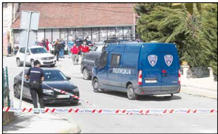
Police officers block a road near a nightclub after a massive fire in the town of Kocani, North Macedonia on March 16.

Family members gathered in front of hospitals and city offices in Kocani, some 115 kilometers (72 miles) east of Skopje, begging authorities for more information.