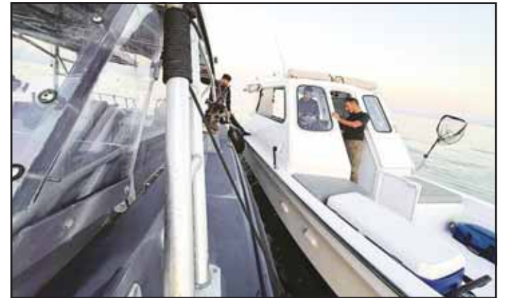
Coast Guard intensifies patrolling to prevent illegal maritime activities.

He stressed that the Coast Guard will take legal action against vio-