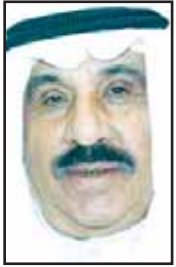
Hassan Ali Karam

"The Minister of Interior recently said in a television interview that the number of Kuwaitis before the invasion was 600,000 and this increased to 1.5 million after the liberation. It seems that the minister's dream is for Kuwaitis to return to the number he believes; or that Kuwaitis have become infertile, having stopped getting married and having children. The minister attributed the unnatural population growth to the wave of naturalizations that swept Kuwait after the liberation and the return of the country to the bosom of its people.