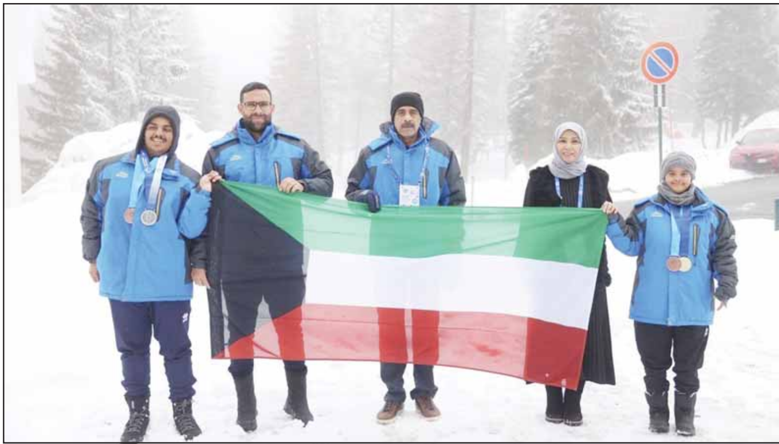
The Kuwaiti delegation from the Special Olympics Kuwait at the closing ceremony of the Winter Games.