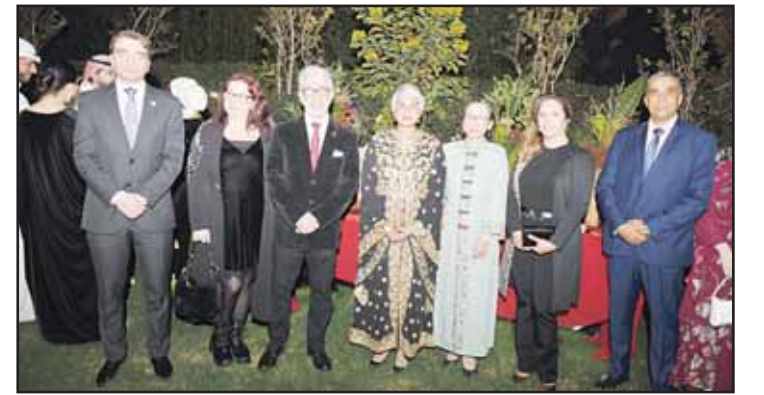
Photos during the Francophone Diwaniya organized by the Canadian Embassy to celebrate the International Francophonie Day and International Women's Day.