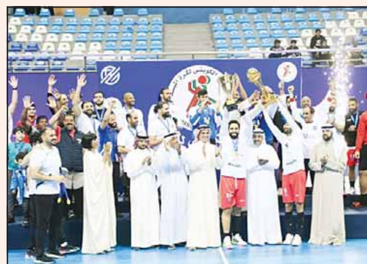
In this file photo, Kuwait Club players celebrate after winning the Super Cup.

There were just 14 finishers, after Aston Martin's Fernando Alonso hit the turn eight barriers on lap 34, while Red Bull's Liam Lawson and Sauber's Gabriel Bortoletto went into the barriers and out of the race 10 laps from home in the treacherously wet conditions.