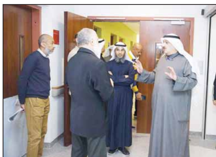
Minister of Health Dr. Ahmad Al-Awadhi during his visit to the new Infectious Diseases Hospital project.

The hospital measures 46,523 square meters; with a total built-up