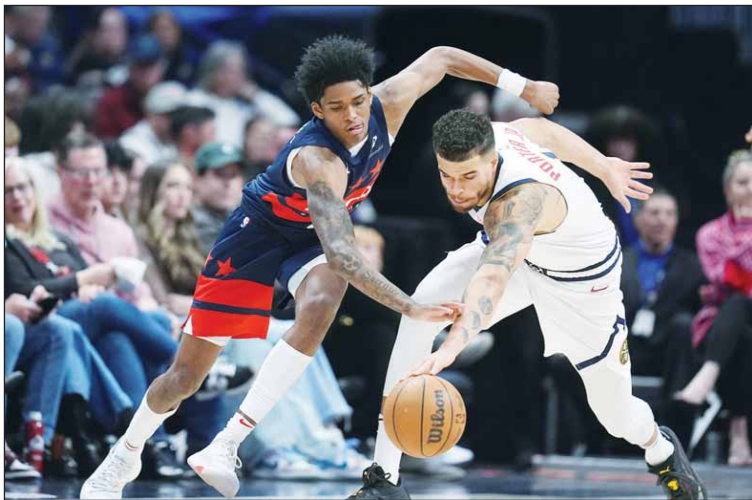
Washington Wizards guard Jaylen Nowell, left, pursues the ball with Denver Nuggets forward Michael Porter Jr., right, in the second half of an NBA basketball game in Denver.