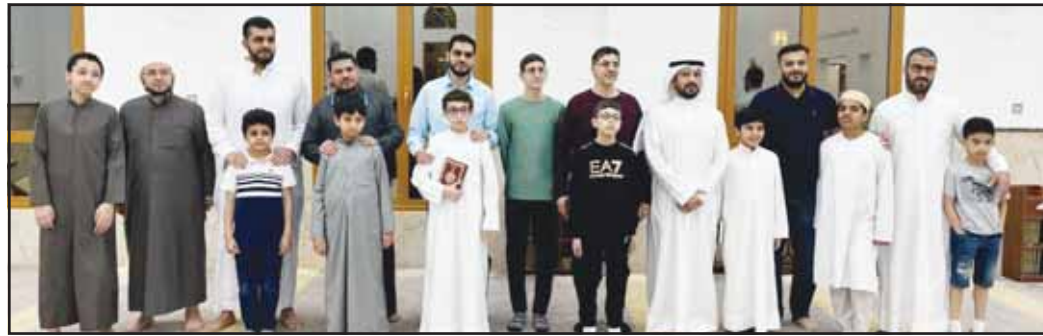
Company employees participate in the Quran competition.