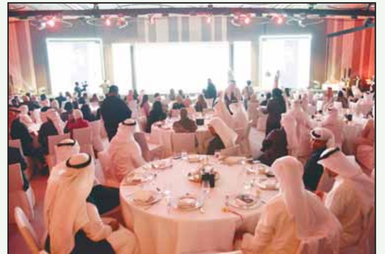
Part of the audience.

KUWAIT CITY, March 16: In a warm and welcoming atmosphere, Gulf Bank hosted its annual Ghabga at the Grand Hyatt 360 Mall, bringing together employees from various departments and branches alongside the Bank's executives and leadership team.