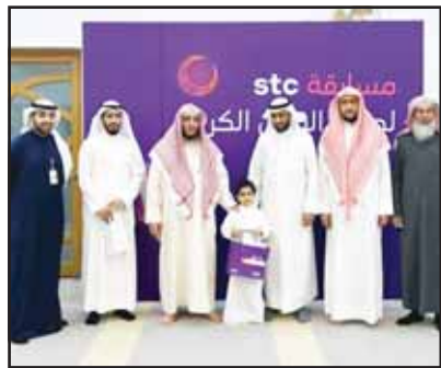
First place winner in the 7 to 10 year category.