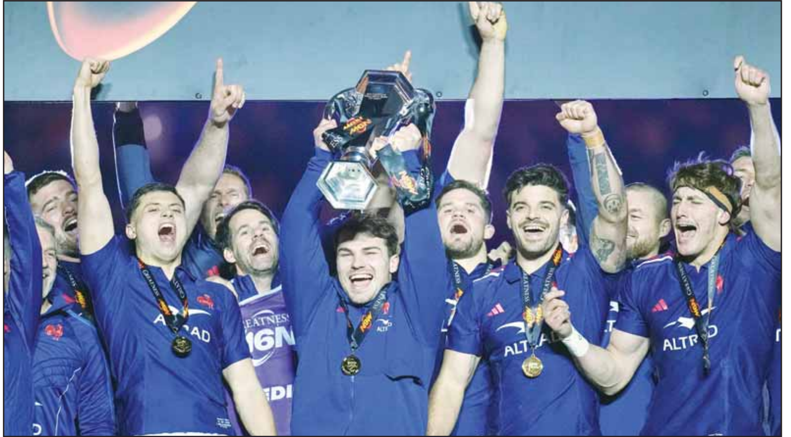
The French team players including Antoine Dupont, center, celebrate with the trophy after the Six Nations rugby union match between France and Scotland at the Stade de France in Saint-Denis, outside Paris.

Tries by Alex Mitchell, replacements Henry Pollock (twice) and Joe Heyes, and then Cunningham-South again completed the rout and a record margin of victory by England over Wales. Pollock's tries came on his debut.