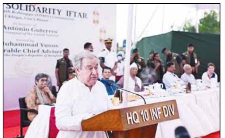
UN Secretary-General António Guterres speaks at the Ukhiya camp for Rohingya refugees in Cox's Bazar, in Bangladesh on March 14.

The U.N. will do everything possible to arrange adequate funding for the Rohingya refugees after the recent announcement of dramatic aid cuts by the US and other countries in Europe,