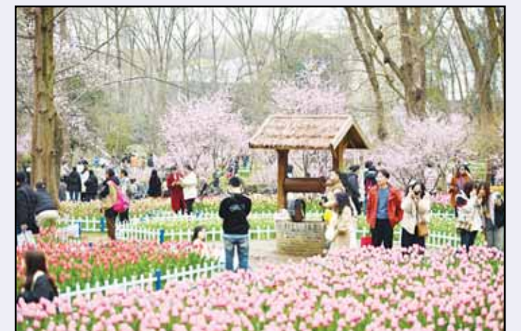
People visit a botanic garden in Nanjing, east China's Jiangsu Province on March 15. As the spring season is coming, flowers are in full bloom across the country. (Xinhua)

Police are investigating the details of the attack. (Xinhua)