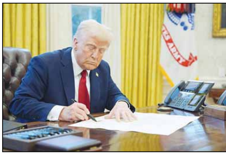
US President Donald Trump signs a document in the Oval Office at the White House on Jan 30, in Washington.

cratic senators decided a government shutdown would be even worse than letting the funding bill pass.