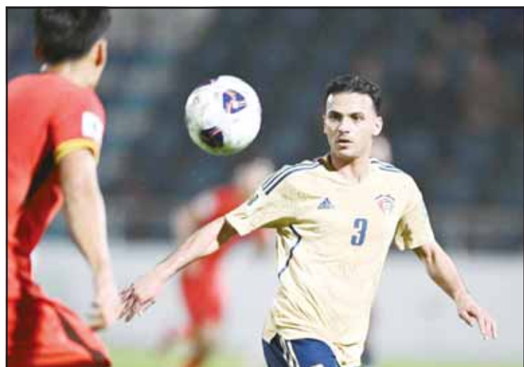
A Kuwaiti challenges for the ball with an opponent during Kuwait, China friendly.

Kuwait wraps up Dubai training ahead of qualifier against Iraq