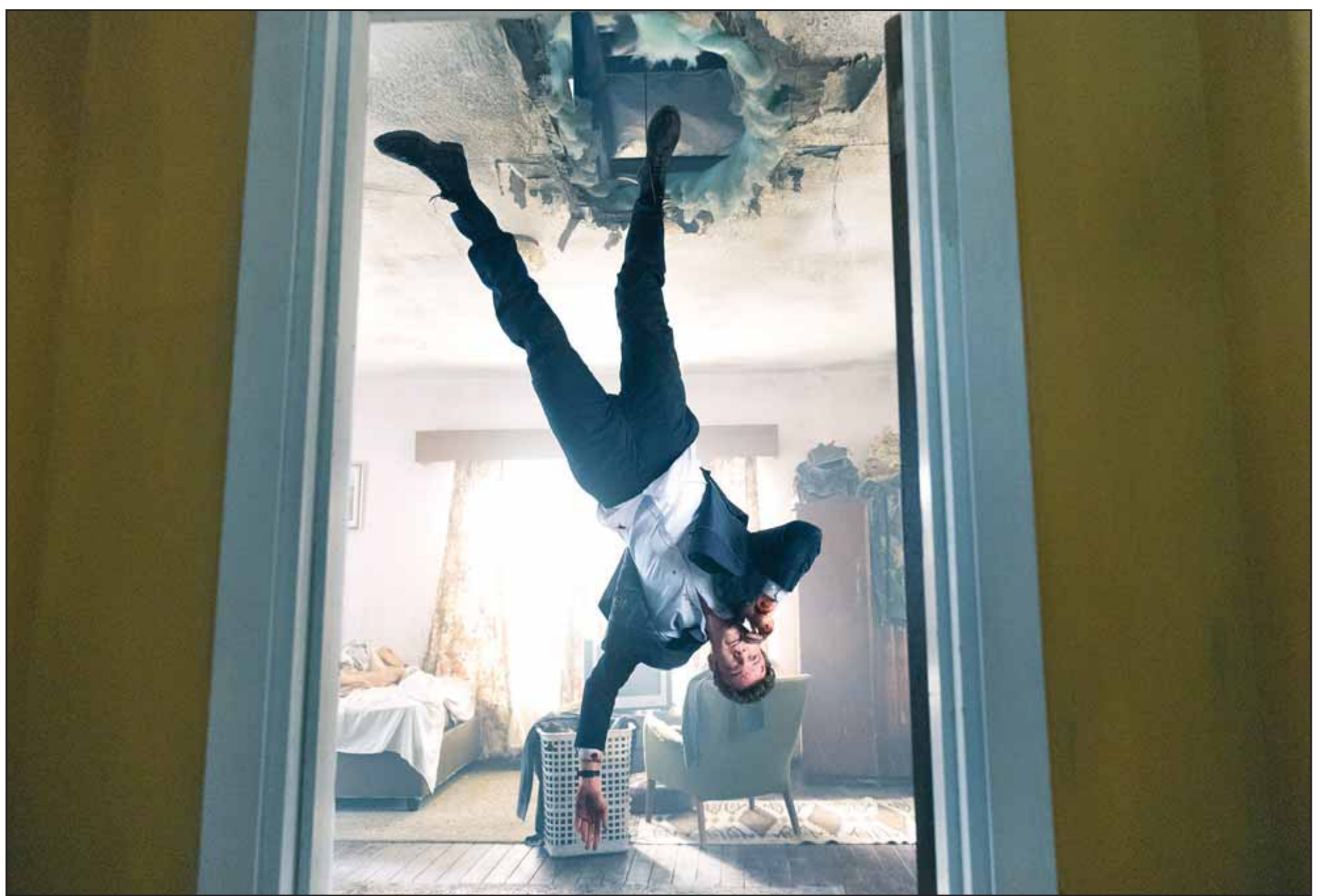
This image released by Paramount Pictures shows Jack Quaid in a scene from 'Novocaine.'

Film's hero feels no pain – but the audience does