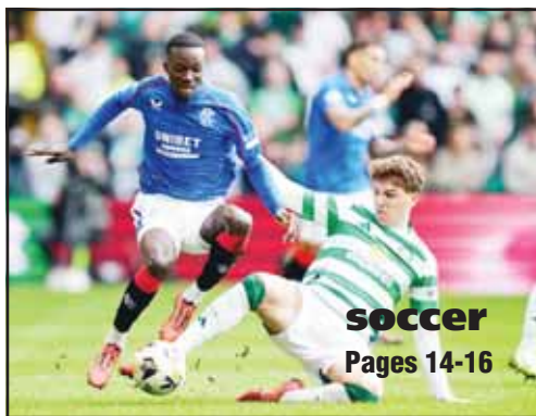
Soccer Pages 14-16