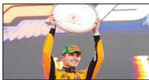
McLaren driver Lando Norris of Britain celebrates on the podium after winning the Australian Formula One Grand Prix at Albert Park, in Melbourne, Australia.