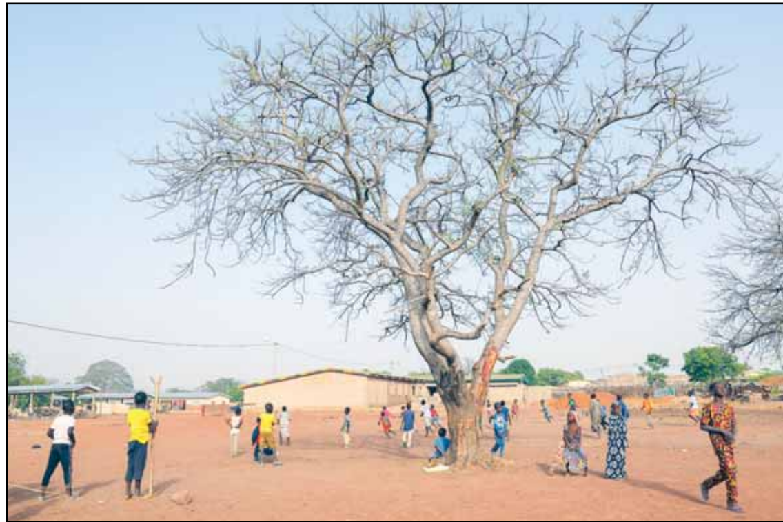
Children play in a park in Kimbirila-Nord, the last village to the Mali border in Ivory Coast on Feb 22.