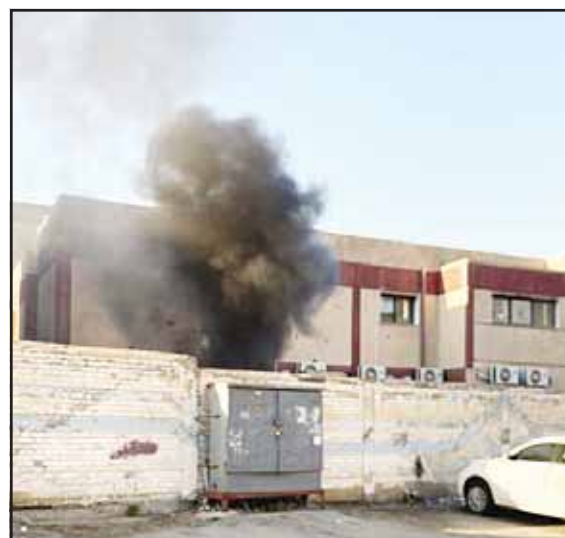
Smoke billows from power transformer.