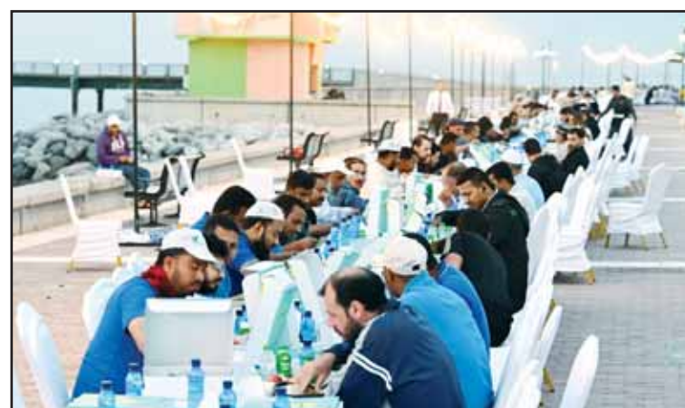
People having iftar meals at a long table in Kuwait City on March 15. More than 4,000 iftar meals were distributed on Saturday at the table in the holy month of Ramadan.