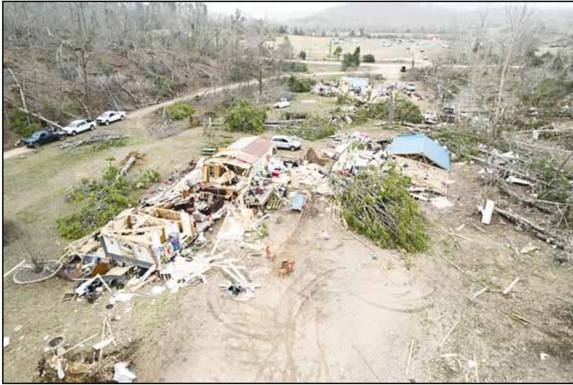
Destruction from a severe storm is seen on March 15, in Wayne County, Mo.