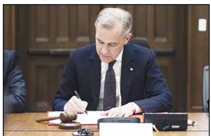
Canada's Prime Minister Mark Carney signs a document during cabinet meeting on Parliament Hill on March 14, in Ottawa.

He will also meet with King Charles III, the head of state in Canada. The trip to England is a bit of a homecoming, as Carney is a former governor of the Bank of England, the first noncitizen to be named to the role in the bank's 300-plus-year history.