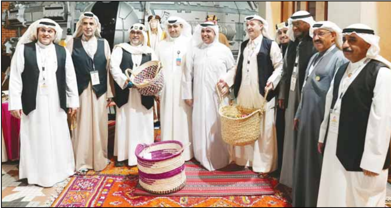
Baskets of Girgae'an ready for distribution.