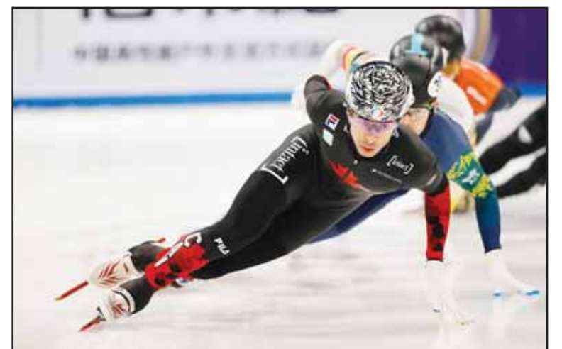
William Dandjinou of Canada competes during the men's 1500m final A at the ISU World Short Track Speed Skating Championships 2025 in Beijing, China.

The three-day World Short Track Championships will conclude on Sunday, with the final five titles to be decided.