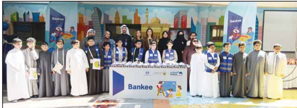
NBK hosts Gergean celebration at Mohammed Alshaya Elementary School.

ing opportunities for positive engagement that align with the essence of the Holy Month. To find out more about stc's events, promotions, and sponsorships, follow stc's official social media platforms, visit one of stc's branches, download mystc mobile application, visit www.stc.com.kw or contact the customer service center by dialing 102 for around the clock assistance.