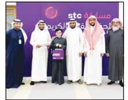
Second place winner in the 7 to 10 years category.

serve as a crucial aspect of each society, further aligning with stc's mission to empower and uplift the communities it serves in meaningful and lasting ways. Looking ahead, stc will continue to introduce various initiatives throughout the Holy Month of Ramadan that embody the values of generosity, learning, and social responsibility. These efforts aim to strengthen bonds with the community while creat-