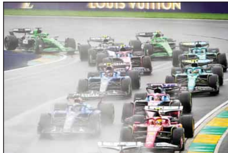
Cars head in to turn two at the start of the Australian Formula One Grand Prix at Albert Park, in Melbourne, Australia.

"I knew I had a good pace, but I made one mistake in turn six and he got me in the DRS and the DRS around here is probably like a second or some-