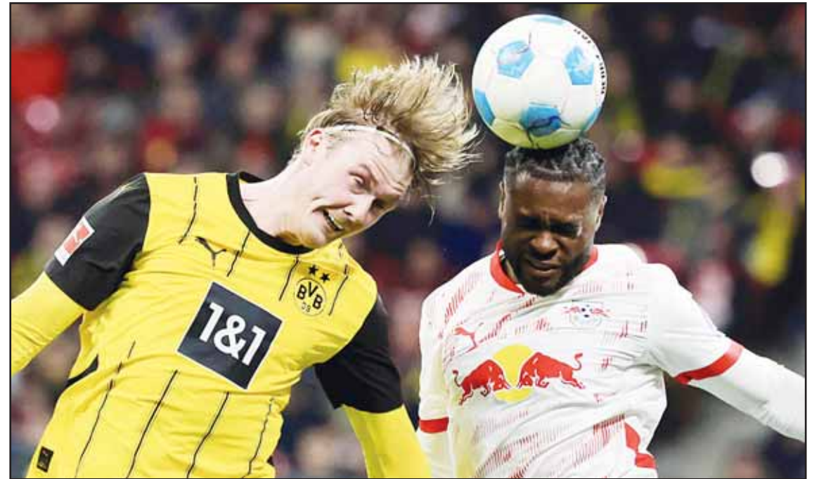
Dortmund's Julian Brandt, left, and Leipzig's Ridle Baku fight for the ball during the German Bundesliga soccer match between RB Leipzig and Borussia Dortmund at the Red Bull Arena, in Leipzig, Germany.

BERLIN, March 16, (Xinhua): Benedict Hollerbach scored a late equalizer as Union Berlin battled to a 1-1 draw with Bayern Munich, loosening Bayern's grip on the Bundesliga's top position.