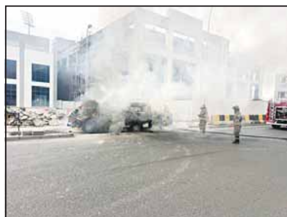
Fire destroys the mini-bus.