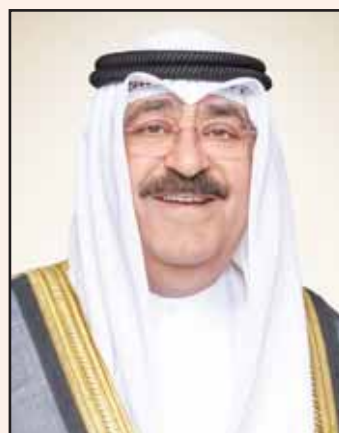
His Highness the Amir

Scan QR code to visit the website: aljarallah.com