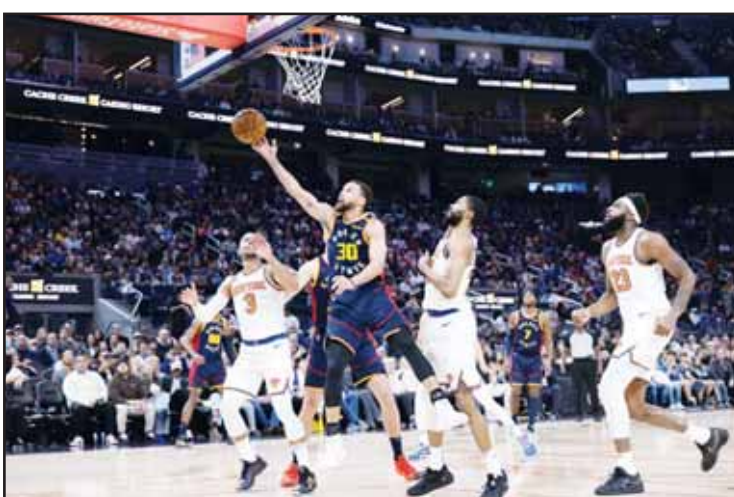
Golden State Warriors guard Stephen Curry (30) shoots during the second half of an NBA basketball game against the New York Knicks, Saturday, March 15, 2025, in San Francisco.

Gilgeous-Alexander shot 17 of 26 from the floor, including 4 of 6 from