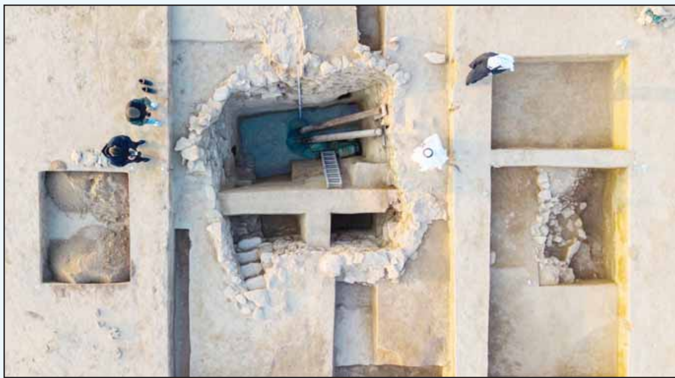
Aerial view of the discovered water well and the stairs leading to the bottom.