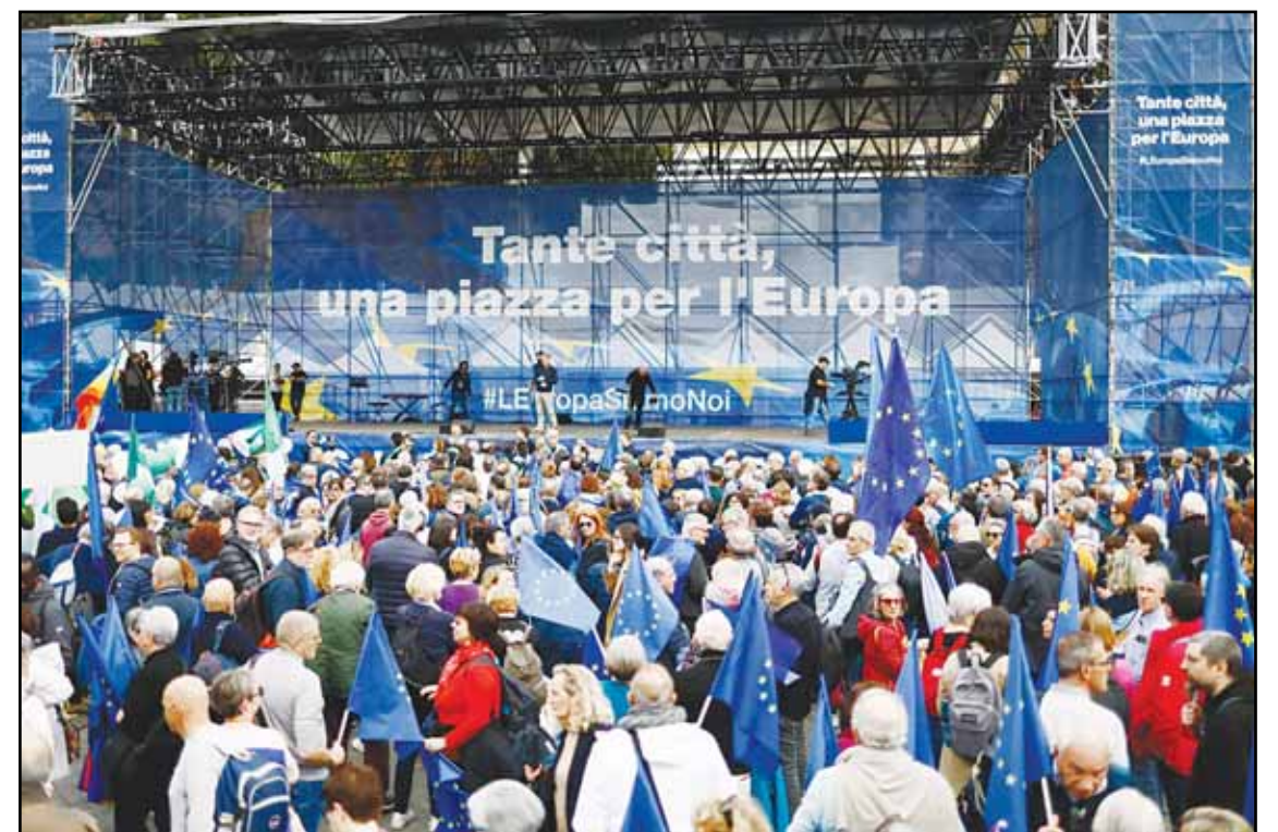
People gather on the occasion of a Pro-Europe demonstration asking for more cohesion in the EU on the wake of the recent changes of priorities in international politics, in Rome on March 15.