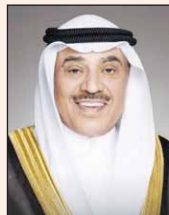
His Highness the Crown Prince