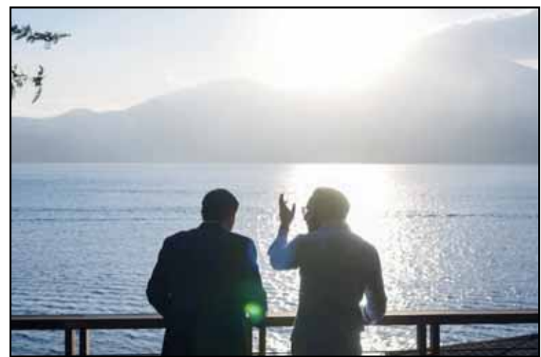
US Secretary of State Marco Rubio, left, meets with President Nayib Bukele at his residence at Lake Coatepeque, El Salvador on Feb 3.

"The Republic of El Salvador confirms it will house these individuals for one (1) year, pending the United States' decision on their long term disposition," wrote El Salvador's ministry of foreign affairs in a memo obtained by The Associated Press.