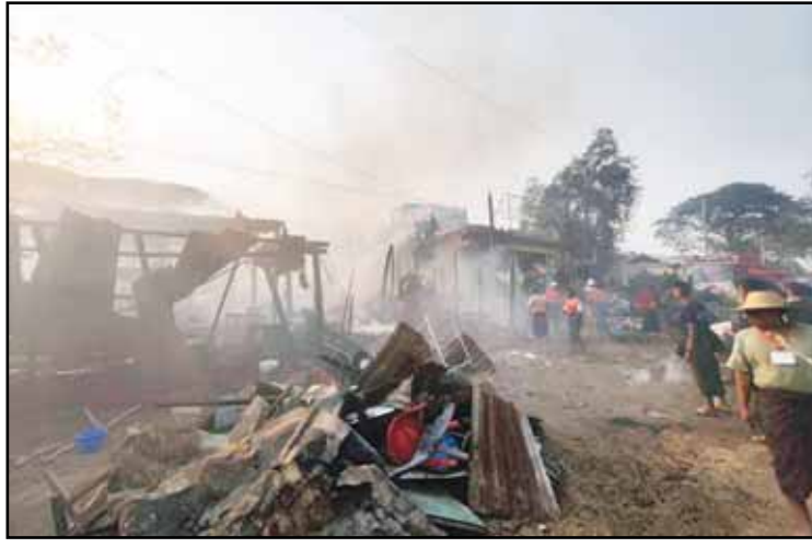
This handout photo provided by the Mandalay People's Defence Force shows debris of the buildings destroyed by an army airstrike in Let Pan Hla village in Singu township in Mandalay region, Myanmar on March 14. (AP)

Osmond, the group's spokesperson, told The Associated Press that about 10 houses near the village market were