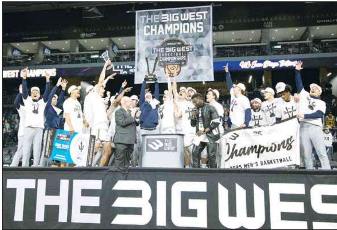
UC San Diego celebrates after an NCAA college basketball game against UC Irvine in the championship of the Big West Conference tournament in Henderson, Nev.

ment title. Pride in the program fully restored.