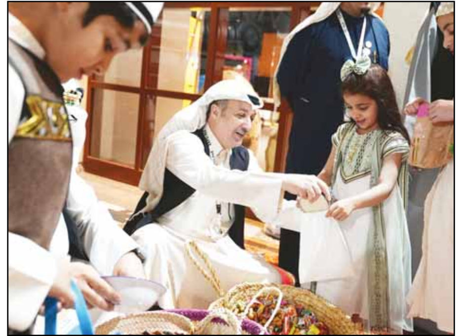
A little girl gets her share of Girgae'an as other children wait.

KUWAIT CITY, March 16: The Scientific Center Kuwait (TSCK), in collaboration with the Expo 965 Team, hosted a three-day Girgae'an to celebrate the holy month of Ramadan.