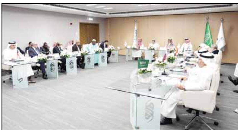
The meeting in progress.

The weekly statistics issued by the department indicated that 28 people were referred to the traffic police station, 21 motorcycles were impounded, one person was arrested for exhibiting abnormal behavior and 21 persons wanted by law were arrested.