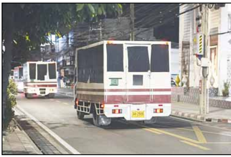
This photo provided by Thailand's daily web newspaper Prachatai shows trucks with black tape covering the windows leaving a detention center in Bangkok, Thailand on Feb 27. (AP)

"Thailand has always upheld a long tradition of humanitarianism, particularly in providing assistance to dis-