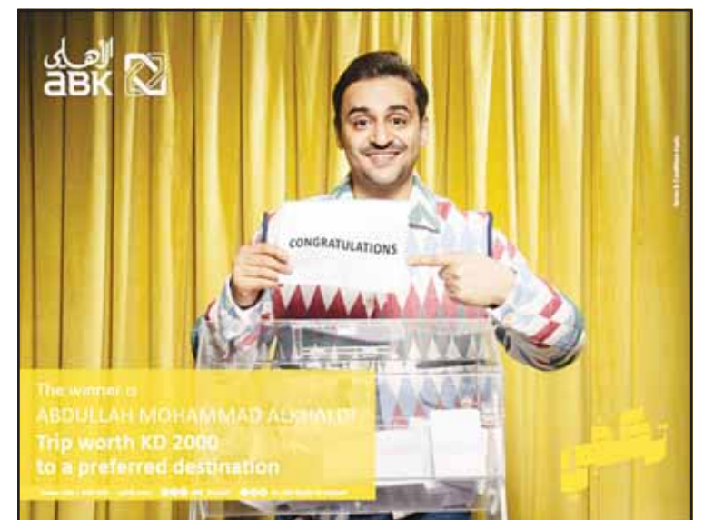
ABK reveals winner of final A+ Student Account quarterly draw.