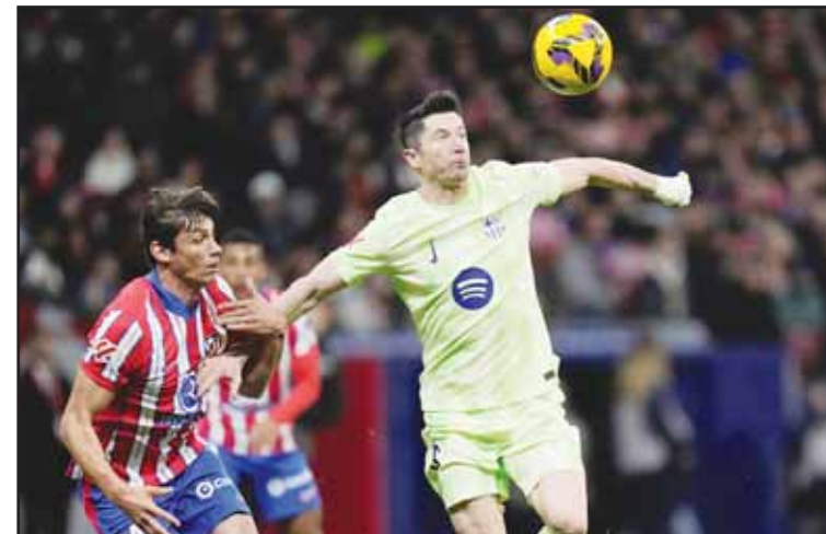
Atletico Madrid's Robin Le Normand, left, challenges Barcelona's Robert Lewandowski during a La Liga soccer match between Atletico Madrid and FC Barcelona at the Metropolitan stadium in Madrid.

Ramon Terrats scored twice as Getafe fought back from Ante Budimir's penalty to win 2-1 away to Osasuna.