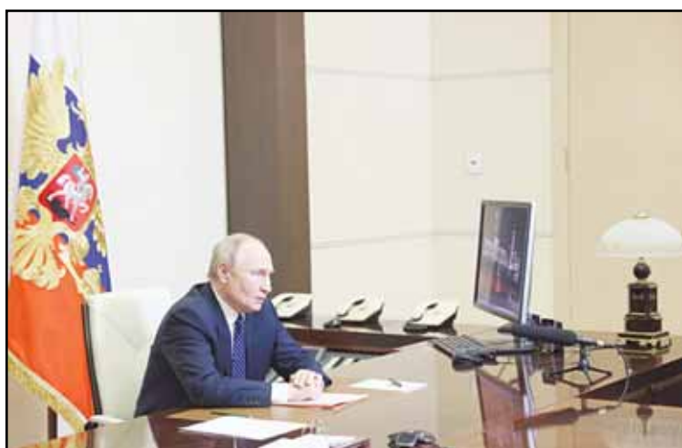
Russian President Vladimir Putin chairs a Security Council meeting at the Novo-Ogaryovo residence outside Moscow, Russia on March 14.

Any such conversation could be a pivot point in the conflict and an opportunity for Trump to continue