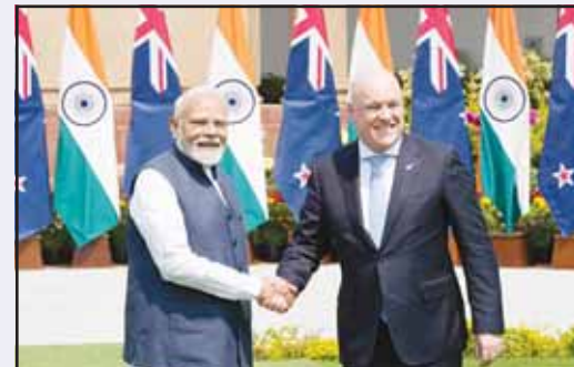
Indian Prime Minister Narendra Modi, (left), greets visiting New Zealand Prime Minister Christopher Luxon before their meeting in New Delhi, India on March 17.

Luxon said he held "highly productive meetings"