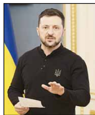
Ukrainian President Volodymyr Zelenskyy speaks during a briefing in Kyiv, Ukraine on March 15.

Barhylevych will now serve as the general inspector of Ukraine's Defense Ministry. Umerov emphasized that Ba-