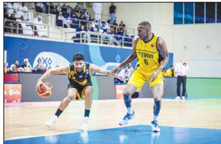
Al-Qadsiya player controls the ball as Al-Ittihad looks on.

In other basketball action, Kuwait Club dominated Al-Yarmouk 122-46 victory in the second division of the Youth League (merger). This win boosted Al-Abyad's total points to 21, while Al-Yarmouk stands at 13. Additionally, Al-Sulaibikhat edged out Al-Nasr 109-93, raising its tally to 15 points, while Al-Nasr sits at 16.