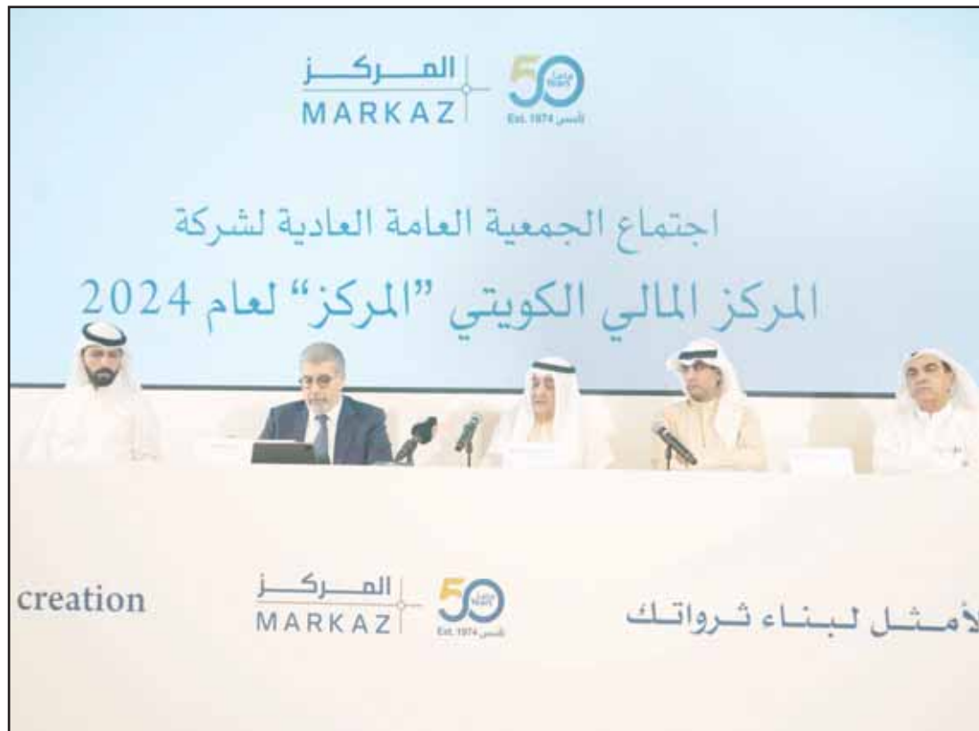
Markaz at the annual general assembly meeting.

"Looking ahead, Markaz remains focused on building a stronger foundation for the future, creating long-term value, adapting to market dynamics, and contributing to sustained growth and resilience in line with the economic development plans of the State of Kuwait."