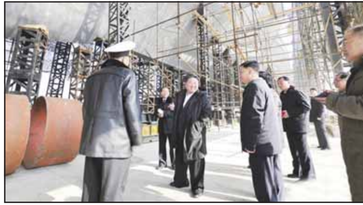
In this undated photo provided on March 8, by the North Korean government, North Korean leader Kim Jong Un (center) visits a shipyard to construct warships at an undisclosed place in North Korea.

The authorities were investigating the cause of the accident. South Korea and the US conducted air drills with advanced fighter jets over a US aircraft carrier this week as part of a major ongoing allied exercise, Yonhap News Agency reported Friday, citing the US Air Force.