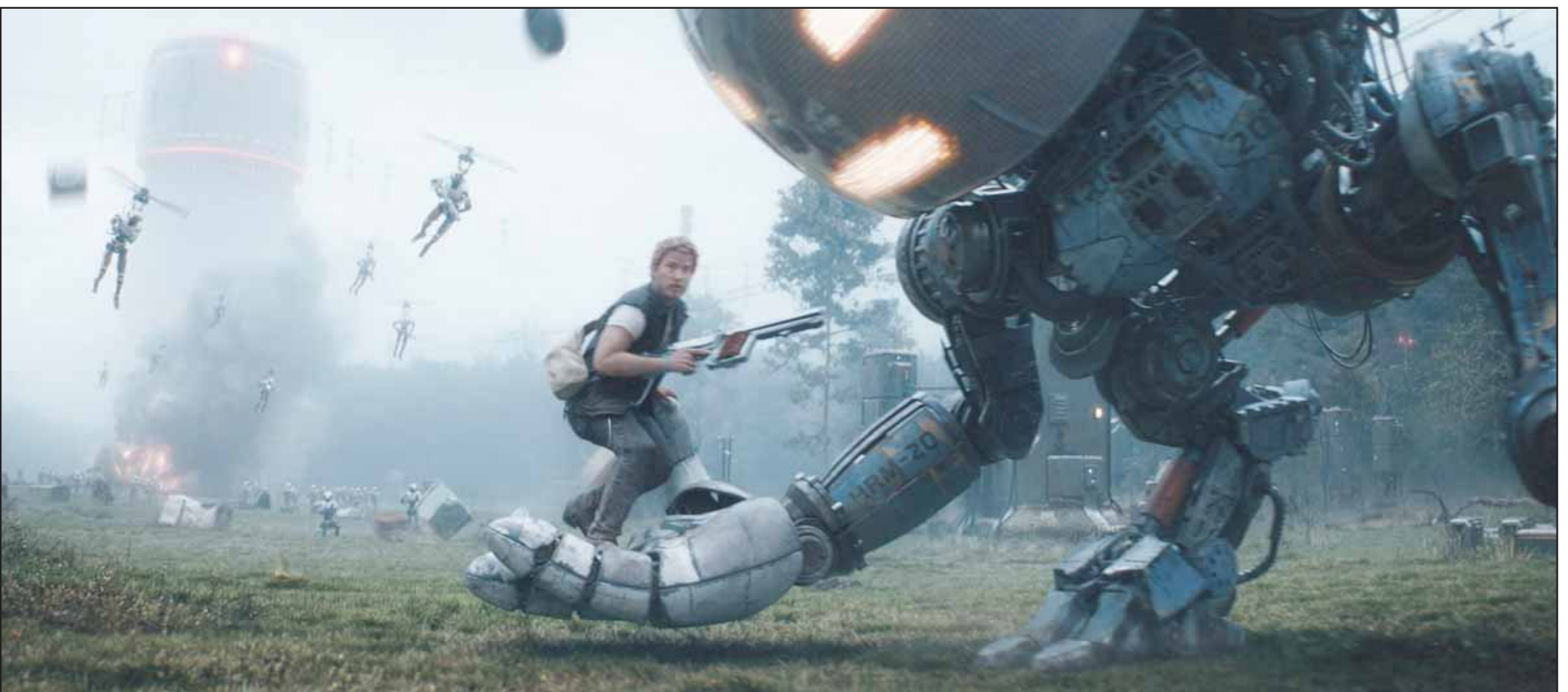
This image released by Netflix shows Chris Pratt, (center), with Herman, voiced by Anthony Mackie, in a scene from 'The Electric State'.

Russo brothers' sci-fi drama misses the mark