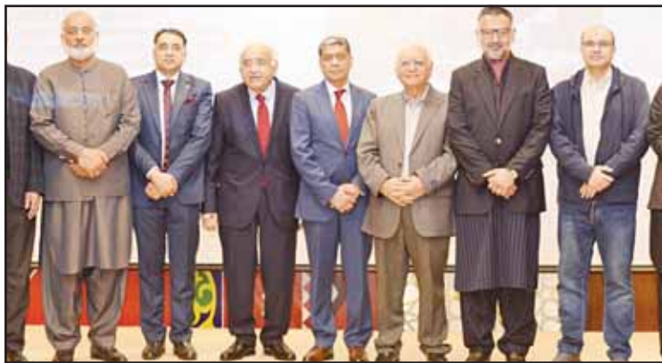
Guests at the event