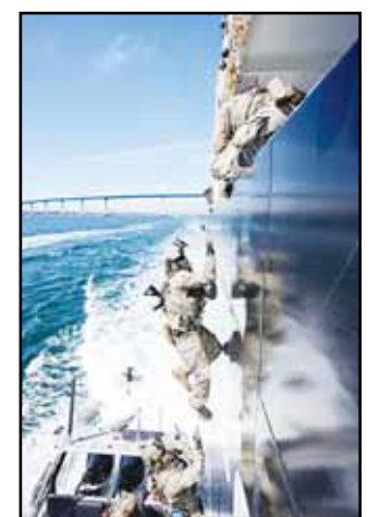
Members of the Maritime Security Response Team participate in an assault boat demonstration as Homeland Security Secretary Kristi Noem, (not pictured), watches on board the US Coast Guard Cutter Elm on March 16, 2025, in San Diego.

White House press secretary Karoline Leavitt, in a statement Sunday, responded to speculation about whether the administration was flouting court orders: "The administration did not 'refuse to comply' with a court order. The order, which had no lawful basis, was issued after terrorist TdA aliens had already been removed from US territory."