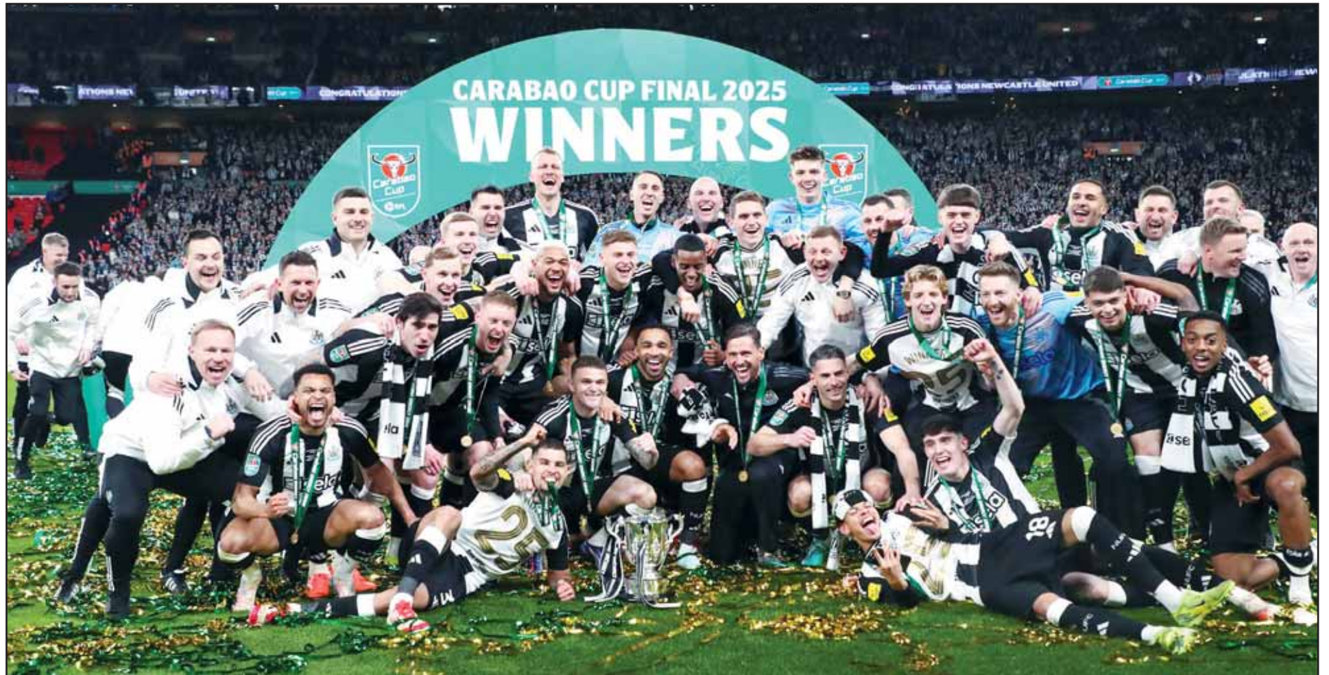
Newcastle players celebrate after winning the EFL Cup final soccer match between Liverpool and Newcastle at Wembley Stadium in London.

team was a worthy winner against a Liverpool team that has been too good for its top-flight rivals this season - losing just once in the league.