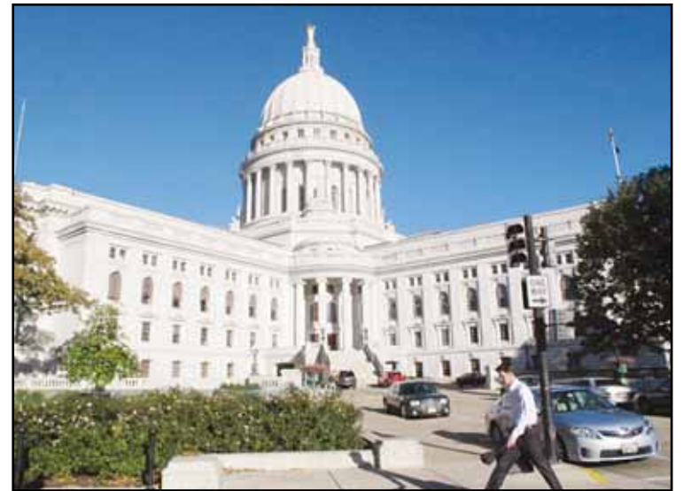
A man walks by the Wisconsin Capitol on Oct 10, 2012, in Madison, Wis.

Underly's education career began in 1999 as a high school social studies