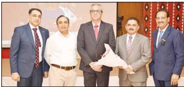
Shaukat Khanum Memorial Hospital & Research Center, Kuwait chapter welcomes chief guest of the event.