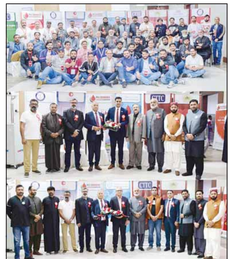
A combo photo from the event.

A special thanks also goes to the media representatives for their coverage and continuous support in spreading awareness about the sig-