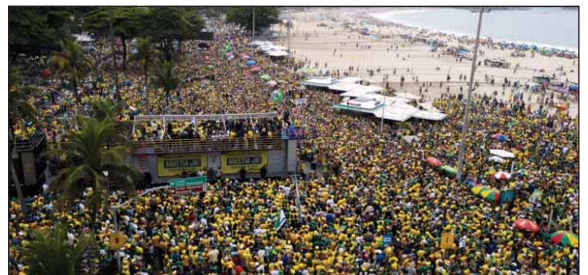
Supporters of Brazil's former President Jair Bolsonaro take part in a rally on Copacabana Beach in support of a proposed bill to grant amnesty to those arrested for storming government buildings in an alleged coup attempt in 2023, in Rio de Janeiro on March 16.

The farm has four ponds and around 50 reptiles. Some have names: Tanker, the largest, shaped like a ship, or Karossa, named after the sub-district the animal was caught after fatally attacking someone.