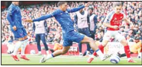
Chelsea's Wesley Fofana, centre, challenges for the ball with Arsenal's Leandro Trossard during the English Premier League soccer match between Arsenal and Chelsea at Emirates stadium in London.