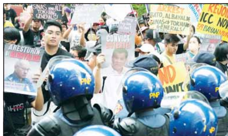
An activist holds a photo of former President Rodrigo Duterte, center, as policemen blocked their march towards Malacanang palace in Manila, Philippines on March 17, during a rally calling on the government to rejoin the International Criminal Court (ICC) following the recent arrest of Duterte.

Meanwhile, anti-Duterte supporters, including the relatives of the alleged extrajudicial killings, also held rallies urging the ICC to arrest Duterte's former police chiefs, Ronald de la Rosa and Oscar Albayalde, for their alleged involvement in Duterte's drug war.