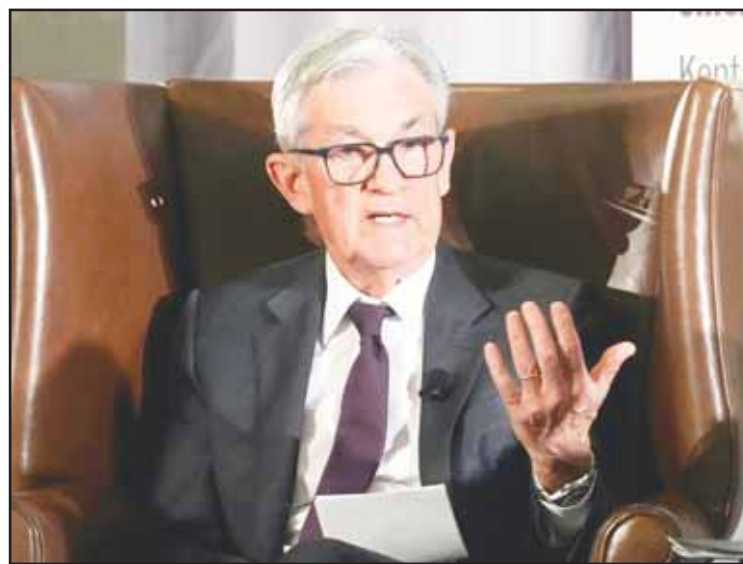
Federal Reserve Chair Jerome Powell speaks during the annual U.S. Monetary Policy Forum, in New York, Friday, March 7, 2025.

Fed officials will almost certainly keep their key rate unchanged at their meeting this week. Once the meeting concludes Wednesday, they will release their latest quarterly economic projections, which will likely show they expect to cut their rate twice this year - the same as they projected in December.