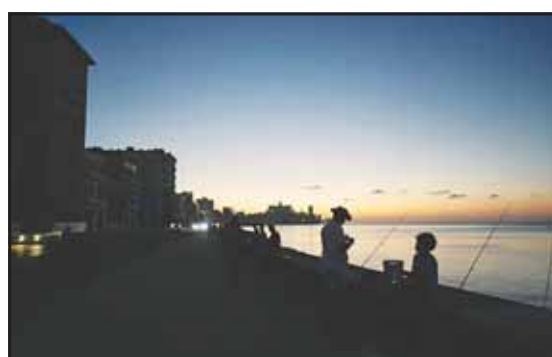
Residents spend time at sunset at the Malecon during a general blackout in Havana on March 15.

Copacabana has regularly been the site for rallies called by Bolsonaro at times when he has sought to demonstrate his political strength. Last month, Brazil's prosecutor-general formally charged Bolsonaro with attempting a coup to stay in office after his 2022 election defeat to current President Luiz Inacio Lula da Silva. Part of that plot allegedly included plans to poison Lula and shoot dead Supreme Court Justice Alexandre de Moraes, who oversees several cases against him.