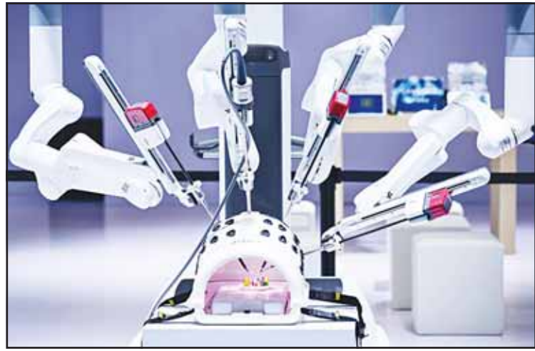
This photo taken on March 14, 2025 shows a surgical robot demonstration during the 2025 China Medical Equipment Conference & Medical Equipment Exhibition held at Chongqing International Expo Center in southwest China's Chongqing Municipality. The four-day exhibition kicked off here on Thursday with a total of 34 professional exhibition areas, including medical imaging, radiotherapy, medical examination, surgical equipment, hospital Internet of Things construction, artificial intelligence and medical robots, etc., showcasing over 10,000 new products, new technologies, new applications and new methods in the field of medical equipment.