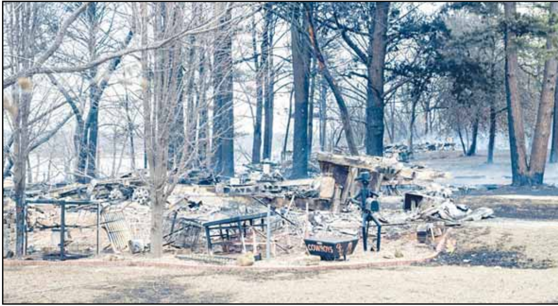
A row of RVs smolder Saturday, March 15, 2025, at the entrance to Fox Run at Lake Carl Blackwell near Stillwater, Okla.