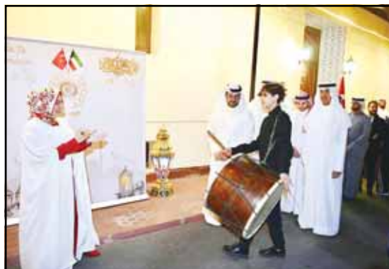
The early morning drummer.