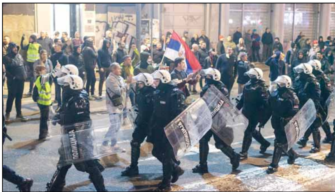
Police in riot gear walk down a street during a major anti-corruption rally led by university students in Belgrade, Serbia on March 15.

Carney, a former central banker who turned 60 on Sunday, has said he's ready to meet with Trump if he shows respect for Canadian sovereignty.