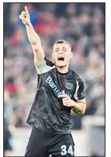
Leverkusen's Granit Xhaka reacts during the German Bundesliga soccer match between VfB Stuttgart and Bayer Leverkusen at the MHP Arena in Stuttgart, Germany.

With all the momentum in its favour, Leverkusen stormed forward in search of a winner, and it came deep into stoppage time. Frimpong whipped in a pinpoint cross from the right and Schick rose highest to power a header past