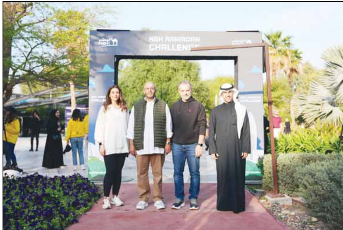
Part of the event attended by officials from the National Bank of Kuwait and Suffix.