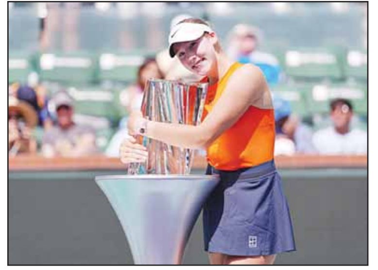
Mirra Andreeva, of Russia, poses with the winner's trophy at the BNP Paribas Open tennis tournament in Indian Wells, Calif.

first time. Andreeva will return to that upper tier in Monday's WTA rankings. Revisiting a theme from her Dubai victory speech that referred to something rapper Snoop Dogg said when he received a star on the Hollywood