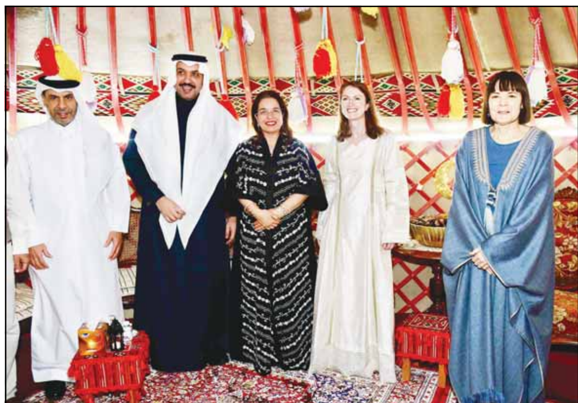
Diplomats and dignitaries.