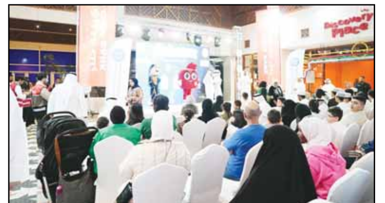
Part of the Gargee'an celebration with children with special needs.

These initiatives reflect Gulf Bank's ongoing dedication to supporting diverse community groups, promoting awareness, and fostering inclusivity for children and individuals with special needs. The events are part of Gulf Bank's "Our Traditions Always Bring Us Together" Ramadan program, which encompasses a wide range of charitable, social, and sports activities that promote humanitarian values and bring joy to the community.