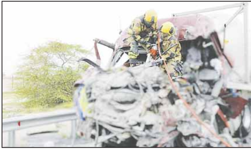
Firefighters worked tirelessly to extricate the driver's body from the wreckage.