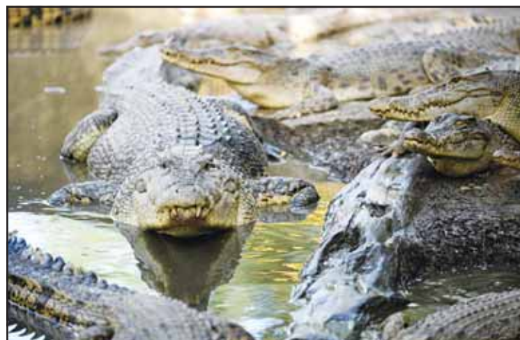
A crocodile nicknamed Karossa, after the name of a village it was captured from following the fatal attack of a man, rests with others inside an enclosure in Budong-Budong, West Sulawesi Island, Indonesia on Feb 24.

People have long feared the ancient predators in the Central Mamuju district of Indonesia's West Sulawesi, where the Budong-Budong River meets the sea. For Munirpa, 48, that