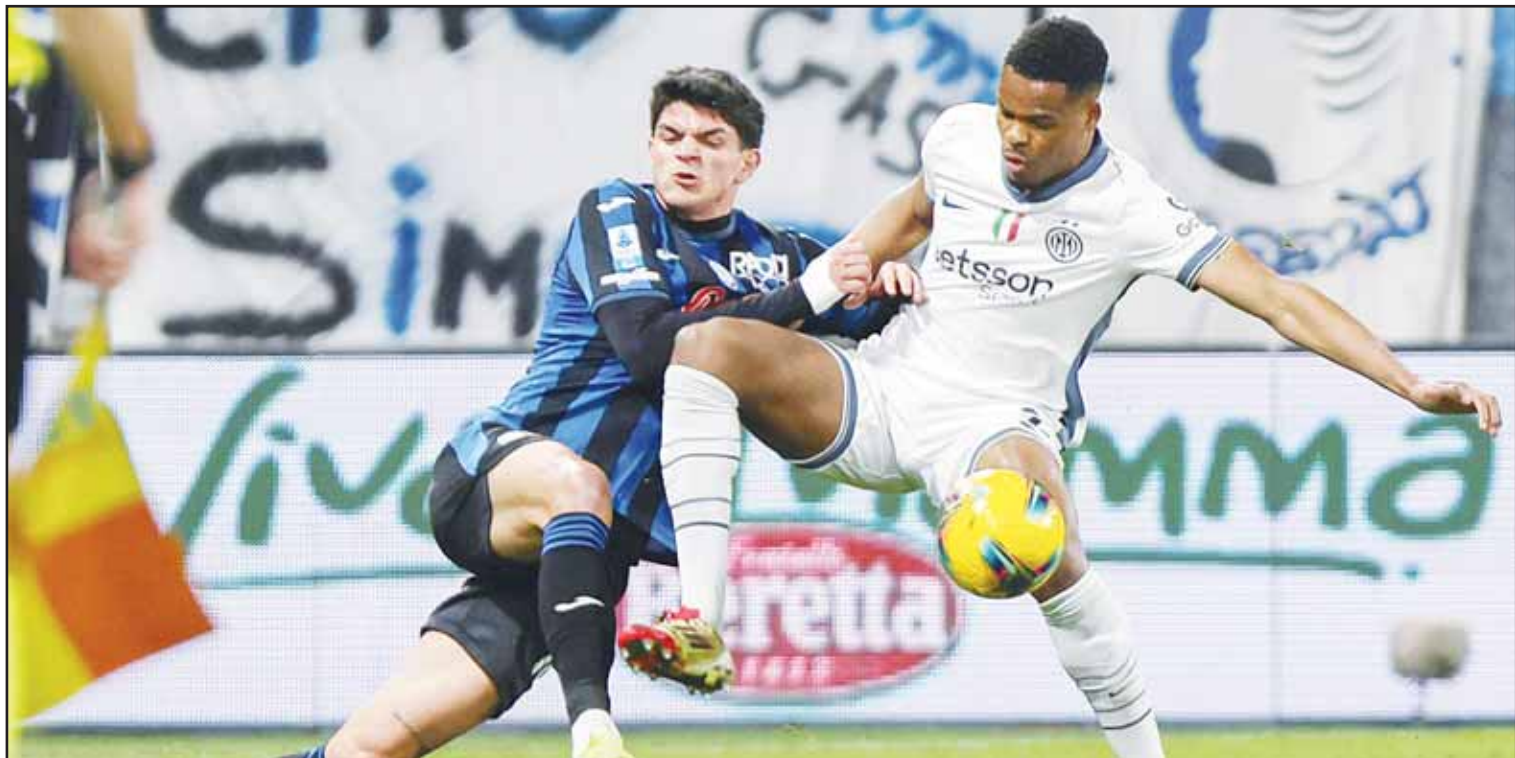
Inter Milan's Denzel Dumfries and Atalanta's Raoul Bellanova, left, vie for the ball during the Serie A soccer match between Atalanta and Inter at the Gewiss Stadium in Bergamo, Italy.