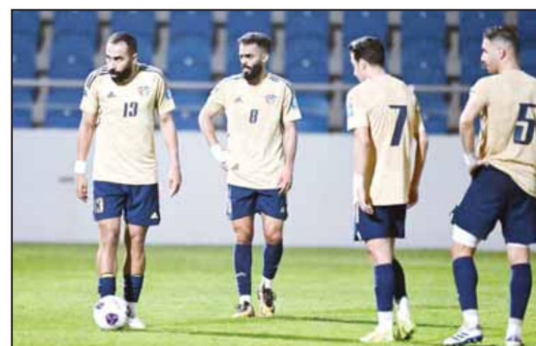
A file photo of Kuwaiti players preparing for a friendly against China.