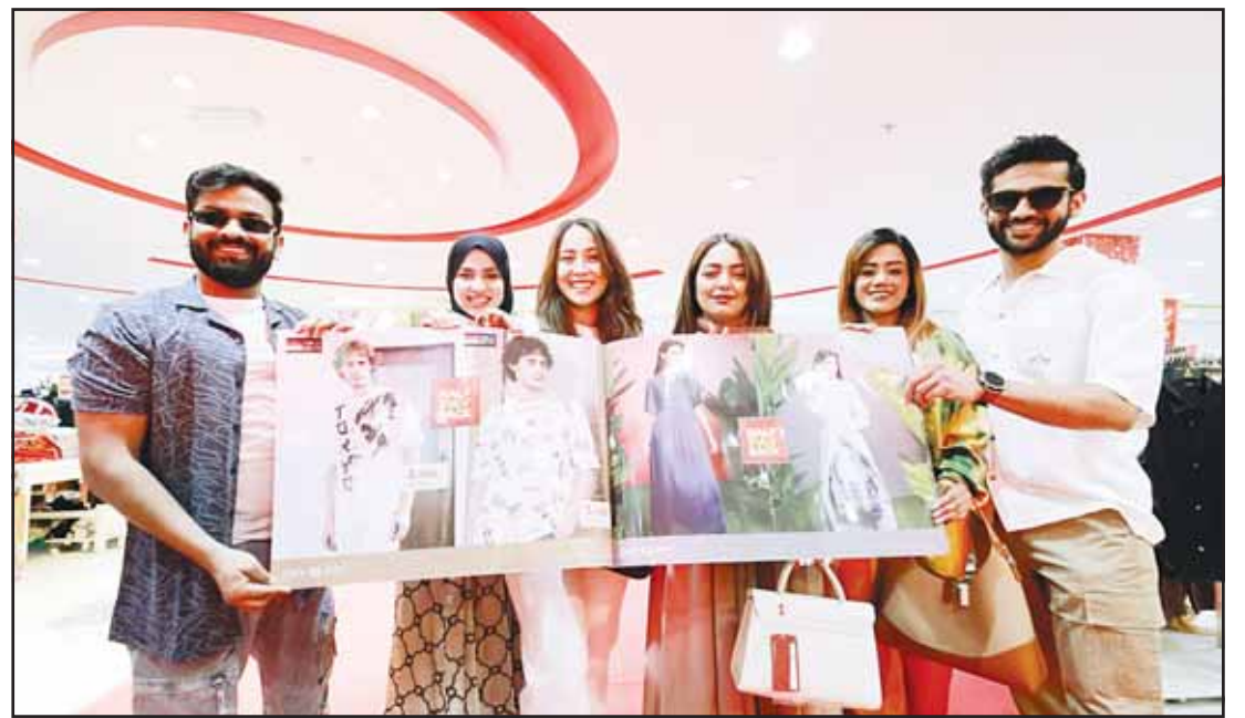
Photos from the launch of LuLu Hypermarket's new summer collection.