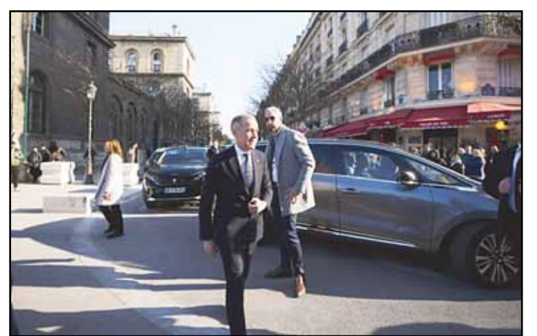
Canada's Prime Minister Mark Carney arrives for a tour of Notre-Dame Cathedral in Paris on March 17.

"We both believe that fair trade which respects international rules is a good thing for the prosperity of everyone and is certainly more effective than