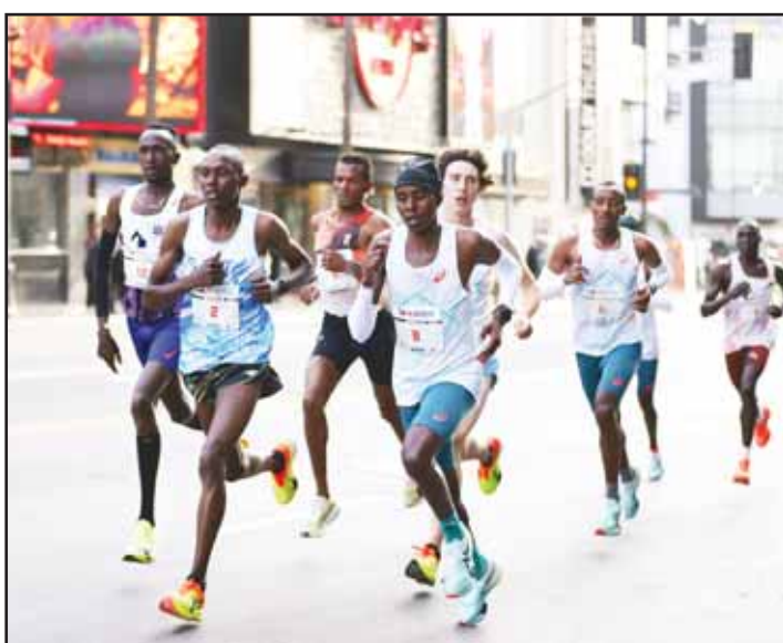
Participants compete during the 2025 Los Angeles Marathon in Los Angeles, the United States.

Kenyan runners showcased their dominance at the 30th edition