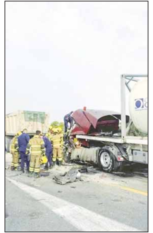
Fire-fighters at the accident site.

The General Fire Force was immediately alerted, and teams specializing in hazardous materials, along with the Al-Bairaq team, were dispatched to carefully remove the body of the deceased from the wreckage and transfer it to the forensic medicine department. The second driver involved in the crash was detained, and a case has been filed regarding the collision.