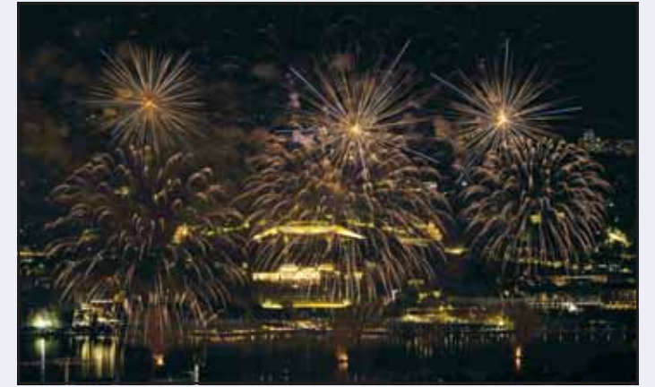
Fireworks illuminate the sky over Lake Burley Griffin during a fireworks show in Canberra, Australia on March 15.

According to a nationwide telephone survey conducted by Asahi Shimbun over the weekend, the cabinet's disapproval rating rose to 59 percent from 44 percent. The data has marked the