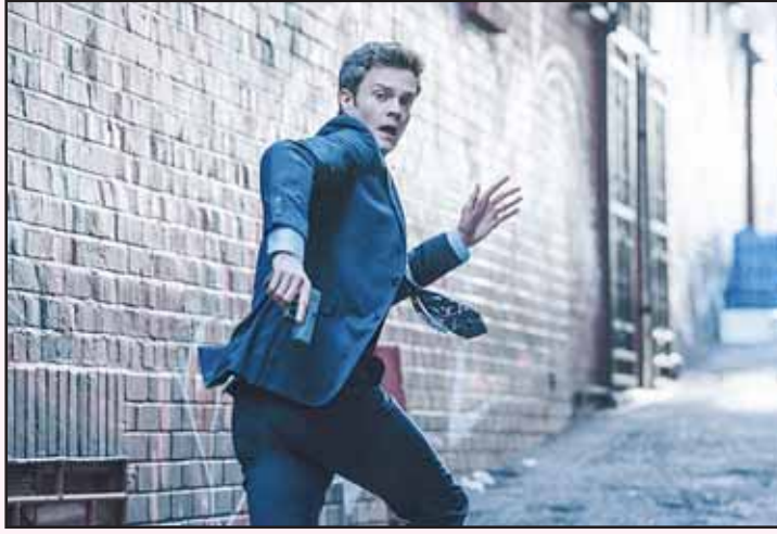
This image released by Paramount Pictures shows Jack Quaid in a scene from 'Novocaine.'

"Novocaine" led the pack with $8.7 million, according to studio estimates Sunday, which was slightly lower than expected. The film starring Quaid as a man who literally can't feel pain was released by Paramount Pictures in 3,365 locations this weekend. The studio also had early access showings the weekend prior, which are included in the total.