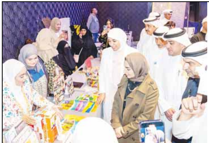
Minister of Social Affairs, Family, and Childhood Affairs Dr. Amthal Al-Huwailah visits a stall.