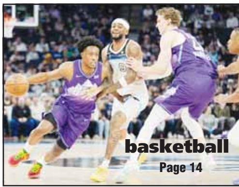
basketball Page 14