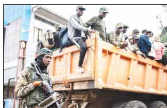
Former members of the Armed Forces of the Democratic Republic of Congo (FARDC) and police officers who allegedly surrendered to M23 rebels arrive in Goma, Congo on Feb 23. (AP)

The latest power outage affected phone, internet and water services. Many families also could not cook because they use electric equipment to prepare their meals. Cuba suffered similar blackouts in October, November and December. The latest was the first of 2025 but in mid-February authorities suspended classes and work activities for two days due to a shortage of electricity generation that exceeded 50% in the country. (AP)