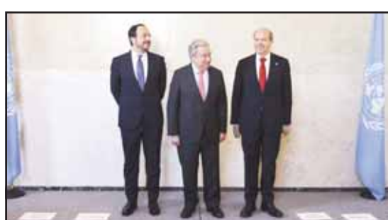
From left: Cyprus President Nikos Christodoulides, UN Secretary-General Antonio Guterres and Turkish Cypriot leader Ersin Tatar pose for a photo, ahead of a meeting to discuss the future of stalled peace talks over the divided island of Cyprus at the United Nations in Geneva, Switzerland on March 18.

"These discussions were held in a constructive atmosphere, with both sides showing clear commitment to making progress and continuing dialogue," Guterres told reporters. He said Christodoulides and Tatar agreed to trust-building initiatives on issues like energy, environment, opening four new crossing points along