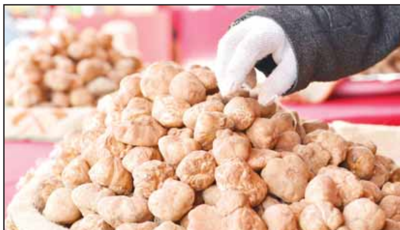
Faqaa (desert truffle) seen on display at a market stand.