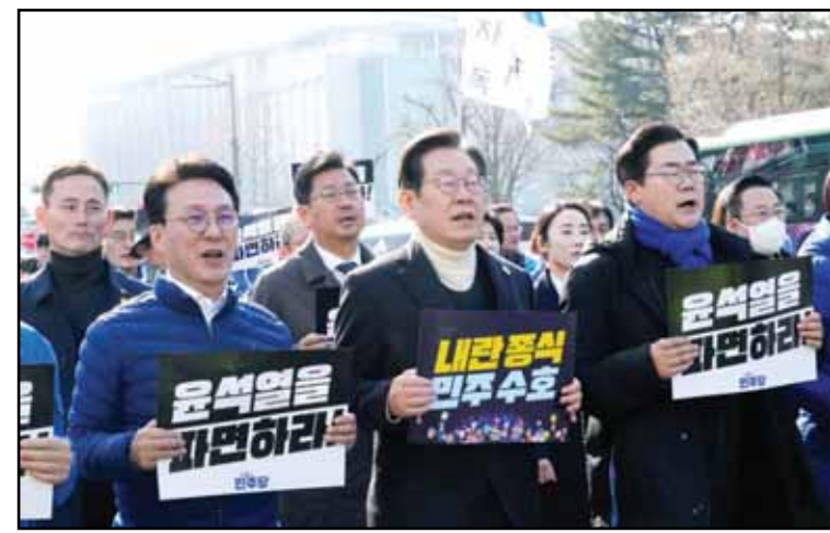
South Korea's main opposition Democratic Party leader Lee Jae-myung, (center), and his party members shout slogans during a rally calling for impeached South Korean President Yoon Suk Yeol's dismissal near the National Assembly in Seoul, South Korea on March 19. The letters read 'Dismiss Yoon Suk Yeol.'

Yoon was apprehended in the presidential office on Jan. 15 and was indicted under detention on Jan. 26 as a