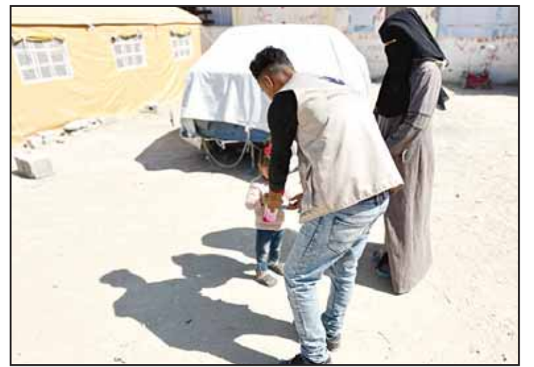
Kuwait's Namaa Charity launches a project to distribute milk to children in the Gaza Strip.

The center confirmed its commitment to improve the efficiency of educational project implementation and guarantee the optimal use of financial resources; thus, enhancing the quality of the education system.