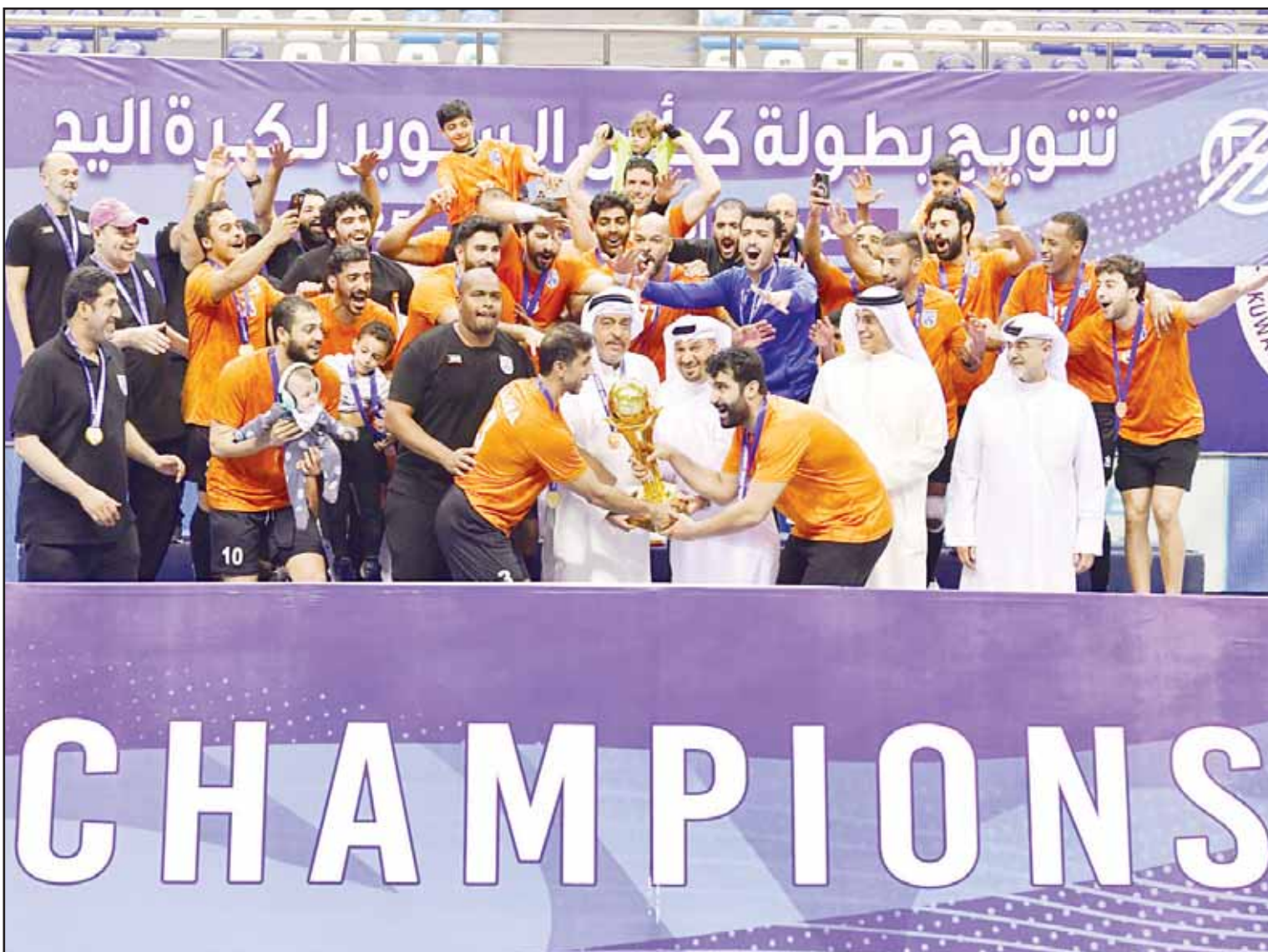
Kazma players celebrate after winning the Super Cup.