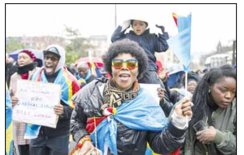
People hold a demonstration to denounce Rwanda's aggression in eastern region of the Democratic Republic of Congo, on Place des Nations in front of the European headquarters of the United Nations in Geneva, Switzerland on March 14.

said both Tshisekedi and Kagame had formally requested Qatar's mediation for the talks, which the diplomat said were informal and aimed at building trust rather than resolving all outstanding issues. The diplomat spoke to The Associated Press on condition of anonymity because they were not authorized to speak publicly about the matter.