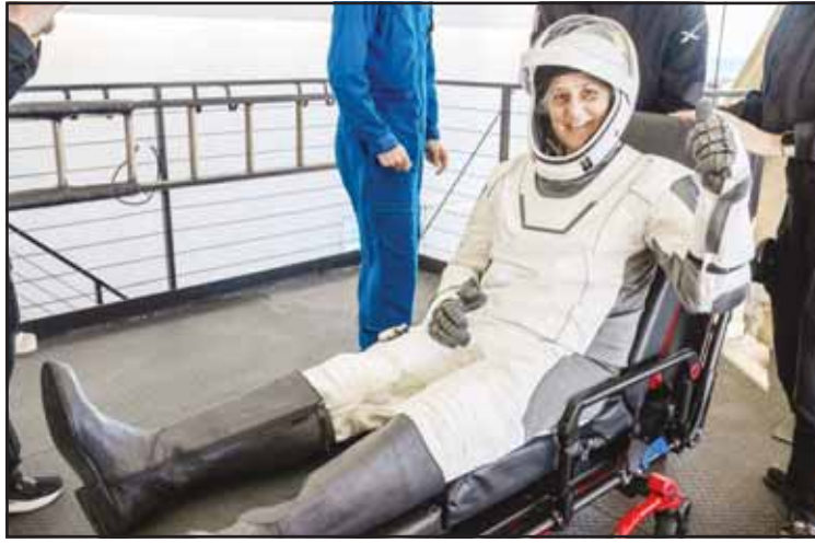
NASA astronaut Suni Williams gives a thumbs-up after being helped out of a SpaceX capsule onboard the SpaceX recovery ship Megan after landing in the water off the coast of Tallahassee, Fla., Tuesday, March 18.

The two expected to be gone just a week or so after launching on Boeing's new Starliner crew capsule on June 5. So many problems cropped up on the way to the space station that NASA eventually sent Starliner back empty and transferred the test pilots to SpaceX, pushing their homecoming