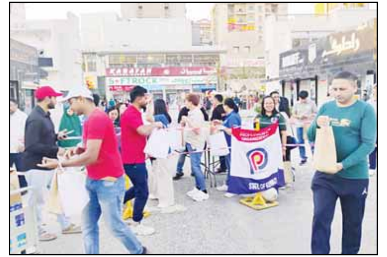
Photos from the event