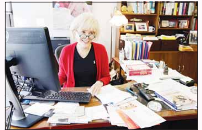
'60 Minutes' correspondent Lesley Stahl poses for a photo in her office in New York on Sept. 12, 2017.