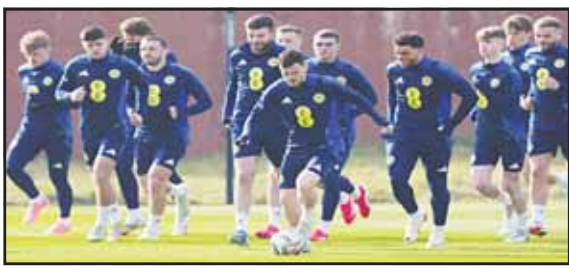
Scotland's Andrew Robertson, centre, and teammates attend a training session at Lesser Hampden, Glasgow, Scotland.