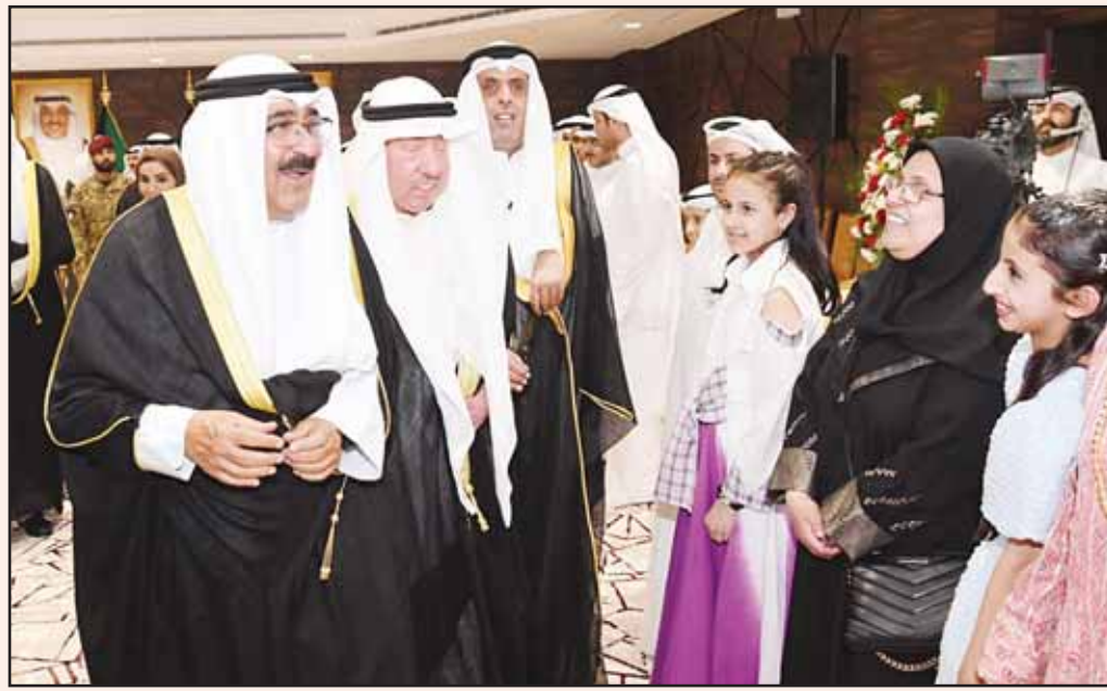
Left: His Highness the Amir, accompanied by His Highness the Crown Prince and Acting Prime Minister, visits the Kuwait Disabled Sport Club (KDSC). Right: His Highness the Amir, accompanied by His Highness the Crown Prince and the Acting Prime Minister, visits the Kuwait Blind Association (KBA).