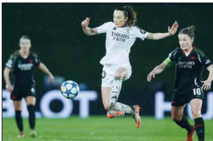
Real Madrid's Caroline Weir, centre, jumps to control the ball in front of Arsenal's Kim Little, right, during the Women's Champions League quarterfinal first leg soccer match between Real Madrid and Arsenal at the Alfredo di Stefano stadium in Madrid, Spain.