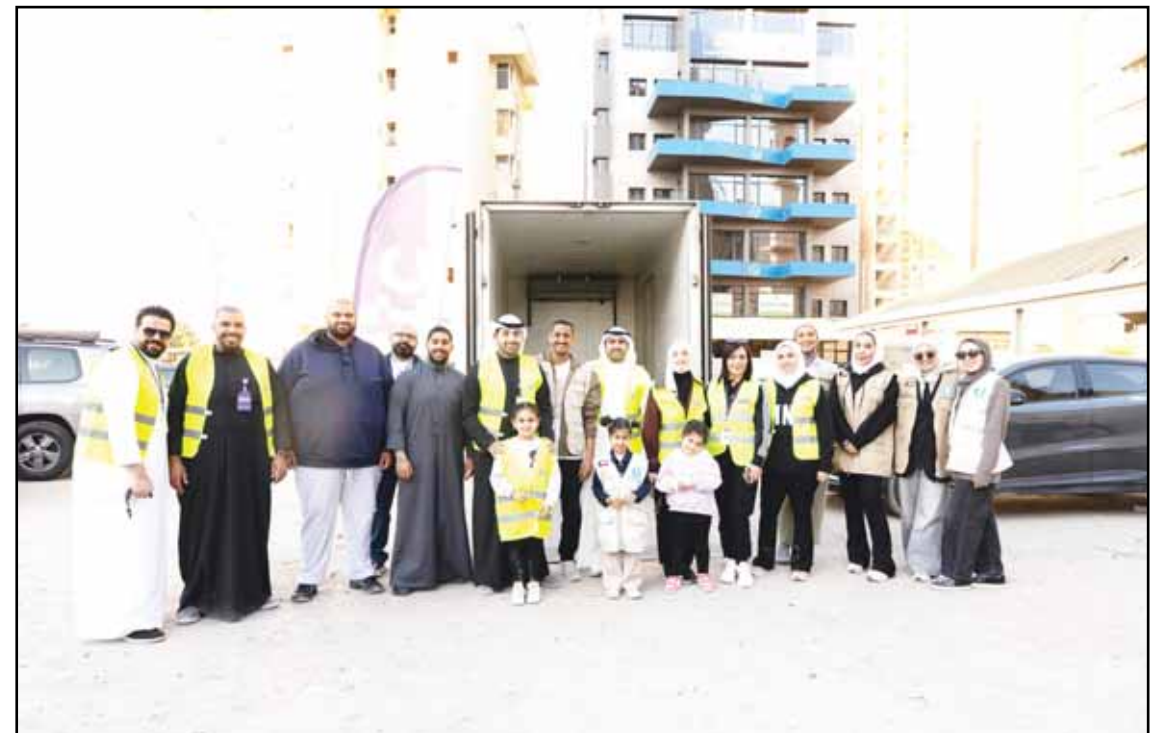
Tarahom and stc teams distributing iftar meals to fasting people.

perience, stc distributed special gifts to children throughout various locations, creating moments of happiness and celebration in the spirit of Ramadan.