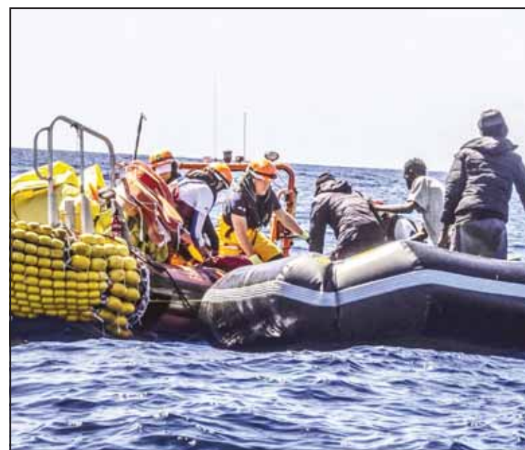
Migrants are helped evacuate a partially deflated rubber dinghy by the rescue personnel of the SOS Mediteranee's humanitarian ship Ocean Viking in the Central Mediterranean Sea on March 12, 2024.

Survivors said that some 56 people were in the dinghy when it departed from the Tunisian port of Sfax on Monday evening, the UNHCR reported. The boat started to deflate a few hours after departure. The people on board were from Cameroon, Ivory Coast, Guinea and Mali, the UNHCR said. The UN Missing Migrant Project puts the number of the dead and missing in the perilous central Mediterranean at over 24,506 from 2014 to 2024, many of whom were lost at sea.