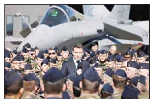
French President Emmanuel Macron speaks to soldiers at the Luxeuil-Saint-Sauveur airbase, in Saint-Sauveur, north-eastern France on March 18.

The Algerians set to be deported include a 37-year-old suspect sentenced to life for his role in an eastern France stabbing attack last month, and a trio of TikTok influenc-