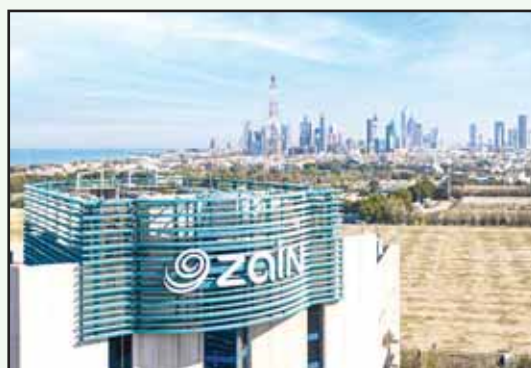
Zain HQ building

Zain's Global M2M Offering also addresses several key challenges faced by OEMs in the region. It ensures full regula-