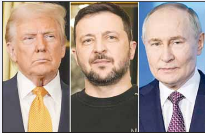
In this combination of file photos, President Donald Trump, (left), and Ukraine's President Volodymyr Zelenskyy, (center), are seen at the Elysee Palace on Dec 7, 2024 in Paris, and President Vladimir Putin, (right), addresses a Technology Forum in Moscow, Russia on Feb 21, 2025.

The limited pause comes as Trump still hopes to get Russia to sign off on his 30-day ceasefire proposal aimed at ending the Russian invasion of Ukraine. Ukrainian officials last week agreed to the 30-day ceasefire proposal during talks in Saudi Arabia led by Secretary of State Marco Rubio. White House