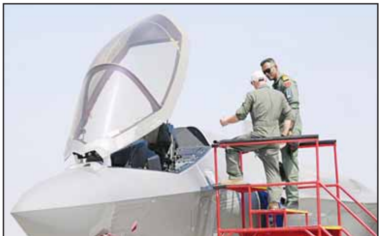
A US Air Force officer, (left), briefs an Indian naval officer about the F-35 fighter aircraft at the static display area on the last day of the Aero India 2025, a biennial event, at Yelahanka air base in Bengaluru, India on Feb 14.

Carney on Tuesday announced an early warning radar system purchase from Australia worth Canadian $6 billion ($4.2 billion). Officials say it will have a smaller footprint than a similar American system.