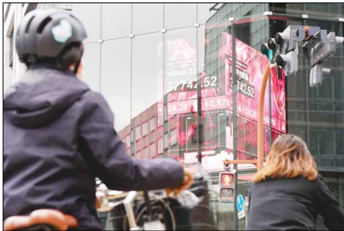
People stand in front of an electronic stock board showing Japan's Nikkei index at a securities firm Thursday, March 6, 2025, in Tokyo.

Much attention will focus Wednesday on forecasts the Fed will publish after its meeting, showing the outlook for interest rates, inflation and the economy. For now, traders on Wall Street are largely expecting the Fed to deliver two or three cuts to rates by the end of