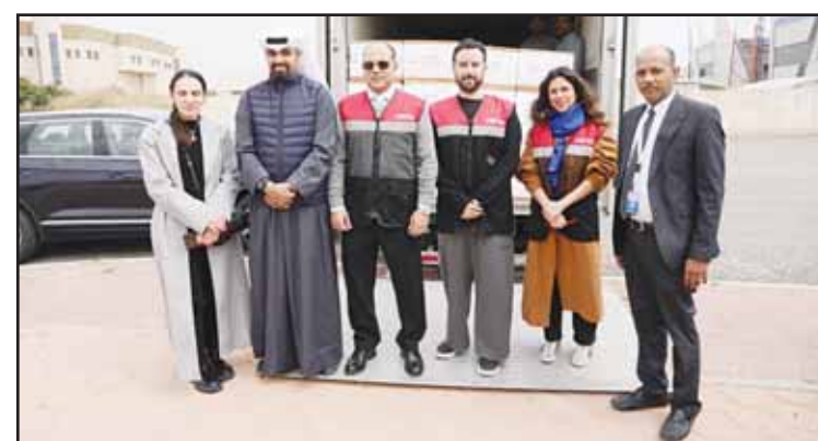
A group photo of the Gulf Bank and City Hypermarket teams.

Gulf Bank continues to uphold its strong commitment to sustainability across social, economic, and environmental levels through carefully curated initiatives that positively impact both the Bank and the community. These efforts support the Bank's 2025 strategy, align with the United Nations Sustainable Development Goals, and contribute to Kuwait Vision 2035. Notably, in the days leading up to