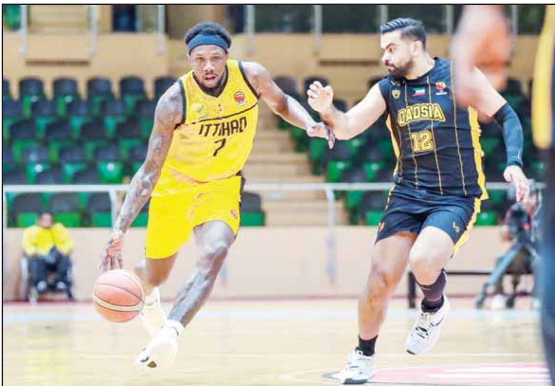
Al-Ittihad players dribble past Al-Qadsiya player during the match.