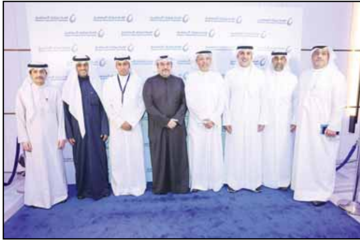
KIB Invest - Sponsorship of UIC 20th Anniversary Ceremony.

KIB Invest's Head of Investor Relations and Marketing, emphasized that "KIB Invest's sponsorship of UIC's 20th Anniversary demonstrates our commitment to fostering long-term relationships and collaborating to shape the future of the investment sector. The event showcased the collective efforts of all contributors to UIC's success, and we are proud to celebrate this milestone. Through such strategic partnerships, we continue to strengthen our presence in the industry while