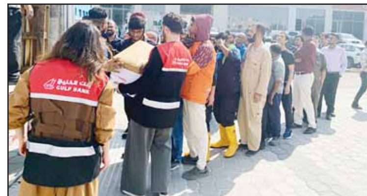
Part of the food package distribution in Al-Ahmadi.

Ramadan, Gulf Bank distributed food packages to visitors at Lulu Hypermarket and Al-Shamiya Cooperative Society over two days.