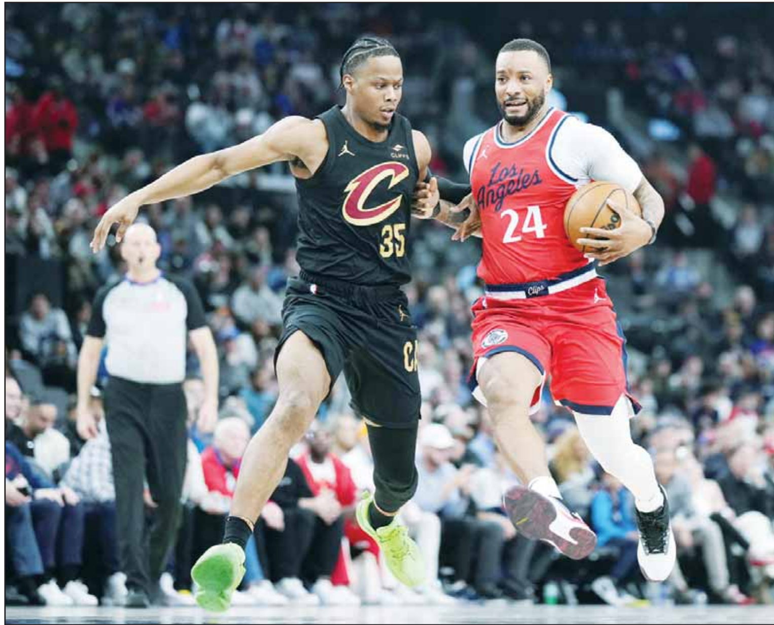
Los Angeles Clippers guard Norman Powell, right, drives past Cleveland Cavaliers forward Isaac Okoro during the first half of an NBA basketball game in Inglewood, Calif.