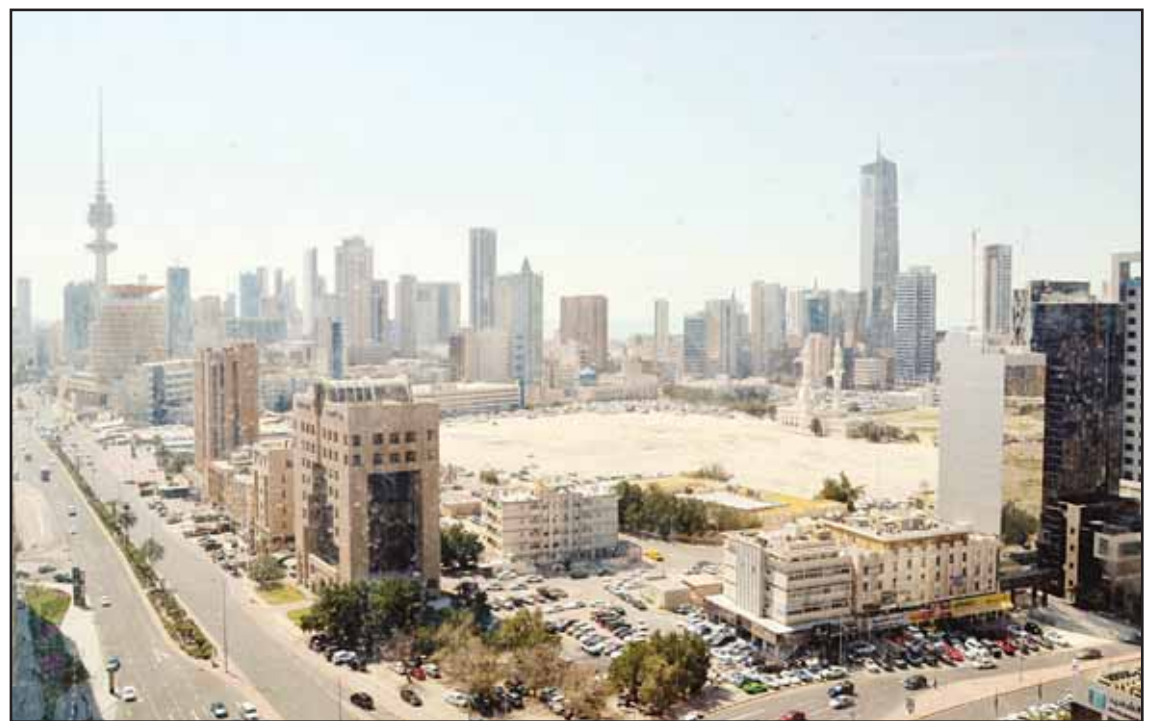
A stunning view of Kuwait City, showcasing its modern skyline and vibrant urban landscape.