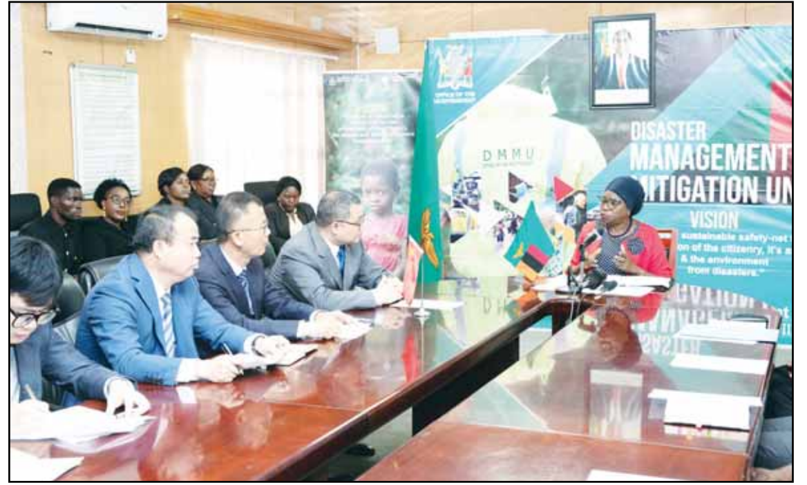
Zambian Vice President Mutale Nalumango (right) attends the handover ceremony of China-donated relief supplies to Zambian flood victims in Lusaka, capital of Zambia, on March 17.

According to the vice president, the floods have claimed four lives, displaced many people, particularly in Lusaka, and impacted other parts of the country.