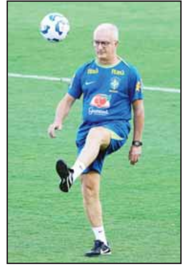
Brazil's coach Dorival Junior controls the ball during a national soccer team training session, in Brasilia, Brazil.

"We wear the most prestigious shirt in football and our mentality is that we have to fight like lions every day. With two wins we can move towards qualification, but two losses would put more pressure on us. We have to overcome that pressure and make sure that we are at our best,"