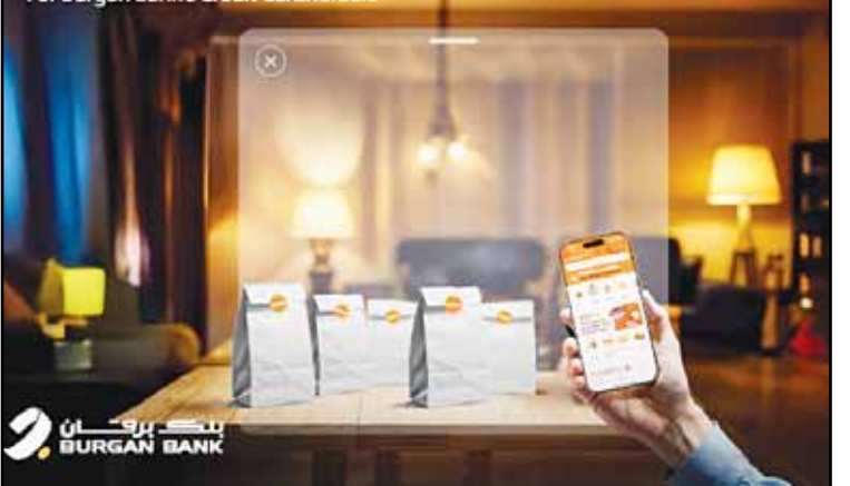
Burgan Bank digital flyer