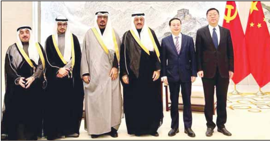
KUWAIT'S Assistant Foreign Minister for Asian Affairs Sameh Hayat, Kuwait's Ambassador to China, Jassim Al-Najim with Kuwaiti and Chinese officials.

BEIJING, March 19, (KUNA): Kuwait's Assistant Foreign Minister for Asian Affairs Sameh Hayat met with Assistant Minister of the International Department of the Central Committee of the Communist Party of China Jin Xin in Beijing on Tuesday.