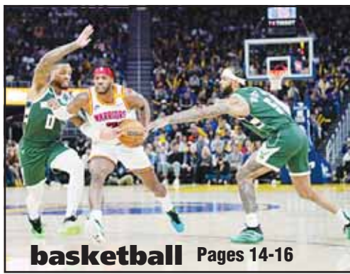
basketball Pages 14-16