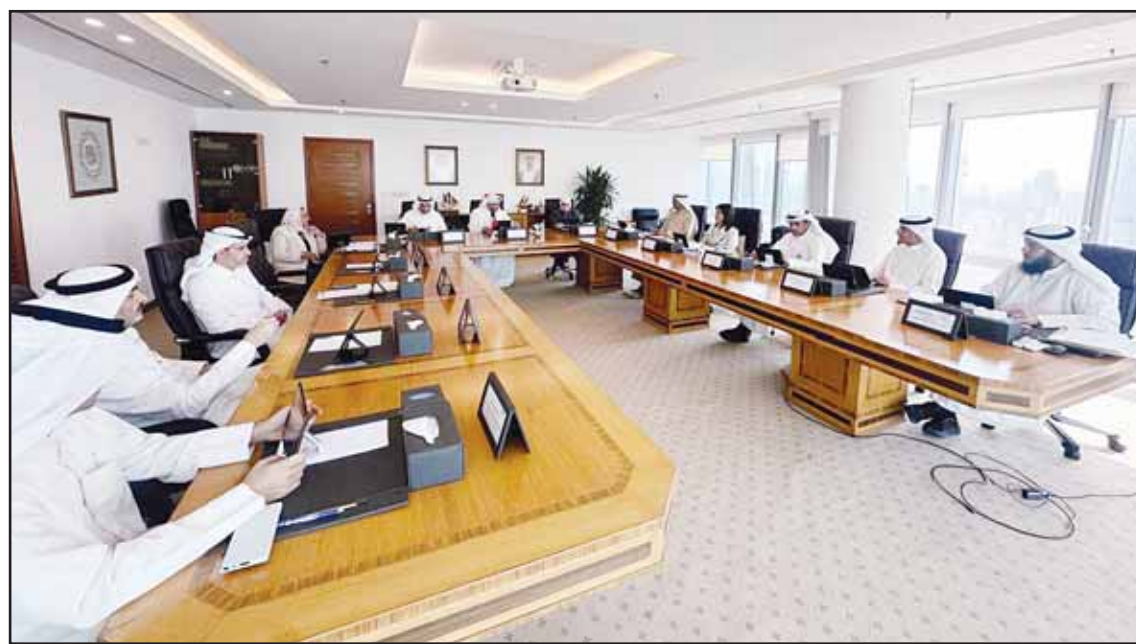
During the council's first meeting of 2025, chaired by the Minister of Higher Education and Scientific Research Dr. Nader Al-Jalal.

The meeting concluded with a review of Kuwait University's annual report for the 2022/2023 academic year, as well as the 2023 annual report of the General Secretariat of the Council of Public Sector Universities.