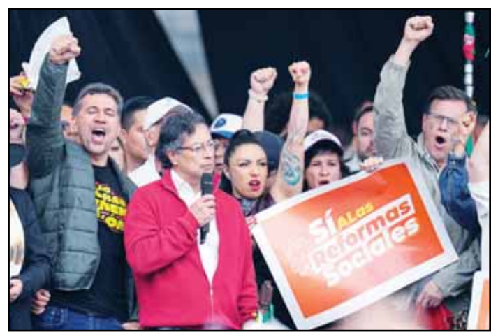
Colombia's President Gustavo Petro addresses supporters during a rally he called to back his labor and health reform proposals, which have struggled to gain legislative approval, outside Congress in Bogotá, Colombia on March 18.

But some analysts have said that the special election can help the government energize its supporters before congressional elections in March. The special election also enables the national government to campaign for its causes, using public funds.