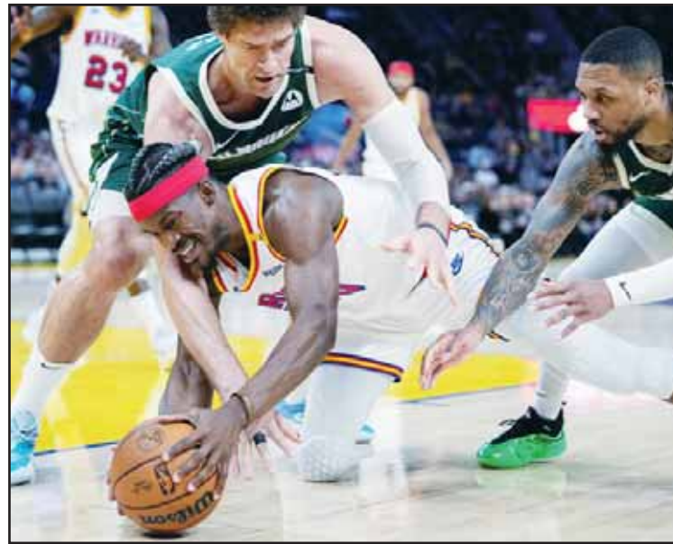
Golden State Warriors forward Jimmy Butler III, center, and Milwaukee Bucks center Brook Lopez, left, compete for possession of the ball during the second half of an NBA basketball game in San Francisco.

With 13 games remaining in the regular season, Golden State is 40-39 and remains in the No. 6 slot in the Western Conference.