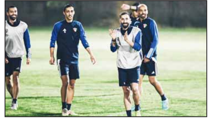
Players hold their final training session before Iraq showdown.