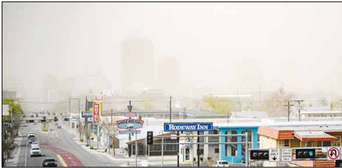
Travel is highly discouraged in the #ABQ metro through Tuesday afternoon on March 18, due to visibility below a quarter mile from blowing dust and dangerous crosswinds of up to 70 mph on north to south roads and highways, in downtown Albuquerque, NM, looking west from Route 66.

"There are only two ways to respond to the proposal of the president of the United States: it's a yes or a no - no buts, no conditions," Stubb said. "Ukraine accepted a ceasefire without any forms of conditions. If Russia refuses to agree, we need to increase our efforts to strengthen Ukraine and ratchet up pressure on Russia to convince them to come to the negotiating table."