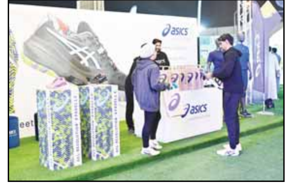
A shot from the ASICS stand during the award ceremony.