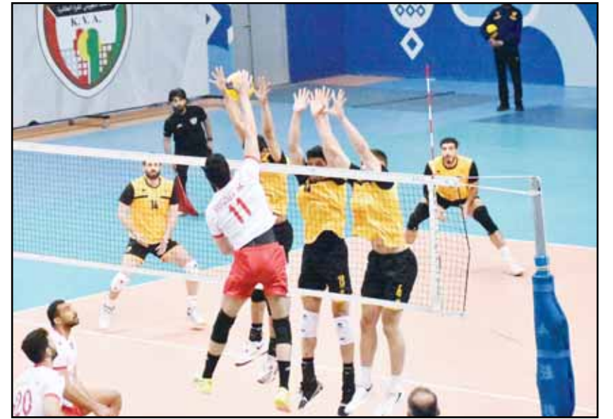
Kuwait Club player spikes the ball as Al Qadsiya players defend.