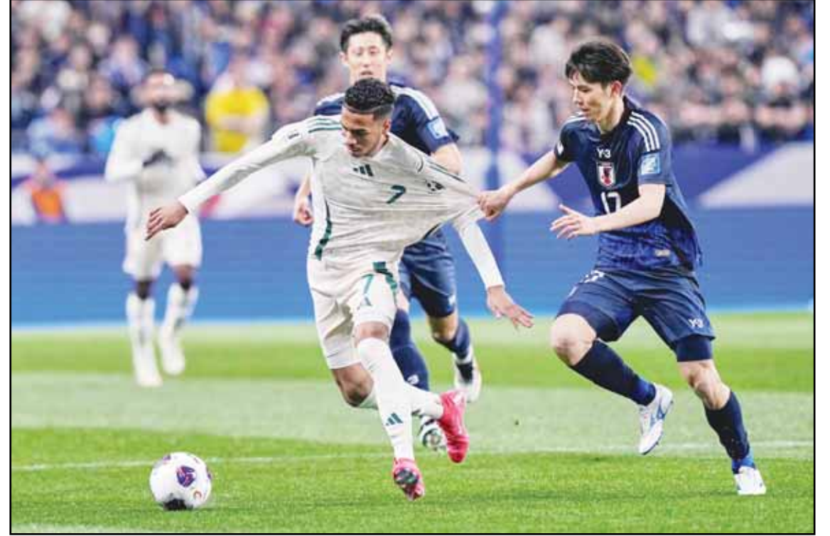
Japan's Ao Tanaka, right, and Saudi Arabia's Musab Aljwayr battle for control of the ball during the World Cup 2026 Group C qualifying soccer match between Japan and Saudi Arabia at Saitama Stadium 2002 in Saitama, north of Tokyo.