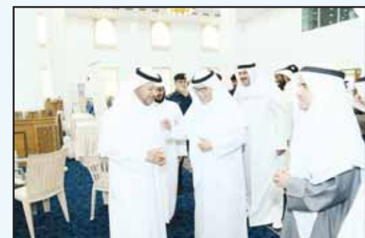
Farwaniya Governorate photos Farwaniya Governor Sheikh Athbi Nasser Al-Athbi Al-Sabah during the inauguration of the mosque in Jleeb.