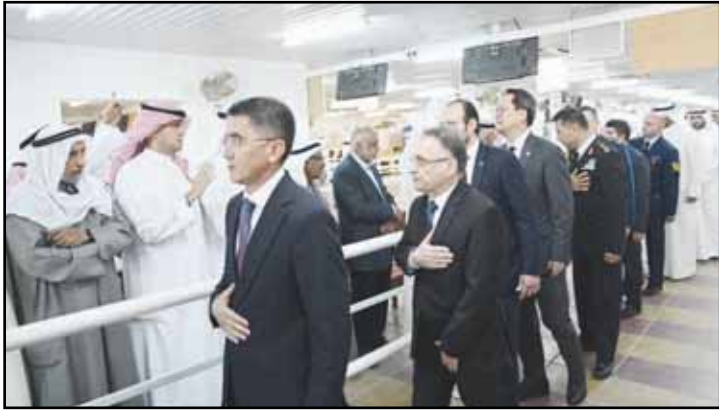
Diplomatic icon Khaled Al-Jarallah laid to rest as diplomats, colleagues and friends pays their respect to the late former Deputy Foreign Minister.