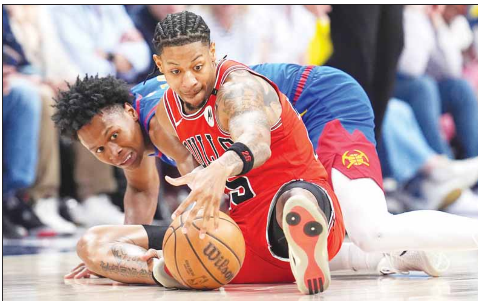
Chicago Bulls forward Dalen Terry, front, struggles to collect a loose ball as Denver Nuggets forward Peyton Watson defends in the second half of an NBA basketball game in Denver.

late in the third quarter of the Celtics' sixth consecutive win. After making his fifth 3-pointer of the game, Tatum absorbed a Flagrant 1 foul by Kings 6-foot-11 center Domantas Sabonis. He remained down for several moments before eventually making 1 of 2 free throws and being helped to Boston's locker room.