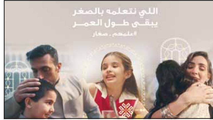
Burgan Bank's 'Teach Them Young' campaign instills Kuwait's values, customs and traditions in children from an early age.