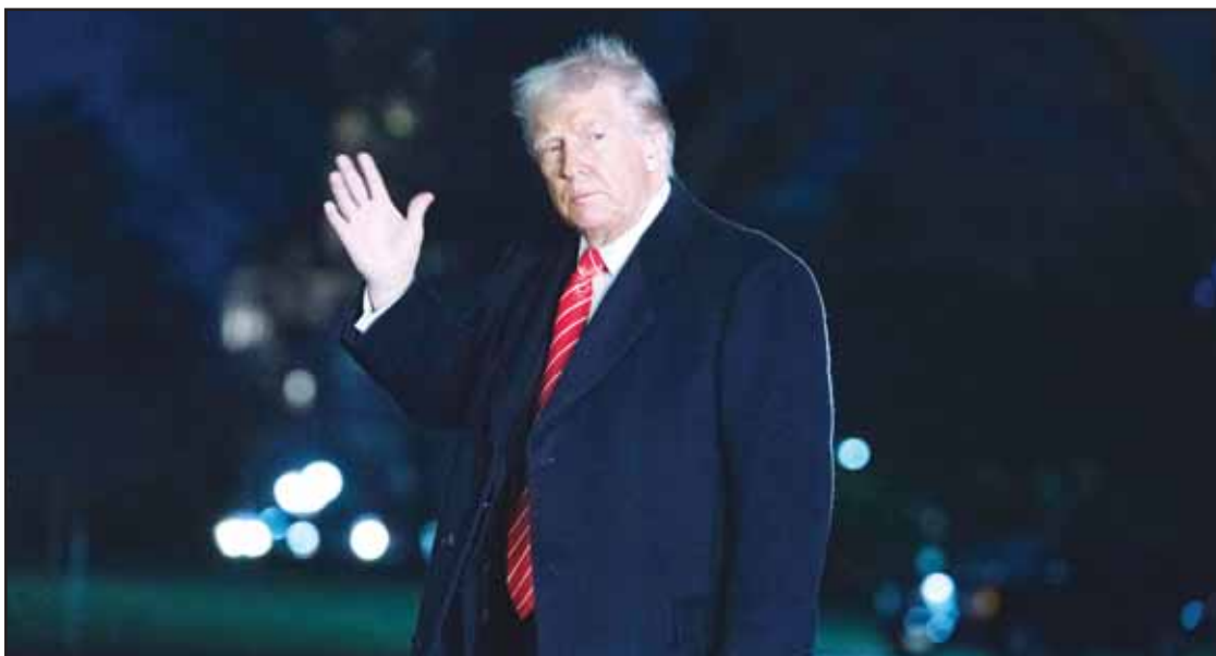
President Donald Trump waves to the media as he walks on the South Lawn of the White House, in Washington, Saturday, March 22, 2025.

an end to the Chevron-Venezuela relationship, in what became a financial lifeline for the South American country.