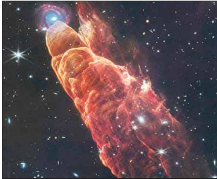
An undated image from NASA's Webb Space Telescope shows an outflow from a nearby still-forming star in infrared light, with a spiral galaxy off in the distance.