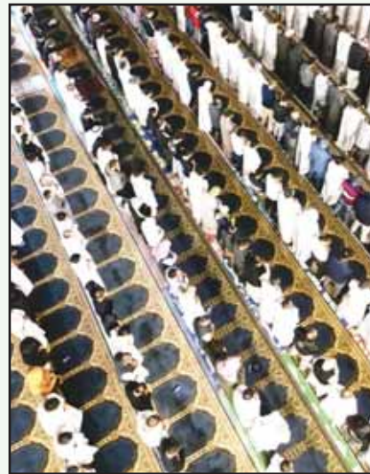
Participation of worshipers in the last ten days.

an essential part of stc's annual Ramadan campaign, especially since it helps support and enhance the spiritual experience of worshipers through thoughtful and meaningful contributions.