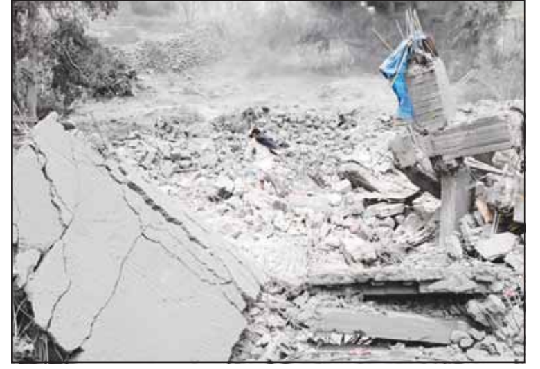
A Yemeni walks over the debris of a destroyed building after US airstrikes in Sanaa, Yemen, Monday, March 24.

The statement added that the National Polio Eradication Program had been implementing a rigorous vaccination strategy aimed at eliminating the virus and brought a consistent decline in polio cases since September 2024.