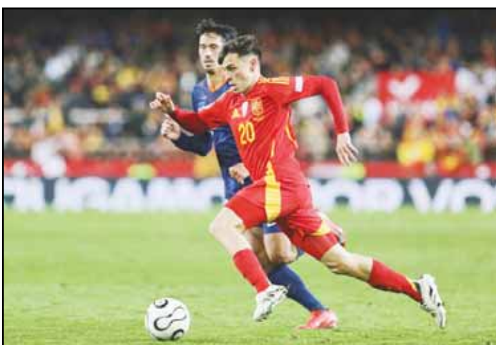
Spain's Pedri, foreground, duels for the ball with Netherlands' Tijjani Reijnders during the UEFA Nations League quarterfinal second leg match, at Mestalla stadium in Valencia, Spain.

On April 2, Barca visit the Metropolitan Stadium for the second leg of their Copa del Rey semifinal after a 4-4 draw in the first leg. On April 5, they play Betis in La Liga (again with less than 72 hours to recover) before hosting Borussia Dortmund on April 9 in the first leg of the Champions League quarterfinal.