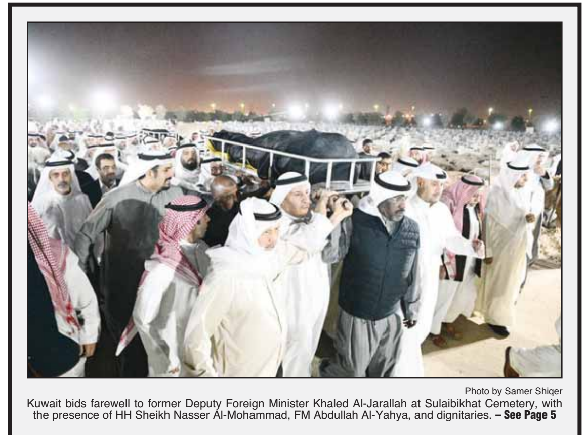
Kuwait bids farewell to former Deputy Foreign Minister Khaled Al-Jarallah at Sulaibkhat Cemetery, with the presence of HH Sheikh Nasser Al-Mohammad, FM Abdullah Al-Yahya, and dignitaries. - See Page 5