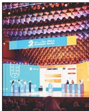
Burgan's Ramadan Ghabga featured friendly competitions between teams, creating a lively and vibrant atmosphere.