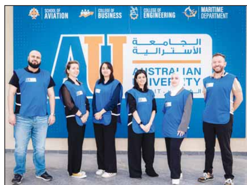
Australian University team

Tel: +973 17701201 - Ext. 351 | Email: reservation@albander.com | www.albander.com | @albanderhotelandresort