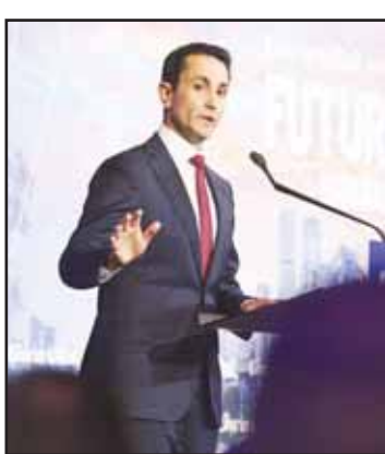
Queensland Premier David Crisafulli speaks during the announcement of Games Delivery Plan for the 2032 Olympics and Paralympics, in Brisbane, Australia.

It's been a year since local organizers scrapped initial plans to demolish and rebuild the Gabba, an iconic