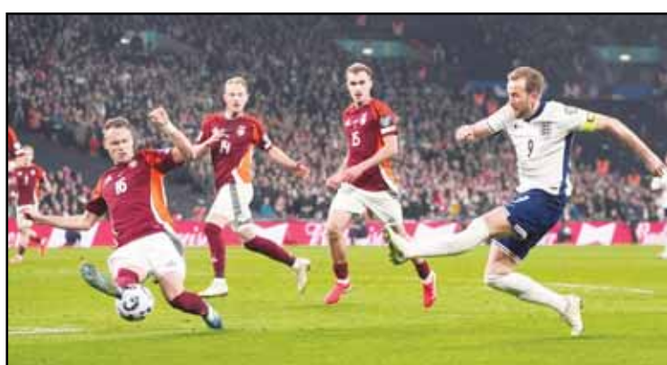
England's Harry Kane, right, makes an attempt to score during a World Cup qualifying soccer match between England and Latvia at Wembley stadium in London.

Poland tops Group G with six points, two ahead of Finland, one of the teams that has never before qualified for the World Cup.