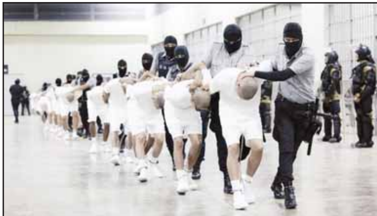
In this photo provided by El Salvador's presidential press guards, prison guards transfer deportees from the U.S., alleged to be Venezuelan gang members, to the Terrorism Confinement Center in Tecoluca, El Salvador on March 16.