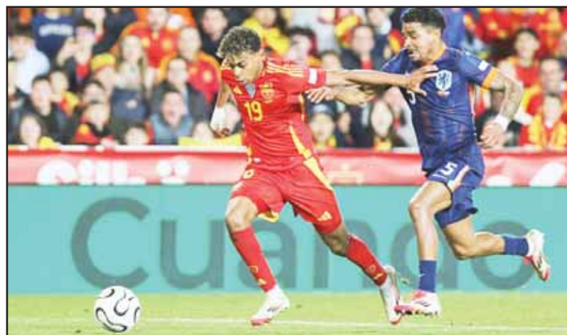
Spain's Lamine Yamal, left, duels for the ball with Netherlands' Ian Maatsen during the UEFA Nations League quarterfinal second leg match between the Netherlands and Spain at Mestalla stadium in Valencia, Spain.

Spain, the defending European champion, is trying to win its second straight Nations League title.