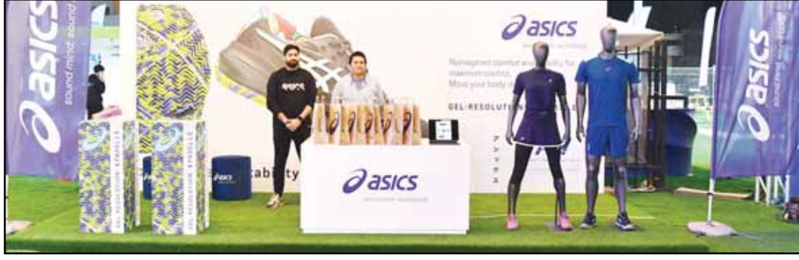
ASICS Pavilion at Al Qabas Padel Championship.