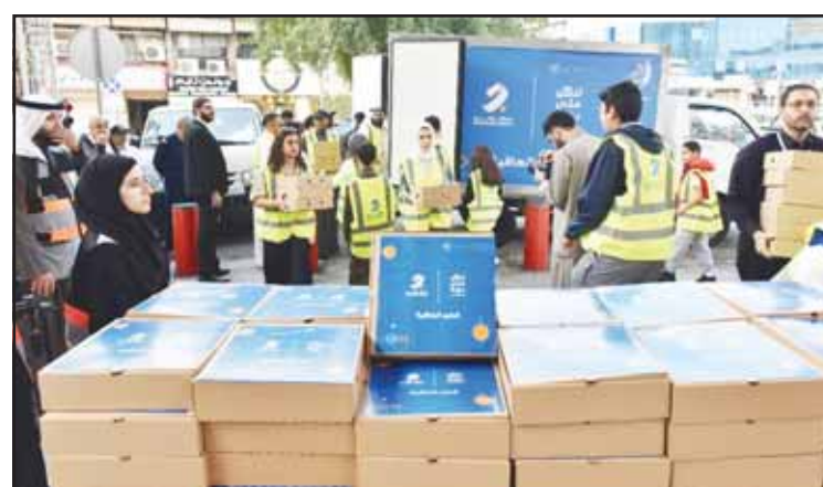
Volunteers distributing iftar meals.

that a person's value lies in their essence and not their appearance. Teaching children young is important, as Ramadan is an opportunity; and what is learned at a young age lasts a lifetime.