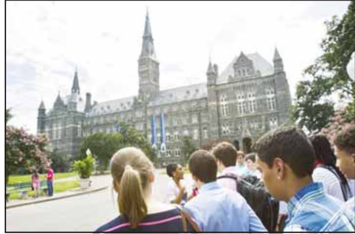
In this July 10, 2013, file photo, prospective students tour Georgetown University's campus in Washington.