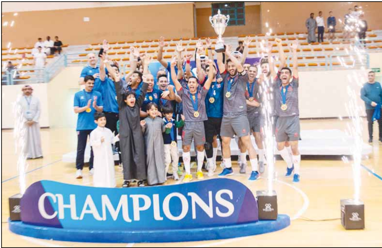
Kuwait Club players celebrate after winning Futsal Federation Cup.

KUWAIT CITY, March 25: Kuwait Club secured the Futsal Federation Cup, edging past Kazma in a dramatic penalty shootout after a thrilling 3-3 draw in regulation time.