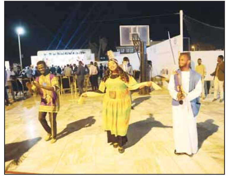
Dancers from a folk troupe perform a traditional dance in Port Sudan, eastern Sudan, Feb. 26, 2025.