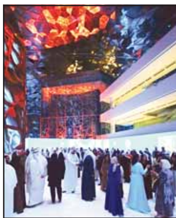
Burgan Bank's family gathered for the annual Ramadan Ghabga at the Sheikh Jaber Al-Ahmad Cultural Center.