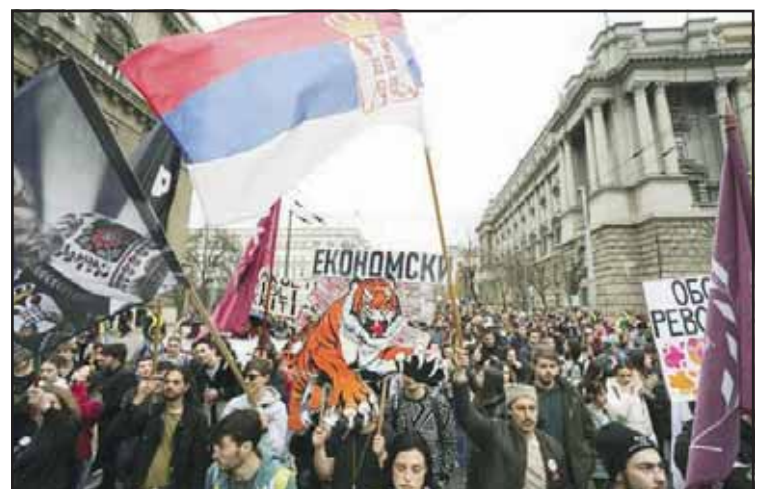
People take part in a protest rally in Belgrade, Serbia on March 24, against a real estate development project that will be financed by the firm of Donald Trump's son-in-law, Jared Kushner, at the site of the former Yugoslav army headquarters destroyed in a US-led NATO bombing campaign in 1999.

Boasberg, an Obama nominee, ruled that immigrants facing deportation must get an opportunity to challenge their designations as alleged gang members. He said there is "a strong public interest in preventing the mistaken deportation of people based on categories they have no right to challenge."