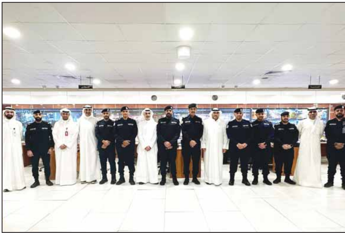
Gulf Bank honors Traffic Officers with Ramadan iftar.

"As families come together to break their fast during the holy month, the dedicated men and women