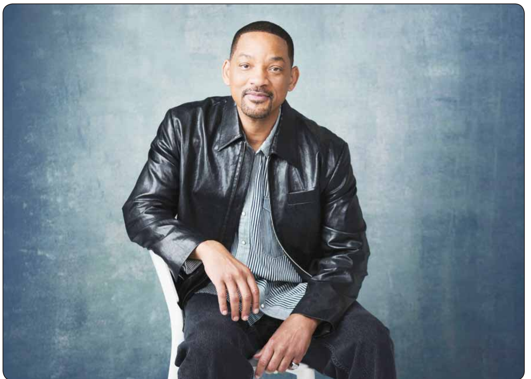
Will Smith poses for a portrait on Monday, March 17, in Los Angeles.

'Based on a True Story,' his first music project in 20 years