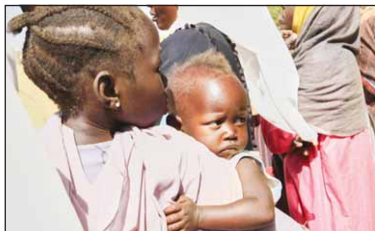
A Sudanese displaced woman holds her child as they take shelter in a school after being evacuated by the Sudanese army from areas once controlled by the paramilitary Rapid Support Forces (RSF) in Omdurman, Sudan, located across the Nile River from Khartoum, on March 23.

to be held in February 2023, but they were postponed until December 2024 - and again until 2026.