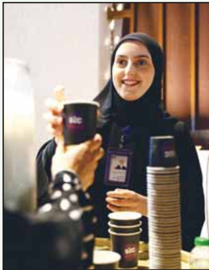
A side of the hospitality of worshipers in the last ten days.

As part of the initiative, stc offered various services to the Grand Mosque and Moza Muhammad Salem Mosque located at Bayan Area, ensuring a comfortable and welcoming environment for worshipers attending Qiyam prayers during the final days of Ramadan. The services provided under stc's care and hospitality initiative included providing refreshments such as water and coffee, providing seats for the elderly, and other additional amenities aimed at enriching the worshipers' experience during this spiritual and significant time during Ramadan. This initiative comes as