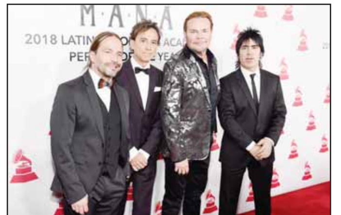
Sergio Vallin, (from left), Juan Calleros, Fher Olvera and Alex Gonzalez, of Maná, appear at the Latin Recording Academy Person of the Year gala in their honor on Nov. 14, 2018.

Referencing the ongoing immigration crackdown in the US, González notes "there's a lot of people that are scared."