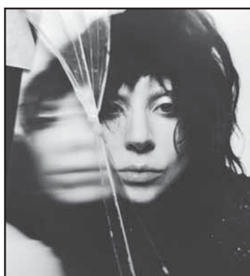
This cover image released by Interscope Records shows 'Mayhem' by Lady Gaga.

The answer, of course, is up to the listener. Some will hear "Ab-racadabra" as life-affirming dance