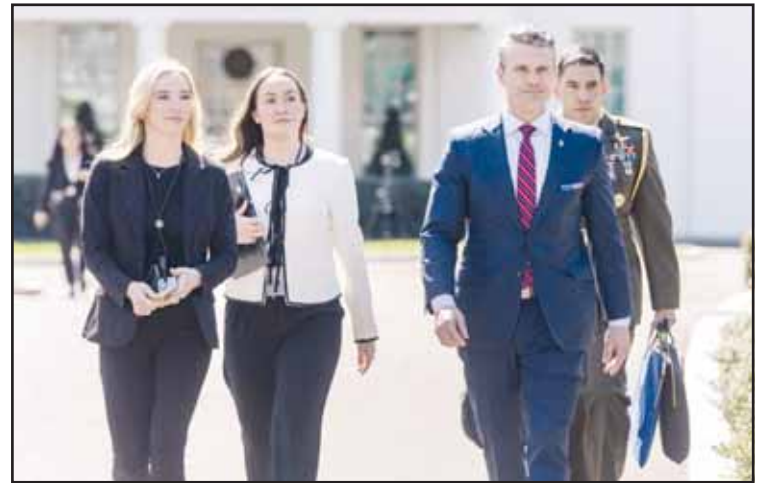
US Defense Secretary Pete Hegseth, second from right, walks outside the Oval Office at the White House on March 21, in Washington.