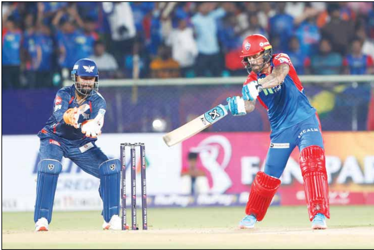
Delhi Capitals' Faf du Plessis plays a shot during the Indian Premier League cricket match between Delhi Capitals and Lucknow Super Giants at ACA-VDCA Cricket Stadium in Visakhapatnam, India.