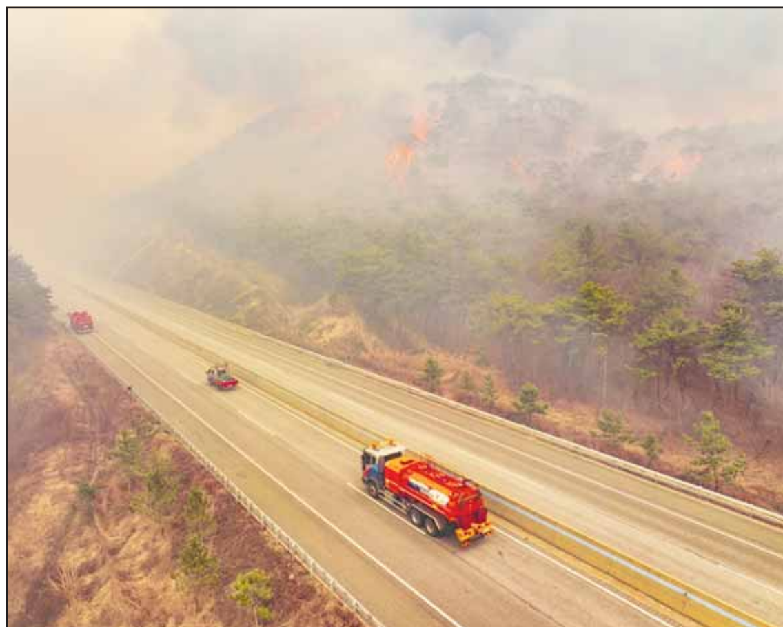
A road is closed as a wildfire fueled by strong winds spreads in Uiseong, South Korea on March 24.

He said companies from all over the world, including those from Italy, are welcome to seize cooperation opportunities in and grow alongside the Chinese economy.