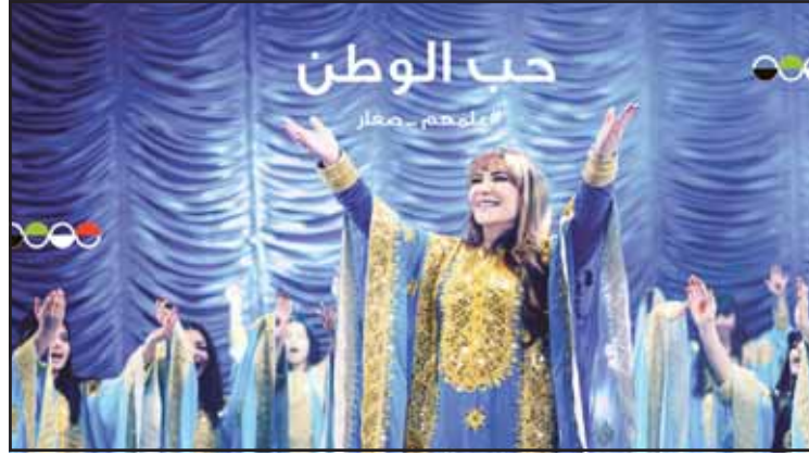
Burgan Bank honors Kuwait's National Day 2025 with a TVC celebrating 'One's Love of Homeland'.

Under the "Teach Them Young" umbrella, the Bank also encouraged employees' children to participate in the philanthropic initiative of distributing iftar meals to those fasting during Ramadan. The initiative aimed to instill several values in children, including selfless giving, the importance of connecting with others, and the belief