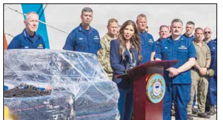
Homeland Security Secretary Kristi Noem speaks during a news conference in Fort Lauderdale, Fla., on March 20.

Those fears were heightened Sunday when Usha Vance, the wife of US Vice President JD Vance, announced she would visit Greenland later this week to attend the national dogsled race.