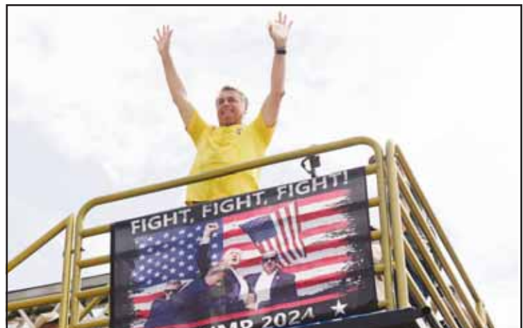
Brazil's former president Jair Bolsonaro gestures to the crowd upon arriving at a rally in support of a proposed bill to grant amnesty to those arrested for storming government buildings in an alleged coup attempt in 2023, in Rio de Janeiro, March 16.

Bolsonaro called on social media Sunday for a new demonstration on April 6, to be held on one of Sao Paulo's main arteries, Avenida Paulista.