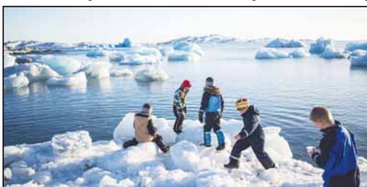
Boys play on a frozen beach in Nuuk, Greenland on March 11.

Greenland. It is a source of immense family pride that her father, an artist and teacher, designed the red-and-