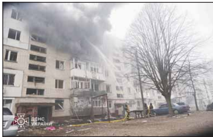
In this photo provided by the Ukrainian Emergency Service, firefighters put out the fire following a Russian attack in Sumy, Ukraine on March 25.

While the White House said a partial ceasefire would include ending attacks on "energy and infrastructure," the Kremlin declared that the agreement referred more narrowly to "energy infrastructure." Ukrainian President Volodymyr Zelenskyy has said he would also like to see sites like railways and ports protected.