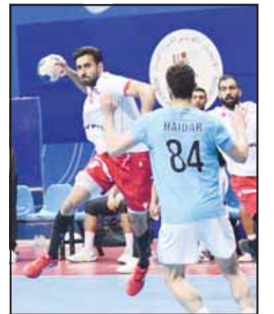
Kuwait Club is tackled as he goes for a goal.

Al-Qurain – 12 points, Al-Qadisiya – 12 points, Khaitan – 8 points, Al-Fahaheel – 8 points, Al-Tadamon – 3