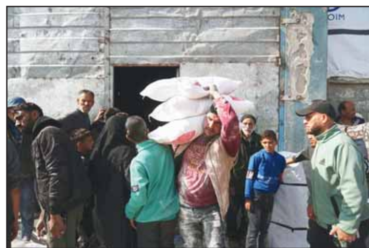
Palestinians receive bags of flour and other humanitarian aid distributed by UNRWA, the U.N. agency helping Palestinian refugees in Jabaliya, Gaza Strip on Tuesday, March 25, 2025.

Israeli occupation is forcibly displacing Palestinians and committing severe violations to international laws and norms namely UNSC resolution 2334, which is against illegal Israeli settlement activities attempting to change the demographic nature of occupied lands including that of east Jerusalem, it added.