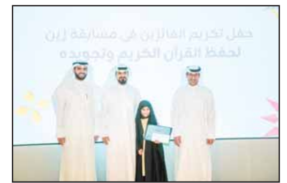
Recognizing a talented winner.

employees and their children, in which the top three winners were honored with encouraging cash prizes.