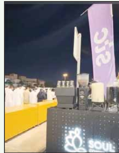
stc's participation in the Grand Mosque and Moza Mosque.

In the Grand Mosque, stc offered its special services in the Amiri Hall, to create an inviting and pleasant ambiance for senior officials and distinguished guests attending prayers. Additionally, stc sponsored