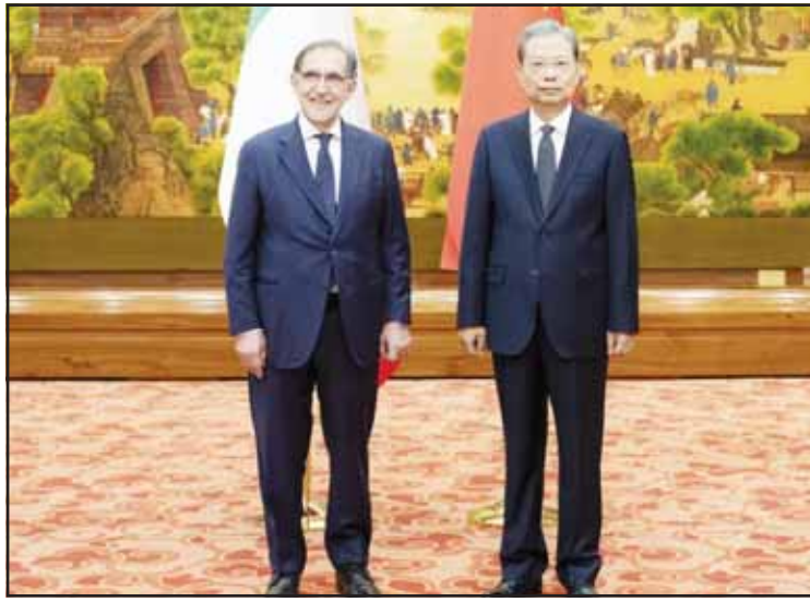
Zhao Leji, chairman of the National People's Congress Standing Committee, holds talks with Italy's Senate President Ignazio La Russa in Beijing, capital of China on March 24.

The Portuguese foreign minister said that Chinese investment has played an important role in Portugal's economic and social development. Portugal welcomes more Chinese en-