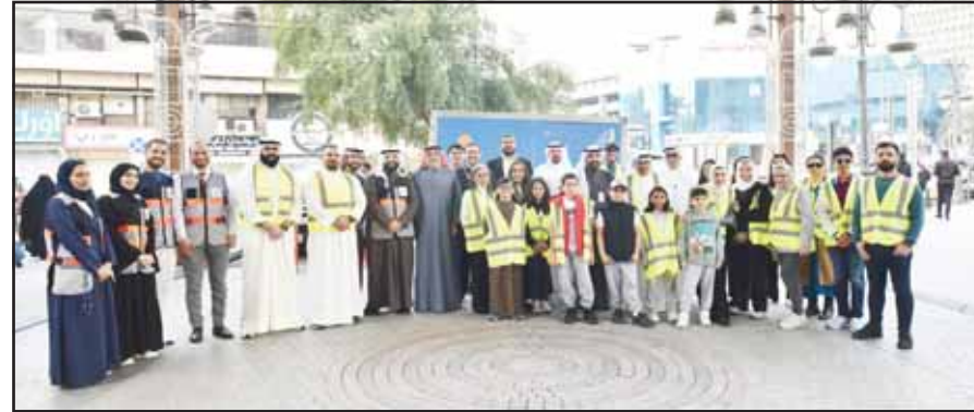
A group photo of Burgan employees and their children who took part in the iftar meals distribution initiative.