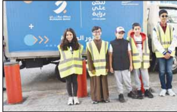
A group photo of children who participated in the iftar meal distribution initiative.