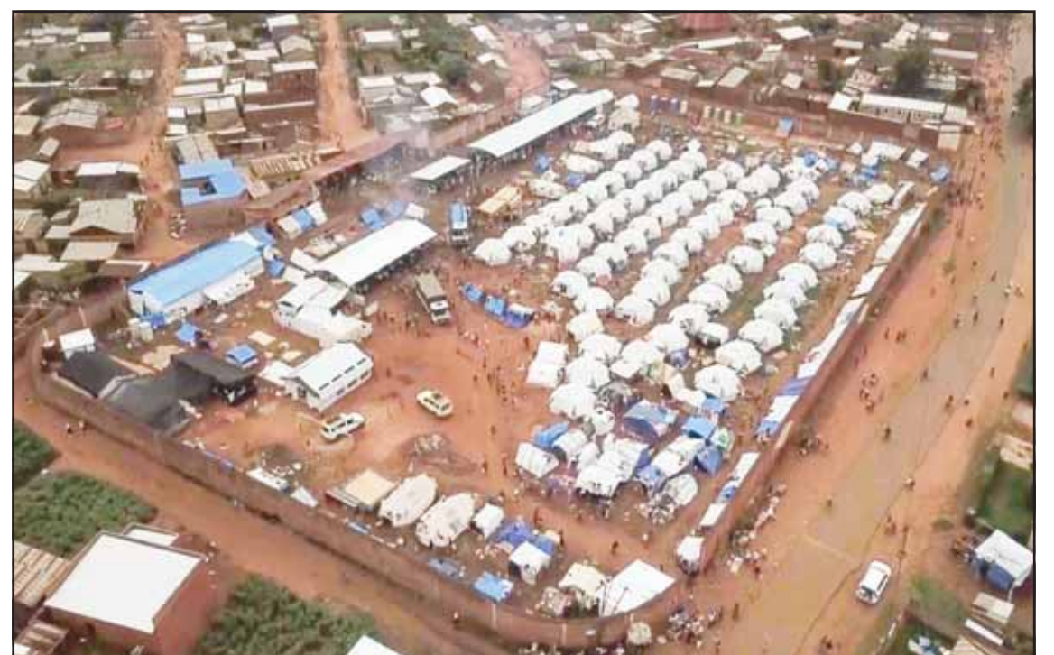
This image taken from a video provided by UN World Food Program shows Rugombo Stadium where more than 45,000 Congolese refugees are sheltering on March 11, 2025, in Rugombo, Burundi. (AP)