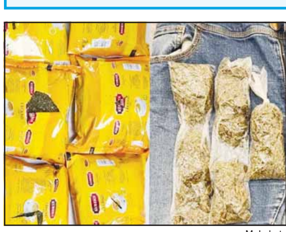
Marijuana packed in tea bags seized by airport customs.