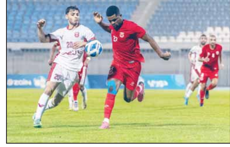
A file photo of players challenging for the ball during the Zain Premier

After this round, the top six teams will advance to the single-round "Championship" league, while the bottom four teams will compete in the "Relegation League," also in a singleround format, with two teams set for