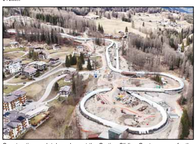
Construction work takes place at the Cortina Sliding Center, venue for the bob, luge and skeleton disciplines at the Milan Cortina 2026 Winter Olympics, in Cortina D'Ampezzo, Italy.

Athletes from 12 nations are involved in the tests this week. It's about 60 athletes in all, about half of them being Italian sliders. Coaches representing at least 23 different sliding nations were also invited to view this week's events.