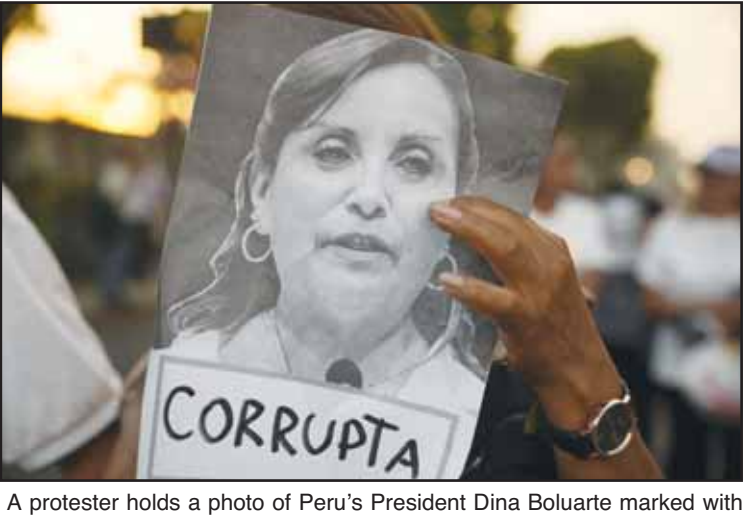
the Spanish word for corrupt during a march to demand the government provide security against the rising violence in Lima, Peru on March 21.