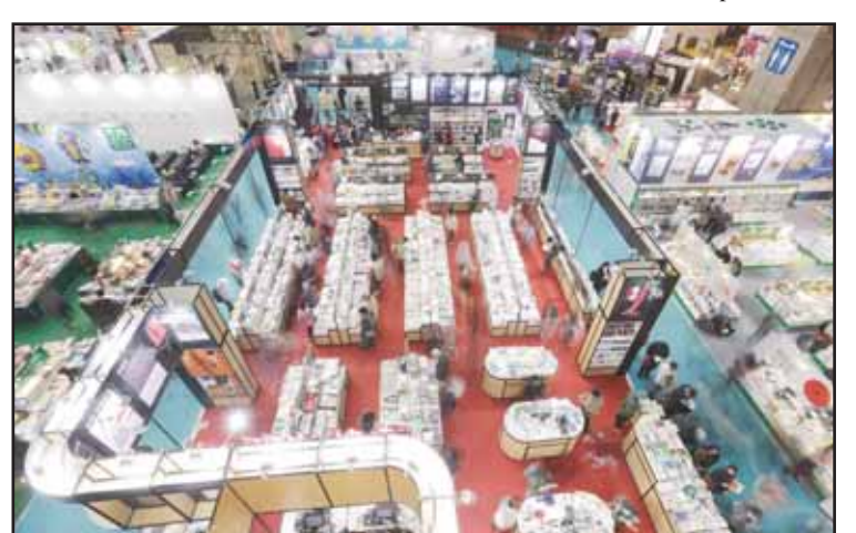
People gather around tables with newly released books on display during the Taipei International Book Exhibition at the Taipei World Trade Center in Taipei, Taiwan on Jan 31, 2023.

had been living in Taiwan, according to Taiwanese media. He was detained two years ago during a trip to China, and Taiwanese media reported last