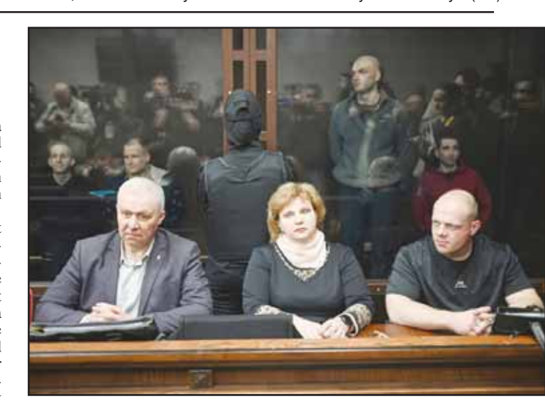
Lawyers of Ukrainians captured by Russia during hostilities in Ukraine sit in front of the defendant's cage during a hearing at the Southern District Military Court in Rostov-on-Don, Russia on March 26.

The defendants included 14 current or former fighters of the elite Azov brigade, which Russia designated a terrorist group, and nine women and one man who worked as cooks or support personnel, according to Russian media reports and rights activists. Twelve defendants were not in court - 11 had returned to Ukraine in two prisoner exchanges and were convicted in absentia. One more died in custody last year, and the case against him had