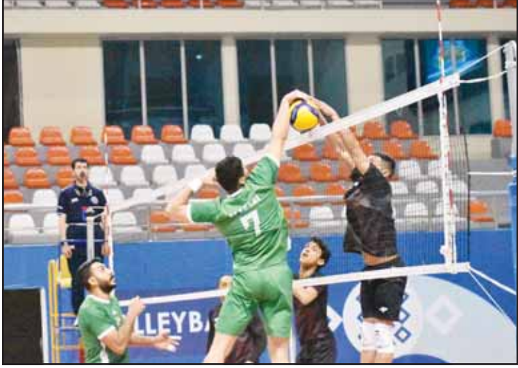
Players battling for the ball.

and the second facing the third. Meanwhile, Al-Nasr, Al-Sulaibikhat, Al-Yarmouk, Al-Tadamon, and Al-Sahel will compete in the first division across three stages.