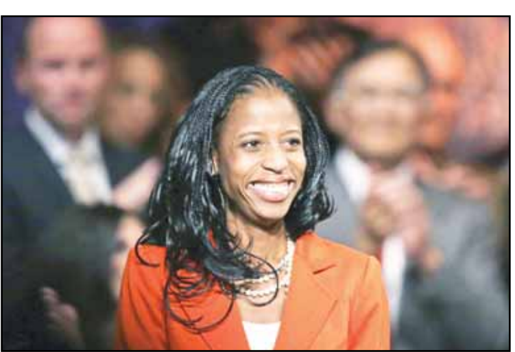
Mia Love, the Republican nominee in Utah's 4th congressional district, smiles after speaking during a rally in Lehi, Utah, Oct. 8, 2014.

She described during a speaking engagement in Salt Lake City how she discovered the tumor. Love said she