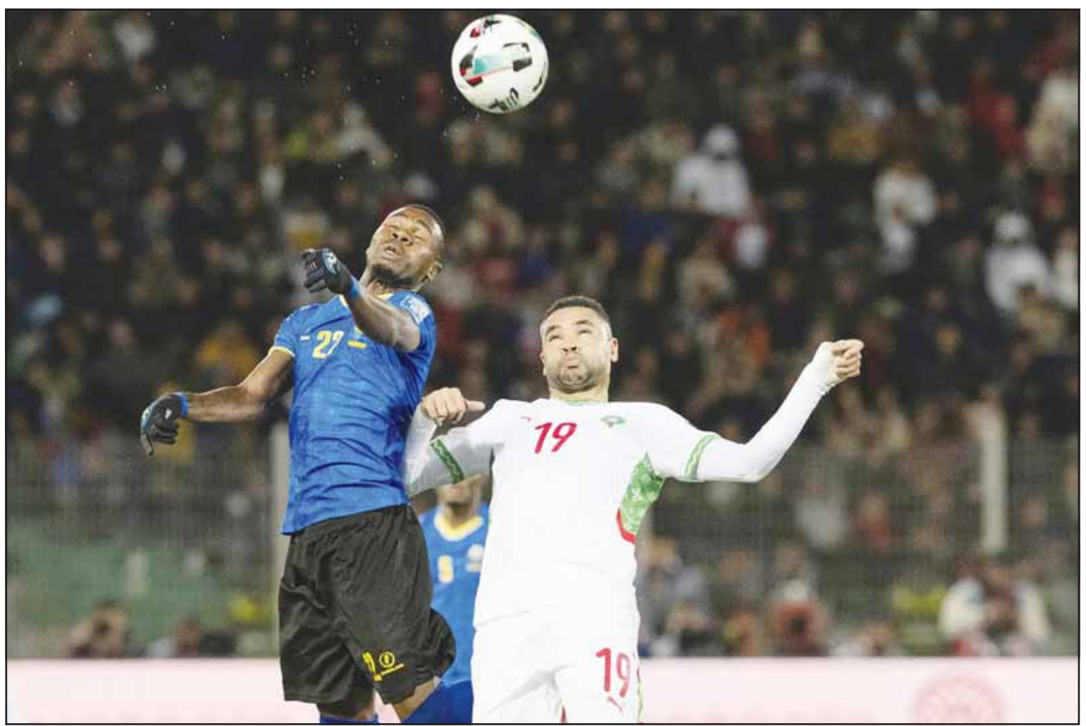
Tanzania's Mudathiri Yahya Abbas, left, is challenged by Morocco's Youssef En-Nesyri during the World Cup Group E qualifying soccer match between Morocco and Tanzania at the Stade municipal d'Oujda, Morocco.

Congo moves top of Group B on 13 points, one ahead of unbeaten Senegal