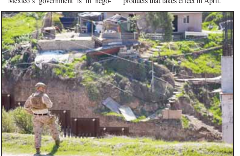
A Marine looks towards Tijuana, Mexico, standing between two border walls during a news conference on joint operations involving the military and the Border Patrol, on March 21 in San Diego.

tiations with the United States in an attempt to eliminate or reduce a proposed 25 percent tariff on Mexican products that takes effect in April.