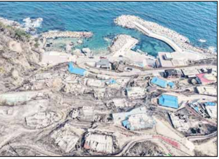
Burnt-out houses are seen at a damaged village due to wildfires in Yeongdeok, South Korea on March 26.

Han said crews were struggling to extinguish the wildfires because strong winds swept the areas overnight. Han said about 4,650 fire-