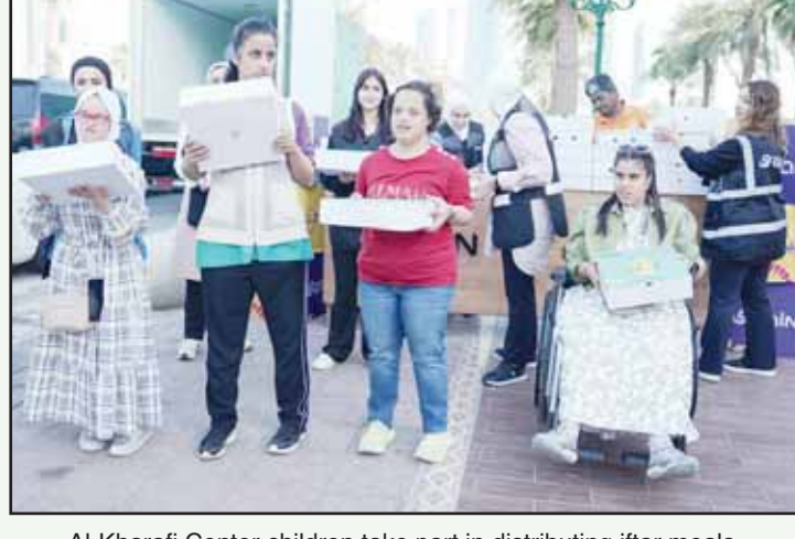
Al-Kharafi Center children take part in distributing iftar meals.

Shuyoukh, bringing the total number of meals distributed throughout the Holy Month to 40,000. Zain's team oversees this initiative directly, with the participation of the Zain Al-Shuhoor volunteer team, comprised of company employees from various departments and