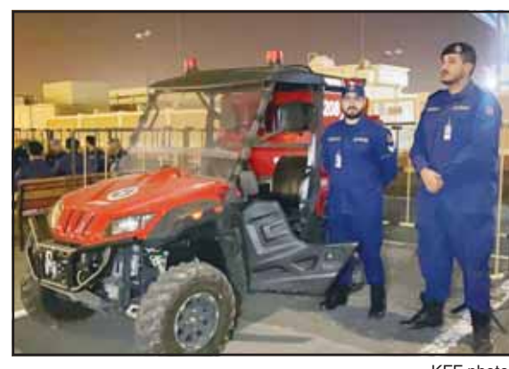
KFF use such buggies in case of inaccessible spots at the blaze site.