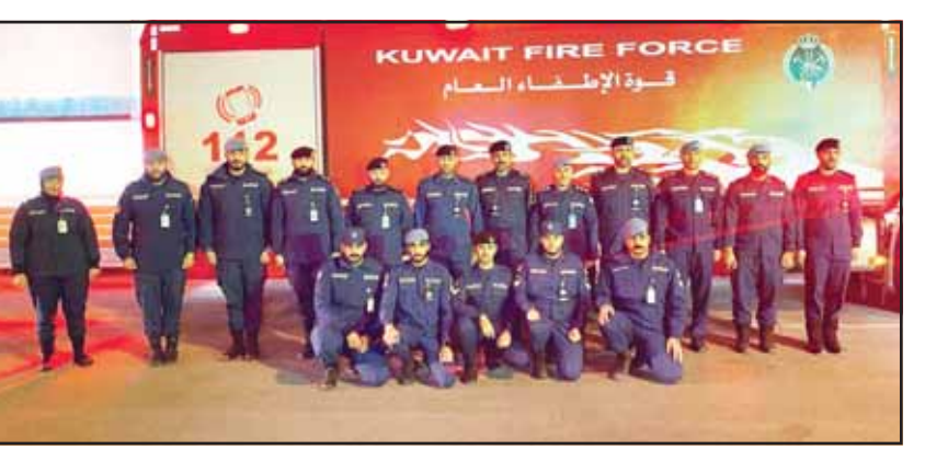
Brigadier General Ahmad Nasser Abdullah and a team of officers during their visit

Article 1 of the resolution removes Clause F in Article 87 of the ministerial Resolution No. 81/1976. Article 2 stipulates that the Undersecretary of the Ministry of Interior is responsible for implementing this resolution, which will take effect from the date of its publication in the official gazette.