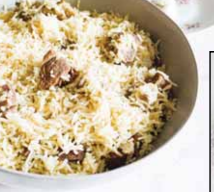
This photo shows a recipe for mutton pulao from Maryam Jillani's book, 'Pakistan.'

1/4 cup ghee; 6 green cardamom pods, cracked; 5 1/2 ounces seviyan (semolina vermicelli); 8 1/2 cups full-fat milk; 3/4 cup sugar; 2 tablespoons blanched sliced al-