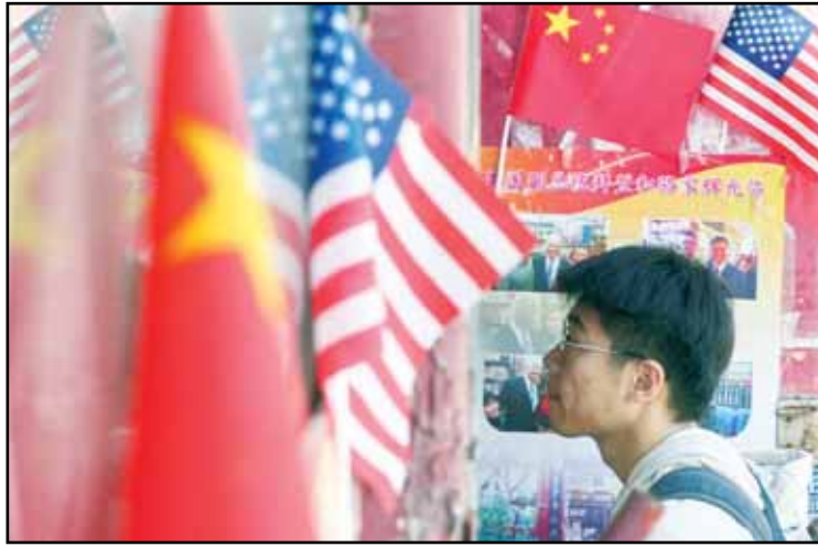
A man walks into a merchandise store displaying Chinese and United States' national flags, in Beijing, Thursday, April 3, 2025.

During Trump's first term, higher tariffs led leader Xi Jinping to champion a shift to high-tech production. That will likely continue as U.S. pressure intensifies, causing job losses due to changes in manufacturing rather than direct damage from