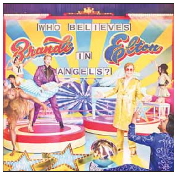
This album cover image released by Interscope Records shows 'Who Believes In Angels?' by Elton John and Brandi Carlile.

It is only natural for fans to leave wanting to hear more John. But in whole, "Who Believes In Angels?" is full of life - and it is a joy to hear an energetic John just a few years after he embarked on his farewell tour.