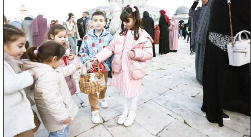
Palestinians attend Eid al-Fitr holiday celebrations at Al-Aqsa Mosque compound in the Old City of Jerusalem, on March 30, 2025.

The Gulf Cooperation Council (GCC) Secretary General, Jassem Al-Budaiwi, described the incursion into Al-Aqsa as a blatant violation of Islamic holy sites. Al-Budaiwi noted that these actions by Israeli officials and settlers not only breach international law but also further destabilize the region and provoke Muslims worldwide, escalating tensions and perpetuating violence in Palestine.