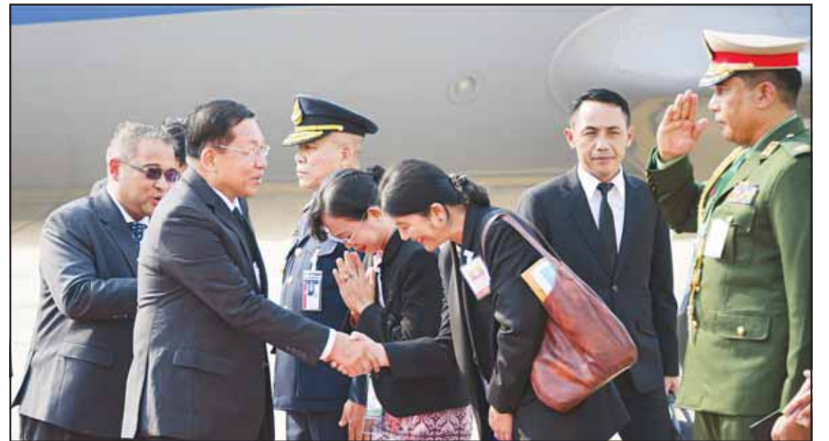
In this photo released by Thailand's Foreign Affairs Ministry, Myanmar's military leader Senior Gen. Min Aung Hlaing, foreground left, arrives in Bangkok, Thailand, on April 3.