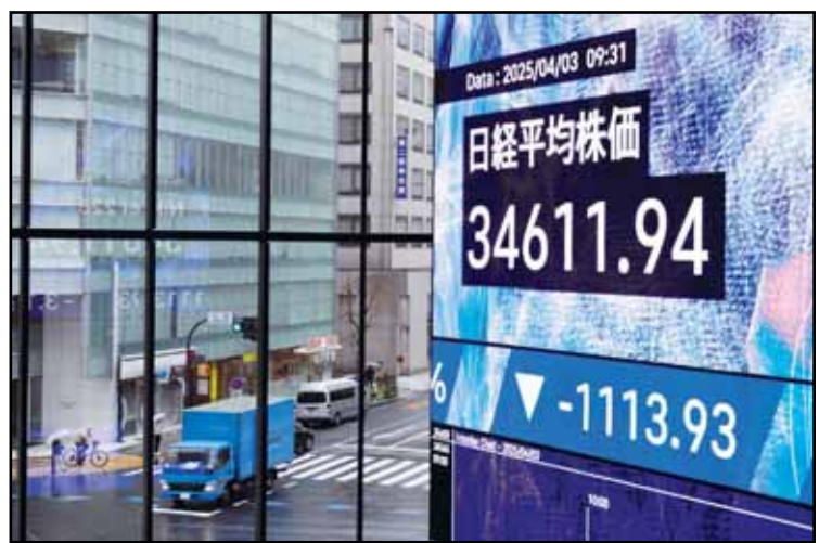
An electronic stock board shows the day's early loss of Japan's Nikkei 225 index at a securities firm Thursday, April 3, 2025 in Tokyo.

Trump's tariff hikes pull Asian shares, US futures sharply lower