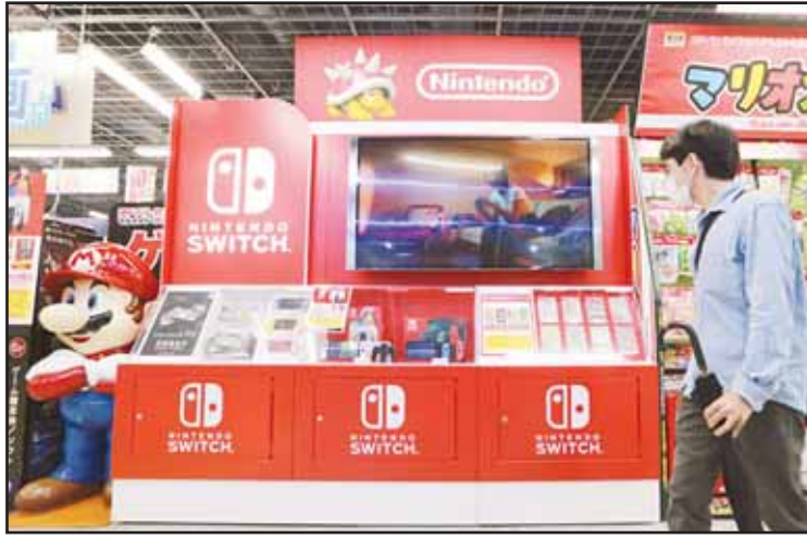
A man walks by a Nintendo Switch display at an electronics retail chain store in Tokyo, on Oct. 13, 2021.

"When you think about some of the biggest titles on (the Nintendo Switch), it's like Mario Kart, Super Mario Jambooree, even though that's quite a new title, has cracked the top 10 of most played games on the console. So, it does make a lot of sense that the sort