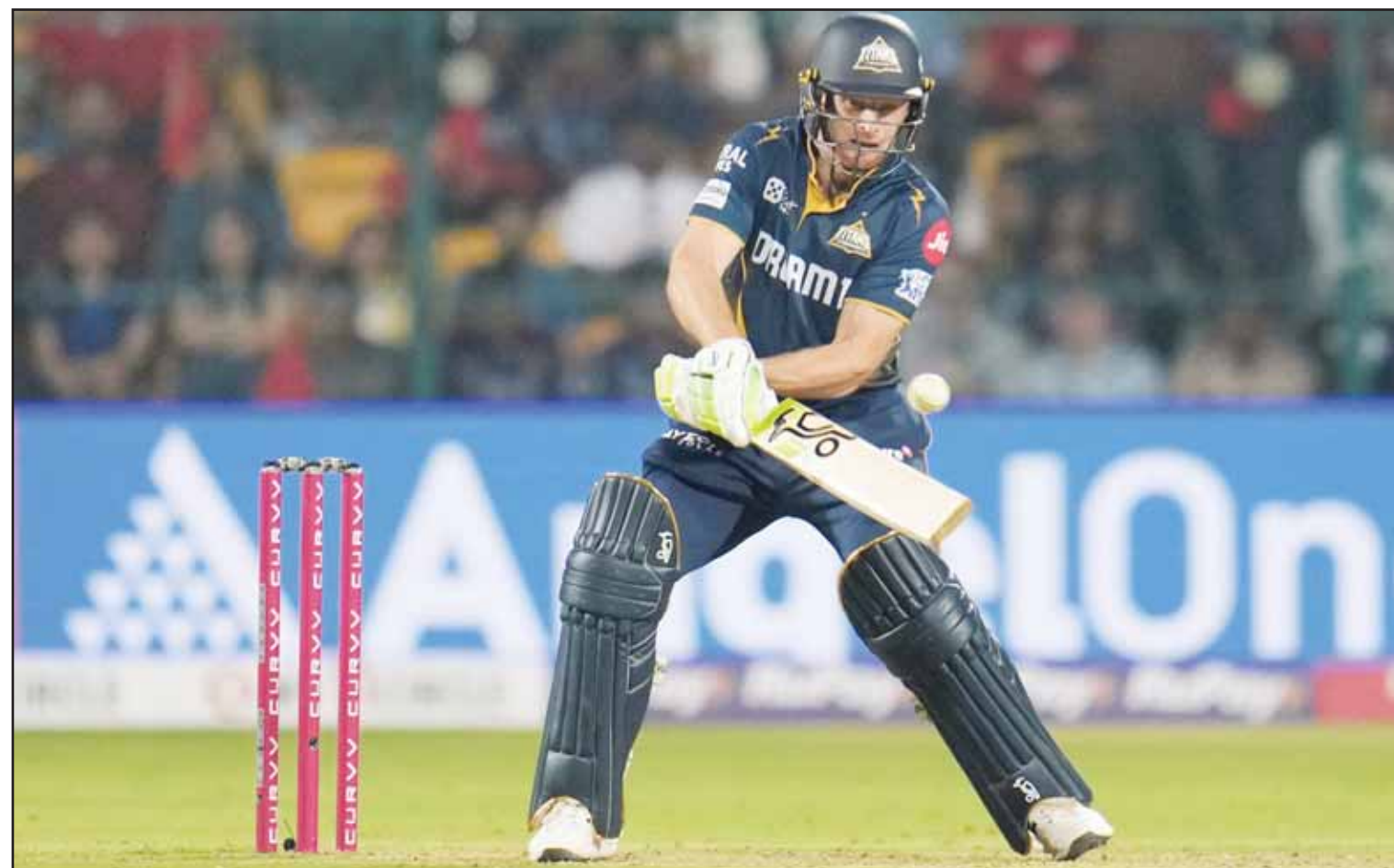
Gujarat Titans' Jos Buttler bats during the Indian Premier League cricket match between Gujarat Titans and Royal Challengers Bengaluru at Chinnaswamy Stadium in Bengaluru, India.