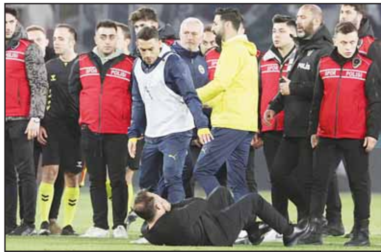
Galatasaray's coach Okan Buruk, bottom, lies on the ground after Fenerbahce's manager Jose Mourinho, center, grabbed his nose at the end of the Turkish Cup quarterfinals soccer match between Fenerbahce and Galatasaray at the Ulker stadium, in Istanbul.

Galatasaray reveled in its victory on Wednesday and posted a picture on its official X account of a smiling Buruk looking in Mourinho's direction.