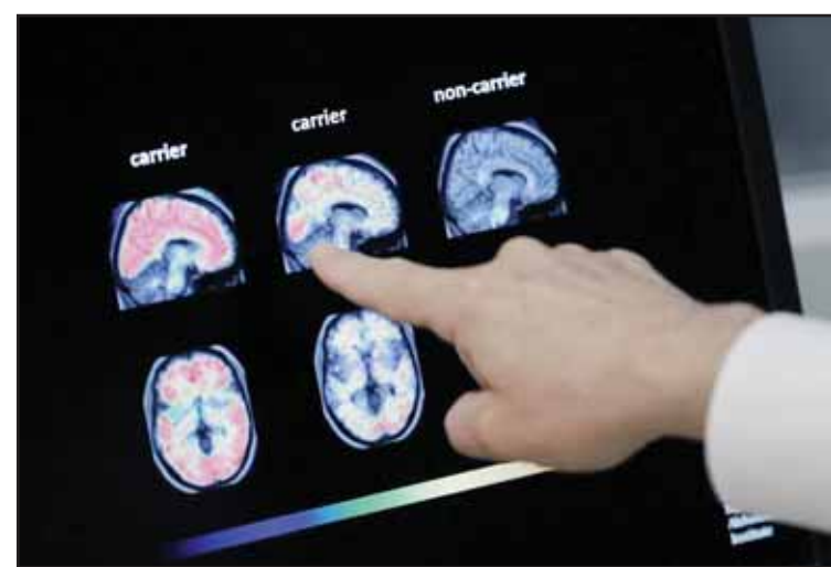
A doctor looks at PET brain scans at Banner Alzheimers Institute in Phoenix on Aug 14, 2018.

Anyone who's had ever had chickenpox - nearly everybody born before 1980 - harbors that virus for the rest of their life. It hides in nerves and can break out when the immune system weakens from illness or age, causing painful, blister-like sores typically on