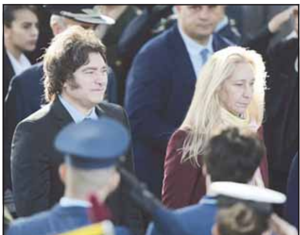
Argentine President Javier Milei, (left), and his sister, the General Secretary of the Presidency Karina Milei, arrive at a war memorial in Buenos Aires, Argentina on April 2, 2025, for a ceremony commemorating the 43rd anniversary of the conflict between Argentina and Great Britain over the Falkland Islands, known as the Malvinas Islands.

"That's why we seek to be a power, to the point that (the islanders) prefer to be Argentine."