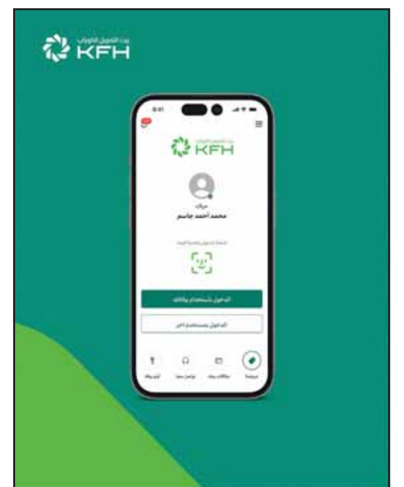
KFH online banking services.

The Bank also launched the Live FX Pricing, and instant cross-border payments service at KFH-Turkey using Ripple's technology in addition to the instant card printing service within two minutes. Additionally, KFH offers digital Wallet service through smart mobiles and watches, providing advanced and smart digital payment methods according to highly developed security standards in cooperation with Samsung, Fitbit and Garmin.