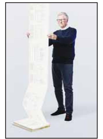
This 1975 photo provided by Gates Ventures shows Microsoft founder Bill Gates holding a printout of the computer code that launched the software maker. (AP)

The code would go on to provide the foundation for a business that would make personal computers a household staple, with a suite of software that include the Word,