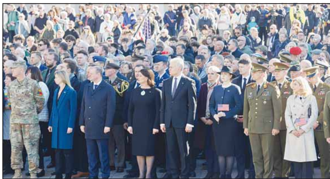
Lithuania's President Gitanas Nausėda, (center), US Ambassador to Lithuania Kara C. McDonald, (second left), and Speaker of Lithuanian Parliament Saulius Skvernelis, (third left), attend a solemn farewell ceremony at Cathedral Square in Vilnius, Lithuania on April 3, 2025, for the US soldiers who died during training exercise.

A spokesperson said that the Democratic senator spent much of Wednesday sleeping.