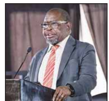
Finance Minister Enoch Godongwana speaks before the vote for national budget for 2025 in the National Assembly, in Cape Town, South Africa on April 2.

The leftist rival party Economic Freedom Fighters celebrated the friction. "We are happy that we managed to break this so-called GNU (government of national unity). What is uniting you if you can't agree on something a national budget?" EFF leader