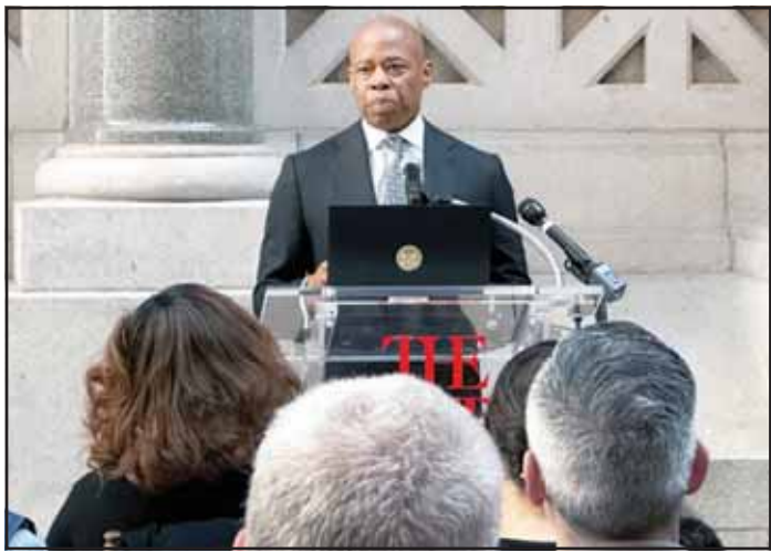
New York Mayor Eric Adams speaks at the Metropolitan Museum of Art during a task force meeting addressing retail theft on April 2, in New York.

A federal judge dismissed Adams' corruption case on Wednesday, ending a legal saga that left the mayor severely damaged and raised