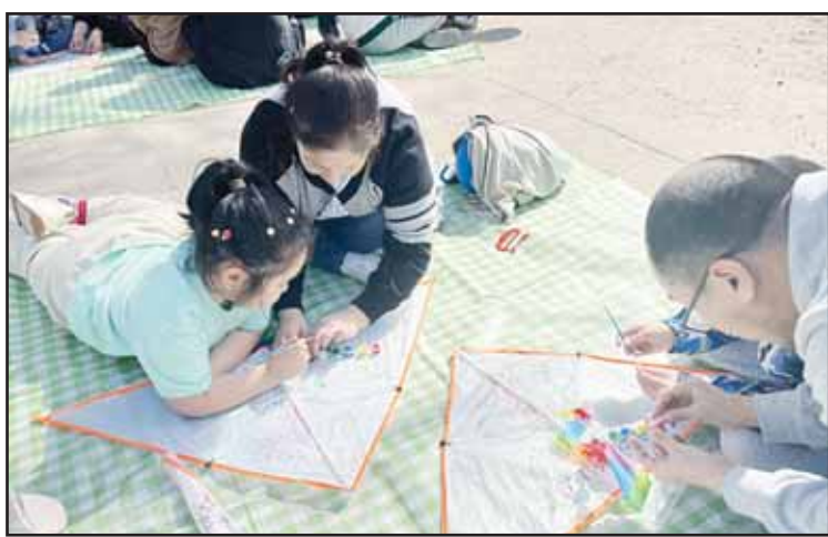
This photo taken with a mobile phone shows autistic children attending an outdoor activity at the Little Turtle children's services center in Shenyang, northeast China's Liaoning Province, April 18, 2024.

"People with autism often experience isolation, stigma and inequality. They have been denied healthcare and education - especially during crises - and their legal capacity has been unrecognized and over-ridden," the