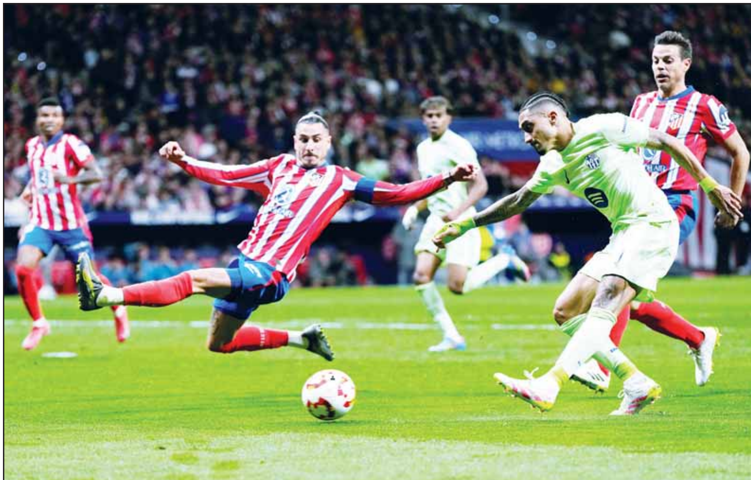
Atletico Madrid's Jose Gimenez blocks Barcelona's Raphinha during the Spanish Copa del Rey semifinal second leg soccer match between Atletico Madrid and Barcelona in Madrid, Spain.

However, despite Atletico's efforts, the Barcelona defense, well-organized by Inigo Martinez and Ronald Araujo, prevented goalkeeper Wojciech Szczesny from being forced into a difficult save.