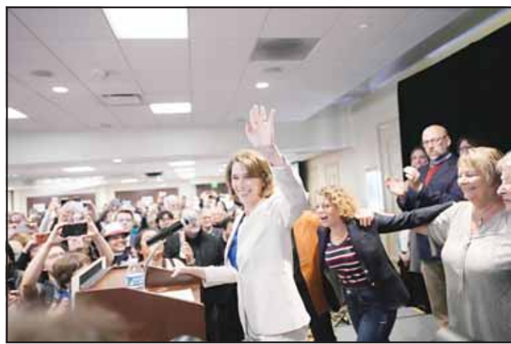
Wisconsin Supreme Court candidate Susan Crawford speaks during her election night party after winning the election on April 1, in Madison, Wis.

Rep. Mark Pocan, D-Wis., predicted further political consequences for Republicans if they don't resist the