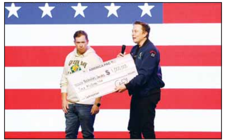
Elon Musk presents a check for $1 million during a town hall on March 30, in Green Bay, Wis.

Now there are signs that it already is winding down. DOGE employees have been shifted to various federal agencies, which are supposed to take the lead on cutting costs. Government-wide layoffs are underway to accom-