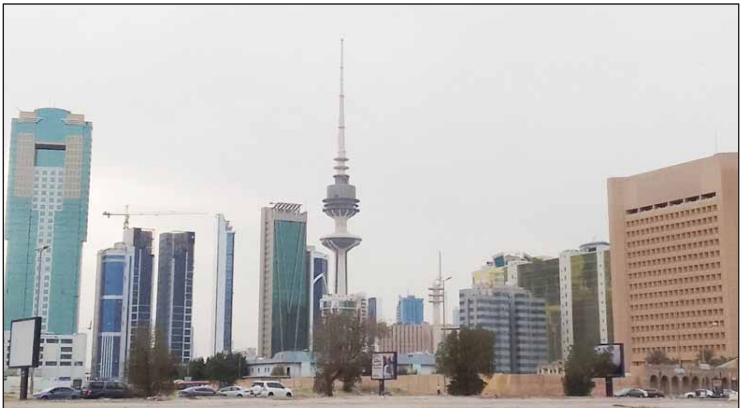
The Kuwait City skyline is shrouded in a thick overcast sky on Thursday, casting a gloomy atmosphere over the bustling metropolis.