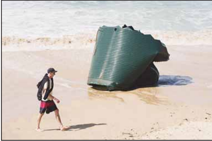
A man walks past a water tank washed onto Sydney's Bondi Beach on April 2.

SYDNEY: An out-of-control bushfire burning in the suburbs of Perth, the capital city of Australia's state of Western Australia (WA), has prompted an emergency evacuation warning.