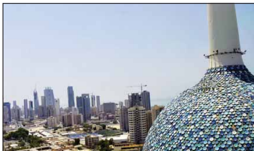
A view of high-rises in Kuwait City, looking over the shoulder of iconic Kuwait Towers.

The medical team and all the staff at Jaber Hospital expressed their pride and appreciation for this achievement, which serves as an exemplary model of medical integration and cooperation and represents a beacon of hope for the patient and her family.