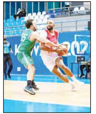
Al-Arabi player tackles Kuwait Club player during the league game.

KUWAIT CITY, April 3: Kuwait Club triumphed over Al-Arabi with a dominant 104-61 victory in a at the Basketball Association Hall in Sheikh Saad Al-Abdullah Complex. This win lifted the Whites to 27 points, securing the top spot in the standings, while Al-Arabi remained at 18 points. In another match, Al-Qadisiya defeated Al-Nasr 120-79. As per the tournament rules, the top four teams will advance to the semi-finals, where they will compete for the championship title. The first-place team will face the fourth-place team in a best-of-three playoff, while the second and third-place teams will battle it out in a similar format.