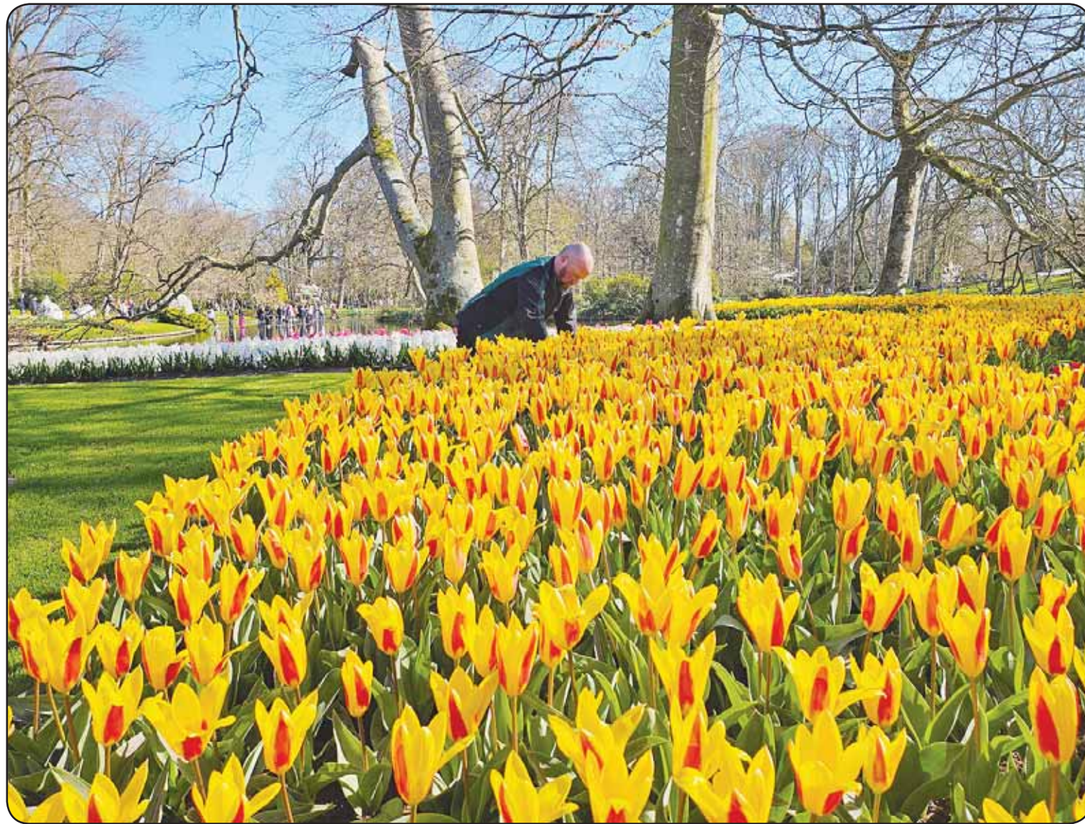
An employee plants tulips at the Keukenhof flower garden in Lisse, Netherlands, Tuesday, April 1.