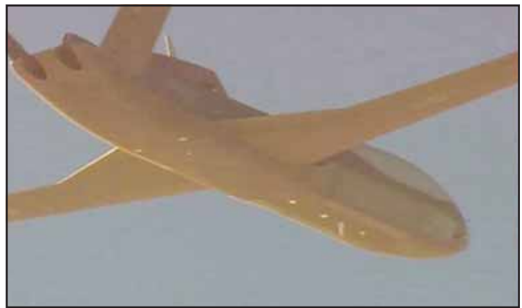
This photograph released by Taiwan Ministry of National Defense taken from a Taiwan Air Force P-3C Orion anti-submarine aircraft, shows a Chinese Cloud Shadow WZ-10 drone near Taiwan on March 17.

Manila and Washington have deepened defense cooperation since Philippine President Ferdinand Marcos Jr. took office in 2022.