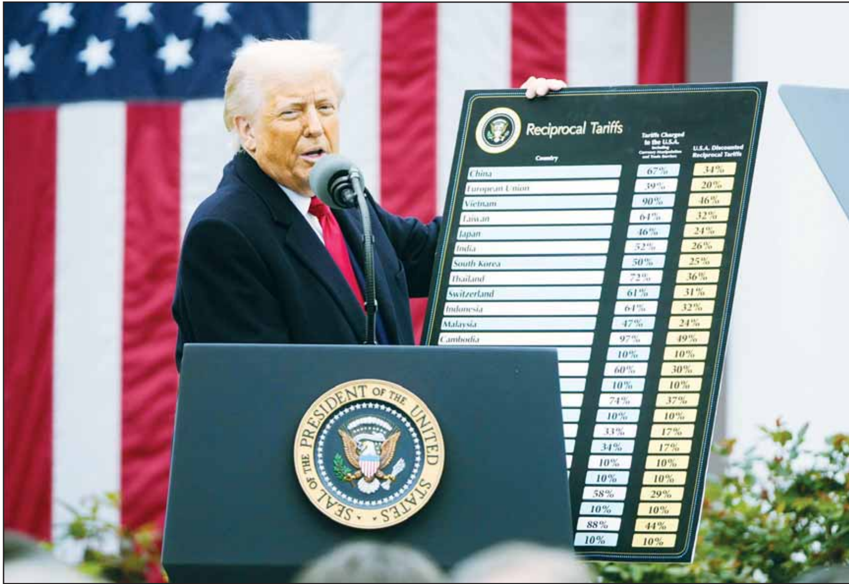
US President Donald Trump speaks during an event to announce new tariffs in the Rose Garden at the White House, April 2, 2025, in Washington. — See Pages 9 & 10