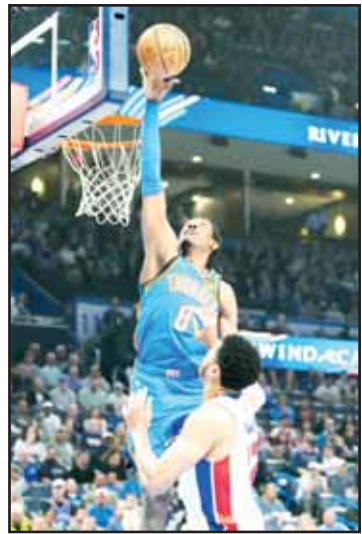
Oklahoma City Thunder forward Jalen Williams, left, blocks a shot by Detroit Pistons forward Tobias Harris, right, during the first half of an NBA basketball game in Oklahoma City.

Jaylen Brown had 24 points and nine rebounds for the Celtics, who had their season-best nine-game win streak snapped. Jayson Tatum and Derrick White both added 16 points apiece.