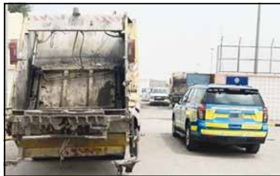
Police seize garbage truck flagged for impoundment.

The complainant then provided the defendant's details, including his phone number and a copy of his civil ID. Detectives attempted to contact the defendant, but he did not answer and eventually turned off his mobile phone.