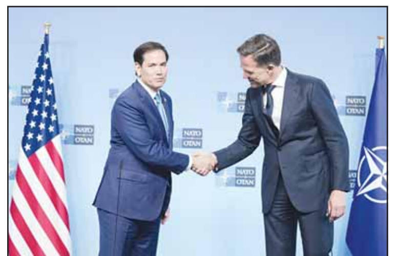
US Secretary of State Marco Rubio, (left), and NATO Secretary General Mark Rutte shake hands after their statements ahead of a NATO foreign ministers meeting at NATO headquarters in Brussels on April 3.

"We want NATO to be stronger, we want NATO to be more visible and