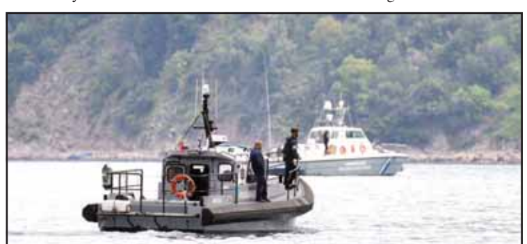
Frontex, (foreground), and Greek coast guard vessels take part in a search and rescue operation, after the capsizing of a boat carrying migrants, off the coast on the northeastern Aegean Sea island of Lesbos, Greece on April 3.

authorities reported what appeared to be a separate sinking in the same area, with nine people dead.