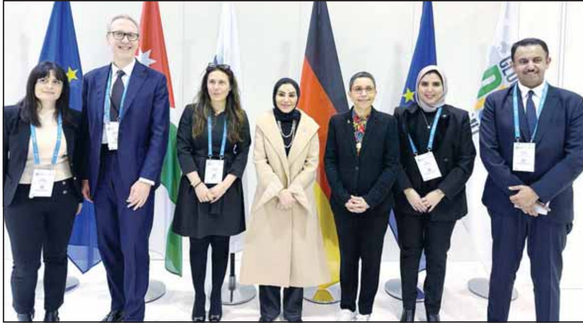
Kuwait's Minister of Social Affairs, Family and Childhood Affairs Dr. Amthal Al-Huwailah and her delegation meet Italian Minister of Disabilities Alessandra Locatelli on the fringes of the third Global Disability Summit (GDS) in Berlin.