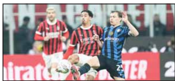
AC Milan's Tijani Reijnders, left, and Inter Milan's Nicolo Barella fight for the ball during an Italian Cup semifinal first leg soccer match between AC Milan and Inter Milan at the San Siro stadium, in Milan, Italy. The match ended 1-1. — See Page 15