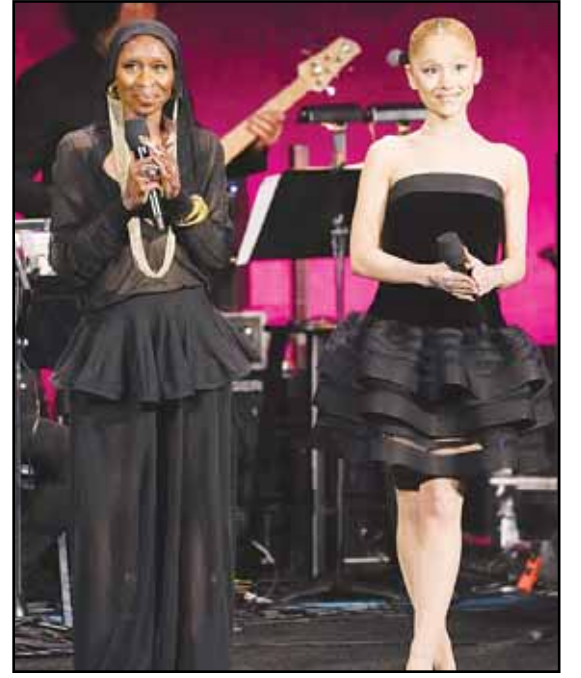
Cynthia Erivo, (left), and Ariana Grande, cast members of the upcoming film 'Wicked: For Good,' appear onstage during the Universal Pictures and Focus Features presentation at CinemaCon on Wednesday, April 2, at Caesars Palace in Las Vegas.

To top off the Blumhouse Productions slate, 30 actors dressed as M3GAN, the artificially intelligent and sometimes hyper-violent subject of the film of the same name, danced to a rendition of "Oops!...I Did It Again." "M3GAN 2.0" hits theaters in June.