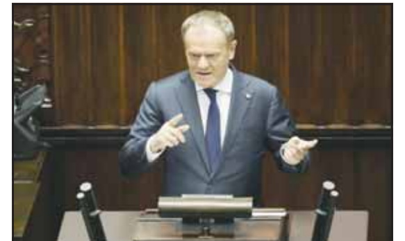
Polish Prime Minister Donald Tusk speaks at the Sejm, the lower house of parliament, in Warsaw, Poland on March 7.

Frederiksen announced plans for her visit after US Vice President JD Vance visited a US air base in Greenland last week and accused Denmark of underinvesting in the territory.