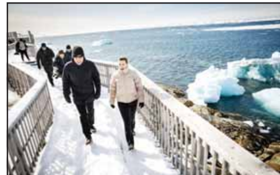
Denmark's PM Mette Frederiksen walks with Greenland's acting PM, Múte B. Eggede, during a three-day visit in the streets of Nuuk, Greenland, on April 2.

NATO will be stronger and more effective than ever before, and I believe that a robust NATO can continue to serve as a bedrock of peace and prosperity." But he added: "NATO's vitality rests on every ally doing their fair share."