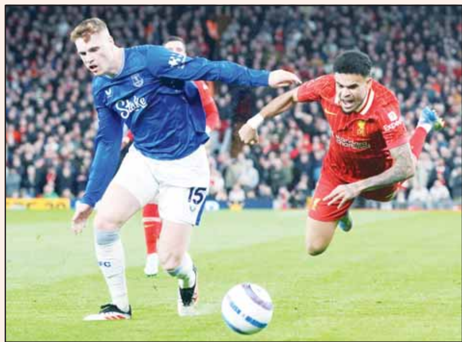
Everton's Jake O'Brien, left, and Liverpool's Luis Diaz battle for the ball during the English Premier League soccer match between Liverpool and Everton at Anfield in Liverpool.

LONDON, April 3, (Xinhua): Diogo Jota scored a 57th-minute goal to see Liverpool win the Merseyside derby 1-0 against Everton and retain a 12-point lead in the Premier League.