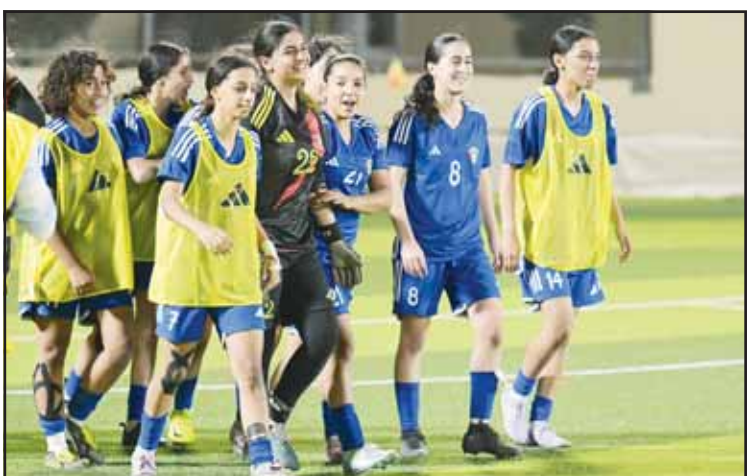
Kuwaiti players leave the pitch after their match.

AMMAN, April 12: The Kuwaiti youth women's national team secured fourth place in the fifth West Asia Championship, held in Aqaba, Jordan, after suffering a 7-1 defeat to Syria in the third-place play-off.