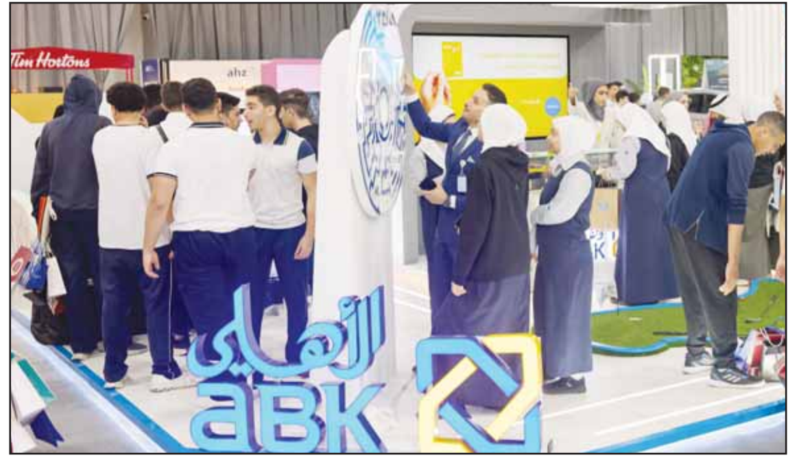
Great turnout at the bank's pavilion.

Marafi: We continue to invest in educational and youth initiatives as part of our strategy to develop the future leaders of Kuwait