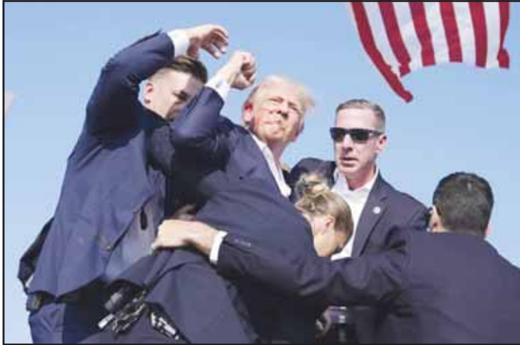
US Republican presidential candidate former President Donald Trump is surrounded by US Secret Service agents at a campaign rally, July 13, 2014, in Butler, Pa.