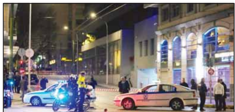
Policemen close the road after a suspected bomb explosion outside of the Hellenic Train offices the company that runs Greece's railway, (the second building on the right), in Athens, Greece on April 11. (AP)

ATHENS, Greece, April 12, (AP): A bomb planted near the offices of Hellenic Train, Greece's main railway company, exploded Friday night in a busy district of central Athens, authorities said. There were no reports of injuries. The explosion comes amid widespread public anger over a 2023 railway disaster, Greece's worst, in which 57 people were killed and dozens more injured when a freight train and a passenger train heading in opposite directions were accidentally put on the same track. Local media said a newspaper and a news website had received an anonymous call shortly before Friday's blast, with the caller warning that a bomb had been planted outside the railway company offices and would explode within about 40 minutes. In a statement, Hellenic Train said the explosion had occurred "very close