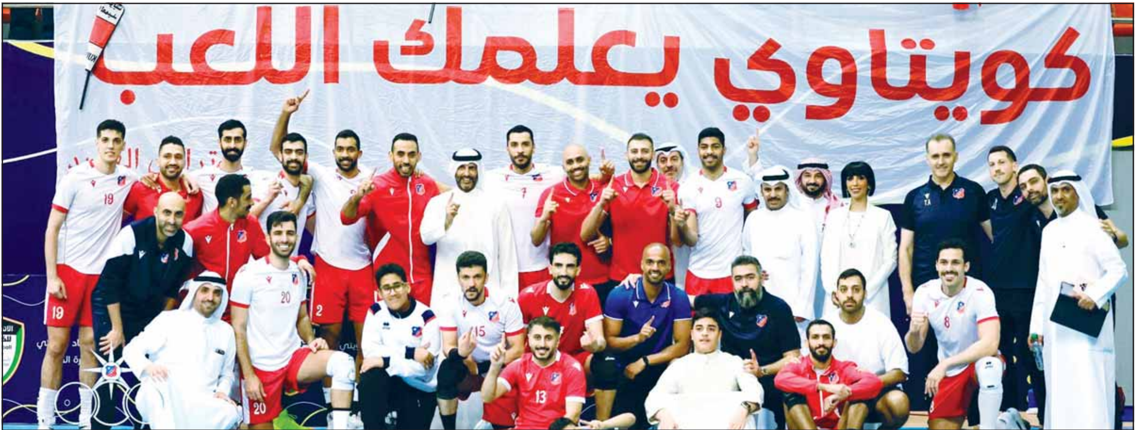
The victorious Kuwait Club players with officials.