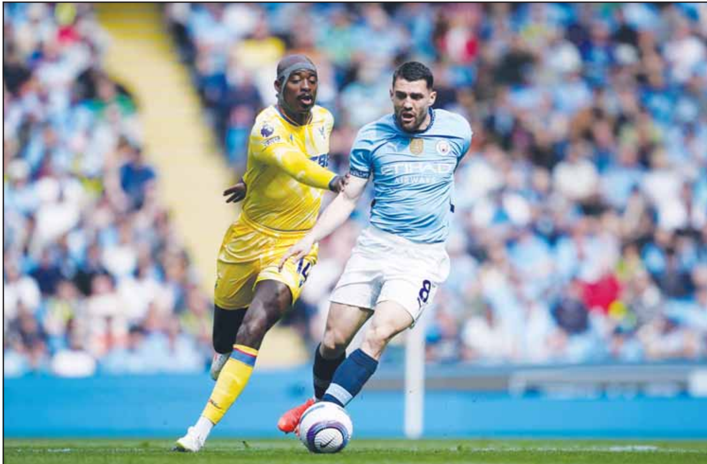
Crystal Palace's Jean-Philippe Mateta, left, challenges Manchester City's Mateo Kovacic during the English Premier League soccer match between Manchester City and Crystal Palace at the Etihad stadium in Manchester, England.