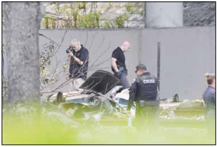
Emergency personnel respond to the area where a small plane crashed on the railroad tracks beneath the overpass near Interstate 95 in Boca Raton, Fla, on April 11.