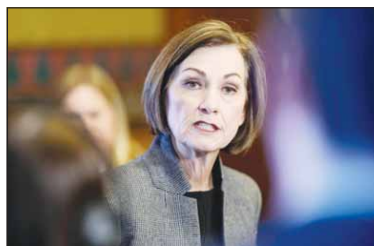
Iowa Gov Kim Reynolds speaks during a news conference at the Statehouse in Des Moines, Iowa, Jan 31, 2024.