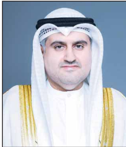
Minister of Justice Nasser Al-Sumait

His Highness clearly ordered the enactment of legislation to develop judicial work and regulations to facilitate its procedures, to expedite