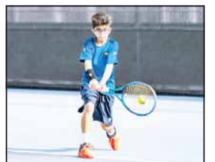
One of the stars of the Kuwaiti team.

Al-Gharib also highlighted the strong preparation of the Kuwaiti national team for the tournament, emphasizing collaboration with the Rafa Nadal Academy,