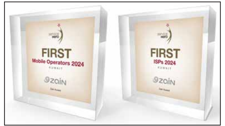
The company secured the highest number of consumer votes in both categories.

KUWAIT CITY, April 12: In an achievement that reflects its continued leadership in the technology sector in the Kuwaiti market, Zain has once again claimed the top position at the Service Hero Customer Satisfaction Index Awards for the 13th time. The company was awarded first place in both the Mobile Operators and Internet Service Providers categories for the year 2024. The announcement was made during the awards ceremony honoring the top-ranked organizations held at the Four Seasons Hotel, attended by