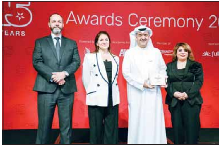
Zain honored with its second award.