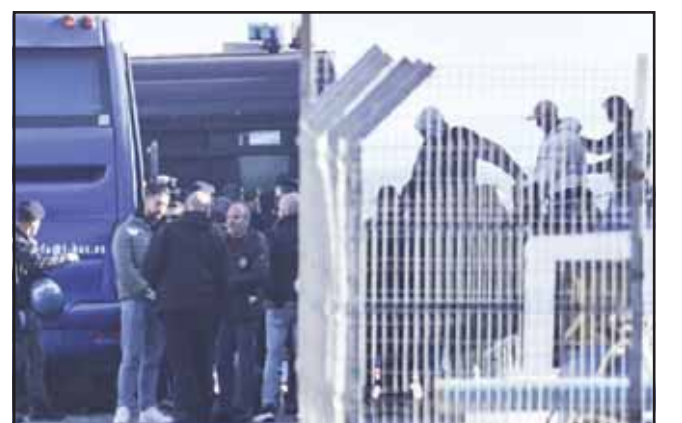
A migrant escorted by police officers disembarks the Italian navy ship Libra as Italian authorities transfer 40 migrants with no permission to remain in the country to Italian-run migration detention centers in Albania, in Shengjin, northwestern Albania on April 11. (AP)

SHENGJIN, Albania, April 12, (AP): Italian authorities on Friday transferred 40 migrants with no permission to remain in the country to Italian-run migration detention centers in Albania. It was the first time a European Union country sent rejected migrants to a nation outside the EU that is neither their own nor a country they had transited on their journey, migration experts said. A military ship with the migrants departed the Italian port of Brindisi and arrived hours later in the Albanian port of Shengjin, about 65 kilometers (40 miles) northeast of the capital, Tirana. The migrants were seen being transferred in buses and minivans under heavy security to an Italian-run center in Shengjin, where they will be processed before being transferred to a second center in Gjader, also run by Italian authorities. The Italian government has not released their nationalities or further details. Both facilities in Shengjin and in Gjader were originally built to process asylum requests of people intercepted in the Mediterranean Sea by Italy.