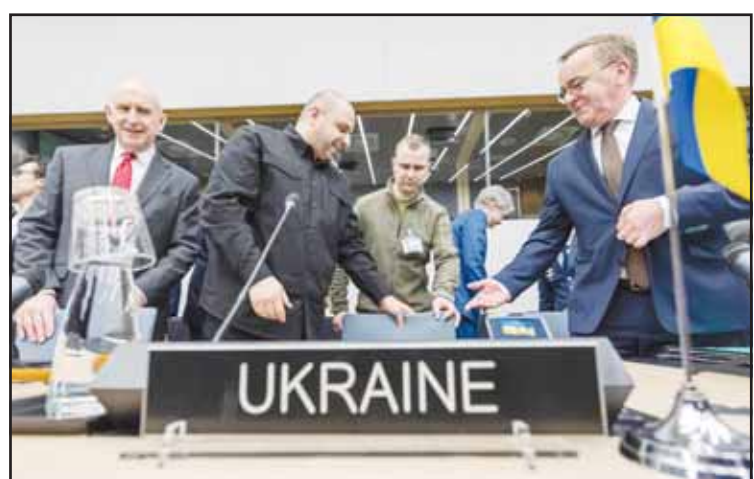
Britain's Defense Secretary John Healey, (left), Ukraine's Defense Minister Rustem Umerov, (second from left), and Germany's Defense Minister Boris Pistorius, (right), arrive for a meeting of the Ukraine Defence Contact Group at NATO headquarters in Brussels on April 11.

BRUSSELS, April 12, Britain on Friday announced a "surge" of military support to Ukraine, as the war-ravaged country's Western backers gathered at NATO headquarters to drum up more weapons and ammunition to help Kyiv fight off Russia's invasion. Britain said that in a joint effort with Norway just over $580 million would be spent to provide hundreds of thousands of military drones, radar systems and anti-tank mines, as well as repair and maintenance contracts to keep Ukrainian armored vehicles on the battlefield. On the eve of the meeting in Brussels, Ukrainian Defense Minister Rustem Umerov said a key issue was strengthening his country's air defenses. "Ukraine needs a sufficient number of modern systems like Patriot" missile systems, he said in a post on social media. "A political decision is needed to supply these systems to protect our cities, towns, and the lives of our people - especially from the threat of Russian ballistic weapons. Our partners have such available systems," Umerov said. President Volodymyr Zelenskyy has renewed his appeals for more Patriot