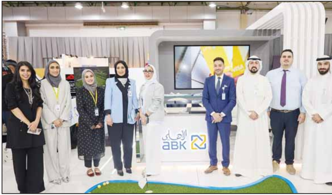
Medium-sized cognitive bank team at the exhibition.