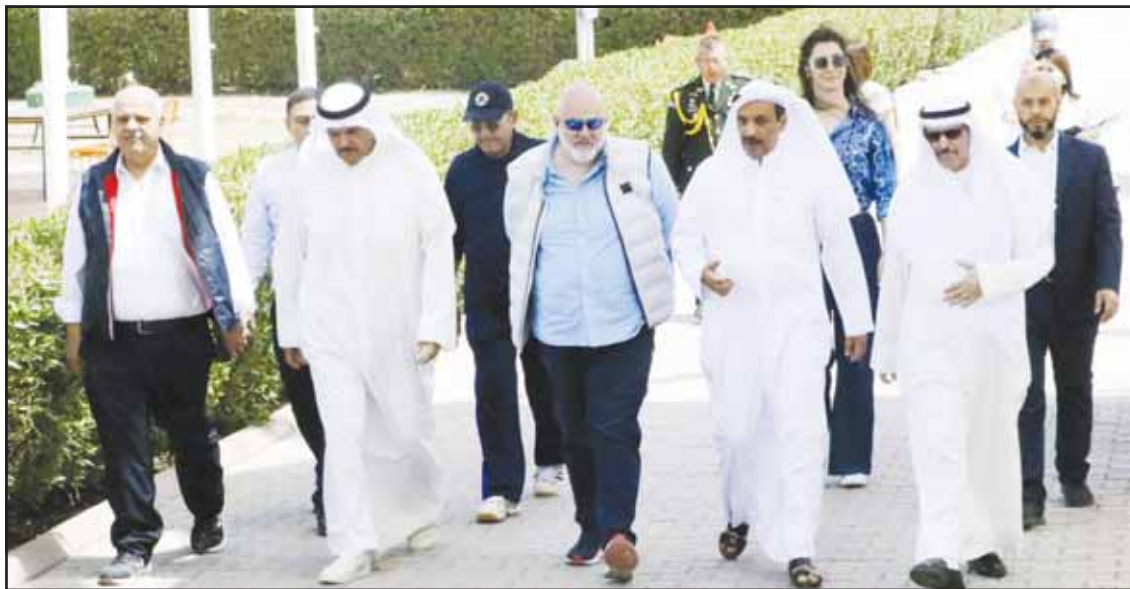
Officials of the Amir International Shooting Championship.