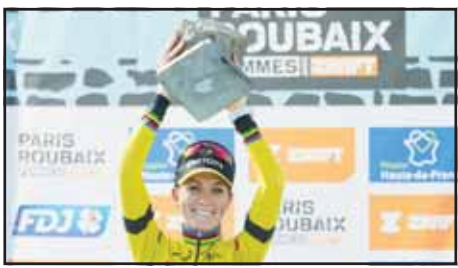
Pauline Ferrand-Prévot, of France, lifts the cobbles trophy after winning the Paris-Roubaix cycling race in Roubaix, France.