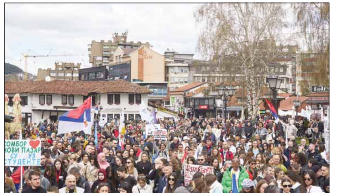
People attend an anti-corruption protest in the southwestern town of Novi Pazar, Serbia on April 12.

systems since 20 people were killed a week ago, including nine children, when a Russian missile tore through apartment buildings and blasted a playground in his home town. "Ukraine needs at the very least 10 systems that are sufficiently effective specifically against Russian ballistic missiles, and this is where Patriots are second to none," he said on his Telegram channel ahead of the meeting. "We are counting on decisions."