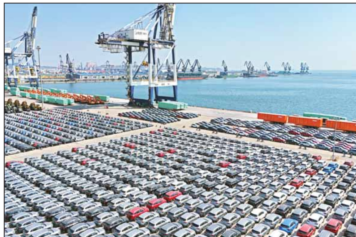
An aerial view of new cars waiting for shipment at a pier for ro-ro ships in Yantai city in eastern China's Shandong province, Sunday, March 30, 2025.

Trump's on-again, off-again measures have caused alarm in stock and