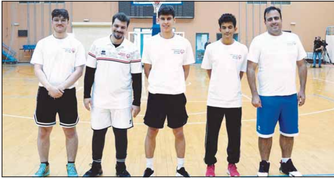
Stars of the Second Forum.