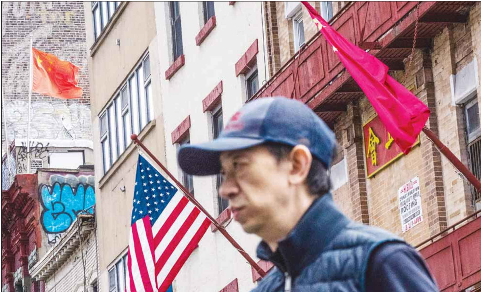
The U.S. and China national flags wave as a person passes by in the Chinatown area in New York, Tuesday, April 8, 2025.

China holds stronger cards than Trump in trade war, could have the upper hand