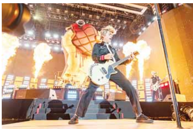
Billie Joe Armstrong of Green Day performs.