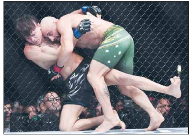
Diego Lopes, left, and Alexander Volkanovski, right, battle during a mixed martial arts fight at UFC 314 in Miami.

In stepped Lopes, the third-ranked challenger, to take on Volkanovski.