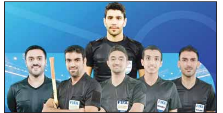
The Kuwaiti officials.

Lion City enters the decisive fixture with a 2-0 advantage from the first leg.