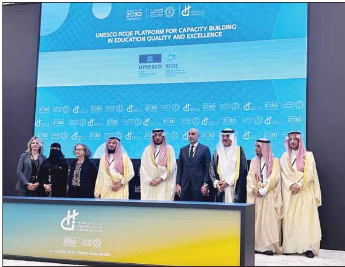
Kuwaiti Minister of Education, Engineer Jalal Al-Tabtabaei, along with more than 300 participants.

The conference features more than 100 dialogue sessions spread across four main platforms, aiming to exchange expertise and discuss prominent practices that contribute to enhancing human capability readiness in response to the world's rapid