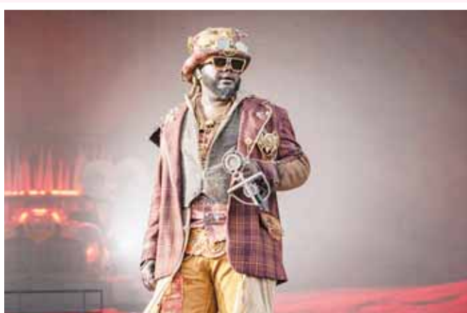
T-Pain performs during the first weekend of the Coachella festival.