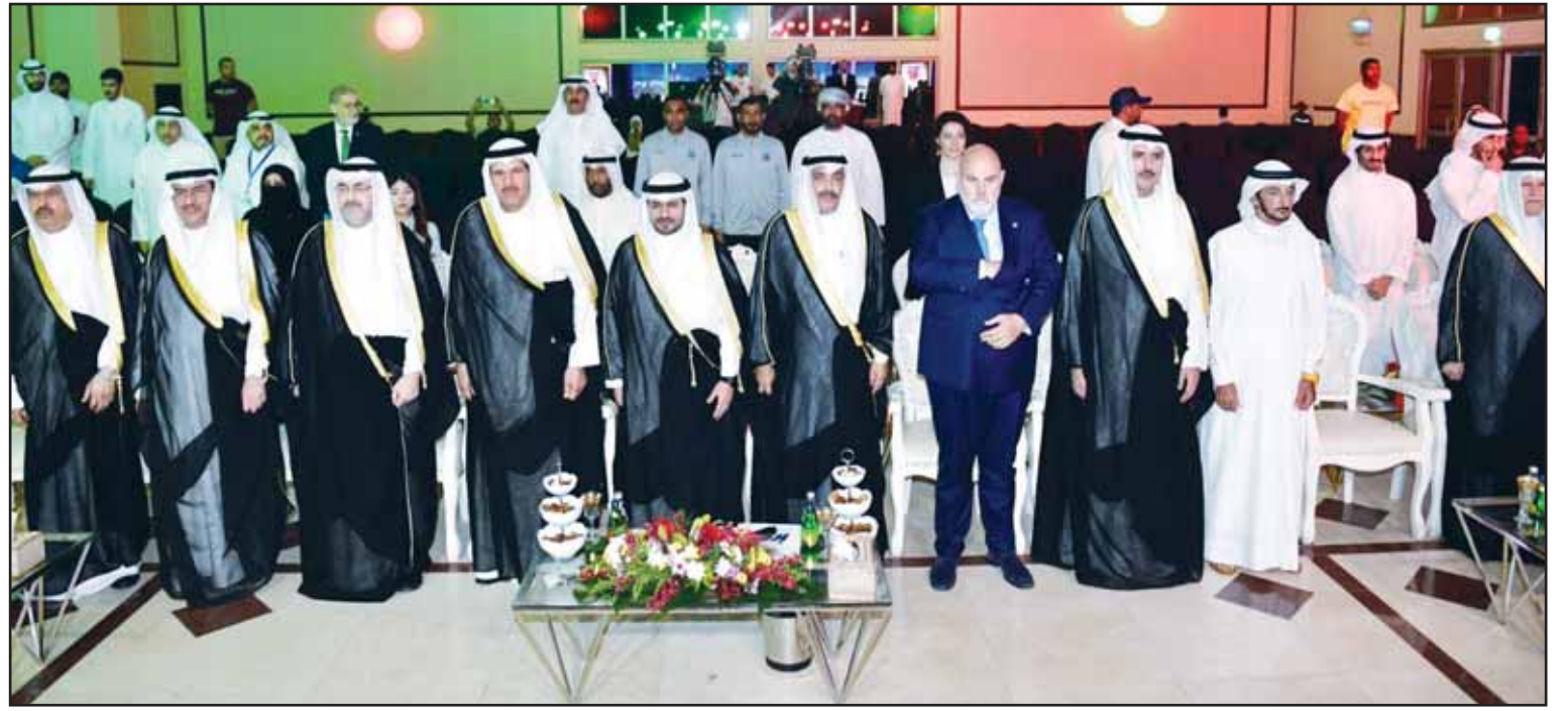
Mubarak Al-Kabeer Governor Sheikh Sabah Badr Sabah Al-Salem Al-Sabah with other dignitaries during the opening ceremony of the Amir's International Shooting Championship.