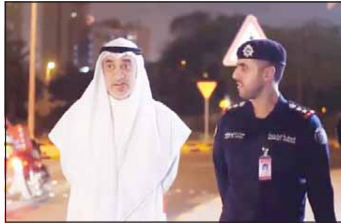
Acting Prime Minister Sheikh Fahad Al-Yousef supervises the security campaign.