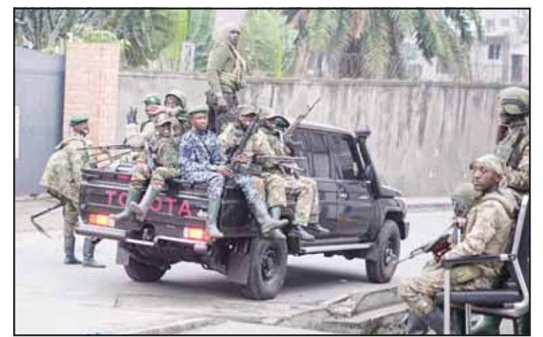
M23 rebels patrol the streets of Goma, Democratic Republic of the Congo on Jan 29.

The decades-long conflict between Congo and the M23 rebels escalated in January, when the rebels made an unprecedented advance and seized the strategic eastern Congolese city of Goma, followed by the town of Bukavu in February. The latest fighting has killed some 3,000 people and worsened what was already one of the world's largest humanitarian crises, with around 7 million people dis-