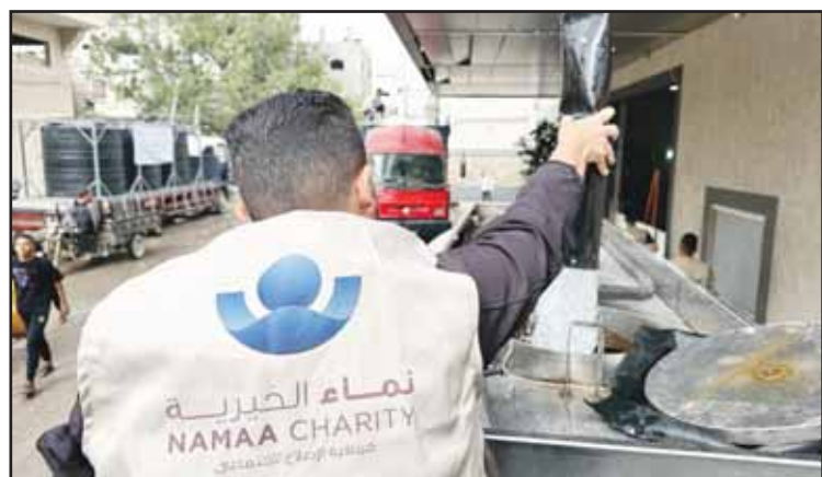
Distribution of water to disaster-stricken Gazan families.