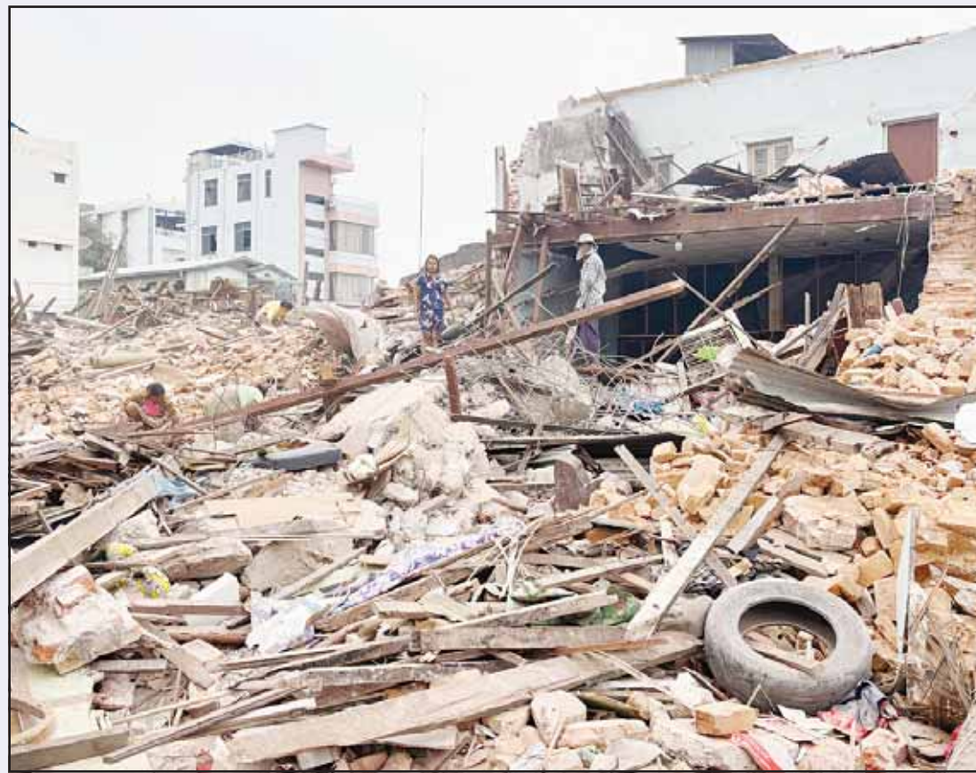
People clean debris from damaged buildings in the aftermath of an earthquake on March 28, in Naypyitaw, Myanmar on April 7.

The death toll from the 7.7 magnitude quake and aftershocks reached 3,689, with 5,020 injured, Maj. Gen. Zaw Min Tun, a spokesperson for the military government, said Friday.