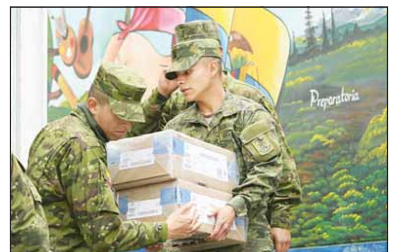
Army soldiers unload electoral kits at a polling station in preparation for Sunday's presidential runoff election in Quito, Ecuador on April 12.

Voters chose Noboa over González in the runoff of a snap election in October 2023. The candidates advanced to Sunday's contest after being the top vote-getters in February's first-round election. Voters are primarily worried about the violence that transformed the country, starting in 2021 - a spike in