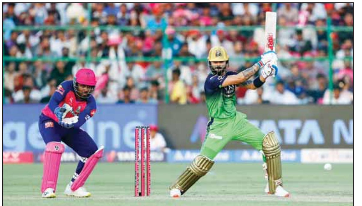
Royal Challengers Bengaluru's Virat Kohli plays a shot during the Indian Premier League cricket match between Rajasthan Royals and Royal Challengers Bengaluru at Sawai Mansingh Stadium in Jaipur, India.