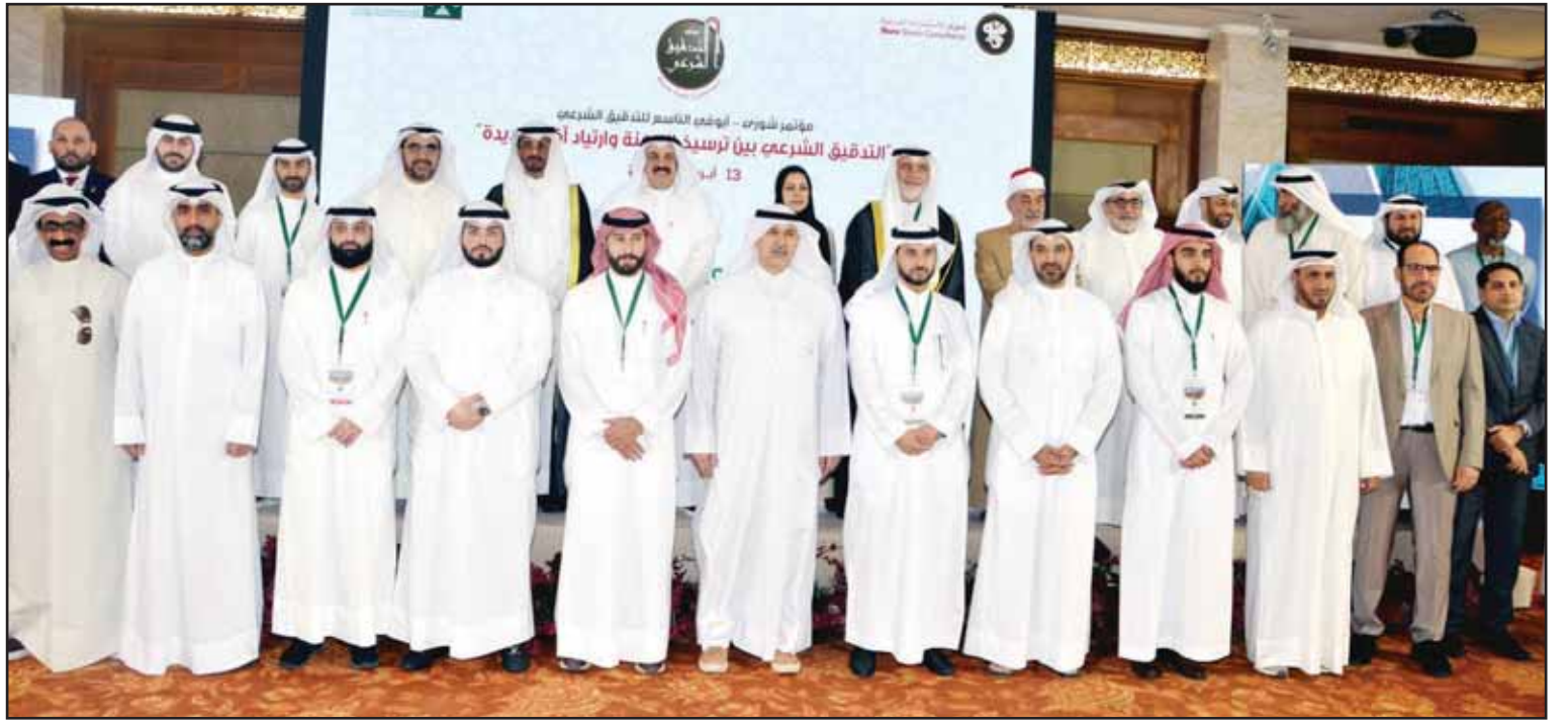
Group photo during the AAOIFI 9th Sharia Audit Conference.