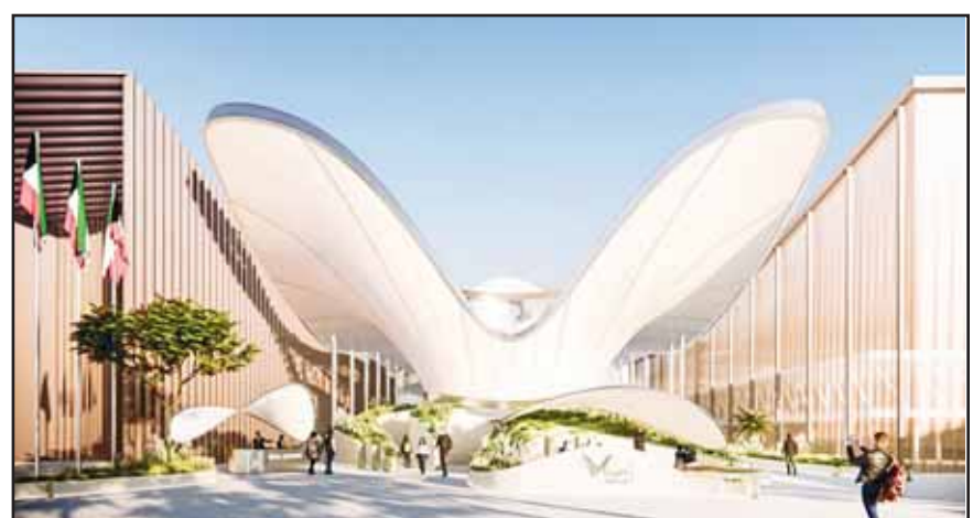
Kuwait's 'Visionary Lighthouse' pavilion at Expo 2025 Osaka.