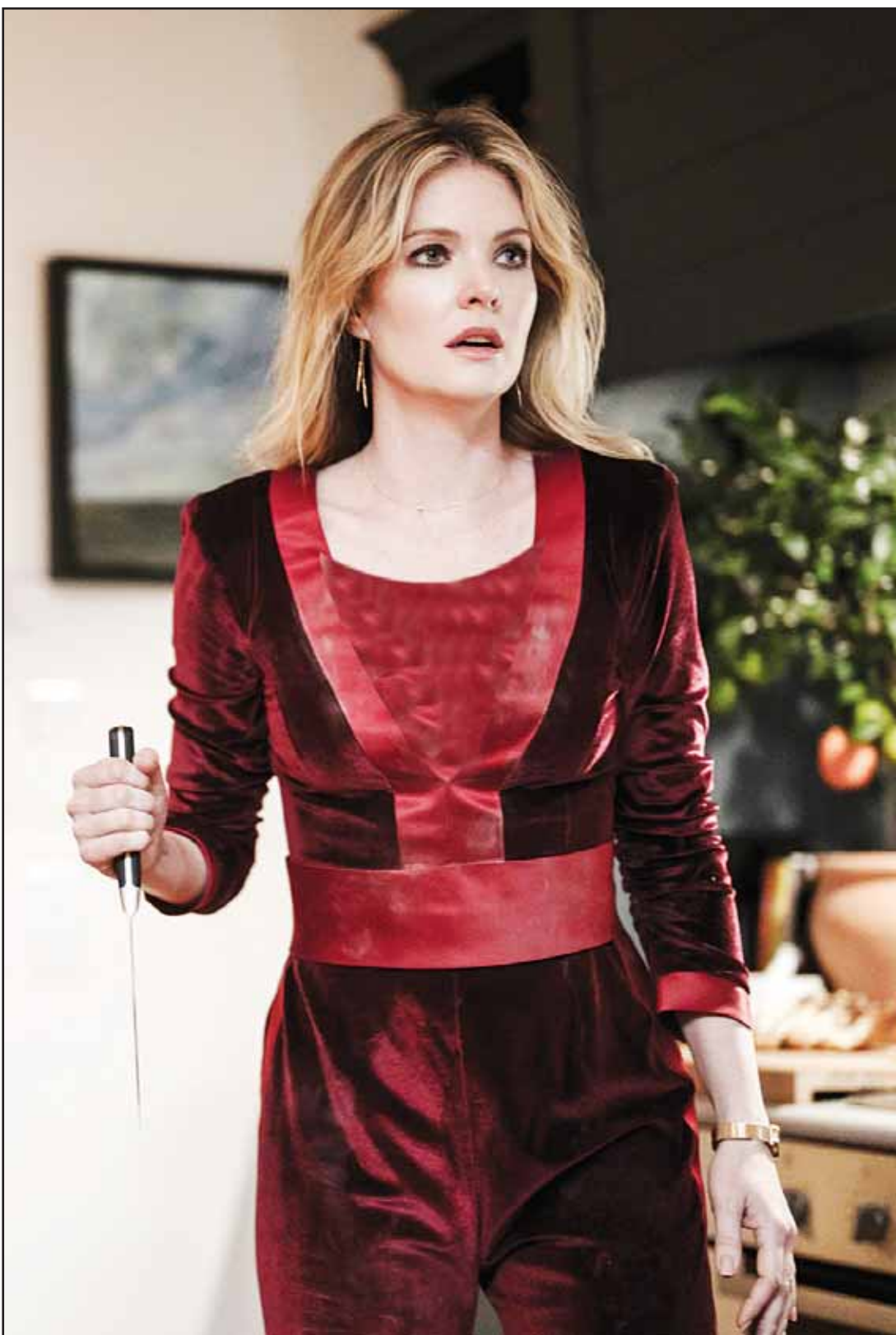
This image released by Universal Pictures shows Meghann Fahy in a scene from 'Drop.'