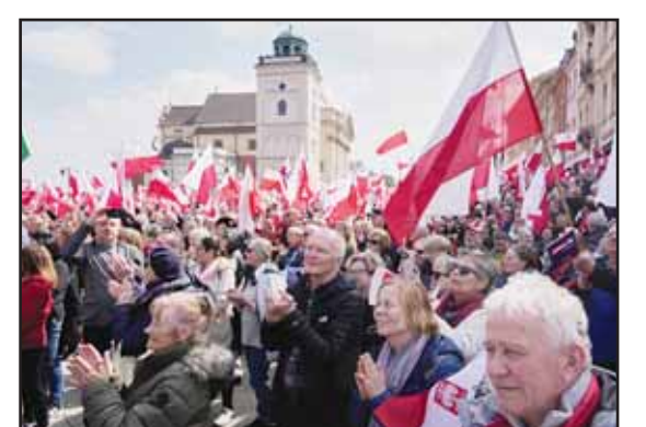
Poles take party in a patriotic demonstration celebrating 1,000 years since the coronation of the first Polish king on April 12, in Warsaw, Poland.

There were a few US flags amid a sea of Polish flags, and