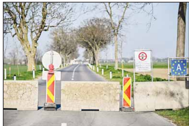
Cement blocks and signs on a road show the closer of a border crossing between Hungary and Austria to prevent spreading of foot-and-mouth disease, Rajka, Hungary, Saturday, April 5.