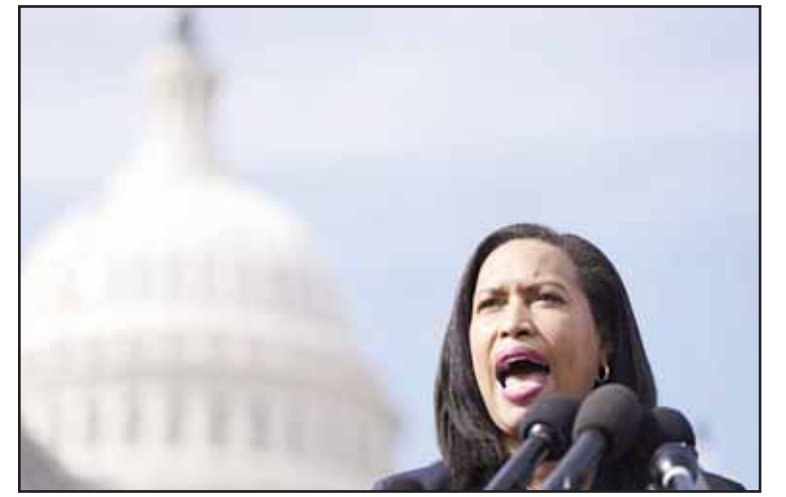
District of Columbia Mayor Muriel Bowser speaks at a news conference to address the impact of the proposed continuing resolution, on Capitol Hill in Washington on March 10.

Bowser also reposted Trump's own social media posting from late March, where he called on House leadership to pass the budget measure and "get it done IMMEDIATELY."