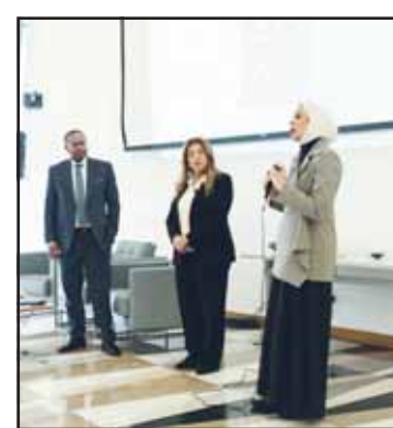
Representatives from the UIC.

This vision aims to cultivate a skilled national workforce capable of leading development by equipping them with modern knowledge and skills, especially in the investment and financial sectors, which form the backbone of the national economy.