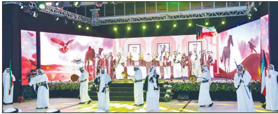
Dancers perform during the opening ceremony.