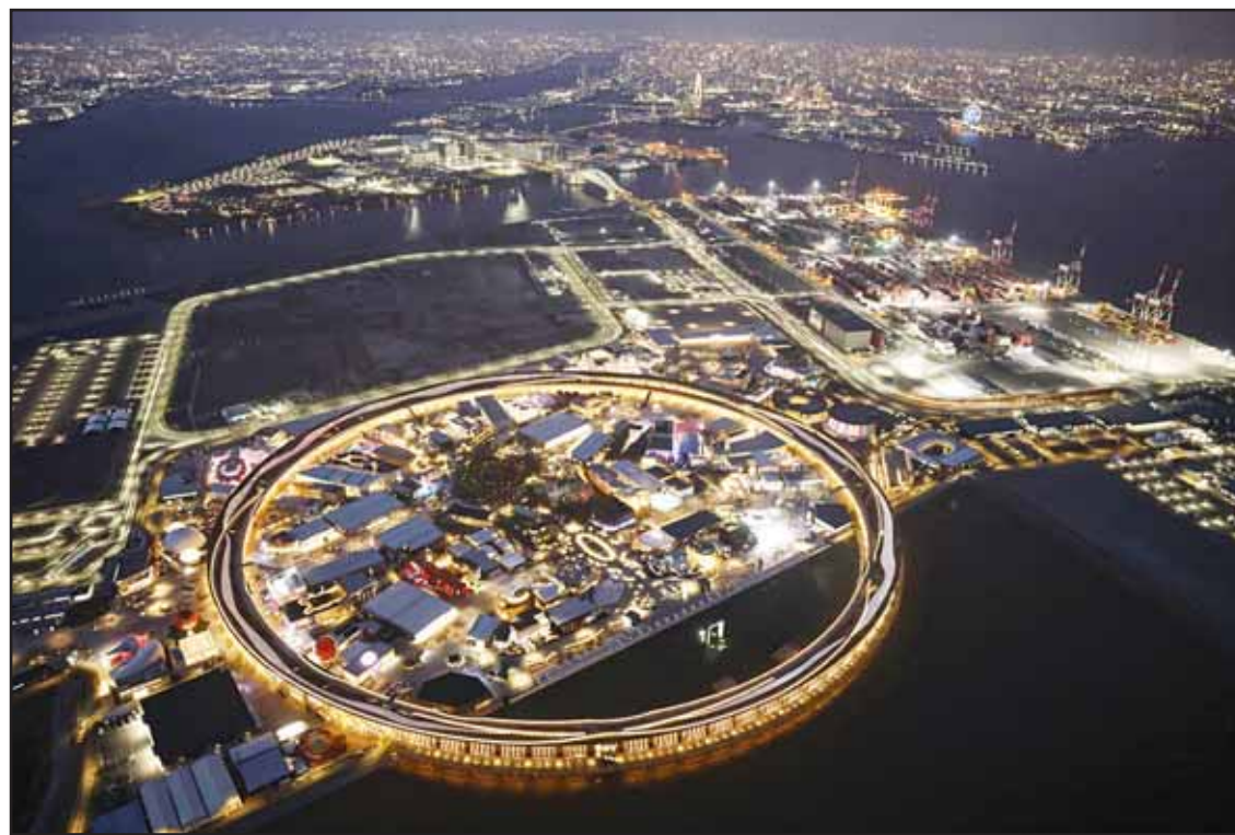
The Grand Ring is seen on Friday, April 11, 2025 prior to the opening day of Osaka Expo 2025 in Osaka, western Japan.