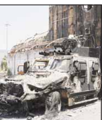
A burned military vehicle sits at Khartoum international airport a day after it was recaptured from the paramilitary Rapid Support Forces (RSF), in Khartoum, Sudan on March 27.

The Ministry extended its deepest condolences and sincere sympathies to the families of the victims, and wished a swift and full recovery to those injured. Sudan's notorious paramilitary group launched a two-day attack on famine-hit camps for displaced people that left more than 100 dead, includ-