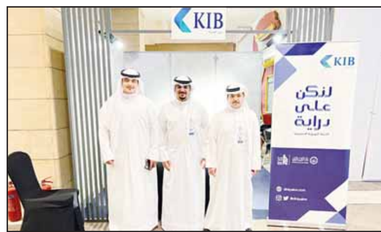
KIB representatives at FunFest.