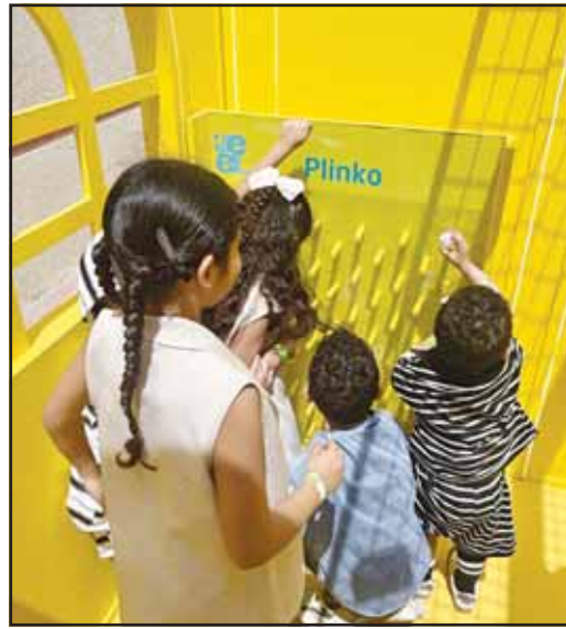
American Baccalaureate School's annual charity carnival.