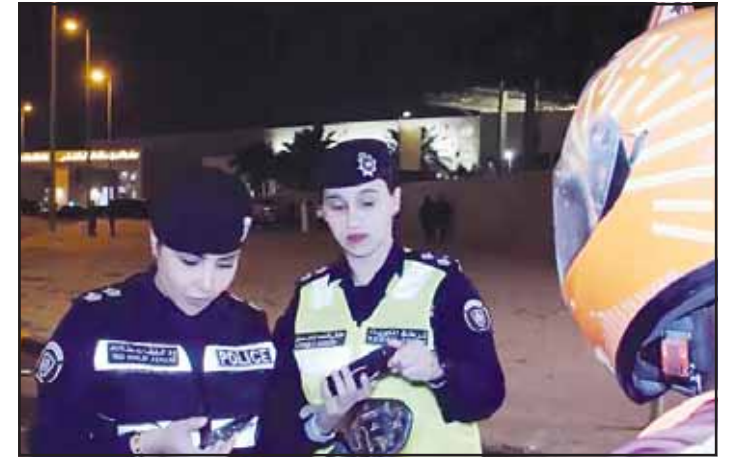
Part of the security campaign.