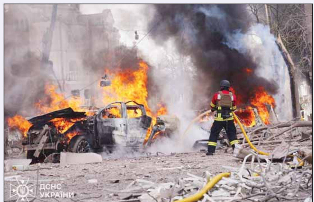
In this photo provided by the Ukrainian Emergency Service, firefighters put out the fire following Russia's missile attack that killed at least 32 civilians in Sumy, Ukraine, on April 13.