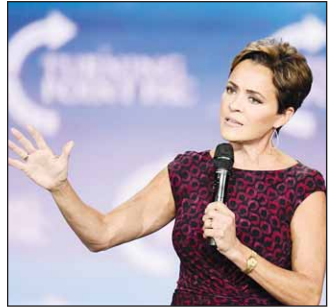
Kari Lake speaks to supporters at a campaign event, Sept. 4, 2024, in Mesa, Ariz.