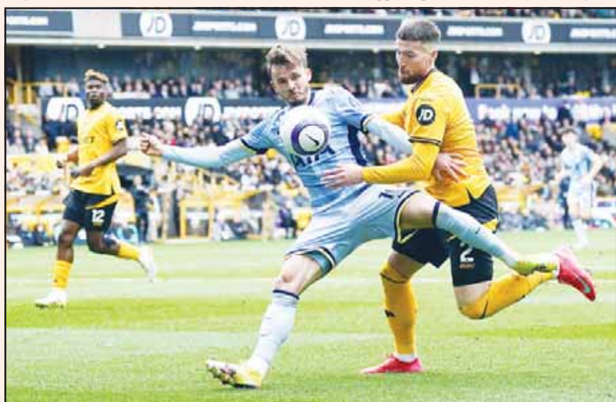
Tottenham Hotspur's James Maddison, left, and Wolverhampton Wanderers' Matt Doherty collide during the English Premier League soccer match between Wolverhampton and Tottenham Hotspur at Molineux Stadium in Wolverhampton, England.

Andre Onana was left out of Manchester United's squad for the game against Newcastle following his latest high-profile errors for the club.