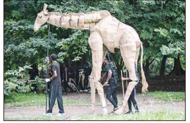
Puppeteers move cardboard animals through DRC's capital Kinshasa's botanical gardens Thursday, April 10, the first steps of 'The Herds', a moving theatre performance that will travel from the Democratic Republic of the Congo to the Arctic Circle in a bid to bring attention to the climate crisis.