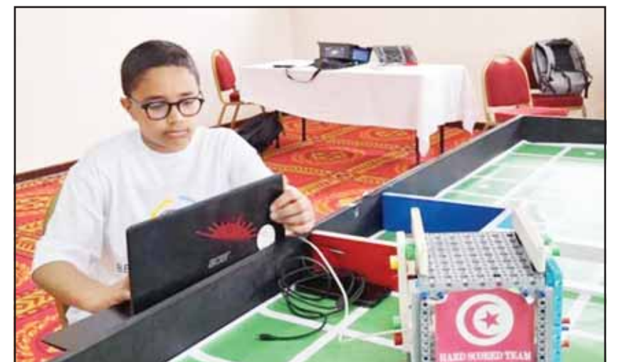
The Arab Robotics and Artificial Intelligence Championship kicks off in Tunisia with Kuwaiti participation.