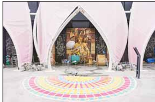
India's pavilion is seen incomplete to open for the opening day of the Expo 2025 in Osaka, central Japan, Sunday, April 13.