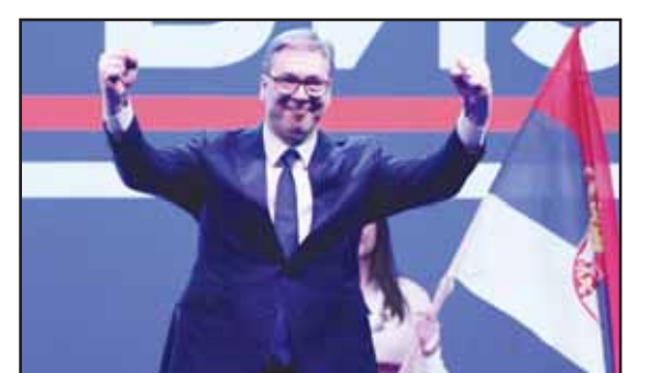
Serbia's President Aleksandar Vucic greets his supporters gathered during a huge rally in his support, apparently designed to counter student-led gatherings in Belgrade, Serbia on April 12.

The gathering in Belgrade was designed to counter the massive anti-corruption protests that have drawn hundreds of thousands of people in an unprecedented challenge to Vucic. In a highly divisive speech, the Serbian president accused the student-led protesters of "inflicting huge evil on Serbia in the past five months," and reiterated claims of a foreign-led plot to oust him from power.