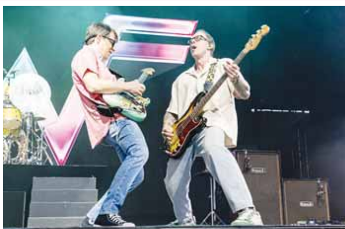
Rivers Cuomo, (left), and Scott Shriner of Weezer perform during the first weekend of the Coachella Valley Music and Arts Festival at the Empire Polo Club on Saturday, April 12 in Indio, Calif.

Defense lawyers also asked that jurors be asked to tell if they've watched shows on television titled: "The Fall of Diddy," "Diddy Do It?" "The Downfall of Diddy," and "Diddy: The Making of a Bad Boy."