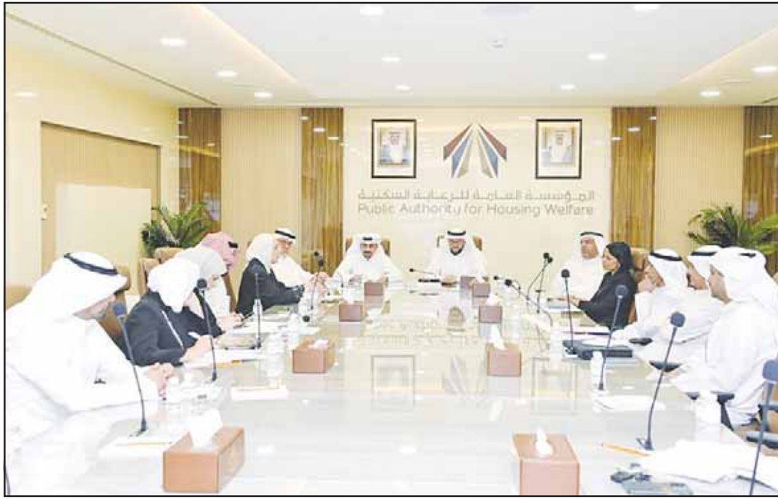
Representatives from Housing and Electricity sectors during the session.