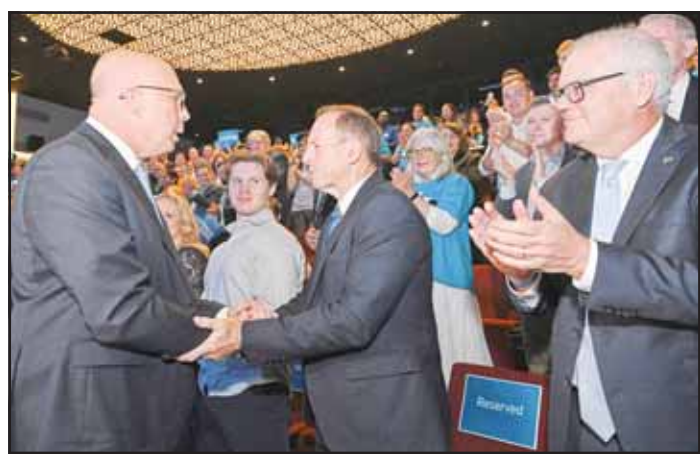
Australian Liberal Party and opposition leader Peter Dutton, (left), meets former prime ministers Tony Abbott and Scott Morrison, (right), at his party's coalition campaign launch ahead of the May 3 federal election in western Sydney, Australia on April 13.

The governing center-left Labor Party promised Sunday 10 billion Australian dollars ($6.3 billion) in grants and loans to build 100,000 new homes over eight years exclu-