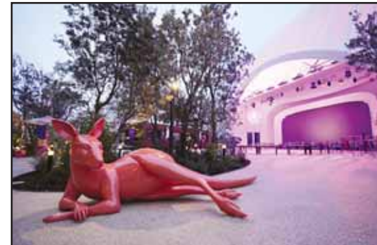
A kangaroo sculpture is seen at Australia's pavilion the day before the opening of the Expo 2025 in Osaka.