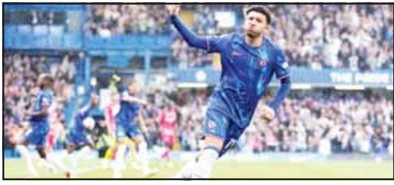
Chelsea's Jadon Sancho celebrates scoring their side's second goal of the game during the English Premier League soccer match between Chelsea and Ipswich Town at Stamford Bridge in London. (AP) — See Page 15