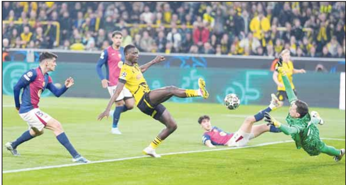
Barcelona's goalkeeper Wojciech Szczesny, right, blocks a shot by Dortmund's Serhou Guirassy, center, during the Champions League quarterfinals second leg soccer match between Borussia Dortmund and Barcelona, at the Signa-Iduna Park in Dortmund, Germany.

Dortmund had arguably lost the quarterfinal in the first leg, and in addition had captain Emre Can and midfielder Carney Chukwuemeka ruled out with injuries earlier in the day.