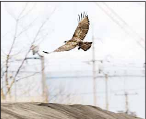
A bird flies within the premises of the Fukushima Daiichi nuclear power plant in Futaba town, north-eastern Japan on Feb 20.

concerns among UK officials. Wera Hobhouse, a member of the Liberal Democratic Party representing Bath, on Sunday wrote on the social media platform Bluesky that authorities gave her no explanation for what she described as a "cruel and upsetting blow." She noted that she was the first British MP to face such a situation upon arrival in the former British colony since it returned to Chinese rule in 1997. Hobhouse had told British media that she flew to Hong Kong to visit her newborn grandchild. She is also a member of the Inter-Parliamentary Alliance on China that has scrutinized Beijing's human rights record. The Hong Kong government, in a statement released late Monday, maintained that its immigration officers are duty-bound to question individuals to ascertain the purpose of any visit.