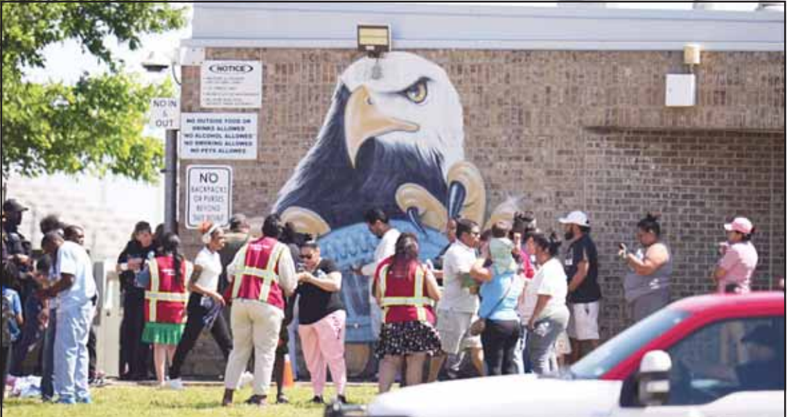
Parents are checked in to pick up their children at Wilmer-Hutchins High School, where police responded to reports of a shooting, in Dallas, Texas, on April 15. (AP)

A suspect in a shooting at a Dallas high school that wounded four students and drew a heavy police response to the campus has been taken into custody, school district officials announced Tuesday night. Three of the students were injured by gunfire and the fourth was injured in their lower body, according to the Dallas Fire-Rescue Department. The department said units were dispatched to Wilmer-Hutchins High School just after 1 pm and that the four students, all of whom are male, were taken to hospitals with injuries ranging from serious to not life-threatening. “Quite frankly, this is just becoming way too familiar. And it should not be familiar,” Stephanie Elizalde, superintendent of the Dallas Independent School District, said at a news conference. The school district said in a statement Tuesday night that a suspect was apprehended within hours of the shooting, but didn’t provide details about the person or say whether they had been arrested. Christina Smith, assistant police chief for the Dallas Independent School District, said at the earlier news conference that the investigation was fluid and she did not have any information on what led to the shooting. (AP)