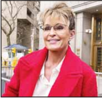
Former Alaska Gov. Sarah Palin leaves federal court Tuesday, April 15, in New York.

She said the correction was posted within 14 hours, and jurors will have to conclude that the newspaper's editors knew they were saying something false and said it anyway to reach a ver-