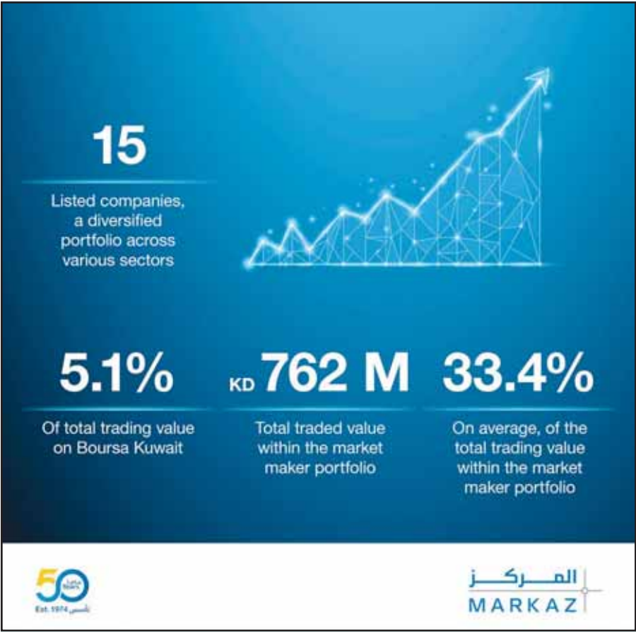
Markaz Market Maker Desk 2024