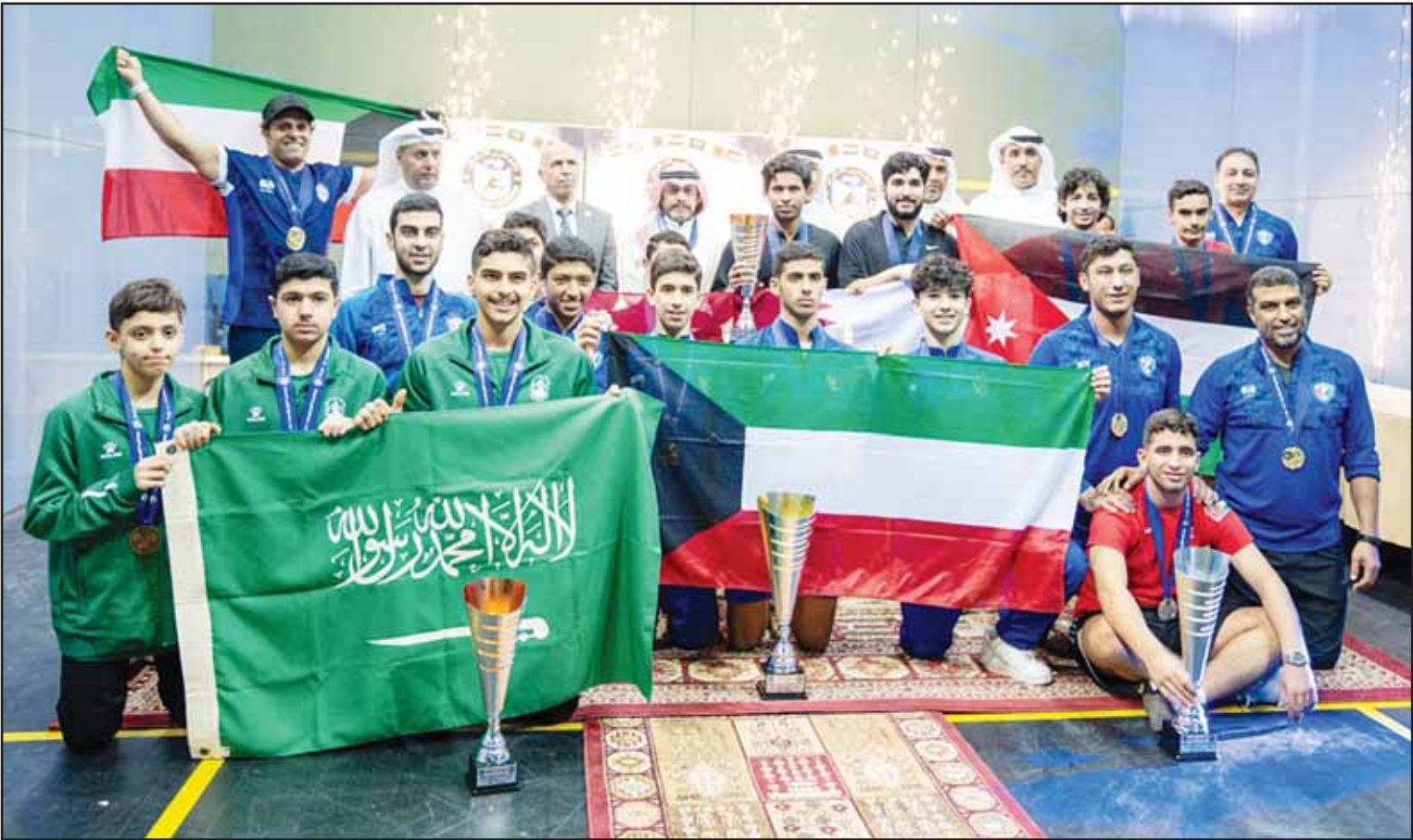
Players celebrate with their trophies after the closing ceremony.

He extended gratitude to the Public Authority for Sports for its unwavering support in hosting the championship and helping elevate Kuwait's status in regional squash.