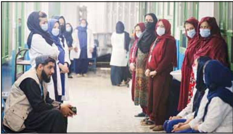
Staff members wait for their director at Action Against Hunger's therapeutic feeding unit in Kabul, Afghanistan on April 15.