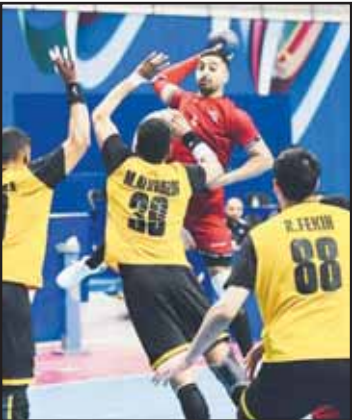
Qadsiya players defend during the first division game.

First Division table following its 30-24 win over Al-Fahaheel, coupled with Khaitan's 36-32 victory over previous leader Al-Nasr in the penultimate seventh round. This shift gave Al-Qadsiya 22 points, pushing Al-Nasr to second place with 20 points. Al-Qurain follows in third with 18 points, while the rest of the standings are: Al-Fahaheel (12), Khaitan (10), Al-Yarmouk (4), Al-Tadamon (3), and Al-Sahel at the bottom with no points.