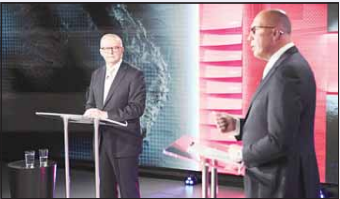
Australian Prime Minister Anthony Albanese looks at Opposition Leader Peter Dutton, right, during the second leaders' debate of the 2025 federal election campaign at the ABC Studios in Parramatta, Sydney on April 16.