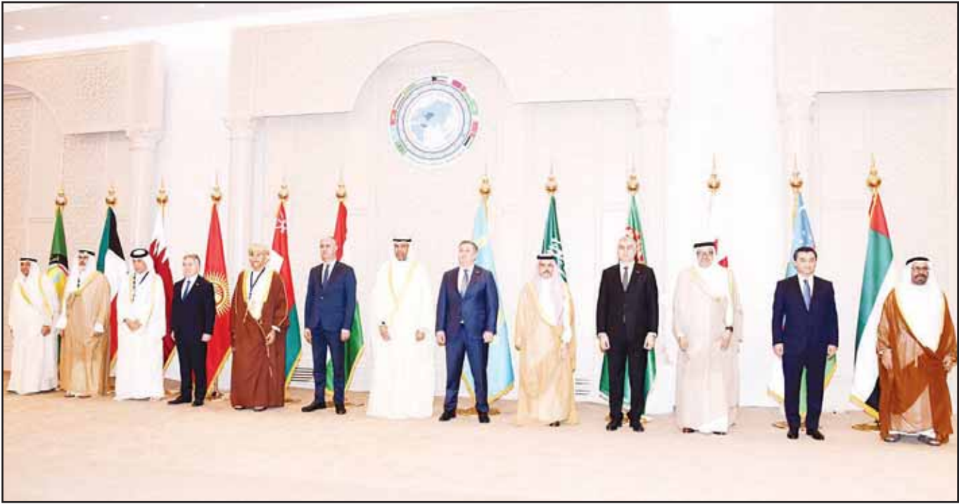
Foreign ministers and representatives from the GCC countries and the Central Asian states pose for a group photo during the Third Ministerial Meeting of the Strategic Dialogue between the GCC and Central Asian countries, hosted by Kuwait.