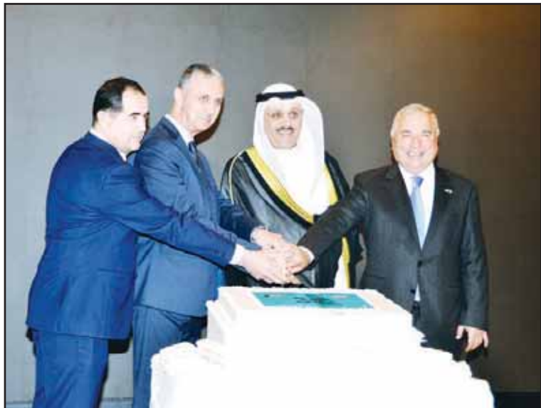
Photo by Samer Shiqer The ceremonial cutting of the cake during a celebration hosted by the Embassy of Tajikistan to commemorate the 30th anniversary of diplomatic relations between the two countries.

By Fares Al-Abdan Al-Seyassah/Arab Times Staff