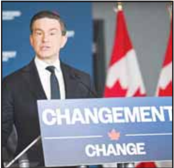
Conservative Party leader Pierre Poilievre speaks during a federal election campaign stop in Montreal on April 15.