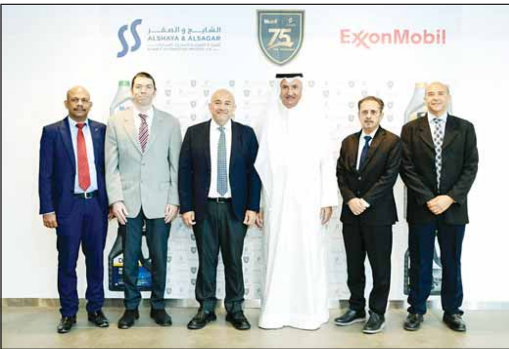
KAICO marks 75th anniversary with ExxonMobil in Kuwait.

"Celebrating 75 years of working with KAICO is a testament to our shared vision and commitment to delivering superior value driven lubrication solutions,"