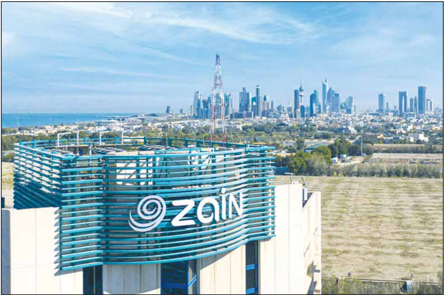
Zain HQ building.

Please feel free to download the 2024 Zain Group Annual Report and Sustainability Report ( https://zain.com/en/agm2024 ) available in digital format