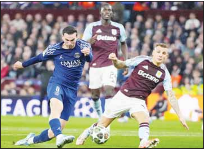
PSG's Fabian Ruiz, left, challenges for the ball with Aston Villa's Lucas Digne during the Champions League quarterfinal second leg soccer match between Aston Villa and Paris Saint-Germain at the Villa Park stadium, in Birmingham, England.

club's first Champions League title. It lost in the final to Bayern Munich in 2020 and was eliminated in the semifinals by Dortmund last season. “We believed in the end we were going to go through,” Marquinhos, PSG's Brazilian center back, said in comments from Portuguese to English on British broadcaster Amazon Prime. “But this is the Champions League - the games are always going to be difficult.” Donnarumma ended up being PSG's savior, diving full length to claw away a powerful shot by Marcus Rashford and a header by Tielemans, and then standing tall to keep out Marco Asensio - a player on loan from PSG - when the playmaker was clean through. Then, with virtually the last kick of the game, Villa substitute Ian Maatsen sent in a volley that might have been swerving into the bottom corner, only for PSG defender William Pachó to block the shot near the line. And so for Villa, it marked the end of the road in the club's first European Cup campaign since 1982-83 season - when it was the reigning champion. Now it's all about qualifying again, with Villa sitting in seventh place in the Premier League and a point off the Champions League qualification spots. “We showed tonight we can compete at the highest level,” Konsa said. “We want to do it again next season.”