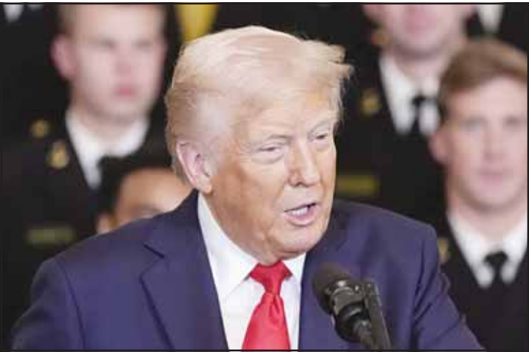
US President Donald Trump speaks during the Commander-in-Chief trophy presentation to the Navy Midshipman football team in the East Room of the White House, on April 15, in Washington.

Fox Noticias said the interview with Trump was taped Monday.