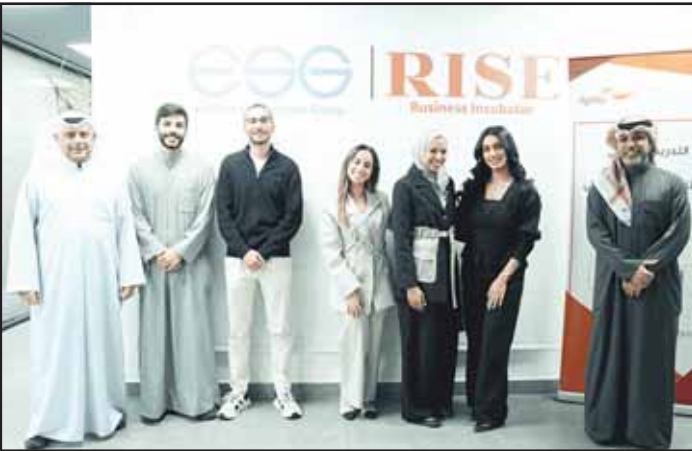
Agility, ESG continue facility management training for Kuwaiti graduates.

It is worth mentioning that the State of Kuwait's participation in (Expo 2025) is the second of its kind in the same region, as Kuwait previously participated in (Expo 1970) in (Osaka, Japan) more than fifty years ago, and the exhibition attracted more than 64 million visitors at that time.