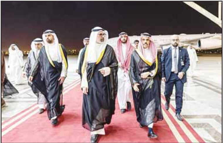
Deputy Foreign Minister Ambassador Sheikh Jarrah Jaber Al-Ahmad Al-Sabah receives Saudi Minister of Foreign Affairs.

Deputy Foreign Minister Ambassador Sheikh Jarrah Jaber Al-Ahmad Al-Sabah received the Bahrain Minister of Foreign Affairs Dr. Abdullatif Al-Zayani, at Kuwait International Airport, upon his arrival to participate in the third ministerial meeting of the GCC and the Central Asian countries strategic dialogue.