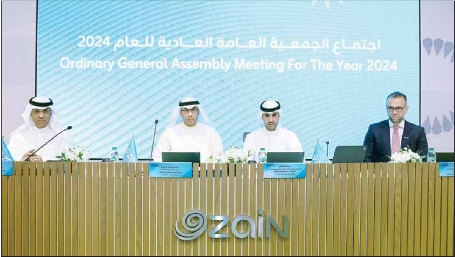
Zain Group Annual General Meeting (AGM).