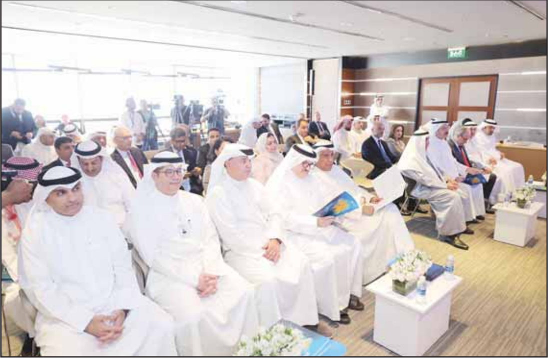
Some members of the Board of Directors and Executive Management during the meeting.