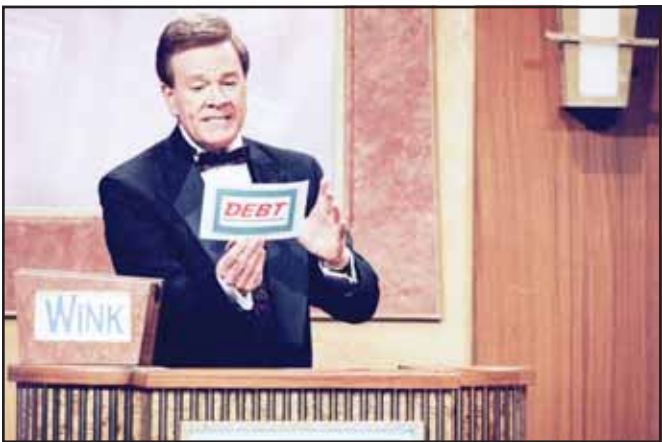
Host Wink Martindale looks at a card during game show, May 22, 1997.

His first network hosting job was on NBC's "What's This Song?" where he was credited as Win Martindale from 1964-65.