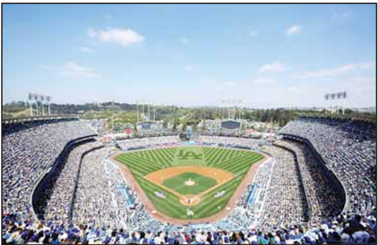
In this file photo, Dodger Stadium is seen during the first inning of an opening day baseball game between the Los Angeles Dodgers and the San Diego Padres in Los Angeles.

preliminary matches at the Peacock Theater across from Crypto.com Arena, which will host the final stages in downtown LA. Weightlifting also will be at Peacock, while artistic gymnastics and trampoline will be in Crypto.com Arena. Volleyball will be at Honda Center in Anaheim, about 27 miles from downtown Los Angeles. The city of Carson will host archery at Dignity Health Sports Park after the Rugby Sevens tournament. Shotgun shooting will be in South El Monte, about 14 miles from downtown LA. Equestrian is set for Santa Anita racetrack in suburban Arcadia, which hosted the sport during the 1984 Los Angeles Games. Rhythmic gymnastics will be at Galen Center on the University of Southern California campus, along with badminton. The Sepulveda Basin Recreation Area in the San Fernando Valley north of downtown LA will host 3x3 basketball, as well as modern pentathlon, BMX freestyle, BMX racing, skateboarding and skateboarding street.