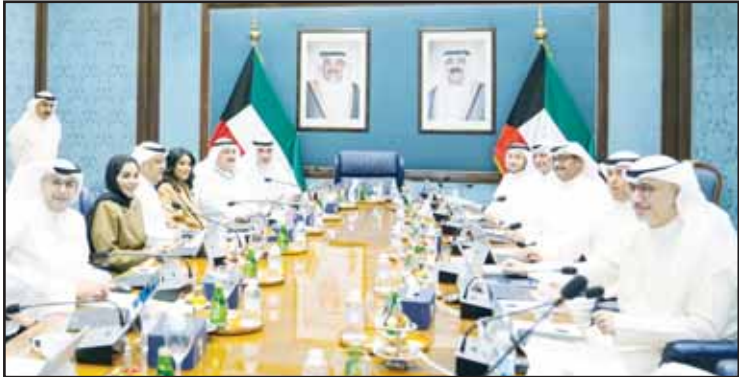
Prime Minister Diwan photo Photo during the Cabinet meeting.

The joint statement highlighted the importance of finalizing the demarcation of the Kuwaiti-Iraqi maritime border, ensuring compliance with international law, and protecting Kuwait's sovereignty. Both countries reaffirmed their commitment to Security Council Resolution