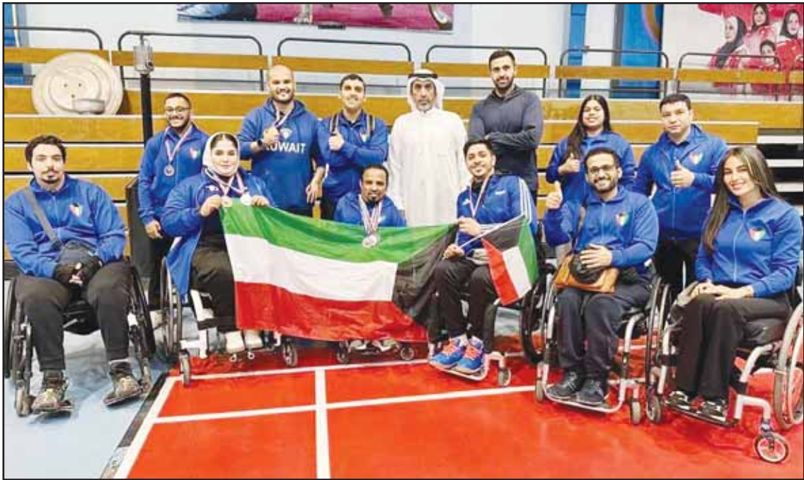
The heroes of International Table Tennis Championship.

AMMAN, April 16: The Kuwait Paralympic table tennis team returned with an impressive haul of seven medals, following its participation in the 16th National Club International Table Tennis Championship, held in the Jordanian capital, Amman. The tournament, organized by the Jordanian Paralympic Committee, featured 85 players representing 13 countries across Asia, Africa, and Europe.