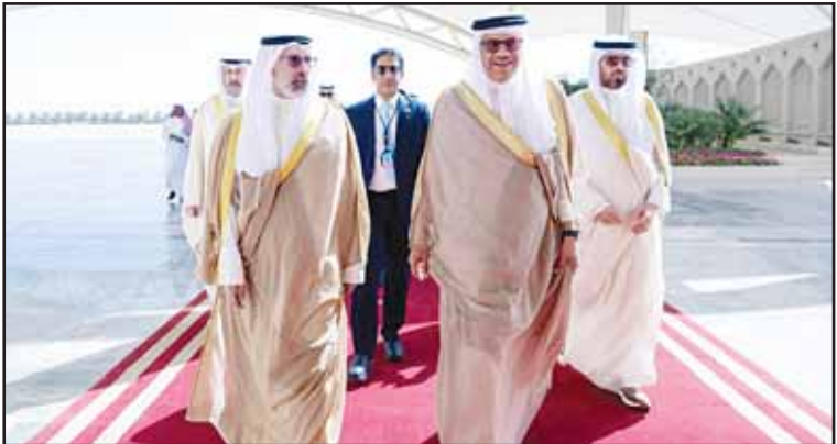
Deputy Foreign Minister Ambassador Sheikh Jarrah Jaber Al-Ahmad Al-Sabah receives the Minister of Foreign Affairs of the Kingdom of Bahrain, Dr. Abdullatif bin Rashid Al-Zayani.