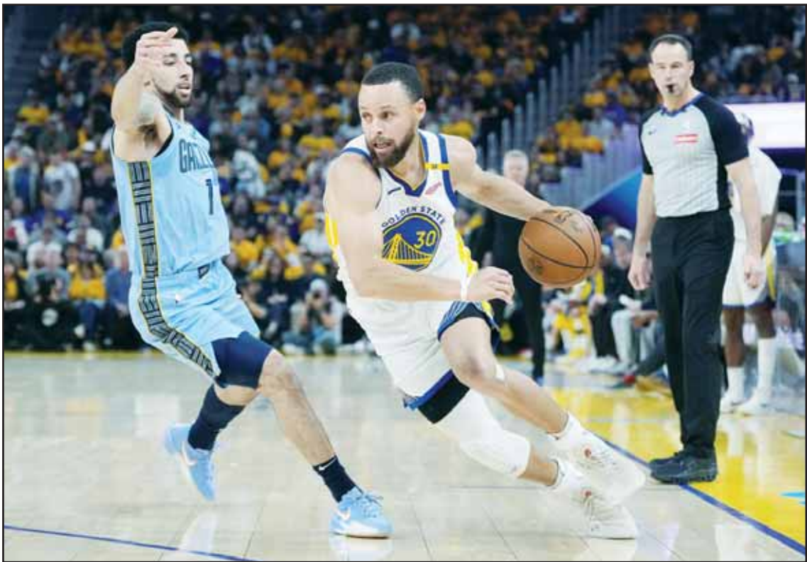
Golden State Warriors guard Stephen Curry (30) drives to the basket against Memphis Grizzlies guard Scotty Pippen Jr. (1) during the first half of an NBA play-in tournament basketball game in San Francisco.

Playoff Jimmy in all his brilliance on the big stage took all the pressure off Curry, and now they're taking the Golden State Warriors to the playoffs. “I know I want to win a championship so he needs, his what, this would be No. 5?” Butler said. Butler had 38 points, seven rebounds and six assists creating opportunities on both ends at every chance, Curry scored 37, and the Warriors earned the seventh seed in the Western Conference by beating the Memphis Grizzlies 121-116 on Tuesday night in the Play-In Tournament. Curry knocked down a baseline 3-pointer with 1:50 to go and one from the left wing with a minute on the clock then converted four free throws in the closing five seconds. Golden State is now headed for a best-of-seven first-round series with the Rockets beginning with Game 1 on Sunday at Houston. After a pair of free throws by Curry with 5.4 seconds left, the Grizzlies had one last chance - but Santi Aldama couldn't inbound the ball before a five-second violation. Desmond Bane scored 30 points and Ja Morant 22 for Memphis, which will head home to host the winner of the Mavericks-Kings matchup on Wednesday night in Sacramento to determine the eighth playoff spot. With the Grizzlies on a roll midway through the third, Butler grabbed momentum back with a steal and dunk. He shot 12 for 20 in a second straight 30-point performance and his highest scoring game since joining the Warriors at the trade deadline. He made 12 of 18