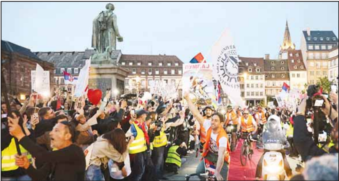
Protesting Serbian university students who rode bicycles from Novi Sad, Serbia, arrive at the heart of the European Union to seek support on April 15, in Strasbourg, eastern France.