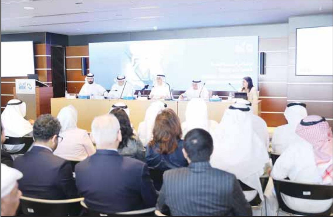
A section of the audience.

In 2024, ABK’s stock was promoted to the Premier Market on Boursa Kuwait due to its compliance with qualification requirements. This increased institutional trading and demonstrated ABK’s commitment to meeting regulatory standards and maintaining its status in the index.