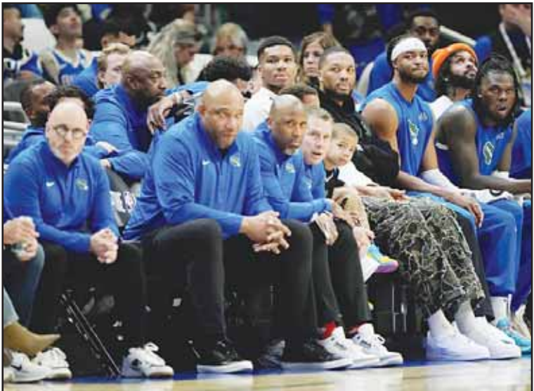
Milwaukee Bucks’ Giannis Antetokounmpo and Damian Lillard watch from the bench during the first half of an NBA basketball game against the Detroit Pistons.