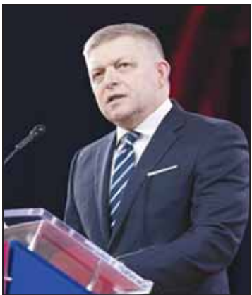
Slovakia’s Prime Minister Robert Fico speaks at the Conservative Political Action Conference, CPAC, at the Gaylord National Resort & Convention Center on Feb 21 in Oxon Hill, Md.

BRATISLAVA, Slovakia, April 16, Slovakia’s populist Prime Minister Robert Fico reacted angrily Tuesday to what he called “disrespectful” remarks by the European Union foreign policy chief who warned European leaders against traveling to Moscow for military celebrations of the end of World War II. Known for his pro-Russian views, Fico has repeatedly vowed to attend the military parade in the Russian capital on May 9 that will mark the 80th anniversary of Nazi Germany’s defeat in WW II. Kaja Kallas told reporters in Luxembourg on Monday after a meeting of EU foreign ministers that “what was also discussed and very clearly said by different member states is that any participation in the 9th of May parades, or celebrations, in Moscow will not be taken lightly on the European side, considering that Russia is really waging a full-scale war in Europe.”