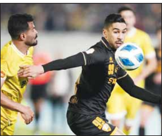
Al-Qadsiya and Duhok players fighting for the ball.