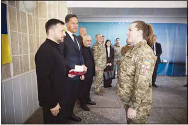
In this photo provided by the Ukrainian Presidential Press Office, NATO Secretary General Mark Rutte watches as Ukraine’s President Volodymyr Zelenskyy awards a military medic with a state award in a hospital in Odesa, Ukraine on April 15.

ODESA, Ukraine, April 16, NATO’s support for Ukraine remains “unwavering,” the alliance’s secretary-general said Tuesday, emphasizing that more than 20 billion euros - over $22 billion - in security assistance has already been pledged by NATO allies in the first three months of the year. Mark Rutte spoke on Tuesday in Ukraine’s port city of Odesa, where he met with President Volodymyr Zelenskyy. His visit came days after two Russian ballistic missiles struck the city of Sumy on Palm Sunday morning, killing at least 35 people, including two children, and injuring 119. The attack on the northeastern city, about 30 kilometers (20 miles) from Ukraine’s border with Russia, marked the second large-scale attack in just over a week to result in significant civilian casualties. Earlier this month, about 20 people were killed, including nine children, after a Russian ballistic missile struck Zelenskyy’s hometown of Kryvyi Rih on April 4. “I’m here today because I believe Ukraine’s people deserve real peace, real safety and security in their country, in their homes,” Rutte said during a joint news conference with Zelenskyy. The two met with wounded Ukrainian soldiers at a hospital in Odesa. This is Rutte’s first trip to Ukraine