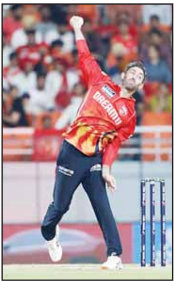
Punjab Kings’ Glenn Maxwell bowls a delivery during the Indian Premier League cricket match between Punjab Kings and Kolkata Kings Riders at Maharaja Yadavindra Singh Cricket Stadium in Mohali, India.