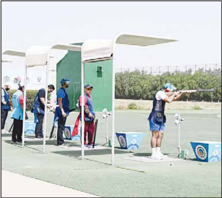
Shooters in action during the Amir International Shooting Championship.

past medalist at the 2022 edition, praised the high caliber of competition.