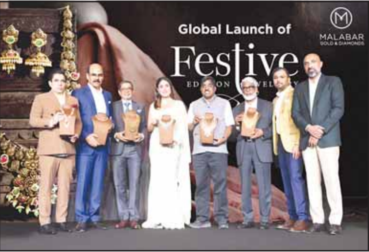
Kareena Kapoor Khan launches Malabar Gold & Diamonds’ Festive Edition in Dubai.