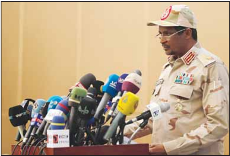
Gen Mohammed Hamdan Dagalo, the deputy head of the military council speaks at a ceremony in the capital Khartoum, Sudan, on Aug. 4, 2019. (AP)

CAIRO, April 16, (AP): A notorious paramilitary group fighting against the Sudanese military announced that it was forming a rival government, which will rule parts of the country controlled by the group including the western Darfur region where the United Nations says recent attacks by the group have killed over 400 people. Gen Mohammed Hamdan Dagalo, commander of the Rapid Support Forces, announced the move in a speech on Tuesday as the northeastern African nation marked two years of civil war. "On this anniversary, we proudly declare the establishment of the Government of Peace and Unity," Dagalo said in a recorded speech, adding that other groups have joined the RSF-led administration, including a faction of the Sudan's Liberation Movement, which controls parts of Kordofan region. Dagalo, who is sanctioned by the US over accusations that his forces committed genocide in Darfur, said that he and his allies were also establishing "a 15-member Presidential Council" representing all of Sudan's regions. The move came as the RSF suffered multiple battlefield setbacks, losing the capital, Khartoum and other urban cities in recent months. The paramilitary group has since regrouped in its stronghold in the sprawling region of Darfur. It raises concerns that Sudan is heading towards partition, or a prolonged conflict like that one in neighboring Libya where two rival administrations