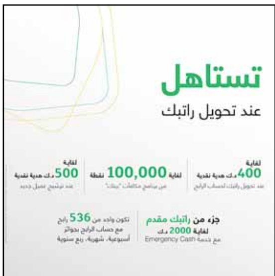
'You Deserve' Campaign.