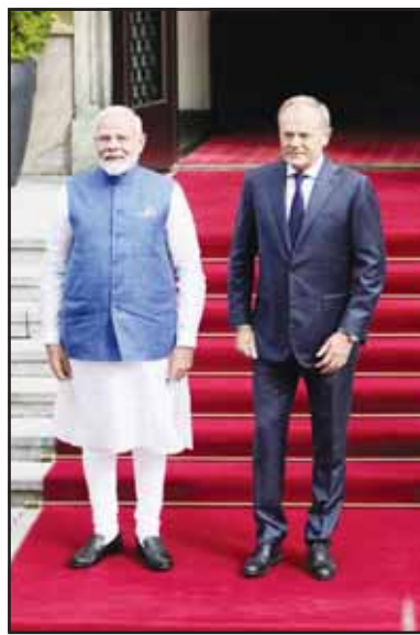
Indian Prime Minister Narendra Modi, (left), is greeted by his Polish counterpart Donald Tusk, before talks in Warsaw, Poland on Aug 22. Modi and Tusk met for talks on security, the war on Ukraine by India's strategic partner Russia, and invigorating bilateral ties.