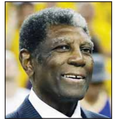
In this file photo, former Golden State Warriors head coach Al Attles is seen during the first half of Game 2 of basketball's NBA Finals between the Warriors and the Cleveland Cavaliers in Oakland, Calif.

Attles would joke how he passed to Chamberlain for all those points. He actually had six assists, while Guy Rodgers had 20 of the team's 39 overall in the 169-147 win against the Knicks.