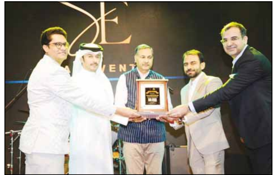
Photos during the concert.