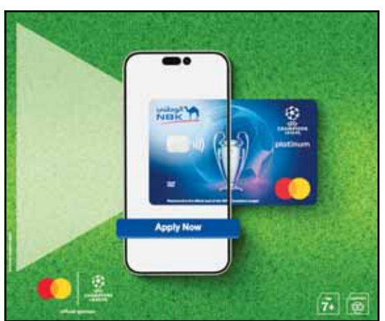
NBK cashback prepaid card.