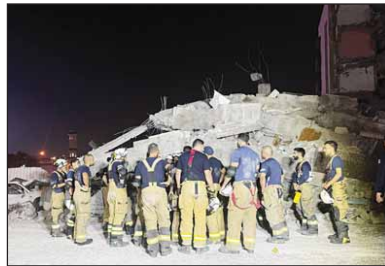
Fire brigade personnel at the site of the building collapse.