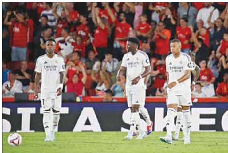
Real Madrid's Vinicius Junior, left, Aurelien Tchouameni, centre and Kylian Mbappe prepare to kick off after Mallorca's Vedat Muriqi scored his side's first goal during a Spanish La Liga soccer match between Mallorca and Real Madrid at the Son Moix Stadium in Palma de Mallorca, Spain.

Saturday kicks off with Osasuna at home to Mallorca, with the visitors traveling after holding Real Madrid to a 1-1 draw on the opening day of the season. The team from the Balearic Islands are now coached by Jagoba Arrasate, who left Osasuna in