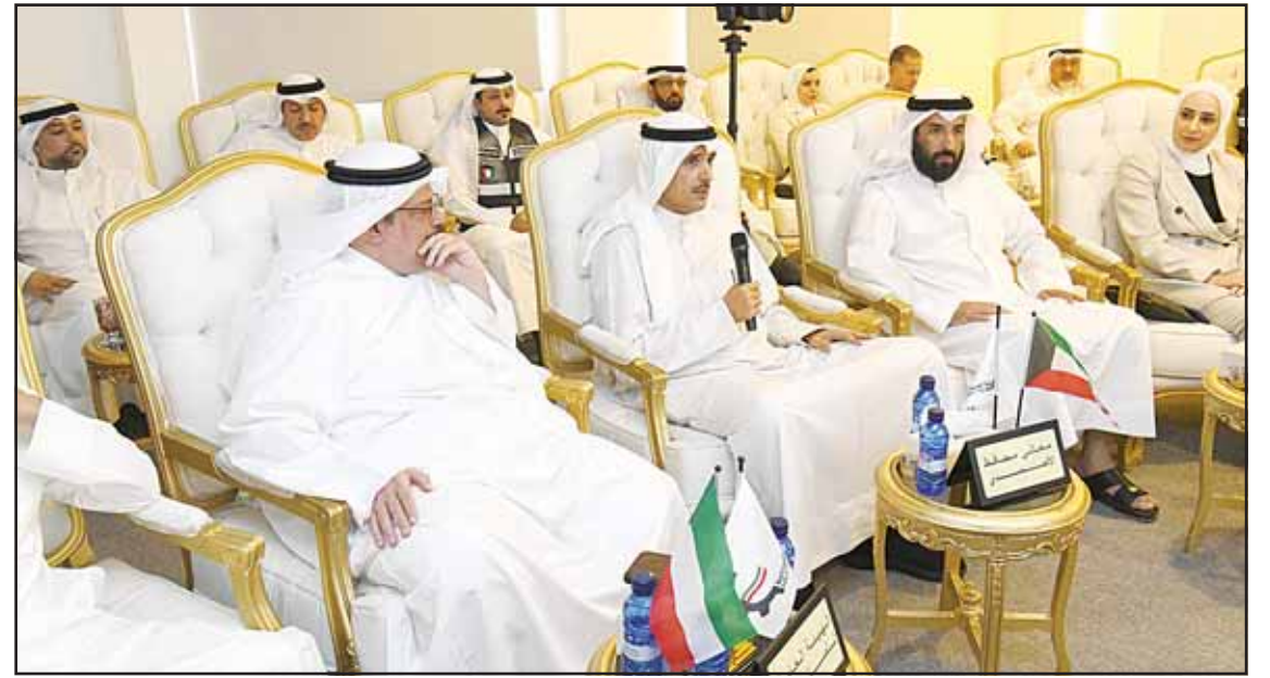
Ahmadi Governor speaking during the visit.

The project will provide necessary infrastructure to enhance Kuwait's business environment. It will help in pushing for industrial development, increasing the contribution of non-oil manufacturing industries to the gross domestic product (GDP), and creating productive job opportunities for the national workforce through the support of small and medium-sized enterprises.