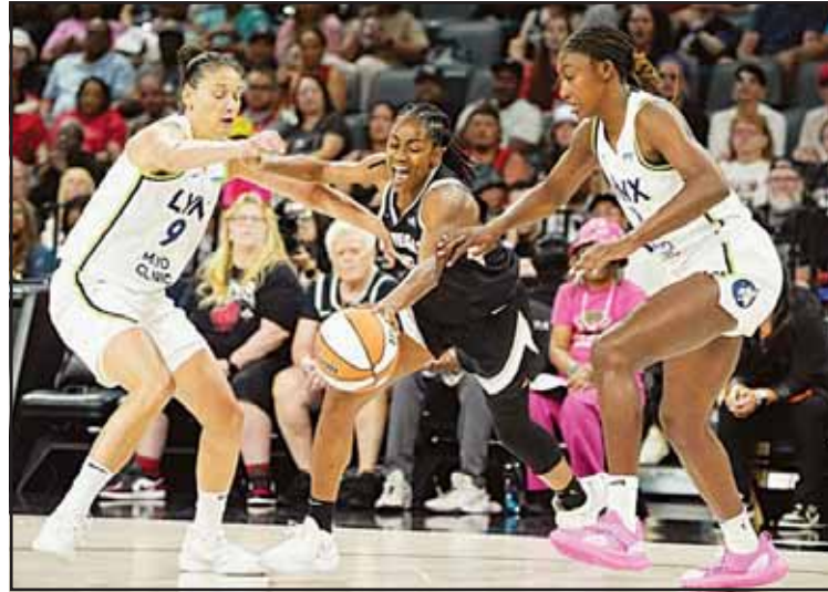
Las Vegas Aces guard Tiffany Hayes (15) drives between Minnesota Lynx forward Cecilia Zandalasini (9) and forward Diamond Miller (1) during the first half of a WNBA basketball game in Las Vegas.

Bridget Carleton added 12 points, Kayla McBride had 11 and Alanna Smith 10, giving the Lynx (20-8) five starters in double figures for just the second time, the first coming in the other win over the Aces. Myisha Hines-Allen, acquired in a trade on Tuesday, had eight points off the bench.