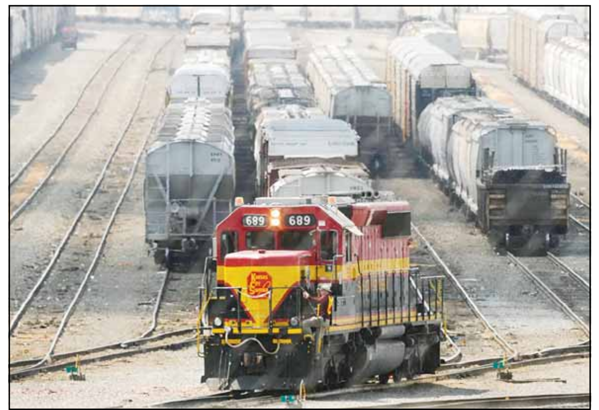
A worker climbs aboard a locomotive at a CPKC rail yard Wednesday, Aug. 21, 2024, in Kansas City, Mo.

Canada's railroads have sometimes shut down briefly in the past during