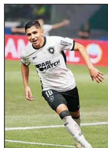
Jefferson Savarino of Brazil's Botafogo celebrates scoring his side's second goal against Palmeiras during a Copa Libertadores round of 16 second leg soccer match at Allianz Parque stadium in Sao Paulo.

what we wanted." In other round of 16 second-leg fixtures on Wednesday, Penarol advanced 4-1 on aggregate despite a 1-0 loss at The Strongest and River Plate progressed 3-1 overall after a 2-1 home draw with