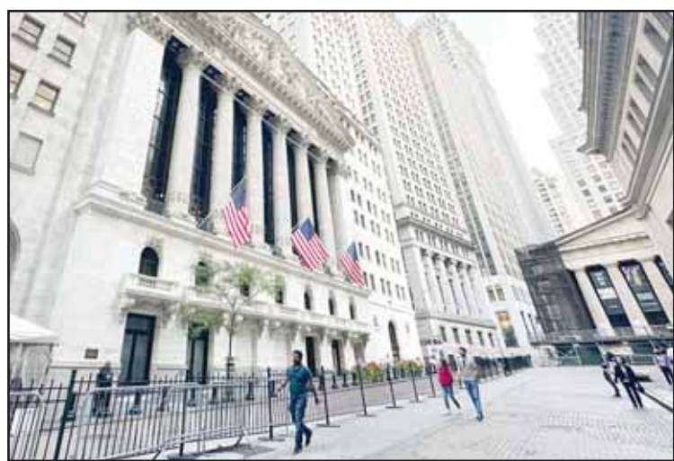
The New York Stock Exchange is shown on Wednesday, Aug. 21, 2024, in New York.

The problem, critics say, is such stellar growth has set off too much euphoria among investors. Through the year's first six months, Nvidia's stock soared nearly 150%. At that point, the stock was trading at a little more than 100 times the company's earnings over the prior 12 months. That's much more expensive than