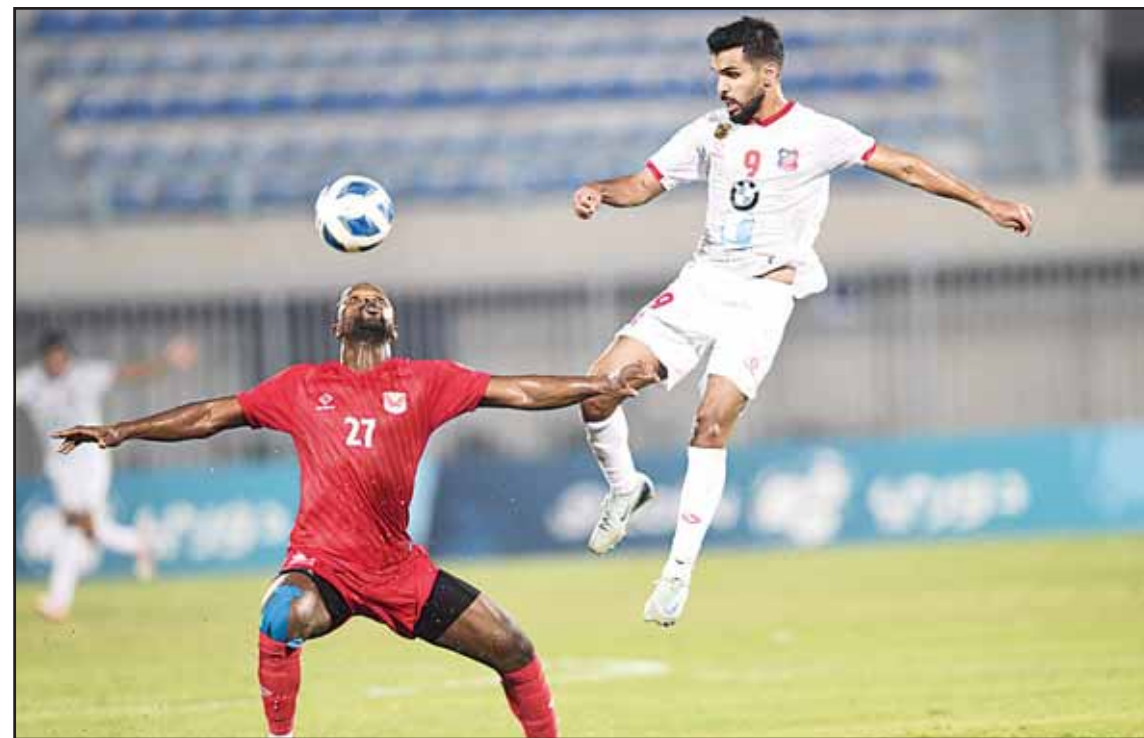
Kuwait Club player vies for the ball with an opponent during a league game.

As for Fahaheel, they delivered a strong performance against Khaitan in the opening round, winning 4-1, but paid the price for missed opportunities against Kuwait Club.