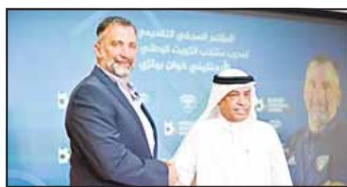
Kuwait senior soccer team coach poses with Kuwait Football Association official.