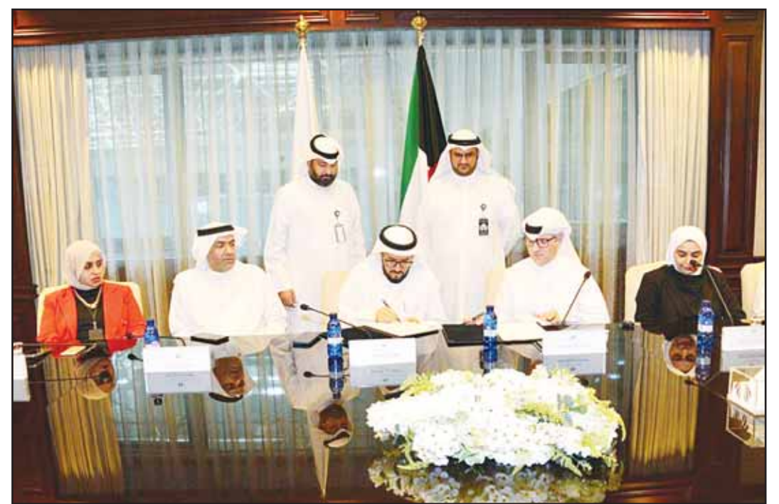
A photo during the signing of the MoU.

The move came after all required legal and regulatory approvals were obtained, the official underlined, terming the process as part of the ministry's strategy to boost the country's strategic medicine and lab stock and to provide high-quality and efficient health services.