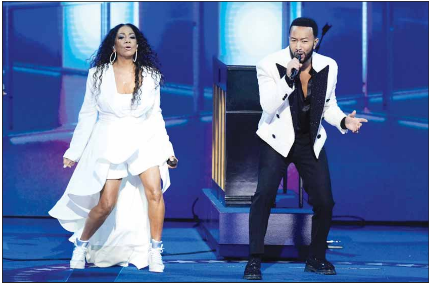
Sheila E., (left), and John Legend perform during the Democratic National Convention Wednesday, Aug. 21, in Chicago.