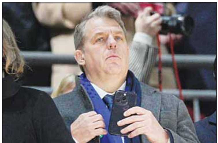
In this file photo, Chelsea owner Todd Boehly looks dejected after losing the English Carabao League Cup Final soccer match between Liverpool and Chelsea, at Wembley Stadium, London, England.

Sterling, who cost 50 million pounds (65.5 million U.S. dollars) two years ago, is thought to be especially annoyed by the situation after cutting his summer holiday short to begin pre-season training a fortnight early to convince Maresca of his worth.