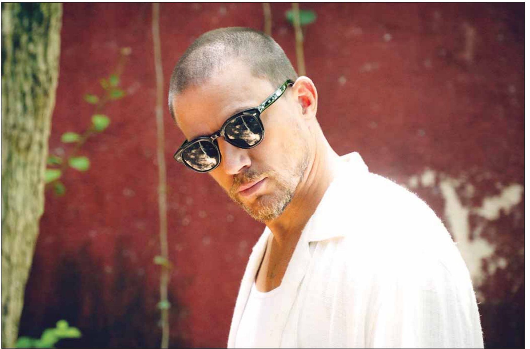
This image released by Amazon/MGM Studios shows Channing Tatum from 'Blink Twice.' (AP)