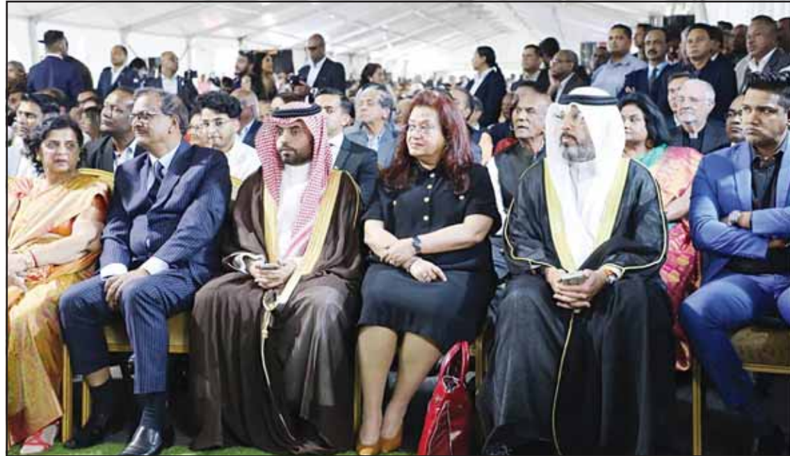
Photo taken during the inauguration.

The financial scope of the project was substantial, with a combined investment of approximately $127 million from both funds. The Kuwaiti Fund contributed around $24 million, reflecting its commitment to supporting health development in the region. The new hospital significantly expands capacity compared to the previous Flacq Hospital, which had only 350 beds. As the ribbon was cut and the doors of the Sir Anirudh Jagnauth Hospital opened, it symbolized not just a new healthcare facility but a strengthened bond between nations dedicated to improving global health standards.