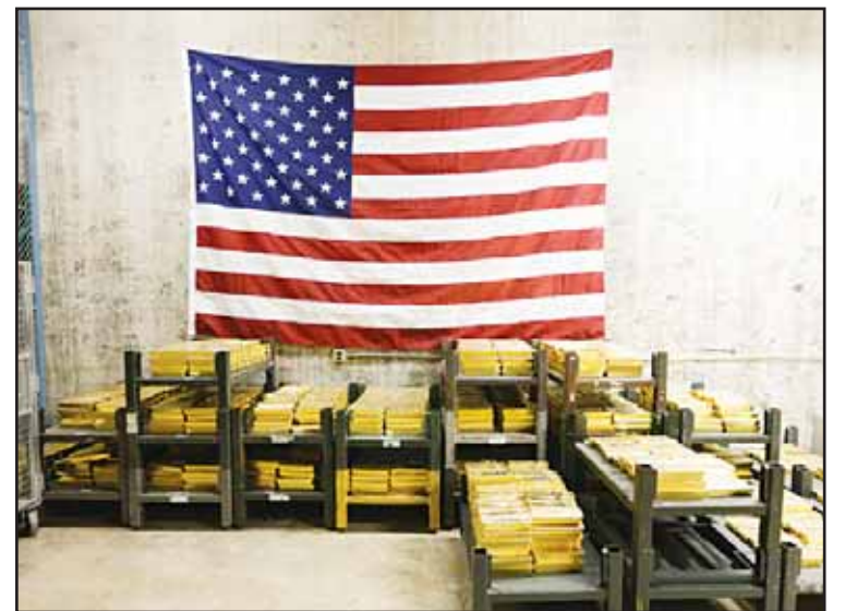
Gold bars are stacked in a vault at the U.S. Mint in West Point, N.Y., on July 22, 2014.