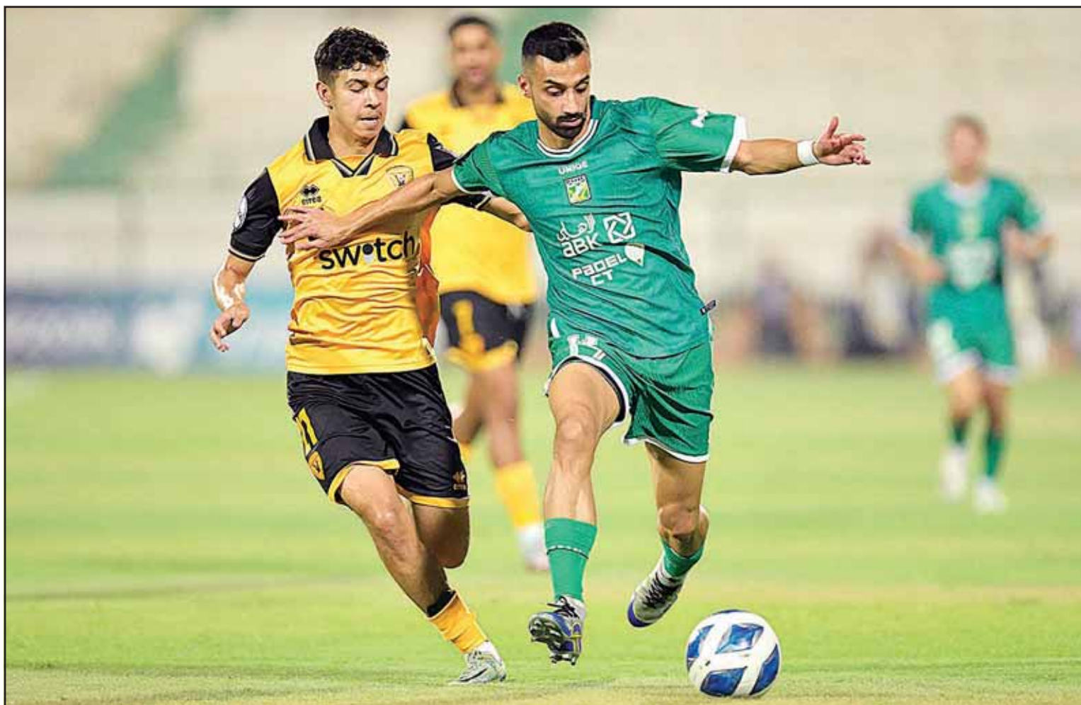
Al-Arabi and Al-Qadisiya players challenge for the ball during the Zain Premier League match.