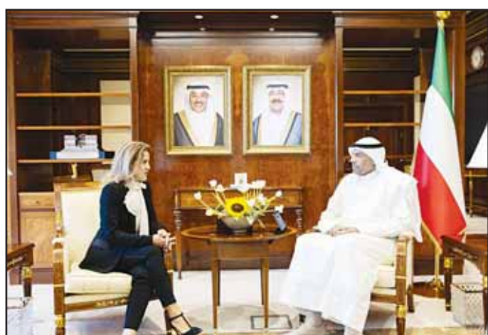
Minister of Foreign Affairs Abdullah Al-Yahya receives the French ambassador to Kuwait Claire Le Flecher.

In a news statement, the KNSN said the quake was six km deep, adding that a 2.2-magnitude aftershock took place at 6:33 the same evening at the same location and the same depth.