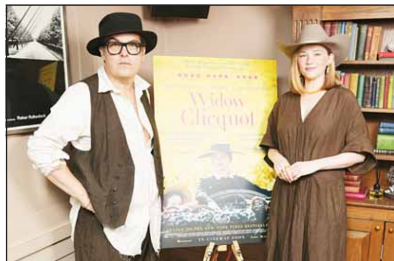
Joe Wright, (left), and Hayley Bennett pose upon arrival at the special screening for the film 'Widow Clicquot' on Wednesday, August 21, in London.

NEW YORK: The four stars who helped shape the new musical "Swept Away" - John Gallagher Jr. , Stark Sands , Adrian Blake Enesco and Wayne Duvall - will steer the nautical tale to the commercial waves of Broadway.