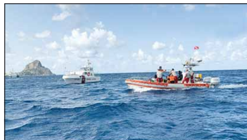
This snapshot taken from a video posted on Aug 20, 2024 shows rescuers searching for survivors off the coast near the shore of Porticello on the island of Sicily, southern Italy. Rescuers searching the wreck of a superyacht that sank off Sicily brought ashore a fifth body on Aug 22, leaving one person still unlocated, as investigators sought to learn why the vessel sank so quickly.

like strippers in the case alleging a scheme to avoid paying at least $1.4 million in taxes. (AP)