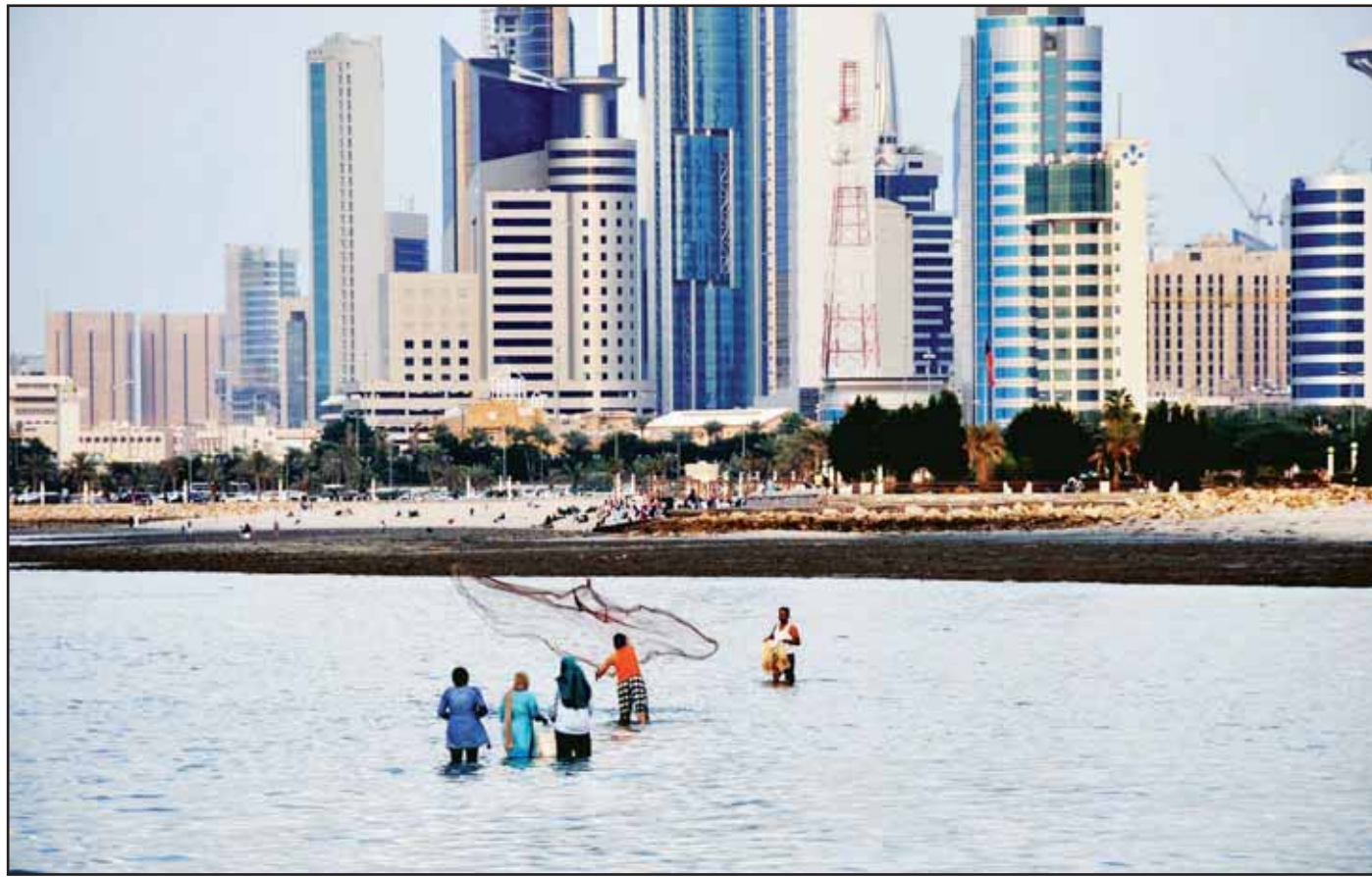
A group of people catching fish with a net, in low-tide, opposite Kuwait City.