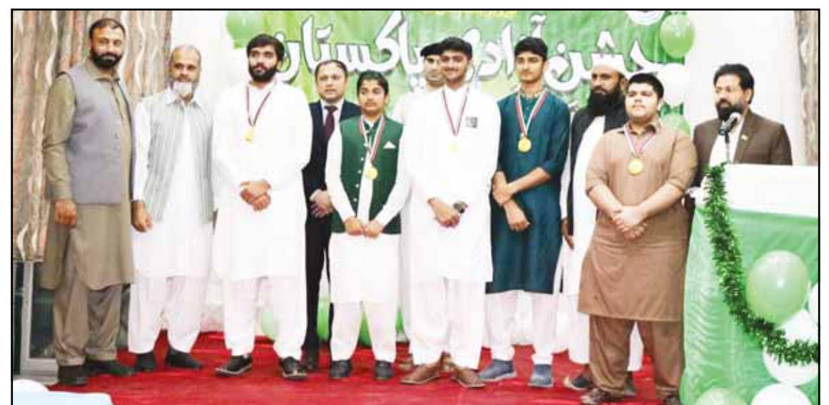
Photo during the event.