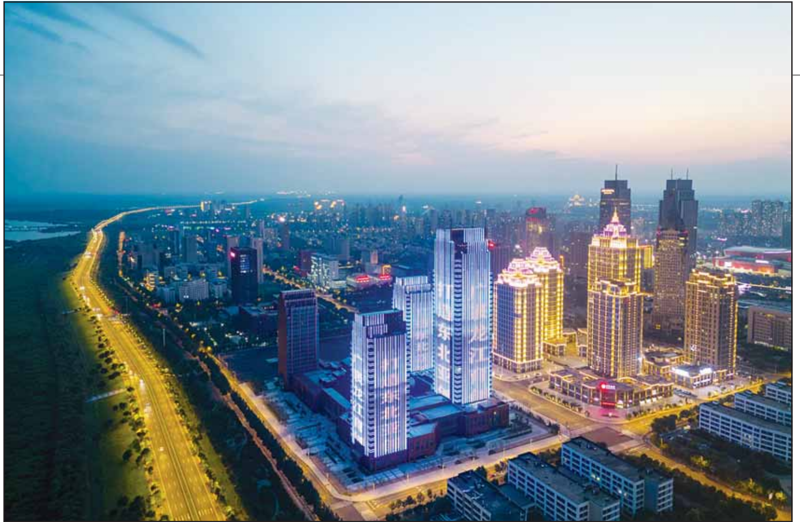
An aerial drone photo taken on July 21, 2024 shows the night view of the sub-area of Heilongjiang pilot free trade zone (FTZ) in Harbin, northeast China's Heilongjiang Province. Known as China's 'Ice City', Harbin has a reputation for its cool weather and diversified attractions, even during the summer months, which helps it remain attractive to tourists throughout the year. (Xinhua)

Authorities have had to release about 7,000 people because of a lack of evidence. While the government is accused of committing mass human rights abuses in the crackdown, Bukele remains highly popular in El Salvador because homicide rates sharply dropped following the detentions. (AP)