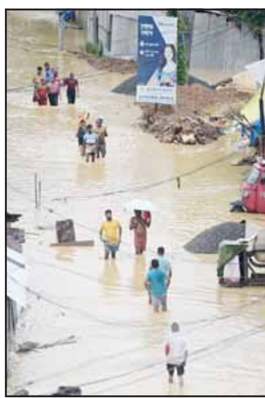
People navigate a flooded street following incessant rains in Agartala, north eastern Tripura state, India on Aug 22.

"The man was exhibiting some quite strange behavior," Varghese told Melbourne Radio 3AW.