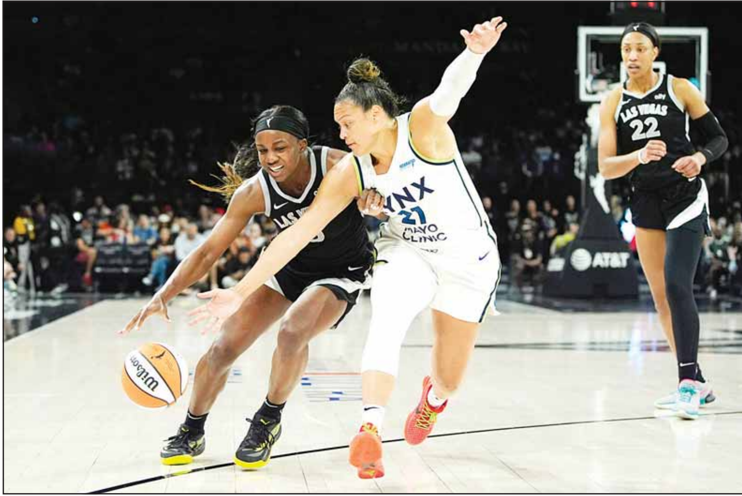
Minnesota Lynx guard Kayla McBride, right, guards Las Vegas Aces guard Jackie Young (0) during the first half of a WNBA basketball game in Las Vegas.