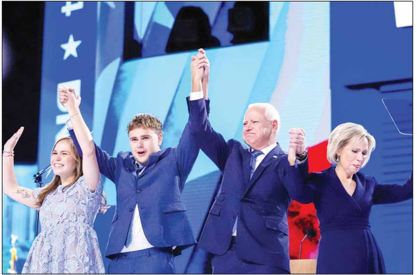
Democratic vice presidential nominee Minnesota Gov Tim Walz celebrates with his family during the Democratic National Convention on Aug 21 in Chicago. (AP)

Hungary's anti-immigrant government has taken a hard line on people entering the country since well over 1 million people entered Europe in 2015, most of them fleeing conflict in Syria. The country built fences protected by razor wire on its southern borders with Serbia and Croatia and a pair of transit zones for holding asylum seekers on its border with Serbia. Those transit zones have since closed.