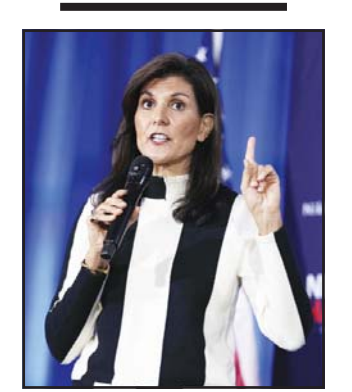
Republican presidential candidate Nikki Haley speaks during a town hall, Friday, Dec. 8, 2023, in Sioux City, Iowa.