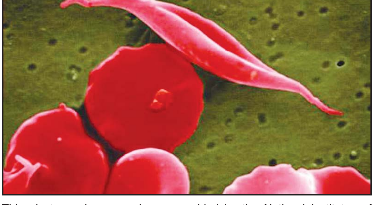
This electron microscope image provided by the National Institutes of Health in 2016 shows a blood cell altered by sickle cell disease, top. (AP)

The company claims on its website to operate "100%" sustainably by sourcing fish from Cygnus Ocean, a farm which has a permit to breed totoaba, and using a portion of their profits to release some farmed fish back into