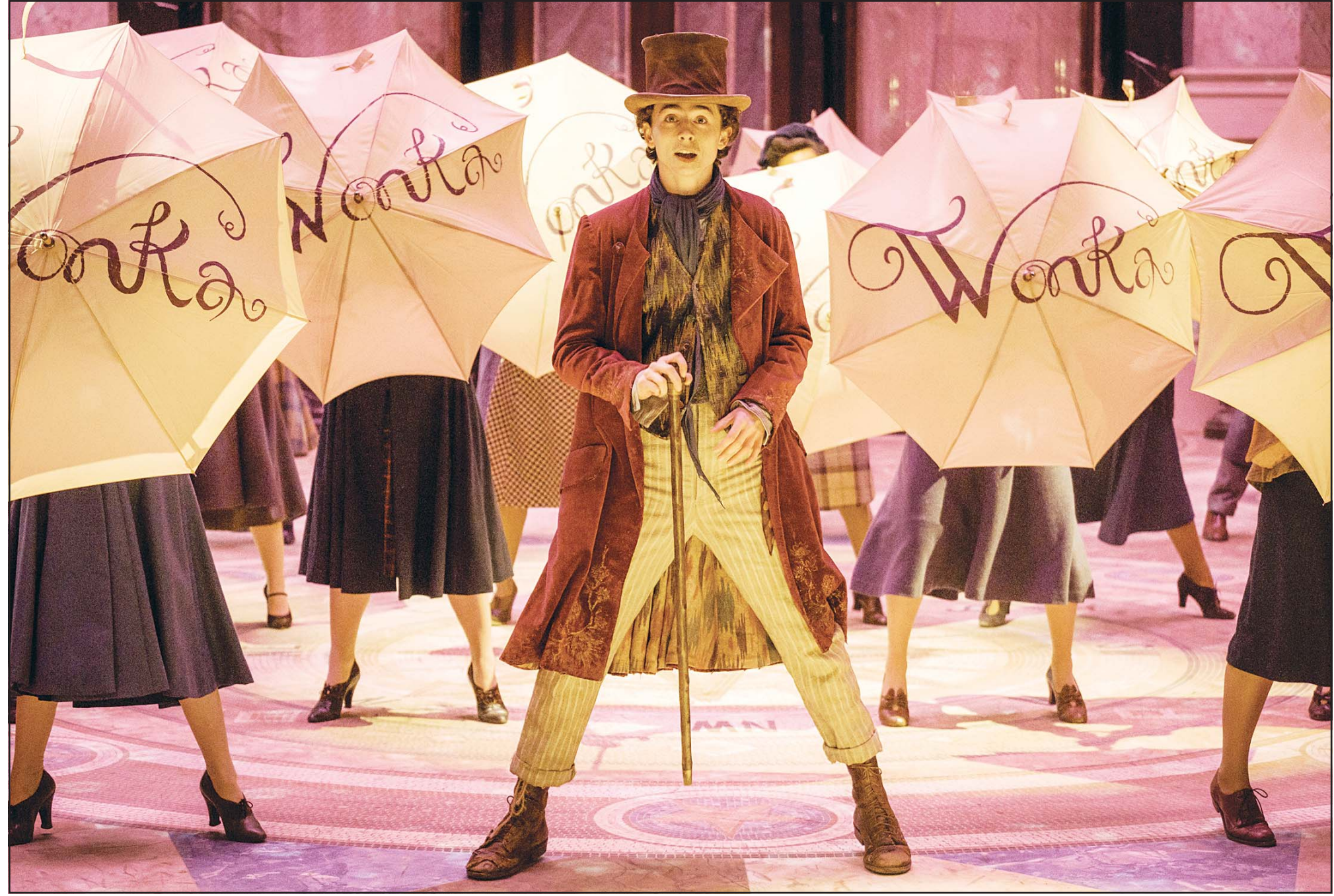
This image released by Warner Bros. Pictures shows Timothee Chalamet, (center), in a scene from 'Wonka.' (AP)