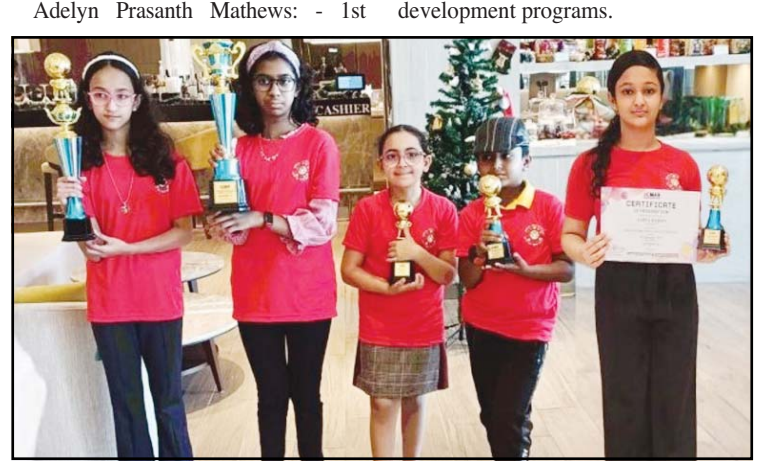
UCMAS-Kuwait students with their awards.

UCMAS Kuwait is located in Salmiya, Block 12, and has been representing Universal Concept of Mental Arithmetic System (UCMAS), an international education organization that is widely recognized as a leader in whole brain