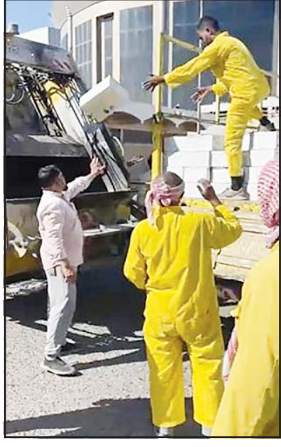
Outdated medicines thrown into garbage.