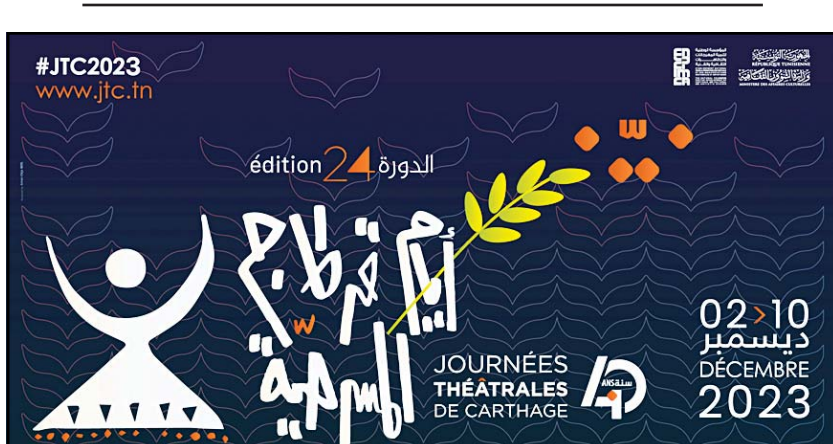
The banner of 24th edition of the Carthage Theater Festival in Tunisia Al-Bassam handles '20 Beirut Port explosion

Kuwait's envoy in Tehran submits credentials as non-resident ambassador to Turk-