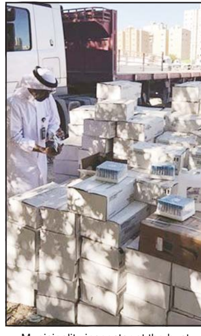
Municipality inspector at the bust.