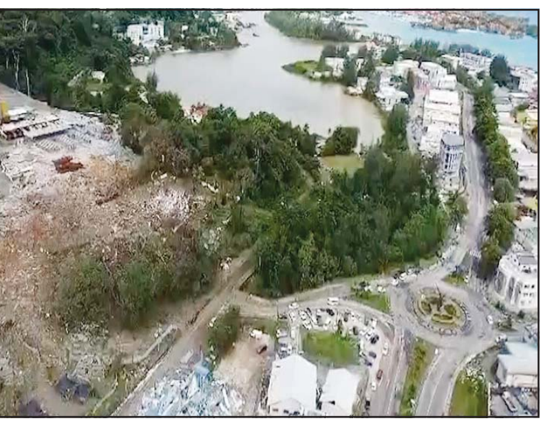
In this image made from video, buildings damaged after a massive explosion at an industrial area on the main island in Mahe, Seychelles, Thursday, Dec. 7, 2023. The president of Seychelles declared a state of emergency on Thursday after a huge blast at an explosives depot and flooding in other parts of the country's main island.

Mushaki is a pivotal transport hub that paves the way to larger cities in east Congo's Kivu region. It has traded hands between rebels and the army throughout the