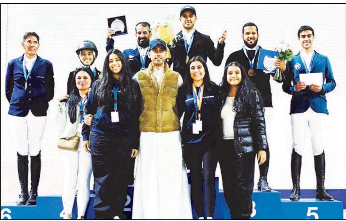
Winners of the inaugural Abdul Aziz Al-Masaieed show jumping tournament celebrate on the podium.

Al-Masaieed emphasized that the tournament operates on a points system, ensuring transparency and providing equal opportunities for all riders to compete.