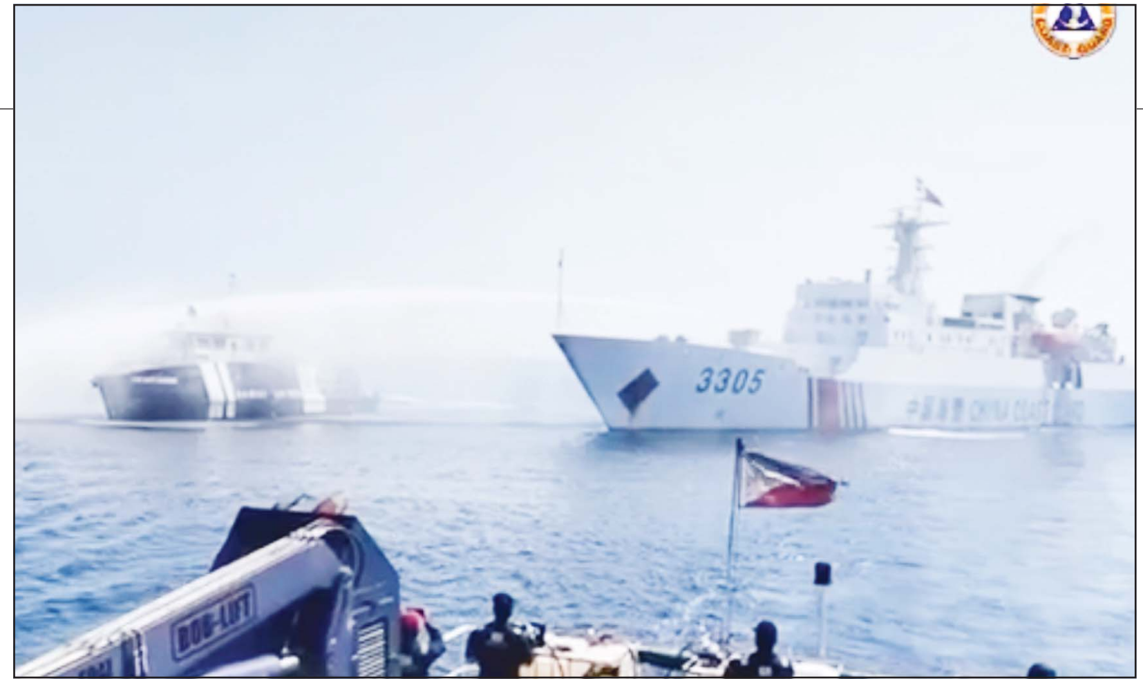
In this image taken from video provided by the Philippine Coast Guard, a Chinese Coast Guard ship (right), uses a water cannon on a Philippine Bureau of Fisheries and Aquatic Resources (BFAR) vessel as it approaches Scarborough Shoal in the disputed South China Sea on Dec 9, 2023. The Philippines and its treaty ally, the United States, separately condemned a high-seas assault Saturday by the Chinese coast guard and suspected militia ships that repeatedly blasted water cannons to block three Philippine fisheries vessels from a disputed shoal in the South China Sea.

set the border. The diplomatic fight over the Essequibo region has flared since then, but it intensified in 2015 after ExxonMobil announced it had found vast amounts of oil off its coast.