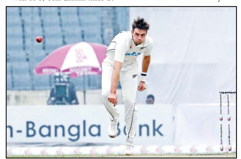
New Zealand's captain Tim Southee bowls on the fourth day of the second test cricket match between Bangladesh and New Zealand in Dhaka, Bang-

Earlier, the entire second day and the first session of the third day was