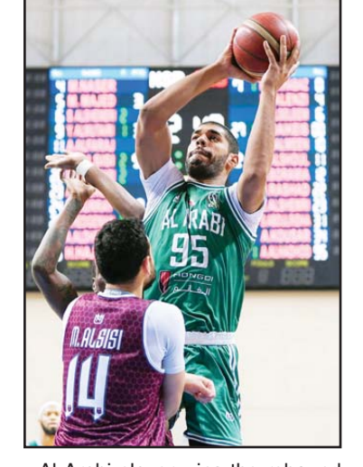
Al-Arabi player wins the rebound battle.

Anticipated to be an exciting matchup, Sulaibikhat's recent successes against mid and lower-ranked teams, coupled with their setbacks against formidable opponents like