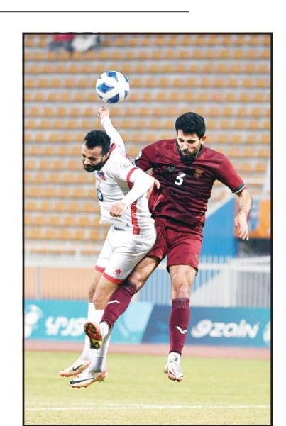
Al-Kuwait and Al-Nasr players battle for the aerial supremacy.

defeating Al-Qadsia, after Al-Shabab 4-0, temporarily claimed the lead. The team's exceptional