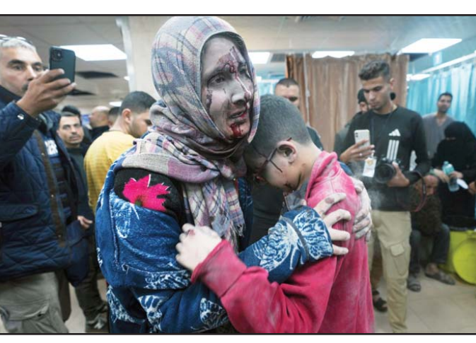
Palestinians wounded in the Israeli bombardment of the Gaza Strip are brought to the hospital in Deir al Balah on Dec. 8, 2023.

Gaza's borders with Israel and Egypt are effectively