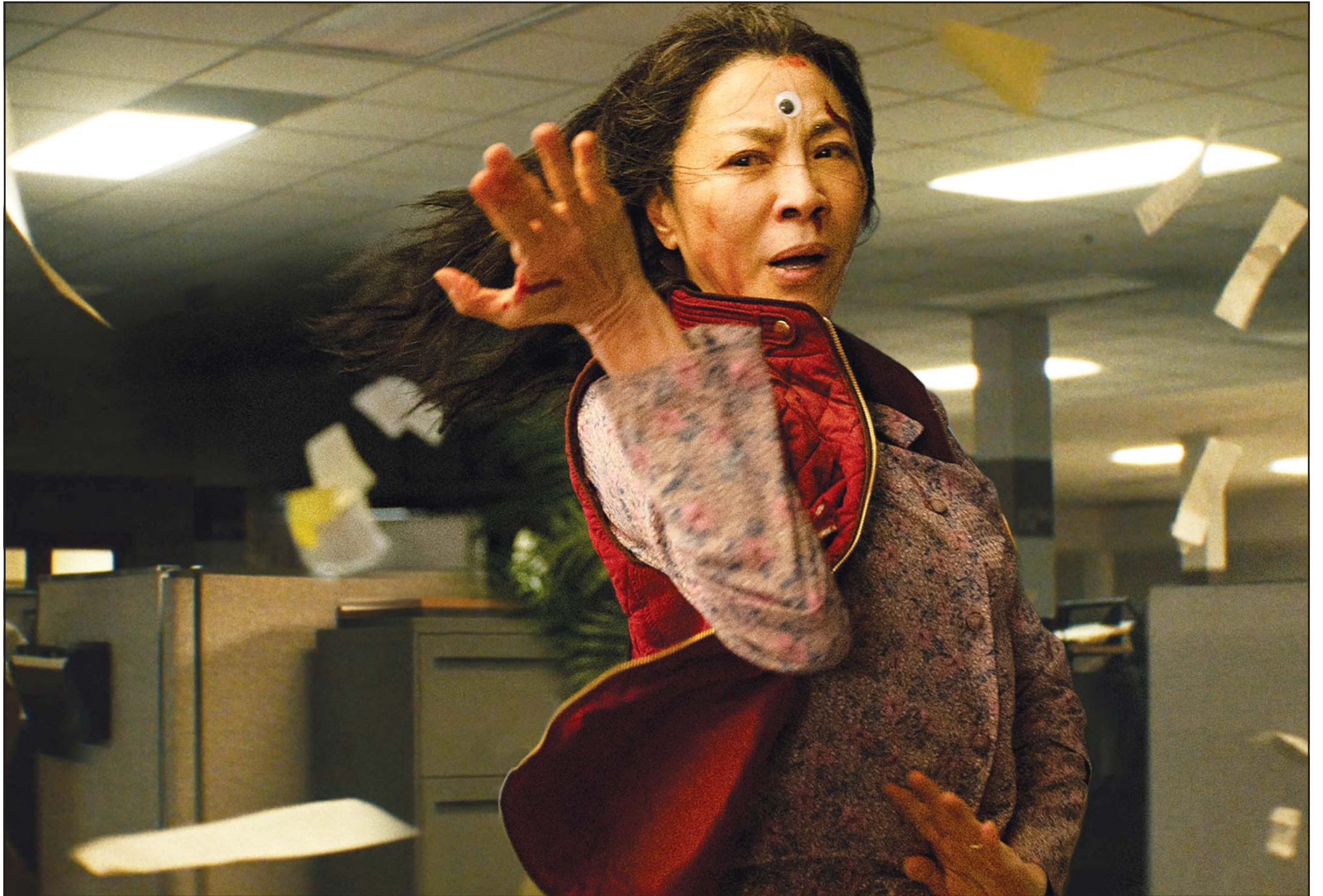
This image released by A24 shows Michelle Yeoh in a scene from 'Everything Everywhere All at Once.'