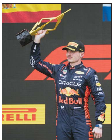
Red Bull Racing's Max Verstappen, of the Netherlands, celebrates his win on the podium following the Formula One Canadian Grand Prix auto race in Montreal.