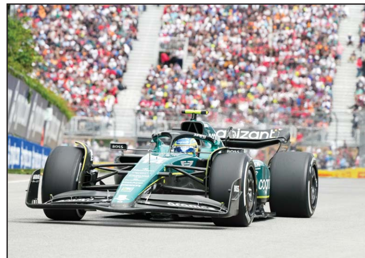
Aston Martin driver Fernando Alonso, of Spain, drives during the Formula One Canadian Grand Prix auto race in Montreal.

"We'll talk about maybe a new contract because of that," Verstappen said with a laugh.