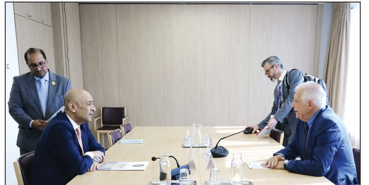
Secretary General of the Cooperation Council for the Arab States of the Gulf and High Representative for the Foreign and Security Policy of the European Union during their meeting.

They revealed that the company has started terminating the contracts of a specific number of employees, especially those who hold leadership