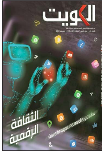
KUNA photos Kuwait Magazine's publications.