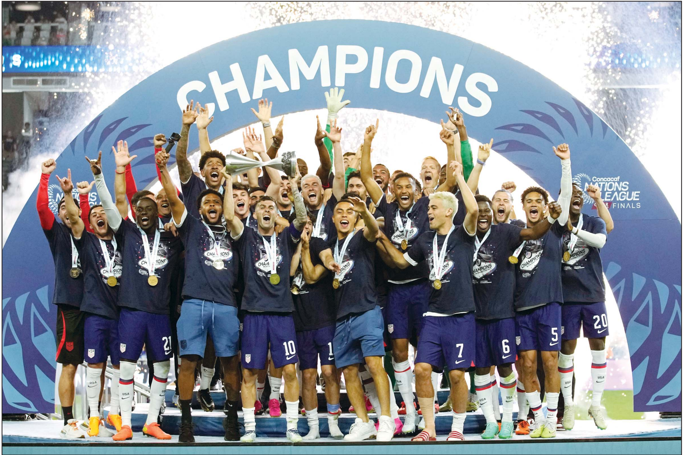
United States players celebrate after defeating Canada in a CONCACAF Nations League final match in Las Vegas.