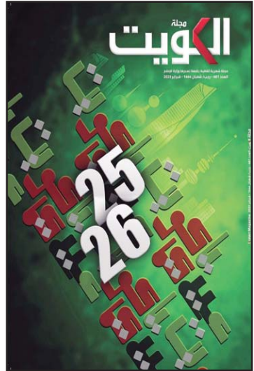
The magazine's recent publication marking Kuwait's national celebrations.

The oil sector is fully ready to start the exchange operations, as it will be taking funds from the account of the Ministry of Finance, provided that the institution undertakes the disbursement and deposit of bonuses in the employees' accounts.