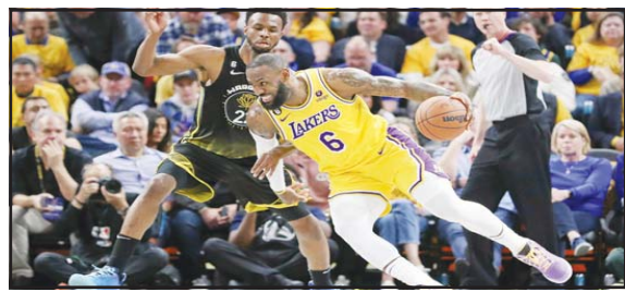
Golden State Warriors' Andrew Wiggins (left) tries to stop Los Angeles Lakers' LeBron James during the second quarter of an NBA basketball Western Conference semifinal game in San Francisco.