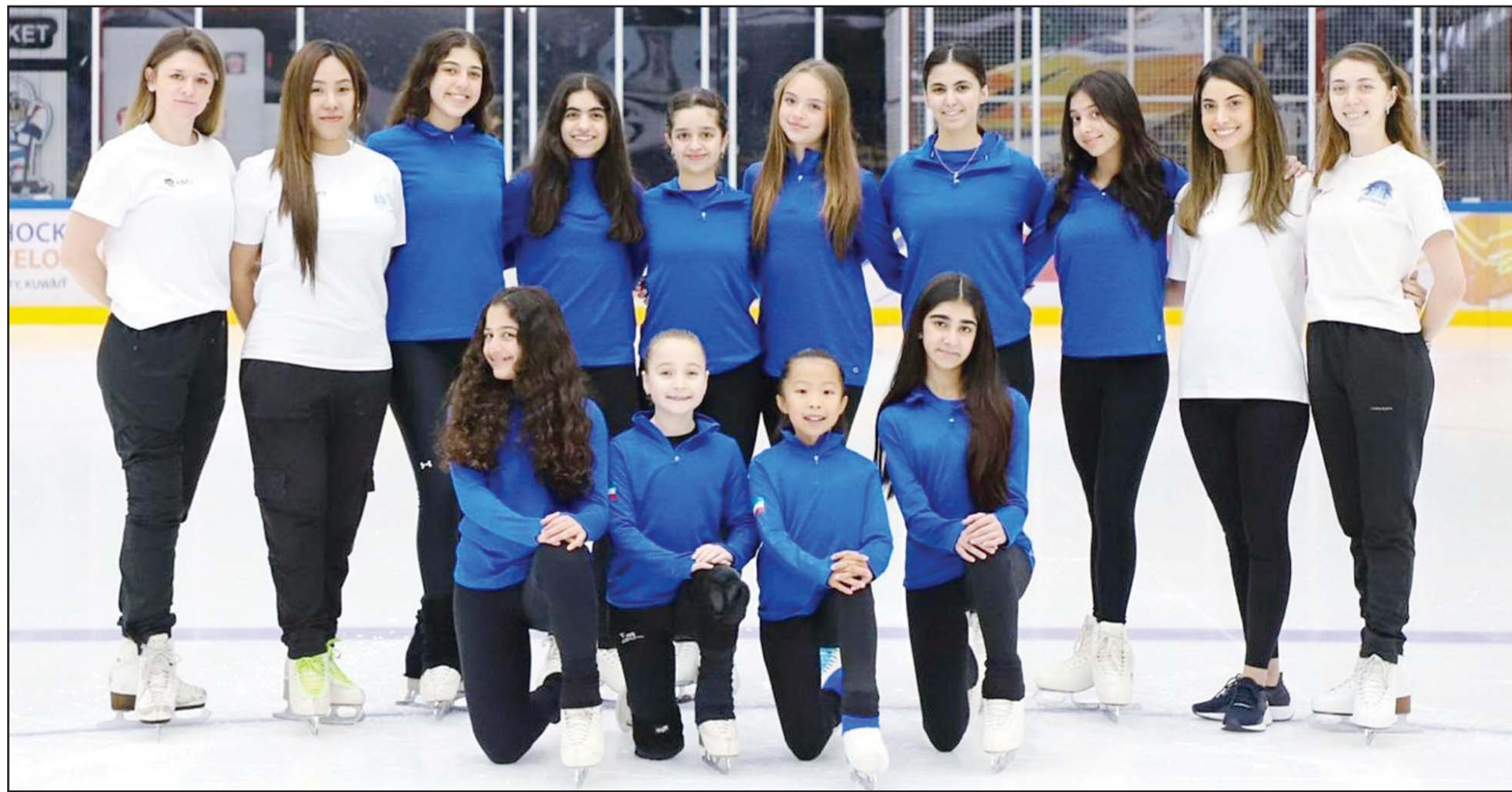
Kuwait's national figure skating team with the training staff.

He grabbed 106 rebounds in seven games against Sacramento, including 90