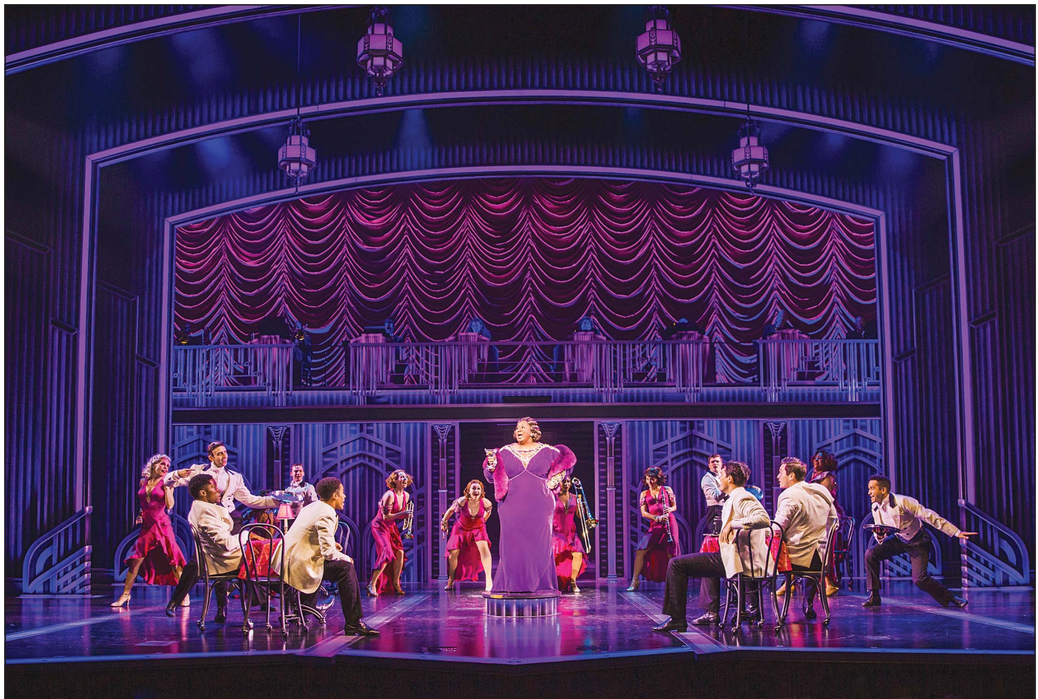
This image released by Polk & Co. shows the cast during a performance of 'Some Like It Hot.' (AP)