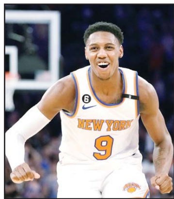
New York Knicks guard RJ Barrett reacts in the second half of Game 2 in the NBA basketball Eastern Conference semifinals playoff series against the Miami Heat at Madison Square Garden in New York.

with 34 on the offensive end and 27 assists in the final five games of that series.