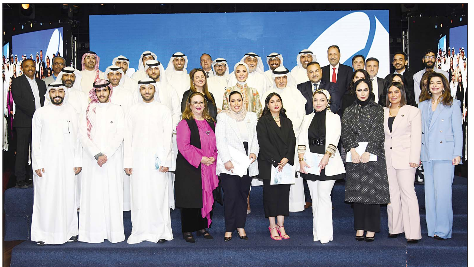
Borgan Bank's Ro2ya graduates

To conclude, talabat social efforts have witnessed high praise and shall continue its social participations and strategic initiatives and support all voluntary work initiatives.