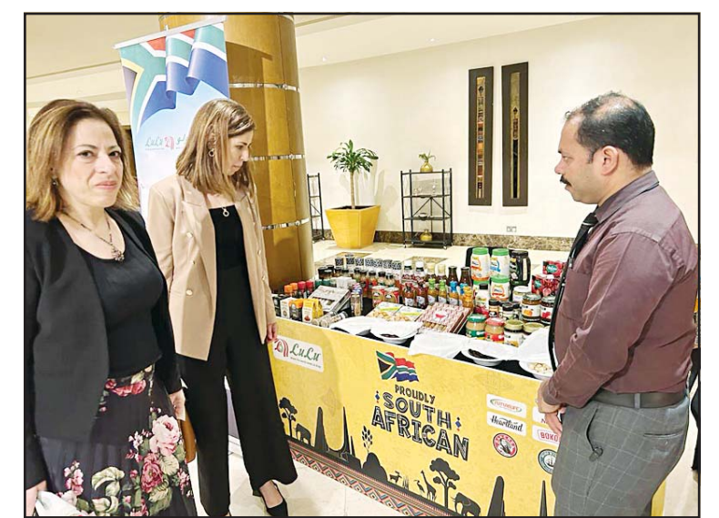
A photo from the event.

Commenting on the event, Director said, "We are honored to be a part of