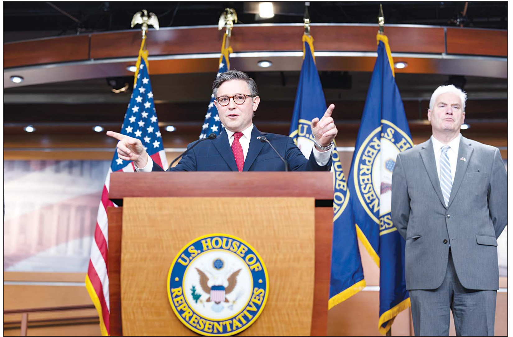
US Speaker of the House Mike Johnson, R-La., joined at right by Majority Whip Tom Emmer, R-Minn., takes questions as he meets with reporters ahead of a crucial vote on a continuing resolution to keep the government funded at its current levels, a measure not heartily supported by the hard right wing of his party, at the Capitol in Washington, on Nov 14.

“At this stage, it is not possible to determine exactly whether and where magma might reach the surface,” the Meteorological Office said.