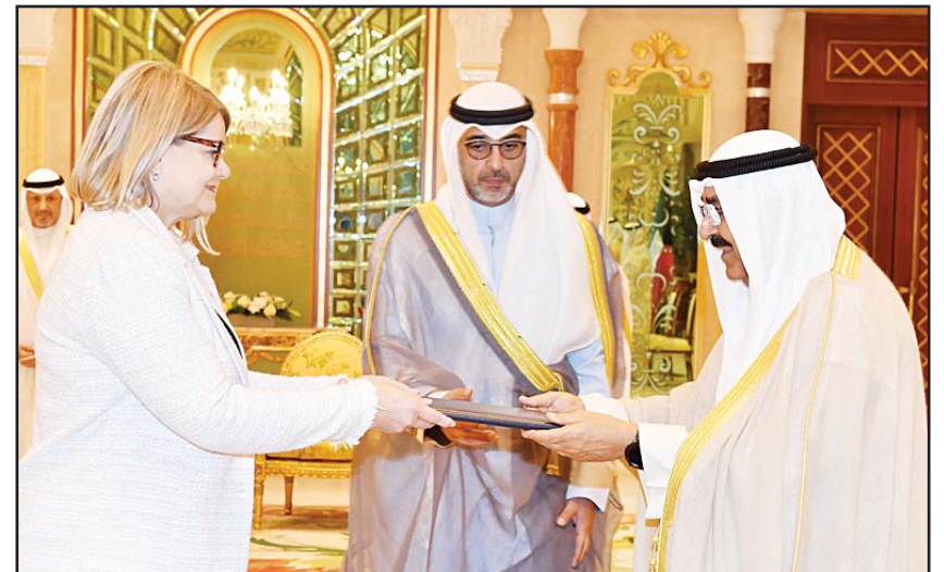
His Highness the Crown Prince receives the credentials of the European Union ambassador.