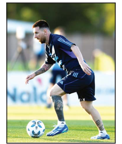
Argentina's Lionel Messi plays the ball during a training session of the national soccer team prior to a qualifying soccer match for the FIFA World Cup 2026, against Uruguay, at the Argentina Soccer Association facilities in Buenos Aires, Argentina.

Messi, who appears to have recovered from a muscle injury in his leg, led Argentina to its third World Cup title last year and has his team in first place in the South American qualifying group for the 2026 tournament. The 36-year-old Suárez has just returned to Uruguay's national team as he nears