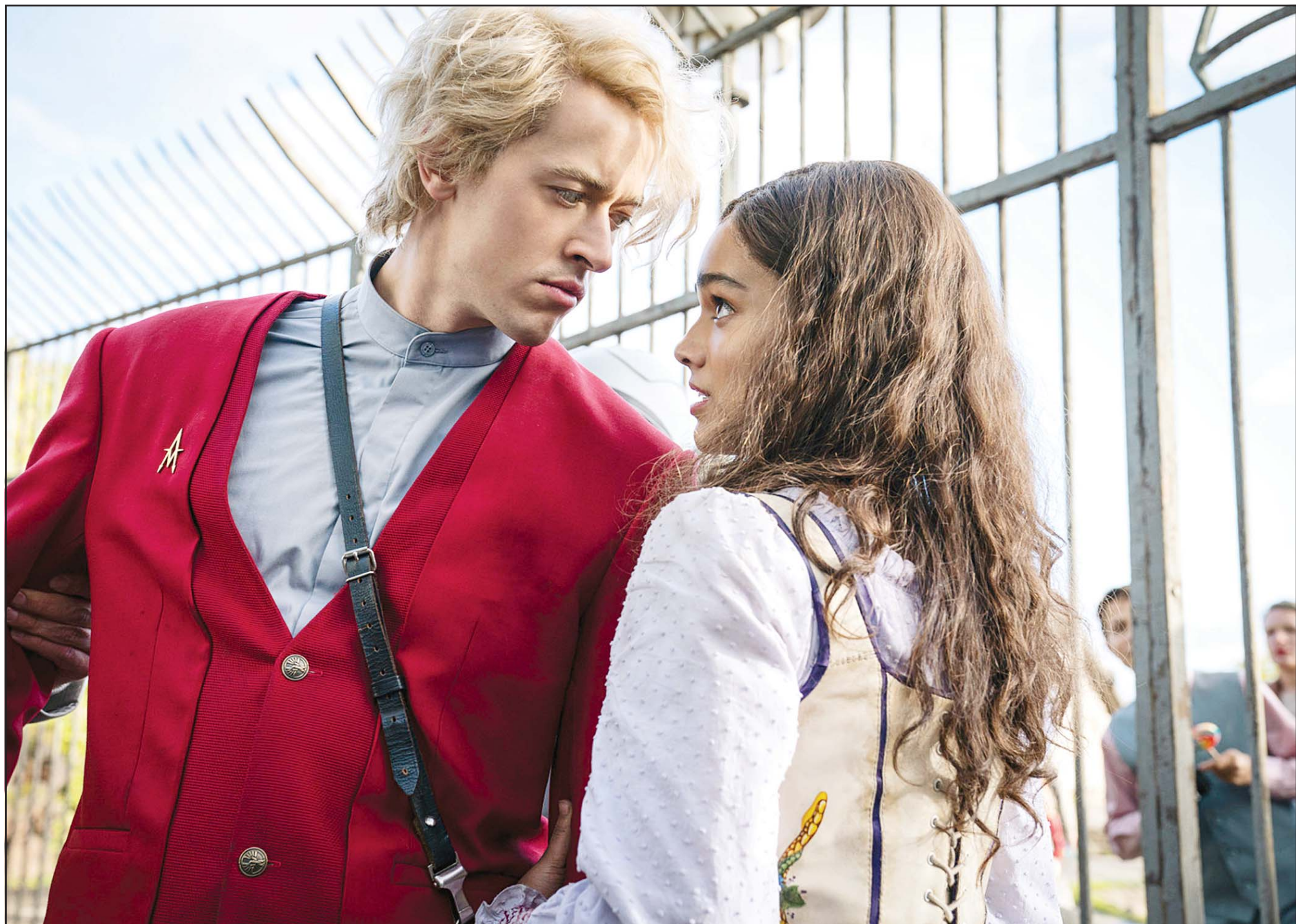
This image released by Lionsgate shows Tom Blyth, (left), and Rachel Zegler in a scene from 'The Hunger Games: The Ballad of Songbirds and Snakes.'