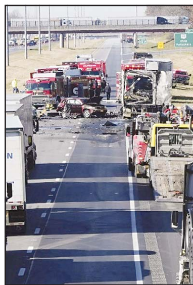
Both directions of Interstate 70 are closed in Licking County, Ohio, near the State Route 310 interchange after a fatal accident on Nov 14. A charter bus carrying students from a high school was rear-ended by a semitruck on the Ohio highway.

The opposition from headline conservatives left Johnson with few other options than to skip what’s typically a party-only procedural vote, and rely on another process that requires a two-thirds tally with Democrats for passage.