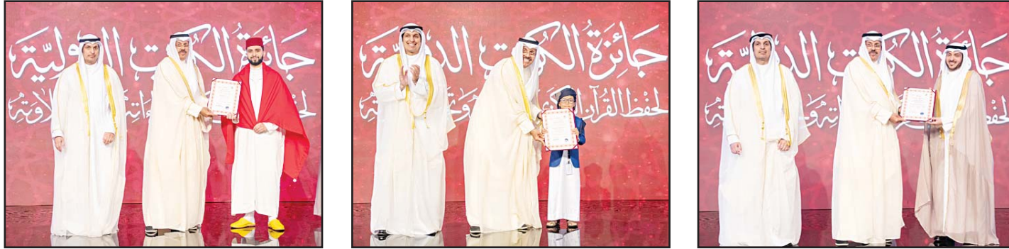
His Highness the Prime Minister Sheikh Ahmad Nawaf Al-Ahmad Al-Sabah awards certificates to the winners.