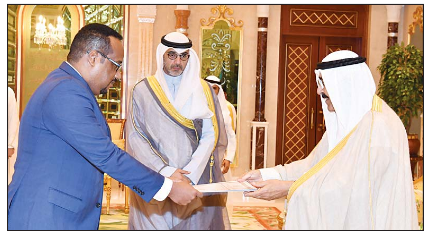
His Highness the Crown Prince receives the credentials of the Ethiopian envoy.

His Highness Sheikh Ahmad Nawaf Al-Sabah expressed gratitude and appreciation for the outstanding efforts put into organizing the competition.