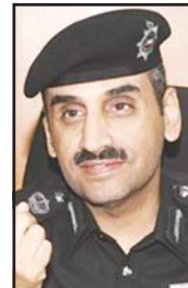
Brig Gen Al-Otaibi

4. What is the beneficial aspect of reciprocity with other countries?