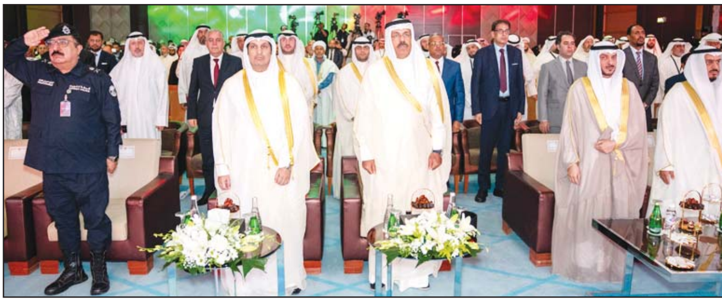
His Highness the Prime Minister Sheikh Ahmad Nawaf Al-Ahmad Al-Sabah and Minister of Information and Minister of Awqaf and Islamic Affairs Abdulrahman Al-Mutairi at the concluding ceremony.