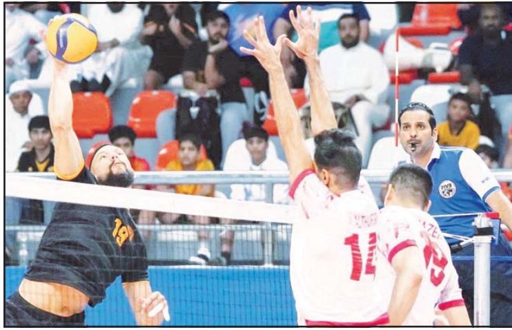
Players vie for the ball.

Kuwait boast six championship titles, Kazma hold two, and Al-Qadsia