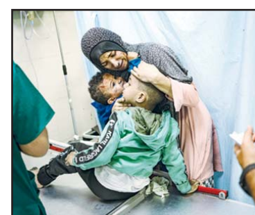
Palestinians wounded in Israeli bombardment of the Gaza Strip are brought to a hospital in Khan Younis, Nov. 15, 2023.

"They are still here," he said by phone from inside the hospital, hours after the raid began. "Patients, women and children are terrified."