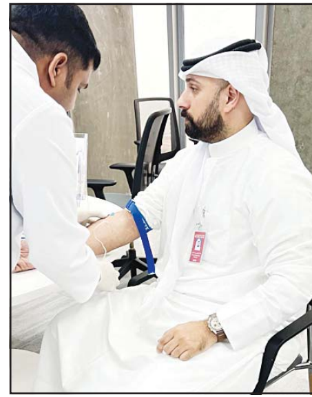
A photo from the Gulf Bank's first Movember campaign.

She concluded by stressing on Gulf Bank's steadfast dedication to sustainability, exemplified by its pursuit of gender equality, with consistent employment benefits for all, and its rigorous adherence to sustainability standards;