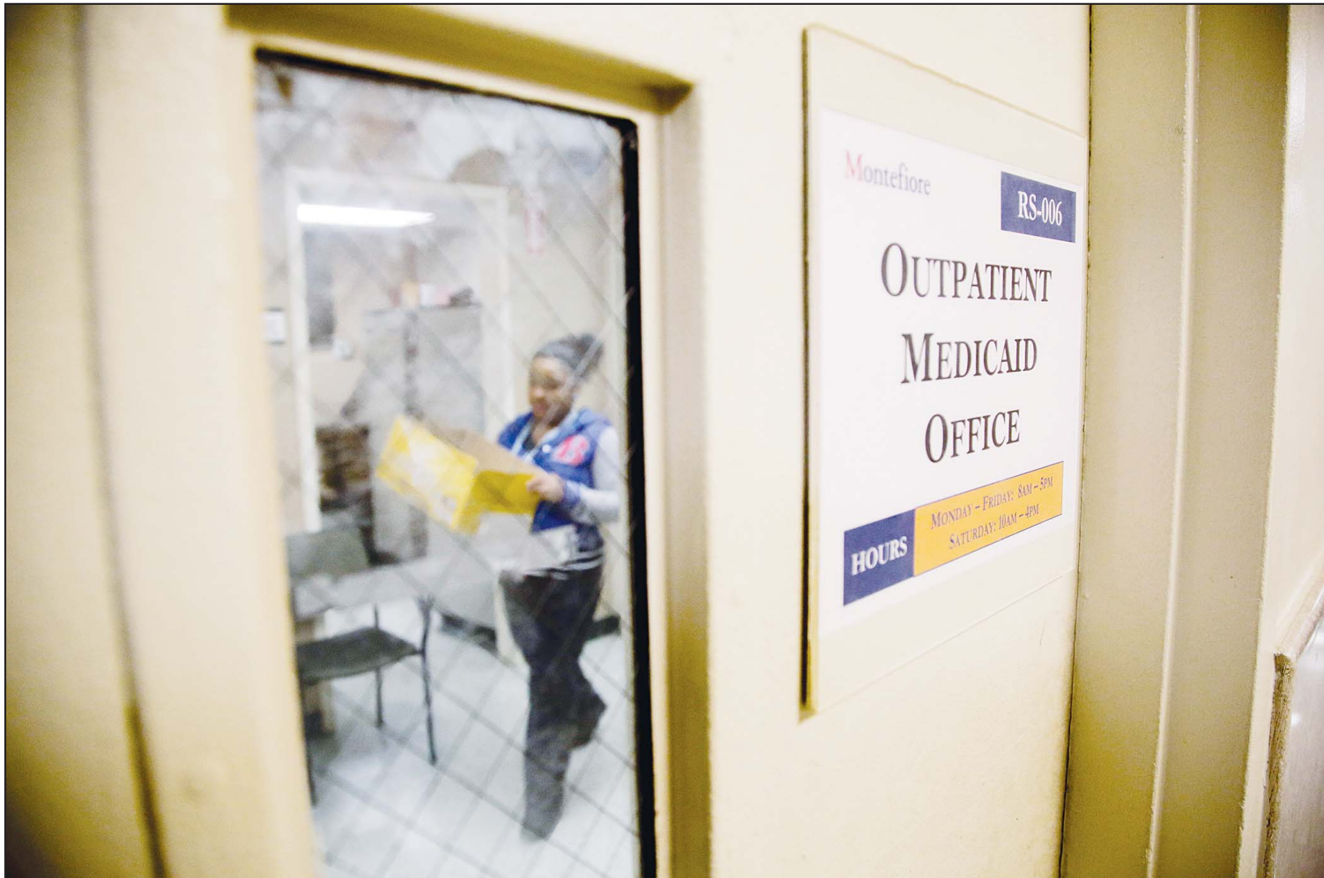
A Medicaid office employee works on reports at Montefiore Medical Center, Nov. 21, 2014, in New York. Error-ridden state reviews have purged millions of the poorest Americans from the Medicaid program, and poverty experts across the country worry the Biden administration is not doing enough to stop them. (AP)

WASHINGTON, Nov 15, (AP): Up to 30 million of the poorest Americans could be purged from the Medicaid program, many the result of error-ridden state reviews that poverty experts say the Biden administration is not doing enough to stop.