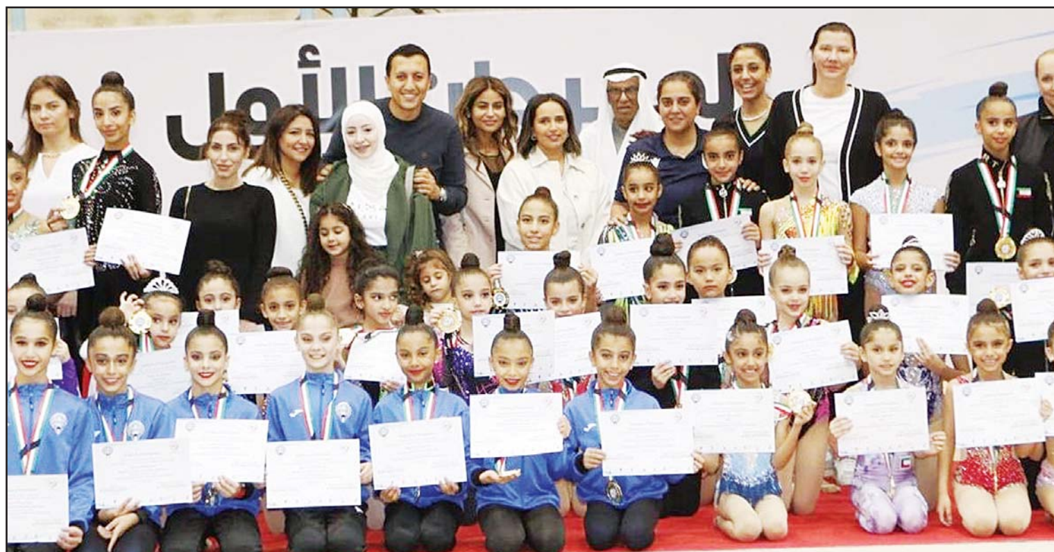
Participants display their certificates at the end of the festival.

He expressed confidence that Saudi Arabia would use all of its capabilities to win the hearts and minds of those having doubts in regard to their abilities.