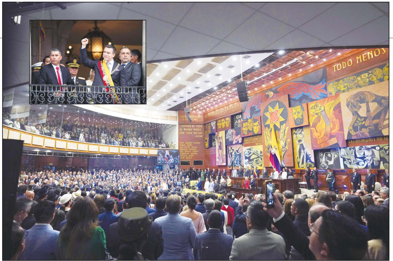
Lawmakers and invited guests attend the inauguration ceremony of President-elect Daniel Noboa, in the National Assembly in Quito, Ecuador on Nov 23. Inset: Noboa waves from a balcony of the Carondelet presidential palace.

The leadup to last Thursday's election was marked by protests against Rajoelina led by opposition candidates. Security forces fired tear gas grenades at the demonstrators and two opposition candidates sustained minor injuries. Some polling stations were torched ahead of the election, which was delayed for a week because of the trouble.