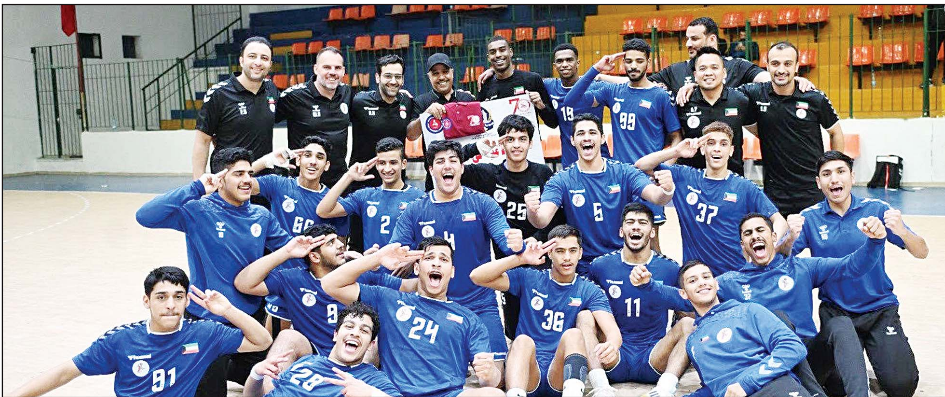
Junior handball team celebrates its bronze medal.

Barcelona was held in check until late in the second half. Minutes after substitute Raphinha hit the post, Lejeune inadvertently turned a cross by Alejandro Balde intended for Robert Lewandowski into his own net in the 82nd.