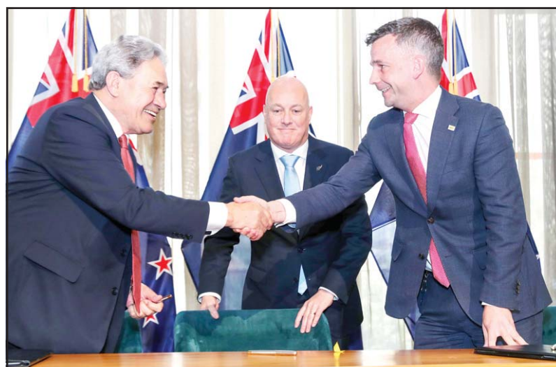
New Zealand Prime Minister-elect Christopher Luxon (centre), watches as his coalition partners, New Zealand First leader Winston Peters (left), and ACT leader David Seymour shake hands following a signing ceremony in Wellington, New Zealand on Nov 24.