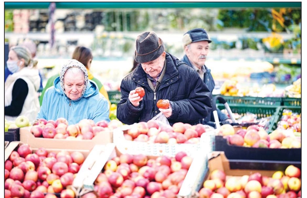
People buy fruits at a hypermarket in Moscow, Russia, on Nov. 3, 2023. The shelves at Moscow supermarkets are full of fruit and vegetables, cheese and meat. But many of the shoppers look at the selection with dismay as inflation makes their wallets feel empty.

That keeps the cost of imports high, even as import possibilities shrink because of Western sanctions.