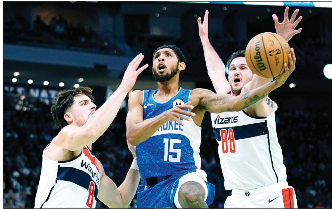
Milwaukee Bucks' Cameron Payne (15) shoots between Washington Wizards' Deni Avdija (8) and Danilo Gallinari (88) during the first half of an NBA basketball In-Season Tournament game Friday, Nov. 24, 2023, in Milwaukee.

his season high with 26 points, Pascal Siakam had 18 and the Toronto Raptors beat Chicago 121-108 in the NBA's In-Season Tournament, eliminating the Bulls for contention.