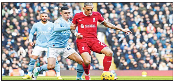
Liverpool's Kostas Tsimikas (right), challenges for the ball with Manchester City's Phil Foden during the English Premier League soccer match between Manchester City and Liverpool at Etihad stadium in Manchester, England.