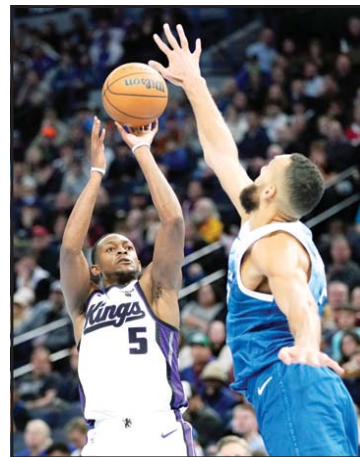
Sacramento Kings guard De'Aaron Fox (5) attempts to shoot as Minnesota Timberwolves center Rudy Gobert, right, defends during the second half of an NBA basketball In-Season Tournament game, Friday, Nov. 24, 2023, in Minneapolis.

Williamson scored nine points in the final 12 minutes as the Pelicans improved to 3-1 in West Group B play.