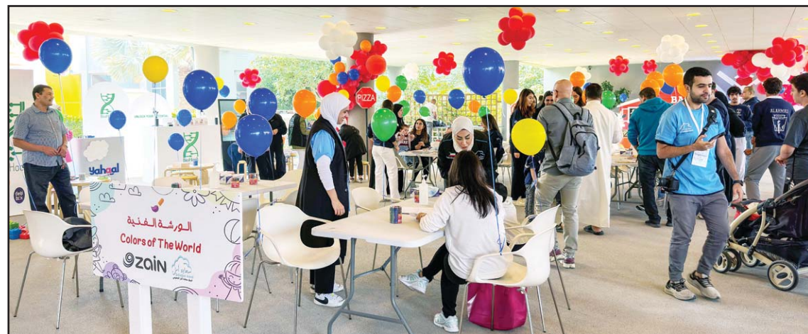
Event's many segments brought joy to the children.

KUWAIT CITY, Nov 25, (KUNA): His Highness the Amir Sheikh Nawaf Al-Ahmad Al-Jaber Al-Sabah sent on Saturday a cable to President of Suriname Chan Sandokhi, congratulating him on his country's National Day.