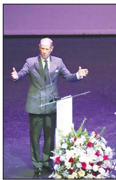
Britain's Prince Edward, Duke of Edinburgh, delivers a speech during the Duke of Edinburgh's International award presentations at the British School, in Jakarta, Indonesia on Nov 24.

In September, senior officials of the three nations agreed to restart the trilateral summit "at the earliest convenient time."