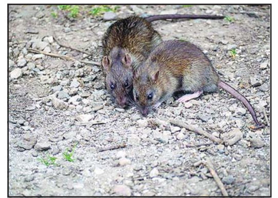
The rodents nibbling on foodstuff.