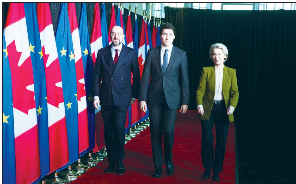
From left: European Council President Charles Michel, Prime Minister Justin Trudeau and European Commission President Ursula Gertrud von der Leyen arrive for a news conference in St. John's, Newfoundland on Friday, Nov. 24, 2023 on the second day of the Canada-EU Summit.