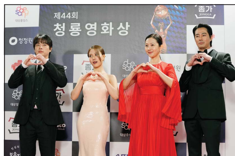
Park Jeong-min, Ko Min-si, Yum Jung-ah and Zo In-sung, (from left to right), pose for photographers upon arrival during the red carpet event for the Blue Dragon Film Awards in Seoul, South Korea, Friday, Nov. 24.

President Joe Biden and his wife Jill called NBC during the parade. The president told Al Roker that people should take a moment to be thankful to live in a country with so much.