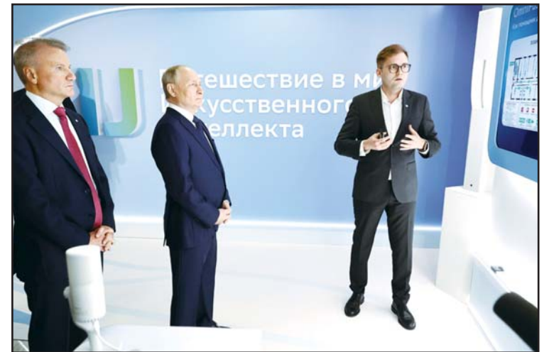
Russian President Vladimir Putin, center, and Sberbank CEO German Gref, left, visit an exhibition of an artificial intelligence conference AI Journey in Moscow, Russia, Friday, Nov. 24, 2023. Putin says he will endorse a national strategy for the development of Artificial Intelligence, emphasizing that it's essential to prevent a Western monopoly.

"When they feel the threat of its uncontrolled spread, uncontrolled activities in this sphere, a desire to reach agreement will come immediately," he said.