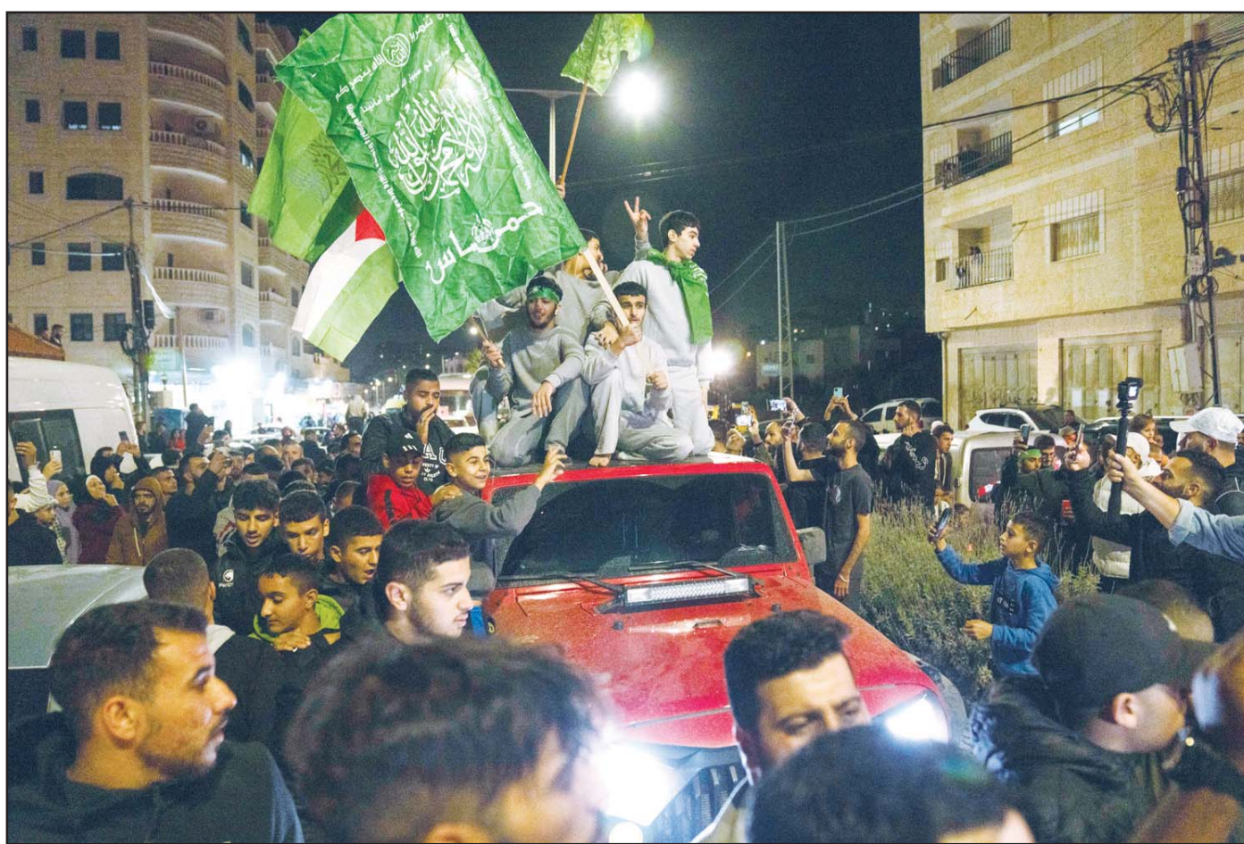
Former Palestinian prisoners who were released by the Israeli authorities, fly Palestinian and Hamas flags while they ride on top of a vehicle upon their arrival in the West Bank town of Beitunia, Friday, Nov. 24, 2023.

For the first time in over a month, aid reached northern Gaza, the focus of Israel's ground offensive.