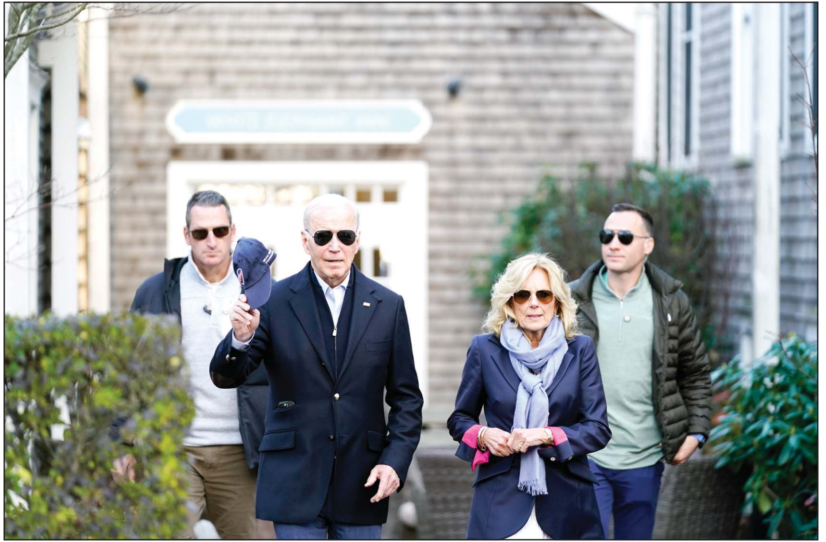
US President Joe Biden and First Lady Jill Biden visit shops in Nantucket, Mass. on Nov 24.