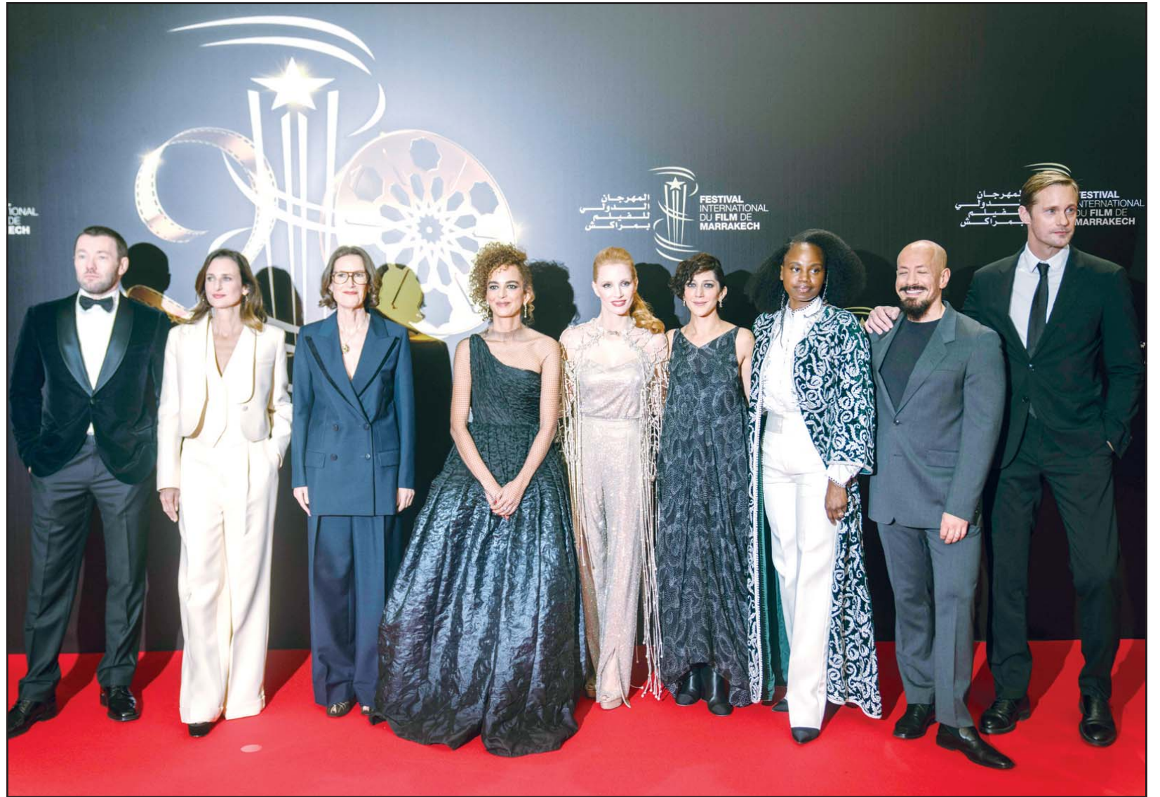
The jury of the Marrakech International Film Festival pose for photos on the red carpet on the opening ceremony, in Morocco, Friday, Nov. 24.

The woman is seeking damages to be determined at trial, the suit says.