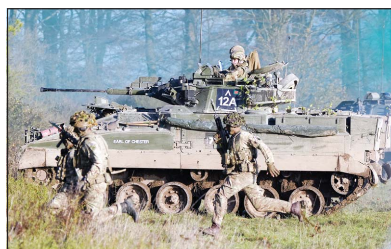
Britain’s Prince William, the Prince of Wales and Colonel-in-Chief, 1st Battalion Mercian Regiment, rides in a Warrior Armoured Fighting Vehicle as he takes part in an attack exercise during a visit to the regiment, in the south west of the UK, during a visit to the regiment, for the first time following his appointment to the role by King Charles III, in Salisbury, England on Nov 23.