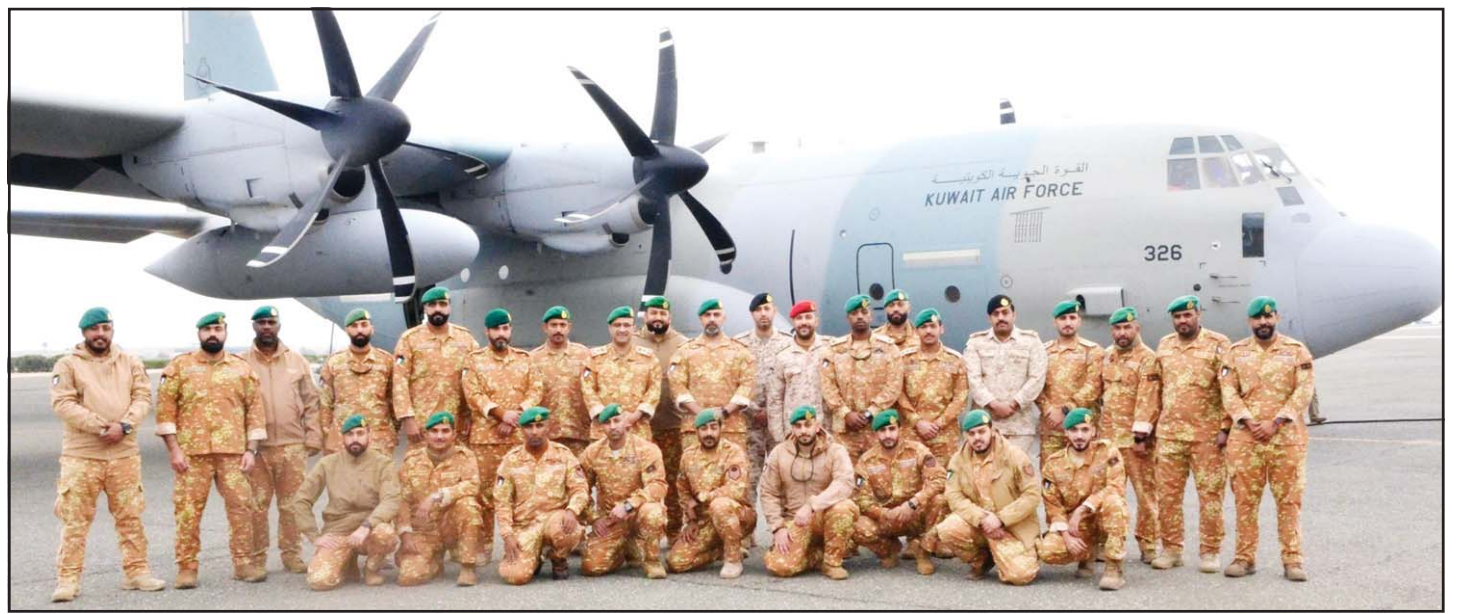
Force from the 25th Commando Brigade upon departure for Pakistan.

She concluded by saying that she is really happy to be in Kuwait. "I have already met many Kuwaiti friends from all walks of life and I look forward to working with Kuwaitis to strengthen EU-Kuwait partnership," she stated.