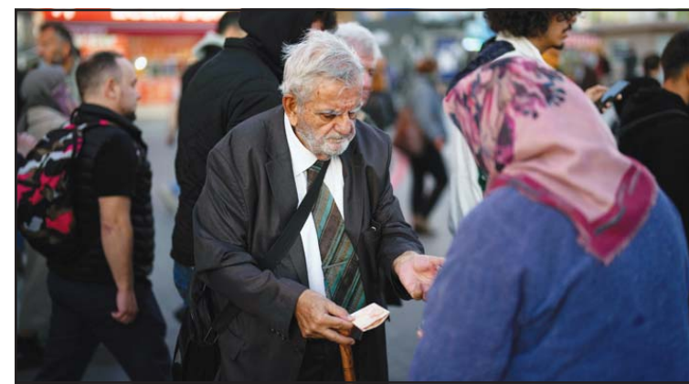
A man purchases food from a street vendor at Kadikoy ferry terminal in Istanbul, Thursday, Nov. 16, 2023. Turkey's central bank delivered another huge interest rate hike on Thursday, Nov. 23, 2023 continuing its effort to curb double-digit inflation that has left households struggling to afford food and other basic goods.

Under Erkan's tenure, the central bank has hiked its main interest rate from 8.5% to 40%.