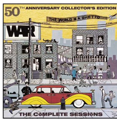
This image released by Far Out Productions shows ‘The World Is a Ghetto’ by War, the 50th Anniversary Collector’s Edition. (AP)