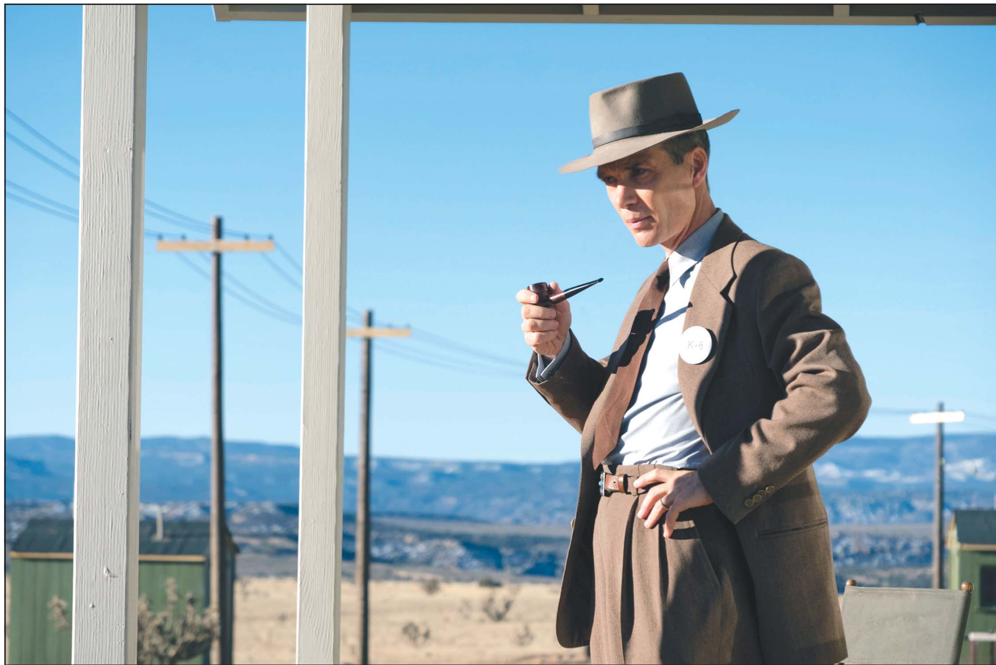
This image released by Universal Pictures shows Cillian Murphy in a scene from 'Oppenheimer.' (AP)