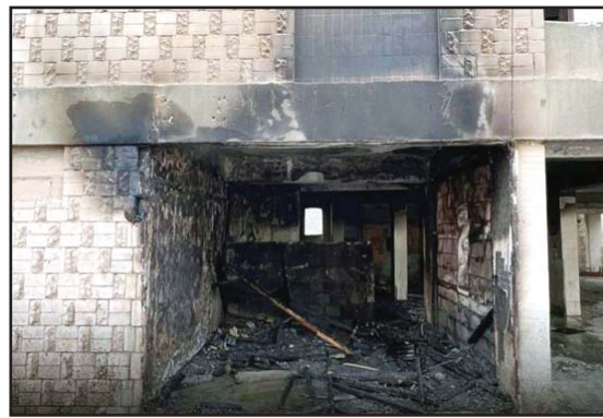
Damage caused by the fire.