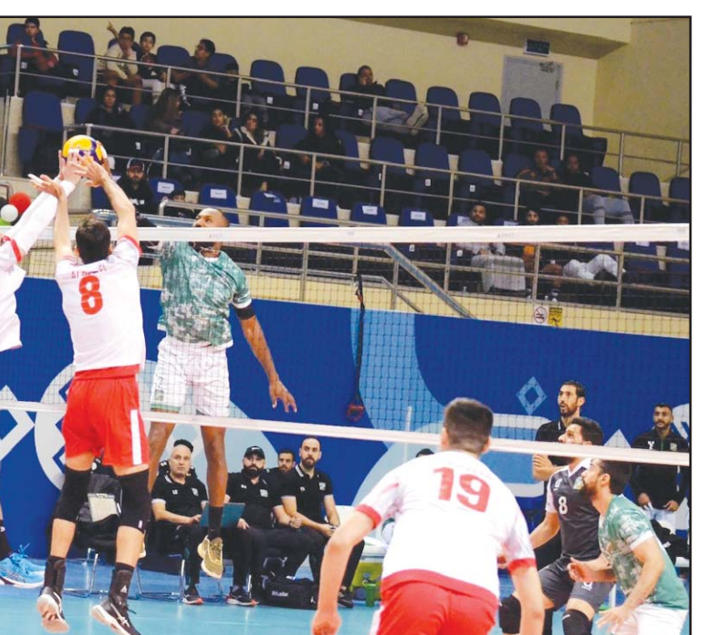
Players battle for the ball during the volleyball league.