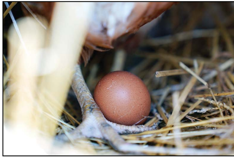
A hen stands next to an egg, Jan. 10, 2023, at a farm in Glenview, Ill. More than 1.3 million chickens are being slaughtered on an Ohio egg farm as the bird flu continues to take a toll on the industry.

US health officials recalled three more brands of whole and pre-cut cantaloupes Friday as the number of people sickened by salmonella more than doubled this week.