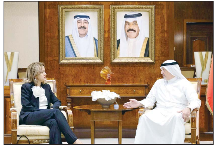
French Ambassador Le Flecher.

In turn, the head of the Municipal Council, Abdullah Al-Mahri, said in a statement to Al-Rai that the master plan will serve as a road map for building a "new Kuwait" in line with the huge development projects included in the government's action plan, in addition to the memorandums of understanding that were signed with China, stressing the necessity of immediate meetings should be held between the municipality and the rest of the government agencies to formulate general policy to implement the content of the plan.