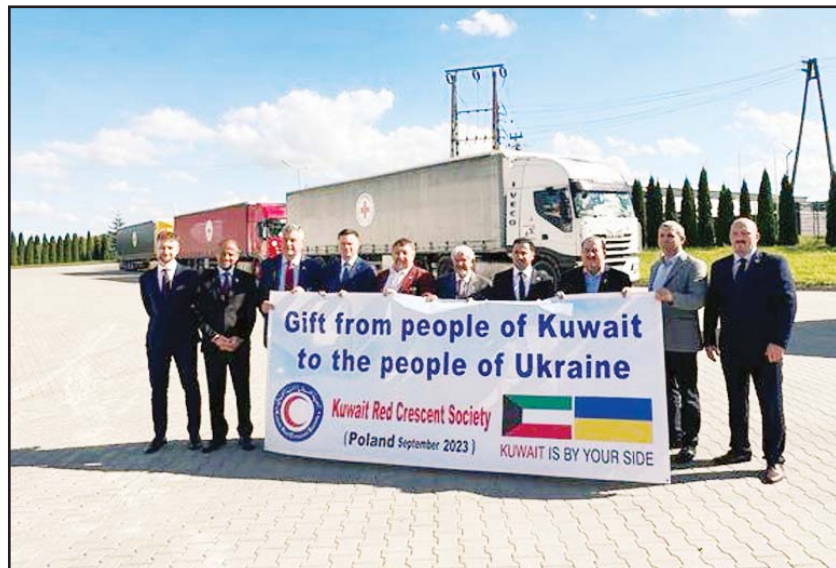
A new batch of Kuwaiti relief aid to help refugees from Ukraine.

and needy families, noting that the campaign aims to collect KD 750,000 about (USD 2.4 million) to pay school fees for 3,000 students at an amount of KD 250 for each student, he said. Among the sponsors, Minister of Social Affairs, Family and Childhood Affairs, Kuwait Banking Association, the General Secretariat of Endowments and the Zakat House, in addition to 15 associations and other charitable bodies, noting that the campaign would be in several locations to collect donations, in the Mubarakia School, Al-Babtain Library, the National Library, and Bait Al-Othman. (KUNA)