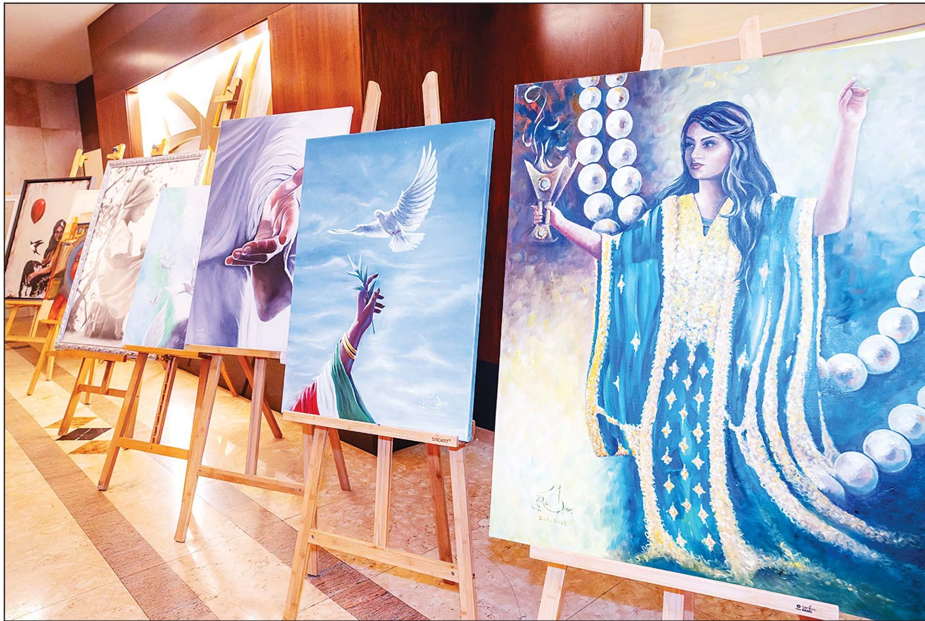
Paintings on display at the art exhibition themed around peace, titled 'The Feather of Peace', with the participation of numerous artists who presented expressive paintings in alignment with the ceremony's objectives. - See Page 5

A U.N.-brokered cease-fire had already largely halted the violence, and Yemen has seen only sporadic clashes since the truce expired nearly a year ago. But diplomats have warned that the situation remains volatile.