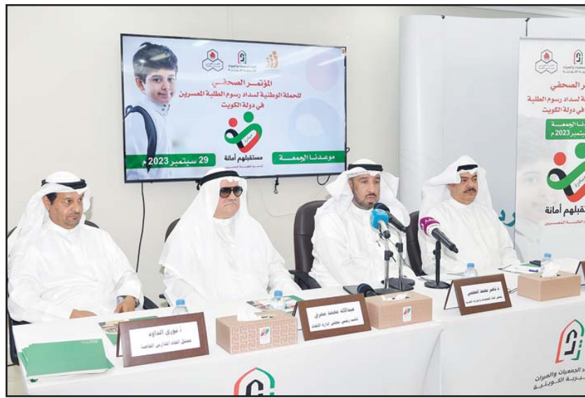
The press conference in progress.