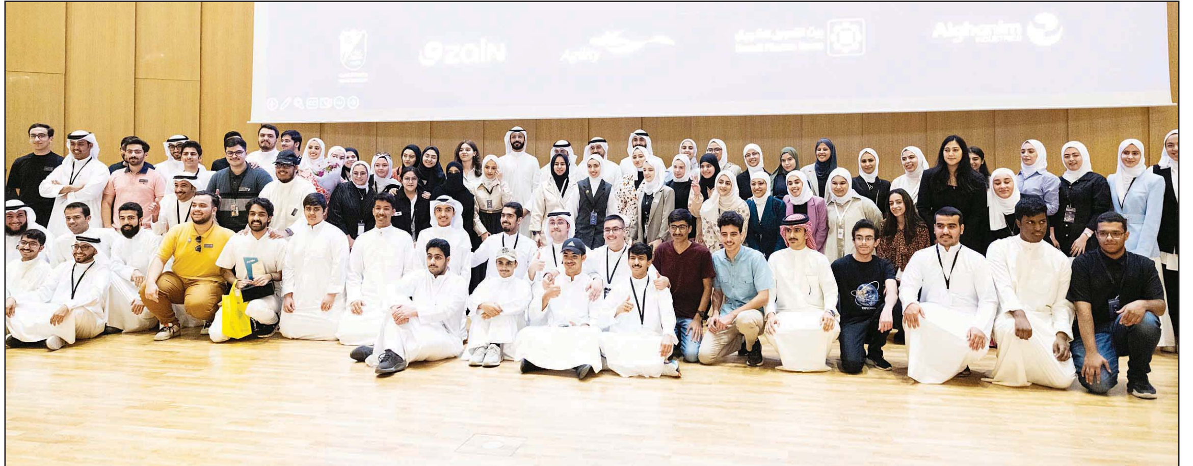
Kuwait Codes participants.