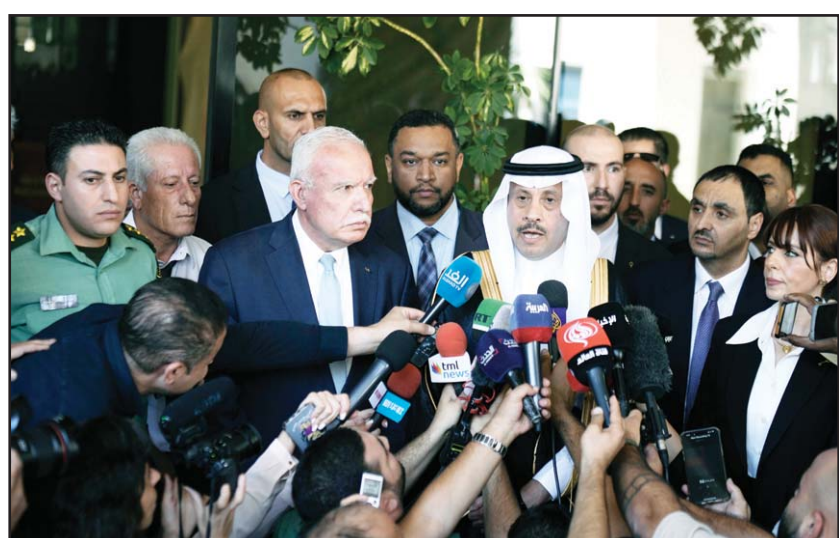
Nayef al-Sudairi, Saudi Arabia's first-ever ambassador to the Palestinian Authority (right), and Palestinian Minister of Foreign Affairs and Expatriates, Dr. Riyad Al-Maliki (left), make a joint statement after their meeting in Ramallah, Tuesday, Sept. 26, 2023.

The hospital, he has added, already has a special ward, called "the virtual division," where doctors are trained on state of art techniques.