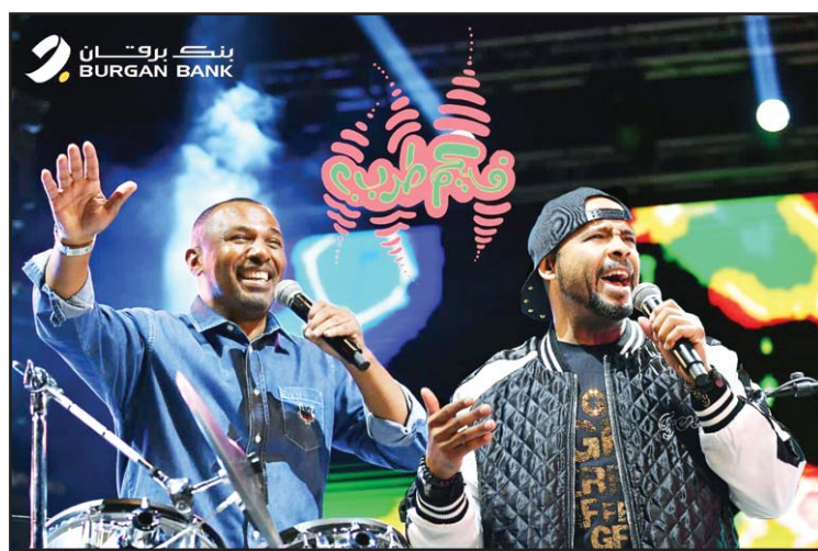
Miami – Burgan concert poster

ABK is a strong supporter of Central Bank of Kuwait and Kuwait Banking Association's 'Let's Be Aware' awareness campaign. Through its various initiatives, the Bank aims to promote financial inclusion by educating Kuwaiti society about customer rights, responsibilities, and the different types of banking and special needs services. Additionally, ABK consistently provides strategic information on how