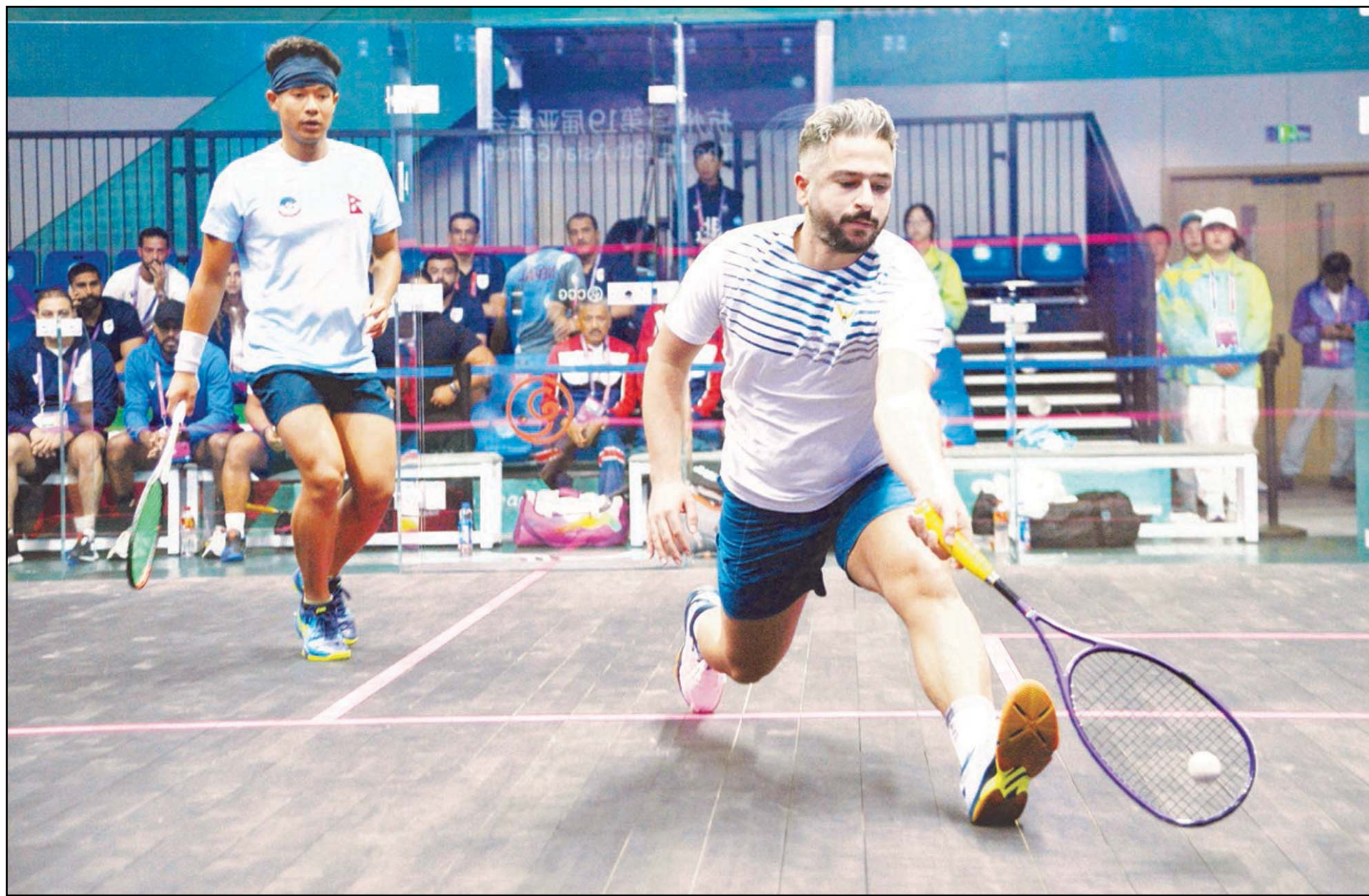
Kuwait's Al-Muzayen in action during squash match at the Asian Games.