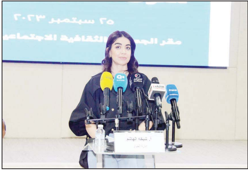
One of the speakers at the gathering.

BIOMETRIC/FINGERPRINT APPOINTMENT: https://meta.e.gov.kw/En/