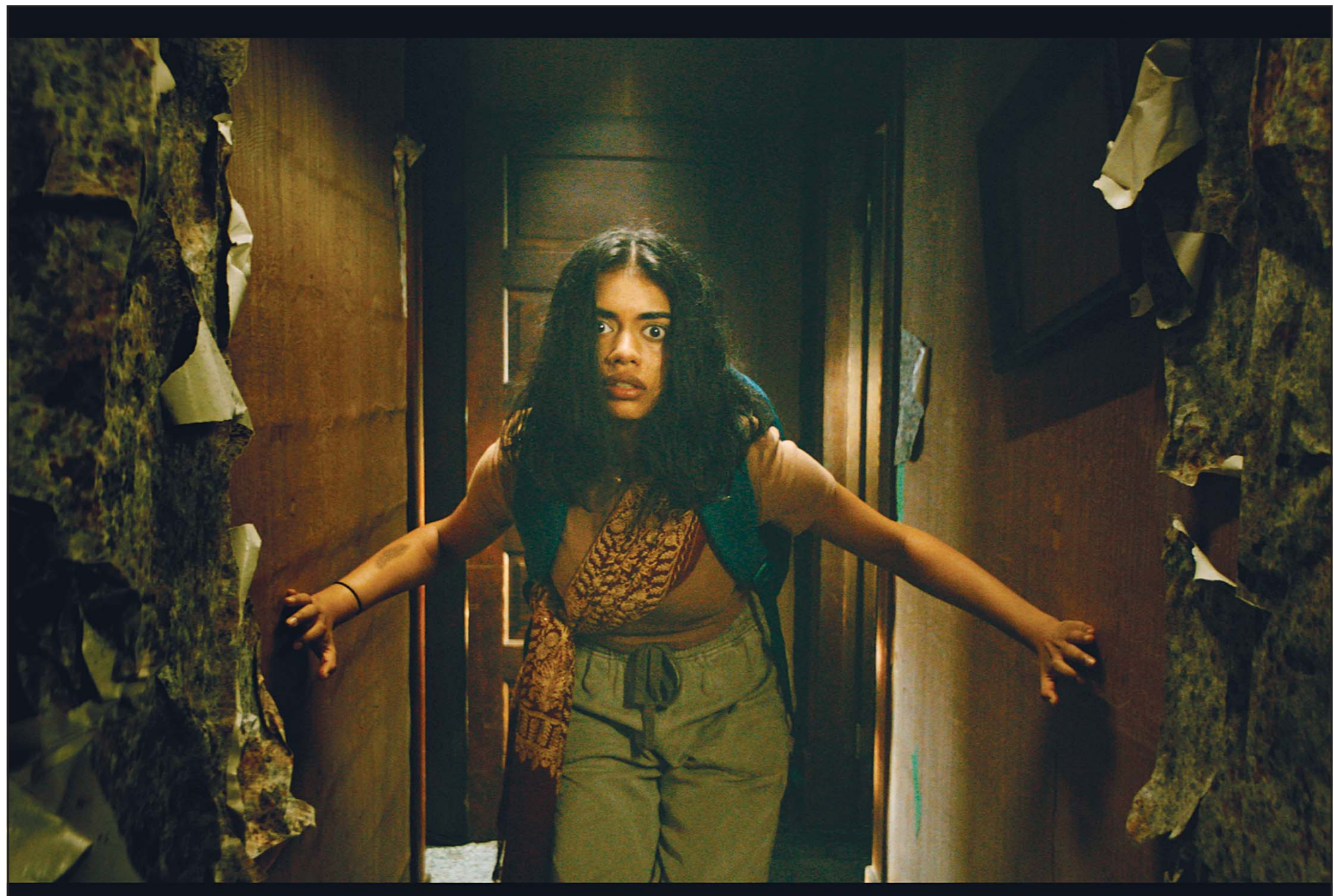
This image released by Neon shows Megan Suri in a scene from 'It Lives Inside.'