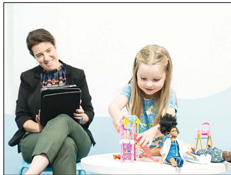
The latest peer-reviewed findings from the third year of the study from Cardiff University suggest that doll play could be a beneficial playtime experience for children with varying social communication styles, including those who display neurodivergent traits commonly associated with autism.

The team of neuroscientists used state-of-the-art functional, near-infrared spectroscopy equipment to explore brain activation while children played with dolls and on tablets, both by themselves and with another person, replicating conditions from Year 1.