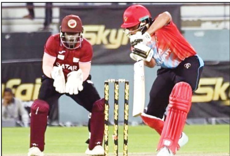
A Kuwaiti bats during the cricket match against Qatar.