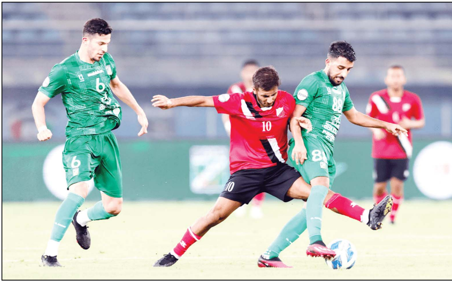
Al Arabi and Khaitan players battle for the ball.