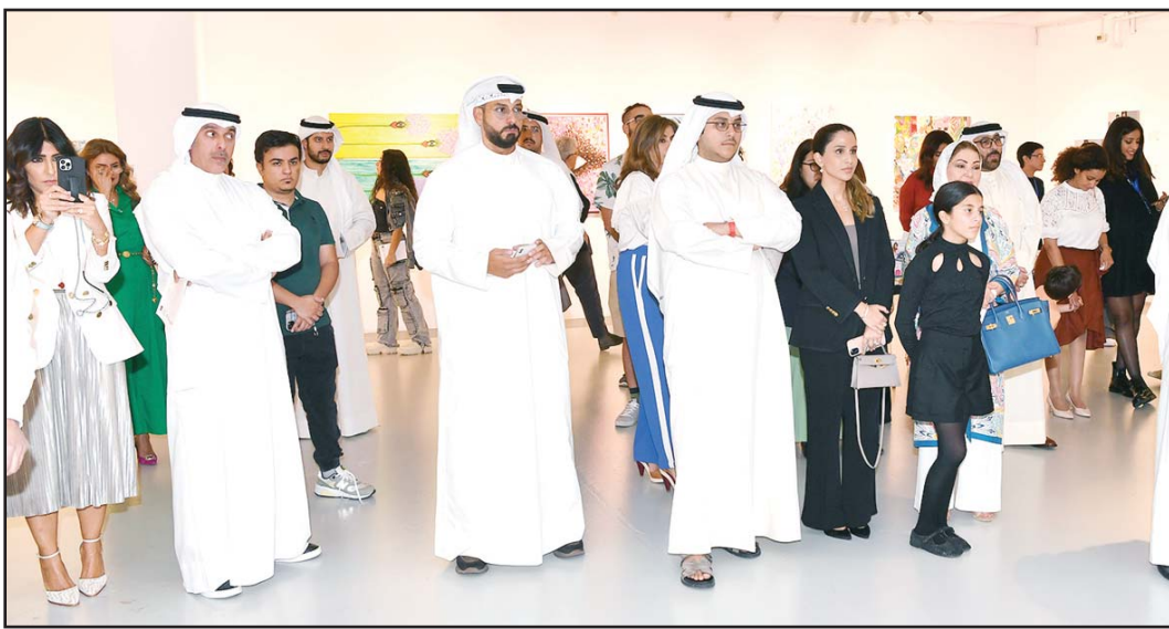
Opening of the charitable art exhibition 'Drawings of Hope'.

He welcomed the General Conference's adoption of the decision to re-appoint Mr. Rafael Grossi as Director-General of the International Atomic Energy Agency for a second term of four years, expressing Kuwait's support for the efforts made by Mr. Grossi, including his appreciated efforts towards strengthening the agency's role to protect all nuclear sites, preventing a nuclear accident that threatens international peace and security.