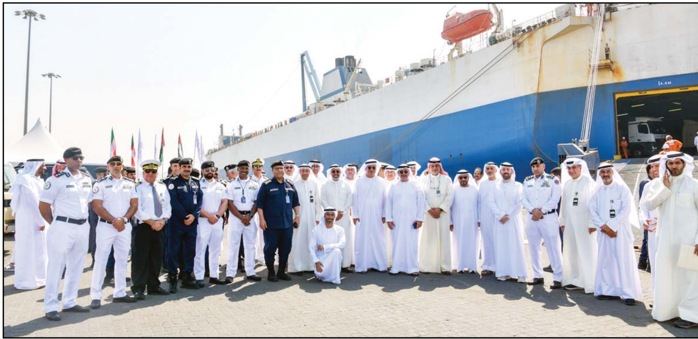
Minister of State for Municipal Affairs and Minister of State for Communications Affairs Fahad Al-Shula in a group photo during the inauguration of the new route between Kuwait's Shuwaikh and UAE's Khalifa ports.

Bahman provided traffic safety tips and instructions to students, underlining the importance of compliance. He mentioned a proposal to link a student's academic performance with their behavior on the road within the university city, wishing safety for all Sabah Al-Salem University City visitors.