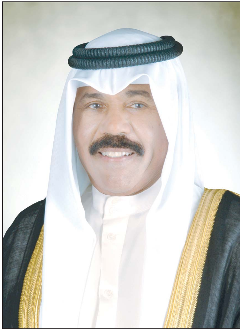
His Highness the Amir Sheikh Nawaf Al-Ahmad Al-Jaber Al-Sabah