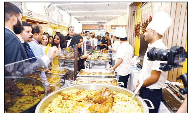
Top and above: Some photos of the event