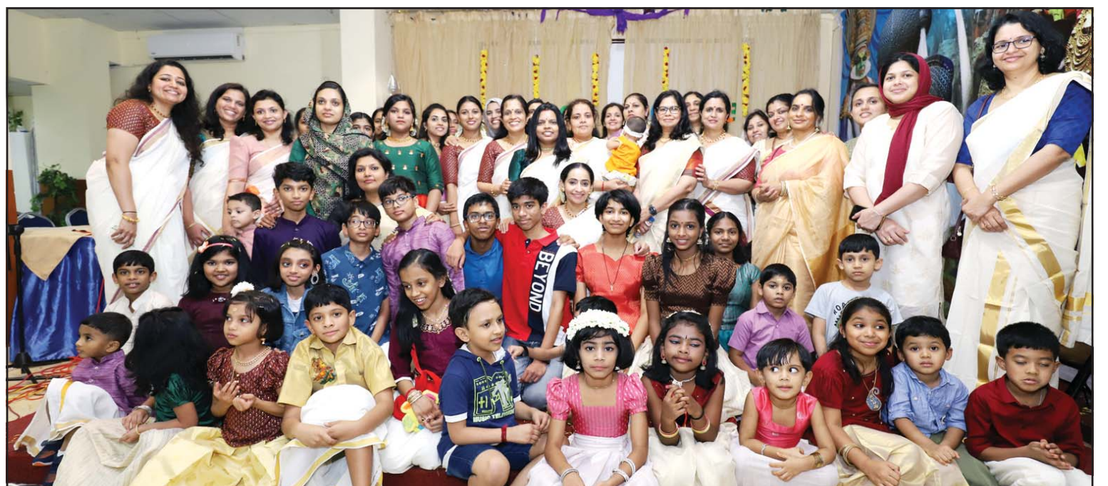
A group photo from the event.