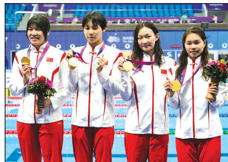
Gold medalist Team China celebrates during the victory ceremony for the women's 4x200m freestyle relay swimming at the 19th Asian Games in Hangzhou, China.

China plays Vietnam on Friday for the bronze, while South Korea and Taiwan will battle for gold.