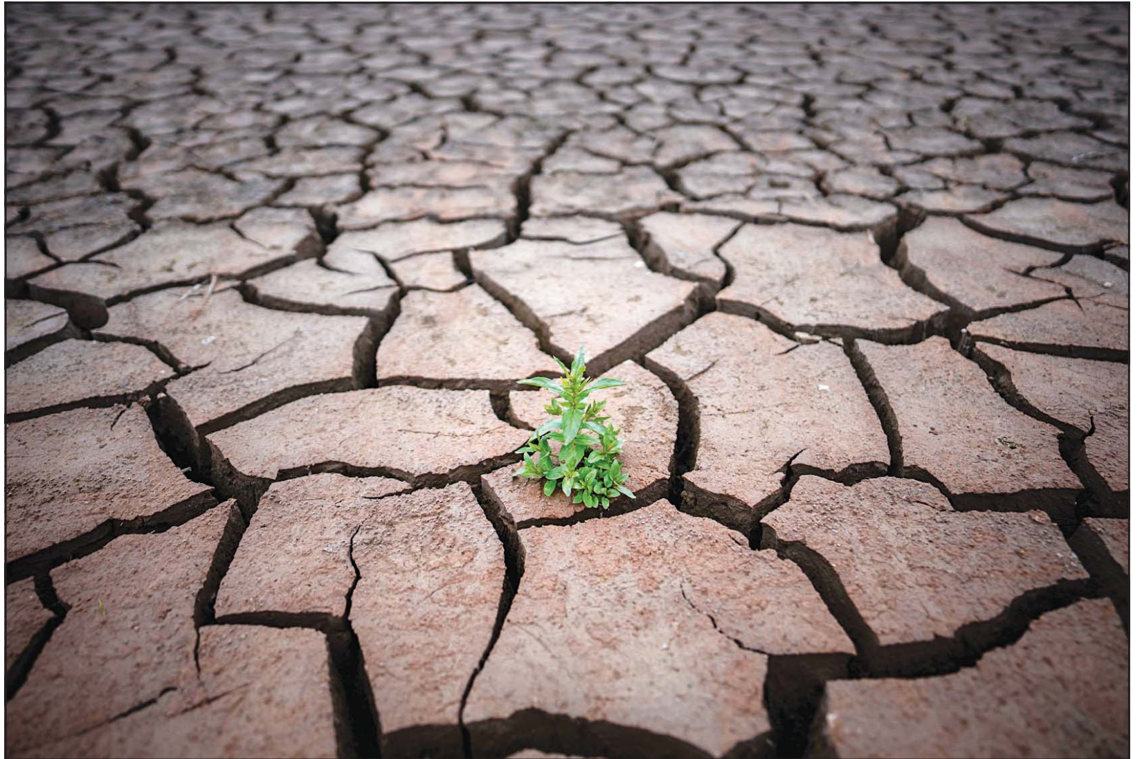
A plant is photographed on a cracked earth after the water level has dropped in the Sau reservoir, about 100 km (62 miles) north of Barcelona, Spain, on April 18, 2023. Six young people from Portugal are arguing on Wednesday, Sept. 27, that governments across Europe aren't doing enough to protect people from the harms of climate change at the European Court of Human Rights.

Arguing that their rights to life, to privacy and family life, and to be free from discrimination are being violated, the plaintiffs hope a favorable ruling will force governments to accelerate their climate efforts.