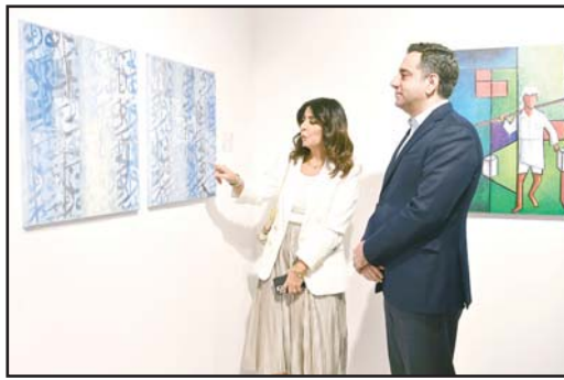
Side of the exhibition