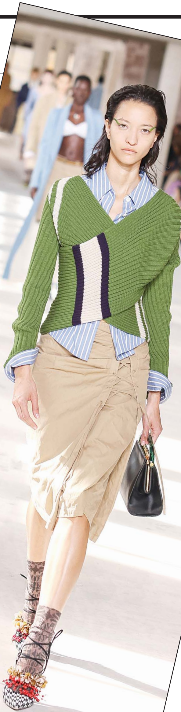
Dries Van Noten

Above and below: Models wear creations for the Undercover, Balmain and Dries Van Noten Spring/Summer 2024 womenswear fashion collections presented Sept 27, in Paris. (AP)