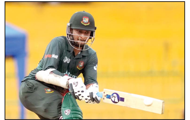
Bangladesh's Shakib Al Hasan plays a shot during the Asia Cup cricket match between Bangladesh and India in Colombo, Sri Lanka.