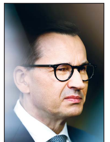
Poland's Prime Minister Mateusz Morawiecki talks to journalists as he arrives for the third EU-CEL-AC summit in Brussels, Belgium, Tuesday, July 18, 2023. Polish and U.S. officials signed an agreement Wednesday, Sept. 27, 2023 in Warsaw for the construction of Poland's first nuclear power plant, part of an effort by the Central European nation to move away from polluting fossil fuels.

Even the Greens party is divided on the matter. That is a reflection of how fears of climate change have persuaded some environmentalists around the world to embrace nuclear power as a solution, because it doesn't involve the burning of fossil fuels.