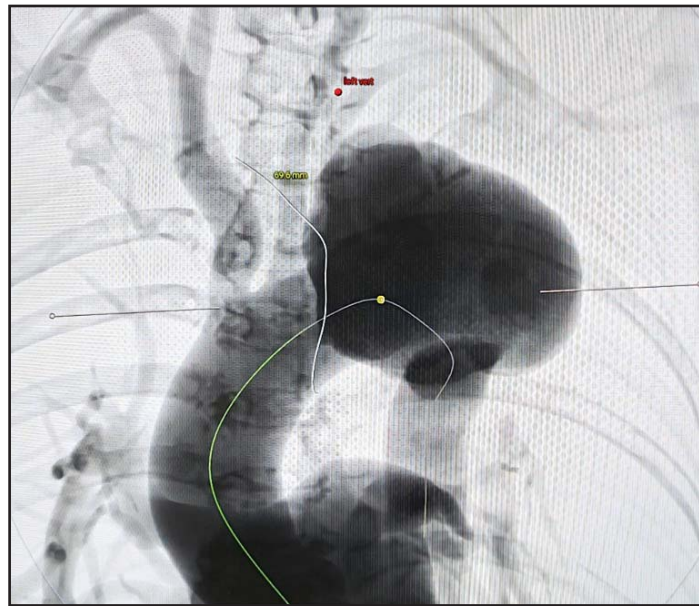
Aortic arch catheterization

He highlighted that this cutting-edge technology is typically available only in select hospitals worldwide. Jaber Al-Ahmad Hospital began employing branched stents in 2020 and has continuously adopted the latest international