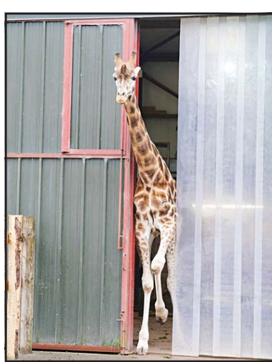
Endangered Rothchild's giraffe Sifa settles into his new home in Blair Drummond Safari and Adventure Park, after traveling from Dublin Zoo, becoming the first male giraffe to call the park home in a decade, near Stirling, Scotland, Sunday, Sept. 24.