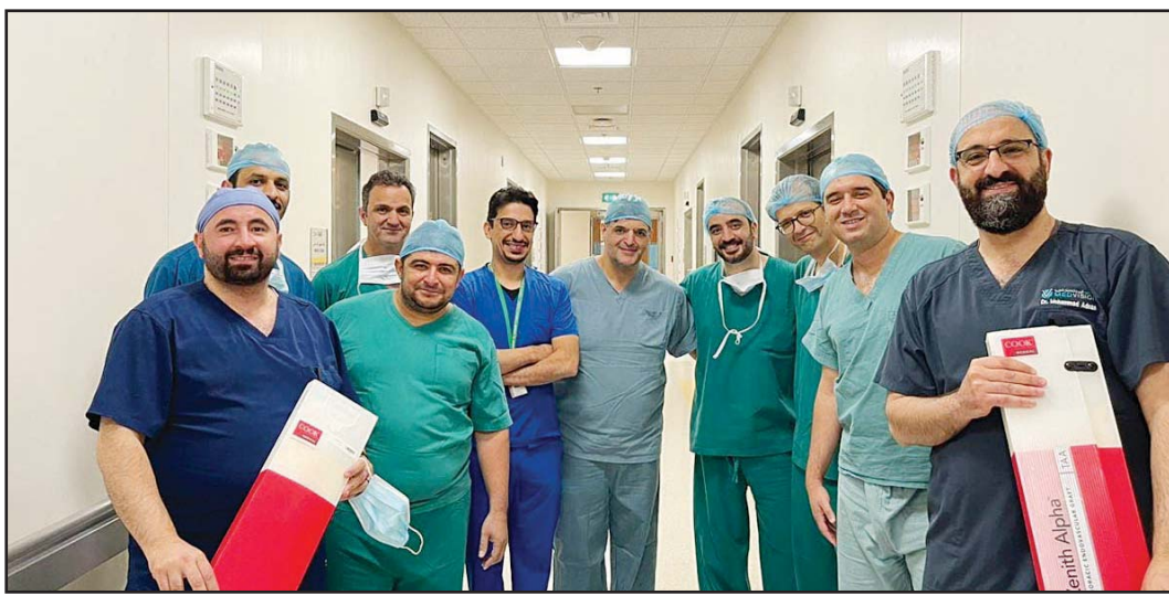
The medical team in the vascular unit at Jaber Hospital.

The #UseHeart movement is also a celebration of the strides made in raising awareness, improving and expanding treatments, and using telemedicine and other digital interventions."