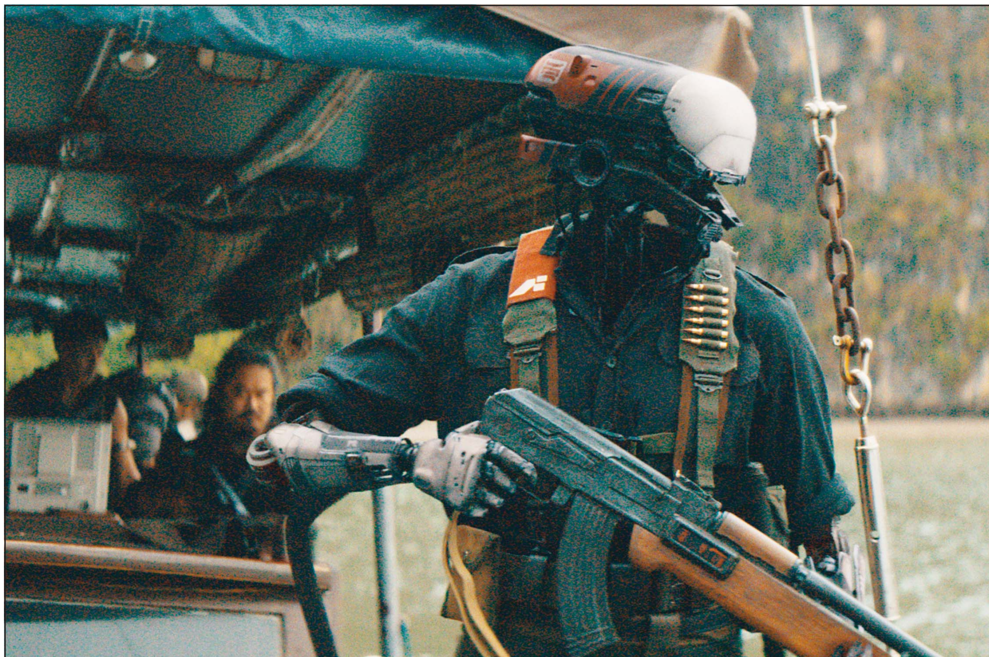
This image released by 20th Century Studios shows a scene from 'The Creator.' (AP)