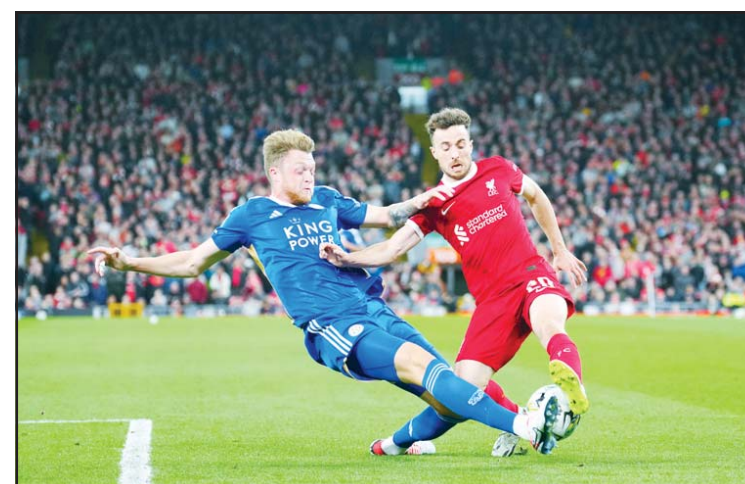
Liverpool's Diogo Jota, (right), fights for the ball with Leicester's Harry Souttar during the English League Cup third round soccer match between Liverpool and Leicester City at the Anfield stadium in Liverpool, England.

Man City won the League Cup five times in six seasons through 2021 and now has been eliminated in three