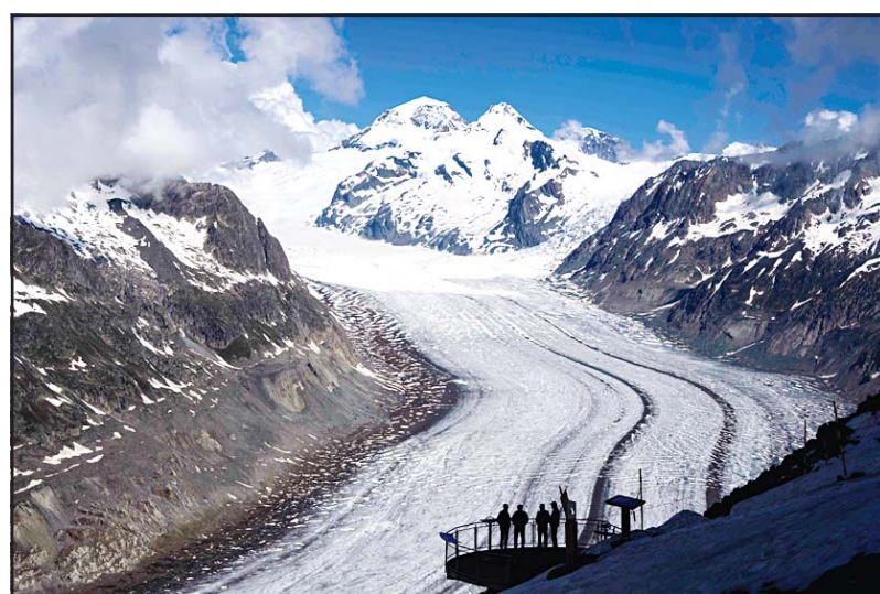
People enjoy the view at the Aletsch Glacier near Goms, Switzerland, June 14, 2023.