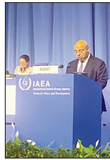
Kuwait's Ambassador to Austria and Permanent Representative to the United Nations organizations in Vienna Talal Sulaiman Al-Fassam speaking at the 67th session of the IAEA General Conference.

He pointed to Kuwait's contribution to the three phases of the program to modernize the IAEA's atomic laboratories in Seibersdorf, Austria, wishing the success and completion of the modernization program.