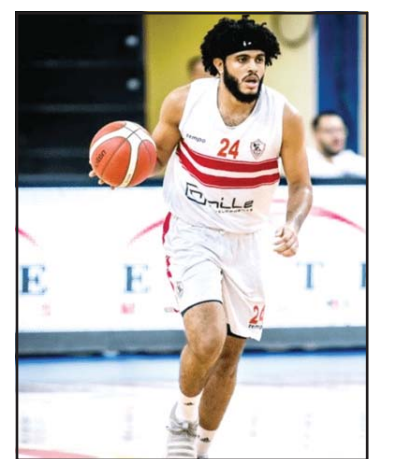
Al-Arabiya player dribbles the ball.

The tournament brings together eight teams representing seven dif-