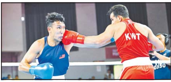
A Kuwaiti boxer punches an opponent during a bout in China.