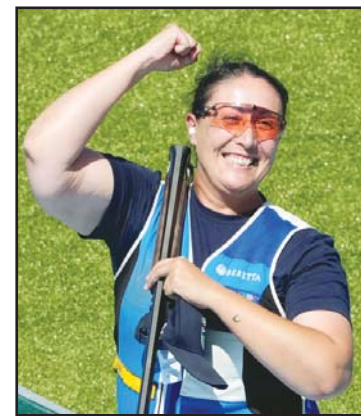
Italy's Diana Bacosi celebrates after winning the gold medal with teammate Gabriele Rossetti in the Skeet mixed team final at the 2024 Summer Olympics in Chateauroux, France.