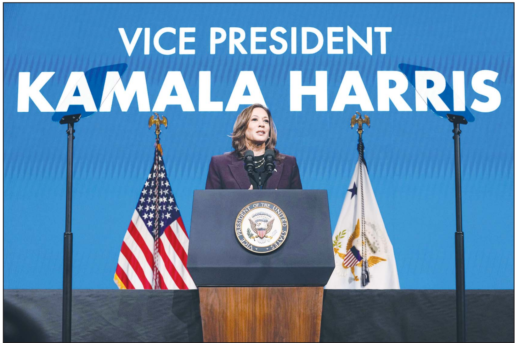
US Vice President Kamala Harris speaks during the American Federation of Teachers' 88th national convention on July 25 in Houston. Harris' campaign on Aug 4 was launching 'Republicans for Harris' as she looks to win over Republican voters put off by Donald Trump's candidacy.

More than 35,000 people have been arrested in the crackdown. Many prominent opposition figures have fled the country and others have been sentenced to long prison terms. The rights group Viasna says there are nearly 1,400 political prisoners currently in Belarus.