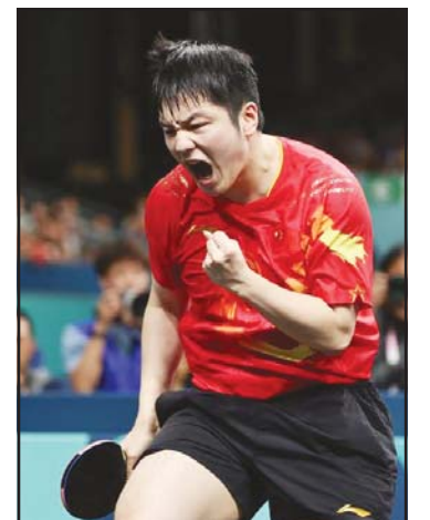
Fan Zhendong of China celebrates after the men's singles gold medal match of table tennis between Truls Moregard of Sweden and Fan Zhendong of China at the Paris 2024 Olympic Games in Paris, France.

Moregard, who was defeated by Fan in the men's singles final at the 2021 World Table Tennis Cham-