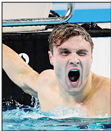
United States' Bobby Finke celebrates winning the gold medal in the men's 1500-meter freestyle final at the Summer Olympics in Nanterre, France.

The only time the U.S. didn't win gold was in 1980, when it boycotted