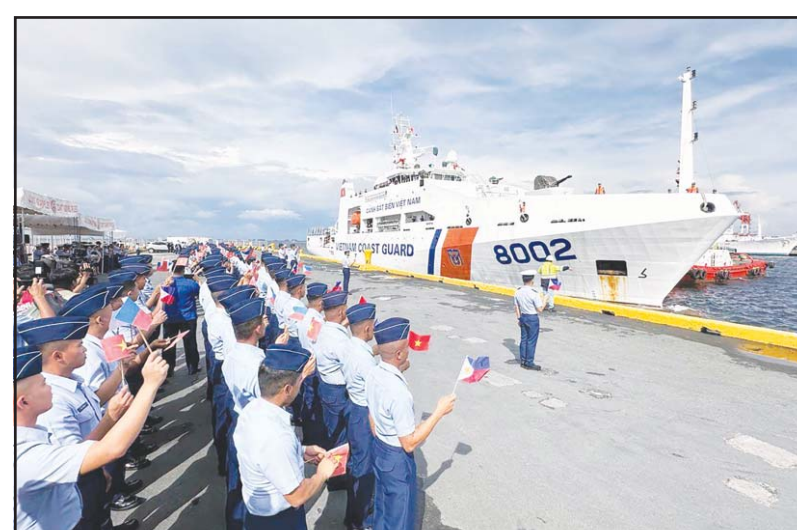
Philippine Coast Guard personnel wave Vietnamese and Filipino flags to welcome the Vietnam Coast Guard (VCG) ship, CSB 8002, in Manila, Philippines on Aug 5. A Vietnamese coast guard ship arrived in Manila on Monday for a four-day goodwill visit and joint exercises as the two countries attempt to put aside their own territorial disputes in the face of rising tensions with China over control of key features in the South China Sea.

Since 2012, Mali has been grappling with the expansion of terrorism and a deep multidimensional crisis, including security, political, economic, and humanitarian challenges.