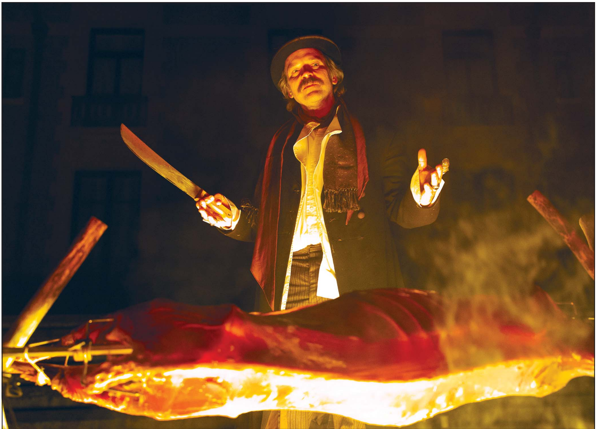
This image released by Greenwich Entertainment shows Peter Sarsgaard in a scene from 'COUP!' (AP)