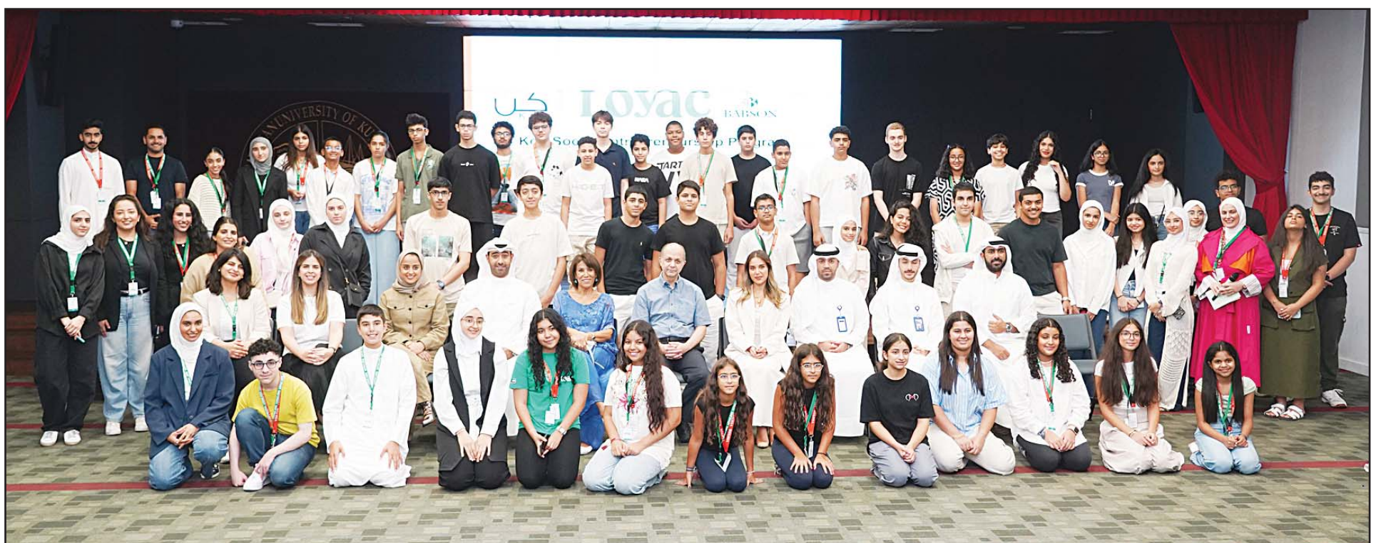
Group photo of workshop participants.