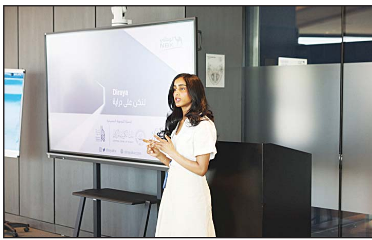
Photo from the event.