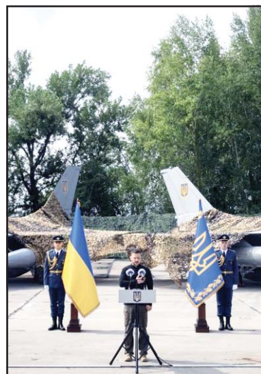
Ukraine's President Volodymyr Zelenskyy talks on the occasion of the Air Forces Day standing against the background of Ukraine's Air Force's F-16 fighter jets in an undisclosed location in Ukraine on Aug 4. The F-16 fighter jets that have been delivered to Ukraine by Western countries will be flying sorties in Ukrainian skies and helping the country's current fleet of Soviet-era jets to counter Russia's invasion. (AP)

A tornado watch also was in effect for parts of Florida and Georgia on Monday. (AP)