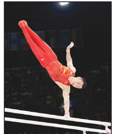
Zou Jingyuan, of China, competes during the men's artistic gymnastics individual parallel bars finals at the 2024 Summer Olympics in Paris, France.

The horizontal bar contest was very tight. Behind Oka and Barajas - who claimed Colombia's first ever medal in gymnastics - Zhang Boheng of China and Tang Chia-Hung of Taiwan shared the bronze medal with a score of 13,966 points and an identical execution note.