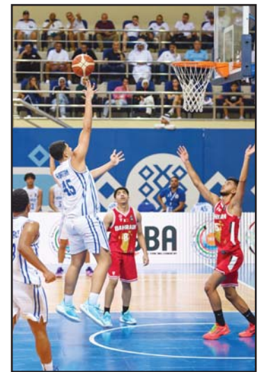
A file photo of the team in action.

The team qualified for the Asian Cup finals after securing second place in the Asian qualifiers held in Kuwait last weekend, alongside the