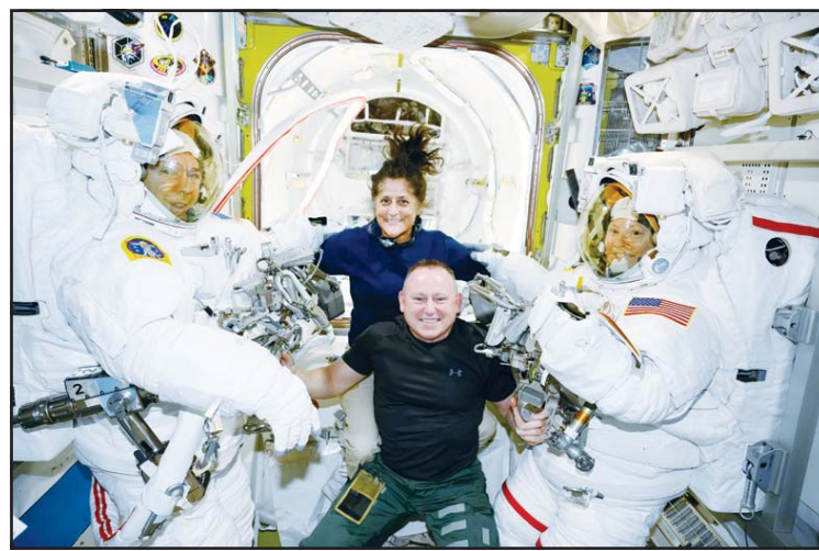
Boeing Crew Flight Test astronauts Sunita Williams and Butch Wilmore, (center), pose with Expedition 71 Flight Engineers Mike Barratt, (left), and Tracy Dyson, aboard the International Space Station's Quest airlock on June 24, 2024.

Wilmore paused before boarding the Starliner on each launch attempt, huddling in prayer with technicians and Williams. He acknowledged the risks of spaceflight - especially on a test