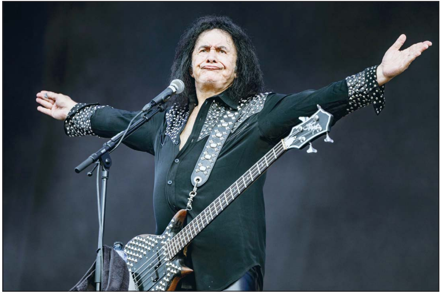
Gene Simmons, singer of the band 'Kiss,' performs at the Wacken Open Air metal music festival, in Wacken, Germany, Friday, Aug. 2.