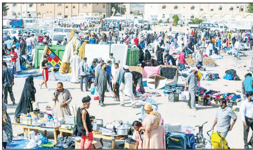
A makeshift market in Jleeb Al-Shuyoukh serving people of all nationalities.

The Council of Ministers' focus on these recommendations and the expedited establishment of labor cities reflect a strategic approach to resolving the deep-seated issues in Jleeb Al-Shuyoukh and improving the living conditions in the region.