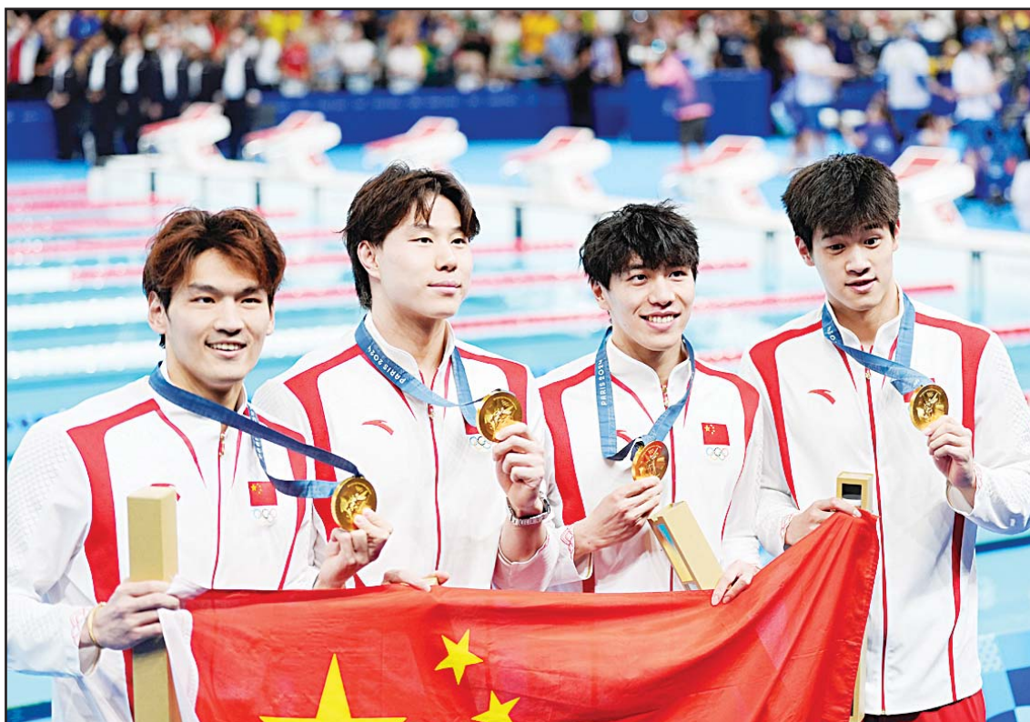
China's Xu Jiayu, Qin Haiyang, Sun Jiajun, and Pan Zhanle pose for a photo with their gold medals during the awards ceremony for the men's 4x100-meter medley relay at the Summer Olympics in Nanterre, France.

Walsh, in her first swim of a busy night, just missed out on a medal in 24.21.