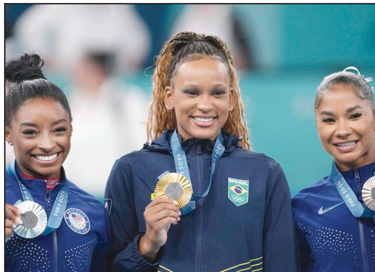
Gold medalist Rebeca Andrade, center, of Brazil, celebrates on the podium with silver medalist Simone Biles, left, of the United States, and Jordan Chiles, also of the United States, during medal ceremony for the women's artistic gymnastics individual floor finals at Bercy Arena at the 2024 Summer Olympics in Paris, France.

The routine ends with Biles blowing a kiss, a little wink that she has incorporated into her program in various forms for years.