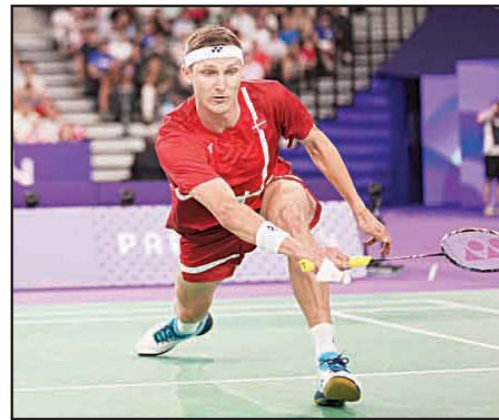
Denmark's Viktor Axelsen plays against Thailand's Kunlavut Vitidsarn during their men's singles badminton gold medal match at the 2024 Summer Olympics in Paris, France.