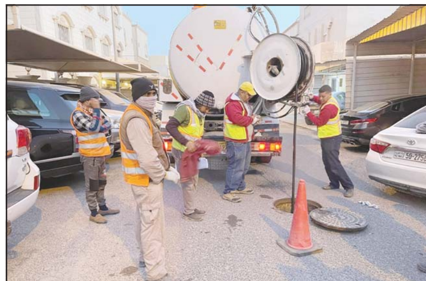
File photo of men working on rainwater network.