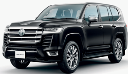
TOYOTA LC 300 (MY 2022 & 2023)

VIN: JTMABBBJ9N4000689 TO JTMABBBJ2P4060249