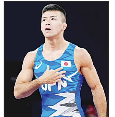
Japan's Kenichiro Fumita celebrates after defeating Iran's Mehdi Seifollah Mohsen Nejad during their men's Greco-Roman 60kg wrestling quarterfinal match, at Champ-de-Mars Arena, during the 2024 Summer Olympics in Paris, France.