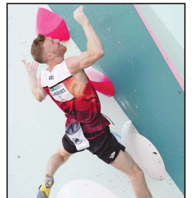
Jacob Schubert of Austria competes in the men's boulder and lead sport climbing at the 2024 Summer Olympics in Le Bourget, France.