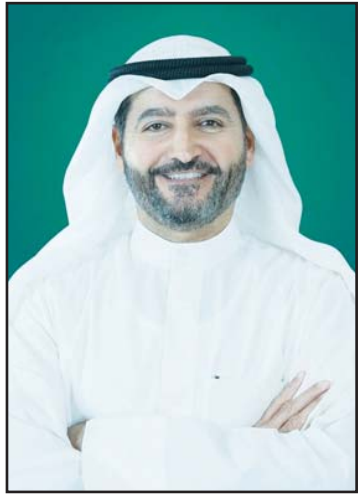
KFH Chairman Hamad AlMarzouq

Driven by KFH's digital transformation vision as a fundamental driver for sustainable development and based on its belief that digital transformation is the primary engine for future growth, KFH's digital banking services have undergone significant development, notably the launch of "Tam" Digital Bank, the first sharia-compliant digital bank in Kuwait. This signifies a substantial achievement in KFH's journey towards leading digital bank-