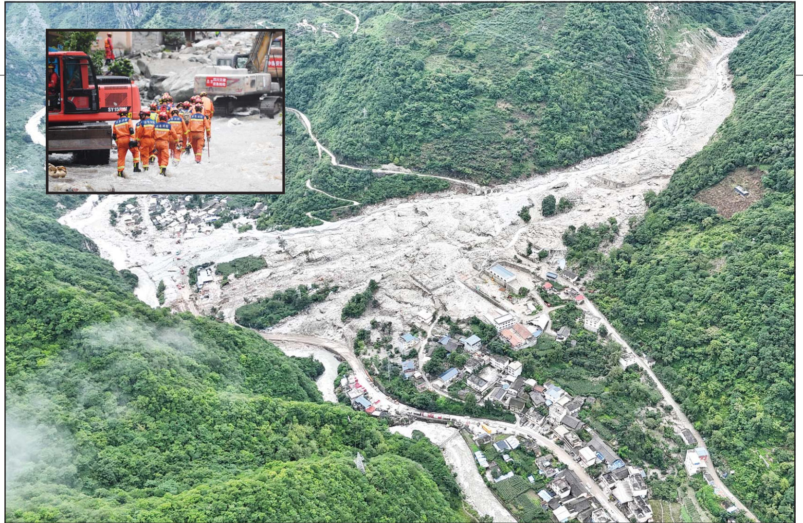
In this aerial photo released by Xinhua News Agency, the impact of flash floods and mudslides can be seen near Ridi Village, Kangding City, Garze Tibetan Autonomous Prefecture in southwestern China's Sichuan Province on Aug 4. Inset: Rescuers waded through floodwater to the disaster site of Ridi Village in Kangding City, Garze Tibetan Autonomous Prefecture, southwest China's Sichuan Province.

Media workers are regularly targeted in Mexico, often in direct reprisal for their work covering topics like corruption and the country's notoriously violent drug traffickers.