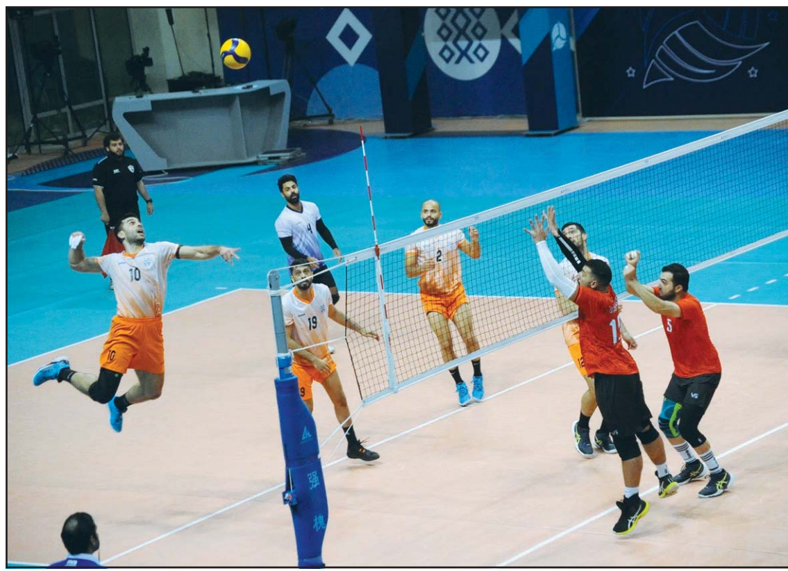
Kazma players preparing for the new season.