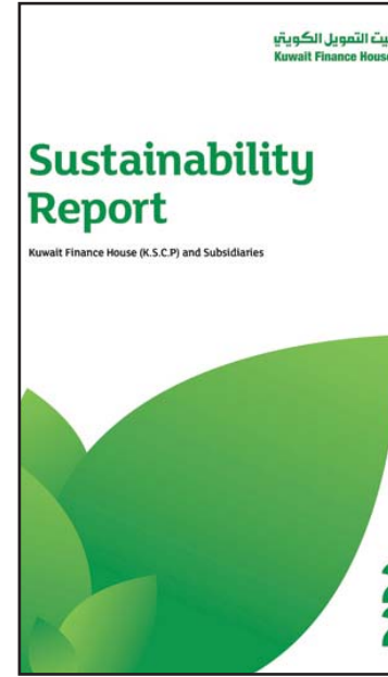
KFH Final Sustainability Report 2023.