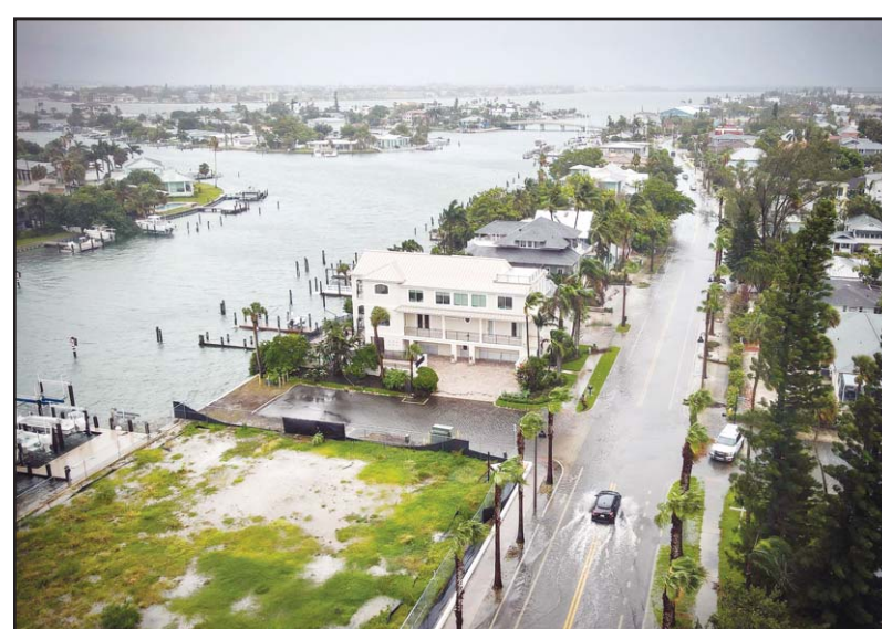
A driver negotiates a flooded street as Tropical Storm Debby passes just to the west of the Tampa Bay, Florida, region on Aug 4. Hurricane Debby has made landfall on Aug 5 in northern Florida as a Category 1 storm.