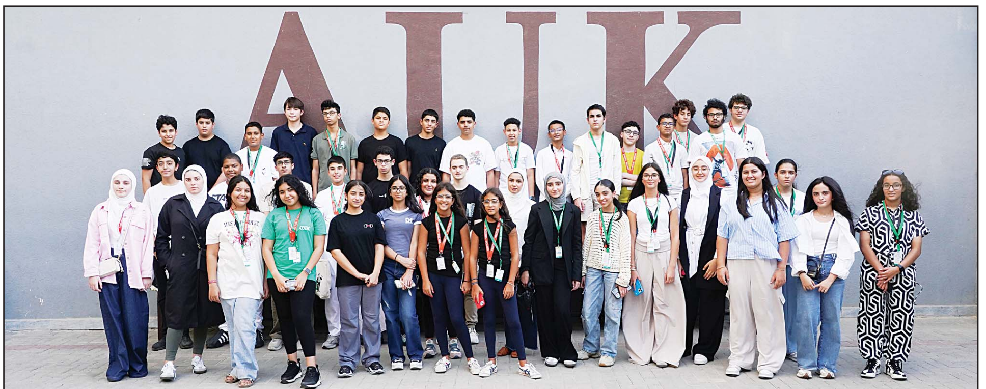
Group photo of workshop participants.

The American University of Kuwait (AUK) is an independent, private, equal opportunity, and coeducational liberal arts institution of higher education. The educational, cultural and administrative structure, methods and standards of AUK are based on the American model of higher learning. The language of instruction is English. More information on the American University of Kuwait can be found at www.auk.edu.kw