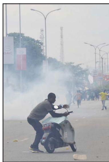
Police fired tear gas during a protest in Abuja, Nigeria on Aug. 1, 2024. Nigeria's leader on Aug 4, called for an end to mass protests against the West African nation's economic hardship, saying the rallies have turned violent and have become politically motivated.

Sudan plunged into chaos in April last year when simmering tensions between the military and the RSF developed into open fighting in the capital, Khartoum, before spreading across the northeastern African country. Darfur saw some of the worst and most devastating bouts of fighting in the war.