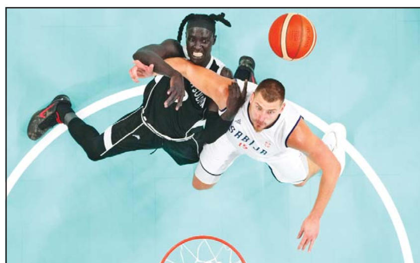
South Sudan's Wenyen Gabriel, (left), and Serbia's Nikola Jokic battle for a rebound during a men's basketball game at the 2024 Summer Olympics, in Villeneuve-d'Ascq, France.

"The guys, I think, are well prepared for it," U.S. coach Steve Kerr said. "They've done a great job of not only preparing on the floor but adapting to these weird circumstances of having 12 starters in the NBA adjust to being a 12-man team here and some