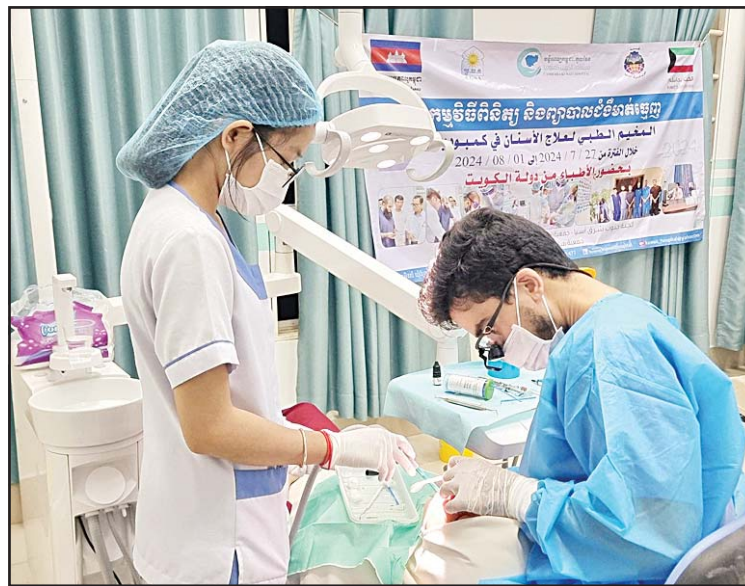
Providing medical services for oral and dental health for humanitarian cases there.

Kuwait Hospital, Cambodia's first charitable hospital since 2015, offers essential services like surgery, obstetrics, pediatrics, dental