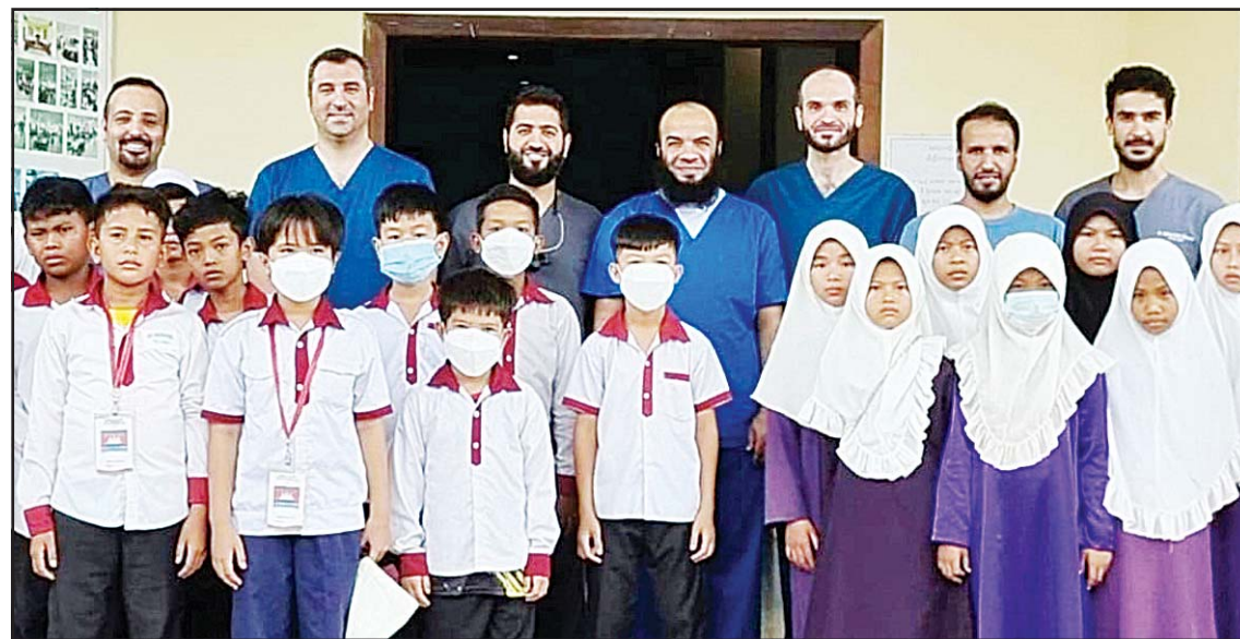
The Kuwaiti volunteer medical team with children who are beneficiaries of the humanitarian campaign.

Nonetheless, the Kuwaiti effort does not stop there as the "Kuwait Village for Orphans," funded by