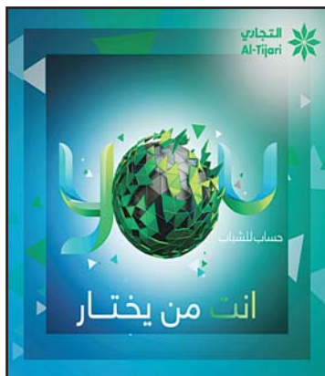
New 'YOU Account' artwork.

'YOU Account' is designated for the youth who transfer their monthly social allowance to Commercial Bank