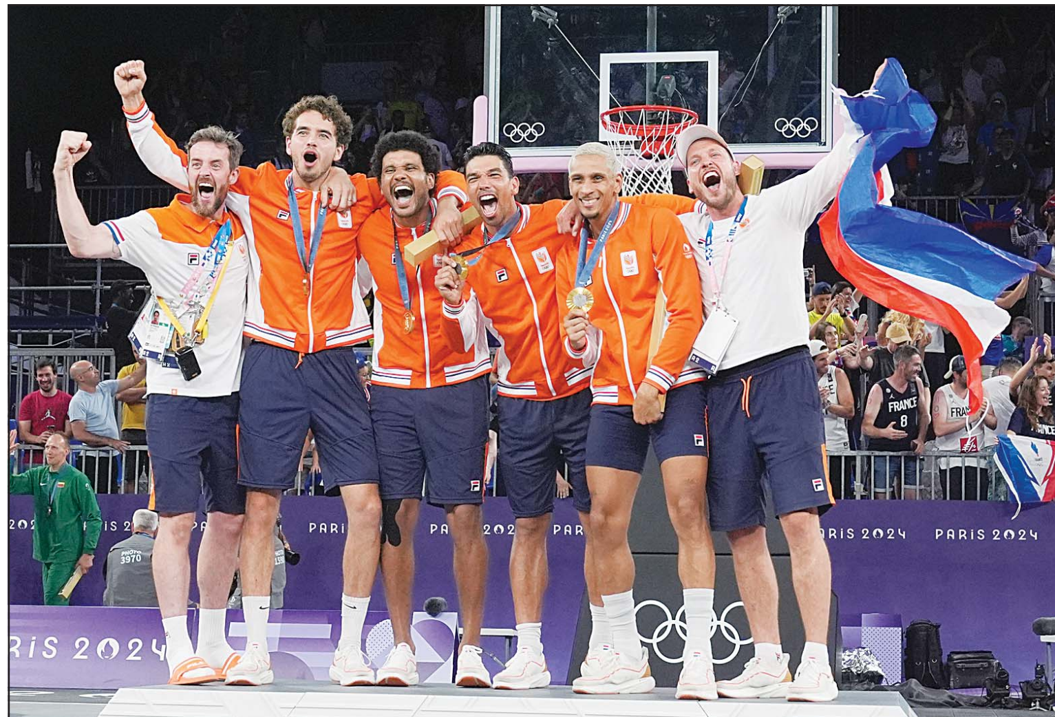
The Netherlands men's 3x3 basketball team celebrates their gold medals during the medal ceremony at the 2024 Summer Olympics in Paris, France.