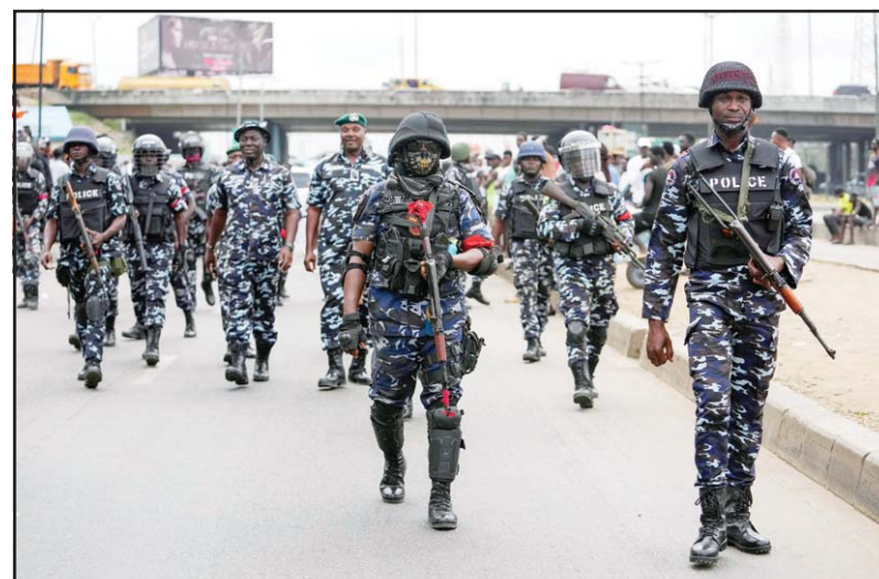
Policemen patrol on a street as people protest over economic hardship in Lagos, Nigeria on Aug 5. Protests against economic hardship continued for a fifth day in several Nigerian states on Monday, a day after President Bola Tinubu called for an end to the demonstrations that have faced a crackdown from security forces.

Officials said that in the second incident