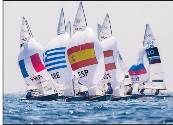
A fleet of boats compete in the 470 mixed dinghy race during the 2024 Summer Olympics in Marseille, France.

Phogat tore her anterior cruciate ligament during her Olympic quarterfinal in 2016 and was taken out on a stretcher. She had never placed higher than ninth at the Olympics or third at a world championship event. For Susaki to have a chance to fight for a medal through repechage, Phogat will need to reach the final. Phogat faces Yusneylis Guzman Lopez of Cuba on Tuesday night in a semifinal.