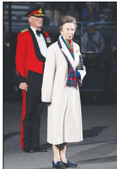
Britain's Anne, The Princess Royal, receives the salute during the Royal Edinburgh Military Tattoo at Edinburgh Castle, in Edinburgh, Scotland on Aug 5.