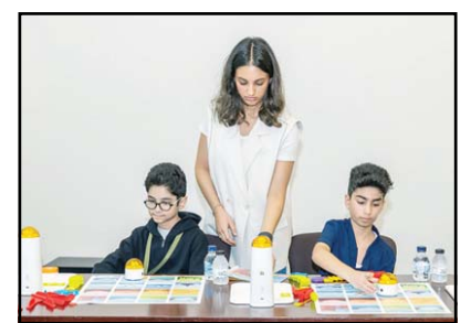
Activities during the summer club programs for children.