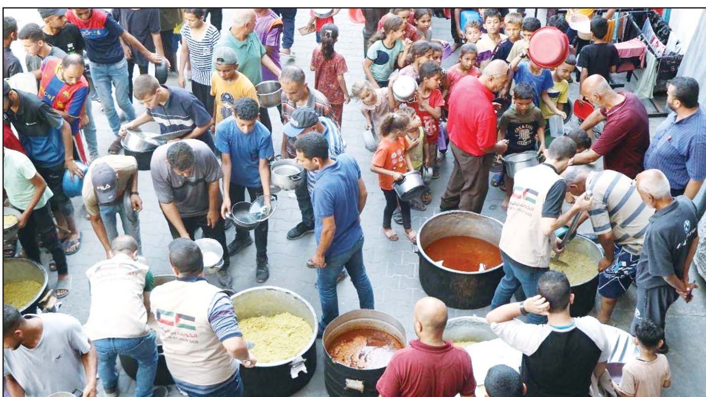
Food is distributed to the displaced Palestinians in Gaza.

Gaza ceasefire holds key to averting broader conflict