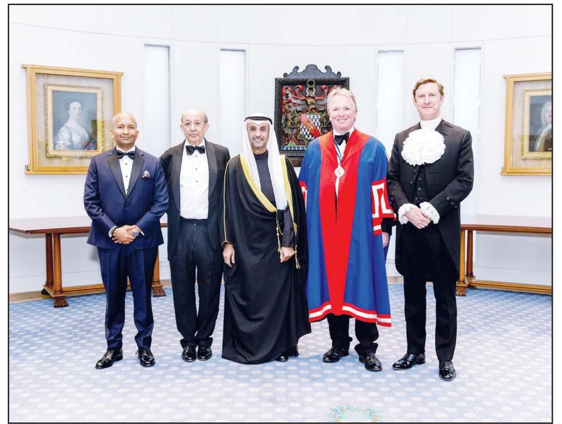
His Excellency Dr. Nayef Al-Hajraf in a group photo during the inaugural charity gala dinner.

They indicated that the facilities usually request a temporary administrative reopening to rectify the violations. Subsequently, inspection teams revisit the facility to collect samples again. Once the safety of water and food is confirmed, the facility can reopen, but will be subjected to continued inspection tours.