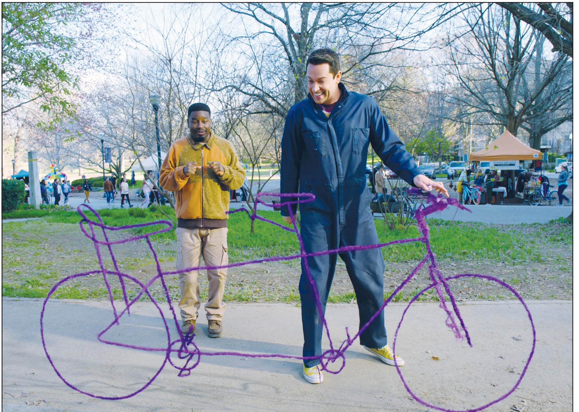
This image released by Sony Pictures shows Zachary Levi, right, and Lil Rel Howery in a scene from 'Harold and the Purple Crayon.'