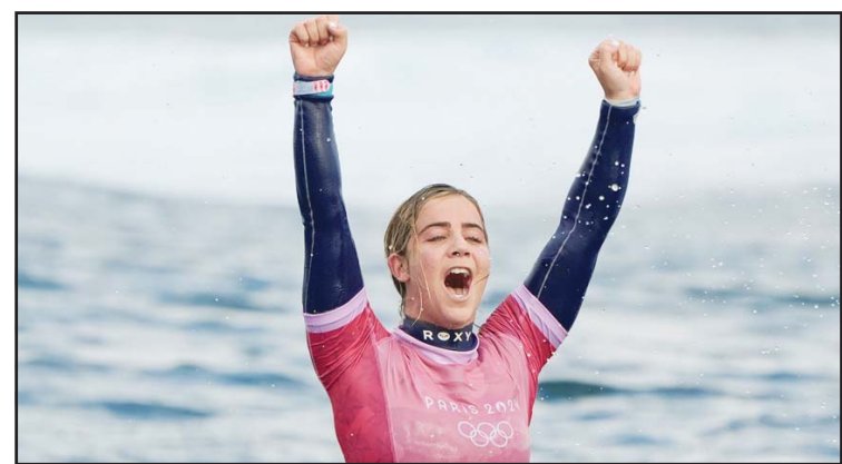
Caroline Marks, of the United States, celebrates after winning the gold medal match of the surfing competition at the 2024 Summer Olympics in Teahupo'o, Tahiti.

the names of the athletes as they walked by. All winners of the Paris Olympics surfing competition are first-time Olympic medalists, after defending Olympic women's champion Carissa Moore of the United States - who won at the Tokyo Games, where Olympic surfing debuted - was beaten in the quarterfinals on Thursday. "Obviously I'm really sad to not be a part of finals day, to get to represent my home and my family one more time, but I'm really grateful," Moore said after her loss. "I just hope that at the end of the day I can encourage whoever is watching, win or lose, don't be afraid to go into it fearlessly and don't be afraid to fail." The final day of the Paris Olympics surfing competition began Monday morning after two days of delays due to unfavorable con-