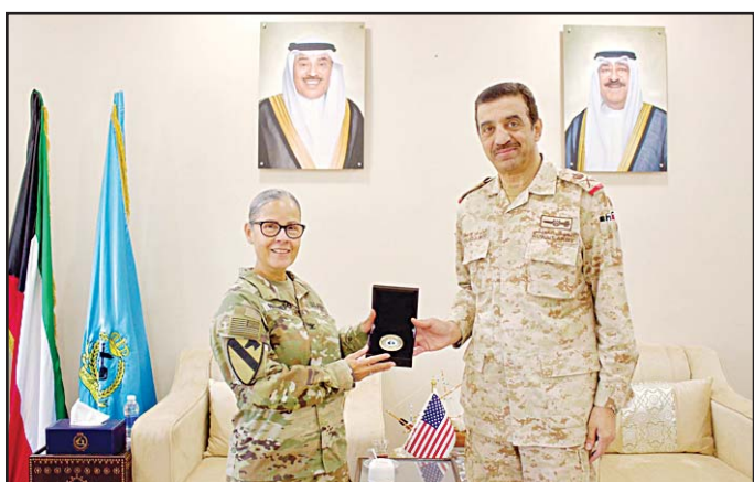
The Air Defense Force commander discusses joint military issues with the commander of the support group in the region.