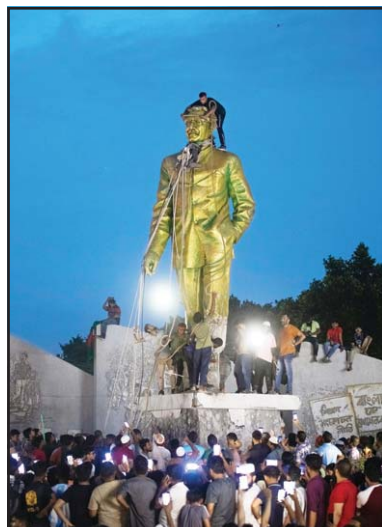
Protesters try to demolish a large statue of Sheikh Mujibur Rahman, father of Bangladesh leader Sheikh Hasina, after she resigned as Prime Minister, in Dhaka, Bangladesh on Aug 5.

With the arrest, the navy has seized a total of 40 Indian poaching trawlers and arrested 287 Indian fishermen in Sri Lankan waters so far in 2024.