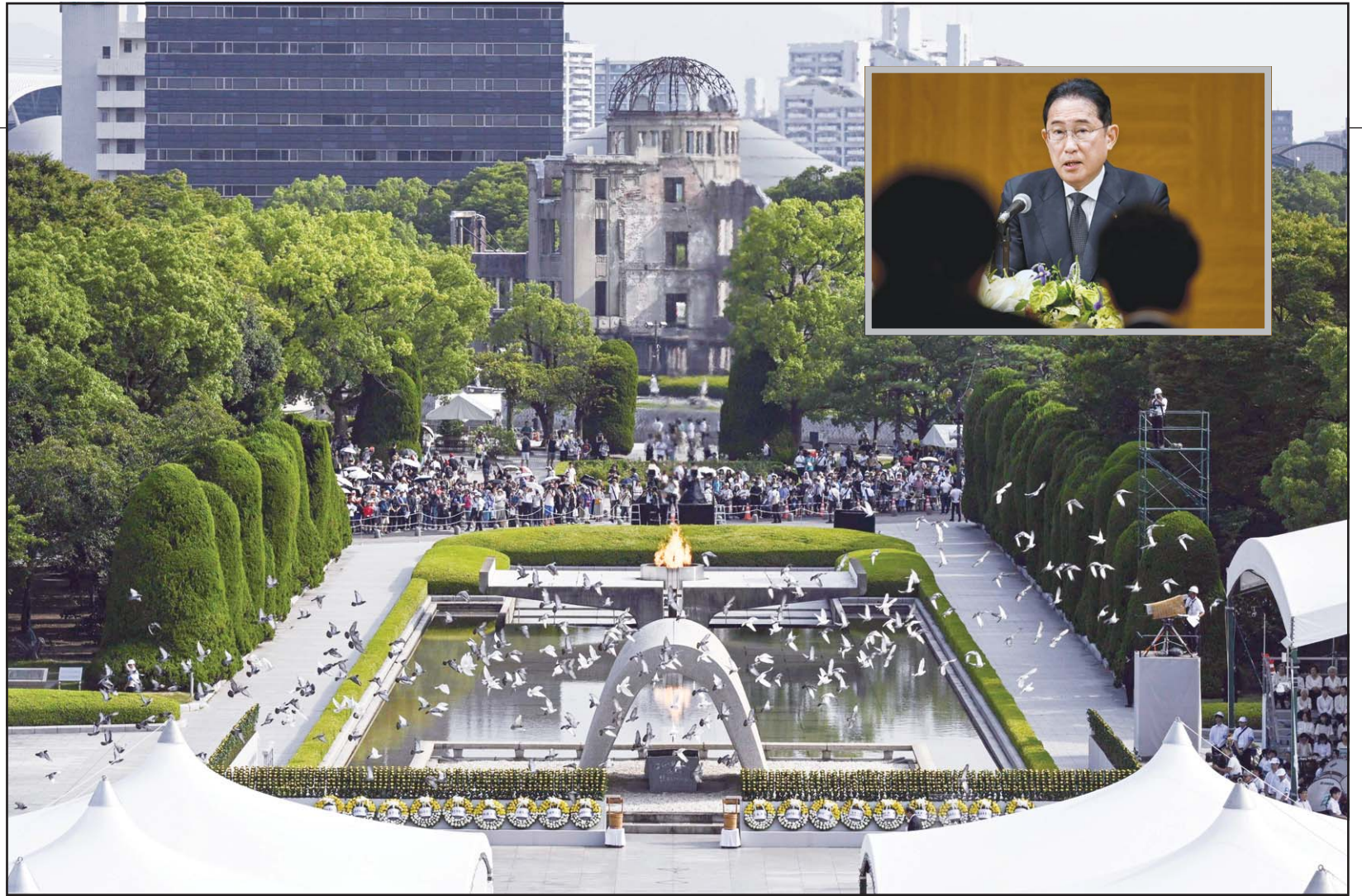
Doves fly over the cenotaph dedicated to the victims of the atomic bombing during an annual ceremony marking the 79th anniversary of the world's first atomic bombing, at the Peace Memorial Park in Hiroshima, western Japan on Aug 6. Inset: Japan's Prime Minister Fumio Kishida speaks at a press conference in Hiroshima, western Japan on Tuesday after he attended an annual ceremony marking the 79th anniversary of the world's first atomic bombing.