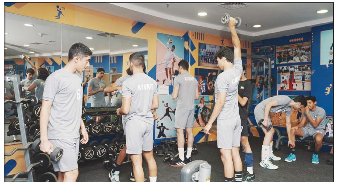
Kuwaiti players training for the championship.

Asked if City would be replacing Alvarez in the squad ahead of the new season, which starts on Friday, Guardiola said last week: "I don't know yet. We talk every day, we see what happens."