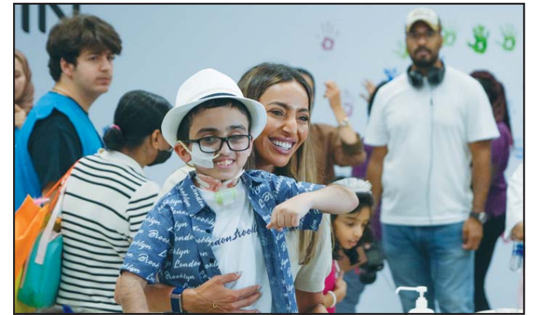
Zain KACCH &amp; BACCH event 2024.