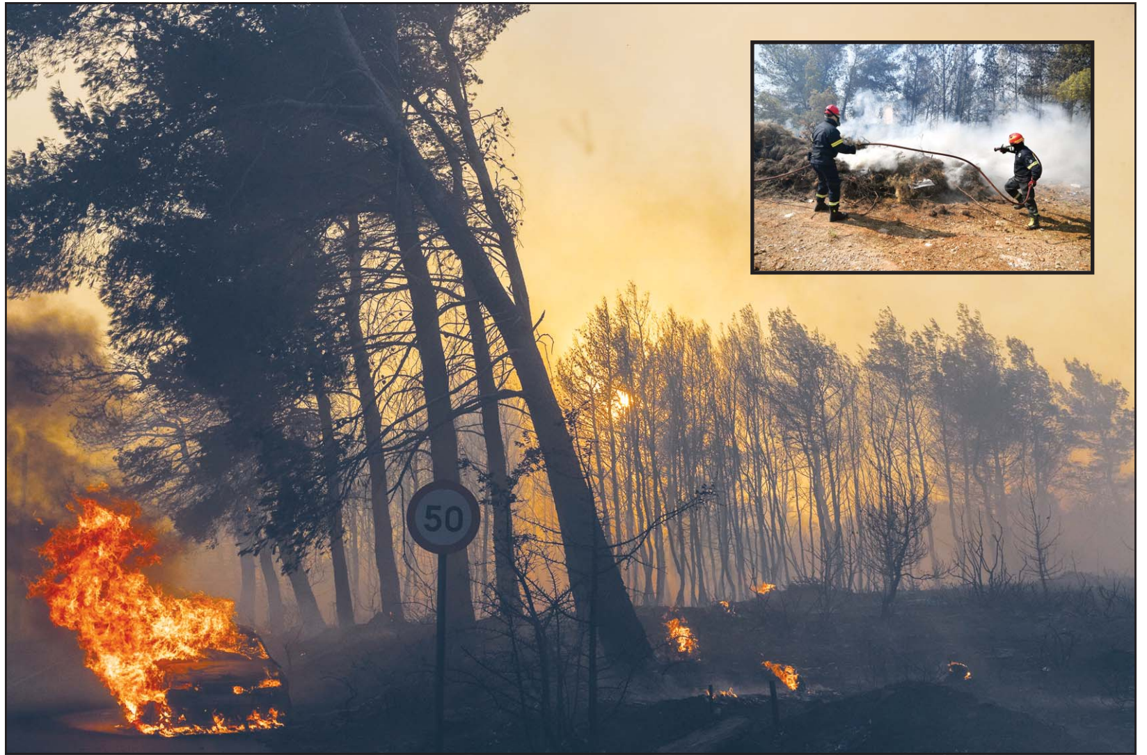
A car (lower left corner) catches fire during a wildfire in Varnavas, around 35 km from Athens, Greece, on Aug 11. Inset: Firefighters operate in Dioni, northeast of Athens, Greece on Aug 12.

"It is part of the hybrid approach" designed to topple the government, Vucic told reporters. "We knew everything in detail. You think you have surprised someone... we have always been restrained, without violence we ensured order in the country, without a problem."