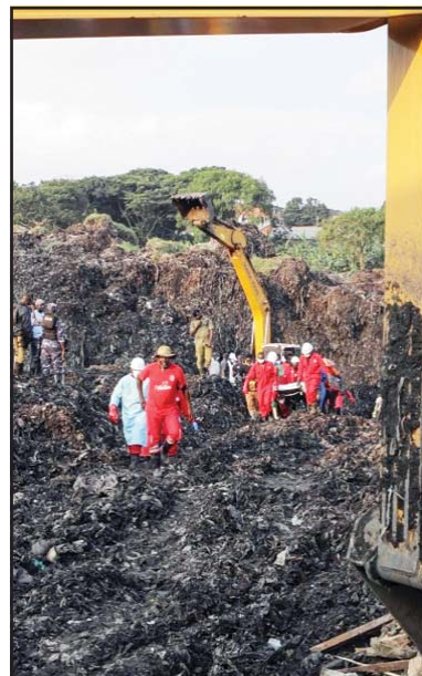
Uganda Red Cross volunteers and other rescuers work at the site of a landslide at Kiteezi landfill in Kampala, Uganda on Aug 11. (Xinhua)

The prefecture started an emergency controlled release of water into a river to keep a dam from overflowing, calling on about 8,300 riverside residents in the towns of Osanai and Kuji to take shelter due to possible flooding from the discharge. (AP)