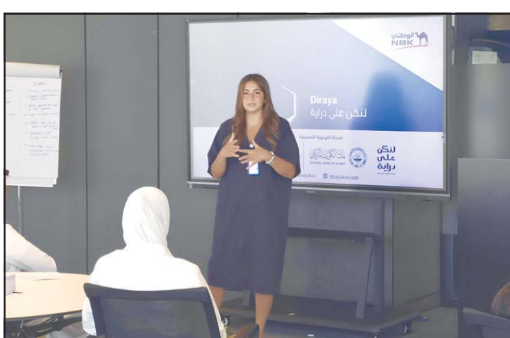
Aspire awareness program.