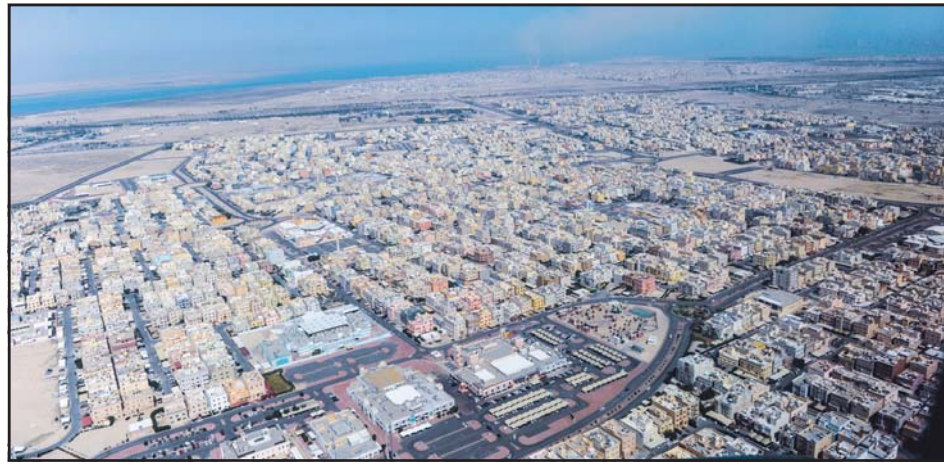
A file photo of Saad Al-Abdullah housing residential project.

He added five tenders were floated including those related to the supply, installation and implementation of two main power stations with a voltage of 400/132/11 kV in South Saad Al-Abdullah Housing City P. He said the number of citizens who received "To Whom it May Concern" certificates for the issuance of building permits in Mutlaa City reached 27,454; while 3,236 certificates were issued to owners of plots in South Abdullah Al-Mubarak housing project and 1,392 to owners