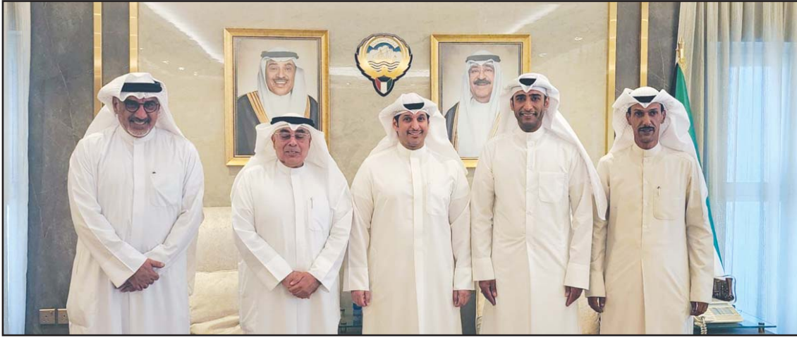
Minister of Information Abdul Rahman Al-Mutairi receiving the school union delegation.