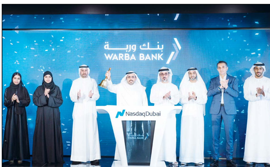
Nasdaq Dubai welcomes USD 500 million Sustainability Sukuk by Warba Bank.