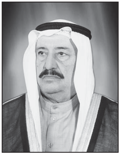
HH Sheikh Salem Al-Ali