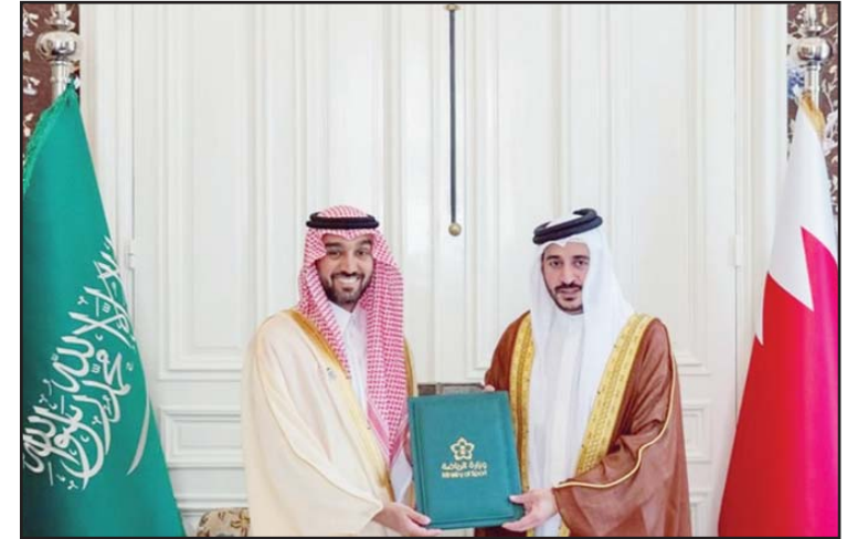
Sheikh Khalid bin Hamad Al Khalifa and Prince Abdulaziz bin Turki Al Faisal pose for photo after signing the new agreement.

The new classification will increase the number of Omani referees on the international list to 7 field referees and 9 assistant referees.