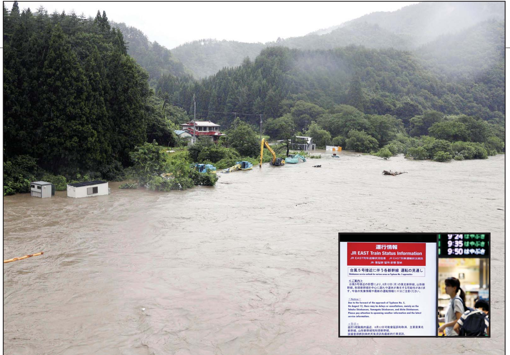
The Omoto river is seen swollen by a storm in Iwazumi, Iwate prefecture, northern Japan on Aug 12. Inset: A station board at JR Sendai Station shows its service updates of Shinkansen, or bullet train, as possible delay are expected due to an approaching storm in Sendai, northern Japan on Monday.

The spree of detentions - urged on by Maduro himself - is unprecedented, and puts Venezuela on pace to easily exceed those jailed during three previous crackdowns against Maduro's opponents.