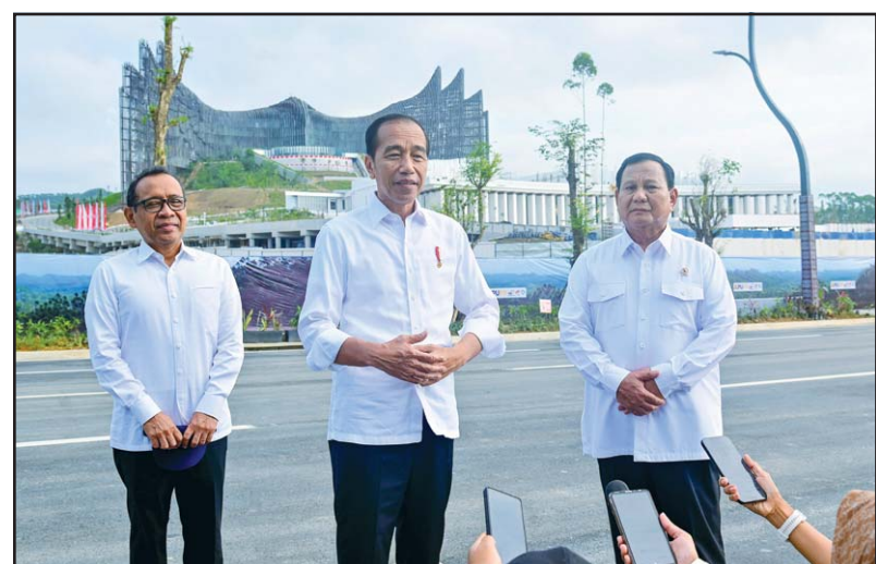
In this photo released by Indonesian Presidential Palace, Indonesian President Joko Widodo, (center), talks to journalists accompanied by Indonesian Defense Minister and president-elect Prabowo Subianto, (right), in the new capital city Nusantara in Penajam Paser Utara, East Kalimantan, Indonesia on Aug 12. Widodo held his first cabinet meeting in the future capital of Nusantara, amid miles of construction sites and doubts about the sustainability of the ambitious mega project.

Between 2013 and 2016, three Mozambican-government-controlled companies quietly borrowed $2 billion from major overseas banks.