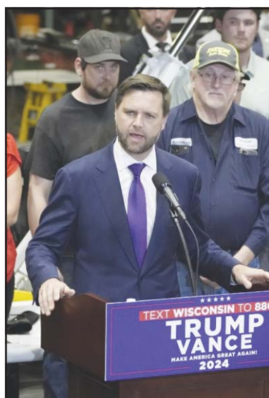
US Republican vice presidential nominee Sen. JD Vance, R-Ohio, speaks at a campaign event at Wollard International on Aug 7 in Eau Claire, Wisconsin.