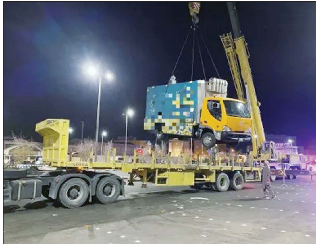
One of the food trucks being lifted on the Municipality's trailer truck.