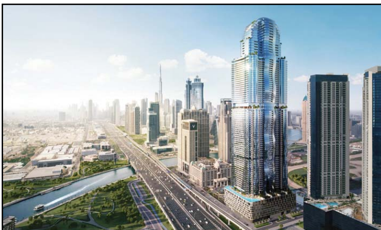
Al Habtoor Tower sets construction records with 100-metre foundations.

Known for landmark projects like Burj Al Arab, the Of-