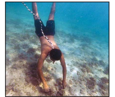
A young diver collecting oysters from the sea bed.

It stressed the need for the competent departments to verify the medical certificates submitted by employees and to implement the administrative systems and regulations in this regard by strictly following the oversight and control rules, while ensuring the highest level of transparency and accountability in all sectors and exposing violations or transgressions in the work systems. It is noteworthy that the competent sector in the ministry that is responsible for authenticating secondary school certificates in and outside the country formed three specialized teams to assess all secondary school certificates issued since 2000 till date in accordance with the directives and direct follow up of the minister.