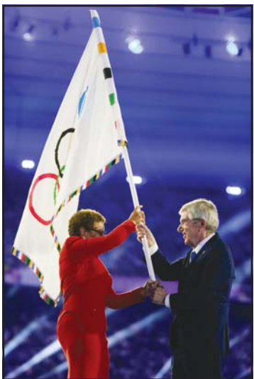
IOC President Thomas Bach hands the Olympic flag to Los Angeles Mayor Karen Bass during the 2024 Summer Olympics closing ceremony at the Stade de France in Saint-Denis, France.

Capping two and a half extraordinary weeks of Olympic sports and emotion, Paris' boisterous, star-studded closing ceremony in France's national stadium mixed unbridled celebration with a somber call for peace from International Olympic Committee President Thomas Bach.