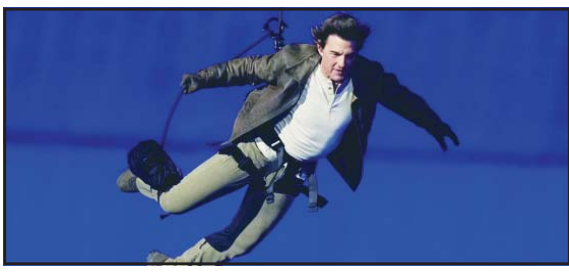
Tom Cruise is lowered on the Stade de France during the 2024 Summer Olympics closing ceremony in Saint-Denis, France.