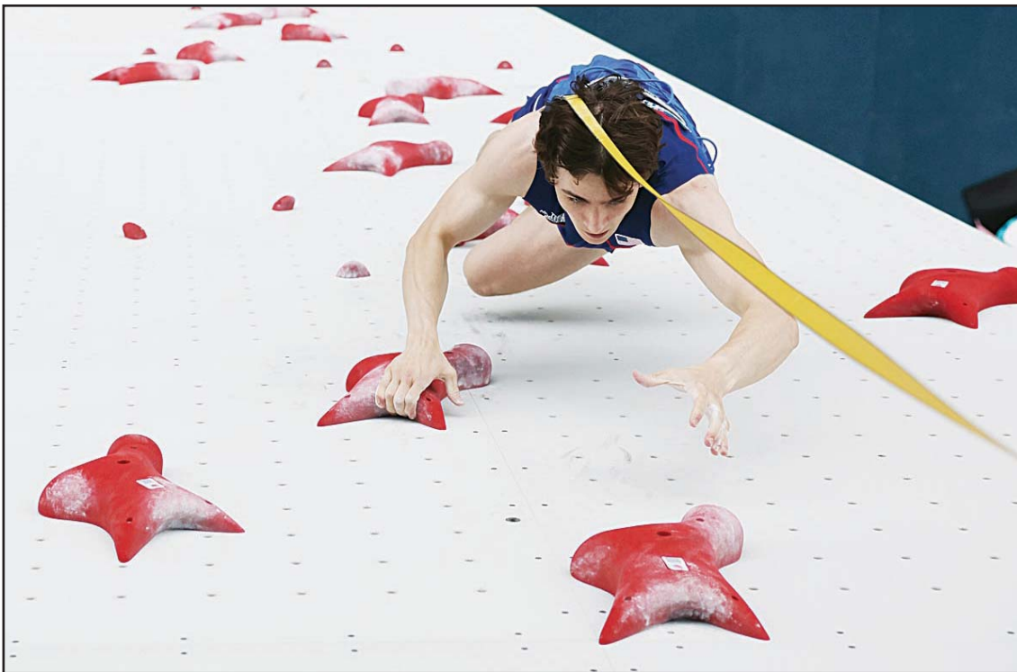
Sam Watson of the United States competes during the men's speed competitions of sport climbing of the Paris 2024 Olympic Games at Le Bourget Climbing Venue, near Paris, France.

Tuesday sees two stages, a dash of just under 70 kilometers from Dordrecht to Rotterdam followed by a 6.3-kilometer individual time trial through the port city.