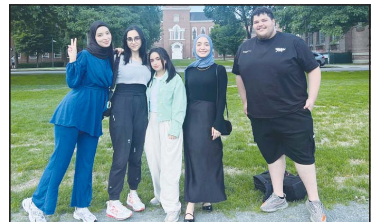
AUK students at Dartmouth College.