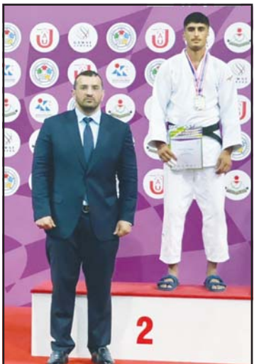
One of the Kuwaiti winners on the podium with an official.

day at the Macau Junior and Cadets Asian Cups 2024, hosted in the Macau Region of the People's Republic