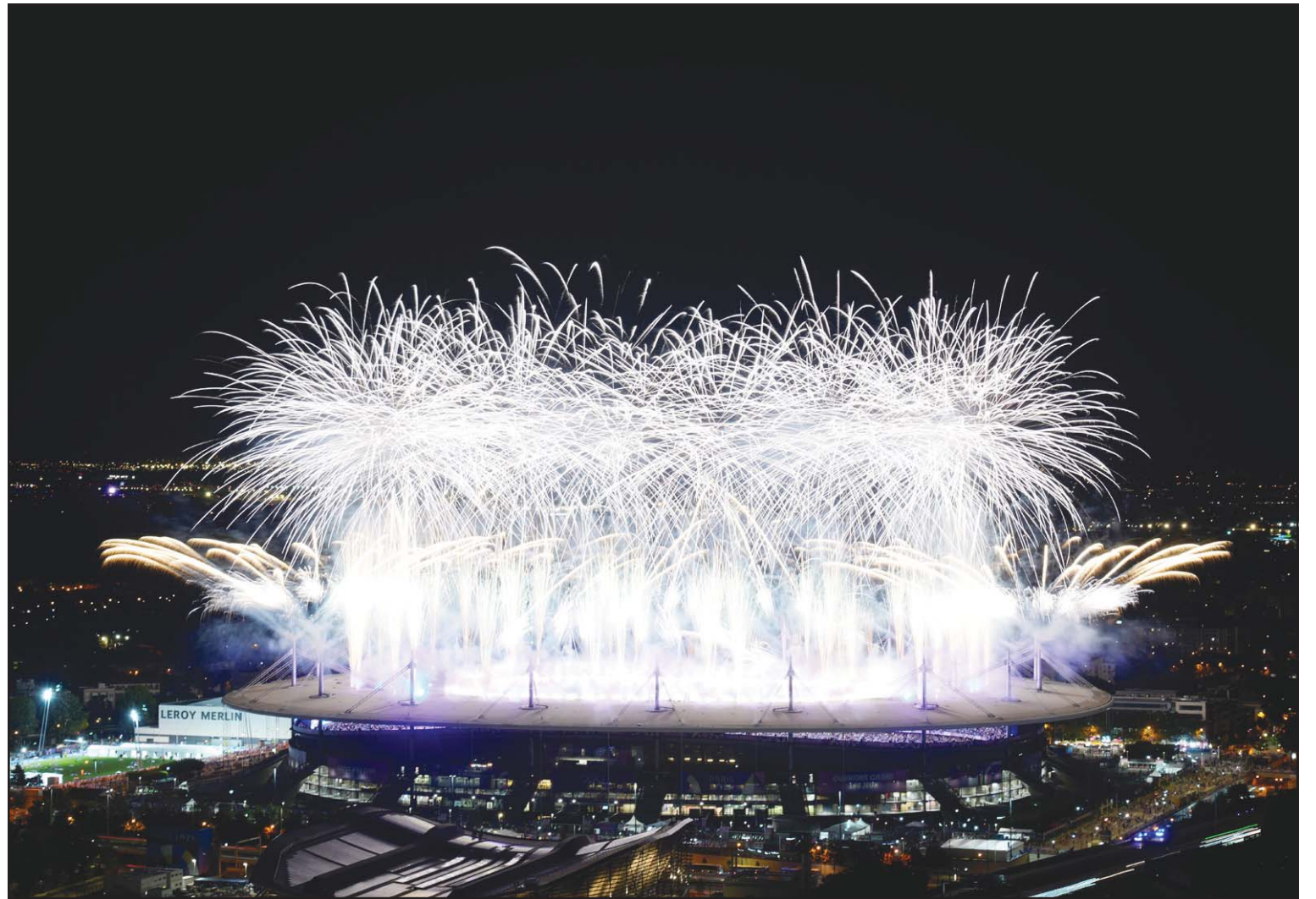
Fireworks signal the end of the 2024 Summer Olympics closing ceremony taking place at the Stade de France in Saint-Denis, France.

After being lowered on a rope live from the roof's giddy heights, Cruise drove his bike past the Eiffel Tower in a prerecorded segment, onto a plane, and then skydived over the Hollywood Hills. Three circles were added to the O's of the famed Hollywood sign, creating five interlaced Olympic rings.