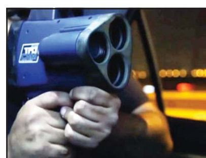
Speed control radar.

During the trial, traffic police apprehended 85 vehicles for speeding violations, 4 vehicles for racing, and 2 motorcycles for driving without license plates and helmets. The rapid detection of these violations, cou-