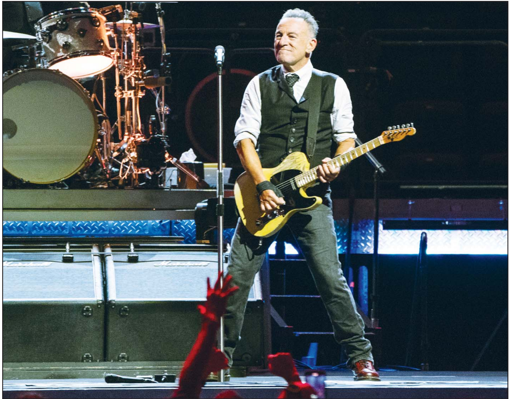
Bruce Springsteen and the E Street Band perform on Thursday, Aug. 15, in Pittsburgh.