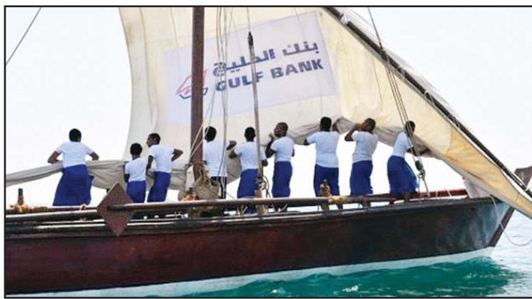
Gulf Bank sponsors the diving trip.