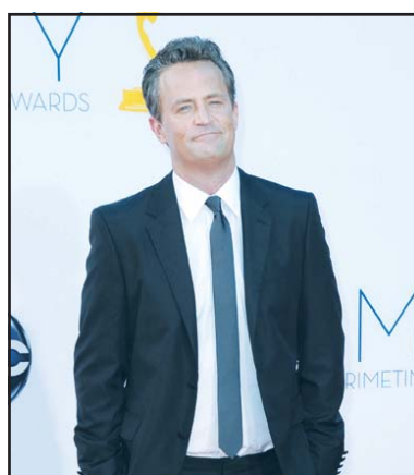
Actor Matthew Perry arrives at the 64th Primetime Emmy Awards in Los Angeles on Sept. 23, 2012.

His attorney argued the Perry case was "isolated" and the doctor should be allowed to treat patients who depended on him at his one-man practice while awaiting trial.