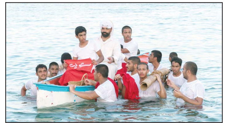
Return of the divers on the closing day.

Organized by Kuwait Sea Sport Club, under the patronage of His Highness the Amir