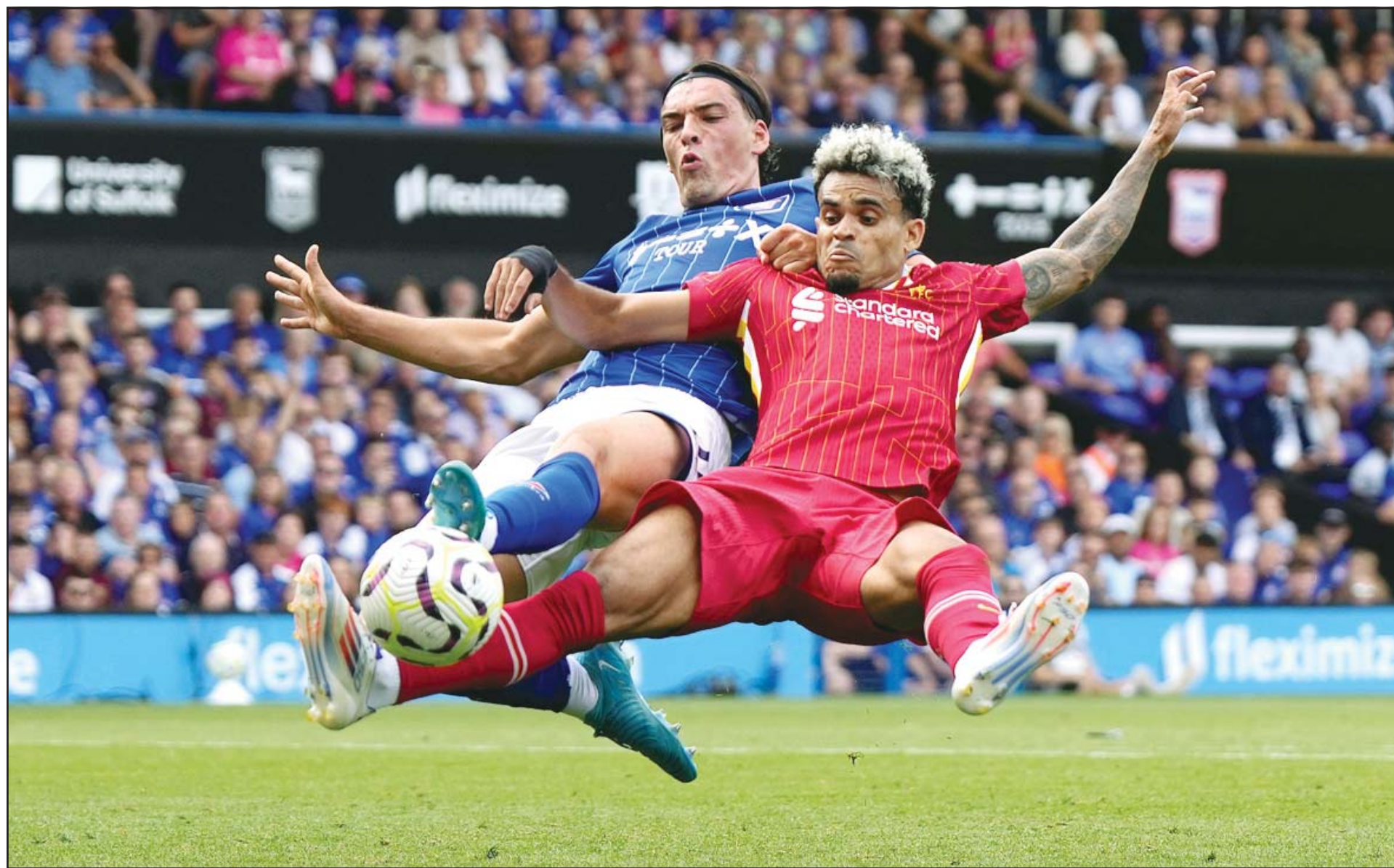
Liverpool's Luis Diaz, right, vies for the ball with Ipswich Town's Jacob Greaves during the English Premier League soccer match between Ipswich Town and Liverpool at Portman Road stadium in Ipswich, England.

Zirkzee, Mazraoui and De Ligt have arrived as part of a $180 million spending spree by the record 20-time champions, a club under new