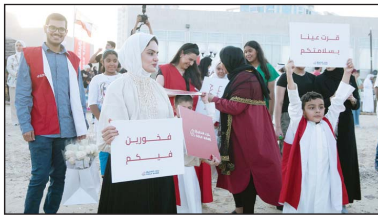
Gulf Bank team waiting for the returnees from the diving trip.