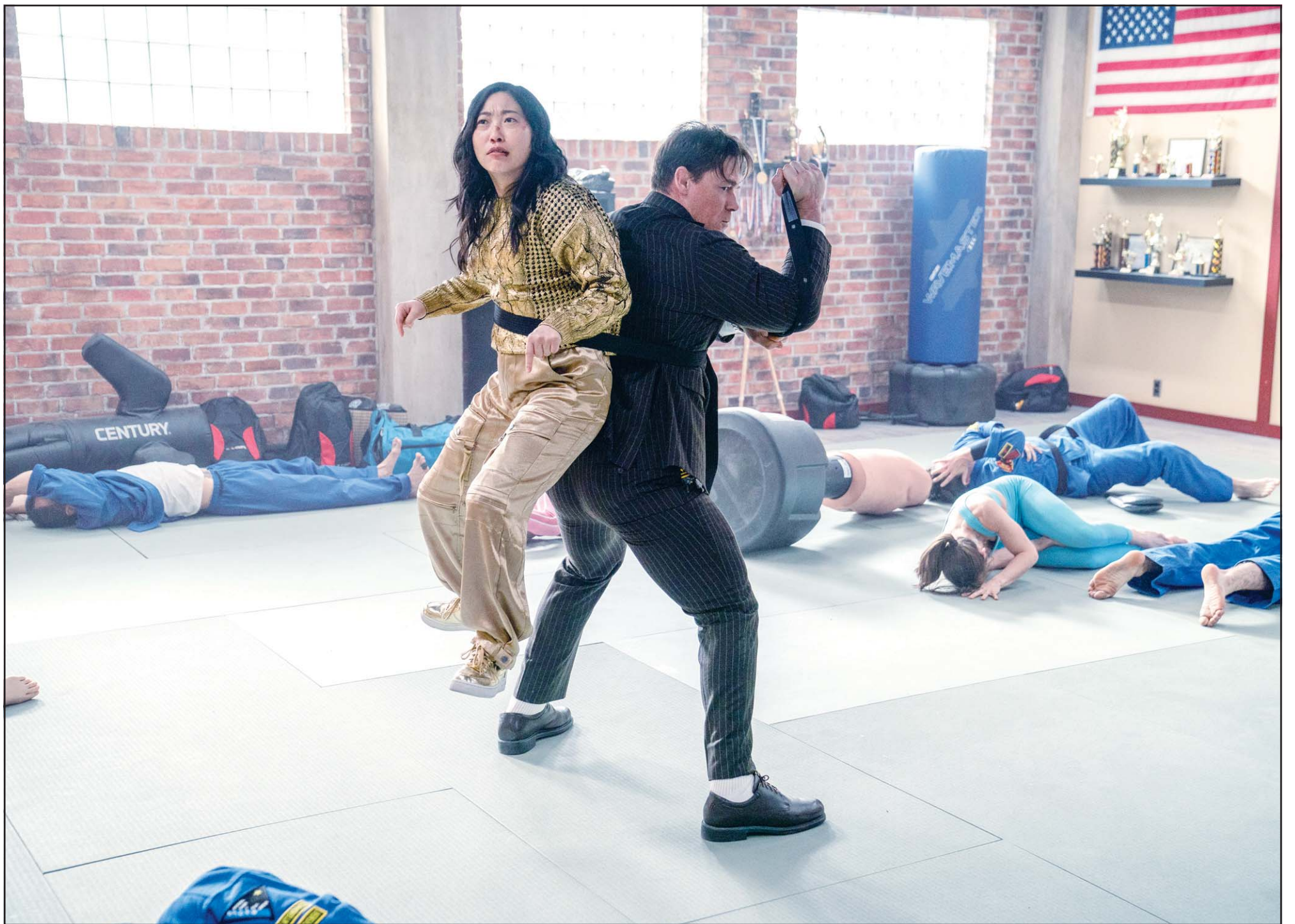
This image released by Prime Video shows John Cena, (right), and Awkwafina in a scene from 'Jackpot!'