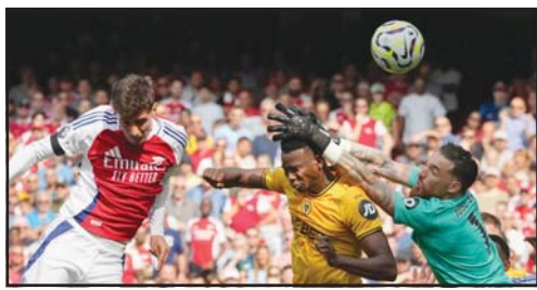
Arsenal's Kai Havertz, left, scores his side's opening goal during the English Premier League soccer match between Arsenal and Wolverhampton Wanderers at Emirates Stadium in London.