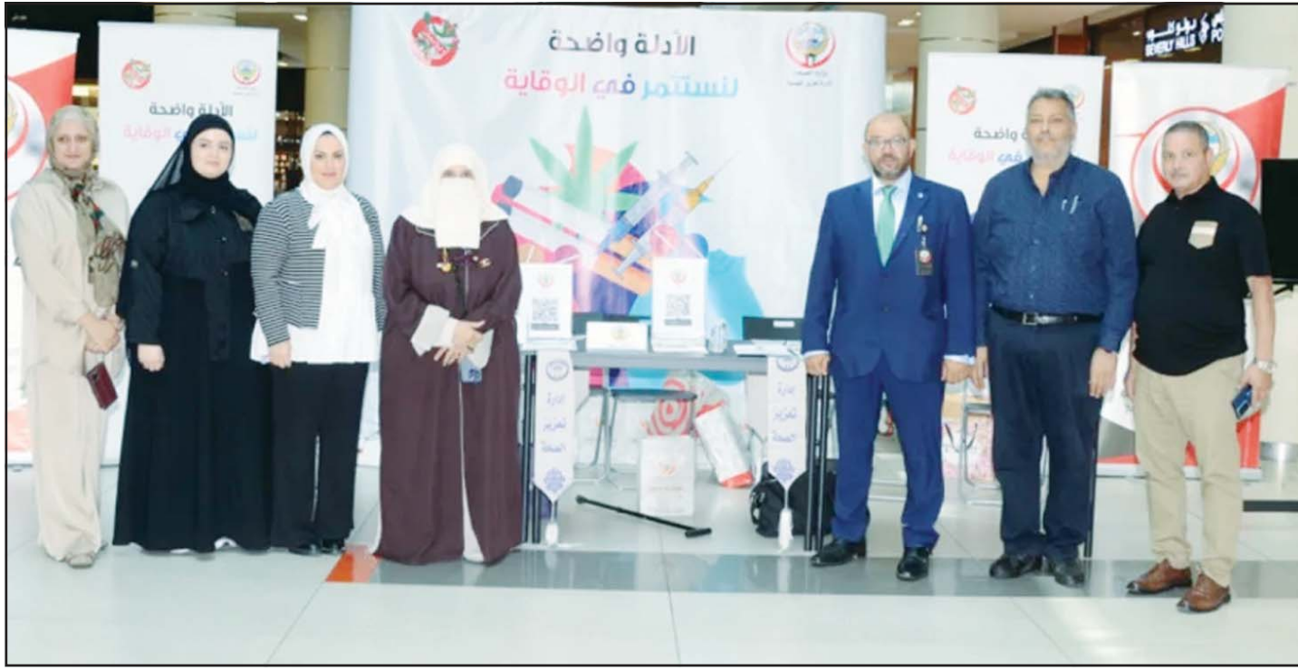
A group photo taken during the awareness campaign 'The evidence is clear ... Let us invest in prevention.'