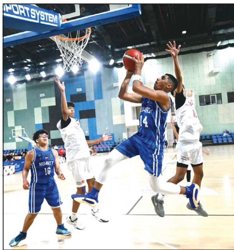
Kuwaiti player out jumps his opponents to score during the opening game of GBA Cup between Kuwait and UAE.

"He has fitted into the dressing room very well, with humility and he is very serious," said Ancelotti.