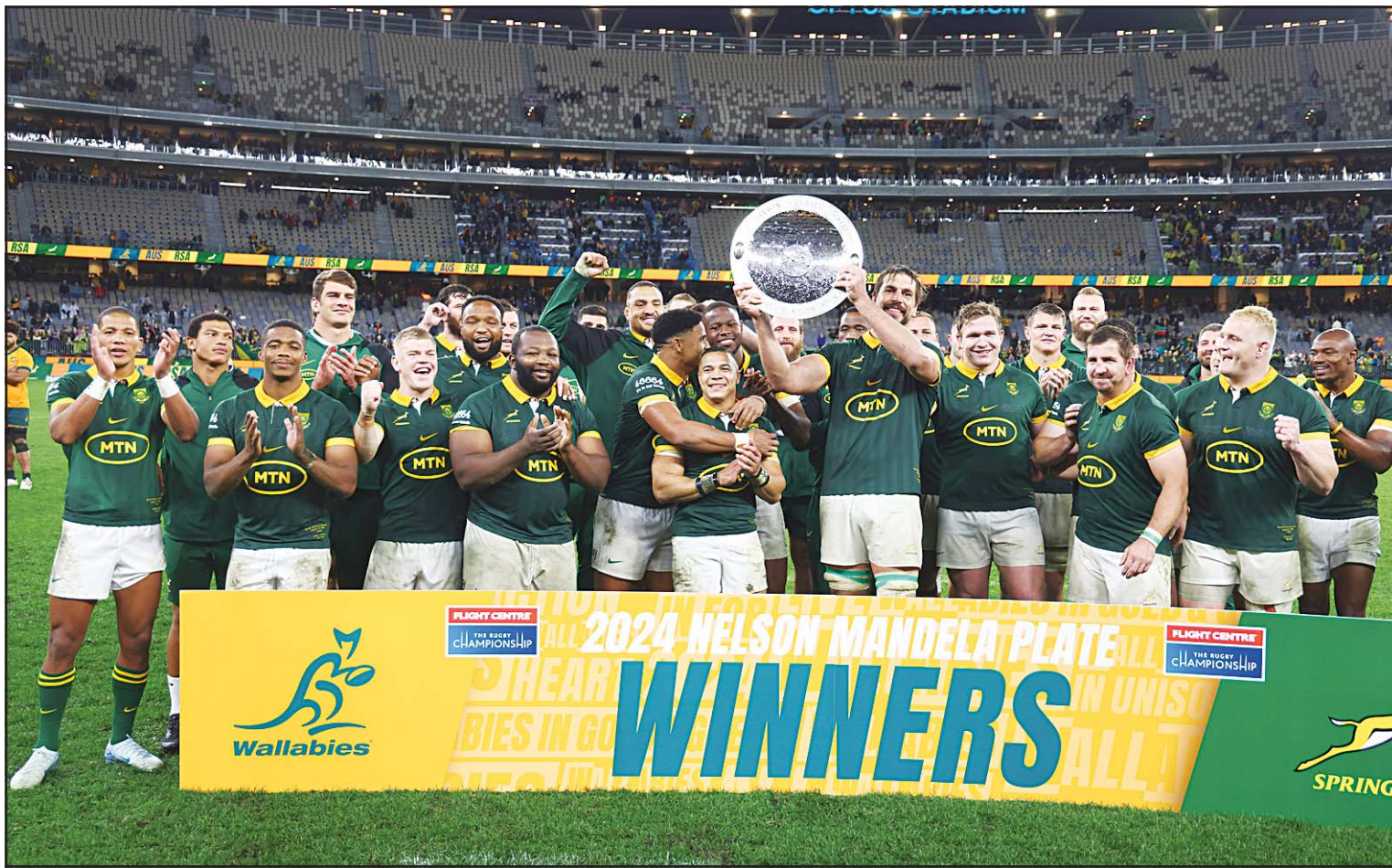
South Africa's players celebrate winning the Nelson Mandela plate after their victory over Australia in their rugby union test match in Perth.