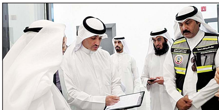
Government Performance Follow-up Agency's officials during the visit to the new addiction treatment center.

The necessary legal actions have been taken against the accused, and they have been referred to the Public Prosecution for further proceedings.