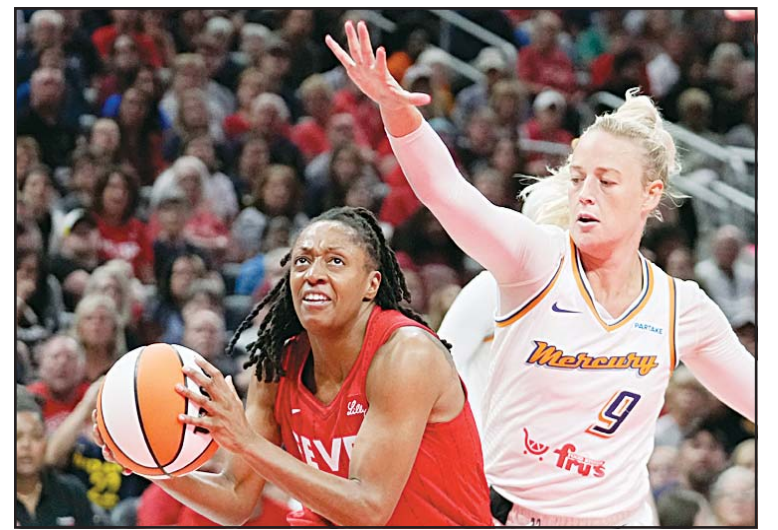
Indiana Fever's Kelsey Mitchell, left, goes to the basket against Phoenix Mercury's Sophie Cunningham (9) during the second half of a WNBA basketball game in Indianapolis.

Satou Sabally finished with 20 points, eight rebounds, seven assists and two steals in her season debut for Dallas (6-20). The 2023 WNBA Most Improved Player missed the first 25 games of the season due to a shoulder injury sustained while helping Germany qualify for the Olympics.