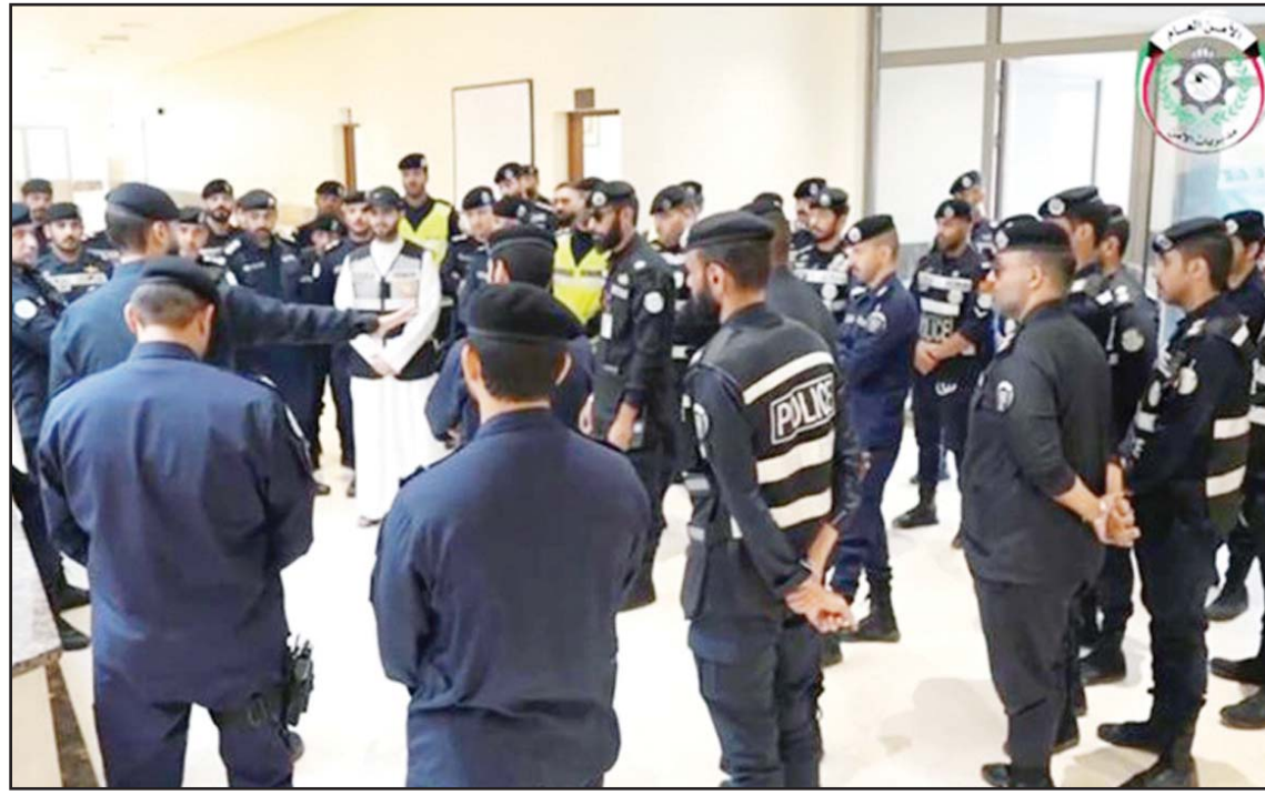
Security officers being briefed during the launch of security campaign.

– Compiled by PFX Fernandes and Mahmoud Ateyieh