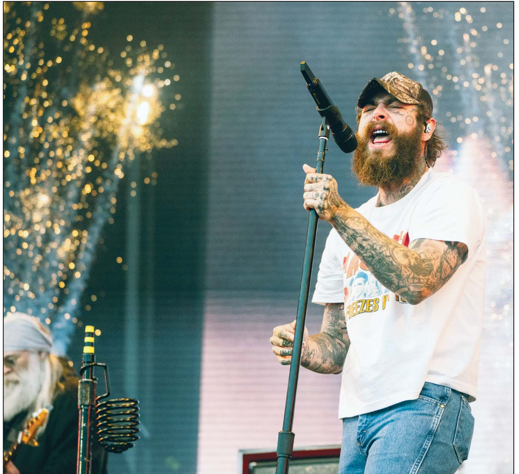
Post Malone performs at Outside Lands Music Festival on Sunday, Aug. 11, in San Francisco.

French film producer Alain Terzian said Delon was "the last of the giants."