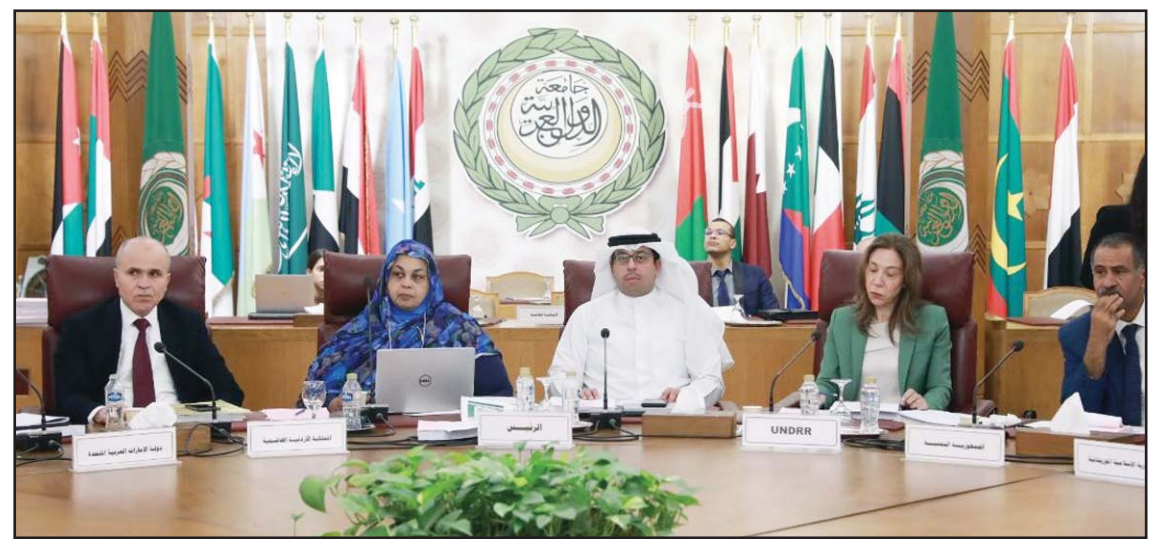
Part of the proceedings of the sixth meeting of the Arab Coordination Mechanism for Disaster Risk Reduction, with the participation of Kuwait.

The second meeting of Arab ministers concerned with disaster risk reduction is scheduled to take place at the League of Arab States headquarters, Wednesday.