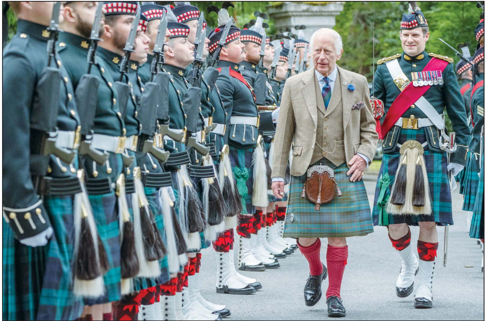
Britain's King Charles III inspects the Balaklava Company, 5th Battalion, The Royal Regiment of Scotland, at the gates of Balmoral, Scotland on Aug 19 as he takes up summer residence at the castle.

The recent civil disorder has heaped pressure on prisons in England and Wales, which were already running out of room amid budget constraints, a growing population and tougher sentencing guidelines.