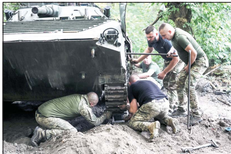
In this photo provided by Ukraine's 24th Mechanised Brigade press service, servicemen of 24th mechanised brigade repair tracks of a BRM1k infantry fighting vehicle near Chasiv Yar town, in Donetsk region, Ukraine on Aug 17. Ukrainian local authorities on Aug 19 ordered families with children to urgently evacuate the eastern city of Pokrovsk.

"The remains are currently in the process