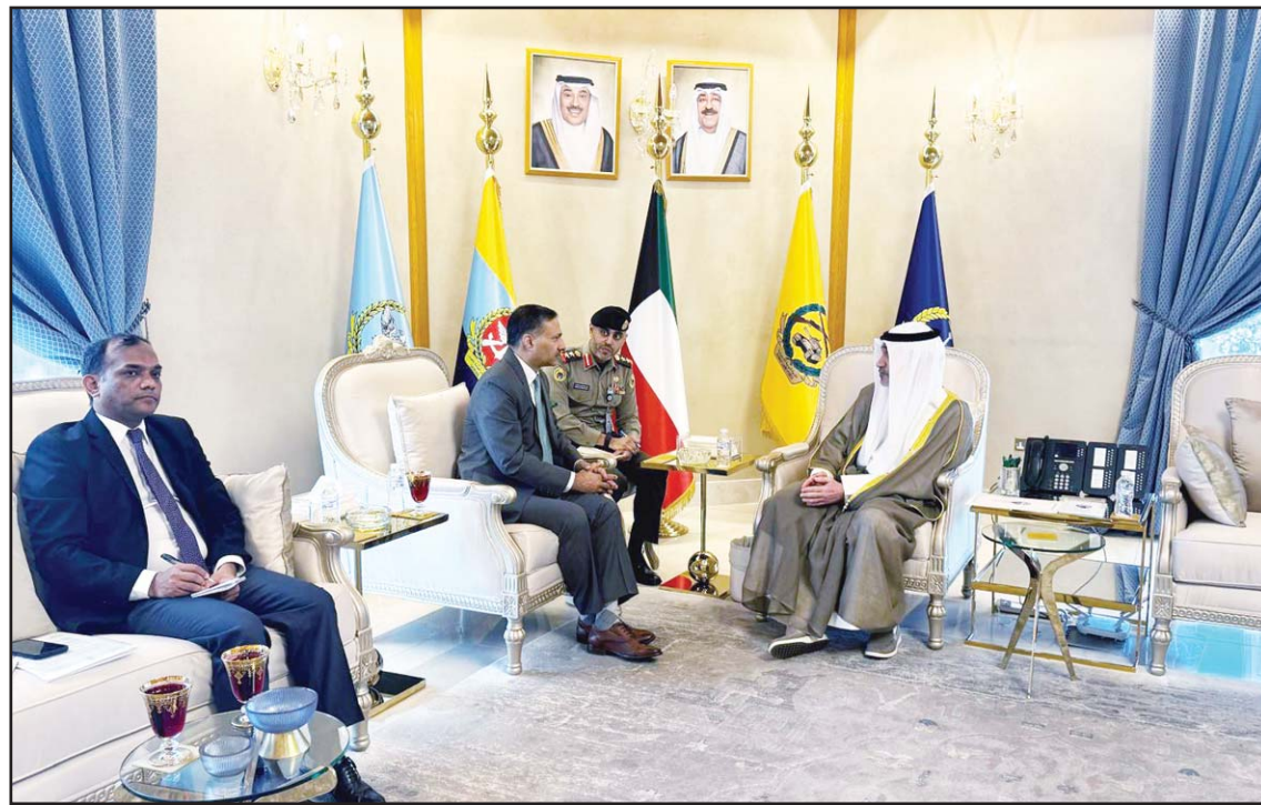
Ambassador Dr Swaika with First Deputy Prime Minister, Minister of Defense and Interior Sheikh Fahad.