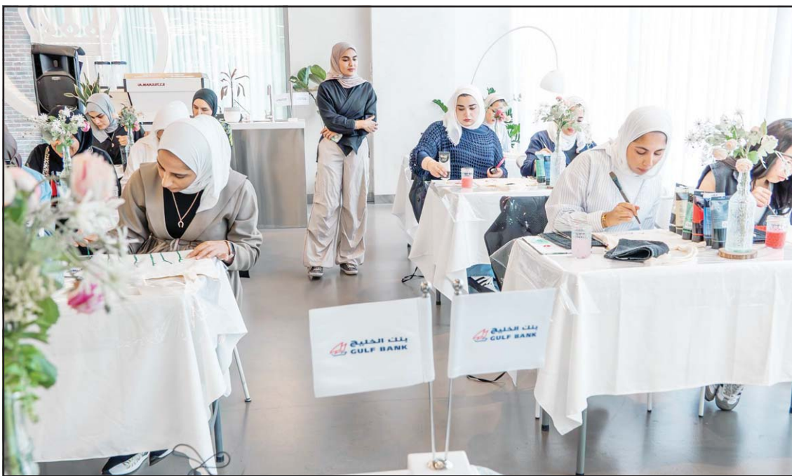
A glimpse of the activities of the tote bag painting workshop.

LOYAC is a nonprofit organization that runs several programs for the youth to develop their professional skills, enhance their personal growth and help them find their sense of purpose by extending themselves to others.