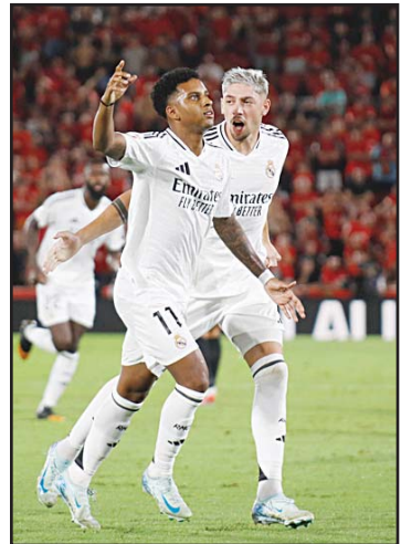
Real Madrid's Rodrygo, left, celebrates with Federico Valverde after scoring the opening goal during a Spanish La Liga soccer match between Mallorca and Real Madrid at the Son Moix Stadium in Palma de Mallorca, Spain.

Real Sociedad, which finished sixth last season, was upset 2-1 at home by Rayo Vallecano, which fought to avoid relegation in the last campaign.