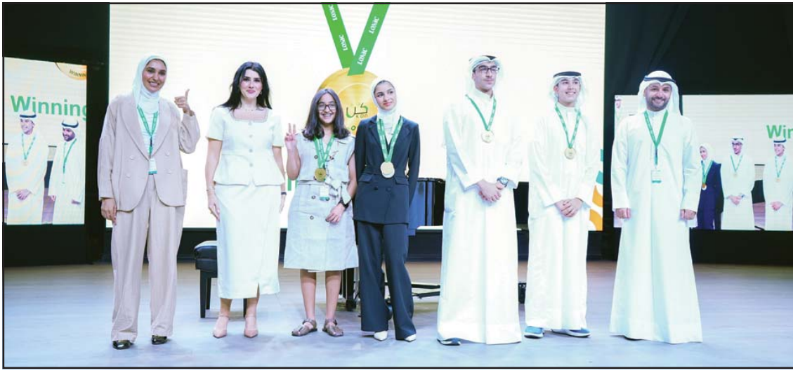
NBK &amp; LOYAC leaders in social entrepreneurship training program.