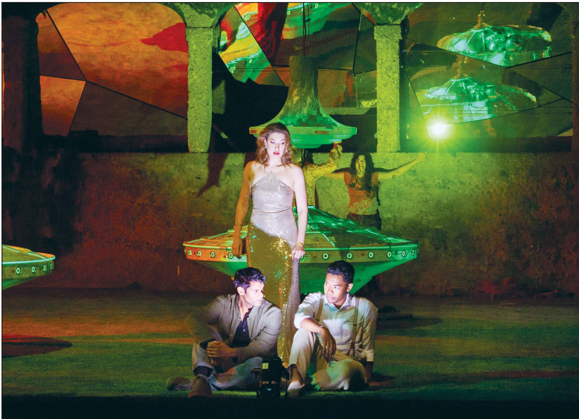
This image released by the Salzburg Festival shows a performance of Sergei Prokofiev's 'The Gambler' by director Peter Sellars on Sept. 25, 2023. (AP)