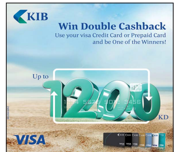
KIB's Summer Card Campaign

It is worth noting that KIB spares no effort in launching different banking initiatives in partnership with Visa, such as the "Surprises for Every Season" campaign, the February promo-