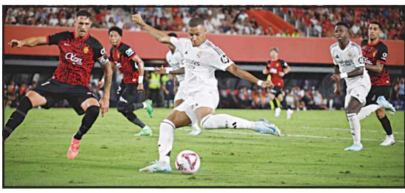
Real Madrid's Kylian Mbappé, centre, prepares to shoot on goal during a Spanish La Liga soccer match between Mallorca and Real Madrid at the Son Moix Stadium in Palma de Mallorca, Spain.