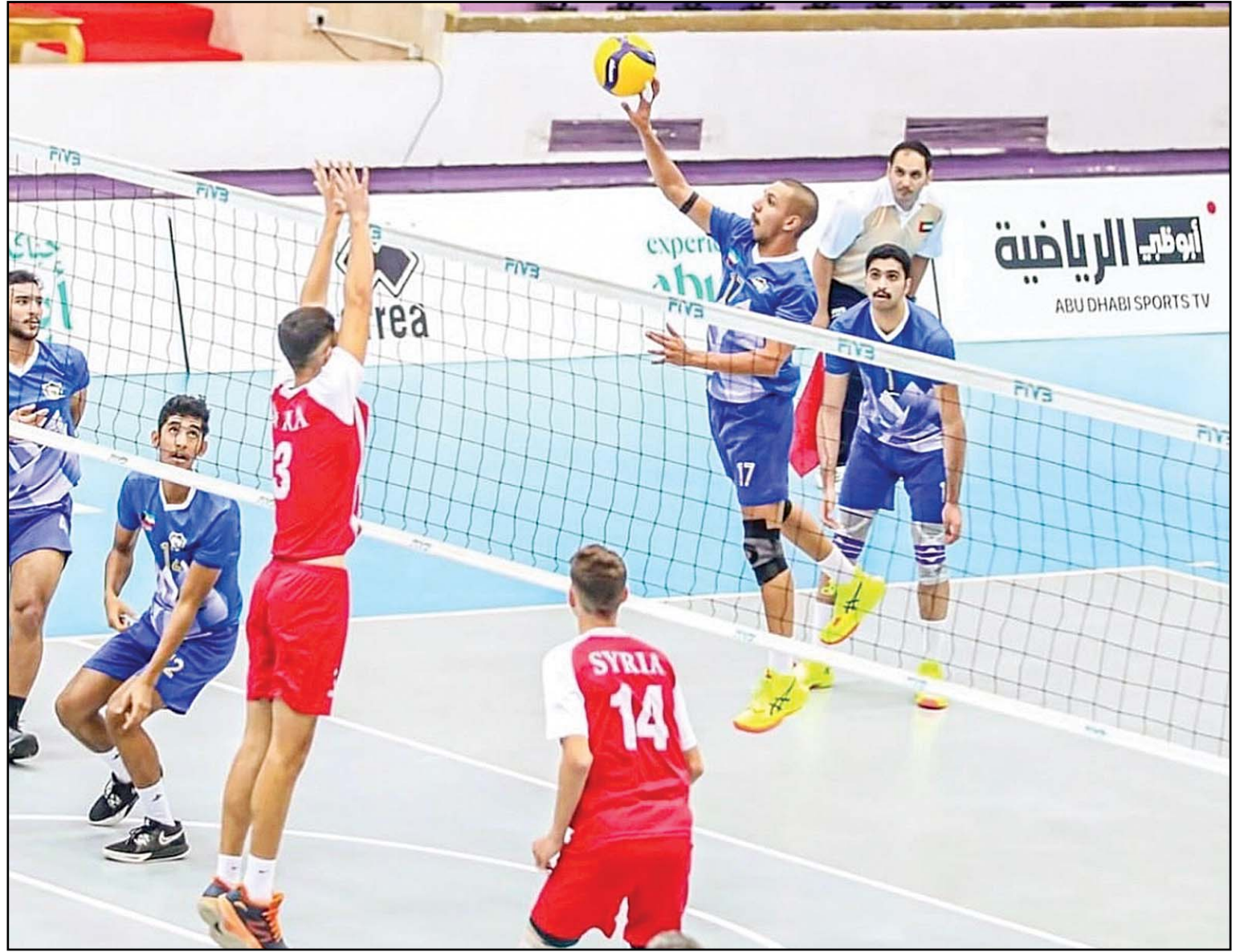
A Kuwaiti player goes for a spike as an opponent defends during the West Asian Volleyball Championship match between Kuwait and Syria.