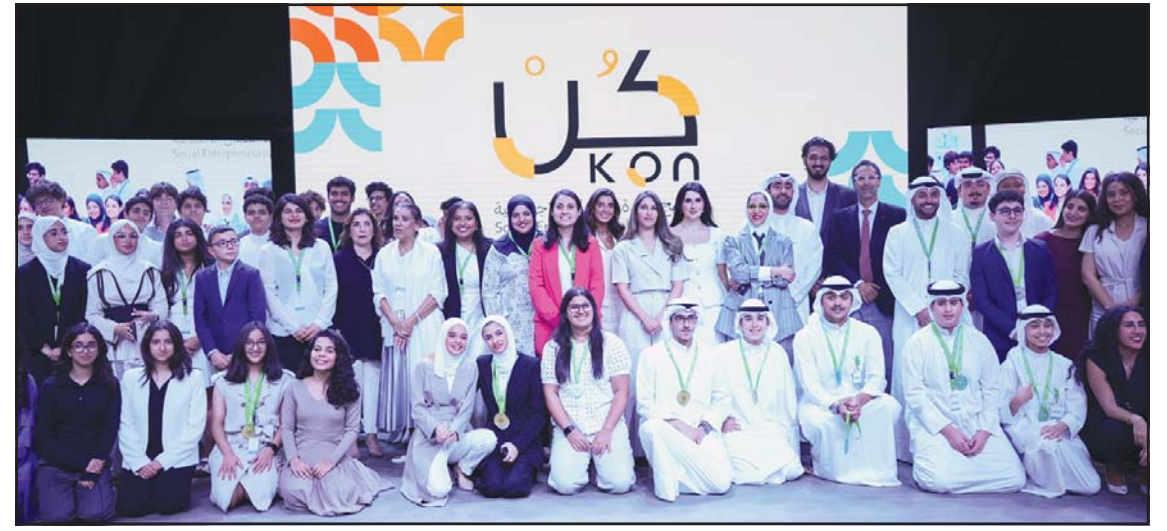
Group picture of the social entrepreneurship training program.