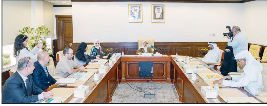
Photo during the announcement of the winners of the Kuwait International Children's Story Writing Competition in the field of charitable and voluntary endowments for the sixth season.