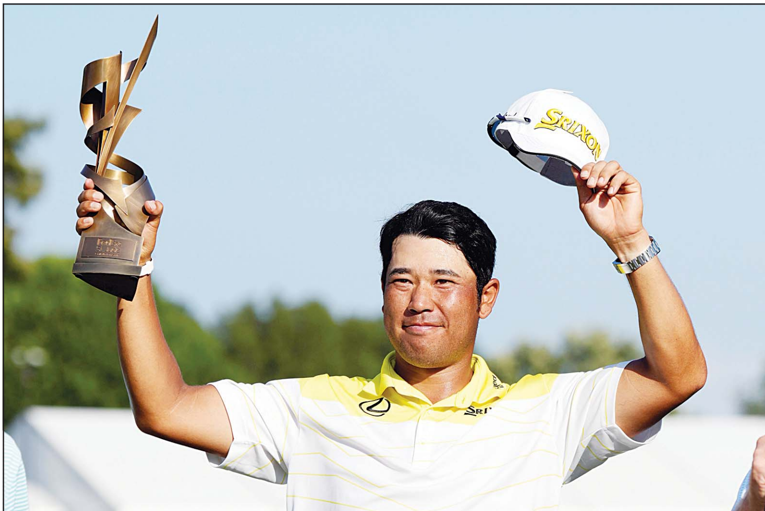
Hideki Matsuyama of Japan is presented with his trophy after winning the St. Jude Championship golf tournament in Memphis, Tenn.