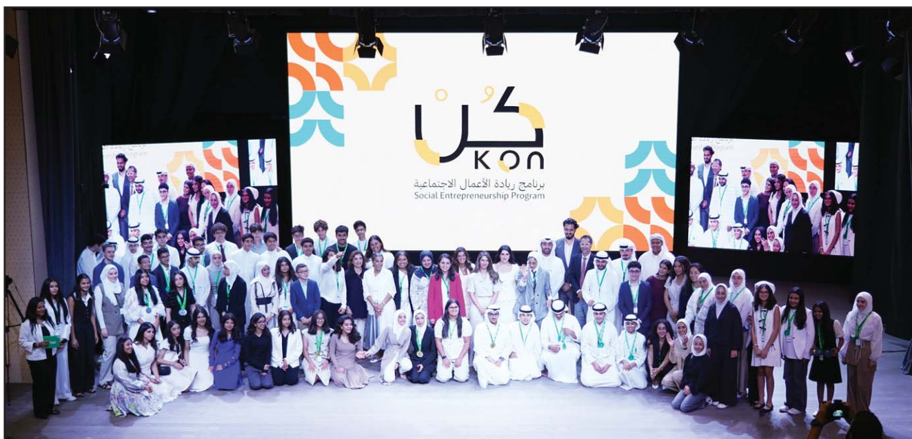
Officials from Zain, LOYAC, and partners with the participants.