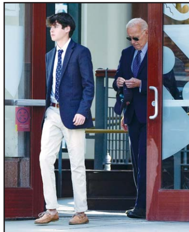
US President Joe Biden follows his grandson Hunter Biden out of the University of Pennsylvania bookstore during a campus visit in Philadelphia on Aug 16. House Republicans have released their initial impeachment inquiry report into Biden, alleging an abuse of power and obstruction of justice in the financial dealings of his son Hunter Biden and family associates.

Southwestern Pennsylvania is a critical part of a key battleground state that has long commanded the attention of presidential candidates. The state voted for Trump in 2016 and for Biden in 2020. Both Harris and Trump are vying to see who can put Pennsylvania in their column on Nov. 5.