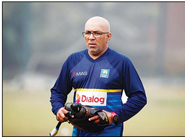
In this file photo, Sri Lanka's head coach Chandika Hathurusingha walks on the field during a training session ahead of the Tri-Nation one-day international cricket series in Dhaka, Bangladesh.

Rawalpindi will also host the second test from Aug. 30.