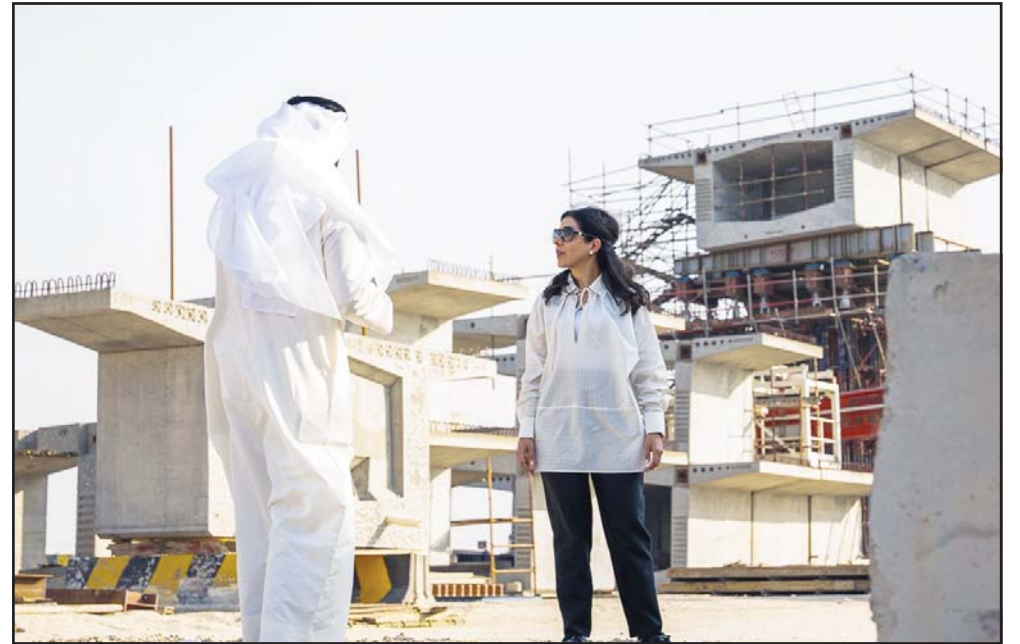
Minister of Public Works and Minister of State for Municipal Affairs, Dr. Noura Al-Mashaan, during the inspection tour of the Sabah Al-Nasser Bridge project.

She assured that the completion of the bridge project linking Sabah Al-Nasser area and Sulabiya Road No. 604 will solve all previous problems of water accumulation in this area, especially during the winter and rainy seasons.