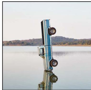
This cover image released by Mercury/Republic Records shows 'F-1 Trillion' by Post Malone.

Now, he's 29. The message is prescient. At age 29, his arrival is a bit early. It's also right on time.