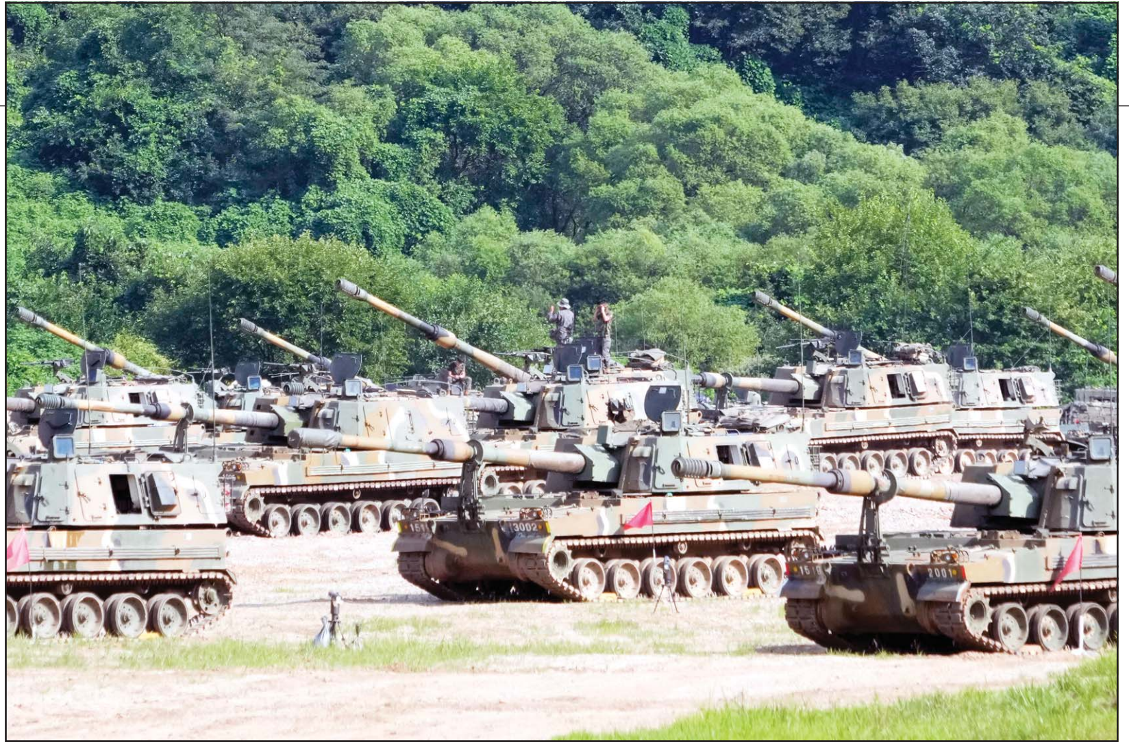
South Korean army soldiers work on their K-9 self-propelled howitzer in Paju, South Korea, near the border with North Korea on Aug 19.

He said the armed forces will continue to serve in aid of civil power as long as the situation warrants. "Our government remains pledge-bound to ensure the safety and security of all religious and ethnic groups."