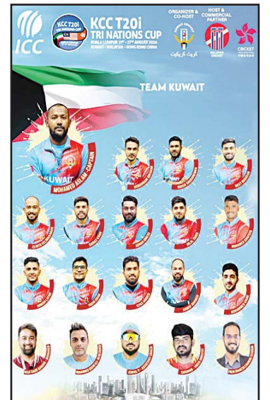
Top and above flyers of the T20 International Tri-Nations Cup.

ing such opportunities for associate players to showcase their talents on an international stage such as this, and mentioned that his boys are absolutely pumped up and looking forward to the tournament.