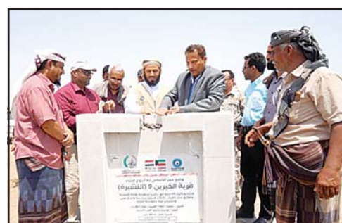
The Governor of Abyan lays the foundation stone for the construction of a Kuwaiti-financed residential village.