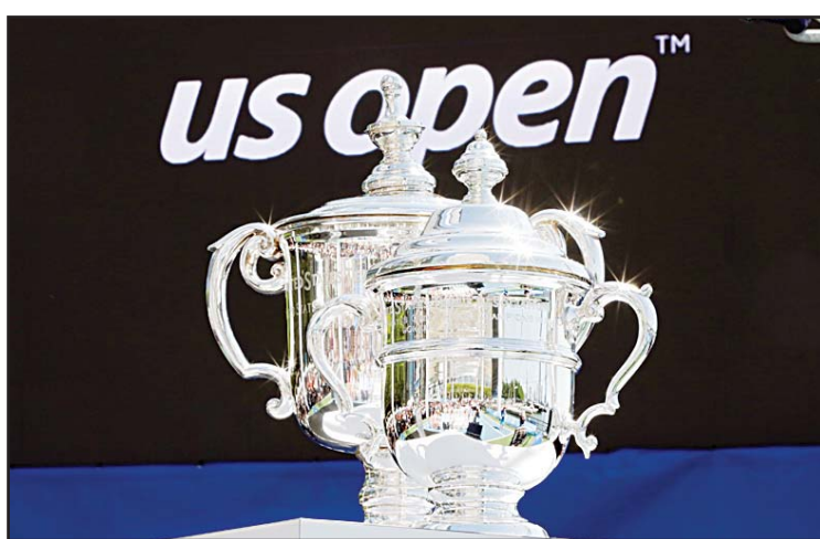
In this file photo, the winners' trophies are displayed during the reveal of the 2018 U.S. Open tennis tournament draw, in New York.

She will walk away from the U.S. Open, where play begins Aug. 26, with a minimum of $100,000, the amount earned by players losing in the first round.