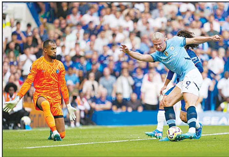
Manchester City's Erling Haaland scores his side's opening goal during the English Premier League soccer match between Chelsea and Manchester City at Stamford Bridge stadium in London, England.

"It was a technical decision, no more than that," Maresca said about Sterling being left out. "In the next day, we will clarify in case we need to.