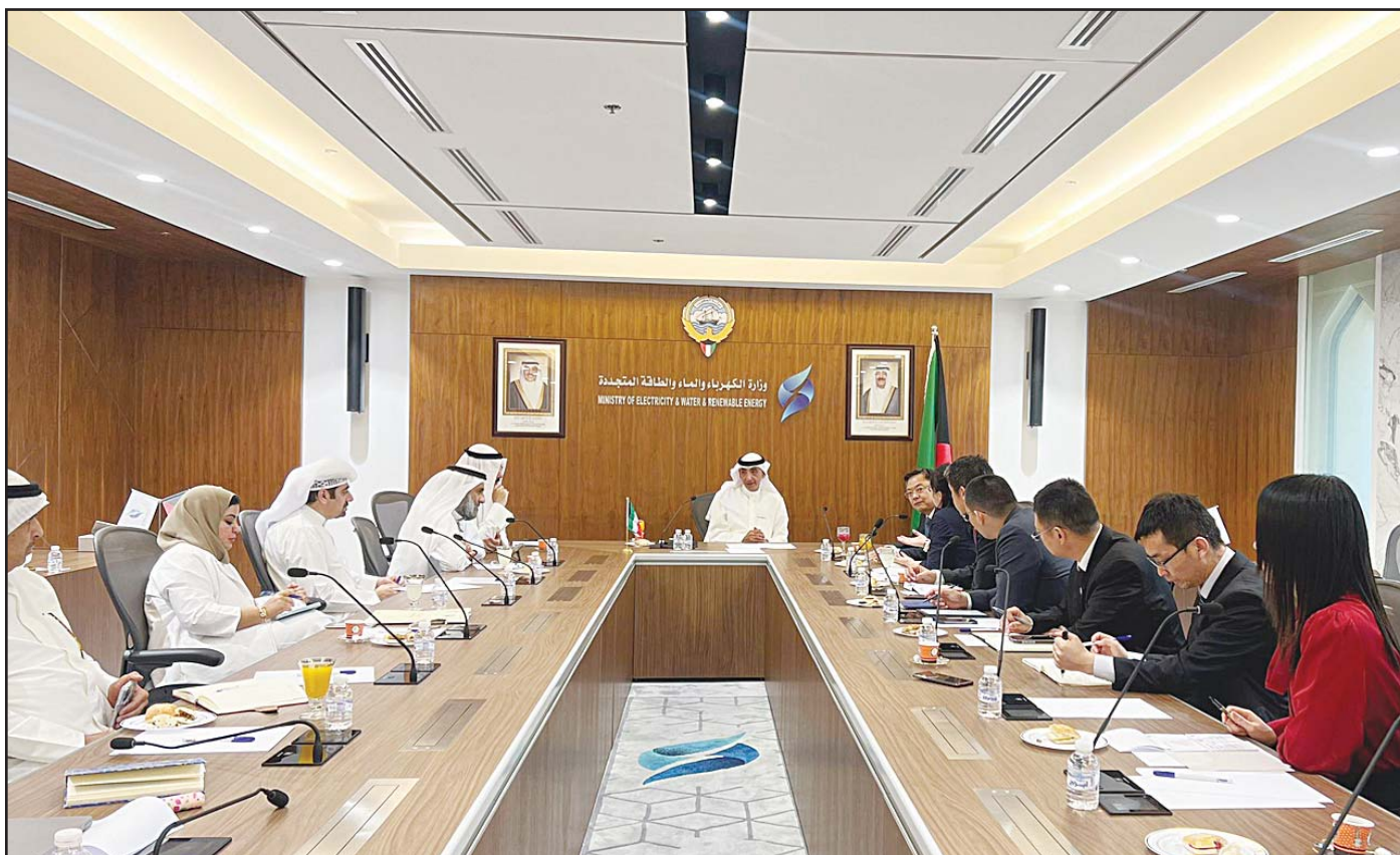
Minister of Electricity, Water and Renewable Energy Mahmoud Bushehri discusses with a Chinese delegation a number of energy projects being implemented in the country.

Gradual restoration to full production: MEW