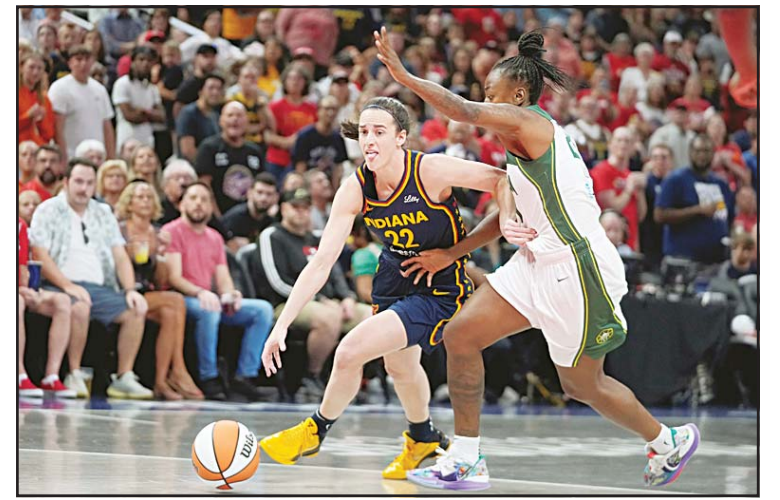
Indiana Fever's Caitlin Clark (22) goes to the basket against Seattle Storm's Jewell Loyd, right, during the first half of a WNBA basketball game in Indianapolis.

Angel Reese scored 19 points and grabbed a career-high 20 rebounds for Chicago (11-16). The No. 7 draft pick has grabbed double-digit rebounds in 20 consecutive games. After just 27 games, she is the fastest in league