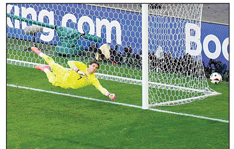
In this file photo, Switzerland's goalkeeper Yann Sommer dives to attempt a save during a quarterfinal match between England and Switzerland at the Euro 2024 soccer tournament in Duesseldorf, Germany. (AP)