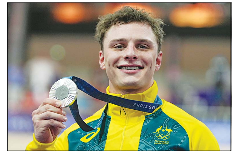
Matthew Richardson of Australia shows the silver medal of the men's sprint event, at the Summer Olympics in Paris, France.