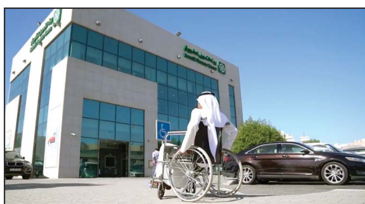
One of the branches of KFH.

KFH employees receive extensive training in sign language to assist custom-