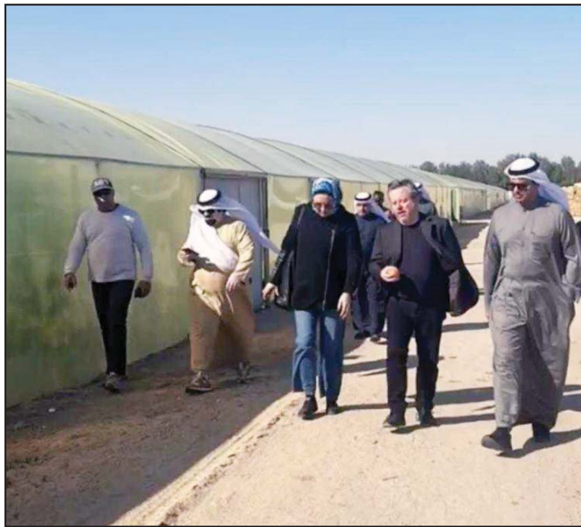
The US embassy delegation tours Wafra farms.

KUWAIT CITY, Jan 13: The Ministry of Endowments and Islamic Affairs has started preparing for the holy month of Ramadan that will most likely begin on March 10, reports Al-Qabas daily quoting a reliable source.