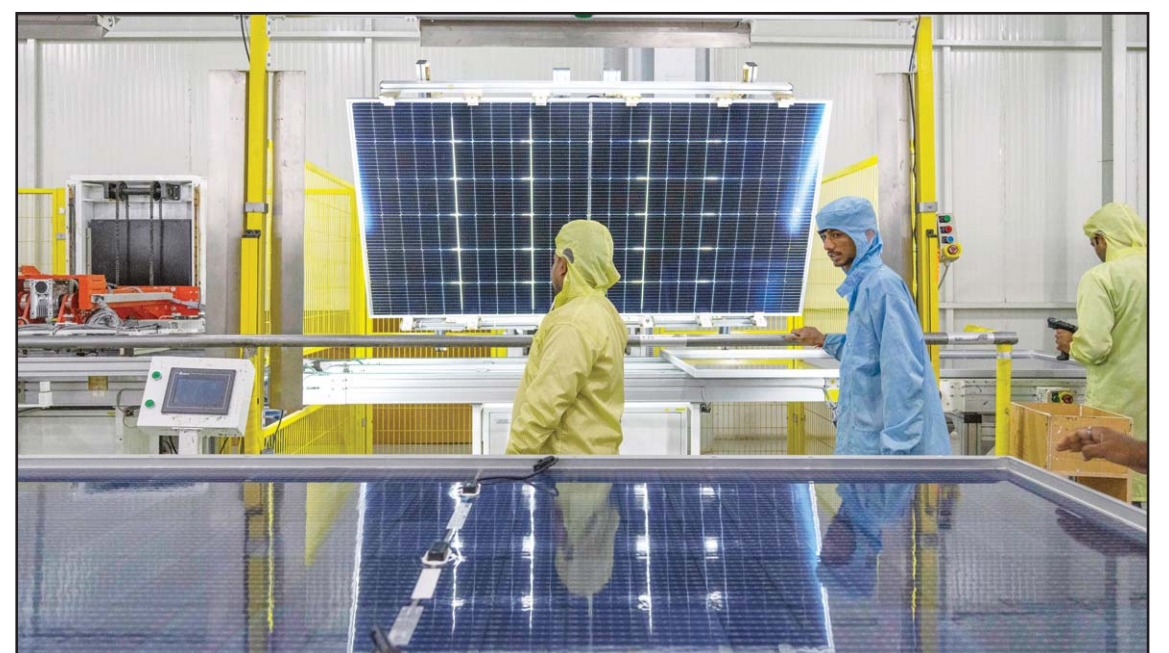
Employees work at the Adani New Industries Limited, one of India's largest solar panels and wafers manufacturing facility in the port town of Mundra in Western India's Gujarat state, India, Sept. 20, 2023. The world's renewable energy grew at its fastest rate in the past 25 years in 2023, the International Energy Agency reported Jan. 11, 2024.

IEA Executive Director Fatih Birol said renewable energy is on course to increase by 2 1/2 times by 2030. That would fall short of the tripling that nations agreed on at last month's annual United Nations climate talks in Dubai, but Birol said the goal is reachable. Increasing funds for clean energy