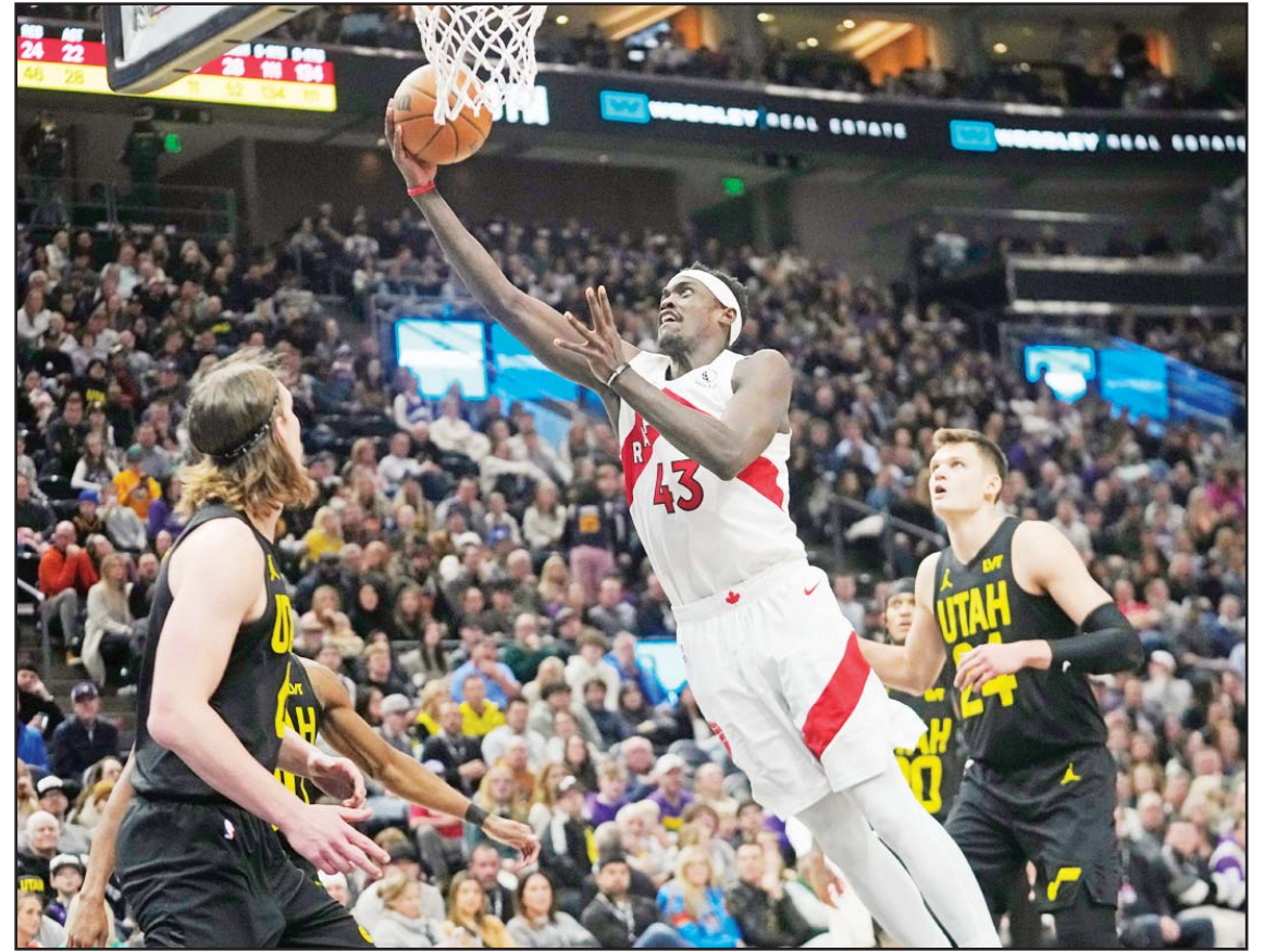
Toronto Raptors forward Pascal Siakam (43) goes to the basket as Utah Jazz's Kelly Olynyk (left) and Walker Kessler (24) watch during the second half of an NBA basketball game Friday, Jan 12, 2024, in Salt Lake City.