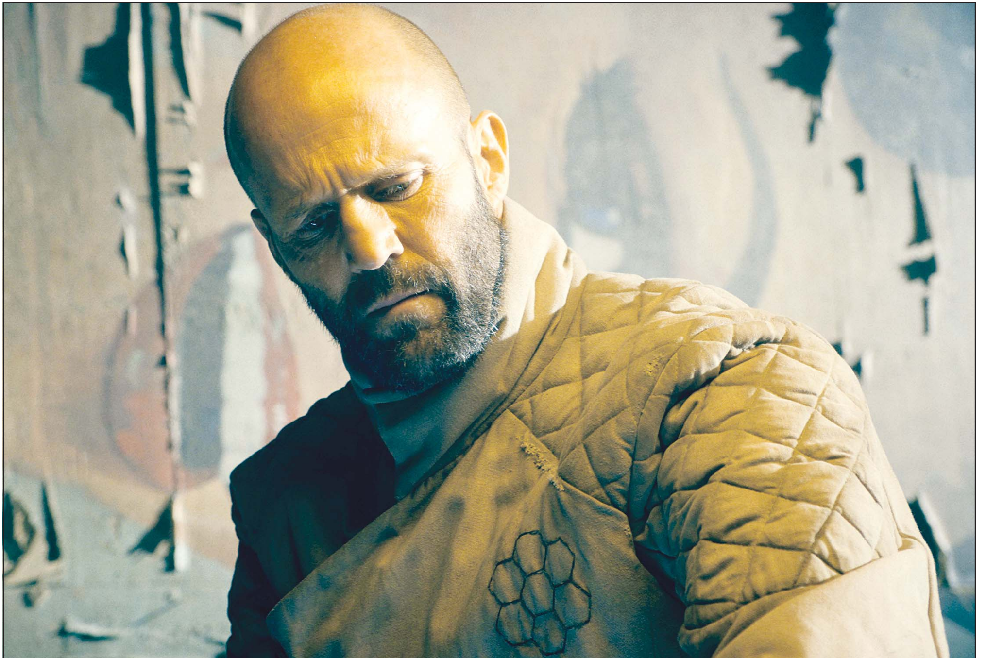
This image released by Amazon MGM Studios shows Jason Statham in a scene from 'The Beekeeper.'