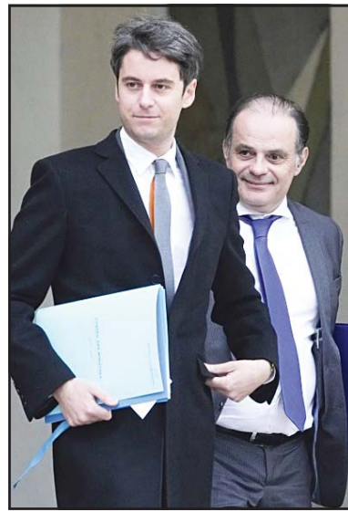
New French Prime Minister Gabriel Attal, (left), and chief of staff of French Prime Minister Emmanuel Moulin, leave the weekly cabinet meeting after a cabinet reshuffle, on Jan 12, 2024 at the Elysee Palace in Paris. (AP)

'Stop blocking agents': The Justice Department on Friday asked the Supreme Court to order Texas to stop blocking Border Patrol agents from a portion of the U.S.-Mexico border where large numbers of migrants have crossed in recent months, setting up another showdown between Republican Gov Greg Abbott and the Biden administration over immigration enforcement. The request comes after Texas put up fencing to take control of a nearly 50-acre (20-hectare) public park along the Rio Grande in Eagle Pass, which was a crossing point for thousands of migrants entering from Mexico last year. Although a similar power struggle played out in the same region more than a year ago, the area Texas closed off this week prevents federal agents from accessing a larger and more visible crossing spot. (AP)