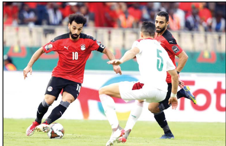
In this file photo, Egypt's Mohamed Salah (left), and Morocco's Nayer Aguerd challenge for the ball during the African Cup of Nations 2022 quarter-final soccer match between Egypt and Morocco at the Ahmadou Ahidjo stadium in Yaounde, Cameroon.

Nigeria, with a rich history in the tournament, seeks to add to their three titles. The African Cup of Nations promises intense competition and showcases the continent's football prowess.