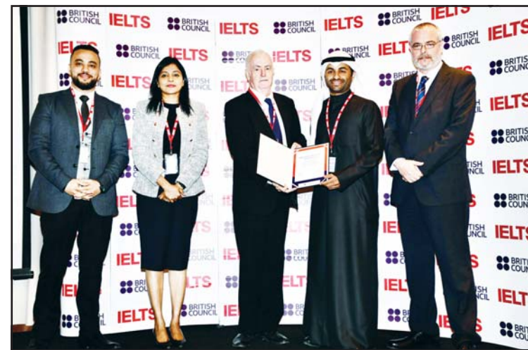
Photo during the forum organized by the British Council.

IELTS is considered a gateway for the transformation of the lives of millions of people every year due to its influential contribution in opening doors to opportunities in education, employment, and even for moving to a new country.