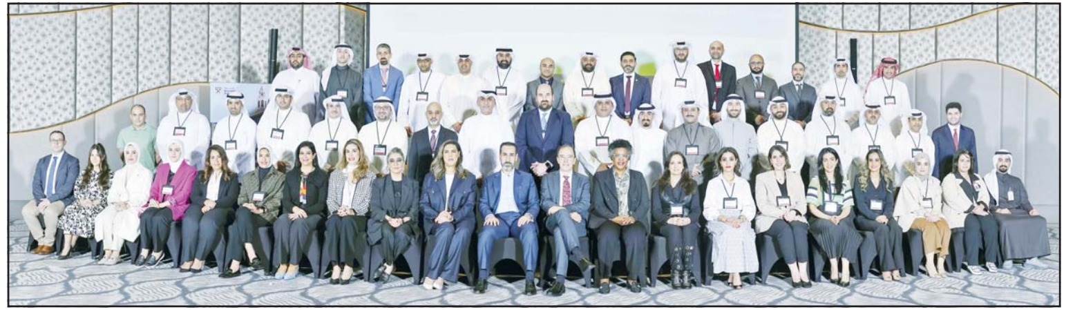
Kuwait Institute of Banking Studies (KIBS) executive education program group photo.

KIBS extends its gratitude all participants who partook in the program from Kuwait and the GCC.