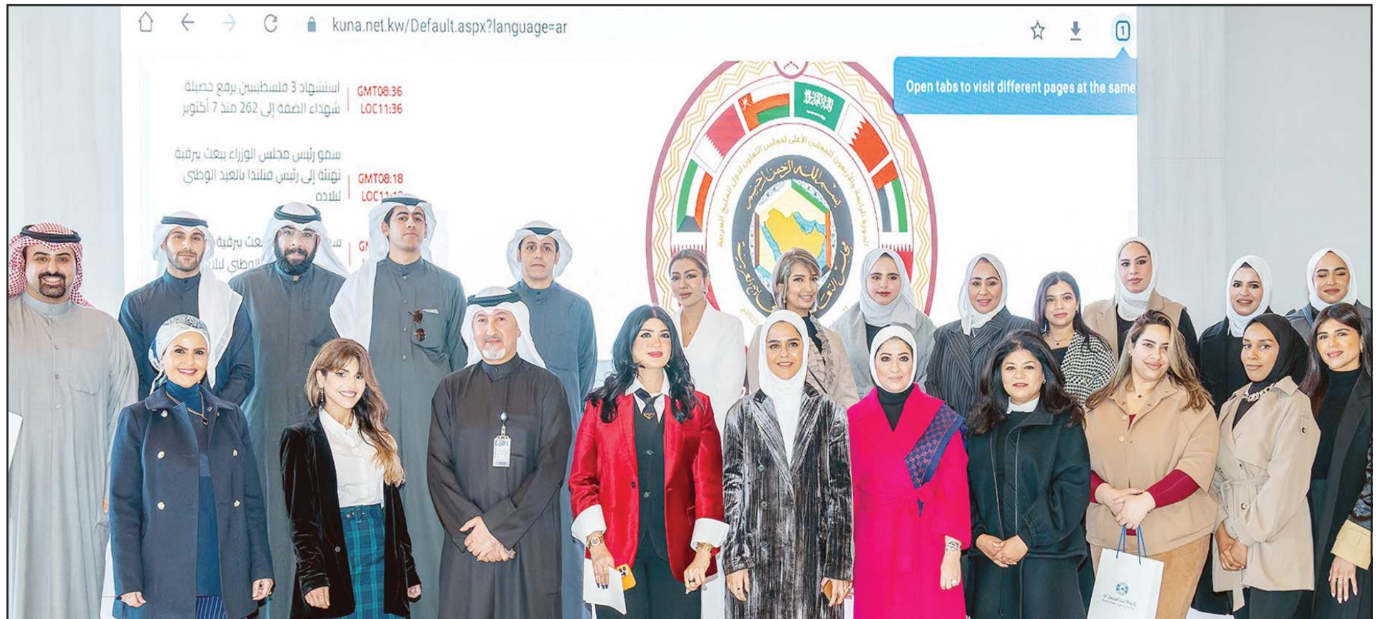
A delegation from the Ministry of Information visits KUNA and is briefed on its working mechanism and news services.