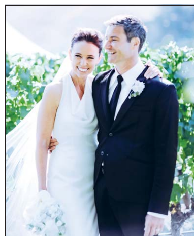
In this image supplied by Dame Jacinda Ardern and Clarke Gayford, former New Zealand Prime Minister Jacinda Ardern embraces her husband Clarke Gayford at their wedding in Havelock North, New Zealand on Jan 13.

Ruto's projects have become unpopular partly due to the fact the government is levying more taxes to fund them at a time when Kenyans are experiencing increases in the cost of living. An increase in fuel taxes that Ruto says is necessary for the country not to default on paying public debt has been particularly painful.