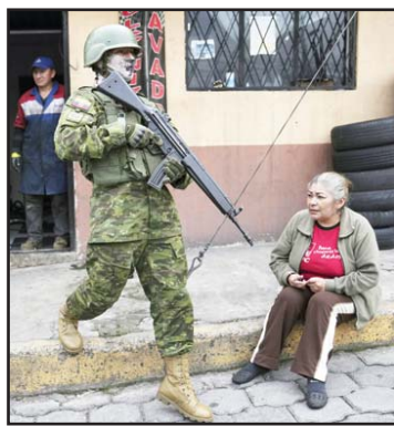
Soldiers patrol a residential area on the south side of Quito, Ecuador, Friday, Jan. 12, 2024, in the wake of the apparent escape of a powerful gang leader from prison. President Daniel Noboa decreed Monday a national state of emergency, a measure that lets authorities suspend people's rights and mobilize the military in places like the prisons.

Noboa's tax proposal, sent to the national assembly last night, would