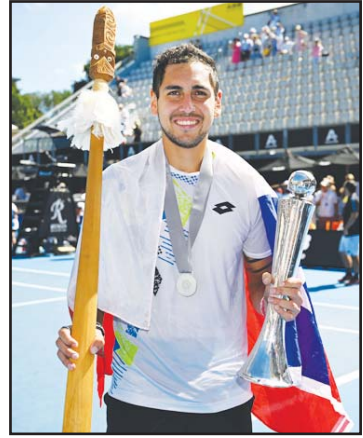
Alejandro Tabilo of Chile poses with his trophies after defeating Taro Daniel of Japan in the final of the ASB Classic tennis tournament in Auckland, New Zealand, Saturday, Jan. 13, 2024.

The 22-year-old Navarro outlasted Mertens of Belgium over 2 hours, 48 minutes to continue her extraordinary