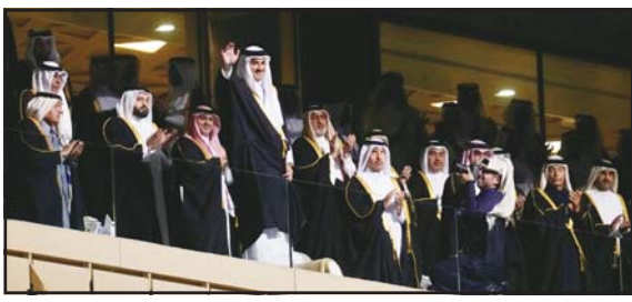
The Amir of Qatar, Sheikh Tamim bin Hamad Al Thani (centre), waves from the tribune during the opening ceremony ahead of the Asian Cup Group A soccer match between Qatar and Lebanon at the Lusail Stadium in Lusail, Qatar.