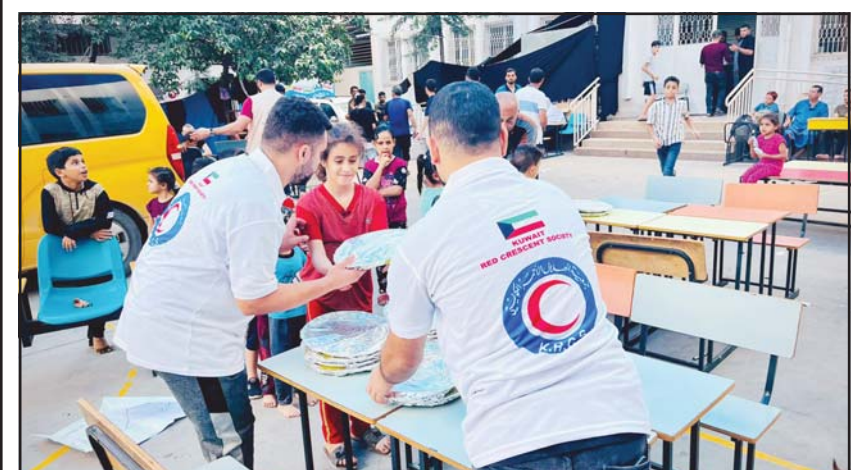
KRCS volunteers distributing food at a Palestinian refugee camp.

They highlighted that the water network implementation projects in the city are advanced and ahead of the timetables set for them. This is within the general framework for the ministry to provide its various services in various areas, especially new residential cities, in coordination with various relevant government agencies.