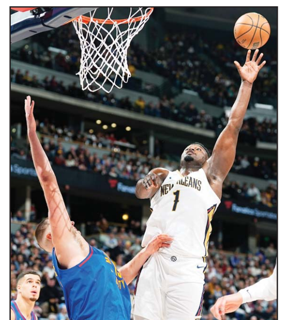
New Orleans Pelicans forward Zion Williamson (right) drives to the basket as Denver Nuggets center Nikola Jokic defends during the second half of an NBA basketball game, Friday, Jan. 12, 2024, in Denver.

Detroit is 1-35 after a 2-1 start, including an NBA-record matching 28-game losing streak. The current streak started with a 136-113 loss to Houston. Jaden Ivey had an open look at a 3-pointer with three sec-