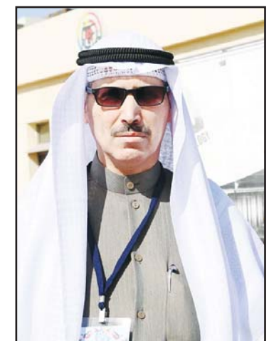
One of the officials who attended the meeting.