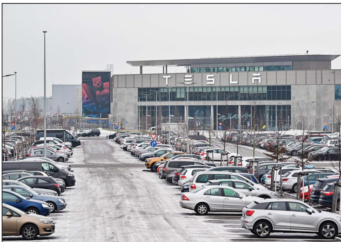
A view of the Tesla Gigafactory Berlin-Brandenburg plant in Grunheide, Germany, Friday, Jan. 12, 2024. Tesla largely suspended production in Germany, due to the Houthi attacks in the Red Sea: ships carrying the necessary parts are taking a detour around Africa, creating a gap in the supply chain.

BERLIN, Jan 13, - Tesla says it's temporarily halting most production at its German factory because of attacks in the Red Sea, a vital global shipping corridor.