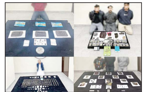
The alleged drug runners and the contraband seized.