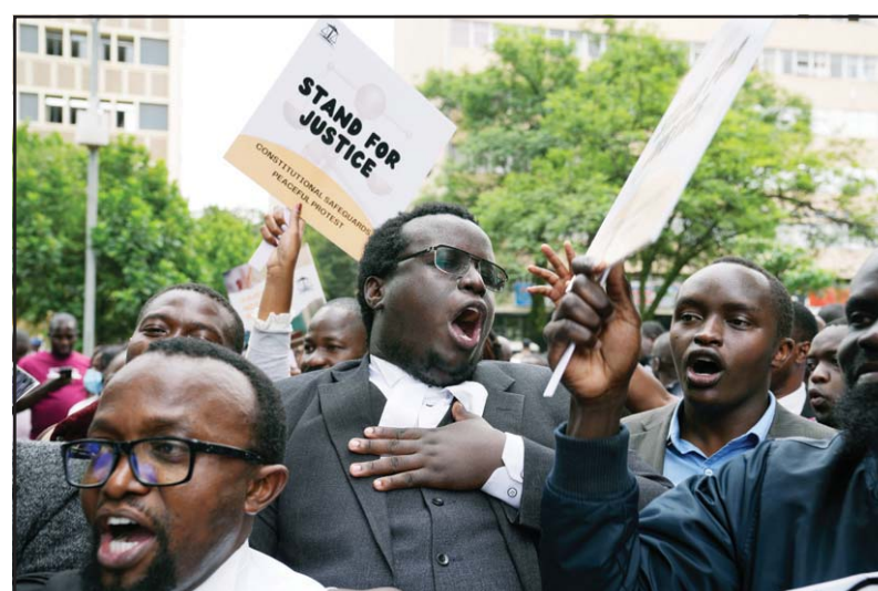
Human rights activists and members of the Law Society of Kenya hold a peaceful protest in which hundreds took part in Nairobi, Kenya on Jan 12. In recent weeks, Kenyan President William Ruto has threatened to disobey court orders, alleging that some judges are working with opposition politicians to block his administration's projects.

The government said it was giving more than $3 million to an emergency fund for