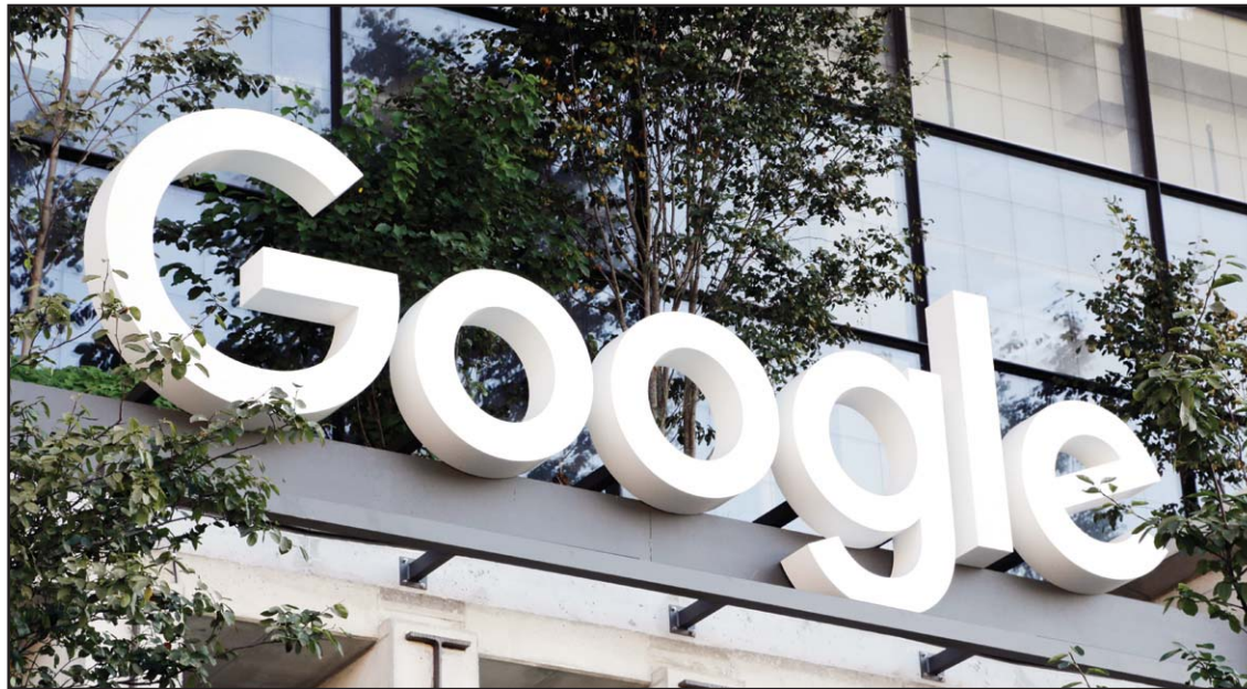
The Google sign is shown over an entrance to the company's new building in New York on Sept. 6, 2023. A legal adviser to the European Union's top court said Thursday that Google should still pay a whopping fine in a long-running antitrust case in which regulators found the company gave its own shopping recommendations an illegal advantage over rivals in search results.

Google made changes in 2017 to comply with the Eu-