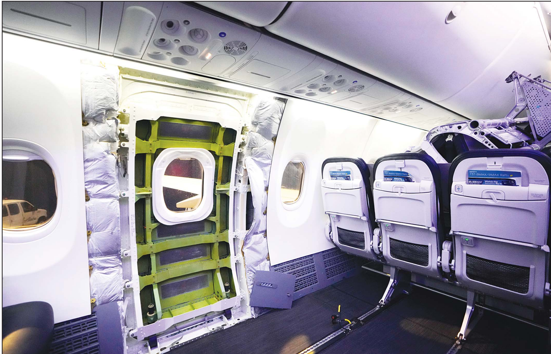
A door plug area of an Alaska Airlines Boeing 737 Max 9 aircraft awaiting inspection is pictured with paneling removed at the airline's facilities at Seattle-Tacoma International Airport Wednesday, Jan. 10, 2024, in SeaTac, Wash. The Federal Aviation Administration says it will audit Boeing's aircraft production and increase oversight of the troubled company after a panel blew off a jetliner in midflight last week.

committee that investigated the Max crashes, said Friday that the FAA's actions are needed to rein in quality and safety problems at Boeing.