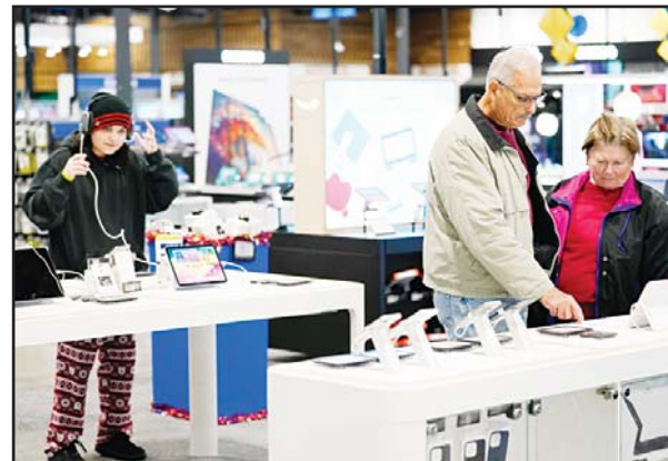
Shoppers browse computer tablets at a Best Buy store, Nov. 24, 2023, in Charlotte, N.C. The government is expected to report, Jan. 11, 2024, that underlying inflationary pressures eased further in December. (AP)

Excluding volatile food and energy costs, though, so-called core prices rose just 0.3% month over month, unchanged from November's increase. Core prices were up 3.9% from a year earlier - the mildest such pace since May 2021. Economists pay particular attention to core prices because, by excluding costs that typically jump around from month to month, they're seen as a better guide to the likely path of inflation. (AP)