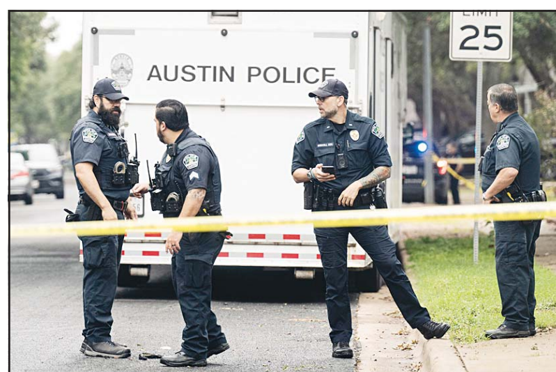
The Austin Police Department investigates the crime scene after an Austin police officer died following a shooting in South Austin, Texas on Nov 11, 2023. On Jan 11, 2024, a grand jury has cleared three Texas police officers who fatally shot a man who shot and killed another officer while wounding another officer and is believed to have killed his mother and brother.

Authorities established communications using a GPS texting device with the two men. Following a search of the area, the pair were located and transported for medical care, the sheriff's office said. One of the men suffered a broken arm, KREM-TV reported.