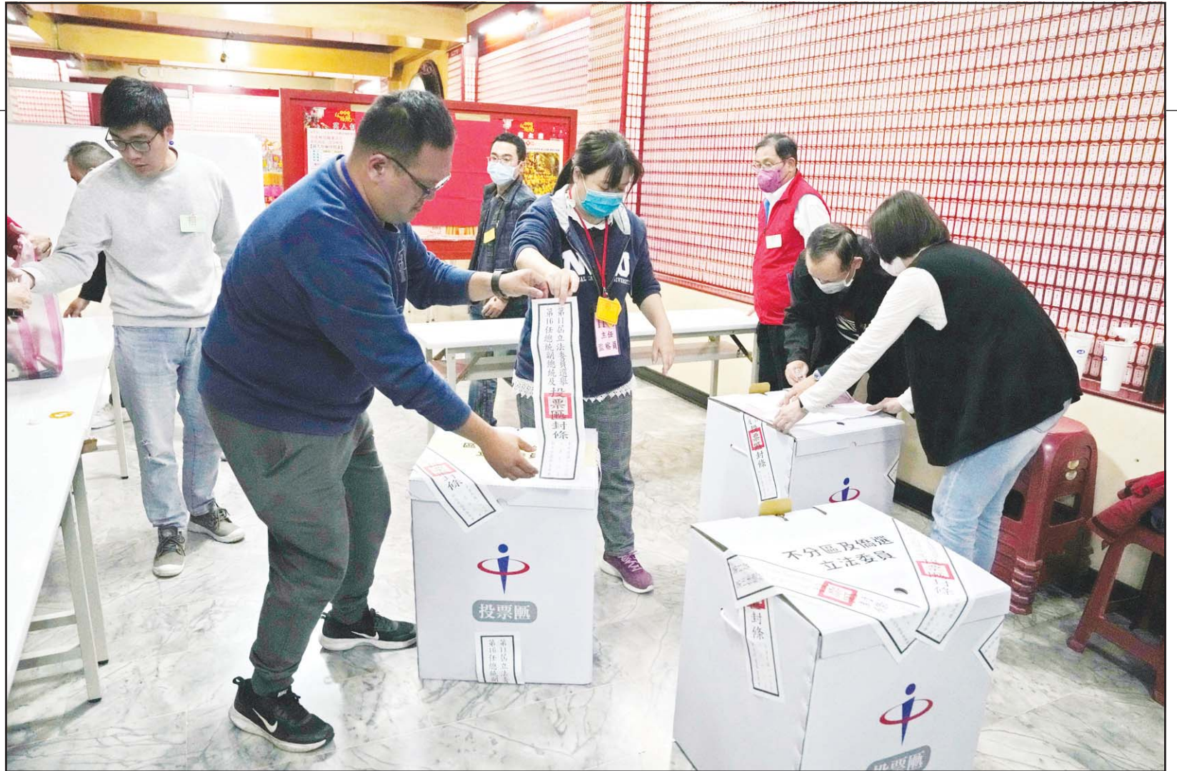
Poll officers seal ballot boxes at the end of voting in New Taipei City, Taiwan, Jan 13, 2024. Polls closed Saturday after Taiwanese cast their votes for a new president and legislature in an election that could chart the trajectory of the self-ruled democracy's relations with China over the next four years.