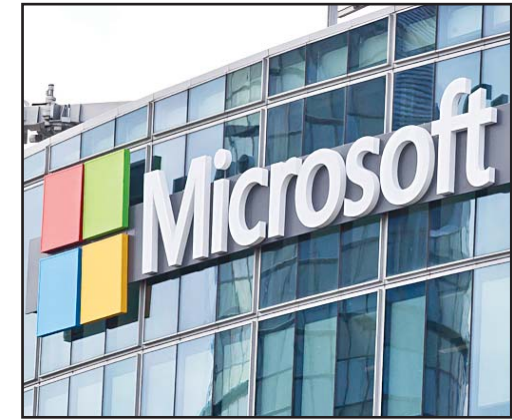
The Microsoft logo is seen in Issy-les-Moulineaux, outside Paris, France, Tuesday April 12, 2016. Microsoft said Thursday, Jan. 11, 2024, that it is upgrading its cloud computing service to let customers store all personal data within the European Union.

Amazon last year rolled out independent cloud infrastructure for the EU as it looked to address strict regulations that companies and public sector organizations face.