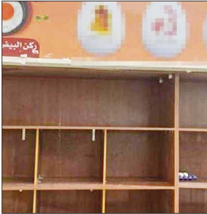
Shelves at co-ops devoid of eggs.