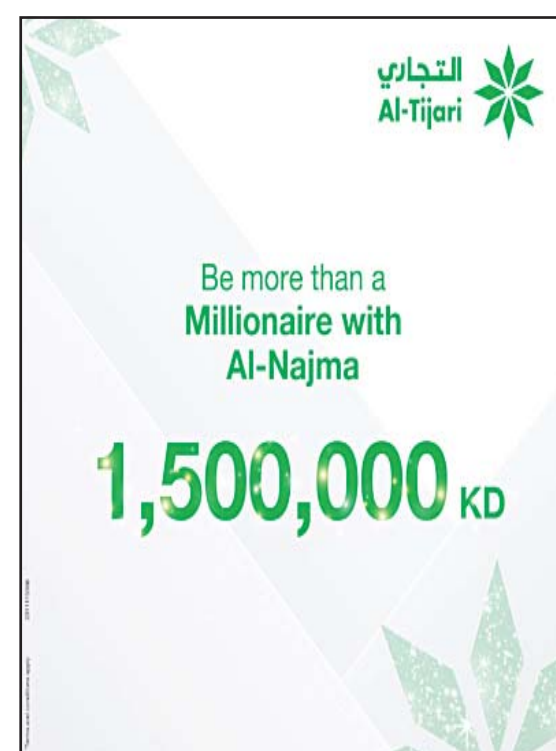
A flyer of Al-Najma Account's mega annual draw.