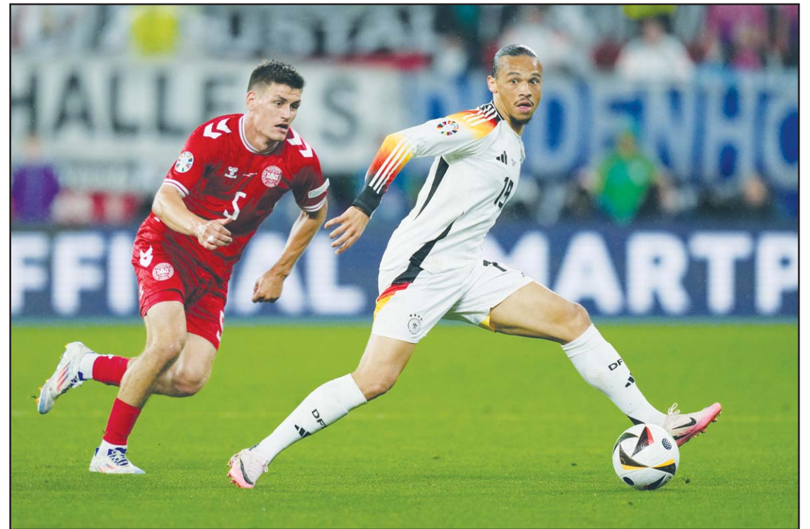
Germany's Leroy Sane challenges for the ball with Denmark's Joakim Maehle during a round of sixteen match between Germany and Denmark at the Euro 2024 soccer tournament in Dortmund, Germany.

There was about a 20-minute delay before the rain relented and players re-emerged, undertaking warmups before play resumed a few minutes later. The pitch held up well in the circumstances.