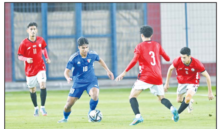
Kuwaiti player controls the ball as Yemen players defend during the Under-19 West Asian Championship in Saudi Arabia.