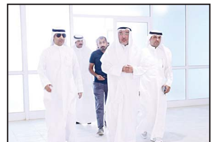
Minister of Education, Higher Education and Scientific Research Adel Al-Adwani inspect the new schools in Al-Mutlaa.

He explained the visit is in compliance with the directives of the Council of Ministers, stressing that all the concerned departments in his ministry are working hard to ensure the schools are ready to receive the students at the beginning of the next academic year.