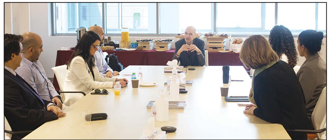
A photo of the meeting.