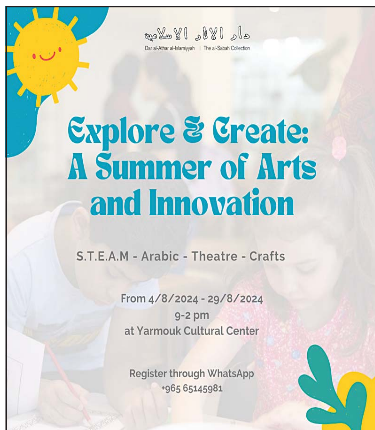
A flyer of the DAI event.

Al-Najma Account can be opened by depositing KD 200, and customer should maintain a minimum amount of KD 200 to be eligible to enter all draws on Al-Najma Account prizes. As for the chances of winning, the more balance a customer maintains in Al Najma Account, the more chances the account holder will get to win, the account also offers additional benefits like the ATM card, a credit card against customer's account and all CBK banking services that customer can enjoy. The Bank revealed that Al Najma account is available to everyone, and anyone can open Al Najma account through CBK mobile application in simple steps from anywhere and at any time.