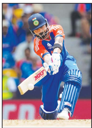
India's Virat Kohli plays a shot during the ICC Men's T20 World Cup final cricket match between India and South Africa at Kensington Oval in Bridgetown, Barbados.

His faith was repaid in the final against South Africa on Saturday, when Kohli led India's batting with 76