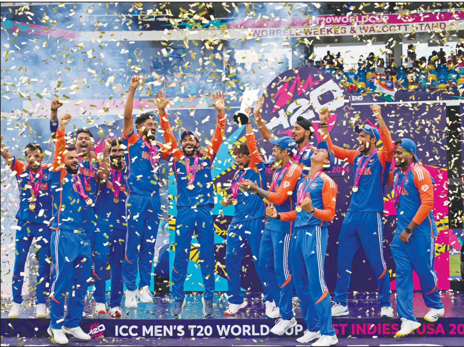
India's players celebrate with the winners' trophy after winning against South Africa in the ICC Men's T20 World Cup final cricket match at Kensington Oval in Bridgetown, Barbados.

BRIDGETOWN, Barbados, June 30, Right up to the Twenty20 World Cup final, there were question marks about whether India should persist with playing Virat Kohli.