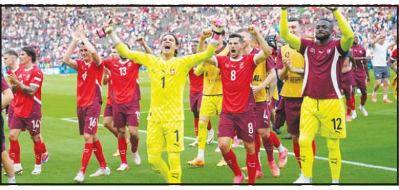
Switzerland players celebrate after a round of sixteen match between Switzerland and Italy at the Euro 2024 soccer tournament in Berlin, Germany. Switzerland won 2-0 to qualify.