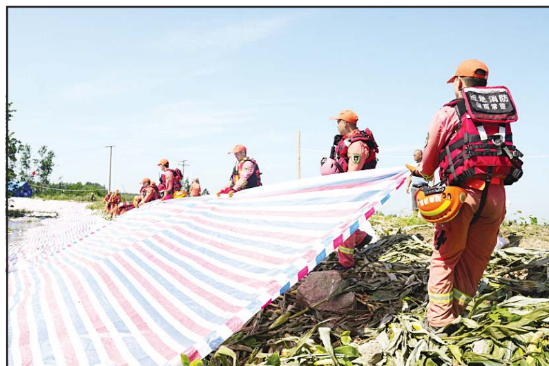
Rescuers strengthen a waterproof cover at an embankment in Huarong County, central China's Hunan Province on July 7. Rescuers are racing against time to strengthen an embankment after a dike breach at China's second-largest freshwater lake in Hunan Province on July 5. (Xinhua)

The World Bank estimates that about 72 percent of Malawians will face poverty this year following the weather shocks as inflation is expected to average 27 percent. (Xinhua)