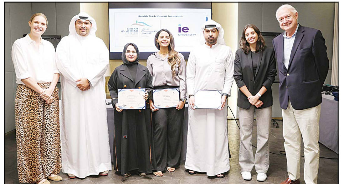
Sabah Al-Ahmad Center for Giftedness holds a program to incubate medical innovators in cooperation with the Spanish IE University.