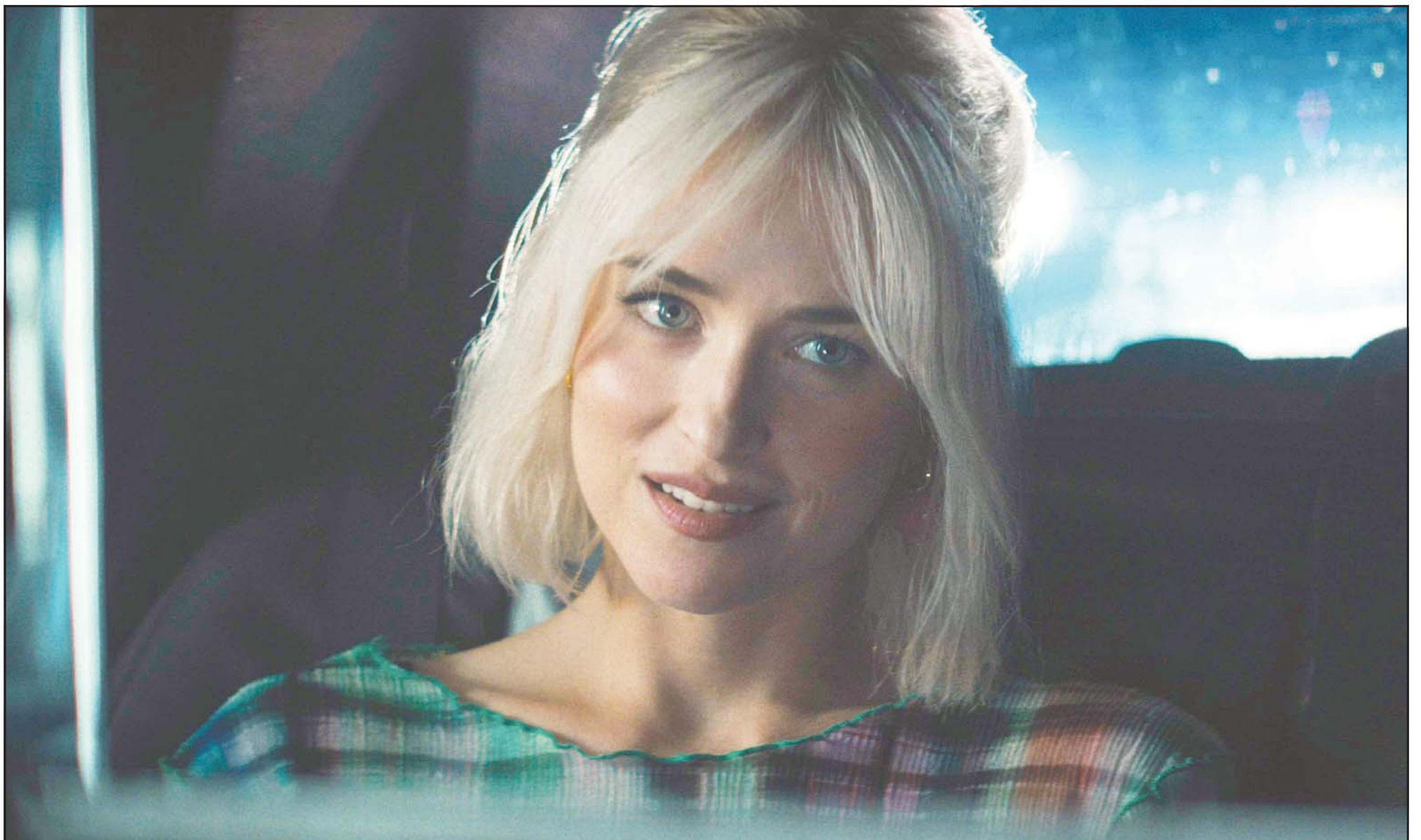
This image released by Sony Pictures Classics shows Dakota Johnson in a scene from ‘Daddio.’