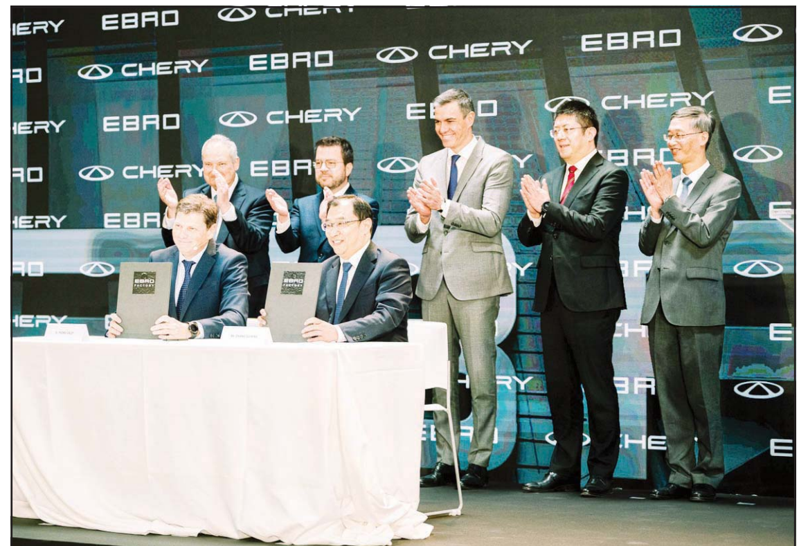
This photo taken on April 19, 2024, shows a scene at the signing event for an agreement between Spain's auto company Ebro-EV Motors and China's Chery Automobile in Barcelona, Spain.

The FAO revised its forecast for global cereal production in 2024 to a record high of 2,854 million tonnes, according to its "Cereal Supply and Demand Brief" released on Friday.