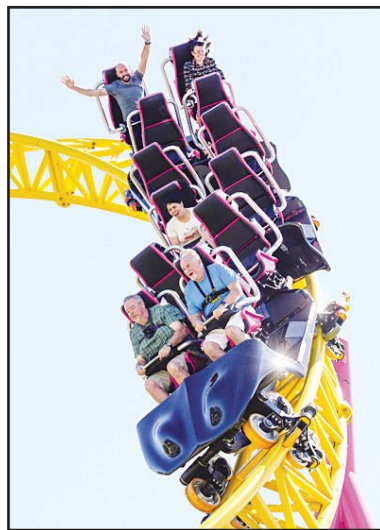
People ride on the new roller coaster during the launching event at Pacific National Exhibition (PNE) Playland in Vancouver, British Columbia, Canada, on July 5. The new ride, called 'ThunderVolt', launched on Friday at Vancouver's PNE Playland.

On one hand, Harris fills the traditional role of loyal lieutenant, a job she did enthusiastically - and on the fly - in television appearances immediately after Biden's lackluster debate ended. Yet should Biden ultimately decide to step aside as presumptive nominee, she would be among the favorites, if not the favorite, to carry the Democratic banner against Trump.