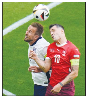
Switzerland's Granit Xhaka (right) jumps for the ball with England's Harry Kane during a quarterfinal match between England and Switzerland at the Euro 2024 soccer tournament in Dusseldorf, Germany.

The Netherlands remained on the front foot and turned the tides as Cody