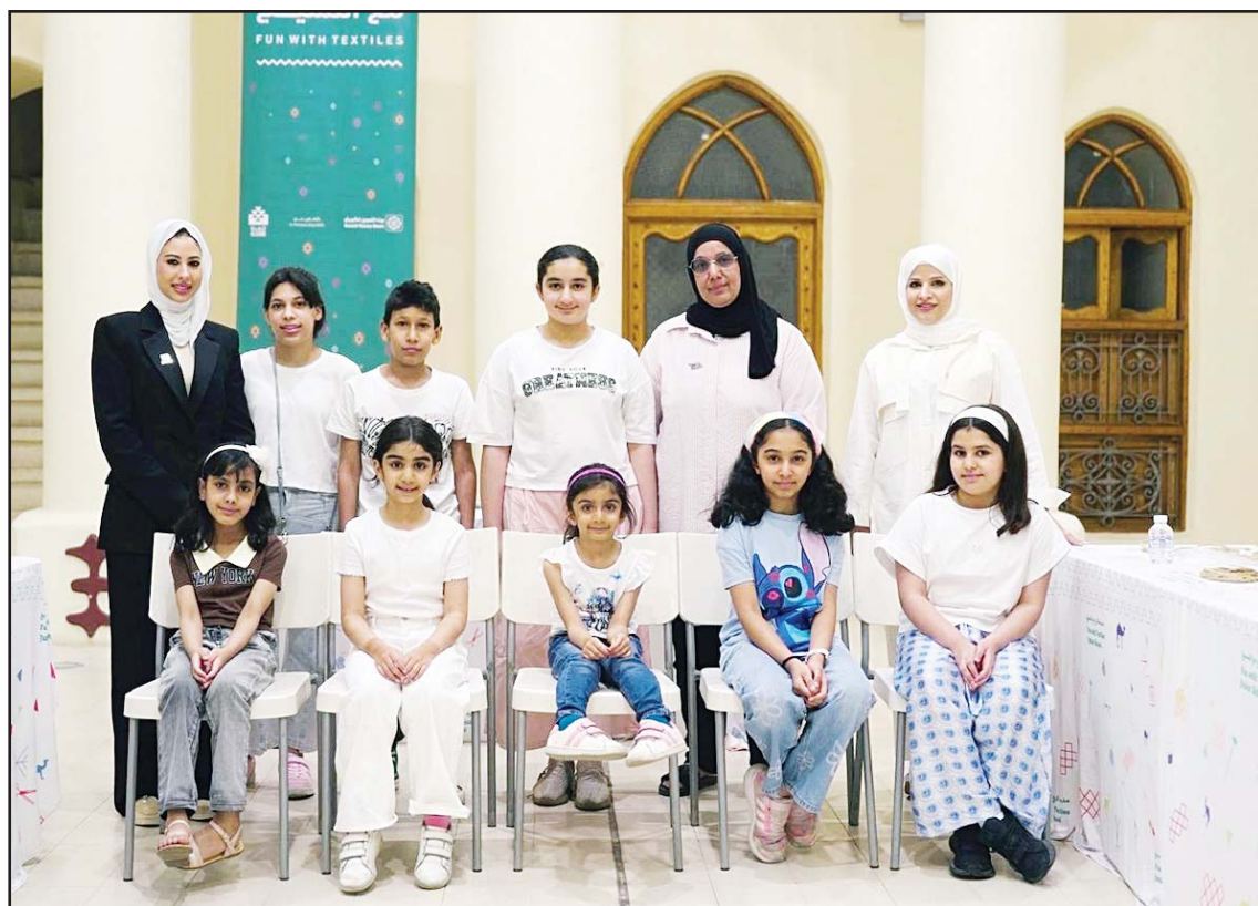
Group photo of participants in the summer camp.

In a statement, stc expressed that the Company has been a long-time supporter of students and graduates, having participated in numerous events. These initiatives align with the Company's strategy to empower and attract ambitious Kuwaiti talents who fit stc's dynamic culture. Additionally, the Company has participated in and sponsored various initiatives that aimed to support and contribute to the local education arena, especially under the umbrella of its educational 'upgrade' initiative. The Company highlighted that it will continue to explore opportunities of strategic collaborations within the education sector, stressing on the importance of knowledge and education to further develop the economy.