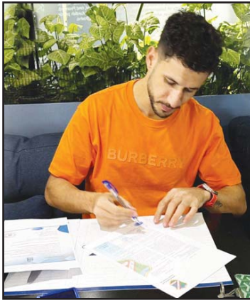
The signing of the contract in progress.