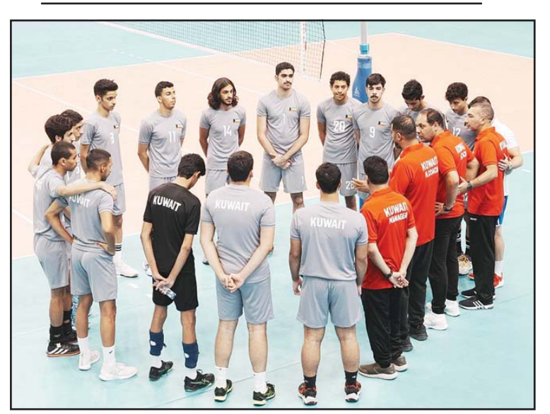
The technical team gives instructions to the players before they start training.

"I lost in the third round. I felt like I underachieved a little bit, but it's tennis, so you have to move on. I'll have many more chances this year to show my game. I'll just focus on that," said the 23-year-old Pole who claimed her third French Open title in a row last month.