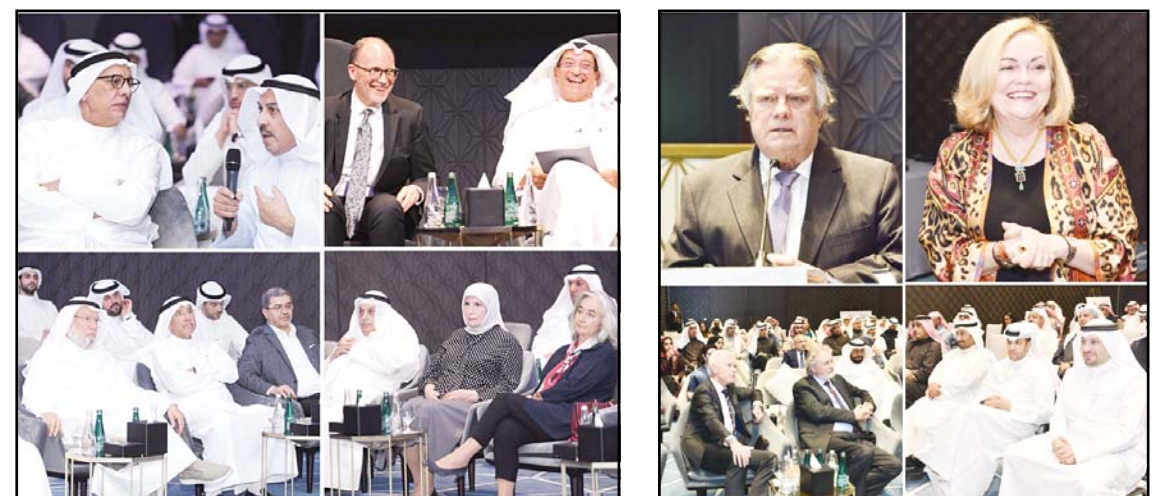
Highlights from five years of Reconnaissance Research events, showcasing key moments and influential discussions.

Among the academic and research institutions the center has collaborated with are the Georgia Institute of Technology, Doshisha University in Japan, the Near East and South Asia Center for Strategic Studies, the Institute of Energy Economics in Japan, and Jawaharlal Nehru University in India. These partnerships facilitate the exchange of knowledge and expertise between Kuwaiti researchers and their international counterparts, enriching scientific research and academic interaction.