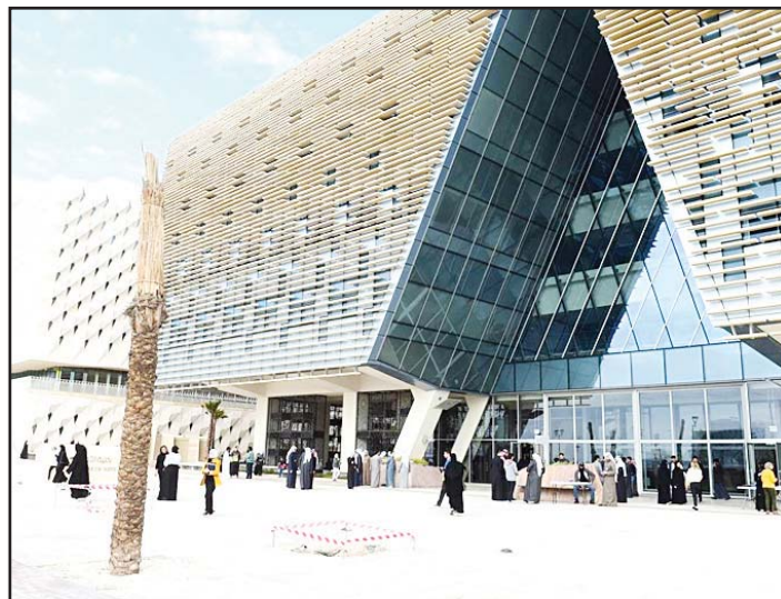
Kuwait University campus.