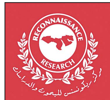
Reconnaissance Research logo