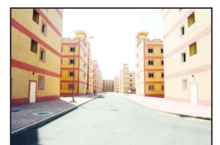
Labor housing projects.

Council member Fahd Al-Abduljader stressed that the council will not delay, regardless of the circumstances, taking any step to solve the problem in order to protect lives, even if it necessitates holding an emergency meeting. He clarified that "the problem is not only about the regulations or laws, as the real