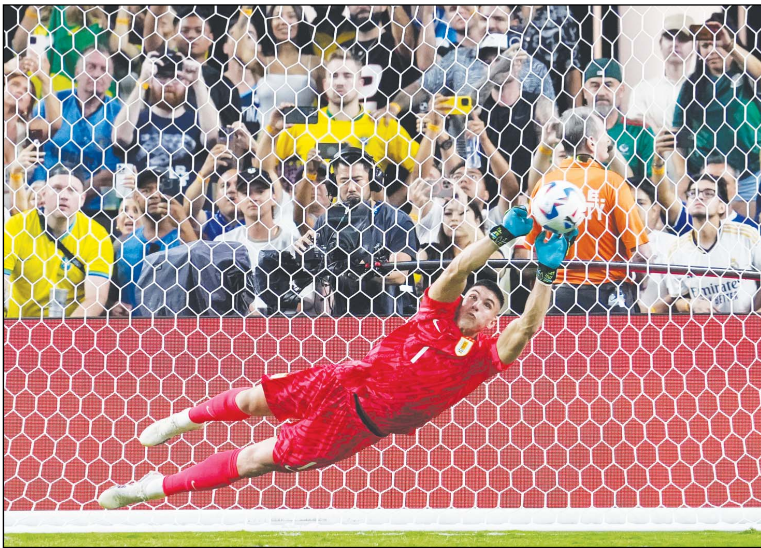
Uruguay's goalkeeper Sergio Rochet blocks a shot by Brazil's Eder Militao in a penalty shootout during a Copa America quarterfinal soccer match in Las Vegas.

LAS VEGAS, Nevada, July 7, (Xinhua): Uruguay advanced to the Copa America semifinals by overcoming Brazil on penalties 4-2 (0-0) on Saturday.