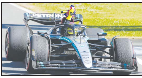
Mercedes driver Lewis Hamilton of Britain celebrates after winning the British Formula One Grand Prix race at the Silverstone racetrack, Silverstone, England.