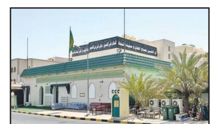
One of the Husseiniya premises.

The Ministry of Interior, under directives