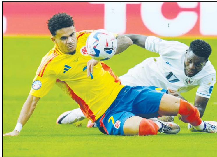
Colombia's Luis Diaz, (left), and Panama's Jose Fajardo fall during a Copa America quarterfinal soccer match in Glendale, Ariz.

"We scored early and that helped us control the game," Rodriguez, who has five assists in this tournament so far, said after the match. "I wanted to have a good Copa America and help the team try to reach the final. Now, we are a step closer to achieve that."