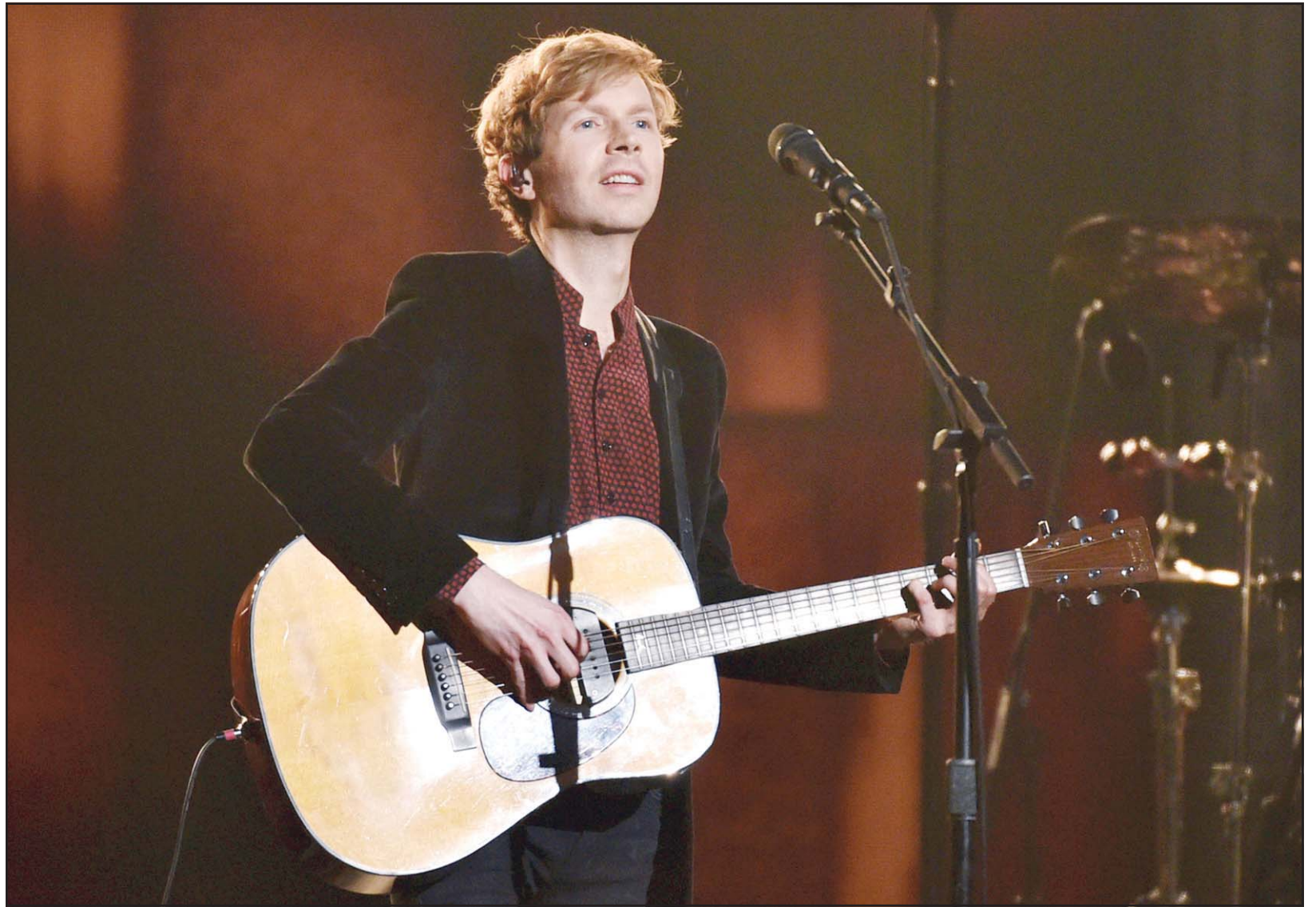
Beck performs at the 57th annual Grammy Awards in Los Angeles on Feb. 8, 2015. Beck will perform at The Hollywood Bowl this Saturday as part of his summer orchestral tour.