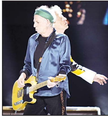
Keith Richards, (front left), and Mick Jagger, of The Rolling Stones, perform in Vancouver, on Friday, July 5.

Beck: You know I haven't even talked to anybody about recording it. I feel like it should be. I hope we're recording it or filming it at some point. It's pretty special and rarified to get to do something like this, and it's not lost on me. And also, being able to dig into some of the deeper cuts on my records. There's a lot of orchestral work over the last, you know, seven or eight albums that we don't get to play live. So, this is a chance to let some of those songs have their moment.