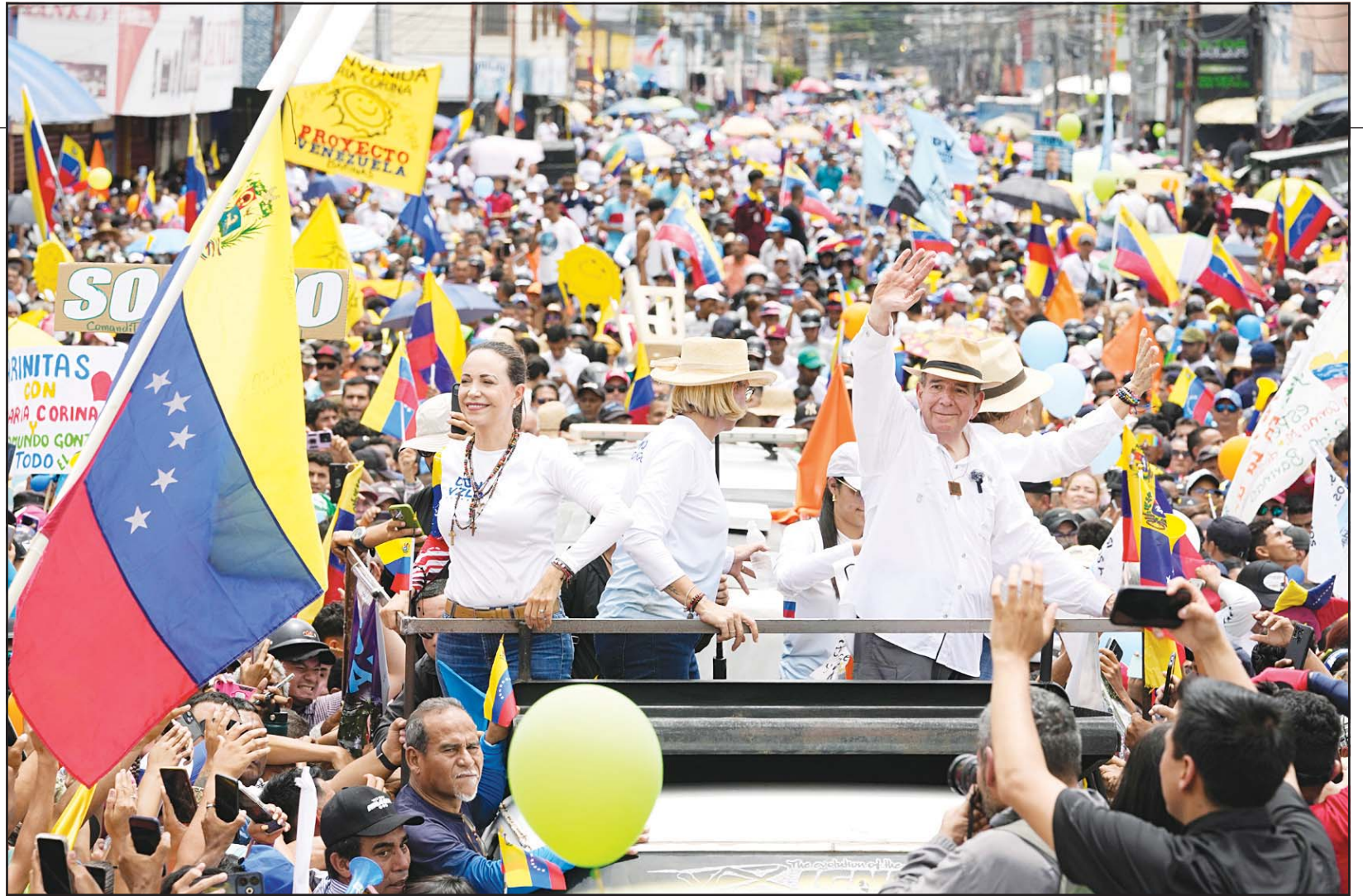
Opposition leader Maria Corina Machado, (left), and presidential candidate Edmundo Gonzalez, parade on a truck transporting them through a crowd of supporters during a campaign rally in Barinas, Venezuela on July 6.

The state of emergency originally declared in 2022 and still in effect has been used to round up 78,175 suspected gang members in sweeps that rights groups say are often arbitrary, based on a person's appearance or where they live.