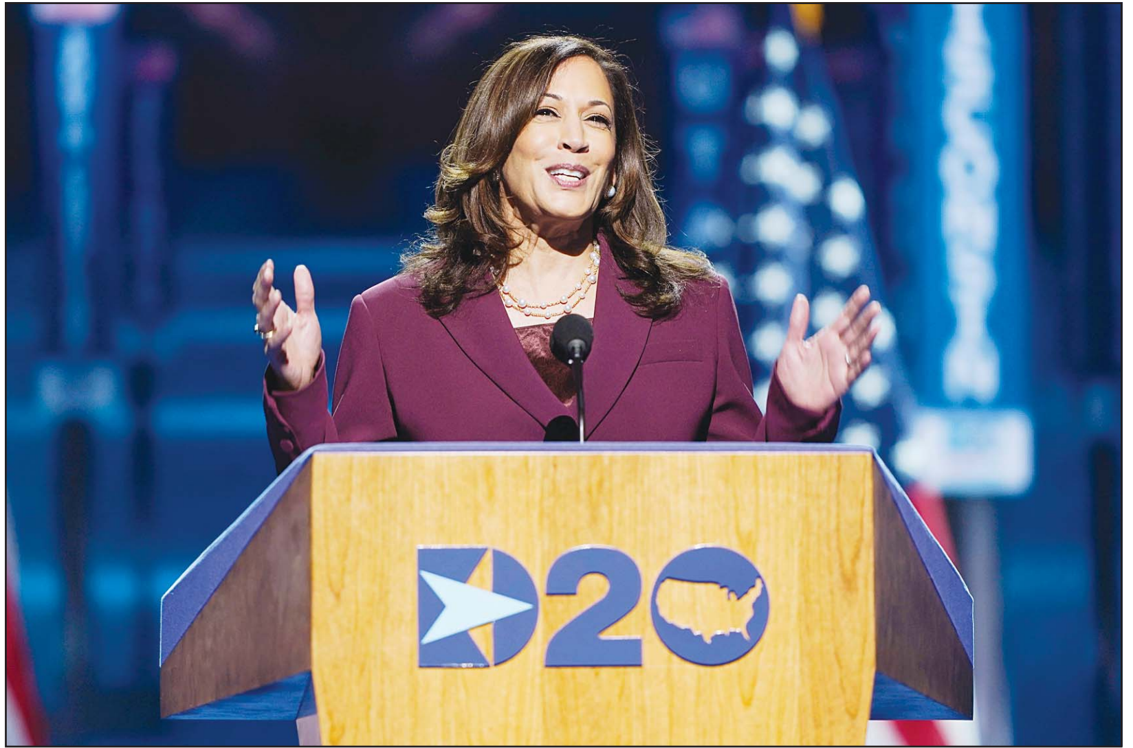
Democratic vice presidential candidate Sen Kamala Harris of California, speaks during the third day of the Democratic National Convention, at the Chase Center in Wilmington, Delaware, on Aug 19, 2020. Harris has been the White House's first line of defense after President Joe Biden's faltering performance in last week's debate with Donald Trump.

After his brief tour, he'll return to England , where he plans to meet with regional mayors, saying in his first news conference Saturday that he would engage with politicians regardless of their party.