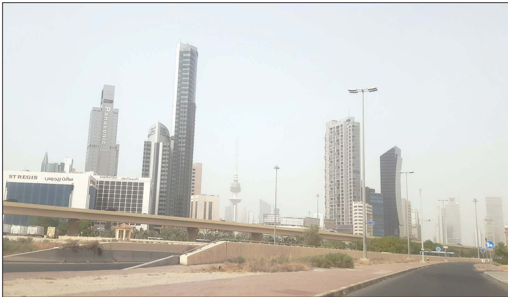
Kuwait skyline obscured by dust as strong northwesterly winds bring reduced visibility. On Sunday, the Meteorological Department issued a weather warning amid gusts exceeding 50 km/h.