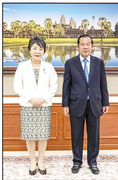
In this photo released by Agence Kampuchea Press (AKP), Cambodian Senate President Hun Sen, (right), poses for photographs with Japanese Foreign Minister Yoko Kamikawa during a meeting in Phnom Penh, Cambodia on July 6.

"I believe the voters gave me a mandate for my accomplishment in the past eight years," Koike said. She pledged to push for more reforms and support for Tokyo residents.