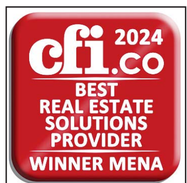
CFI.co awards KIB for outstanding real estate expertise.