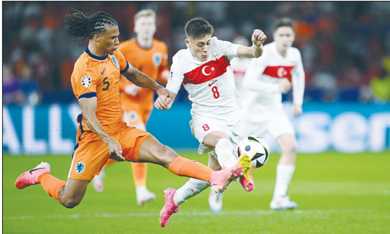
Turkey's Arda Guler (right) and Netherlands' Nathan Ake battle for the ball during a quarterfinal match between the Netherlands and Turkey at the Euro 2024 soccer tournament in Berlin, Germany.