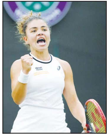
Jasmine Paolini of Italy reacts during her fourth round match against Madison Keys of the United States at the Wimbledon tennis championships in London.

He set up match point with one of his delicate forehand drop shots and converted it with a service winner.