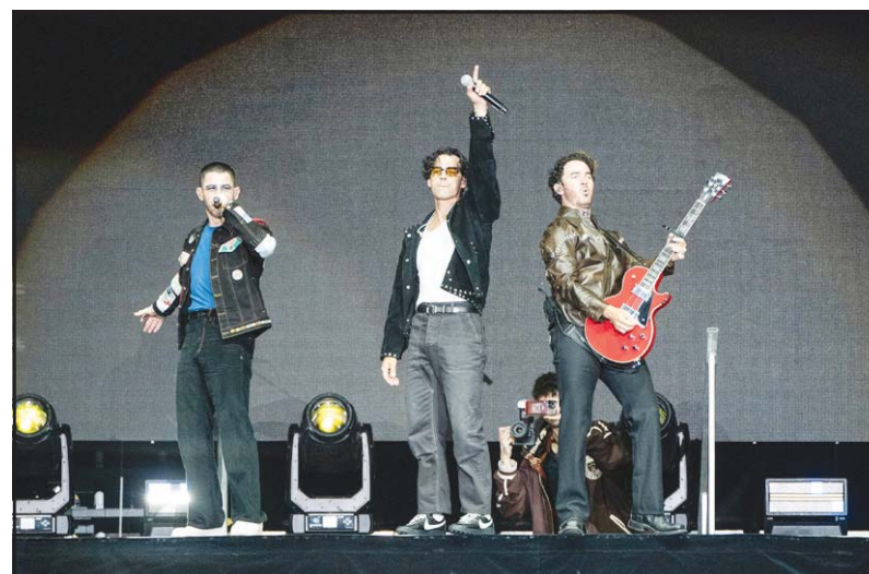
Nick Jonas, (left), Joe Jonas, and Kevin Jonas of The Jonas Brothers perform during Festival d'été de Québec on Saturday, July 6, in Québec City.

The park will complement Harbin Ice-Snow World, a landmark outdoor ice and