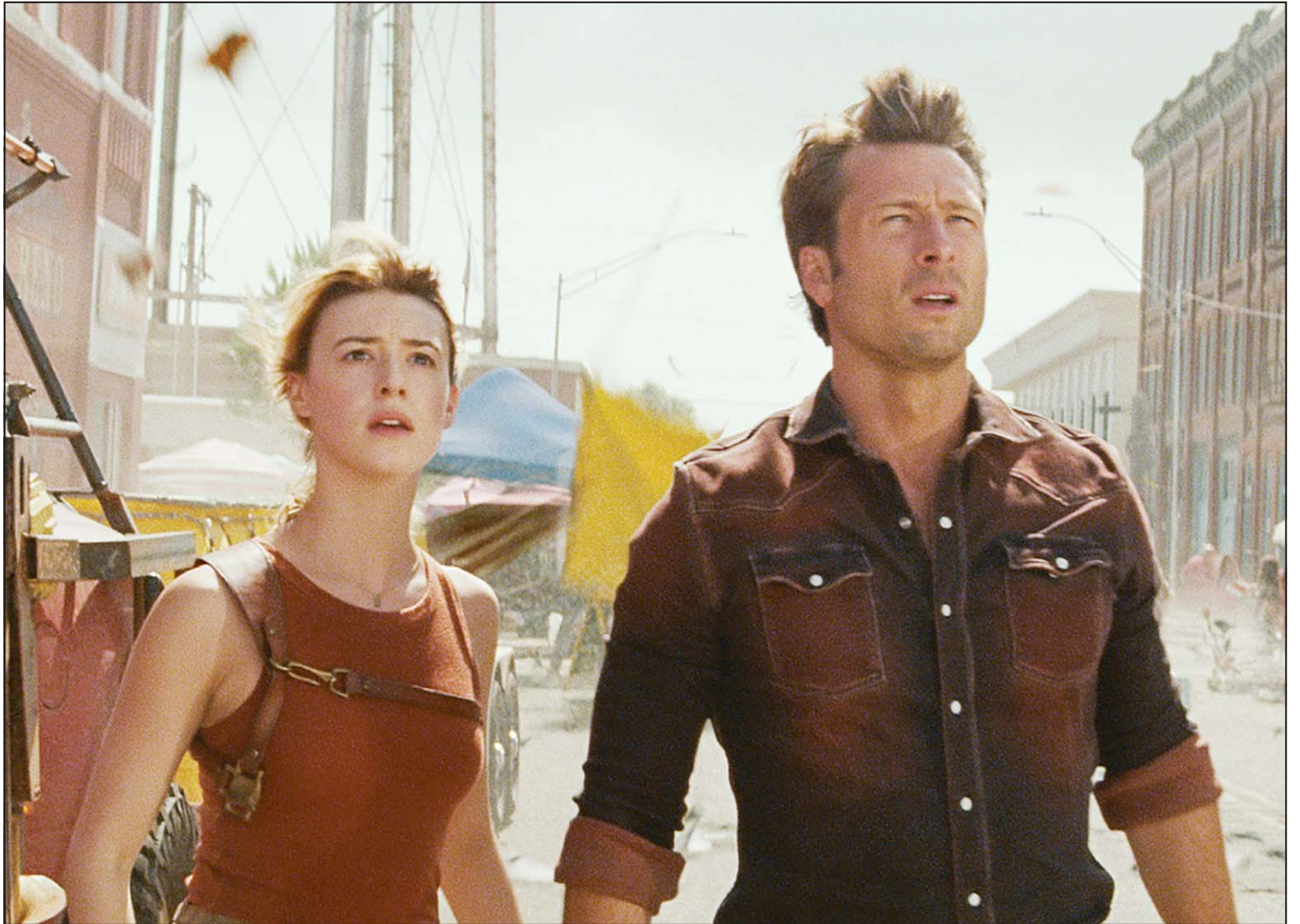
This image released by Universal Pictures shows Glen Powell, (right), and Daisy Edgar-Jones in a scene from 'Twisters.'