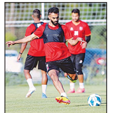
Players training for the upcoming season.

Meanwhile, Kuwait Club team continues rigorous training sessions twice daily in Turkey, part of their ongoing