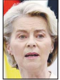
Von der Leyen

The re-election ensures leadership continuity for the 27-nation bloc as it wrestles with crises ranging from the war in Ukraine to climate change, migration and housing shortages.