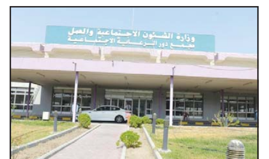
Social care homes complex in Sulaibikhat.

The sources affirmed PART's keenness to overcome all obstacles in the implementation of the project.