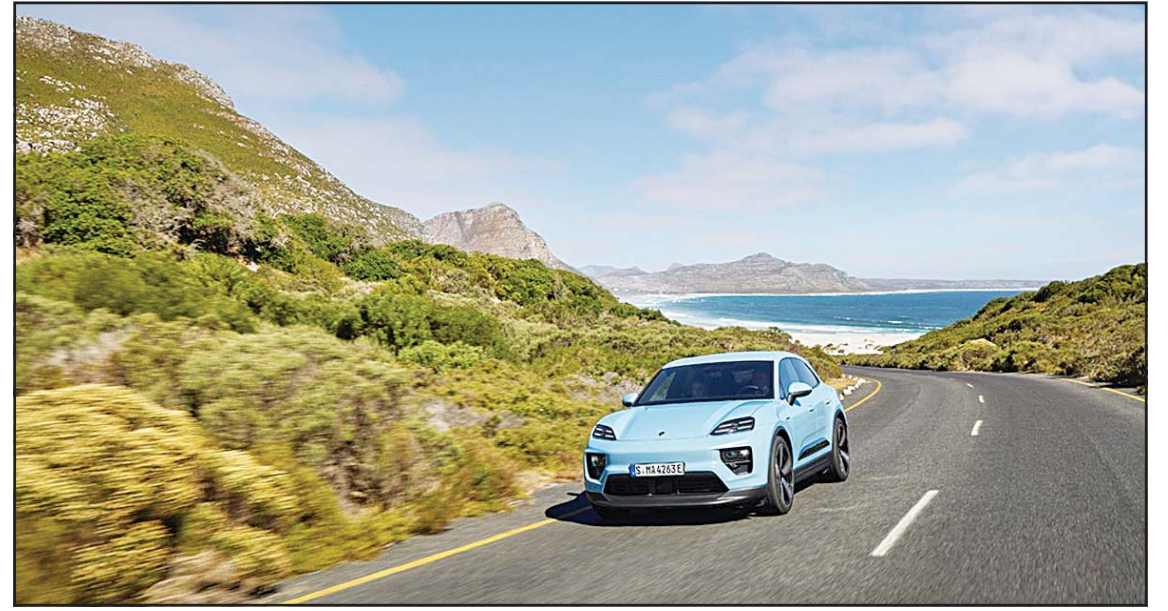
The new Macan

KUWAIT CITY, July 18: The new Porsche Macan with rear-wheel drive is available immediately as the new point of entry to the all-electric SUV model series. It is exceptionally efficient, offering a combined WLTP range of up to 641 kilometres. The new Macan 4S features up to 380 kW (516 PS) and is positioned at the higher-powered end of the model programme. A new off-road design package is also available for all Macan models. Additionally, the Porsche Driver Experience has been comprehensively updated.