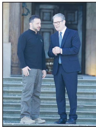
President of Ukraine Volodymyr Zelenskyy, (left), is welcomed by Prime Minister Sir Keir Starmer, (right), to the European Political Community Summit at Blenheim Palace in Woodstock, Oxfordshire, England on July 18. Leaders from across Europe gathered at a grandiose English country mansion on Thursday for a summit clouded by worries about whether the United States would remain a reliable ally if Donald Trump wins a second presidency.

Many conservatives loved the book. Among them were some who lobbied for Vance to be Trump's vice presidential pick. They include Donald Trump Jr.; Kevin Roberts, who leads the Heritage Foundation; and Turning Point USA's Charlie Kirk.