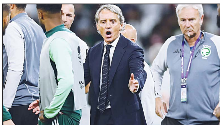
Saudi Arabia Italian coach Roberto Mancini.

The team will face Indonesia on September 5 and China on September 10. Mancini's preliminary squad includes Al-Aqidi and his Al-Nassr teammate Sultan Al-Ghannam.