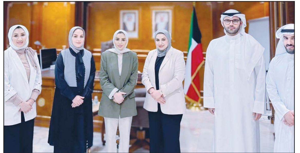
Dr. Amthal Al-Huwaila, Minister of Social Affairs with board members.

A key condition from the General Traffic Department, represented by the Ministry of Interior, specifies that no building permits for commercial and investment projects will be issued