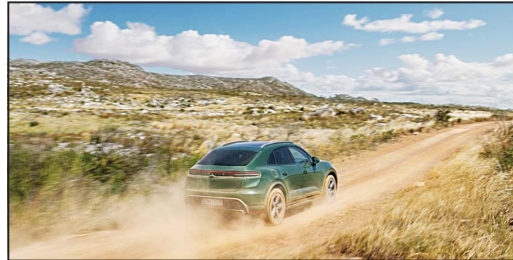
The new Macan 4S

Porsche has once again completely upgraded the design of the screens for all Macan models. It now comprises an emotional welcoming animation, an updated state-of-the-art look, and the new Themes app which can be used to adjust the background colour of the displays and the ambient lighting to match the exterior colour, with twelve colours to choose from.