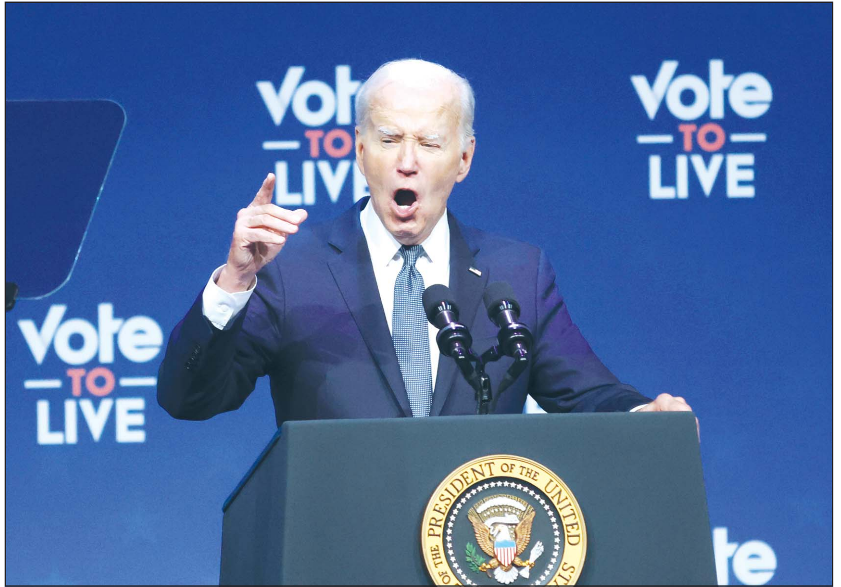
US President Joe Biden speaks at a 2024 Prosperity Summit on July 16 in North Las Vegas, Nev. Biden tested positive for COVID-19 while traveling on July 17 in Las Vegas and is experiencing 'mild symptoms' including 'general malaise' from the infection, the White House said.

The New Popular Front won the most seats but fell well short of the majority needed to govern on its own.