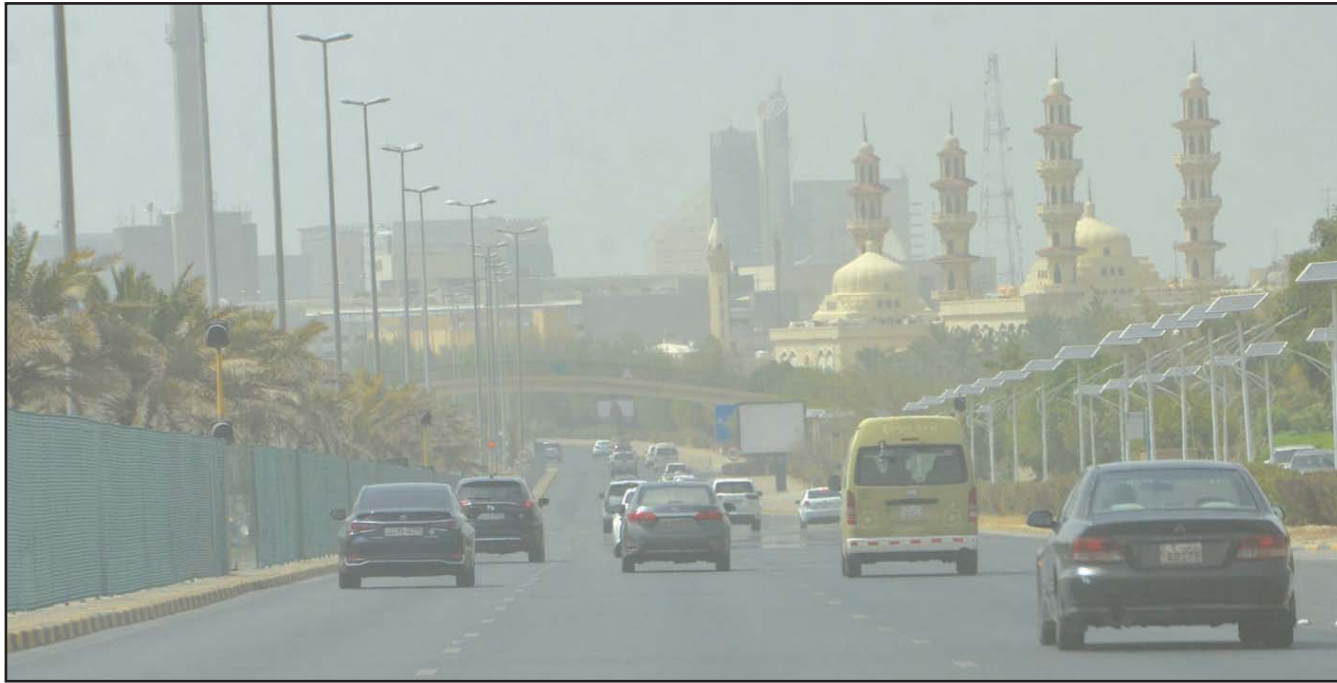
Wind and dust accompany the hot weather prevailing in the country.