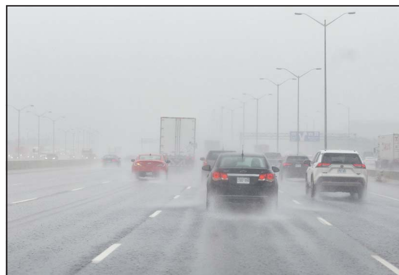
Vehicles run on a road during a heavy rain in Toronto, Canada, on July 16. Toronto received more than a month's worth of rain over a few hours amid a rainfall warning from Environment Canada that called for "extremely heavy rain" with the potential for 125 millimeters in some areas on Tuesday, according to local media.

Her office had no immediate comment, and it was not immediately clear who represented her in court.