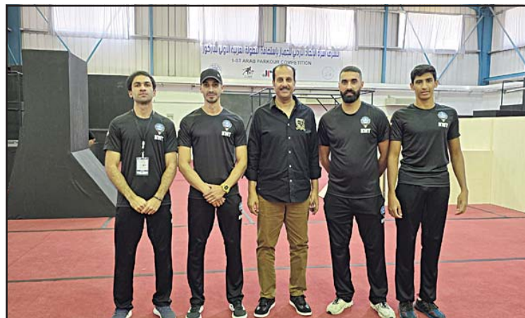
Kuwaiti parkour team set for the inaugural Arab Championship.

KUWAIT CITY, July 18: The Kuwaiti parkour team has embarked on their journey to participate in the inaugural Arab championship for the sport, which commenced in Amman, Jordan yesterday and will continue until next Sunday.