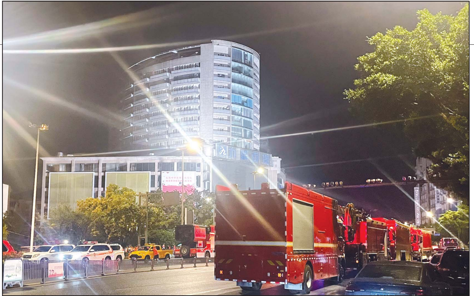
This photo taken with a mobile phone shows rescue vehicles parking near the site of a department store fire in Zigong City, southwest China's Sichuan Province on July 18.