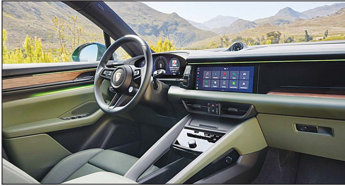
Macan 4S Interior