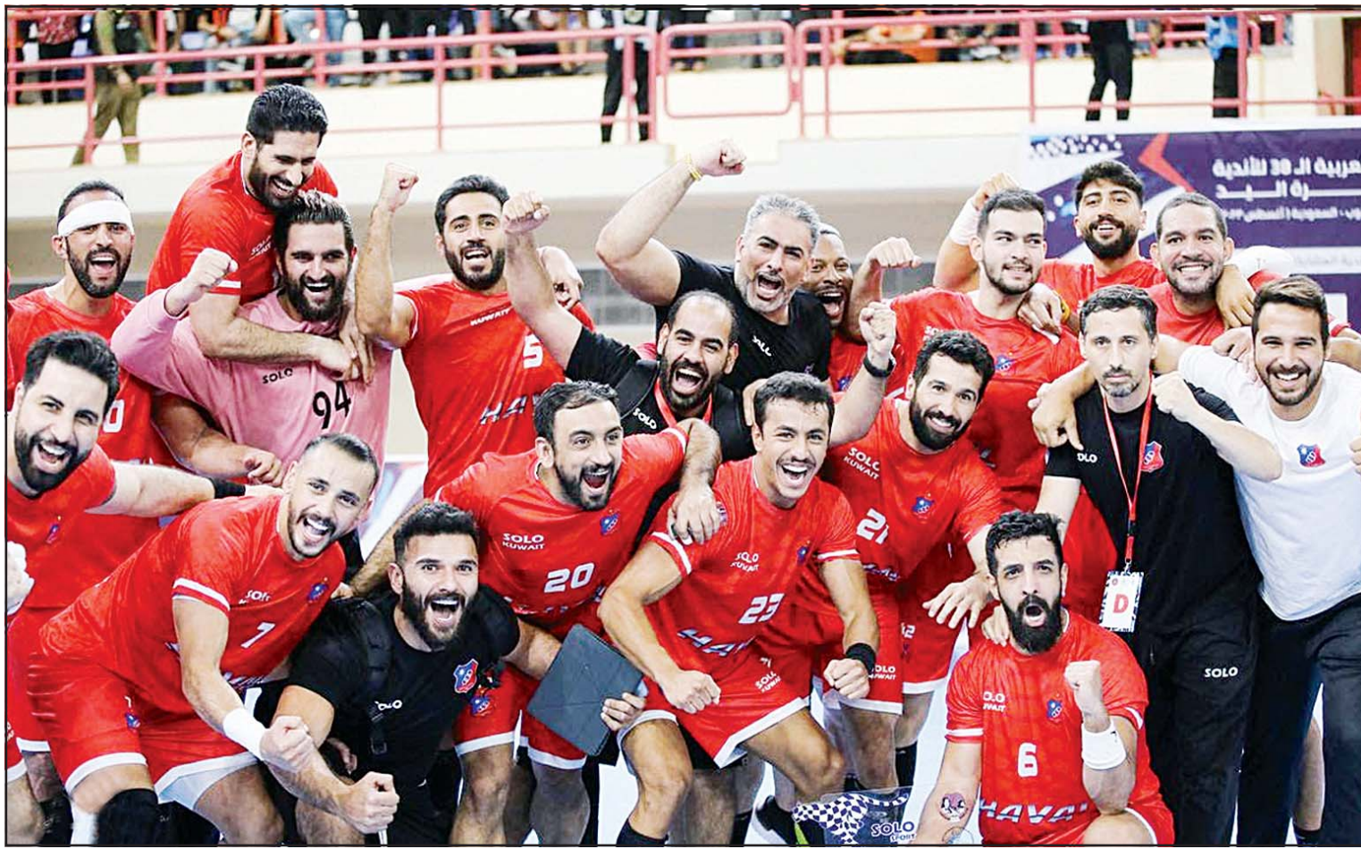
A file photo of a winning team celebrating.