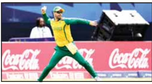
South Africa's captain Aiden Markram throws the ball towards the stumps after fielding it at the boundary during the ICC Men's T20 World Cup cricket match between South Africa and Sri Lanka at the Nassau County International Cricket Stadium in Westbury, New York.