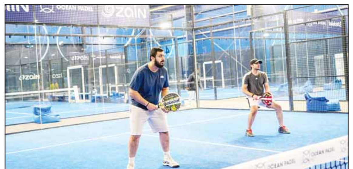
The competition strengthened bonding between employees.