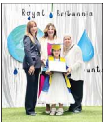
RBK officials honor one of the students.