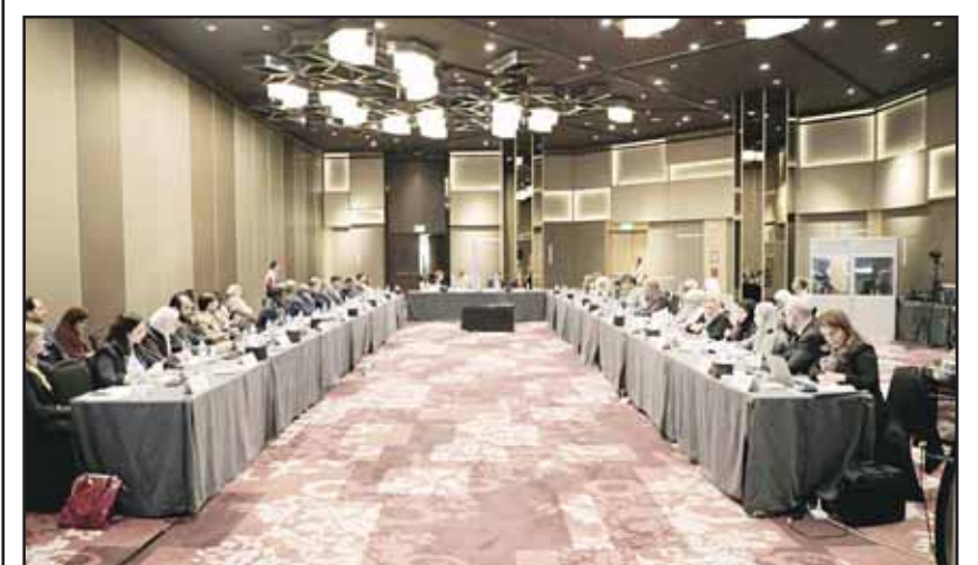
Part of the 15th session of the Committee for Social Development meeting.