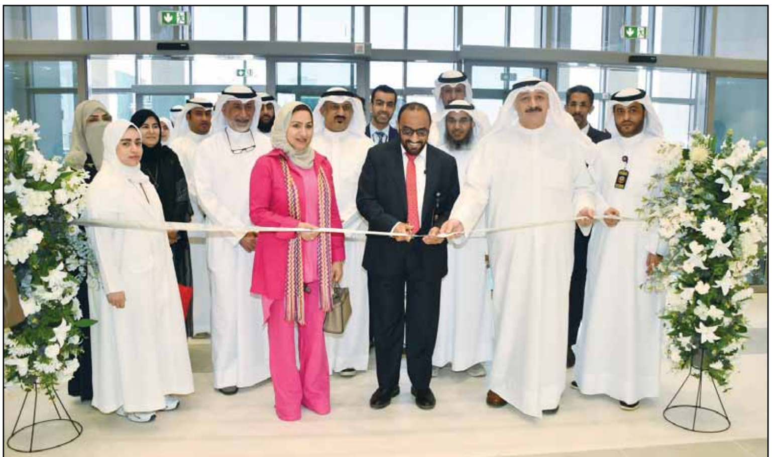
The Minister of Health opens Al-Mutlaa Health Center (2) in the N10 suburb.