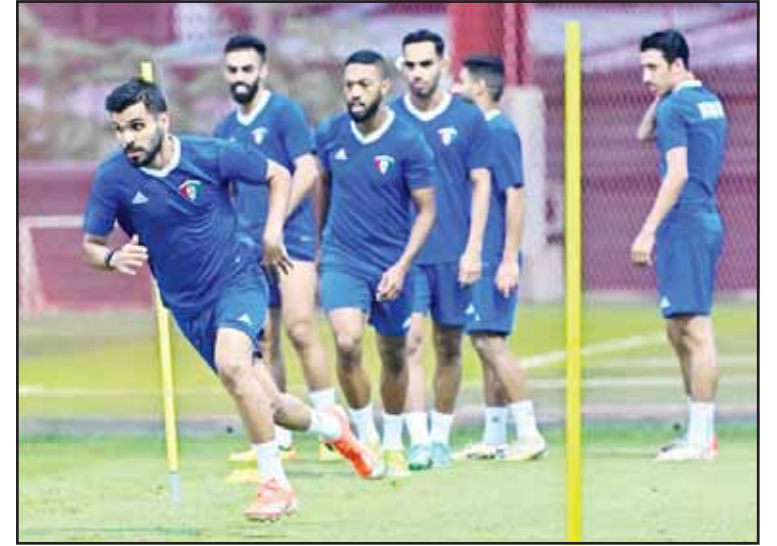
Kuwaiti players hold final training session in Kolkata.