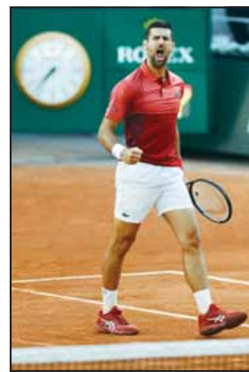
Serbia's Novak Djokovic clenches his fist after holding his service game and reaching 5-5 in the fourth set during his fourth round match of the French Open tennis tournament against Argentina's Francisco Cerundolo at the Roland Garros stadium in Paris.

Gauff pulled away to a 5-2 lead in the last set, then needed a trio of match points to close things out, acknowledging afterward that maybe she grew a little tight down the stretch. In the last game, Gauff needed to save a break point, before Jabeur dismissed one match point with a disguised drop shot that earned a roar from the stands. The 29-year-old Tunisian responded by putting her right index finger to her ear.