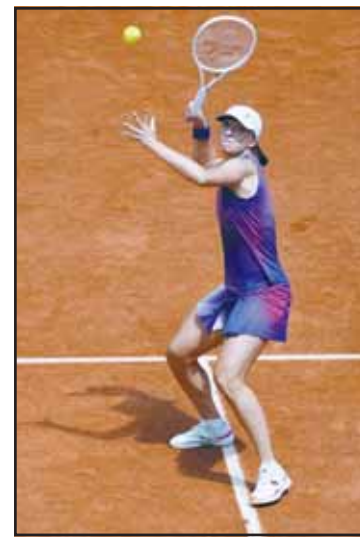
Poland's Iga Swiatek plays a shot against Marketa Vondrousova of the Czech Republic during their quarterfinal match of the French Open tennis tournament at the Roland Garros stadium in Paris.

Swiatek said. "But I guess Coco is not easy. She really likes playing on clay, especially here. I'll just focus on myself and I'll prepare tactically and we'll see."