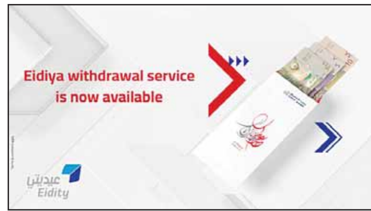
Gulf Bank's 'Ayadi' service.

The "Ayadi" service provides customers with fresh banknotes in denominations of KD20, KD10, KD5, and KD1, addressing the increased demand for new banknotes during