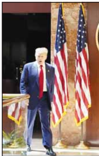
Former US president Donald Trump arrives to speak at a news conference at Trump Tower on May 31 in New York.