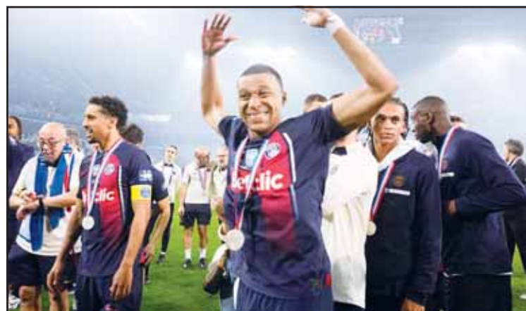
PSG's Kylian Mbappe celebrates after the French Cup final soccer match between Lyon and PSG at the Pierre Mauroy stadium in Villeneuve d'Ascq, northern France.

The current Madrid players were quick to welcome their newest teammate.