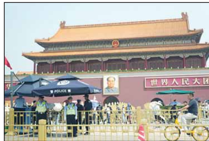
Police officers watch over Tiananmen Gate in Beijing on June 4. Checkpoints and rows of police vehicles lined a major road leading to Beijing's Tiananmen Square on Tuesday as China heightened security on the 35th anniversary of a bloody crackdown on pro-democracy protests. Hong Kong police took at least two people off the streets as the effort to prevent any public remembrance extended beyond the mainland.

Penh, Cambodia's Defense Ministry said in a statement. It said Austin's visit would strengthen the ongoing good cooperation between the countries that has lasted more than 70 years.