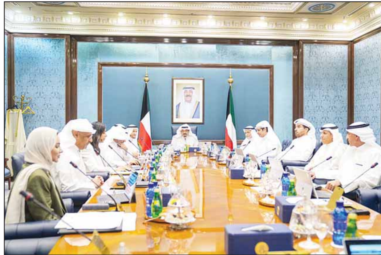
Cabinet meeting in session at Seif Palace, under the chairmanship of His Highness the Prime Minister Sheikh Ahmad Abdullah Al-Ahmad Al-Sabah.

Moreover, the Cabinet was briefed on the report of the National Committee for Anti-Money Laundering and Combating Terrorist Financing regarding the recommendations submitted by the Financial Action Task Force for the Mutual Evaluation of Kuwait (FATF).