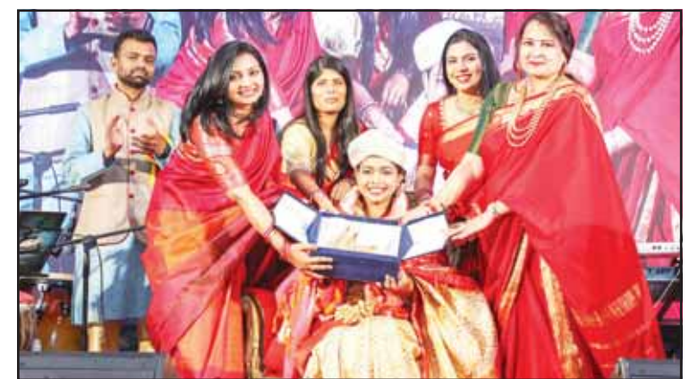
A photo from the event.