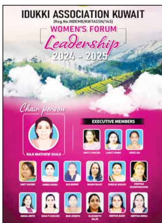
Women's Forum committee