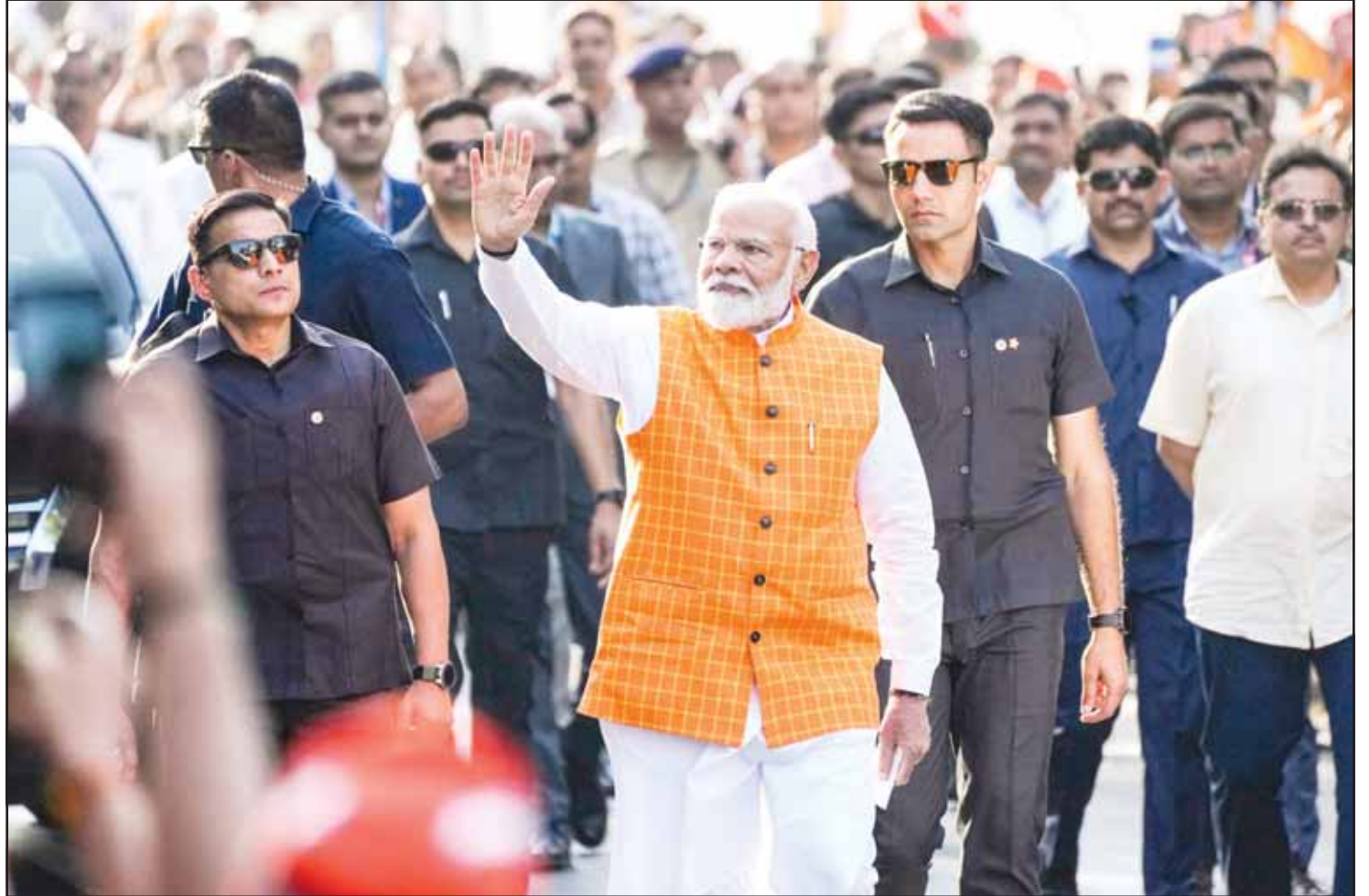
Indian Prime Minister Narendra Modi waves to people as he arrives to cast his vote during the third phase of India's national election, in Ahmedabad, India on May 7.

The world of the 21st century is looking towards Bharat with many hopes. And we will need to make several changes to move forward in the global scenario. We also need to change our traditional thinking regarding reform. Bharat cannot limit reform to just economic reforms. We must move forward in every aspect of life towards the direction of reform. Our reforms should also align with the aspirations of a 'Viksit Bharat' (developed India) by 2047.