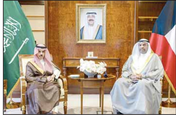
Kuwait's Foreign Minister Abdullah Al-Yahya receives Saudi Arabia's Foreign Minister Faisal bin Farhan Al-Saud.

Earlier, a joint statement gave due credit to the Kuwaiti-Saudi joint coordination committee for its contributions towards keeping relations on an upward trajectory, revealing that the next round of talks are slated for next year in the Saudi capital.