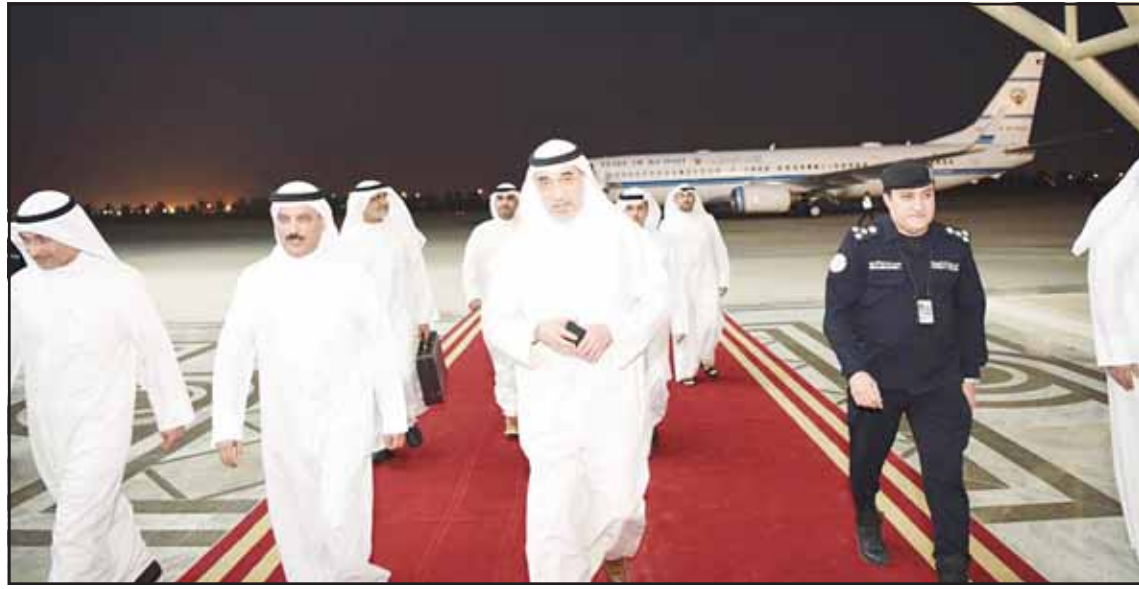
KUWAIT CITY, June 4, (KUNA): Kuwait's First Deputy PM and Defence, Interior Minister Sheikh Fahad Yousef Al-Sabah returns home from Egypt.