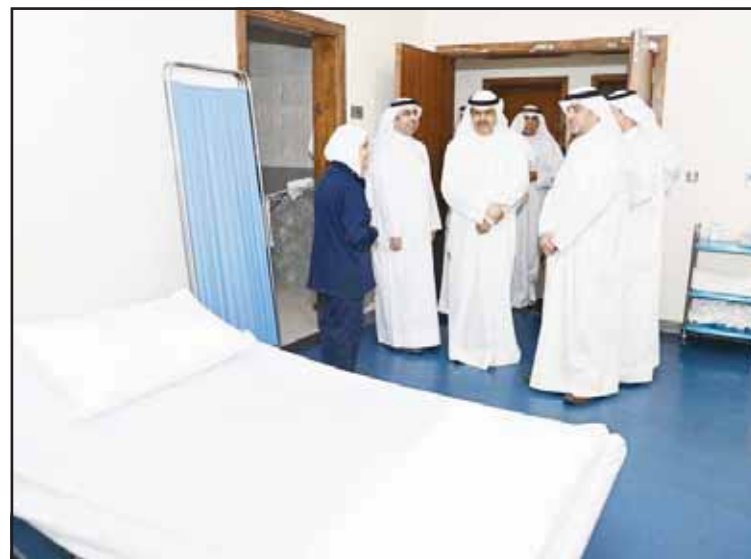
Al-Asfar during the visit to the elderly care facility.

Overall, the Municipal Council's proactive approach to endorsing these initiatives reflects its commitment to addressing various community needs and promoting sustainable development practices.