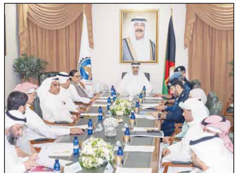
The first meeting of the joint committee formed between the Capital Governorate and Kuwait Voluntary Work Center.

The Capital Governorate will spare no effort in supporting all efforts that would preserve the high style of popular heritage in Souq Mubarakiya, and cooperate with the relevant government institutions and private parties, in order to address all existing problems. This can be either at the level of public cleanliness or developing the necessary facilities and services, in addition to adding an aesthetic character while preserving the heritage value of that area.