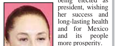
Claudia Sheinbaum, congratulating her on being elected as president.

Also, His Highness the Prime Minister Sheikh Ahmad Abdullah Al-Ahmad Al-Sabah sent a cable to President Claudia Sheinbaum, congratulating her on being elected as president.