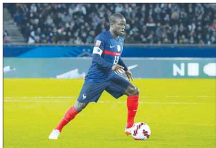
In this file photo, France's N'Golo Kante controls the ball during the World Cup 2022 Group D qualifying soccer match between France and Kazakhstan at the Parc des Princes stadium in Paris, France.

Not conceding goals could be a bigger issue. It's the first time Deschamps enters a major tournament without the reassuring presence of Lloris. AC Milan's Mike Maignan should start a major tournament as the No. 1 goalie for the first time, although he is nursing a finger injury.