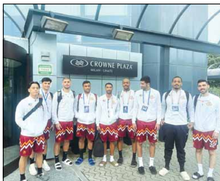
Group photo of AUK's team.

The committee reserved the letter of the Undersecretary of the Ministry of Oil regarding the allocation of the land of the oil complex in Shuwaikh to be the headquarters of the offices of the Ministry of Oil and the Kuwait Petroleum Corporation.