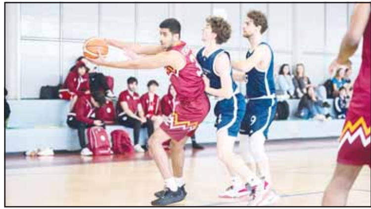
Players fighting for the ball.