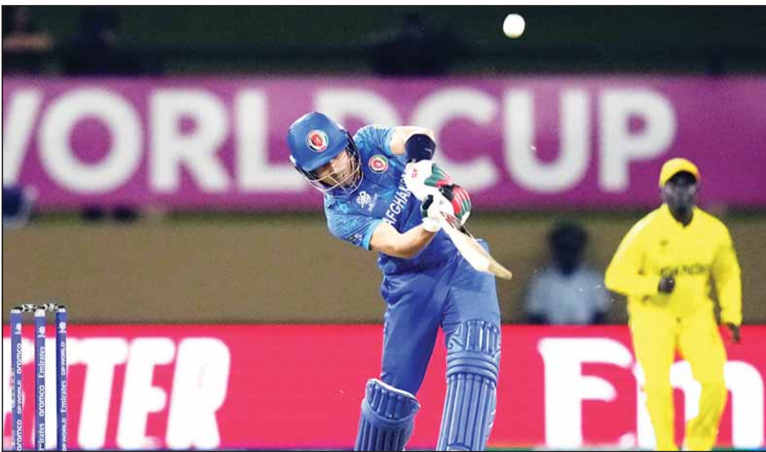
Afghanistan's Rahmanullah Gurbaz plays a shot against Uganda during an ICC Men's T20 World Cup cricket match at Guyana National Stadium in Providence, Guyana.