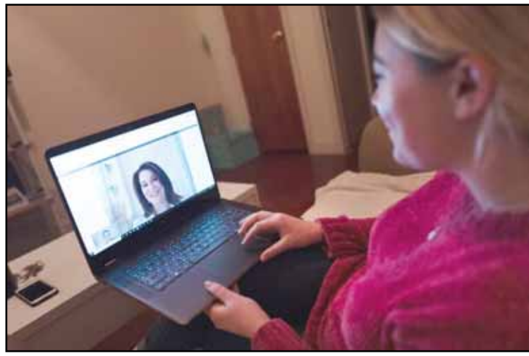
A patient sits in the living room of her apartment in the Brooklyn borough of New York during a telemedicine video conference with a physician on Jan. 14, 2019.

It can be used to diagnose new health problems and monitor existing, long-term issues like diabetes.