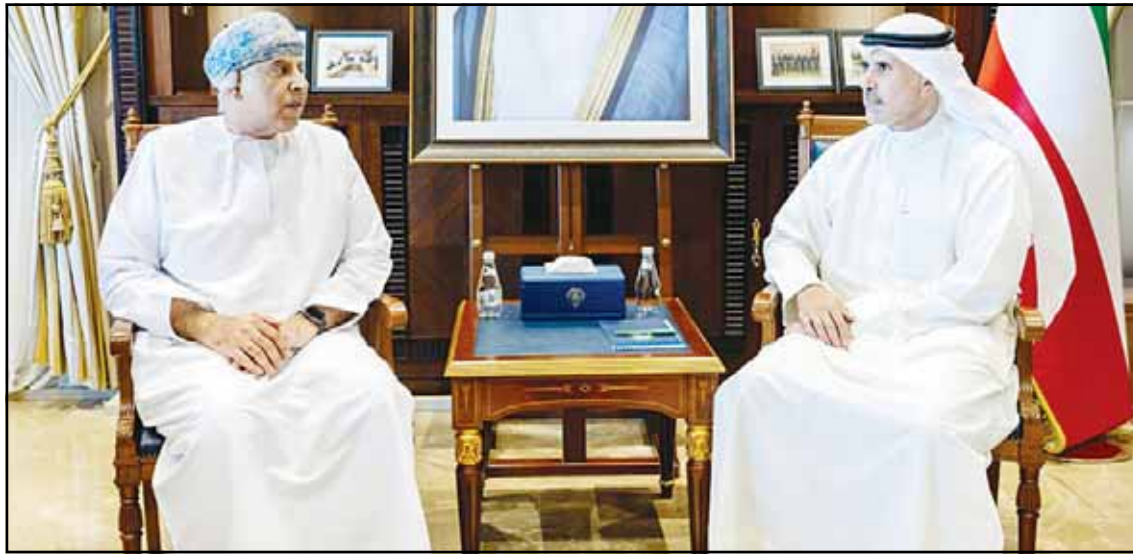
Deputy Minister of Foreign Affairs receives Oman's Undersecretary of the Foreign Ministry for Administrative and Financial Affairs.

Kuwait Airport to operate 76 flights during Hajj season