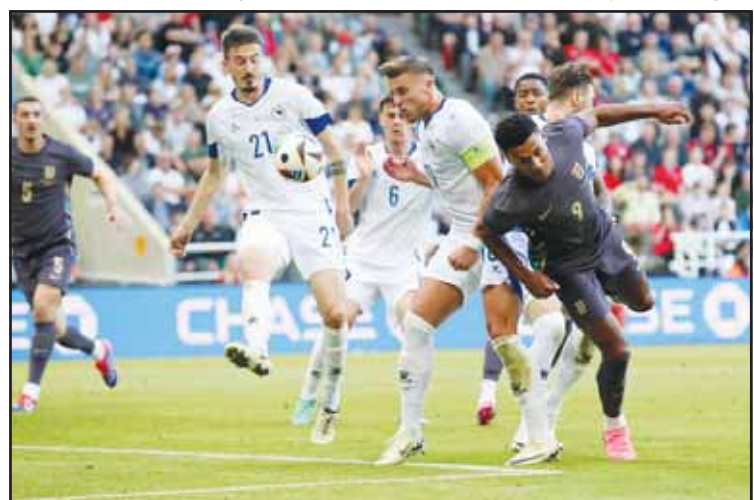
England's Ollie Watkins (right), attempts a header at goal during an international friendly soccer match between England and Bosnia and Herzegovina at St. James Park in Newcastle, England.

Coach Gareth Southgate gave first appearances to Crystal Palace midfielder Adam Wharton - whose club teammate Eberechi Eze impressed in the first half - and Everton defender Jarrad Branthwaite.