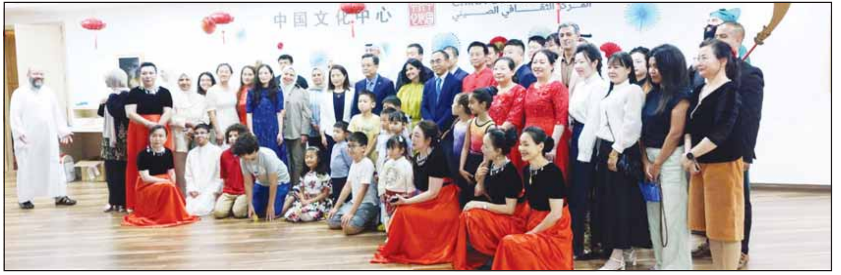
A group photo from graduation ceremony of students from the Chinese Learning and Testing Institute.