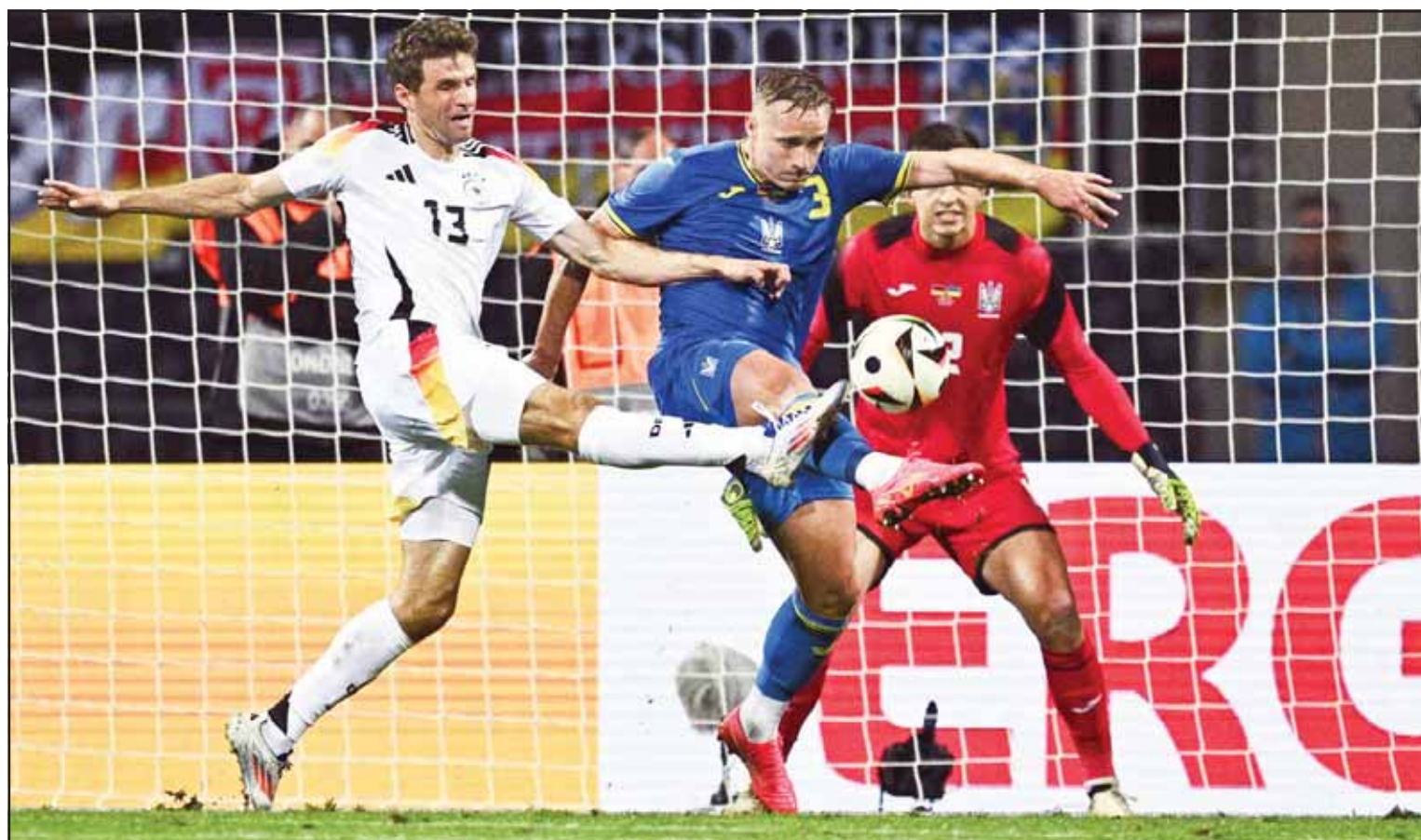
Germany's Thomas Muller (left), fights for the ball against Ukraine's Oleksandr Swatok (center), and goalkeeper Anatolij Trubin, during an international friendly soccer match between Germany and Ukraine in Nuremberg, Germany.