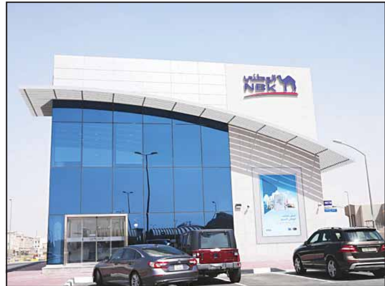
Sabah Al-Ahmad Branch

It is worth mentioning that by opening the new branch, NBK has increased the number of its domestic branch network, which is the largest in Kuwait, to 72 branches, in addition to having the largest owned ATM network locally.