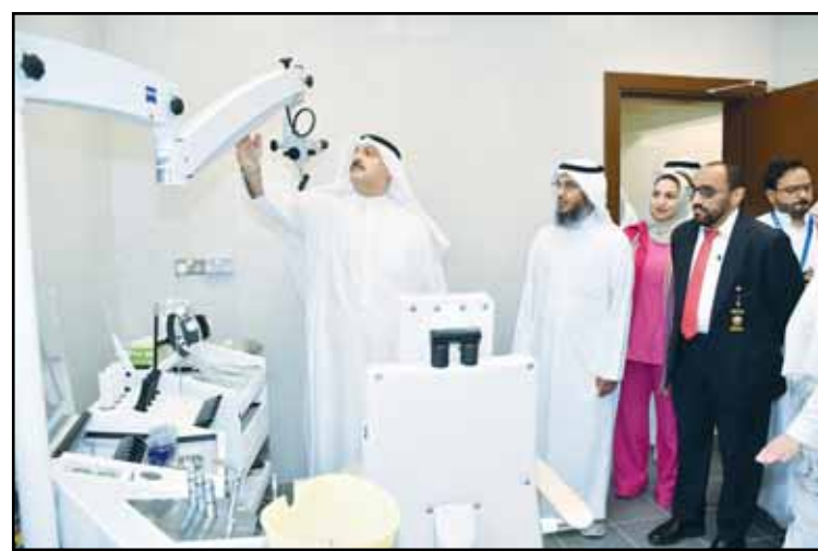
Minister of Health, Dr. Ahmed Al-Awadi inspecting the facility.