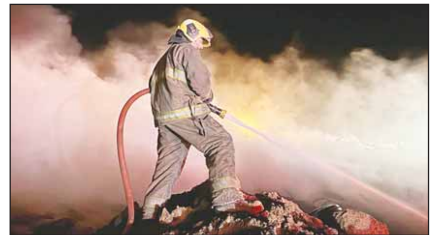
One of the firemen extinguishing the fire at Al-Salmi scrapyard.

The municipality explained in a press statement that specifying these periods comes due to the high temperature during the summer and to make it easier for the families of the deceased to pray over them and bury them at night, saying all cemeteries will be fully lit during the burial periods.