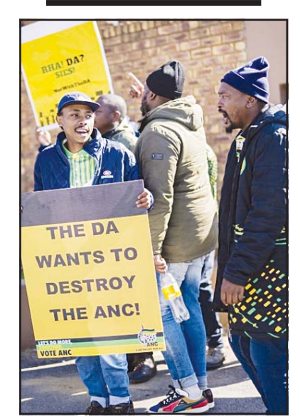
African National Congress party members protest as South African Président Cyril Ramaphosa meets with Senior officials of the ANC during the ANC's National Executive Committee on June 6 in Johannesburg, South Africa.