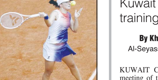
Poland's Iga Swiatek plays a shot against Coco Gauff of the U.S. during their semifinal match of the French Open tennis tournament at the Roland Garros stadium in Paris.

some chances to make more of a match of this.