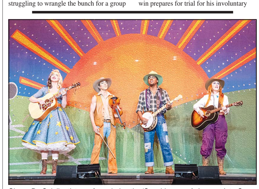
Cirque Du Soleil artists perform during the 'Songblazers - A Journey Into Country Music' Cirque Du Soleil preview Wednesday, June 5, at Belmont University in Nashville, Tenn.

The announcement comes as Baldwin prepares for trial for his involuntary