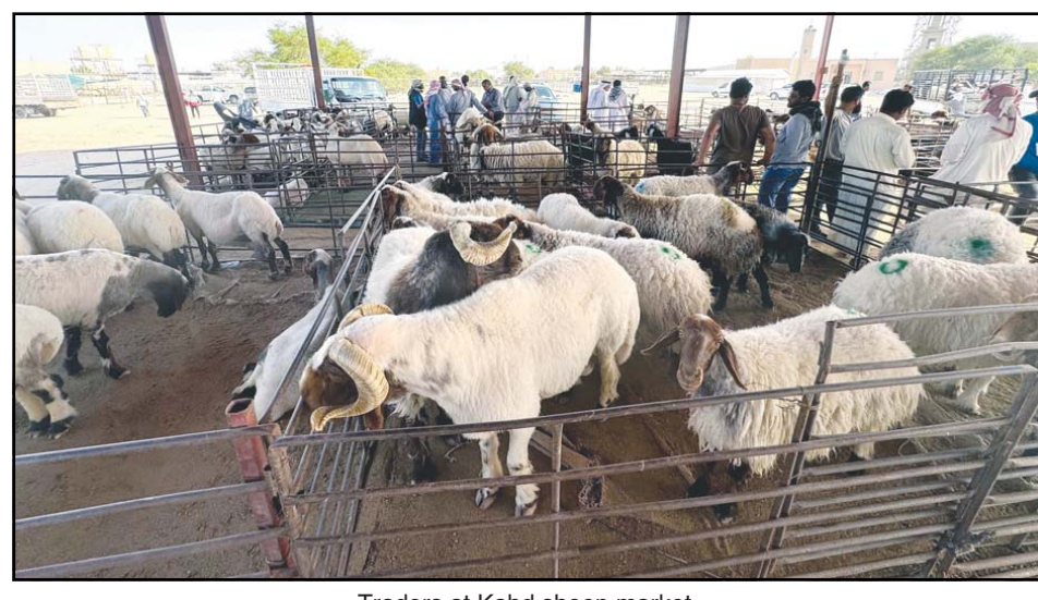
Traders at Kabd sheep market.

people by affirming that some people exagger-