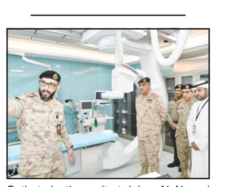
Catheterization unit at Jaber Al-Ahmad armed forces hospital.

KUWAIT CITY, June 6: The country's power consumption index recently exceeded the 16,000-megawatt barrier for the second time; as the consumption peak has started due to the extremely high temperature during summer, reports Al-Jarida daily.