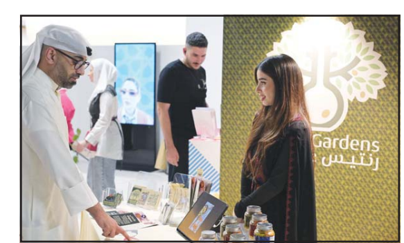
General photo of the exhibition.