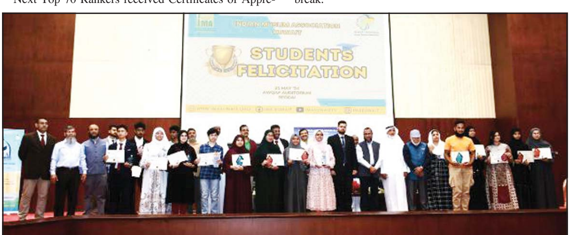
Group photo from the event.

Children Snacks were sponsored by Al Faysal Bakery and Water bottles were sponsored by Malabar Gold. IMA extends its heartfelt thanks for their continued support. Tea and Snacks were served to the attendees during tea