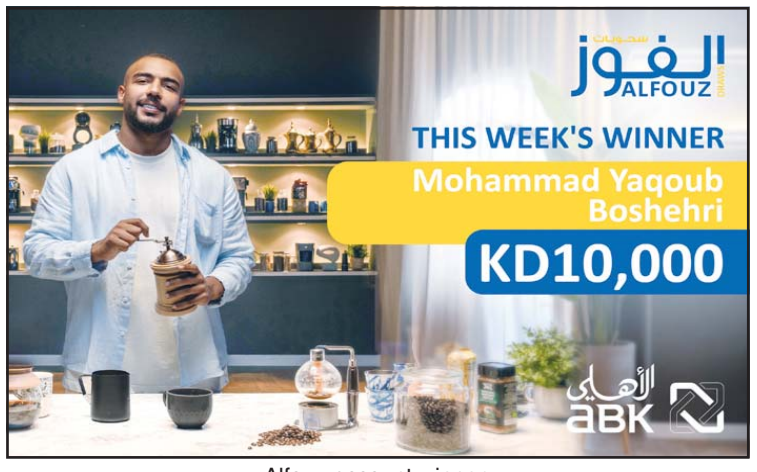
Alfouz account winner.

ABK encourages everyone to open an Alfouz draw account and/or increase their balances to have more chances in winning in the upcoming weekly draw