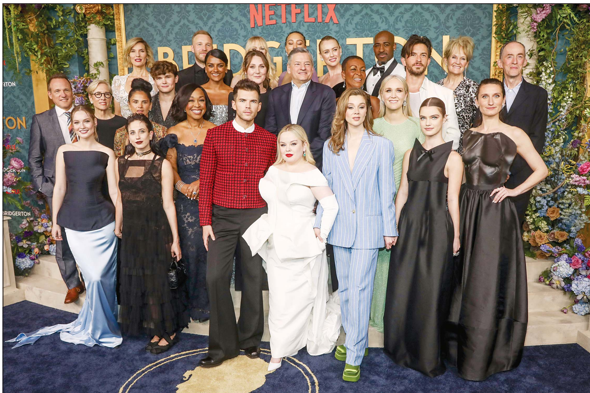
'Bridgerton' cast and producers pose at the 'Bridgerton' Season 3 global premiere at Alice Tully Hall on May 13, 2024, in New York. Even when hit TV series like 'The Crown' or 'Bridgerton' have wide appeal, Netflix still tries to cater to the divergent tastes in its vast audience.