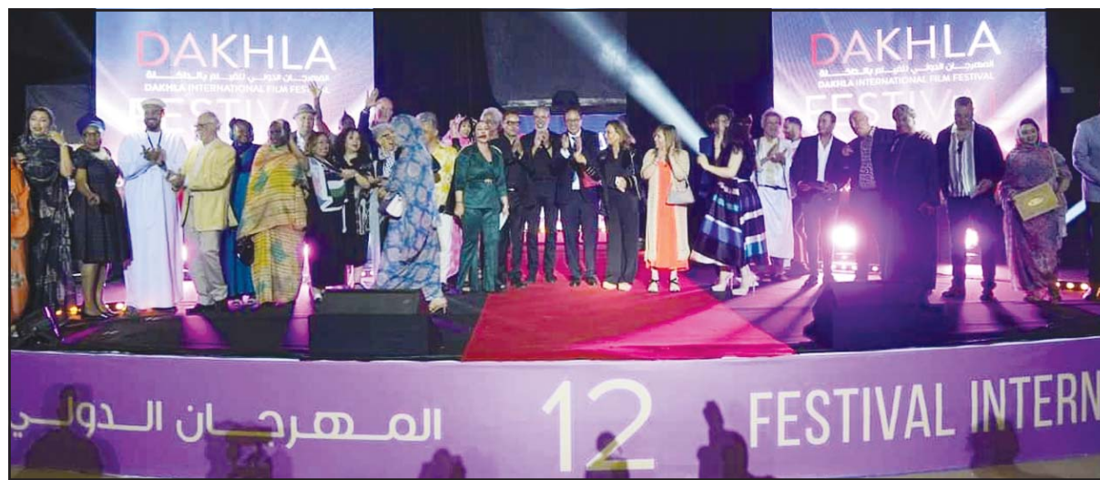
Morocco's Dakhla International Film Festival participants.