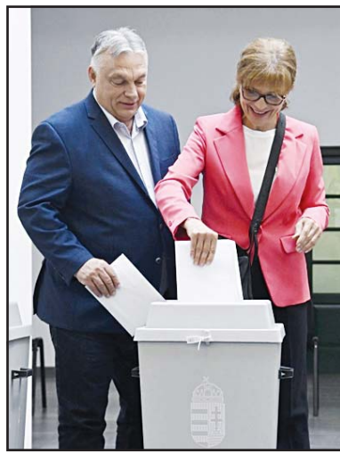
Hungarian Prime Minister Viktor Orban, left, leader of the ruling Fidesz party and his wife, Aniko Levai cast their votes at a polling station during the European Parliament and the local elections in Budapest, Hungary, June 9, 2024.