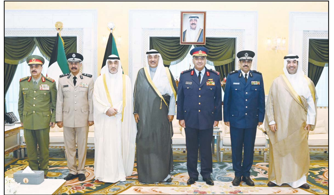
HH the Crown Prince Sheikh Sabah Khaled receives First Deputy PM, Minister of Defense and Minister of Interior Sheikh Fahad Yusuf Saud Al-Sabah, Chief of the General Staff of the Army, Undersecretary of the Ministry of Interior.