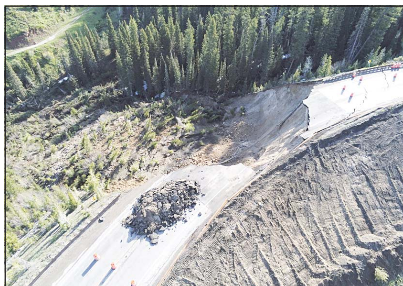
shows a damaged section of Teton Pass near Jackson, Wyoming on June 8 that officials said had 'catastrophically failed.' Aerial photos and drone video of the collapse show the Teton Pass road riven with deep cracks, and a big section of the pavement disappeared altogether. The road was closed at the time of the collapse.

"Next week we get the truth," Menendez said just before stepping into a car that carried him away from Manhattan federal court, where he has been on trial for the last month. Although he generally speaks briefly in Spanish each day leaving court, he made the comment about truth in English.