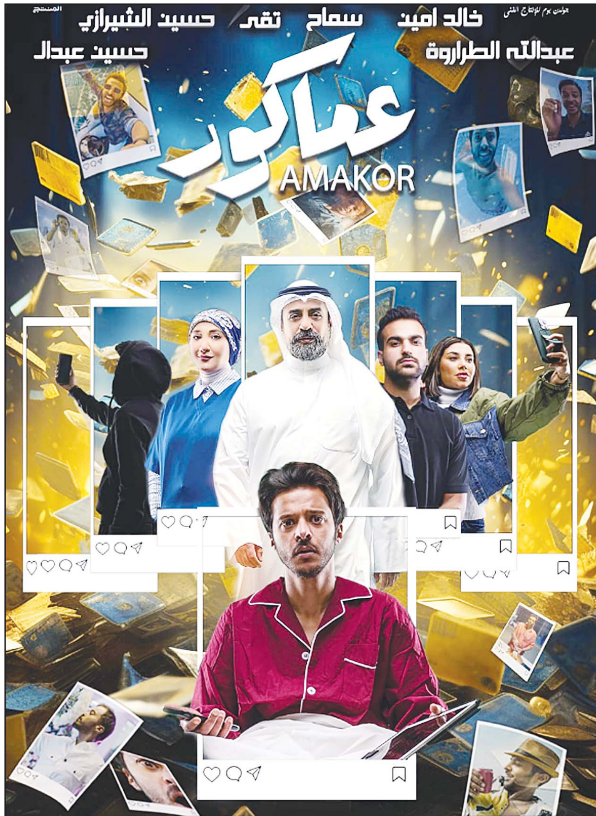
The poster of Kuwaiti film 'Amakor.'