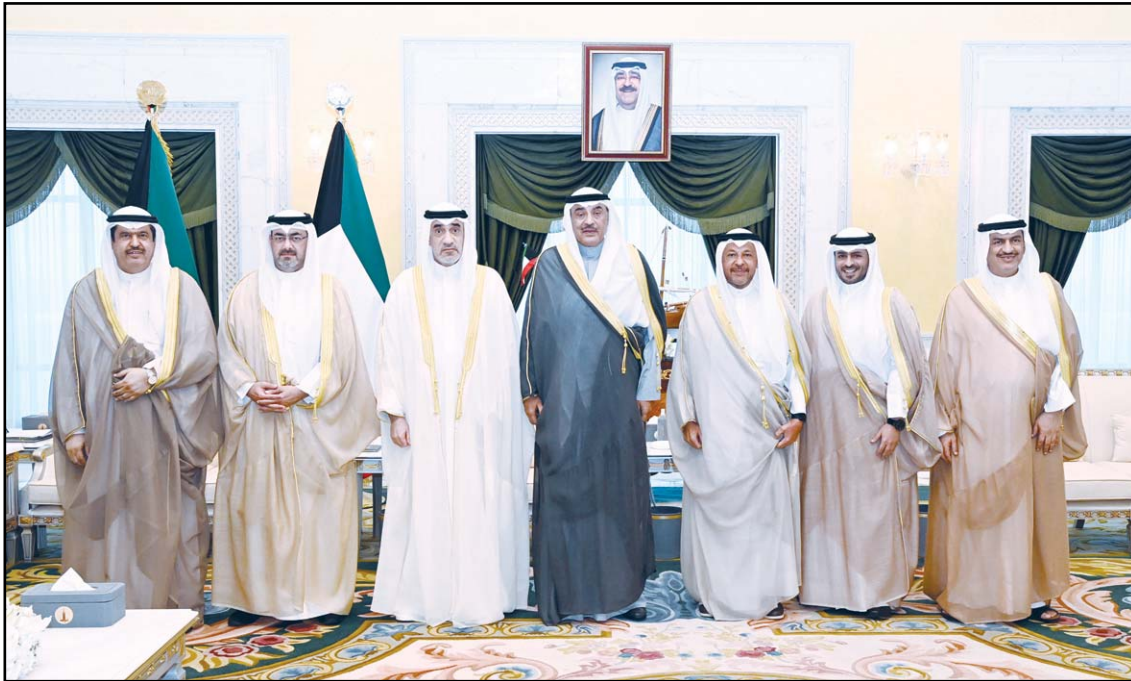
HH the Crown Prince Sheikh Sabah Khaled receives the First Deputy PM, Minister of Defense and Minister of Interior Sheikh Fahad Yusuf Saud Al-Sabah and the governors.