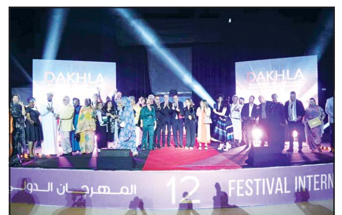
Participants are seen at the conclusion of Dakhla International Film Festival in Morocco on Saturday, where the Kuwaiti film 'Amakor' was showcased. - See Page 12