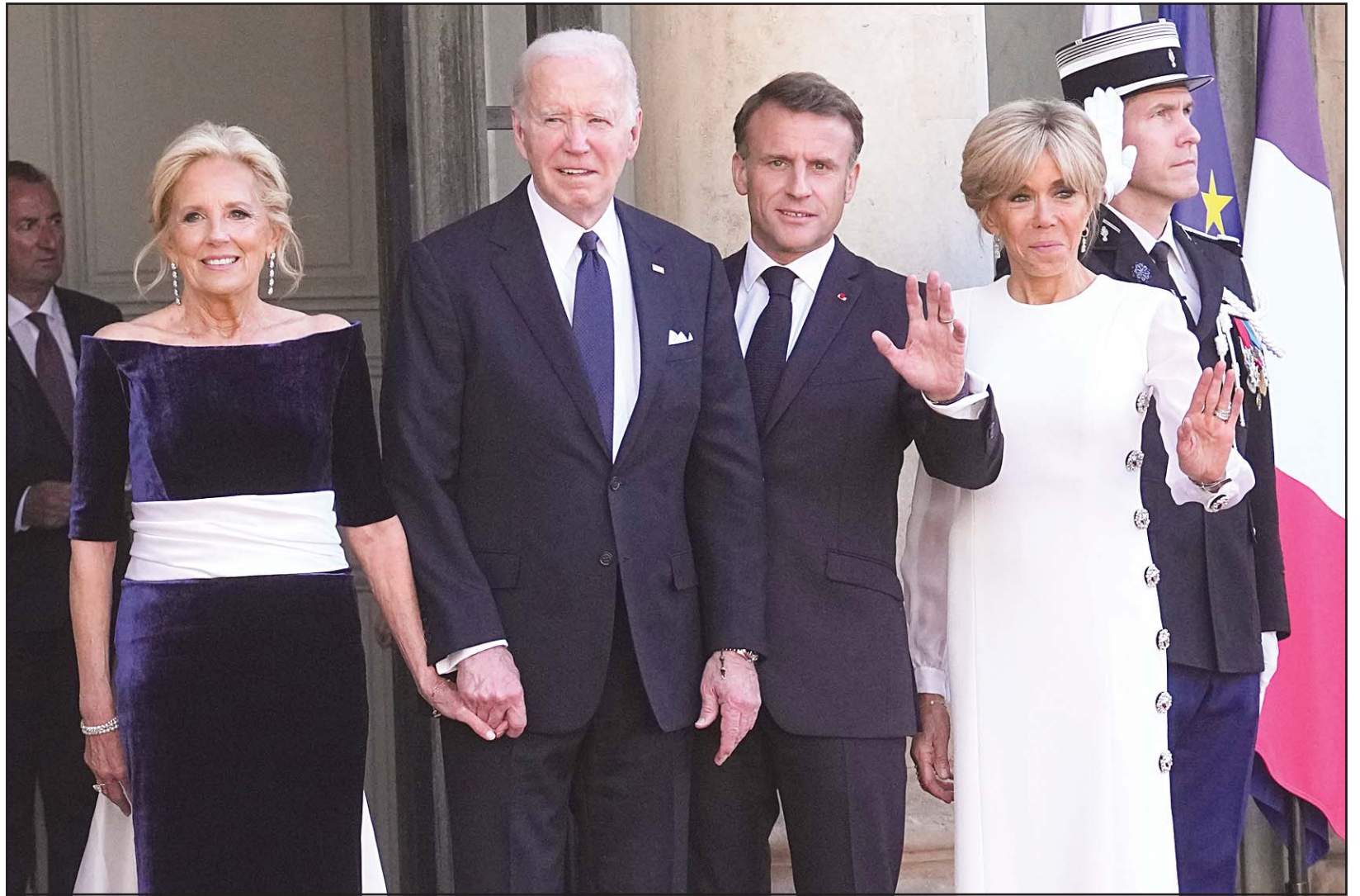
US President Joe Biden and First Lady Jill Biden, (left), French President Emmanuel Macron and his wife Brigitte Macron pose before a state dinner on June 8 at the Elysee Palace in Paris. Biden said France was America's 'first friend' at its founding and is one of its closest allies more than two centuries later as he was honored with a state visit Saturday by Macron aimed at showing off their partnership on global security issues and easing past trade tensions.

The strike comes after the United States and Germany recently authorized Ukraine to hit some targets on Russian soil with the long-range weapons they are supplying to Kyiv. Ukraine has already used US weapons to strike inside Russia under newly approved guidance from President Joe Biden that allows American arms to be used for the limited purpose of defending Kharkiv, Ukraine's second-largest city.