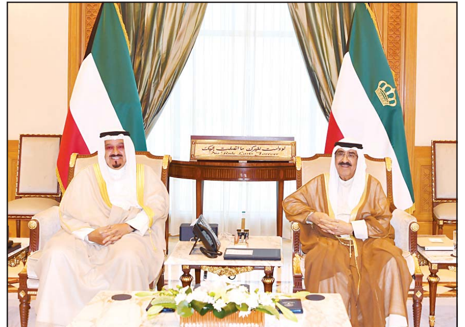
His Highness the Amir Sheikh Mishal Al-Ahmad Al-Jaber Al-Sabah received, Sunday, His Highness the Crown Prince Sheikh Sabah Khaled Al-Hamad Al-Mubarak Al-Sabah (left) at Seif Palace. His Highness the Amir also received His Highness the Prime Minister Sheikh Ahmad Abdullah Al-Ahmad Al-Sabah (right), Deputy Prime Minister, Minister of Defense and Acting Minister of Interior Sheikh Fahad Yusuf Saud Al-Sabah, and Deputy Chief of the National Guard Sheikh Faisal Nawaf Al-Ahmad Al-Sabah.