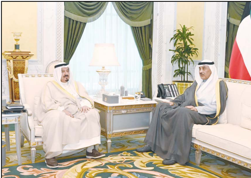
HH the Crown Prince Sheikh Sabah Khaled receives HH the PM Sheikh Ahmad Abdullah Al-Ahmad Al-Sabah.