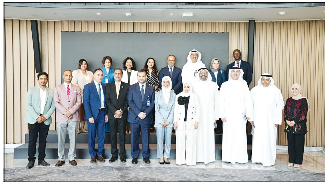
WHO and KGBC visit NBK headquarters for Green Building tour.

Individual investors constituted the second-largest segment, with their