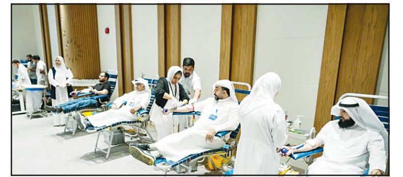
Zain employees were eager to contribute to the initiative's success.

national Federation of Red Cross and Red Crescent Societies (IFRC); the International Federation of Blood Donor Organizations (IFBDO), and the International Society of Blood Transfusion (ISBT).