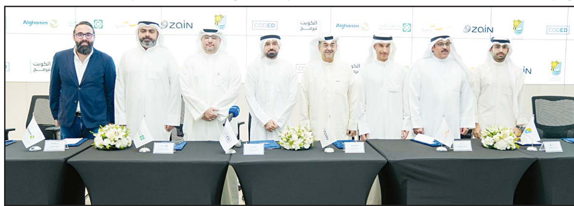
Kuwait Codes equips high school students with programming skills.

"Our continued investment in capacity-building programs reflects Agility's commitment to Kuwait's youth. We want to help equip them with the essential skills needed for today's job market. We are proud to have made a positive impact on more than 7,000 students, over half of whom are young women ready to launch their careers. Our support for Kuwait Codes 2024 and the launch of Academy X underscores our commitment to the next generation of tech talent in Kuwait," said Henadi Al Saleh, Chairperson of Agility.