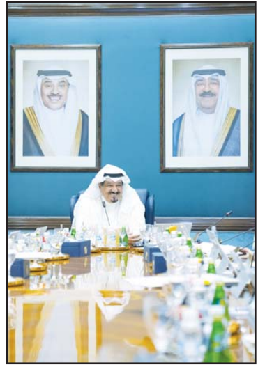
His Highness the Prime Minister chairs the weekly Cabinet meeting.

KUWAIT CITY, June 11, (KUNA): The Kuwaiti Cabinet on Tuesday decided to suspend work at all ministries, state bodies, and public institutions between Sunday (June 16) and Tuesday (June 18) as an official holiday nationwide marking Eid Al-Adha.