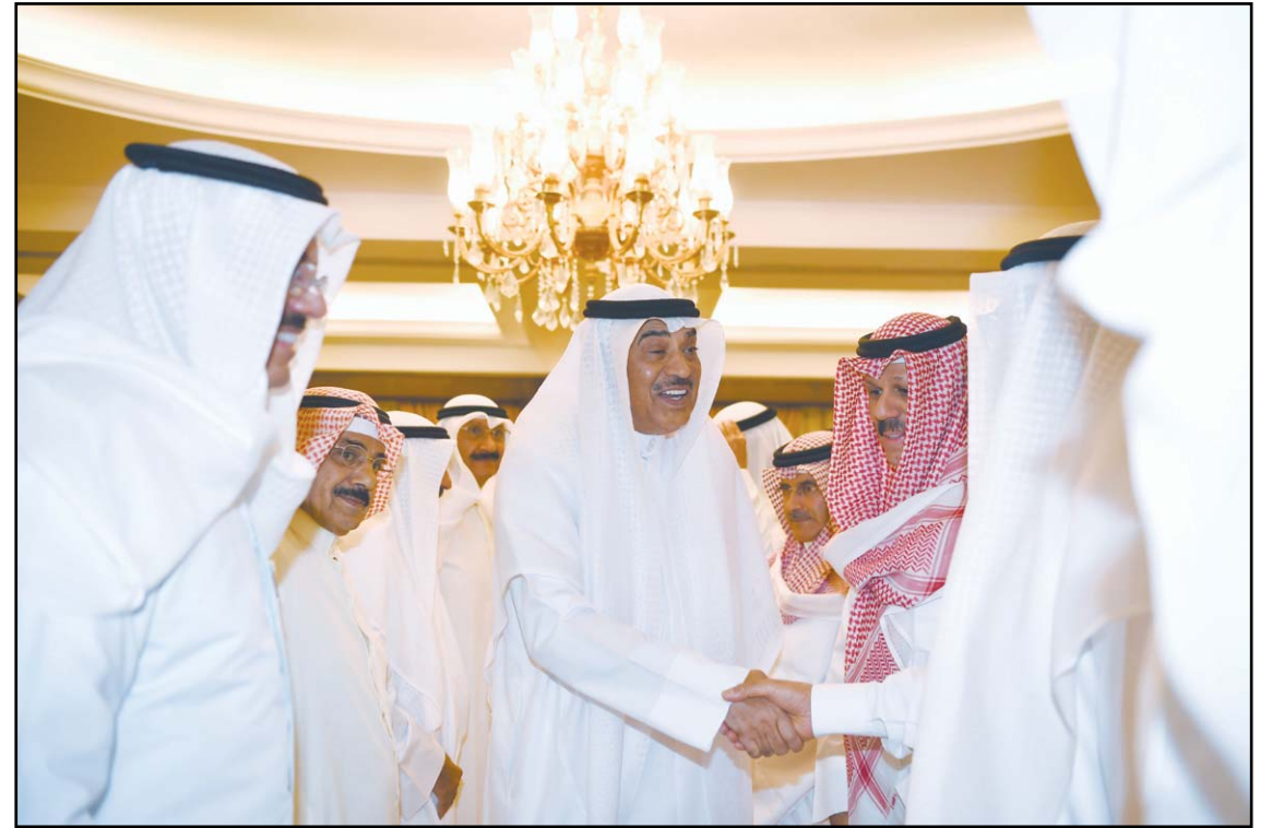
Above: His Highness the Crown Prince Sheikh Sabah Khaled being received at the Bayan Palace.