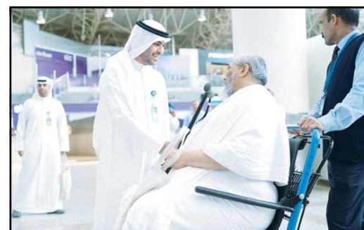
KFH team seeing off Hajj pilgrims at the Kuwait International Airport.

The statement added that both sides discussed bilateral cooperation, and exchanged views on the most prominent regional and international issues of common interest.