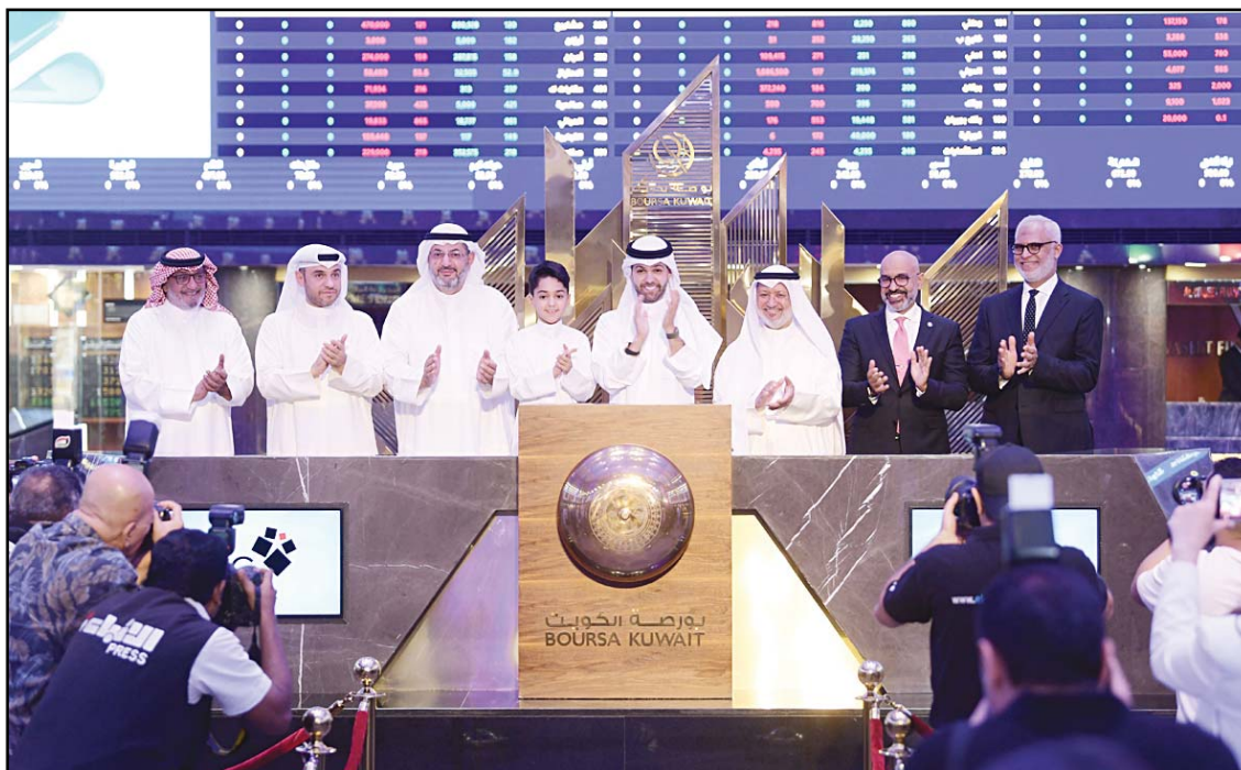
Bursa Kuwait hosts bell-ringing ceremony for BIG's listing.

"Today is a proud and historic moment for Beyout Investment Group and its subsidiaries Kuwait Resources House, Real Estate House, and Boroj Real Estate Investment, as the Company begins a new chapter as a listed business. The Company is deeply rooted within