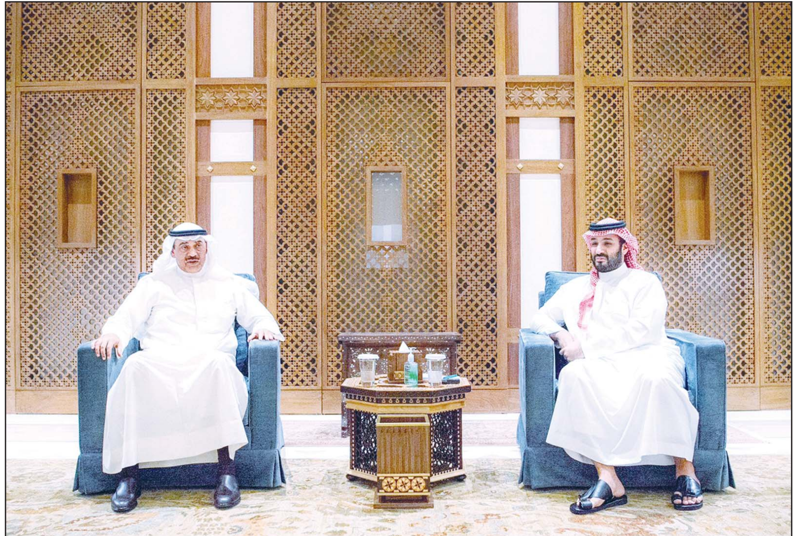
His Highness the Crown Prince Sheikh Sabah Khaled Al-Hamad Al-Sabah and Saudi Crown Prince and Prime Minister Prince Mohammad bin Salman Al-Saud at Al-Salam Palace in Jeddah.