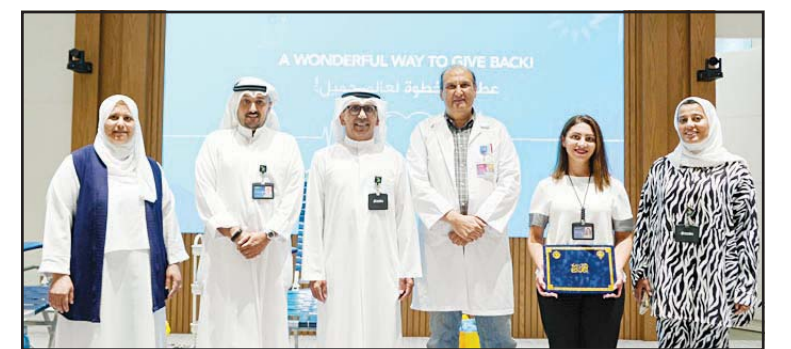
A group photo of Zain and Central Blood Bank teams.

World Blood Donor Day is celebrated around the globe on June 14 of every year. The initiative was organized for the first time in 2004 by four core international organizations: the World Health Organization (WHO), the Inter-