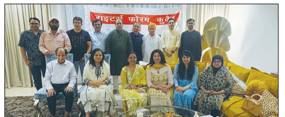
Group photo during the meeting.

awareness of the need for blood and blood products, as well as the importance of having a strategic and sustainable blood reserve. The initiative also highlights the vital role donors play by thanking them for their voluntary, life-saving contributions.