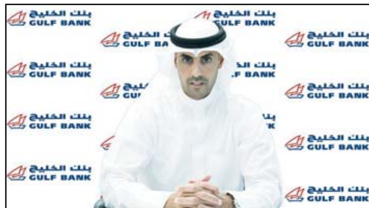
Chairman Bader Nasser Al-Kharafi

Overall, the statistics indicate a slight increase in the total assets of local banks and a decrease in net foreign assets. The total balance of credit facilities for residents and non-residents increased to 54.873 billion dinars in April, compared to 54.521 billion dinars in March.