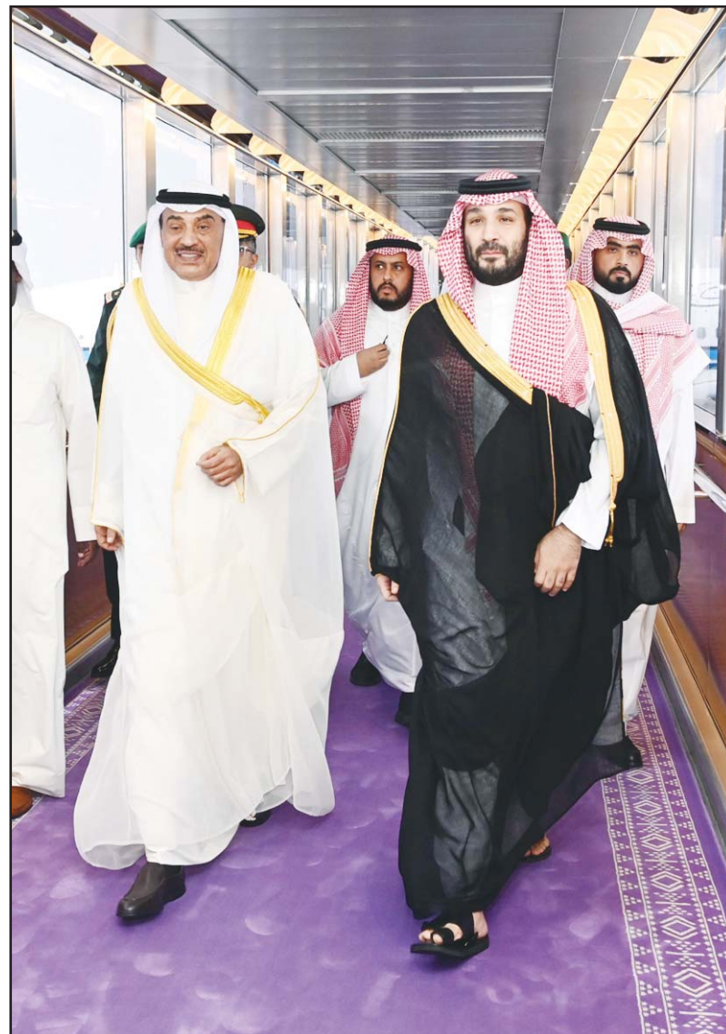
His Highness the Crown Prince Sheikh Sabah Khaled Al-Hamad Al-Sabah is received by the Saudi Crown Prince and Prime Minister Mohammad bin Salman bin Abdulaziz.