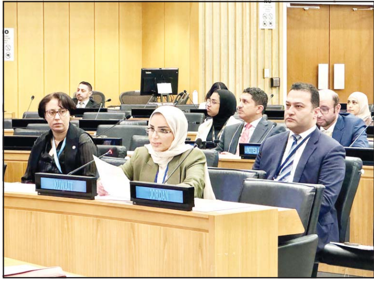
Dr. Amthal Al-Huwailah – Minister of Social Affairs, Family, Childhood, and Minister of Youth, during her speech at the United Nations Arab Group meeting.