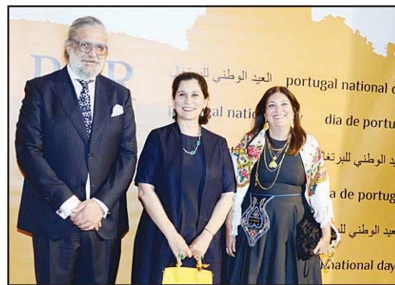
Photos during the event.