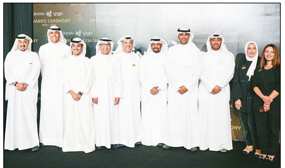
Zain team at the event.

Under this partnership, Zain's role centered around three main areas: supporting athletes with cash prizes, launching social events and interacting with fans at stadiums, and the first-ever Fantasy Football League in Kuwaiti football's history. These contributions and more went in line with the KFA's vision to bolster the local football scene. Zain also extended its appreciation