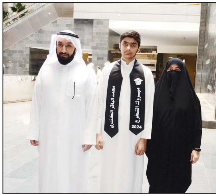
Left-right: Some of the students who have passed their Grade 12 exams pose with their parents.