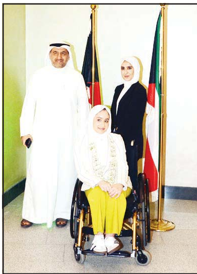
One of the students.

His Highness the Crown Prince praised efforts exerted by the ministry officials on all levels, in preparing, correcting, and evaluating the tests, and all the facilities they offered to the students, wishing for further success and prosperity to the graduates in their fu-