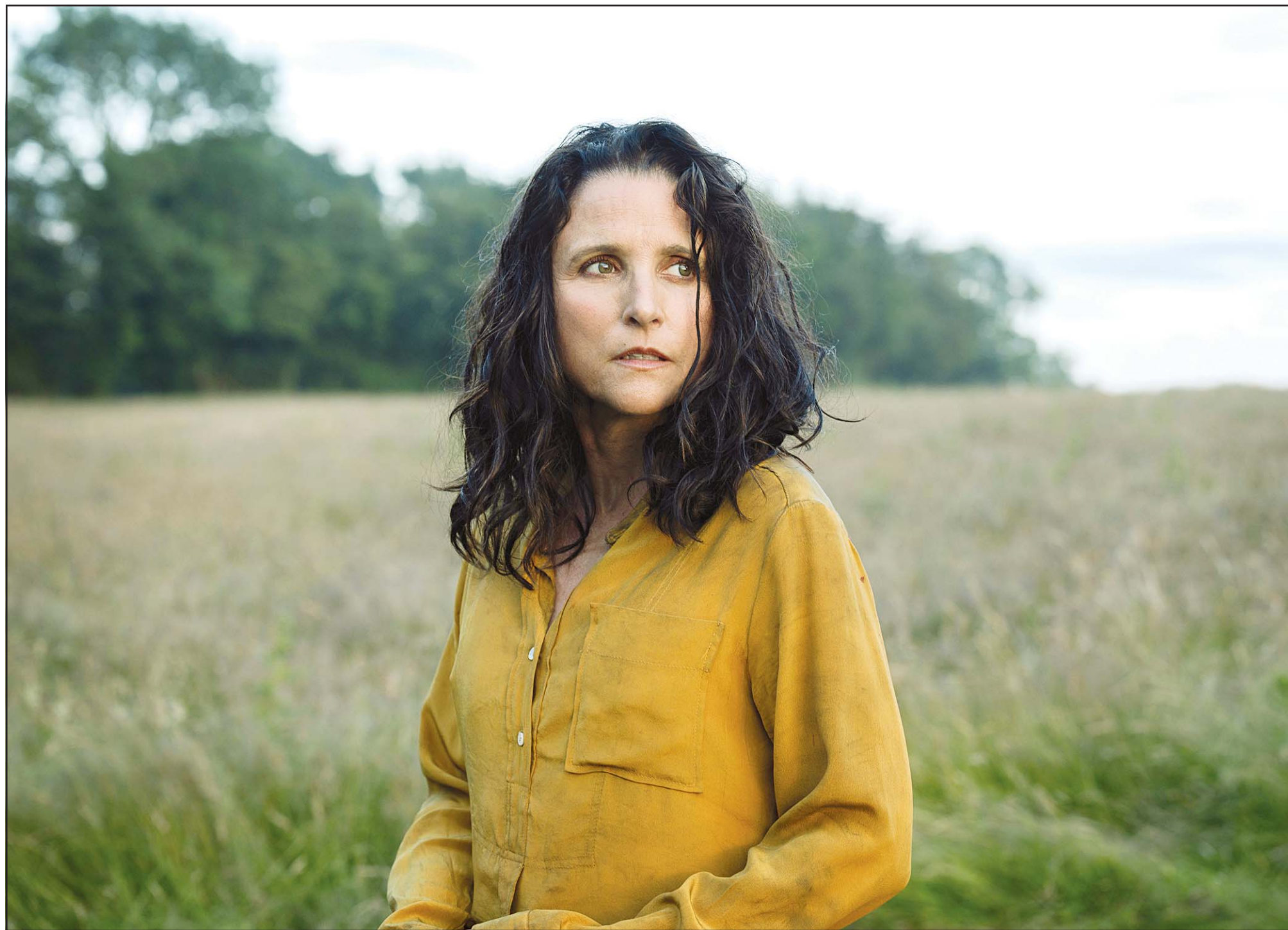
This image released by A24 shows Julia Louis-Dreyfus in a scene from 'Tuesday.' (AP)