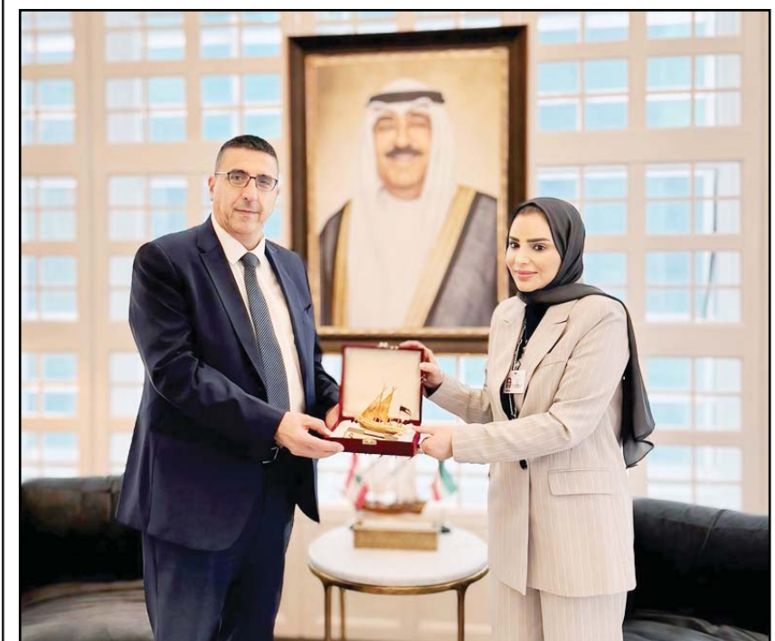
Minister of Social Affairs, Dr. Amthal Al-Huwailah with Lebanese Minister of Social Affairs Dr. Hector Hajjar at the headquarters of the Permanent Delegation of Kuwait to the United Nations.

Tel: +973 17701201 - Ext. 351 | Email: reservation@albander.com | www.albander.com | @albanderhotelandresort