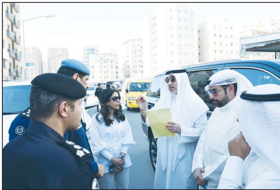
First Deputy Prime Minister, Defense Minister and Interior Minister Sheikh Fahad Yousuf Al-Sabah leads an inspection campaign on illegal properties across Kuwait, accompanied by Minister of Public Works and Minister of Municipality Dr. Nora Al-Mashaan. The campaign covered areas including Al-Mangaf, Al-Mahboula, Khaitan, and Jleeb Al-Shuyoukh.

Sheikh Fahad Al-Yousuf on Thursday headed an overall inspection campaign on illegal