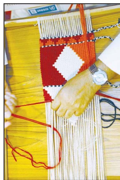
Traditional hand weaving skills on display at Kuwait's Sadu Society live show held Wednesday. — See Page 4