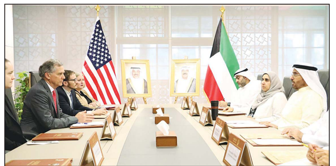
Minister of Finance Dr Al-Mudhaf during the meeting with US congressman French Hill.

He added the opening of customer service centers will continue, especially in remote areas, to ease procedures for citizens and expatriates on one hand, and to increase energy bill payment collection rates on the other hand.