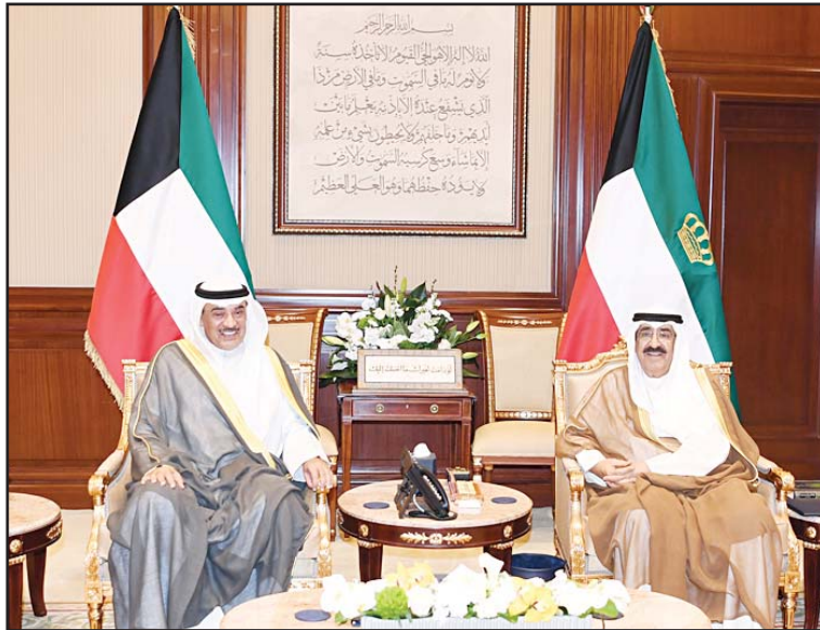
His Highness the Amir Sheikh Mishal Al-Ahmad Al-Jaber Al-Sabah received at Bayan Palace on Wednesday His Highness the Crown Prince Sheikh Sabah Khaled Al-Hamad Al-Sabah and His Highness the Prime Minister Sheikh Ahmad Abdullah Al-Ahmad Al-Sabah.