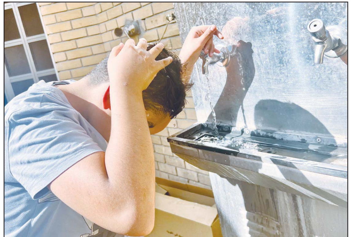
Seeking relief from scorching heat, a young man cools off with water as Kuwait hits 52°C on a blistering Wednesday afternoon.

Official sources from the Ministry of Electricity and Water disclosed that the failure of a power generation unit in South Zour Station with a capacity of 300 megawatts was behind the out-