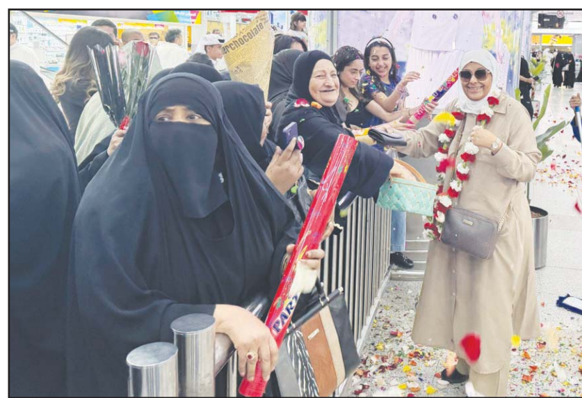
Top and above: Pilgrims being received by their family members at the Kuwait International Airport after their return from Hajj.