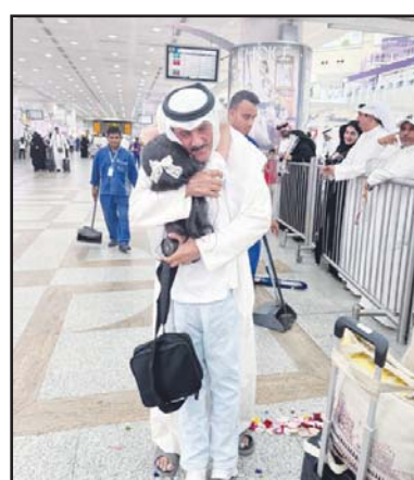
Kuwaiti pilgrims receive warm embraces and a festive welcome from family and loved ones upon their return to Kuwait International Airport after completing Hajj. -- See Also Page 2