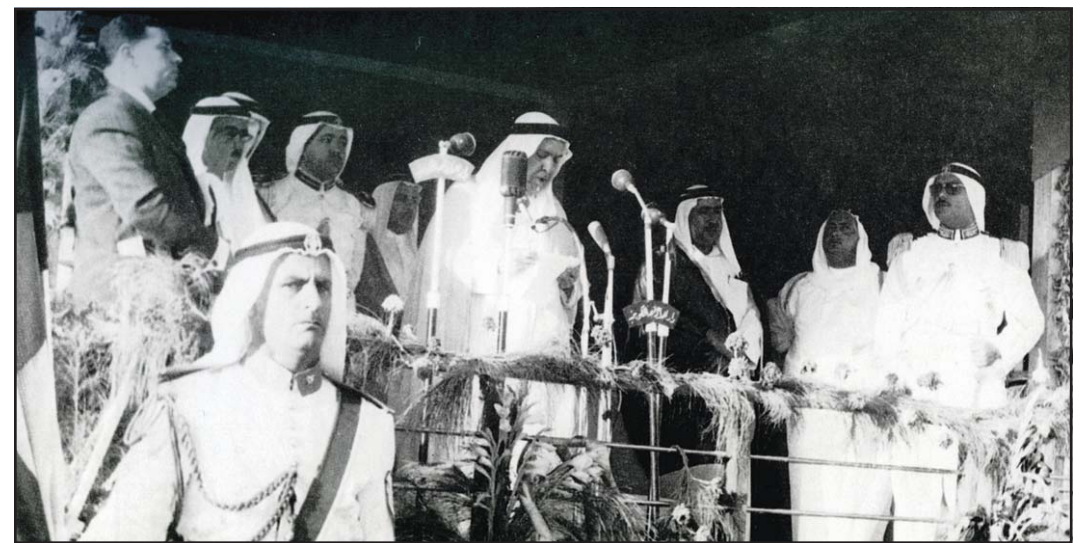
On June 19, 1961, Sheikh Abdullah Al-Salem Al-Sabah officially announced the independence of Kuwait after canceling the Kuwaiti-British Treaty that was signed in 1899.