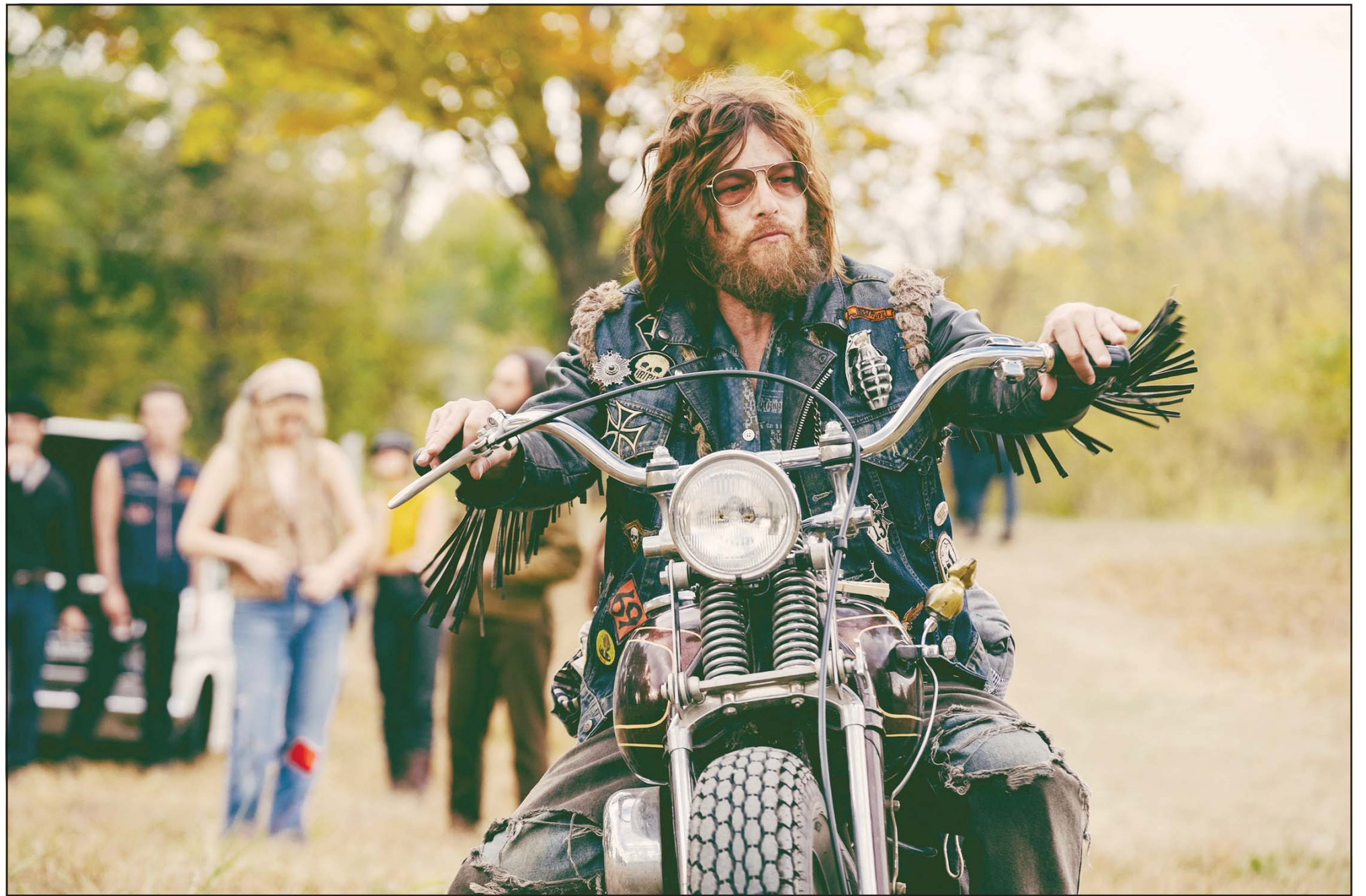
This image released by Focus Features shows Tom Hardy in a scene from 'The Bikeriders.' (AP)