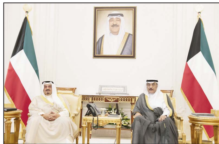
His Highness the Crown Prince Sheikh Sabah Khaled Al-Hamad Al-Sabah received at Bayan Palace Wednesday His Highness the Prime Minister Sheikh Ahmad Abdullah Al-Ahmad Al-Sabah.