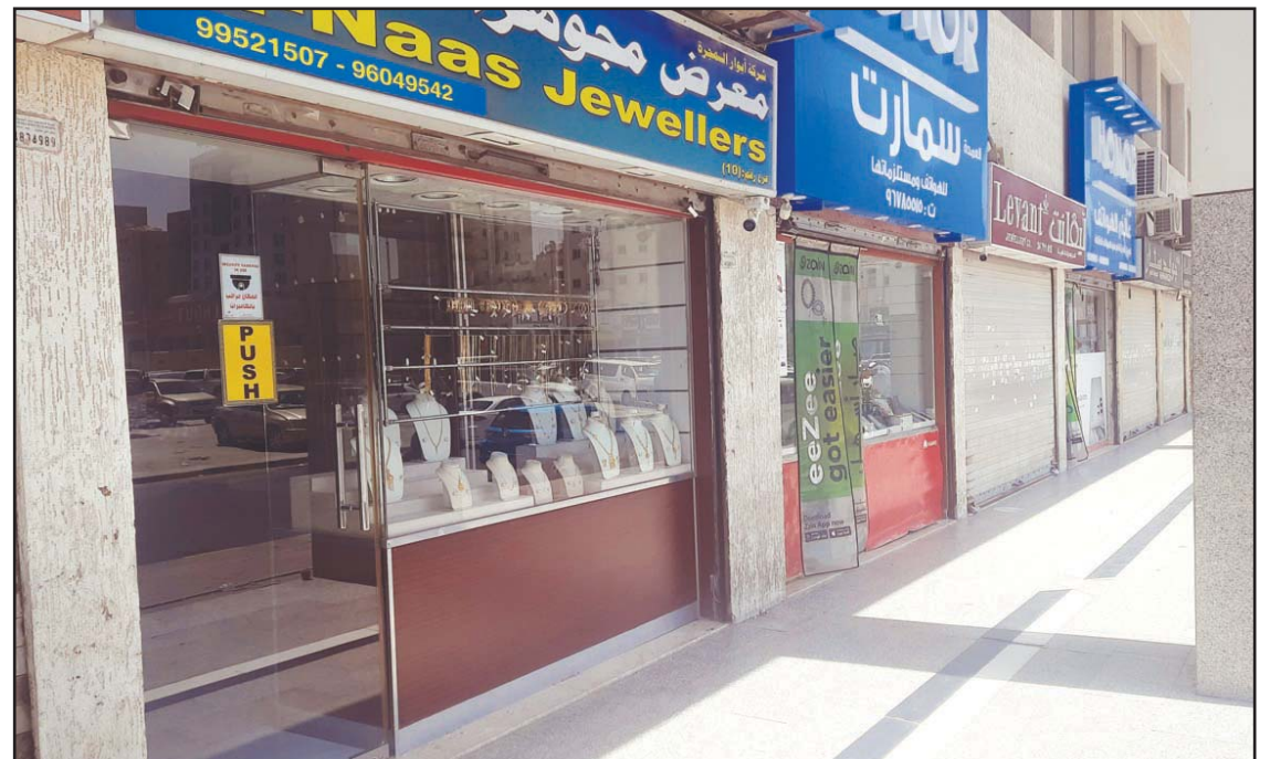
Khaitan shops forced to close as Kuwait grapples with power outage.

ages in different parts of the country. They added this is one of the old stations with eight units whose lifespan ended, affirming that the ministry recently signed a contract to carry out the maintenance works.