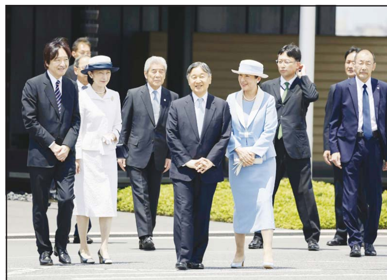
Japanese Emperor Naruhito, (center left), and Empress Masako, (center right), smile as they depart for the state visit to Britain, at Haneda airport in Tokyo, Japan on June 22. Japanese Crown Prince Akishino is seen at left, while Crown Princess Kiko is at second left.