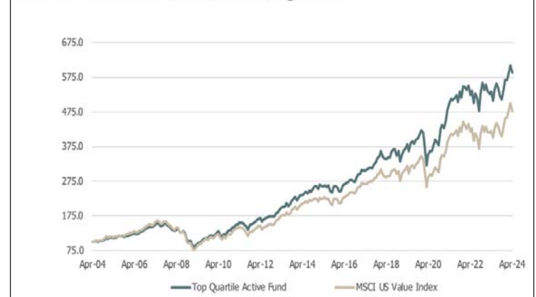
Chart 1 - Active vs. Passive Management 2

In conclusion, value stocks are currently at historically low valuations compared to growth stocks, key indices are overweight growth due to recent outperformance of the growth style. A long-term horizon is key for an investor that wants to explore value opportunities and an active manager can add significant value by identifying attractive stocks and ensure a robust portfolio construction with sufficient diversification.