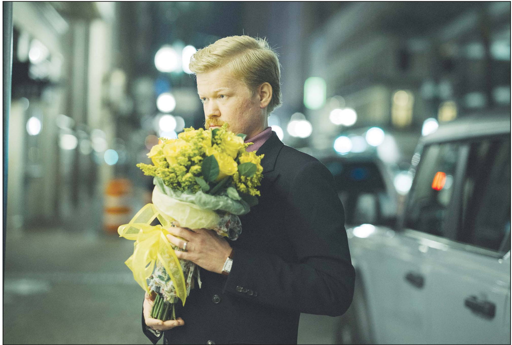
This image released by Searchlight Pictures shows Jesse Plemons in a scene from 'Kinds of Kindness.' (AP)