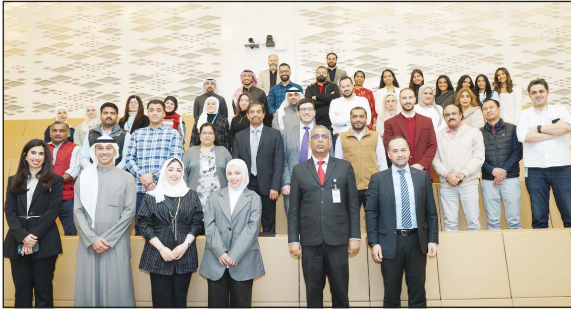
Group photo during the Markaz awareness seminars for its employees and board of directors on the cyber threat landscape.

The awareness seminars also illustrated how the cyber threat landscape has advanced with the advent of artificial intelligence through multiple case studies. These interactive sessions concluded by presenting concrete, actionable solu-