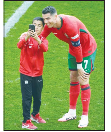
A young pitch invader takes a selfie with Portugal's Cristiano Ronaldo during a Group F match between Turkey and Portugal at the Euro 2024 soccer tournament in Dortmund, Germany.

Portugal backed up its opening 2-1 victory over the Czech Republic and has qualified with a game to spare from Group F, guaranteeing a last-16 match in Frankfurt on July 1. Martinez may choose to rest Ronaldo and more of his