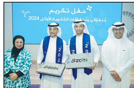
Recognizing two distinguished graduates.