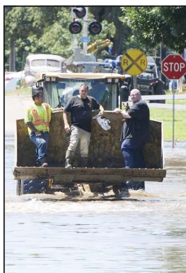
A person holds a dog while being evacuated in the bucket of a front end loader in Hawarden, Iowa on June 22 in the wake of flooding from the Big Sioux River. Massive upstream rainfall sent the river over its banks in Hawarden causing massing flooding that prompted evacuations.

Serrott said the faction representing a majority of the House Republican caucus should make decisions about the fund, since majorities rule in a democracy, in order to comply with state law.