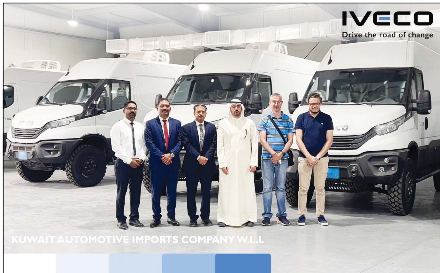
IVECO delivers daily 4x4 trucks to Kuwait's MEW.

It is worth mentioning that Warba Bank is one of the banks that achieved great successes in a short period of time, as it occupied a leading position in the field of digital Islamic banking services for individuals, and it is one of the most local banks in terms of the number of shareholders, and these are among the most prominent elements that make the bank close to all members of society.