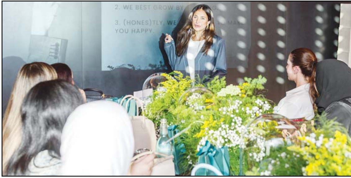
Gulf Bank engages community with interactive jewelry workshop.

It's important to highlight that last year, the bank arranged numerous lectures and workshops covering diverse fields including Makeup, Fashion Styling and Getting Ready for Ramadan. These sessions, which catered to the