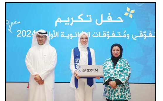
Honoring a top student.