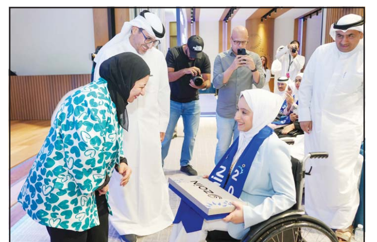
Recognizing a Special Education graduate.

KUWAIT CITY, June 23: Zain organized its annual honoring ceremony to recognize and celebrate Kuwait's top high school graduates for the academic year 2023-2024.