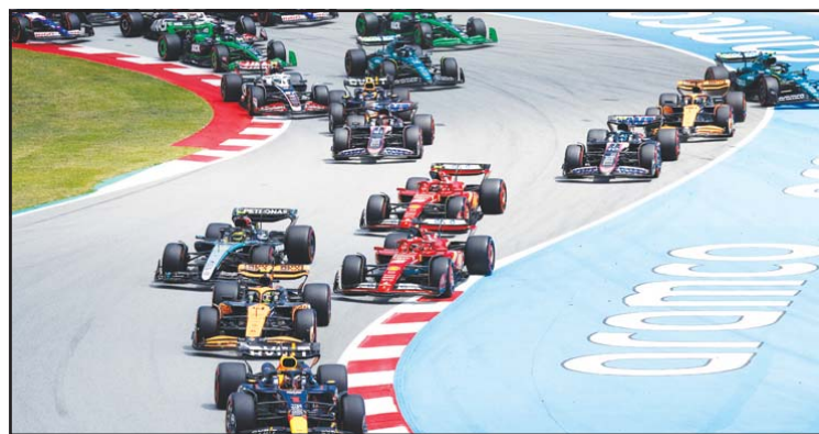
Red Bull driver Max Verstappen of the Netherlands leads the group during the first laps of the Formula 1 Spanish Grand Prix at the Barcelona Catalunya racetrack in Montmelo, near Barcelona, Spain.

Verstappen started from second on the grid behind pole-sitter Lando Norris. But the three-time champion