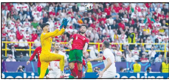
Turkey's goalkeeper Altay Bayindir makes a save during a Group F match between Turkey and Portugal at the Euro 2024 soccer tournament in Dortmund, Germany.