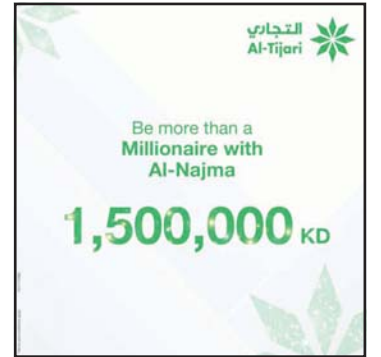
Commercial Bank of Kuwait conducts Al Najma Account weekly draw

Al-Najma Account can be opened by depositing KD 200, and customer should maintain a minimum amount of KD 200 to be eligible to enter all draws on Al-Najma Account prizes. As for the chances of winning, the more