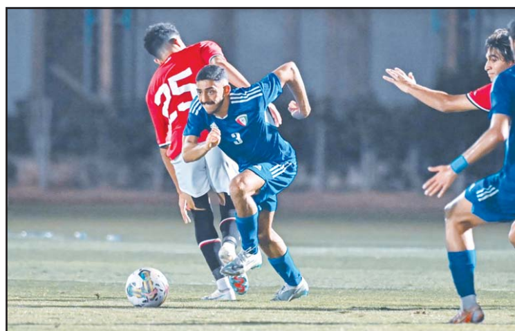
A Kuwaiti dribbles past an opponent during Kuwait, Egypt friendly game.

After the conclusion of the West Asian Championship, the national youth team will return to Kuwait for local training before leaving on July 17 for an external camp in Serbia, which will