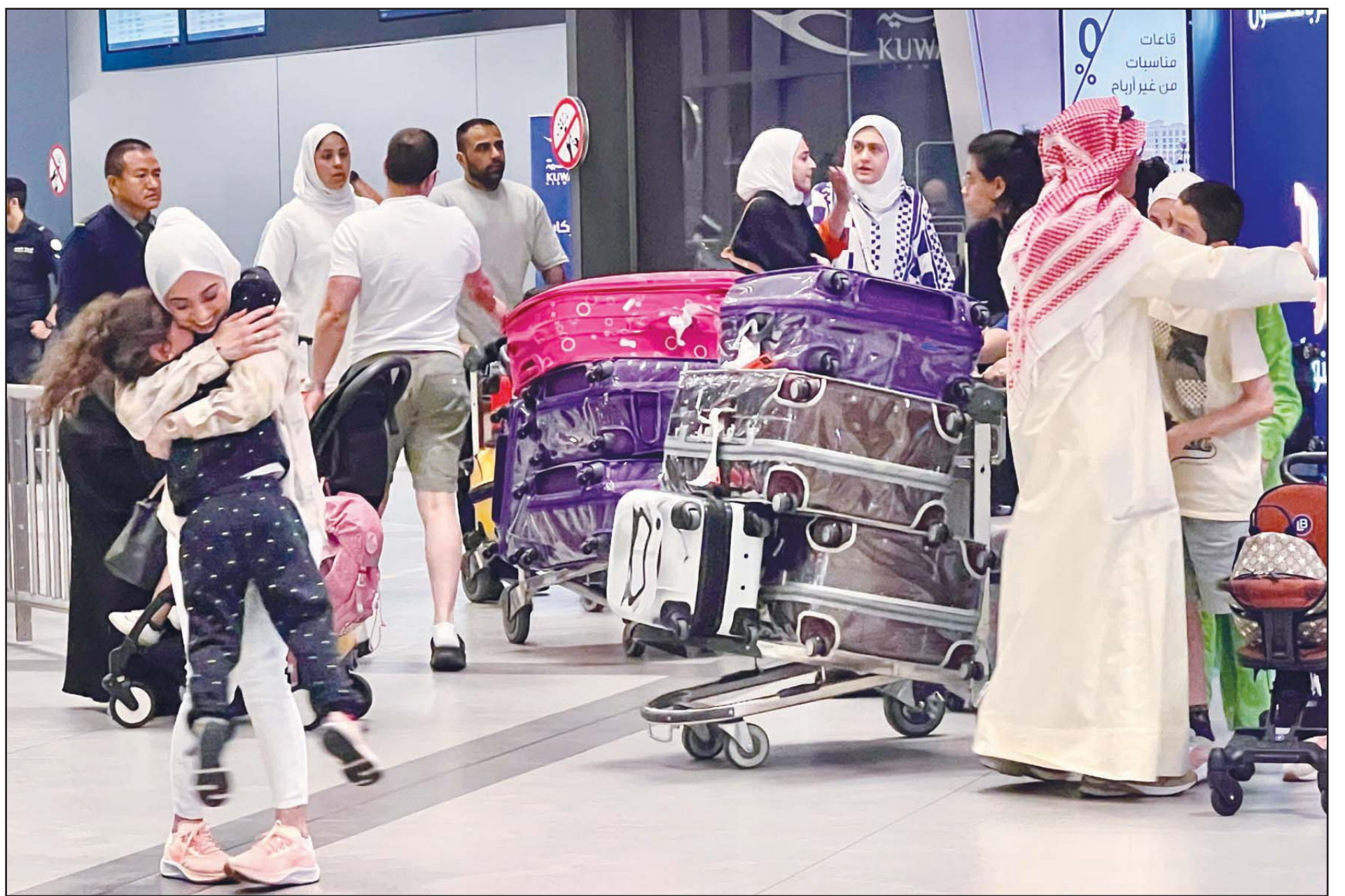
Kuwaiti returnees from Lebanon receive hugs and a warm welcome upon arrival at Kuwait Airport Terminal 4 on Sunday morning.