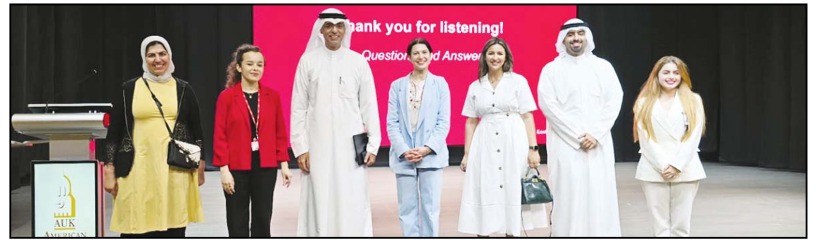
Group photo of the workshop organizers.

By hosting such workshops, AUK positions itself at the forefront of research initiatives in Kuwait, reaffirming its reputation as a dynamic hub for academic exchange and innovation in the region.