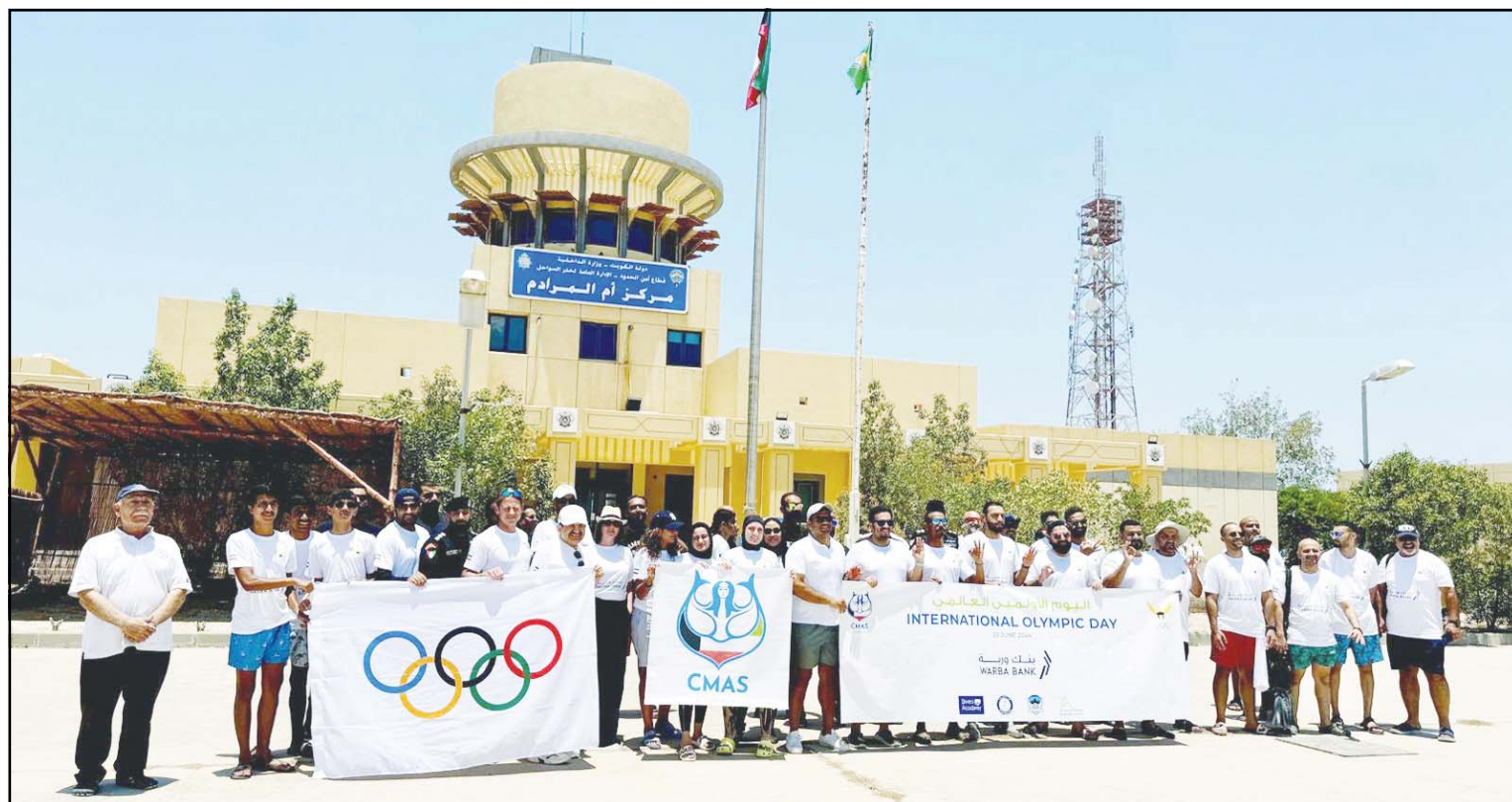
A group photo of campaign participants.