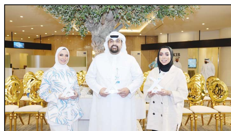
KIB Excellence Program