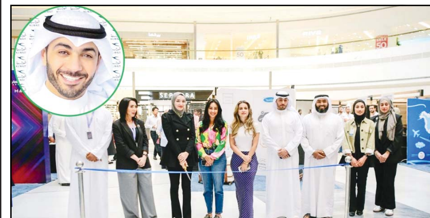
The Kuwait Airways team participating in the exhibition.