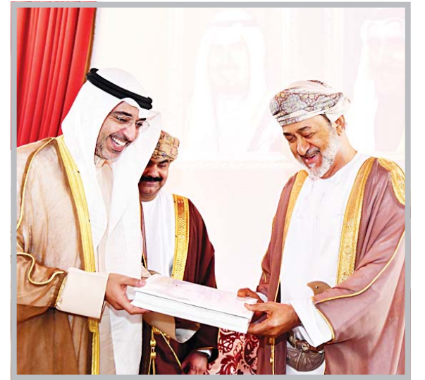
The Sultan of Oman is presented a book on Kuwait history.