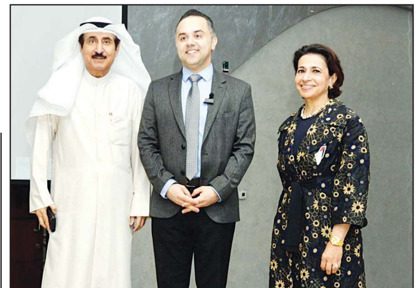
Top and above: Some photos from the event.