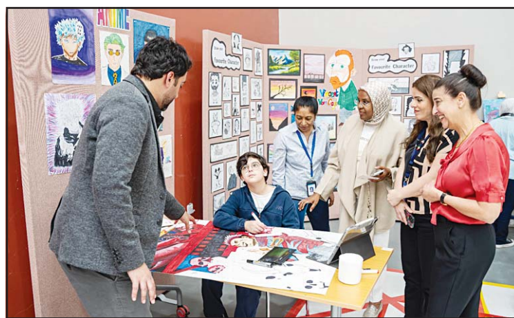
Art coordinator talking to one of the student artists.