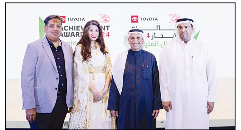
Photos during the event