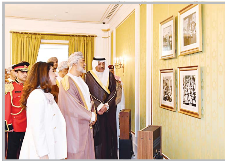
The Sultan of Oman viewing historical pictures of Kuwait rulers.