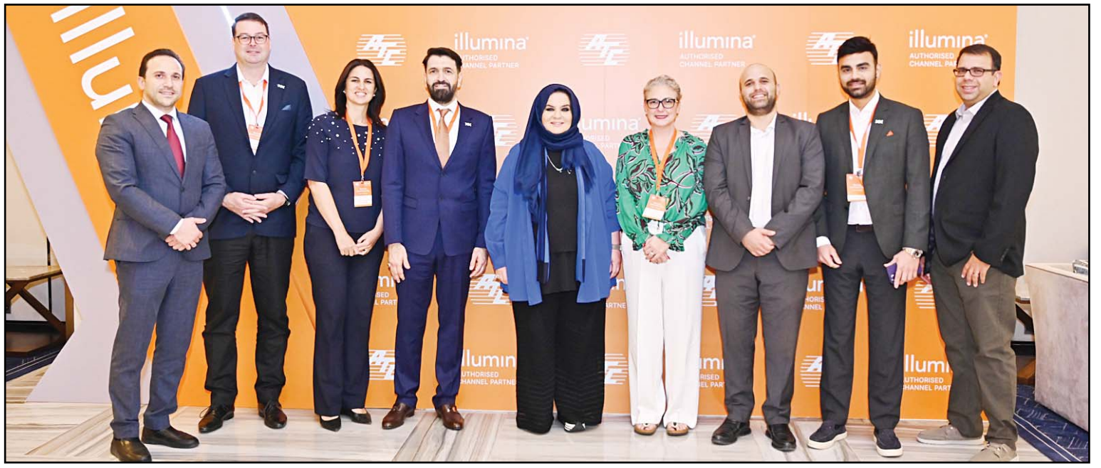
ATC organizes workshops and lectures on genetics and heredity in collaboration with KMGCC and Illumina.

Heart organoids have the potential to help scientists more precisely study how the human heart forms and how it develops disease. In the realm of medical innovation, we believe human heart organoids grown from stem cells are the beating promise of a healthier future.