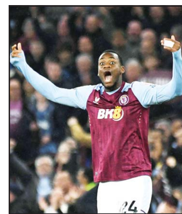
Aston Villa's Jhon Duran celebrates after scoring his side's second goal during the English Premier League soccer match between Aston Villa and Liverpool at the Villa Park stadium in Birmingham, England.

Emery said on Sky Sports. "He was very clinical and today was important for him."