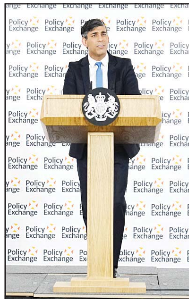
British Prime Minister Rishi Sunak delivers a speech on national security at the Policy Exchange, in London on May 13. Sunak warned of a dangerous future for the UK in a pitch to voters Monday as he fights to hang on to power ahead of a national election that could see Conservatives ousted after 14 years. (AP)

The Danish royal couple arrived in Oslo on their 10th wedding anniversary. Earlier this month, Frederik and Mary made their first state visit to Sweden. (AP)