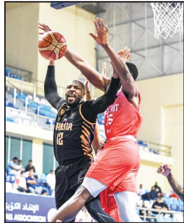
Kuwait Club defender blocks a shot from Al-Qadisiya player.

ties. This is achieved through a multifaceted approach, encompassing sports, healthcare, and social programs for athletes, as well as training and awareness initiatives for their families. Additionally, the Special Olympics offers training programs catering to coaches, medical professionals, and volunteers, thereby contributing to the holistic development and well-being of individuals with disabilities.