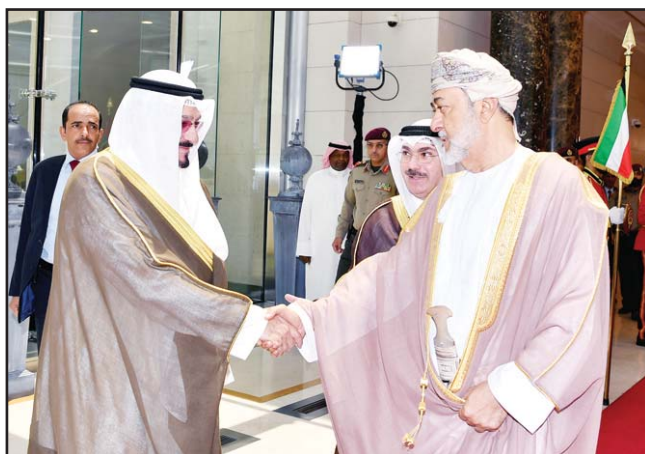
Kuwait's Prime Minister Sheikh Ahmad Al-Abdullah Al-Sabah shakes hands with Sultan of Oman Haitham bin Tariq as he concludes his two-day state visit to Kuwait.