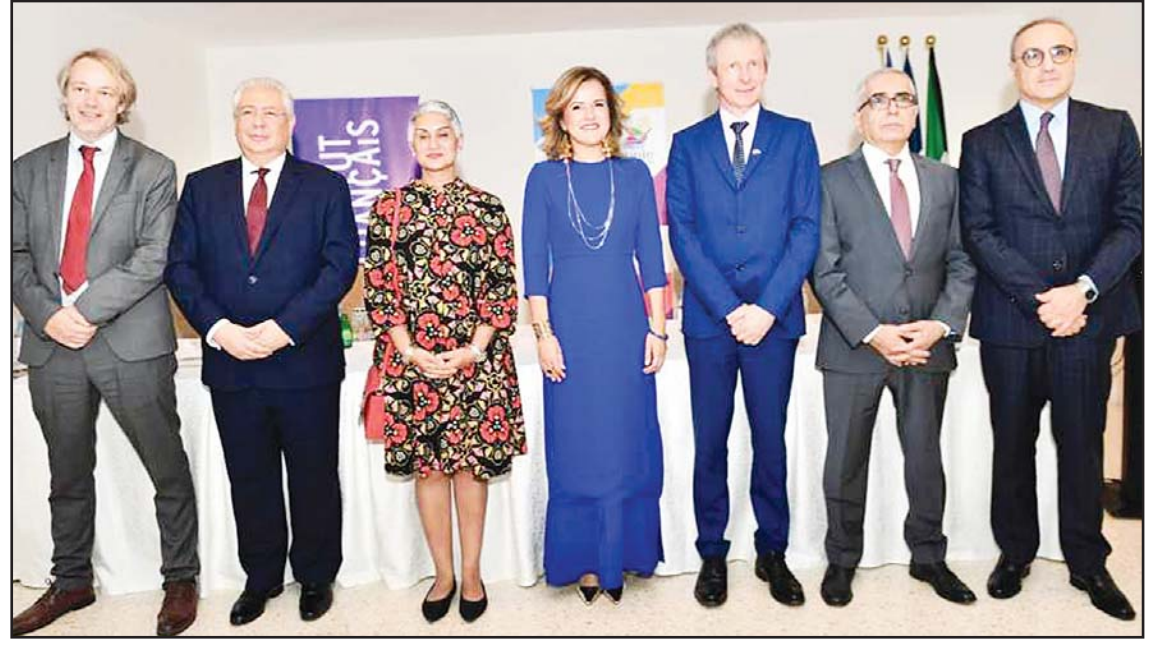
Photo taken during the press conference event.

waitis demonstrating keen interest. Notably, French has become the third most taught language in Kuwait, with around 30,000 students enrolled across public and private schools. Annually, around 10,000 students successfully obtain the French Baccalaureate degree. Some of the objectives of the Council for the Promotion of Francophonie ■ Strengthening the work carried out by the International Organization of Francophonie ■ Introducing Kuwaitis of all ages, especially the younger generations, to the collective face of Francophonie ■ Strengthening French communication networks in Kuwait and facilitating cooperation ■ Organizing French-speaking diwanayahs