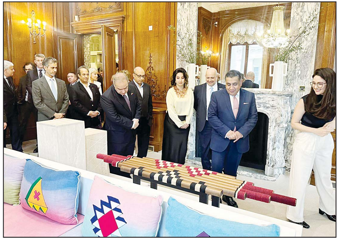
The Kuwaiti Ambassador to the UK and the British Minister of State for the Middle East, North Africa, South Asia, and the UN attended the opening of the Sadu Society exhibition at the London Embassy.