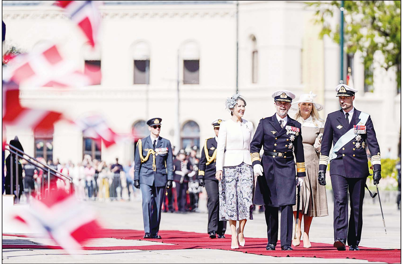
King Frederik and Queen Mary of Denmark are welcomed by Norway's King Harald, Queen Sonja, Crown Prince Haakon and Crown Princess Mette-Marit at Honnørbrygga upon their arrival in Oslo on May 14.

He said 11 miners were immediately brought to the surface with various injuries. Nine of them remain hospitalized.