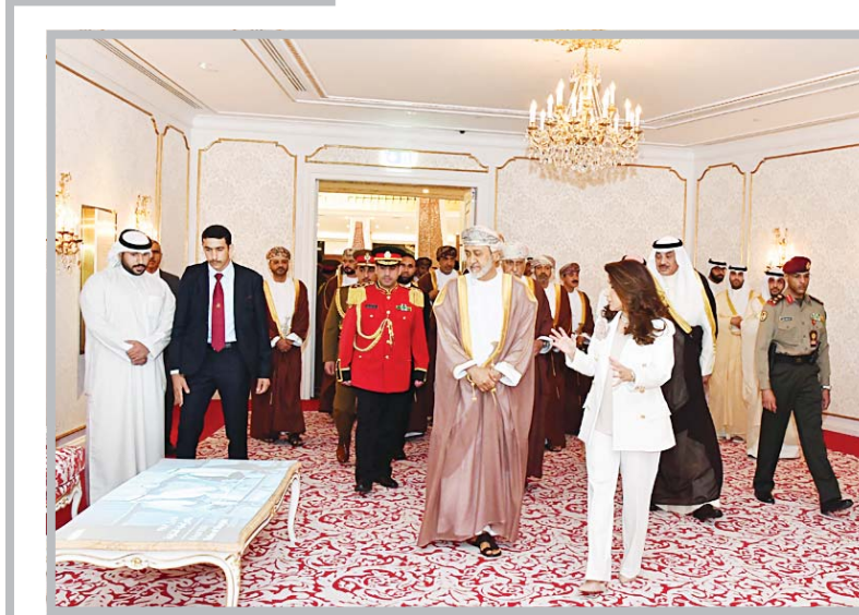
The Sultan of Oman in the Al-Salam Palace.