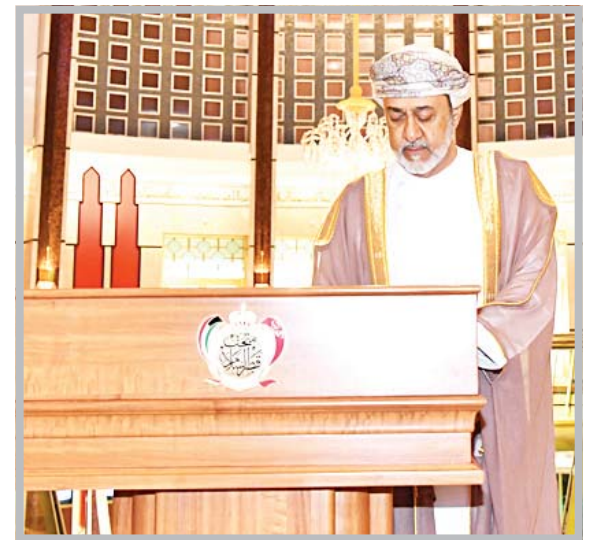
The Sultan of Oman presenting his views after the end of the trip to Al-Salam Palace.