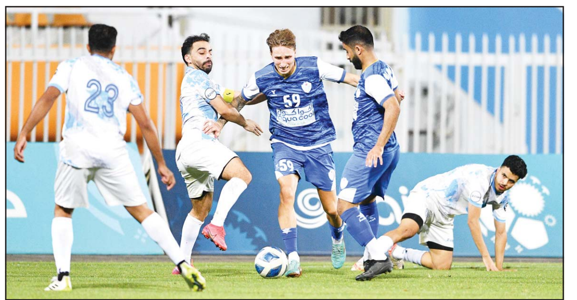
Players fight for the ball during the Zain Premier League game.