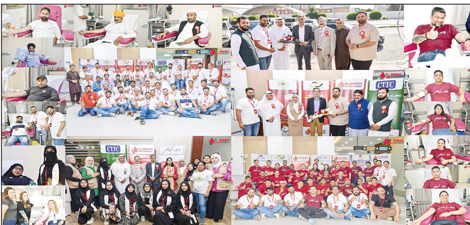
A collage of photos from the event.