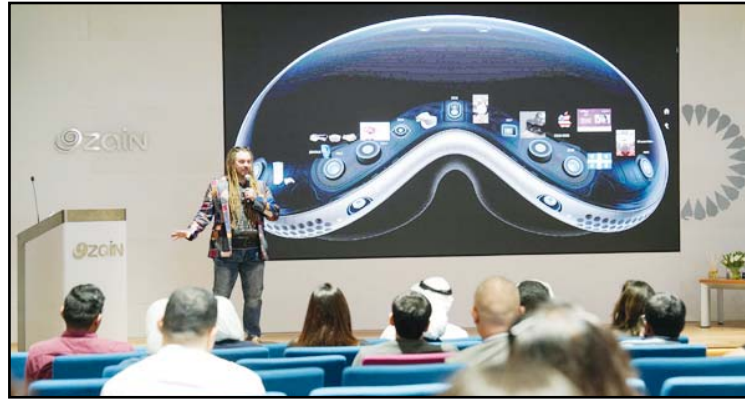
From the special talk at Zain's headquarters.