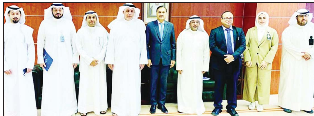
Ambassador poses for a photo with PAM officials.

hood Affairs, and Minister of State for Youth Affairs, has emphasized her commitment to prioritizing family welfare, women's and children's rights, and youth empowerment in the upcoming period.