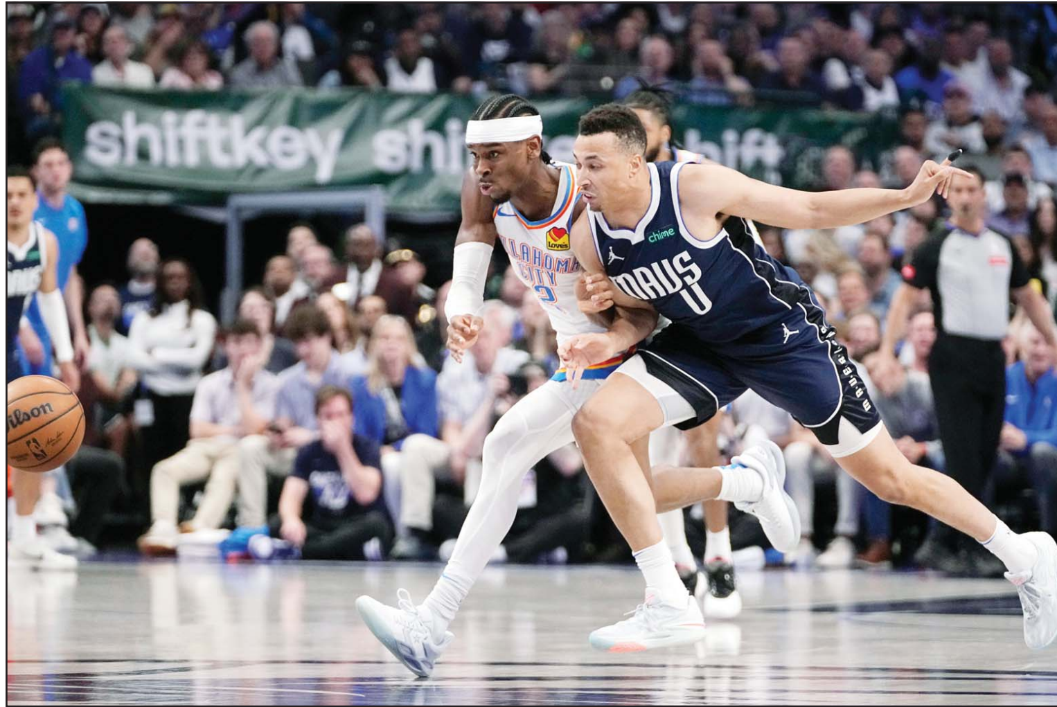
Oklahoma City Thunder's Shai Gilgeous-Alexander (2) and Dallas Mavericks' Dante Exum (0) chase after the ball in the first half in Game 4 of an NBA basketball second-round playoff series in Dallas.