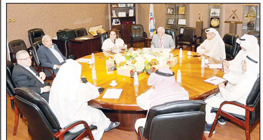
Al-Sayer during a meeting with Al-Khatib and Al-Mamouri.