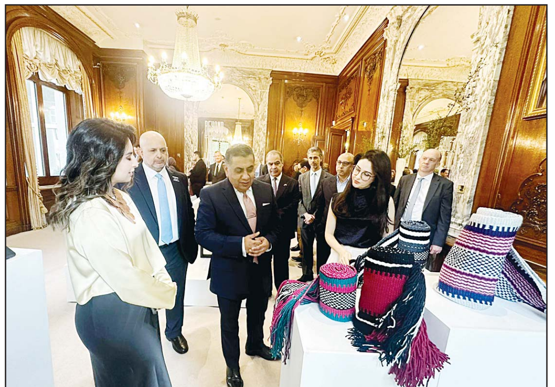
Ambassador Ahmad Al-Awadhi and Lord Tariq Ahmad attend the opening of the Sadu Society exhibition in London.