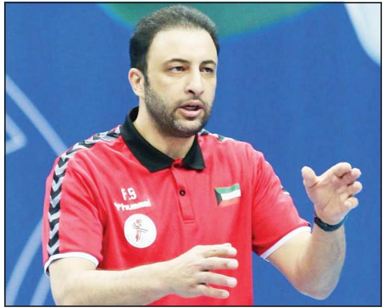
Former Kuwait handball player Faisal Siwan.