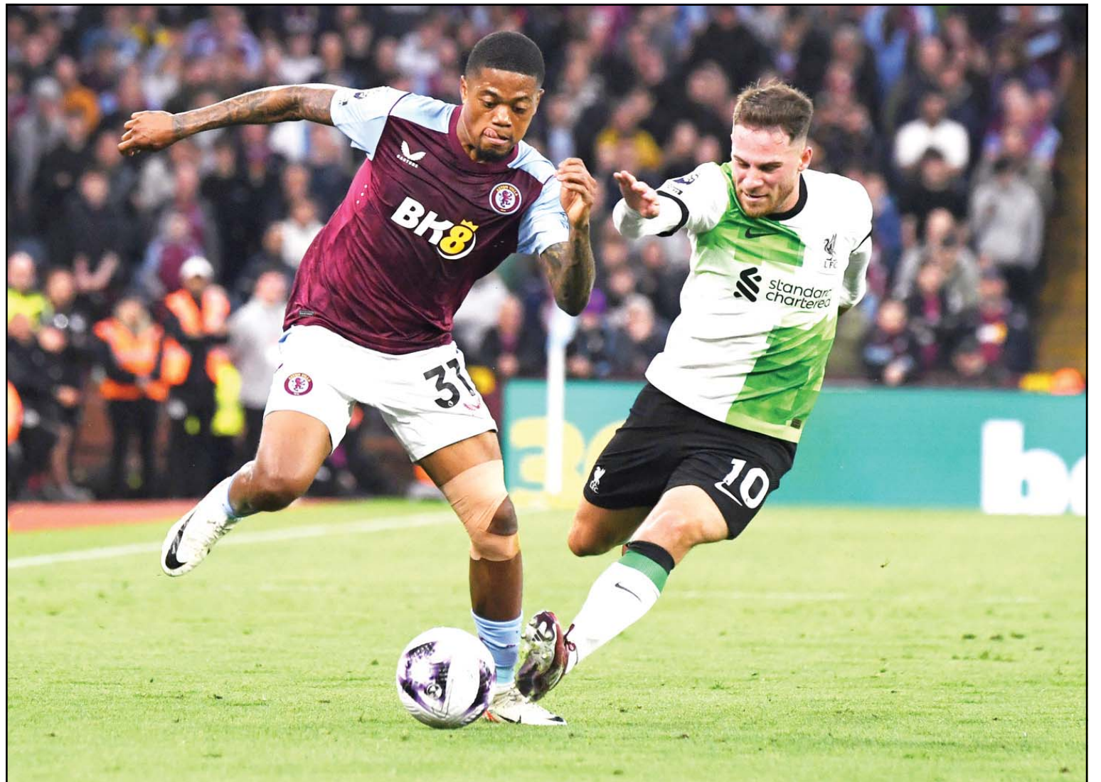
Aston Villa's Leon Bailey (left), challenges for the ball with Liverpool's Alexis Mac Allister during the English Premier League soccer match between Aston Villa and Liverpool at the Villa Park stadium in Birmingham, England.

"I'll see you at Old Trafford to say goodbye for the last game at home this season and it's going to be very emotional day for me, for sure."