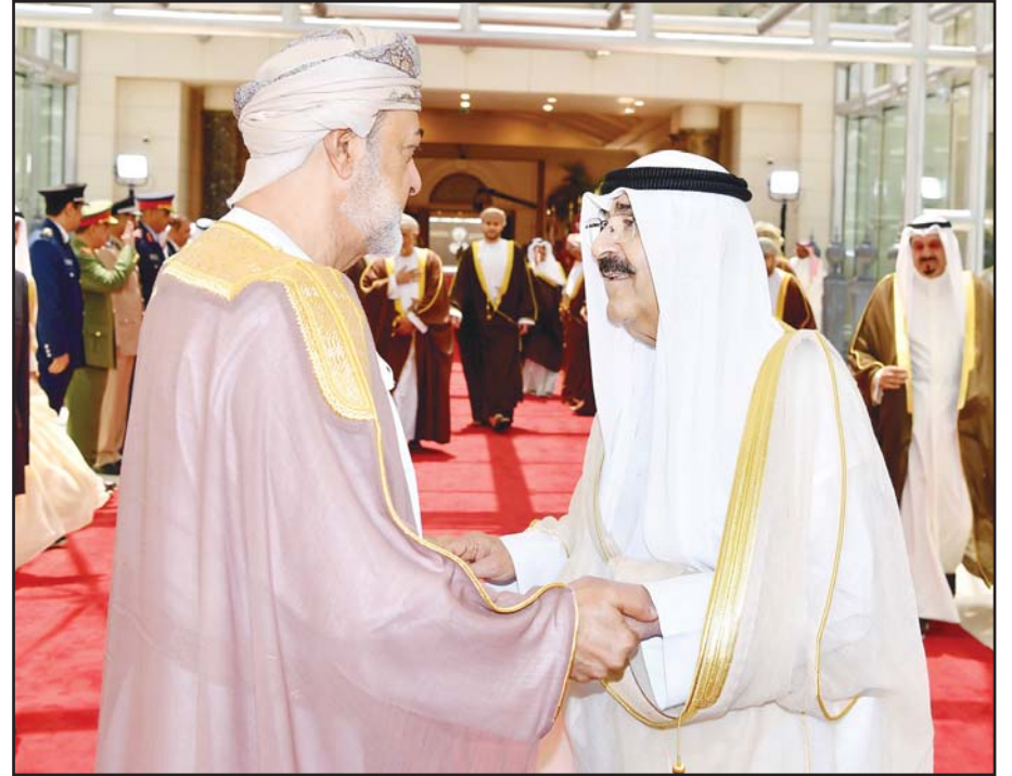
Sultan of Oman Haitham bin Tariq seen off by His Highness the Amir Sheikh Mishal Al-Ahmad Al-Jaber Al-Sabah as he departs Kuwait on Tuesday.