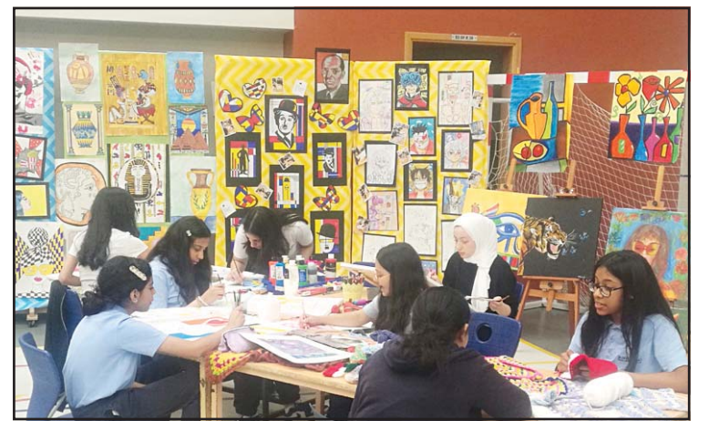
Some of the students at the exhibition.