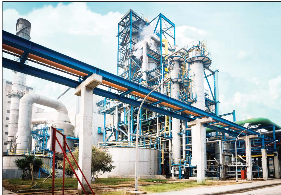
Alexandria Fertilizers Company

Founded in 1997, Egypt Kuwait Holding Company is listed on both the Kuwait and Egyptian stock markets. Over the past decades, it has emerged as one of the largest, leading, and fastest-growing investment companies in the Middle East. Its diverse portfolio spans five major sectors: fertilizers, petrochemicals, gas upstream and distribution, power production and distribution, insurance and non-bank financial services. The Egypt Kuwait Holding Company is aiming to continue achieving high return on investment rates for its investors based on a strong investment portfolio and a competent management team