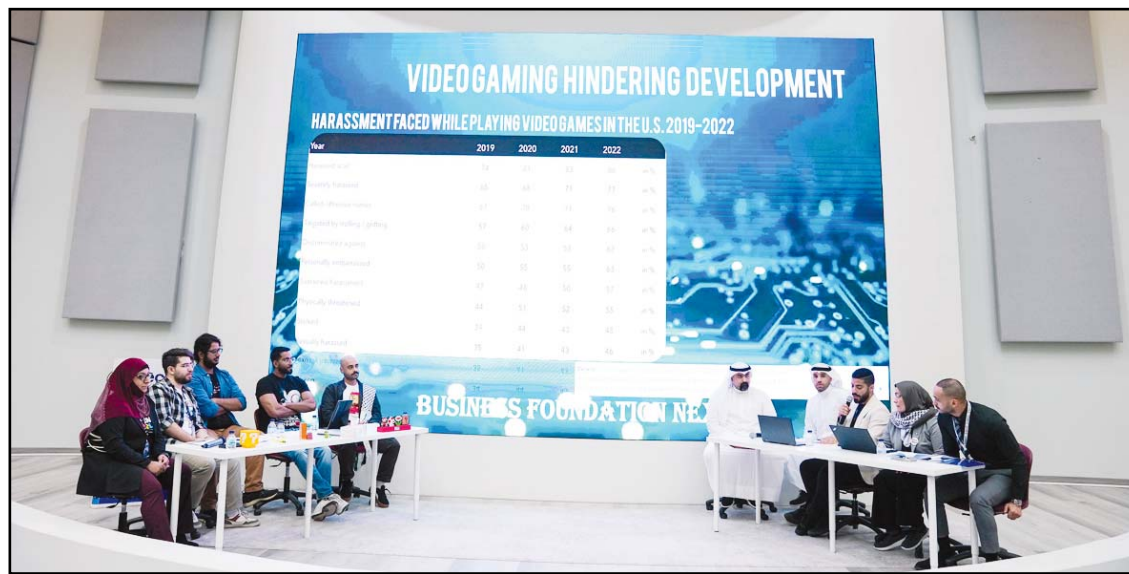
A photo from the debate organized by ktech.

"We aim to demonstrate how the public can directly benefit from the latest technological advancements, which emerge on a weekly, if not daily, basis. Ultimately, our focus remains on advancing patient diagnosis and shaping the future of healthcare," Kouly added.