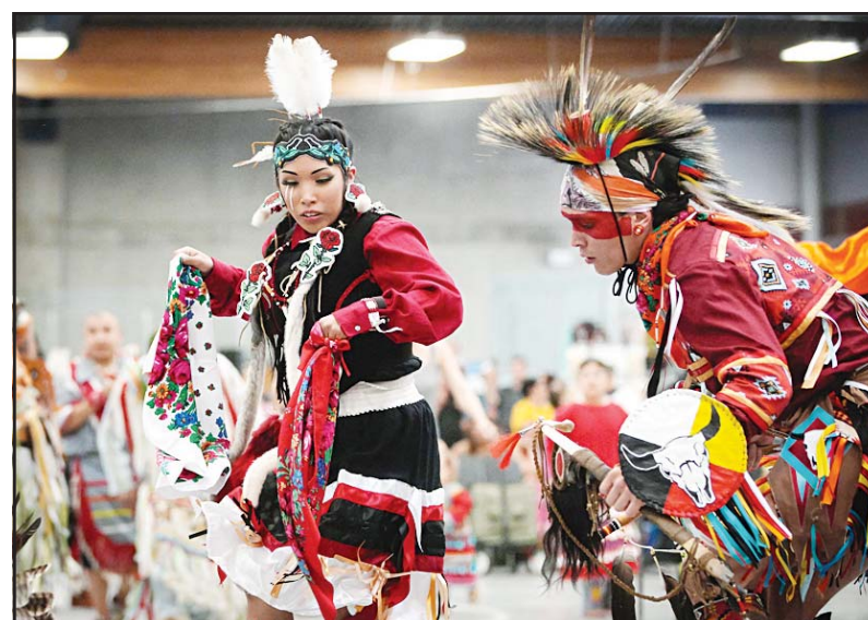
Dancers perform during the Mother's Day Traditional Powwow in Vancouver, British Columbia, Canada, on May 12. Hundreds of indigenous people from various tribes across Canada gathered on Sunday to celebrate Mother's Day with a powwow, a traditional social gathering featuring music and dance.