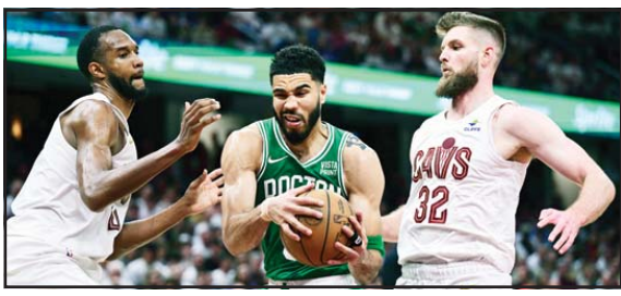
Boston Celtics forward Jayson Tatum (center), drives against Cleveland Cavaliers forwards Dean Wade (32) and Evan Mobley (left), during the second half of Game 4 of an NBA basketball second-round playoff series in Cleveland.