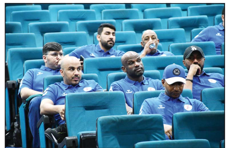
The participants of the coaching course.