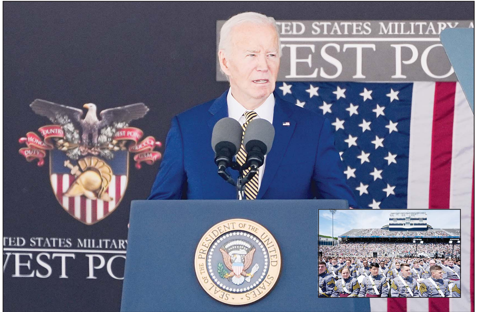
US President Joe Biden speaks during the graduation ceremony of the US Military Academy class of 2024 at Michie Stadium on May 25 in West Point, NY. Inset: Graduates attend the US Military Academy commencement ceremony.