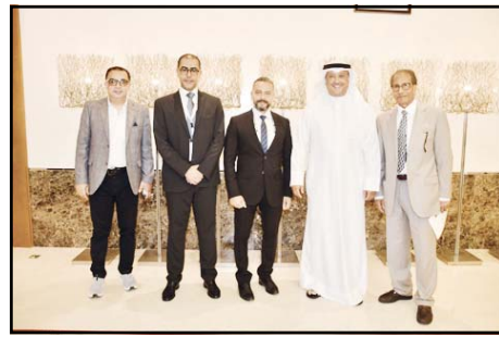
A group photo of the attendees.