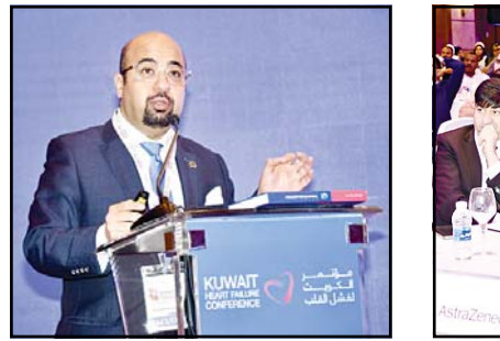
One of the key speakers at the conference.