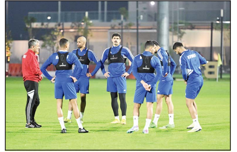
Kuwaiti players train under the supervision of the head coach.