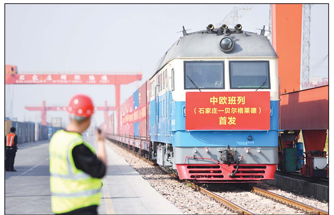
This photo taken on March 21, 2024, shows a China-Europe freight train bound for Belgrade, the capital of Serbia, departs from the Shijiazhuang international land port in north China's Hebei Province.