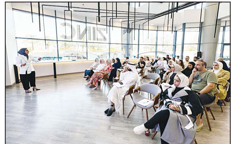
This session is part of Zain's ongoing workshops to foster creativity.

ceived by content creators, SME owners, and creative individuals, offering a mix of theoretical and practical approaches to enhance attendees' skills and produce valuable outcomes.