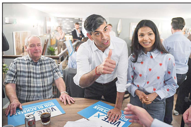
British Prime Minister Rishi Sunak and his wife Akshata Murty attend a Conservative general election campaign event in Stanmore, London, Britain on May 26. Sunak pledged to bring back a form of national service for the first time in more than 60 years, seeking to energize his election campaign after a faltering start.

Police fatally shoot man: Police officers in Baltimore fatally shot a man who pulled a gun while they questioned him in a different shooting, authorities said.