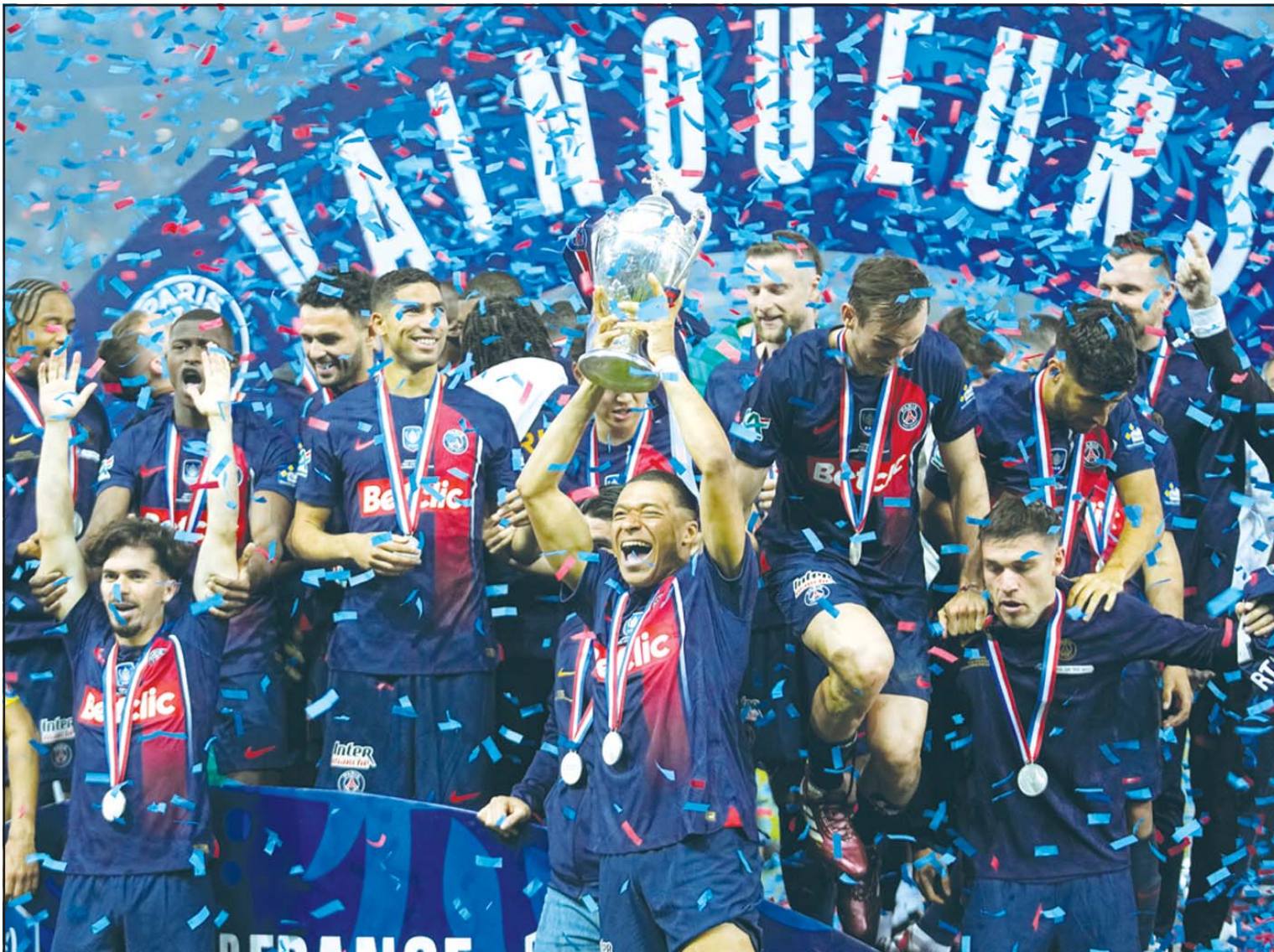
PSG's Kylian Mbappe raises the trophy during the presentation ceremony after the French Cup final soccer match between Lyon and PSG at the Pierre Mauroy stadium in Villeneuve d'Ascq, northern France. PSG won the match 2-1. — See Page 15

Additionally, in the third round of the league, Al-Sahel will face Al-Tadamon at 5:00 pm, followed by a match between Al-Sulaibikhat and Khaitan at 6:30 pm.