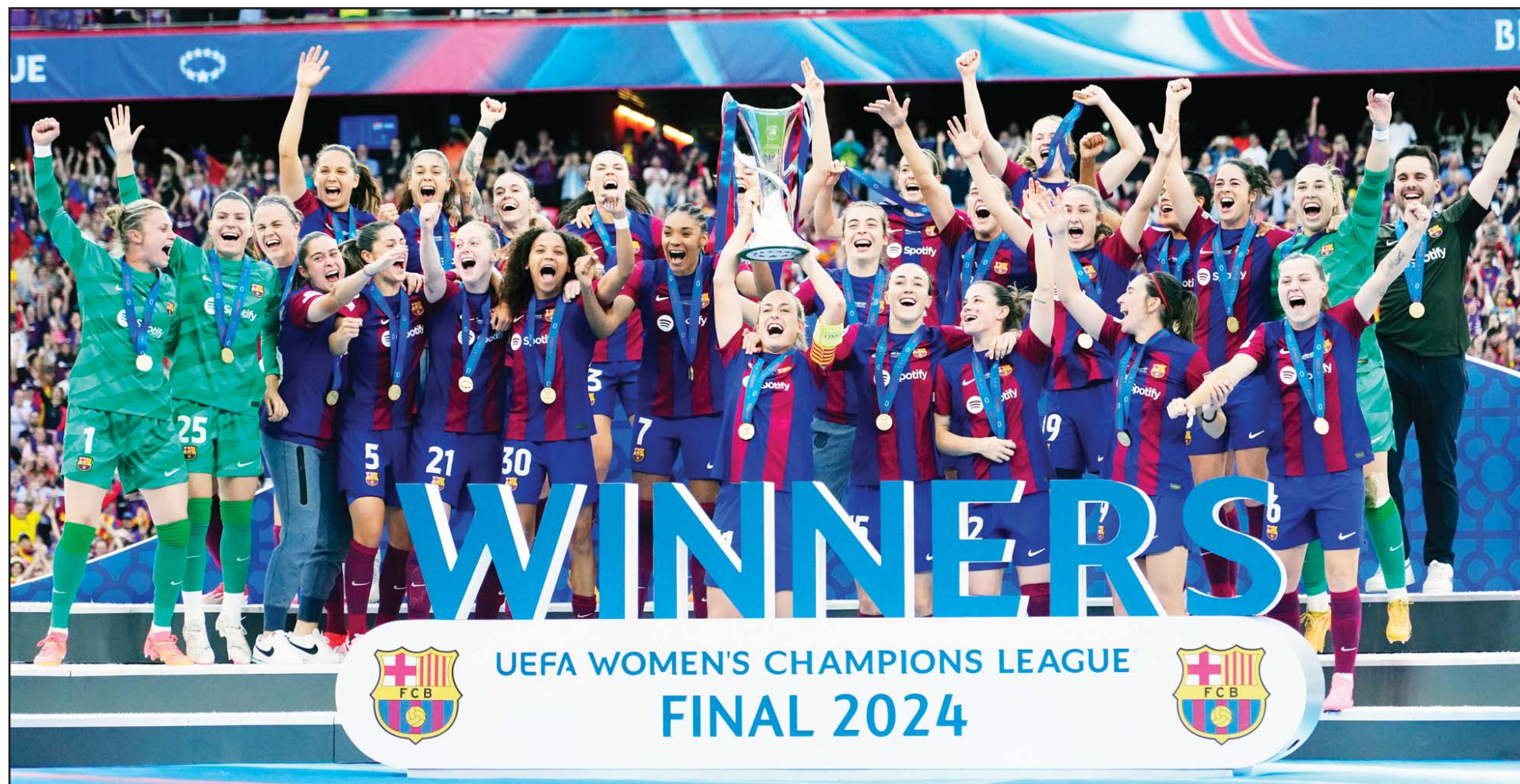
Barcelona's team captain Alexia Putellas lifts the trophy after winning the women's Champions League final soccer match between FC Barcelona and Olympique Lyonnais at the San Mames stadium in Bilbao, Spain.

VILLENEUVE D'ASCQ, France, May 26, Paris Saint-Germain beat Lyon 2-1 in the French Cup final and completed the domestic double in Kylian Mbappé's last game for the club.