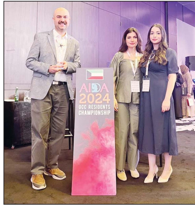
The Kuwaiti delegation participated in the Abu Dhabi Dermatology and Cosmetic Medicine Conference.

He said he returned home as soon as he could - after giving a large bottle of treated water he had brought with him to an elderly woman.