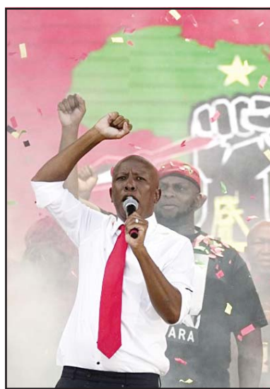
Economic Freedom Fighters (EFF), leader Julius Malekore, speaks at a final election rally in Polokwane, South Africa on May 25. South Africa's four main political parties began the final weekend of campaigning on Saturday before a possibly pivotal election that could bring the country's most important change in three decades. South Africans will vote in the 2024 general elections May 29.

The base where the police will operate from is about 70% done and there is need for secure stores for the armory, according to the senior official, who was in the advance team.