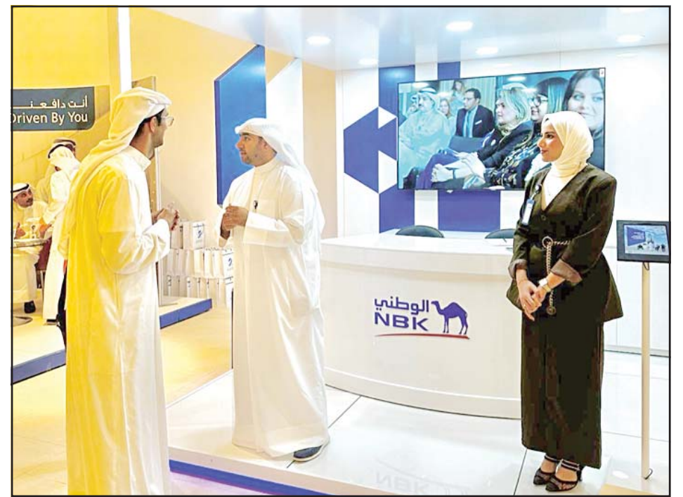
Photos during the event.

commitment," he added. "NBK believes in the potential of every individual in our society, and the need to provide them with due support for learning and development. Reflecting this belief, we have a policy for recruiting certain categories of special needs people, in cooperation with the Public Authority for Disabled Affairs (PADA) and the Public Authority for Manpower (PAM)," he noted.