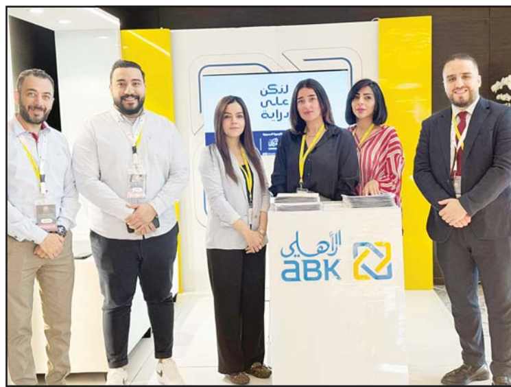
Bank employees during the event.