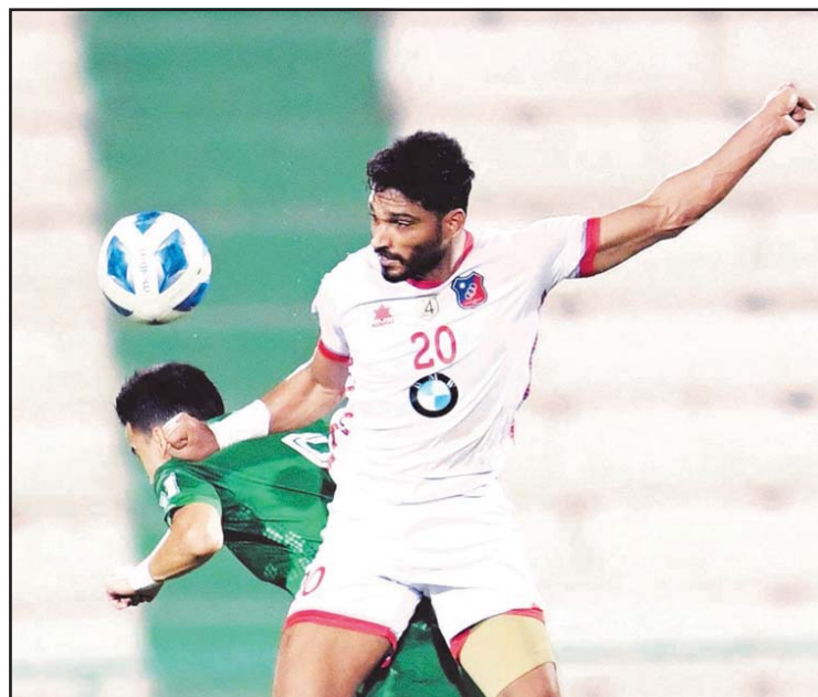
Players challenge for the ball in this file photo.

Also on Sunday, world No. 1 and top seed Viktor Axelsen of Denmark outclassed home favorite Lee Zii Jia to claim the men's singles title.