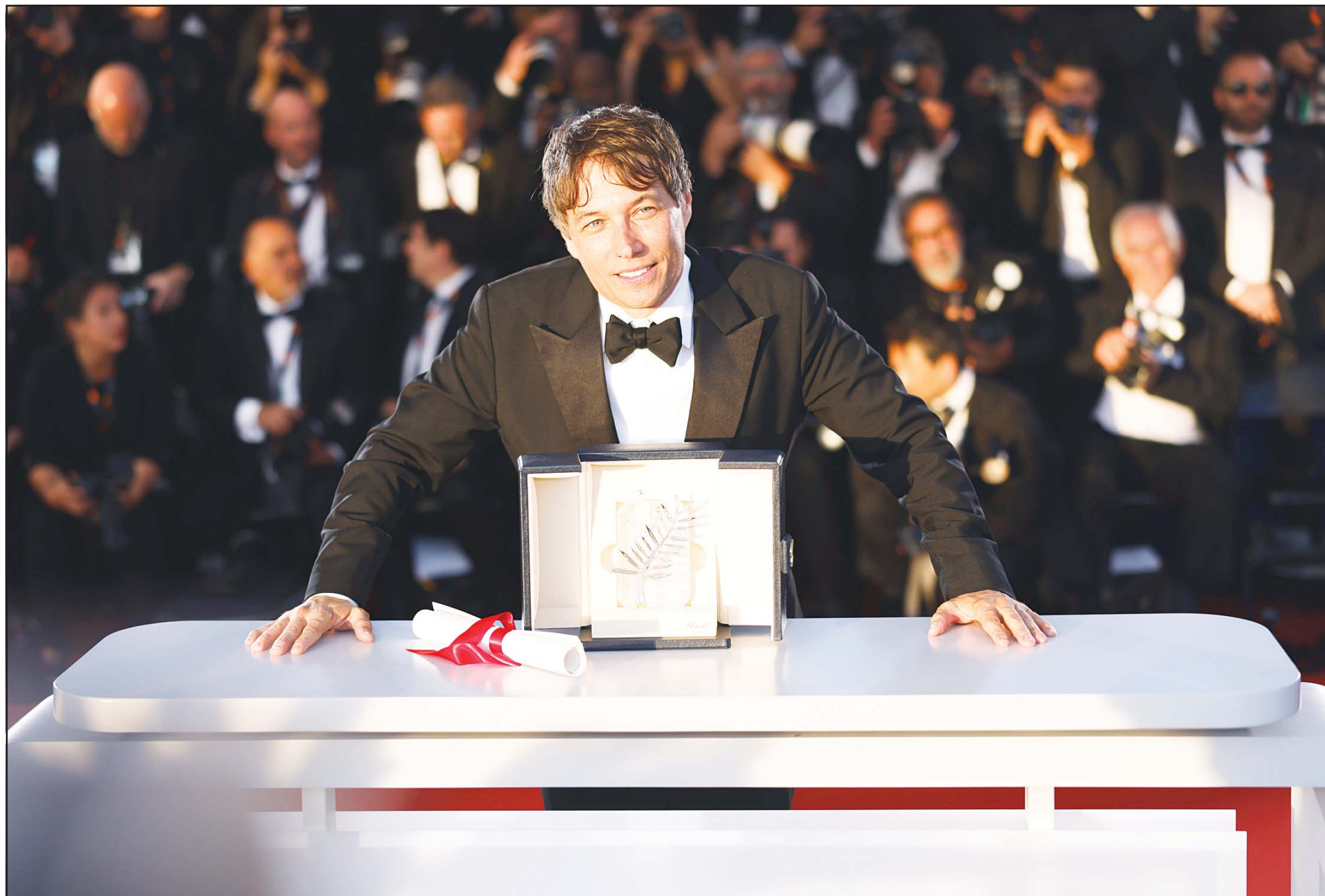
Sean Baker, winner of the Palme d'Or for the film 'Anora,' poses for photographers during the photo call following the awards ceremony at the 77th international film festival, Cannes, southern France, Saturday, May 25.