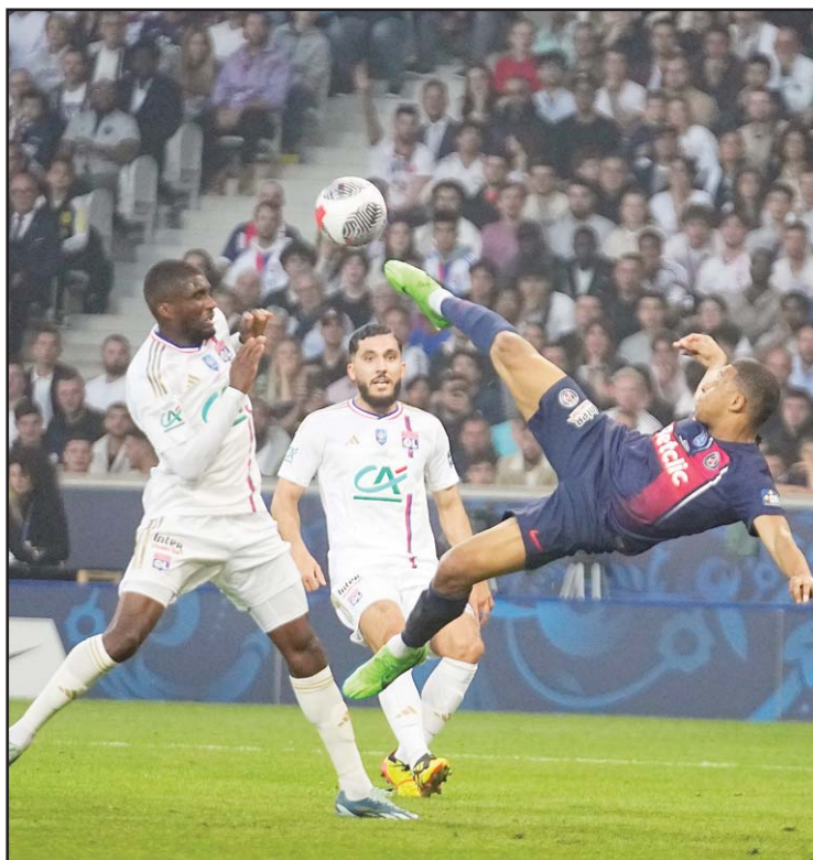
PSG's Kylian Mbappé attempts an overhead kick during the French Cup final soccer match between Lyon and PSG at the Pierre Mauroy stadium in Villeneuve d'Ascq, northern France.

Al-Shalahi expressed his gratitude to Ambassador Al-Neyadi for the warm reception, emphasizing that such meetings strengthen sports relations and pave the way for future cooperation among the Gulf Cooperation Council countries.