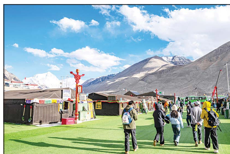
Tourists walk in a base camp of Mount Qomolangma in southwest China's Xizang Autonomous Region on May 24. The Mount Qomolangma National Park has entered peak tourism season. From Jan 1 to May 20 this year, the Mount Qomolangma scenic spot has received about 136,000 tourists.