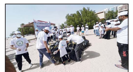
Photos during the event.