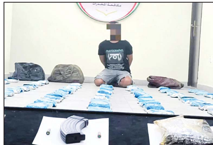
Suspect and the drugs seized by the security authorities.

Citizen dies from fall: A Kuwaiti citizen in his twenties died after falling from the top of his house in one of the areas of Jahra Governorate.