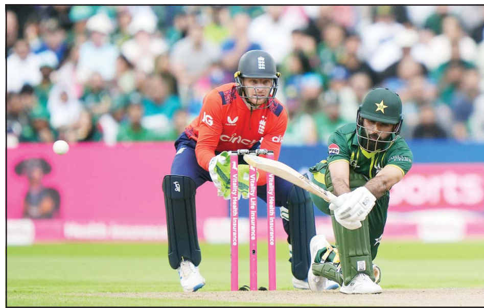
Pakistan's Fakhar Zaman hits out past England wicket keeper Jos Buttler, during the second T20 match at Edgbaston, Birmingham, England.

A reverse sweep for another maximum proved the catalyst for Shadab's final over to go for 20 runs, but the host's momentum was checked when Jonny Bairstow's dismissal on 144-2 sparked a collapse.