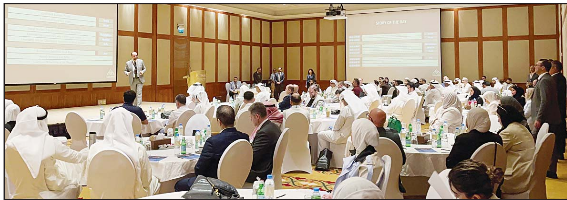
Photo during the event