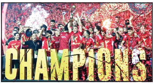
Al-Ain players celebrate on the podium after winning the Asian Champions League title.