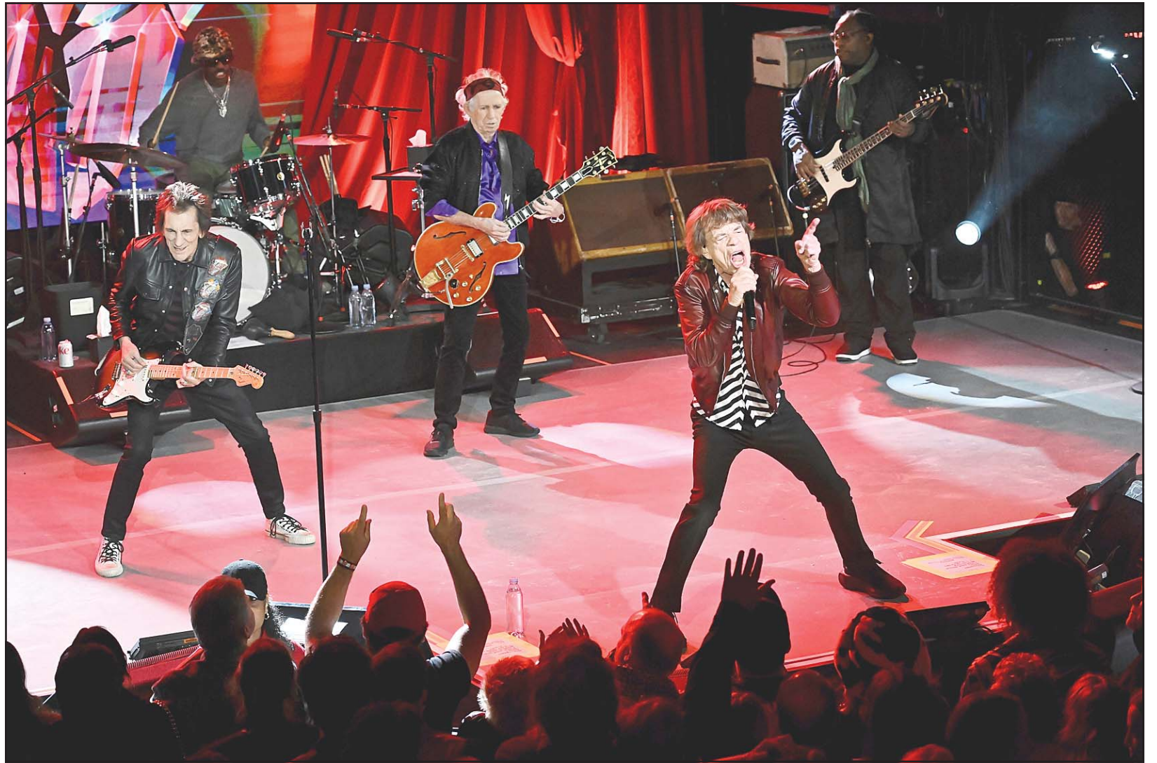
The Rolling Stones perform at a celebration for the release of their new album, 'Hackney Diamonds,' Oct. 19, 2023, in New York. The Rolling Stones has announced that they would close out their North American Hackney Diamonds tour by playing at Thunder Ridge Nature Arena in Ridgedale, Mo.

"Everybody asks me about this album, like 'How you feeling?' I say I feel really happy and I'm at peace. And this is the most free I've ever felt," she said. "I'm not putting pressure on myself to be defined as success through other people's measurements of what that looks like."