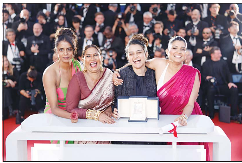
Payal Kapadia, (second from right), winner of the grand prize for 'All We Imagine As Light,' poses with Kani Kusruti, (from left), Chhaya Kadam, and Divya Prabha during the photo call following the awards ceremony at the 77th international film festival, Cannes, southern France, Saturday, May 25.

Antoni Gaudi's architectural masterpiece. Nicolas Ghesquiere's ambitions for the Parisian house's 2025 Cruise collection were unveiled before an A-list crowd, in-