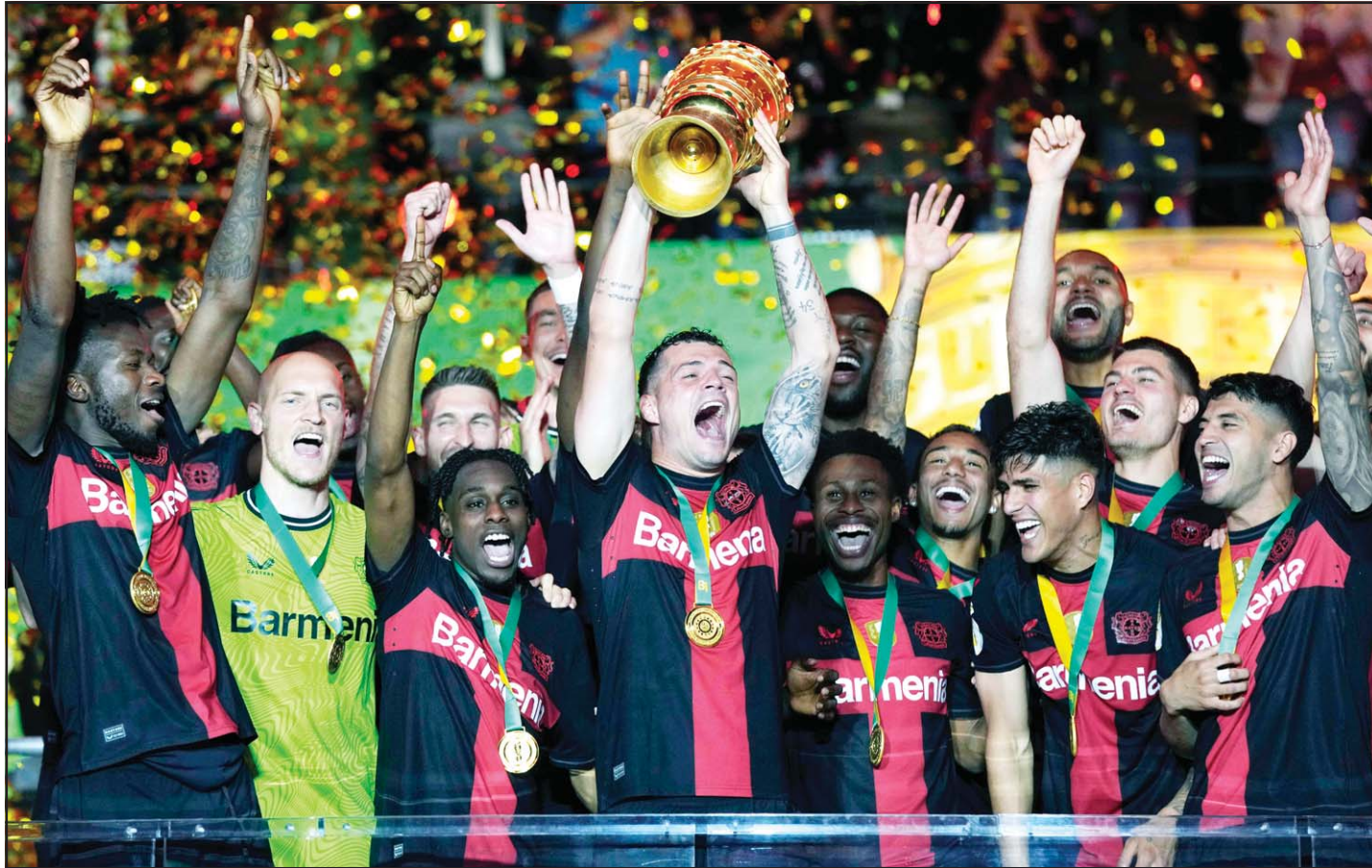
Leverkusen's Granit Xhaka lifts the trophy after the German Soccer Cup final match between 1. FC Kaiserslautern and Bayer Leverkusen at the Olympic Stadium in Berlin, Germany. (AP)

BERLIN, May 26, (AP) — Granit Xhaka's early strike was enough for Bayer Leverkusen to win the German Cup final 1-0 over Kaiserslautern for an unbeaten domestic double.