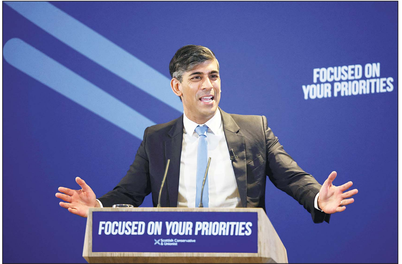
British Prime Minister Rishi Sunak speaks during a Conservative general election campaign event, in Edinburgh, Scotland on June 24. Sunak has portrayed himself as thorough and evidence-led throughout his relatively brief political career, but there's always been a nagging question over the keenness of his political antenna.

Police, and more rarely other symbols of authority, are frequently targeted by Greek far-left militants, although attacks leading to death or severe injury have declined in recent years.