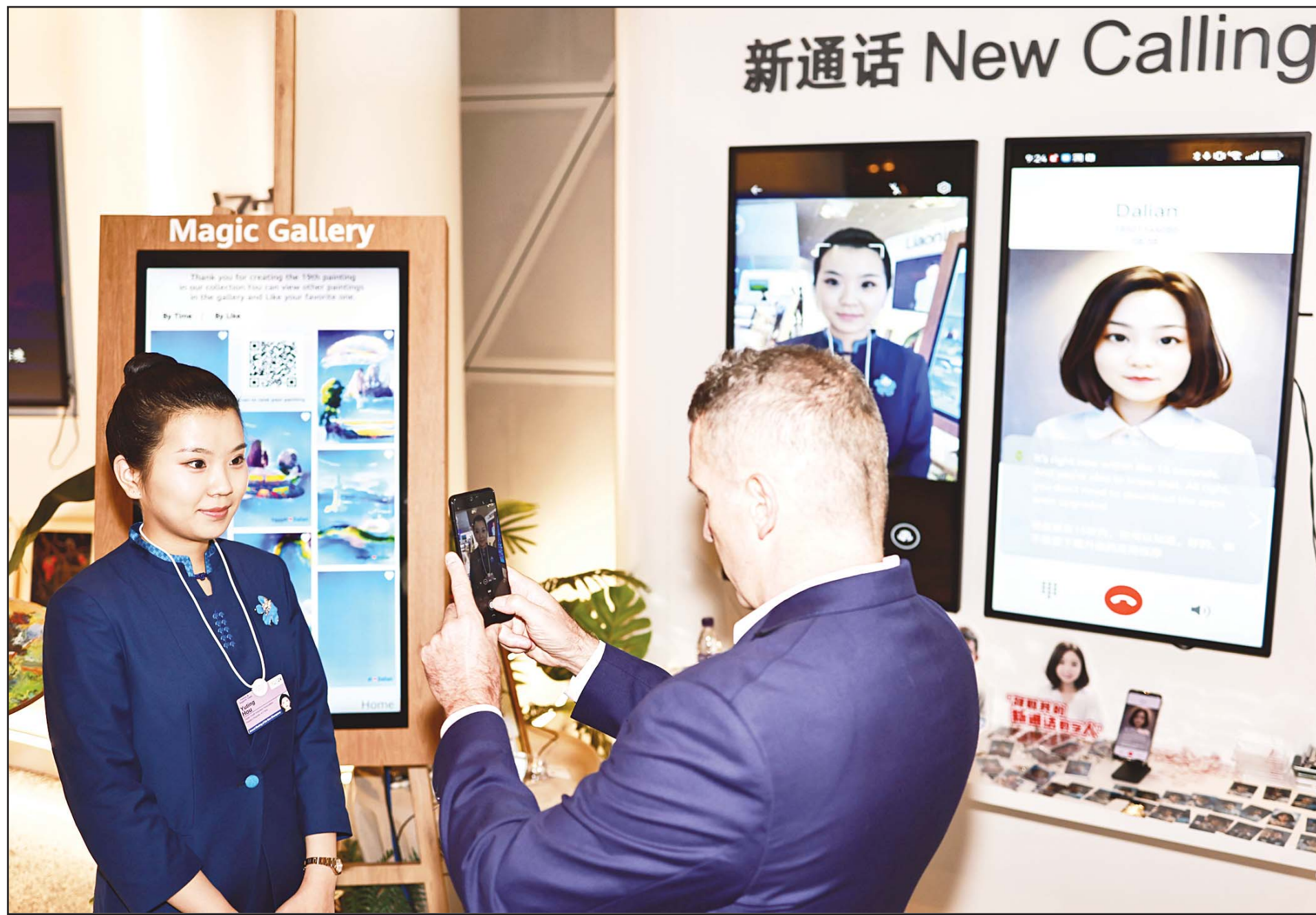
Participants try AI digital image in the exhibition area of 5G 'New Calling' in Dalian, northeast China's Liaoning Province, June 27, 2024. The 15th Annual Meeting of the New Champions, also known as the Summer Davos, concluded in northeast China's coastal city of Dalian on Thursday.

‘The technology advancements in many countries including China are open-sourced, with a spillover effect benefiting other developers globally.’