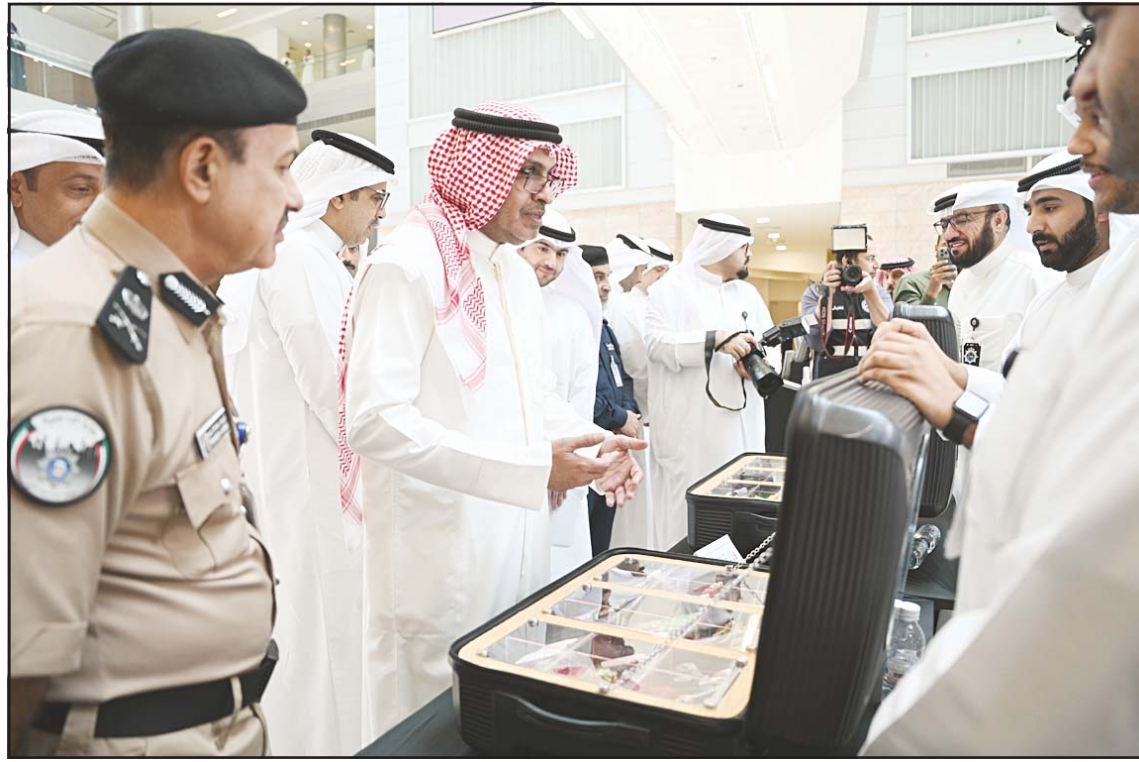
Top security officials taking a tour of the awareness exhibition.

— Compiled by PFX Fernandes & Mahmoud Ateyieh