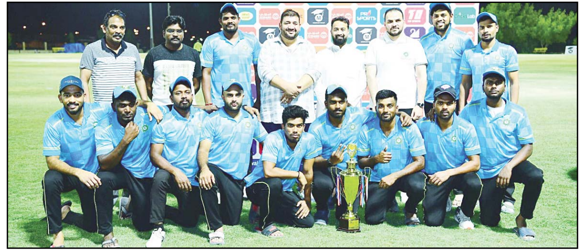
Runners up Al Mulla Exchange.