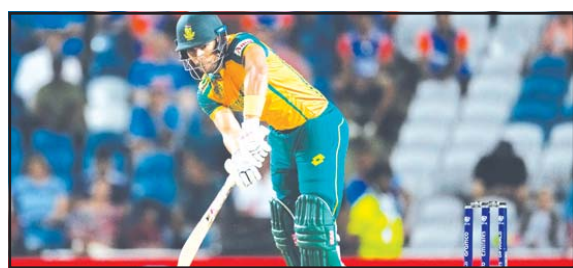
South Africa's Reeza Hendricks bats during the men's T20 World Cup semifinal cricket match between Afghanistan and South Africa at the Brian Lara Cricket Academy in Tarouba, Trinidad and Tobago.