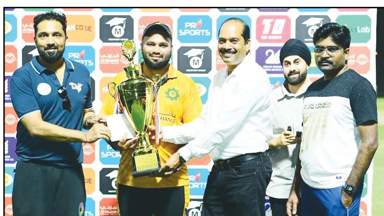
Al Mulla captain receives the runners up trophy.