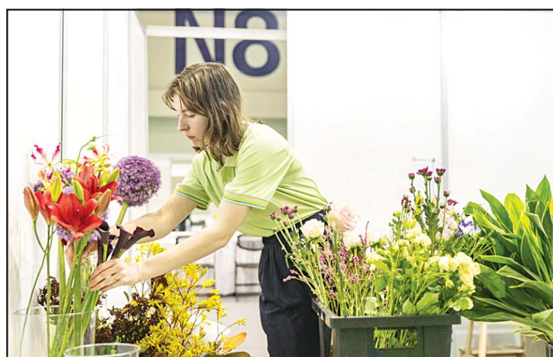
A contestant is pictured during a contest of the second Belt and Road International Skills Competition in southwest China's Chongqing Municipality on June 24. The second Belt and Road International Skills Competition kicked off at Chongqing International Expo Center on Monday, attracting participants from 61 countries and regions.

The head of the International Committee of the Red Cross, known as the ICRC, said "all indicators are going through the roof" since Oct 1 when fighting resumed between Congolese government forces with their allies, and the M23 rebel group.