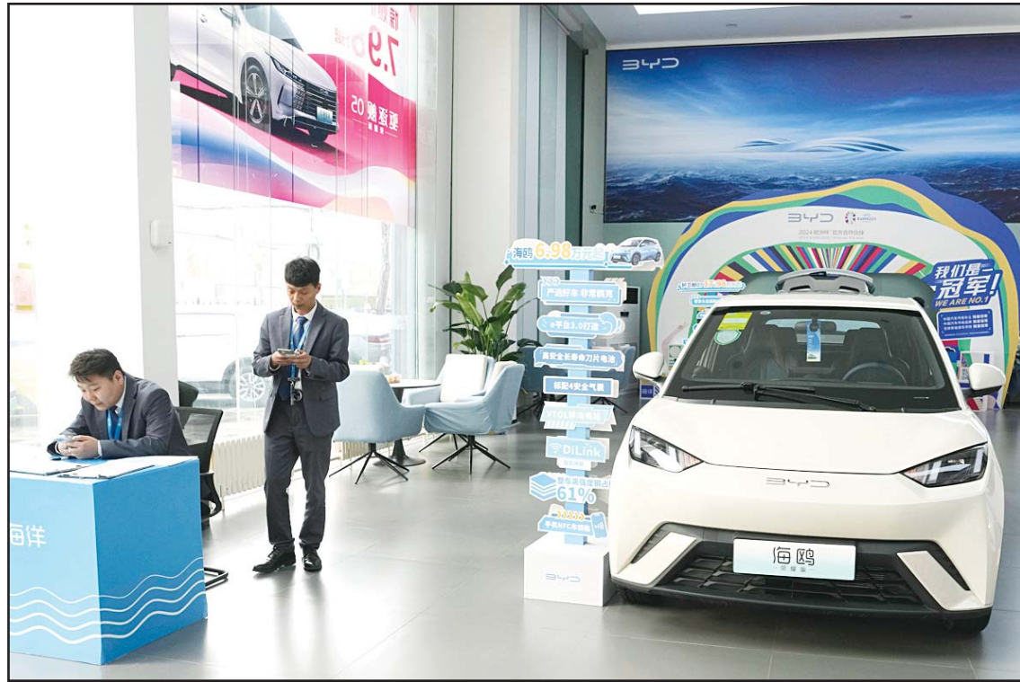
Sales staff stand near the Seagull electric vehicle from Chinese automaker BYD at a showroom in Beijing on April 10, 2024. Considered a marvel of engineering efficiency, its lightweight design allows the Seagull to go farther per charge on a smaller battery.