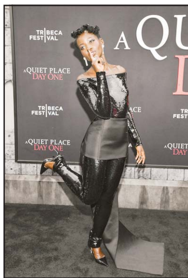
Lupita Nyong'o attends the Paramount Pictures premiere of 'A Quiet Place: Day One' at AMC Lincoln Square on Wednesday, June 26, in New York.

Chanel's latest invitation, a pair of opera glasses, hinted at the show's theme inside Paris' opera house. Staying true to its classic roots, Dior sent out beautifully penned cards by an age-old calligrapher, evoking the maison's timeless elegance. Schiaparelli's giant gold key invitation reflected the surreal legacy of founder Elsa Schiaparelli, promising an avant-garde showcase.