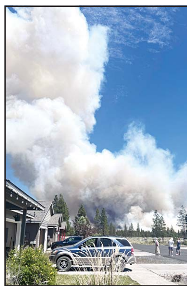
smoke rises from a wildfire on June 25 in La Pine, Ore. The wildfire near the popular vacation destination of Bend, is growing rapidly. Officials on June 27 urged the continued evacuations of hundreds of homes in the area best known for its microbreweries, hiking, river rafting and skiing on nearby Mount Bachelor.

But that road to victory in Tuesday's primary wasn't so clear. The roll of the dice to hop districts was made more dicey by an embarrassing moment when the congresswoman was caught on tape vaping and causing a disturbance with a date at a musical production of "Beetlejuice." Boebert was also beset along her journey by accusations of carpetbagging from fellow Republicans.