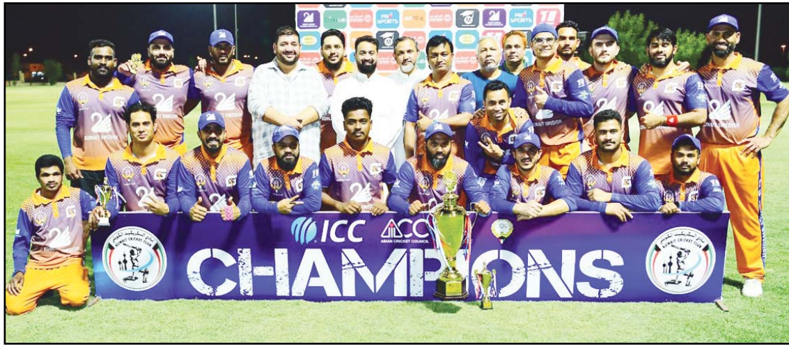
KCC T20 Elite champions Kuwait Swedish.