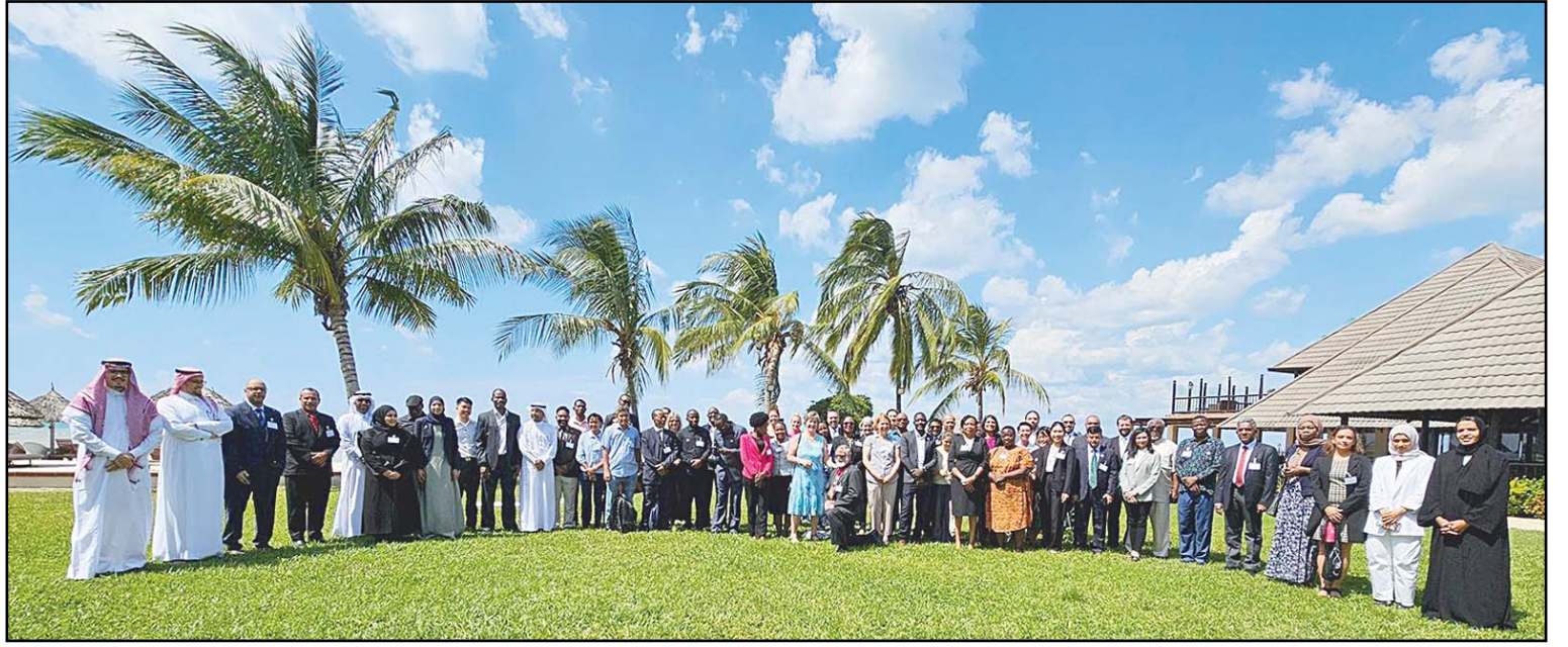
Kuwait participated in the ninth meeting of the MOS9 countries, hosted by the City of Peace in the United Republic of Tanzania, alongside an elite group of specialists from various countries around the world.

He also pointed to the implementation of the Environmental Protection Law, which prohibits the hunting of these organisms and the violation of their nesting sites, in addition to Kuwait's commitment to the IOSEA's memorandum of understanding for sea turtles.