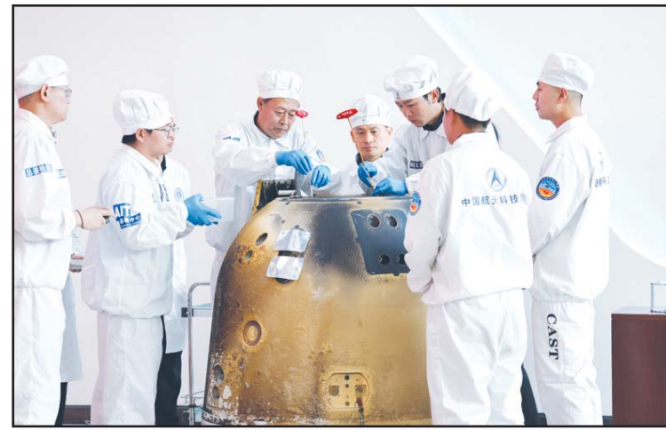
The Chang'e-6 lunar probe returner was opened during a ceremony at the China Academy of Space Technology in Beijing, under the China Aerospace Science and Technology Corporation, on June 26, 2024.

"The lunar soil samples from the moon's near side are fine and loose, while the samples from the far side ap-