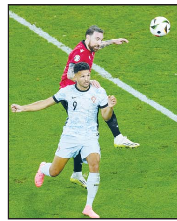
Portugal's Goncalo Ramos challenges for the ball with Georgia's Guram Kashia during a Group F match between Georgia and Portugal at the Euro 2024 soccer tournament in Gelsenkirchen, Germany.

Ukraine grew into the game and chanced its luck with long-range