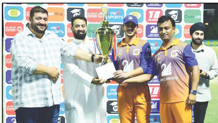
Kuwait Swedish players presented with the championship trophy.