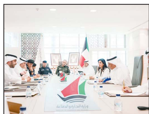
Kuwaiti Minister of Public Works and Minister of State for Municipal Affairs Dr. Noura Al-Mashaan during a meeting on Thursday.

KUWAIT CITY, June 27, (KUNA): Kuwaiti Minister of Public Works and Minister of State for Municipal Affairs Dr. Noura Al-Mashaan stressed Thursday the importance of establishing a distinguished infrastructure to enhance the economic and tourism potential of the country.