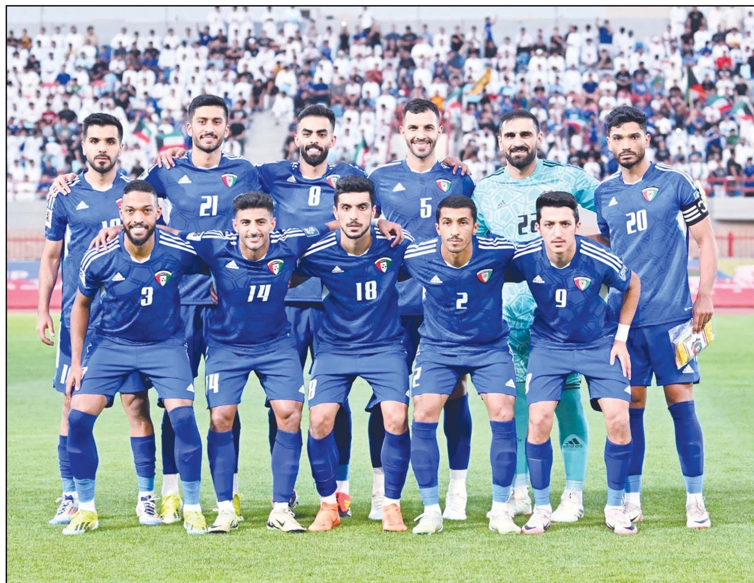
A file photo of Kuwait national team.

Saudi Arabia, Japan and Australia grouped together