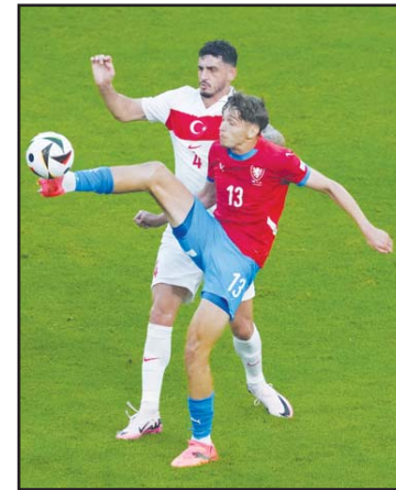
Czech Republic's Mojmir Chytil, (right), challenges for the ball with Turkey's Samet Akaydin during a Group F match between Czech Republic and Turkey at the Euro 2024 soccer tournament in Hamburg, Germany.

efforts as Roman Yaremchuk and Artem Dovbyk tested custodian Koen Castels.