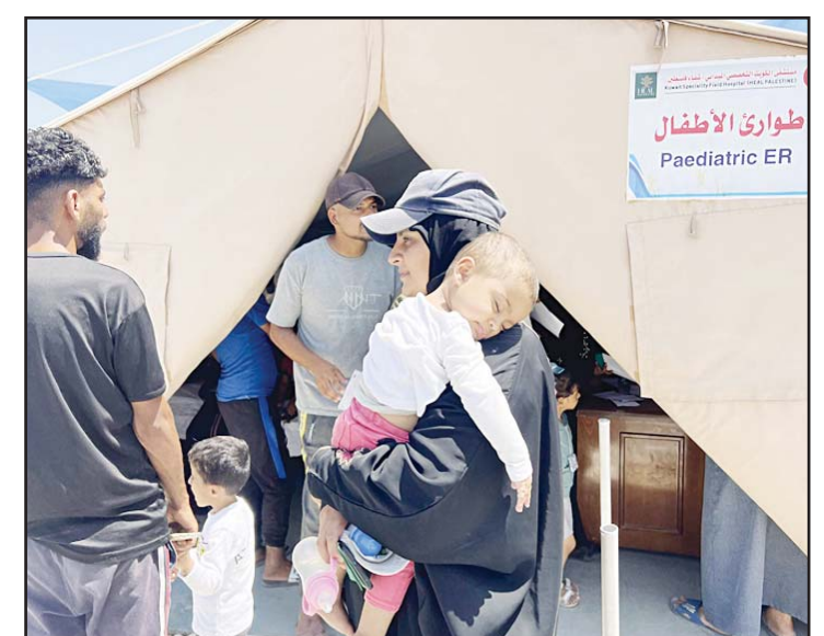
Kuwait Field Hospital in Al-Mawasi, west of Khan Younis, receiving patients.