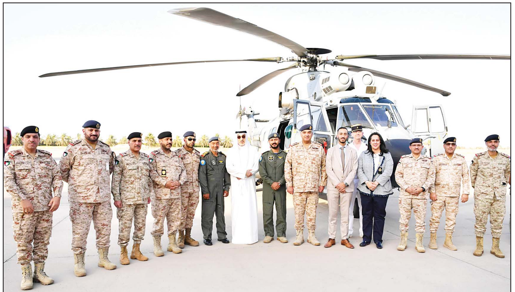
Minister of Defense Sheikh Fahad Yousuf Saud Al-Sabah with the Chief of General Staff of the Kuwaiti Army, senior army commanders and the French military attaché.