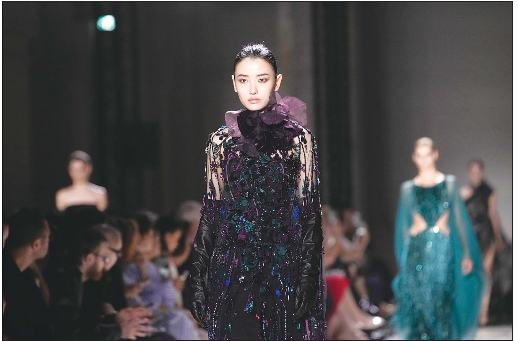
Models wear creations for the Elie Saab Haute Couture Fall-Winter 2024-2025 collection presented Wednesday, June 26, in Paris.