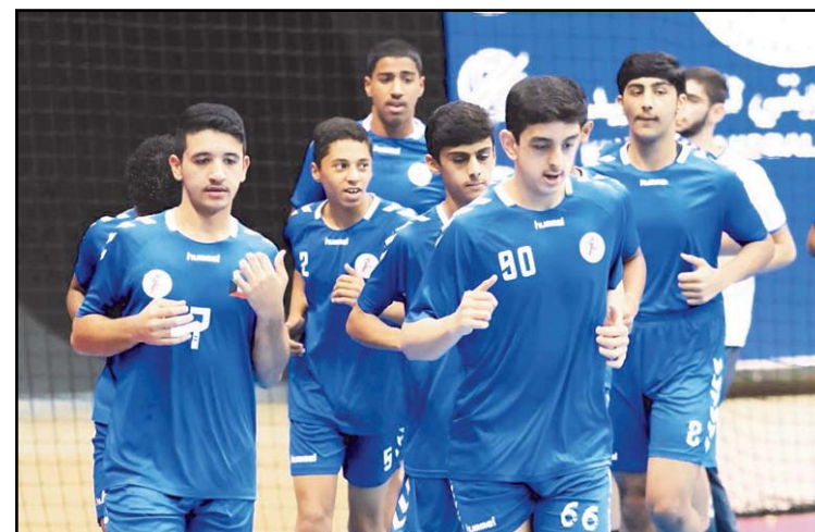
Kuwait youth handball team preparing for the European friendly tournaments.