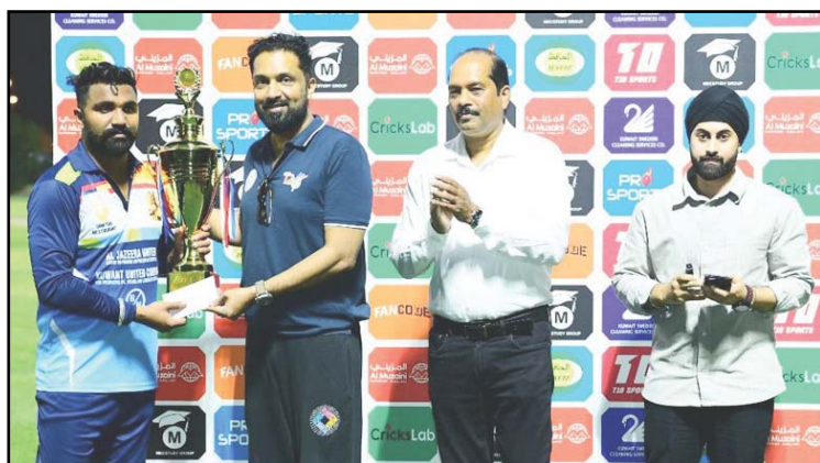
Captain of a winning team receives a trophy from an official.