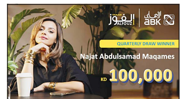
Alfouz quarterly draw winner flyer.

ABK encourages everyone to open an Alfouz draw account or increase their balance to participate in the upcoming weekly draw, which is scheduled to take place on 8 July