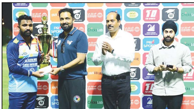
A winning team awarded.