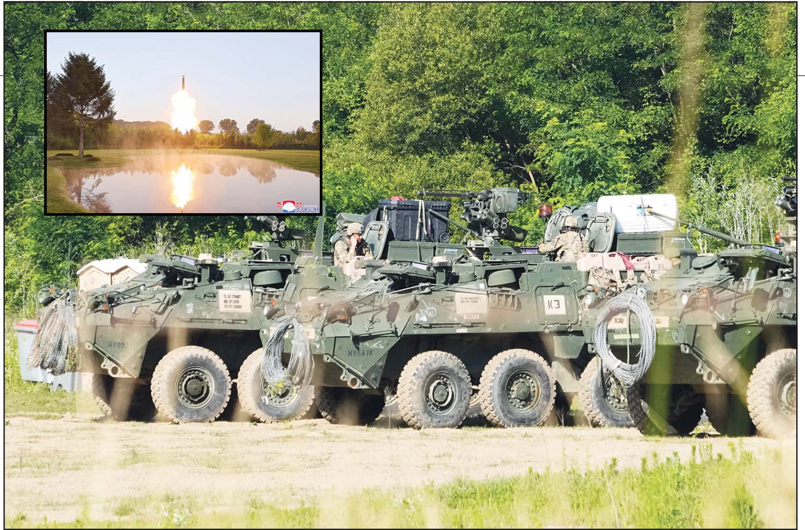
US Army's armored vehicles prepare to move during an exercise in Paju, near the border with North Korea on June 27. Inset: This photo provided by the North Korean government, shows what it says the separation and guidance control test of individual mobile warheads at an undisclosed place in North Korea on June 26.

A jury convicted him in March in Manhattan federal court after a two-week trial, which was closely followed in his home country.