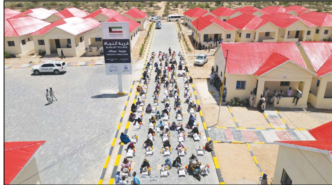
The Kuwaiti Najat Society opens a model charity village in Somaliland.

On the other hand, council member Farah Al-Roumi said everyone is aware of the danger of accumulating car tyres and assembling them in landfills in a way that does not comply with environmental, security and safety standards. She warned this is a threat to the environment and public health, as it is a source of pollution and a waste of natural resources.