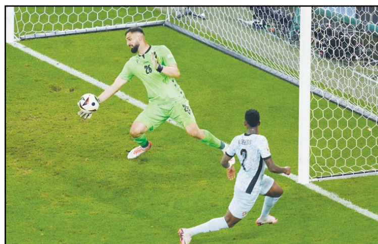
Georgia's goalkeeper Giorgi Mamardashvili saves a shot by Portugal's Nelson Semedo during a Group F match between Georgia and Portugal at the Euro 2024 soccer tournament in Gelsenkirchen, Germany. Georgia won 2-0. - See Page 15

The three powerhouses, with 19 World Cup appearances between them, have been placed in Group C with Bahrain, China and Indonesia.