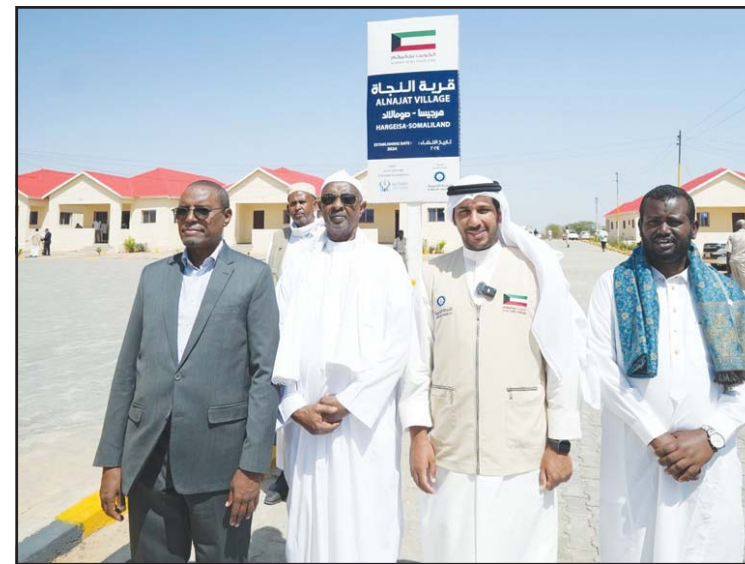
Group photo during the opening of charity village.

He further clarified that the village and its facilities specifically target the most vulnerable groups of displaced persons. The initiative aims to alleviate their hardships, provide a dignified living environment, and create livelihood opportunities for hundreds of families.