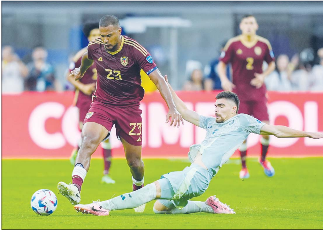
Mexico's Johan Vasquez (right), challenges Venezuela's Salomon Rondón during a Copa America Group B soccer match in Inglewood, Calif.

It's important to note that these findings do not speak to how the athletes actually felt about winning bronze or silver. Smiles can be faked for the cameras. Other times, people smile when they feel awkward or uncomfortable.