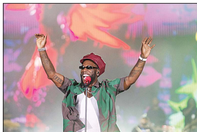
Burna Boy performs at a concert during the 19th edition of Mawazine festival in Rabat, Morocco, Wednesday, June 26. (AP)

"This is a historic conservation partnership that will help protect these magnificent creatures and their habitat," tweeted Todd Gloria , Mayor of San Diego , who attended a farewell ceremony in Ya'an , where the pandas had been residing. (Xinhua)