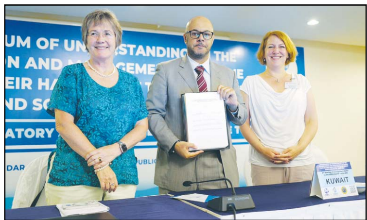
Part of the agreement signing ceremony.

The center explained that Pollux is a giant orange star, about three times larger than the Sun and about 34 light-years away from Earth.