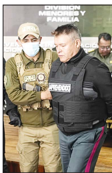
Bolivian police hold the detained Juan Jose Zuniga, former general commander of the Army, in La Paz, Bolivia on June 26. An apparent failed coup attempt erupted Wednesday in the country, and Zuniga appeared to be leading the rebellion.

The eleven opposition politicians were arrested earlier this month during a meeting in a private residence, the Malian National Human Rights Commission, a government agency, said in a statement, denouncing what it called "arbitrary arrests" and "violations of private homes."