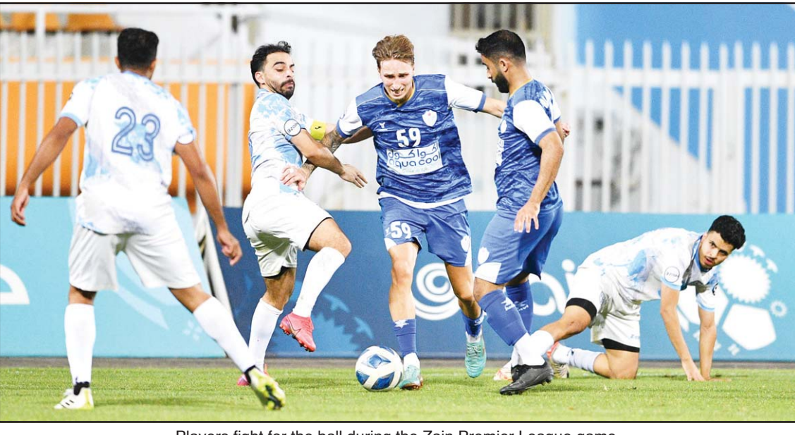
Players fight for the ball during the Zain Premier League game.

left the board of directors of its soccer investment division.