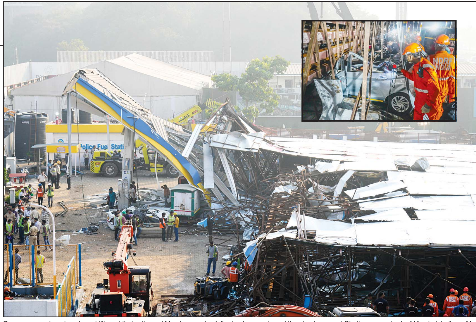
Rescuers search under a large billboard that collapsed Monday evening following heavy rain and thundershowers at Ghatkopar, a suburb of Mumbai, India on May 14. More than a dozen people were killed and dozens were injured in the accident. Inset: Rescuers look for victims under a billboard that collapsed following heavy rain and thundershowers in Mumbai, India on May 13.

There were 81 workers on the site when it collapsed, and 29 have been pulled out alive, the city said. It said 13 of them remained in a hospital without giving details of their condition. The city has previously said that many of the survivors were in critical condition when they were found.