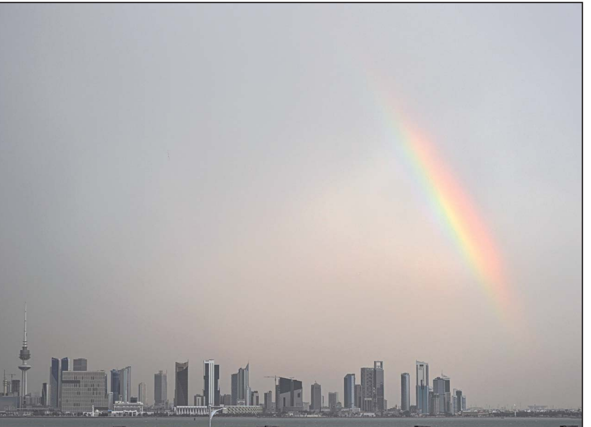
A rainbow appears in the sky over Kuwait City, Kuwait, on May 13, 2024.

The directive stressed the need to make appointments through the 'Meta' platform via the 'Sahel' application, indicating that walk-ins will not be accepted. The ministry urged all those concerned to book their appointment before visiting