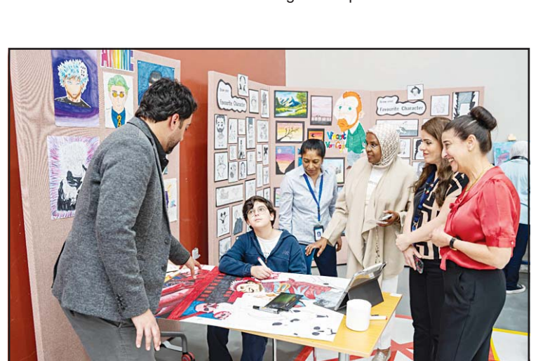
Art coordinator talking to one of the student artists.