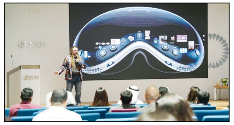
From the special talk at Zain's headquarters.