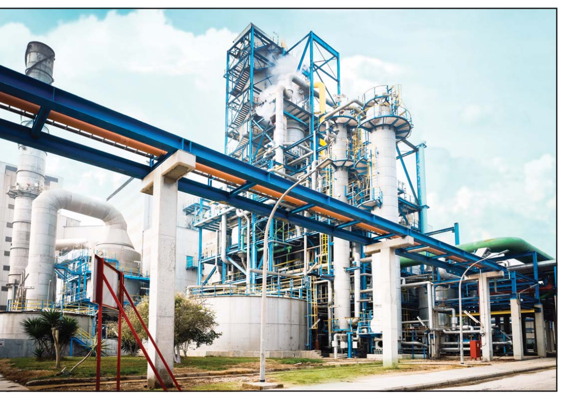
Alexandria Fertilizers Company

Founded in 1997, Egypt Kuwait Holding Company is listed on both the Kuwait and Egyptian stock markets. Over the past decades, it has emerged as one of the largest, leading, and fastest-growing investment companies in the Middle East. Its diverse portfolio spans five major sectors: fertilizers, petrochemicals, gas upstream and distribution, power production and distribution, insurance and non-bank financial services. The Egypt Kuwait Holding Company is aiming to continue achieving high return on investment rates for its investors based on a strong investment portfolio and a competent management team