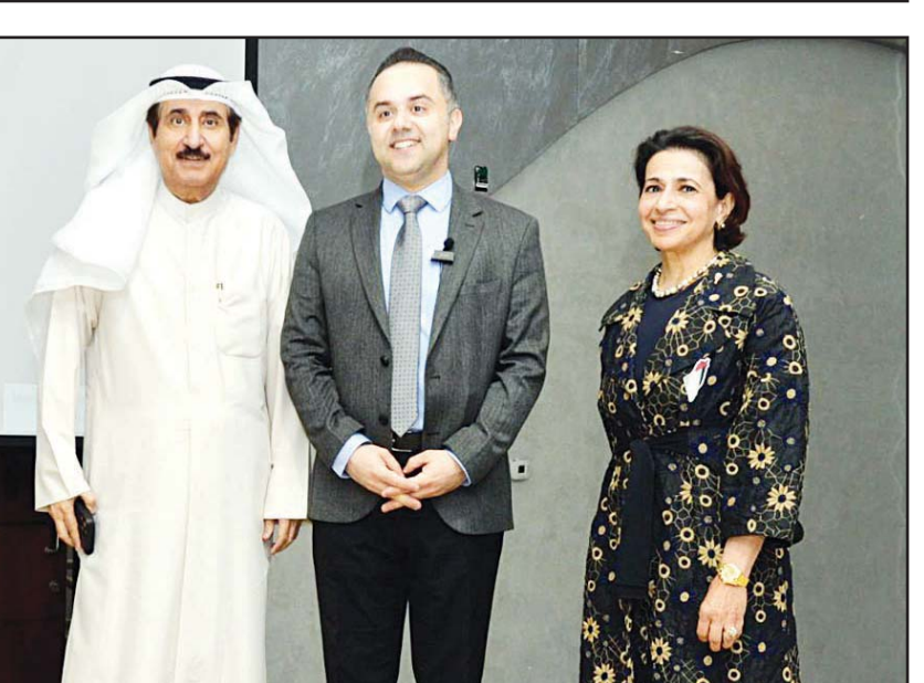
Top and above: Some photos from the event.