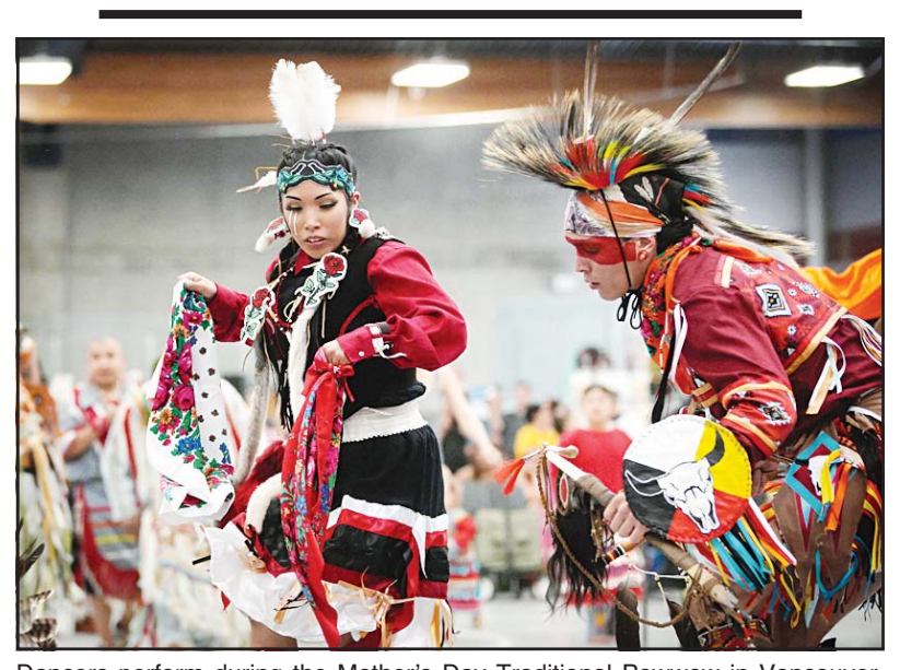
Dancers perform during the Mother's Day Traditional Powwow in Vancouver, British Columbia, Canada, on May 12. Hundreds of indigenous people from various tribes across Canada gathered on Sunday to celebrate Mother's Day with a powwow, a traditional social gathering featuring music and dance.