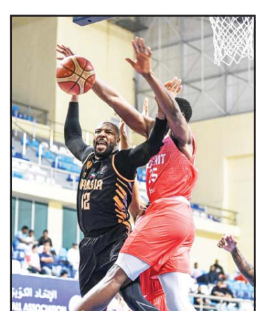
Kuwait Club defender blocks a shot from Al-Qadisiya player.

ties. This is achieved through a multifaceted approach, encompassing sports, healthcare, and social programs for athletes, as well as training and awareness initiatives for their families. Additionally, the Special Olympics offers training programs catering to coaches, medical professionals, and volunteers, thereby contributing to the holistic development and well-being of individuals with