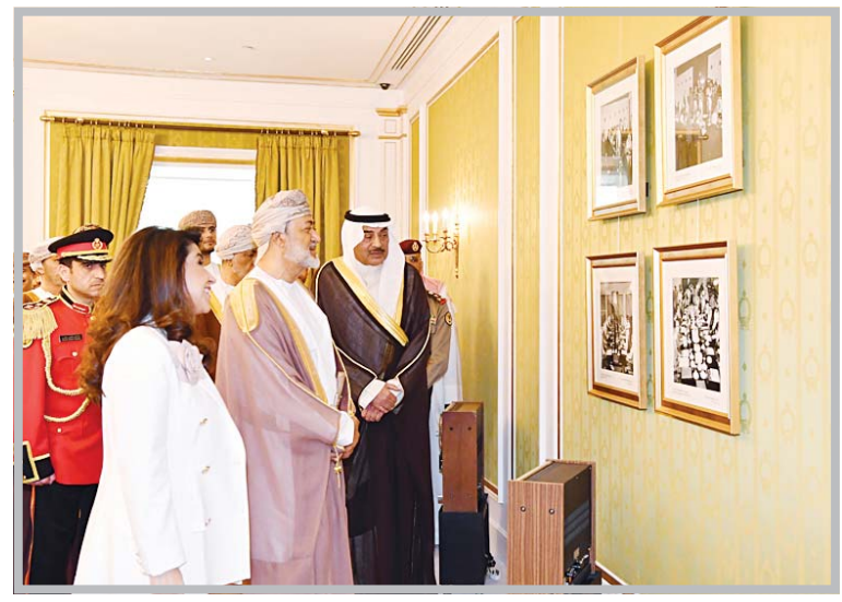
The Sultan of Oman viewing historical pictures of Kuwait rulers.