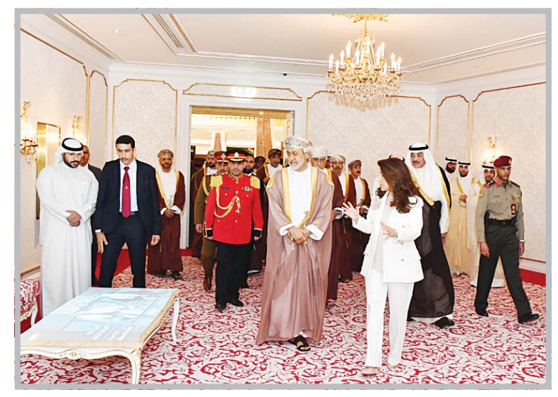
The Sultan of Oman in the Al-Salam Palace.