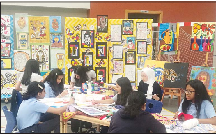
Some of the students at the exhibition.