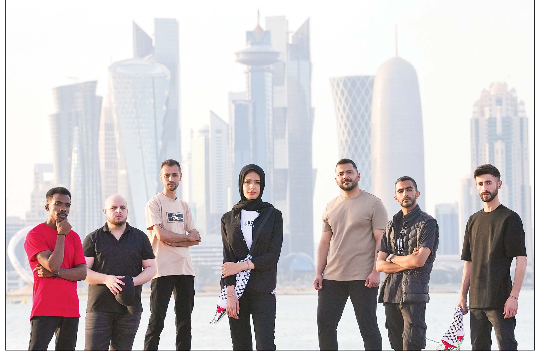
Thursday, May 2.