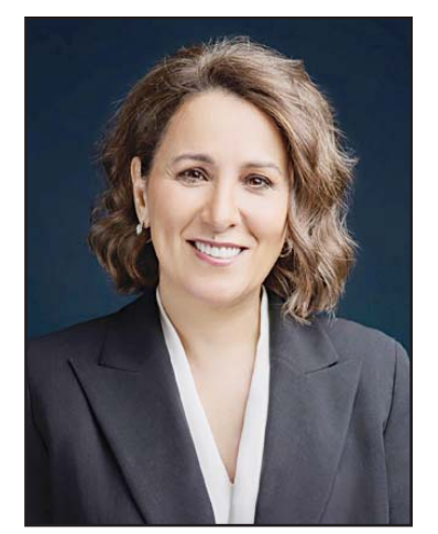
Sheikha Dana Naser Al Sabah

In the first quarter, KIPCO's consolidated revenue came to KD 352 million (US$ 1.14 billion), an increase of 14% over the KD 309.3