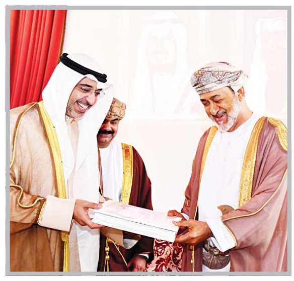
The Sultan of Oman is presented a book on Kuwait his-