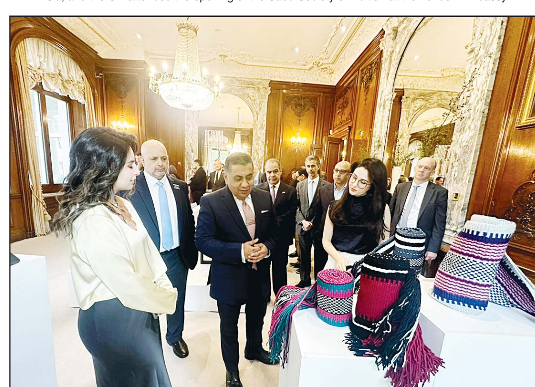
Ambassador Ahmad Al-Awadhi and Lord Tariq Ahmad attend the opening of the Sadu Society exhibition