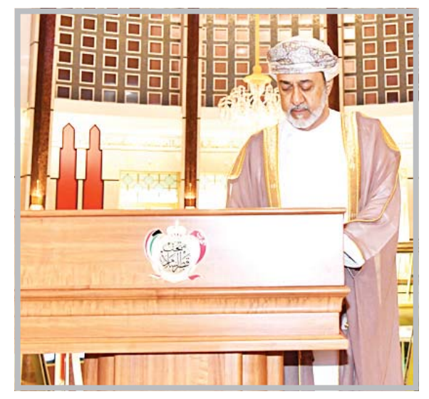
The Sultan of Oman presenting his views after the end of the trip to Al-Salam Palace.