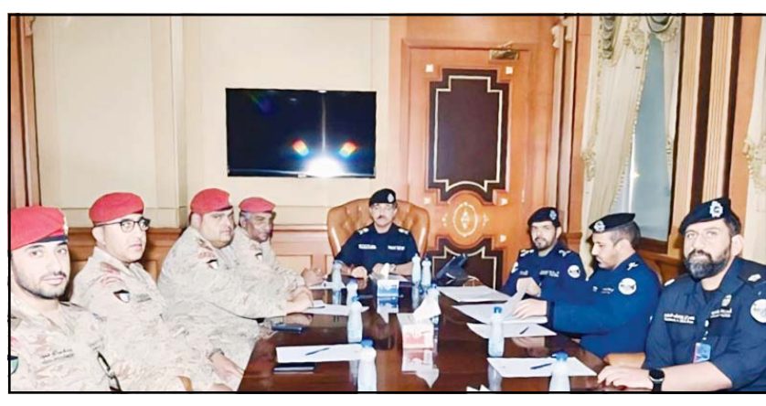
The meeting in progress.